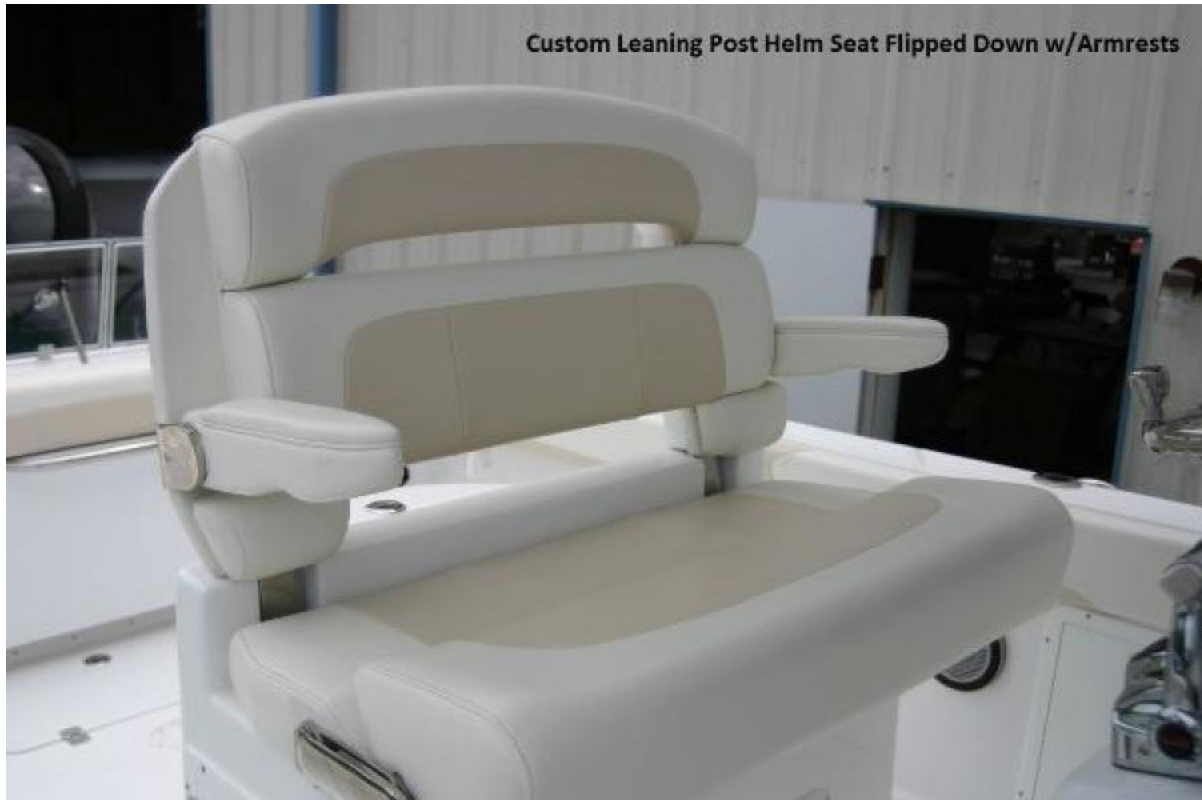
Custom Leaning Post Helm Seat Flipped Down w/Armrests