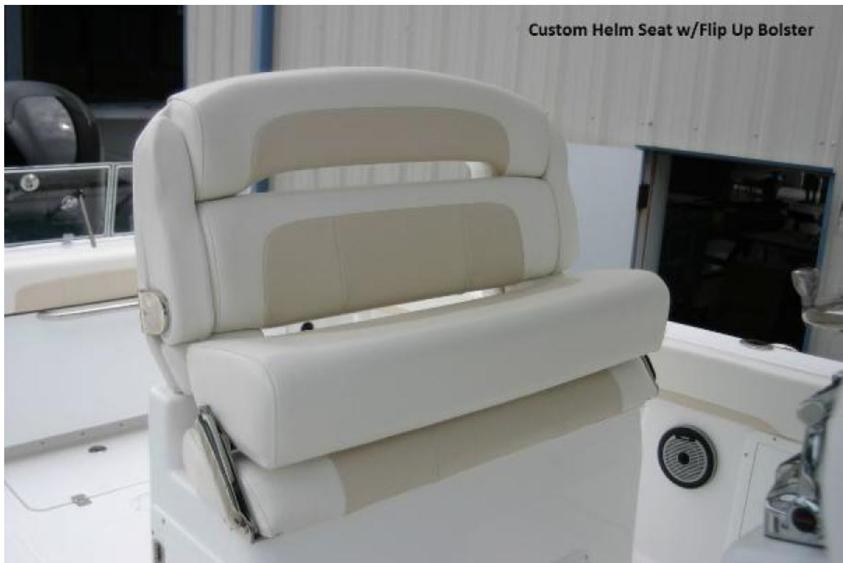
Custom Helm Seat w/Flip Up Bolster