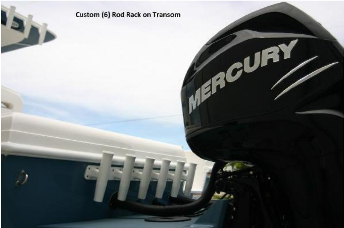
Custom (6) Rod Rack on Transom