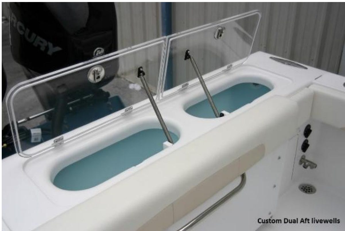
Custom Dual Aft livewells