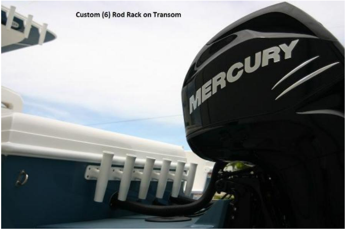
Custom (6) Rod Rack on Transom