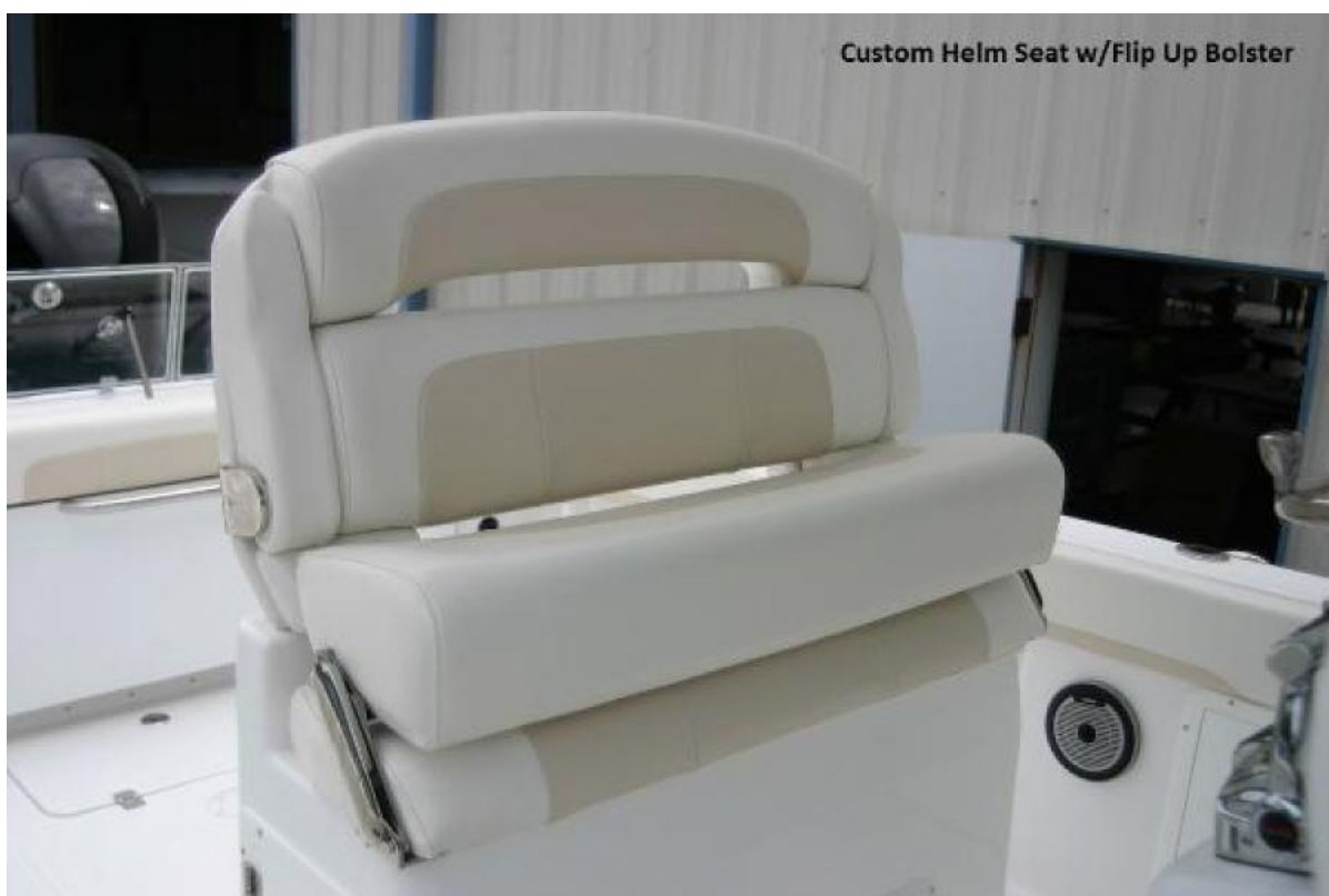
Custom Helm Seat w/Flip Up Bolster