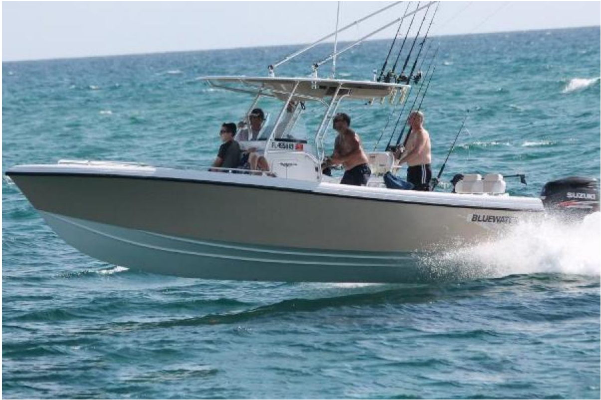
Custom BW Recessed SS Anchor Roller w/SS Windlass and Dual Location Controls