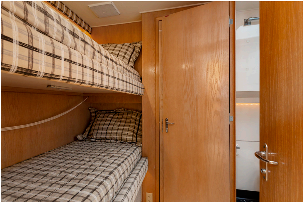
GUEST STATEROOM Or CREW