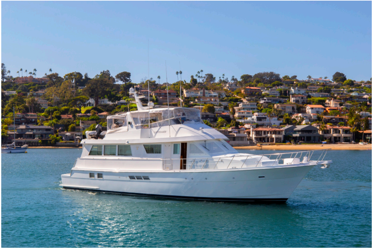
DAYDREAMER IV EXTERIOR