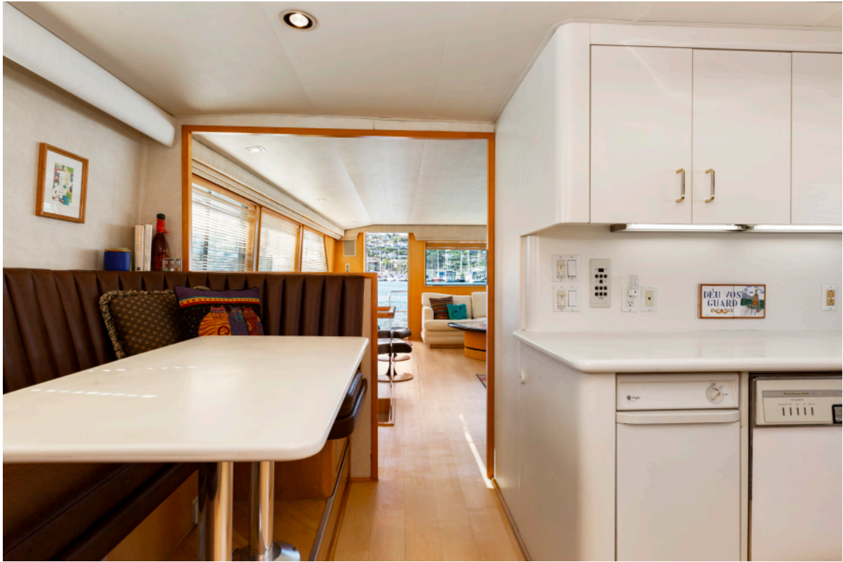
GALLEY and DINETTE