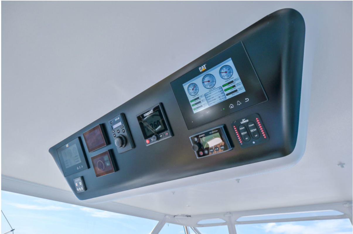
Flybridge Overhead Electronics Panel