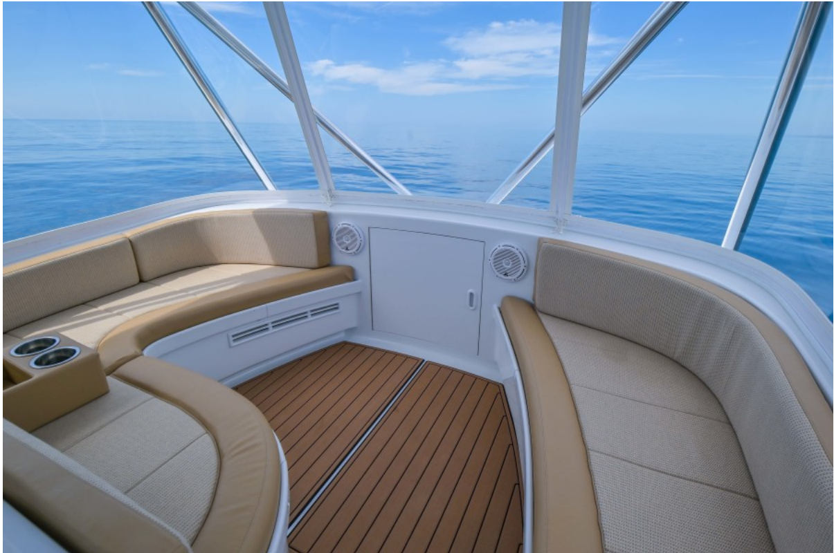
Flybridge Forward Seating