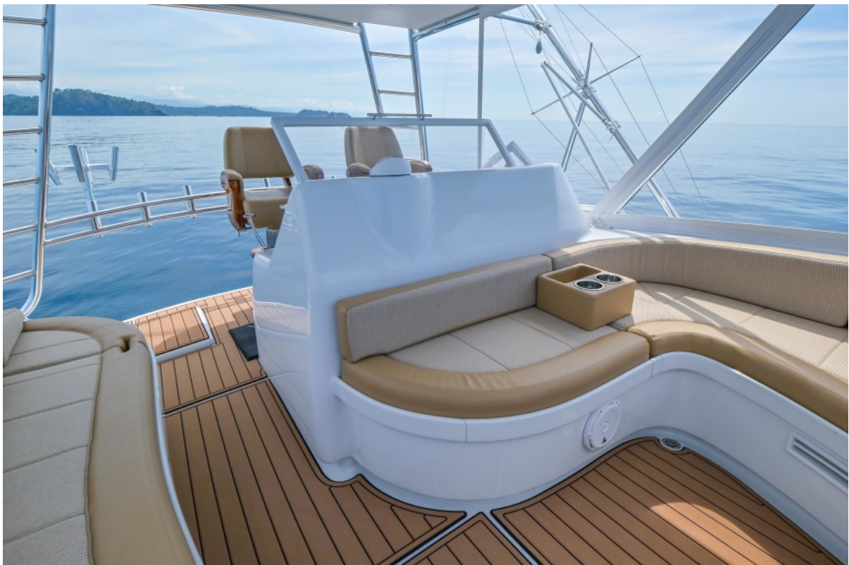
Flybridge Forward Seating