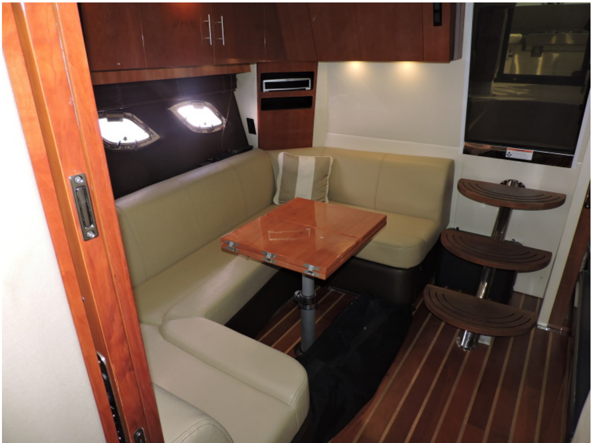
2012 42 Regal Sport Coupe - Sun Storm III - Salon / Dining