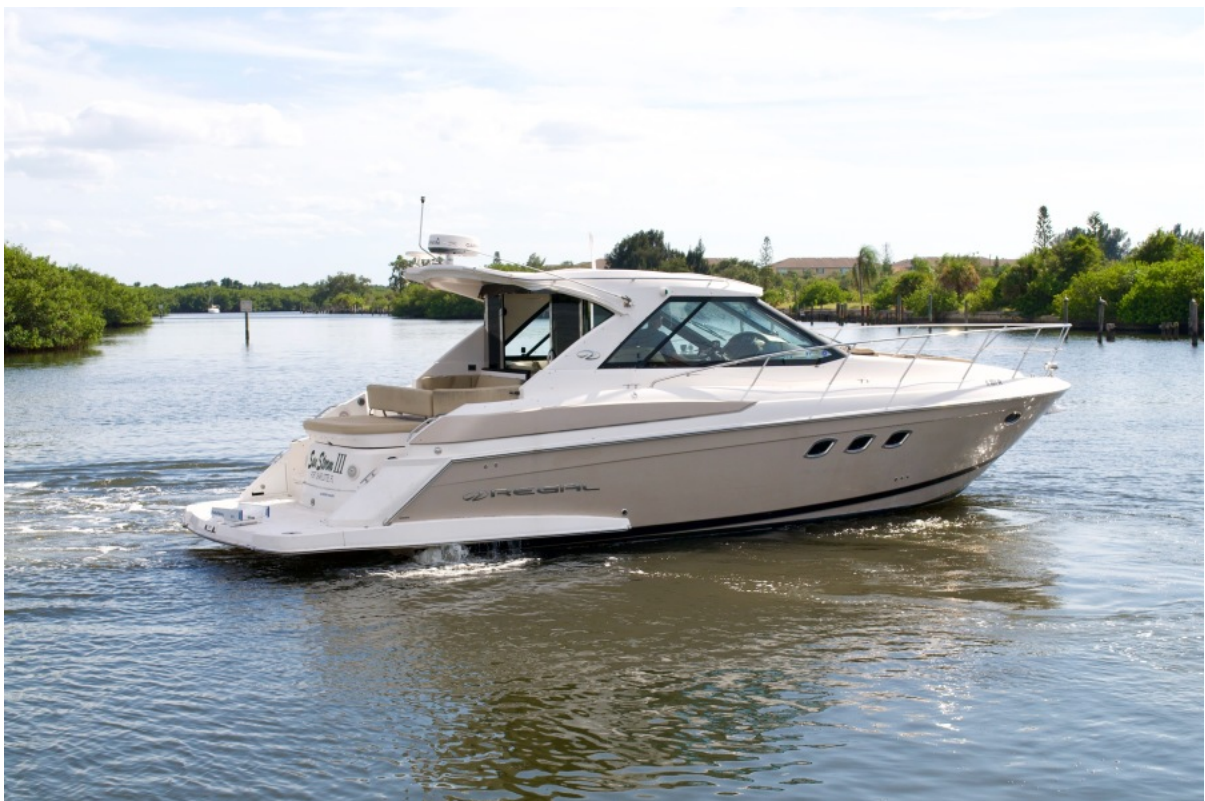
2012 42 Regal Sport Coupe - Sun Storm III - Profile