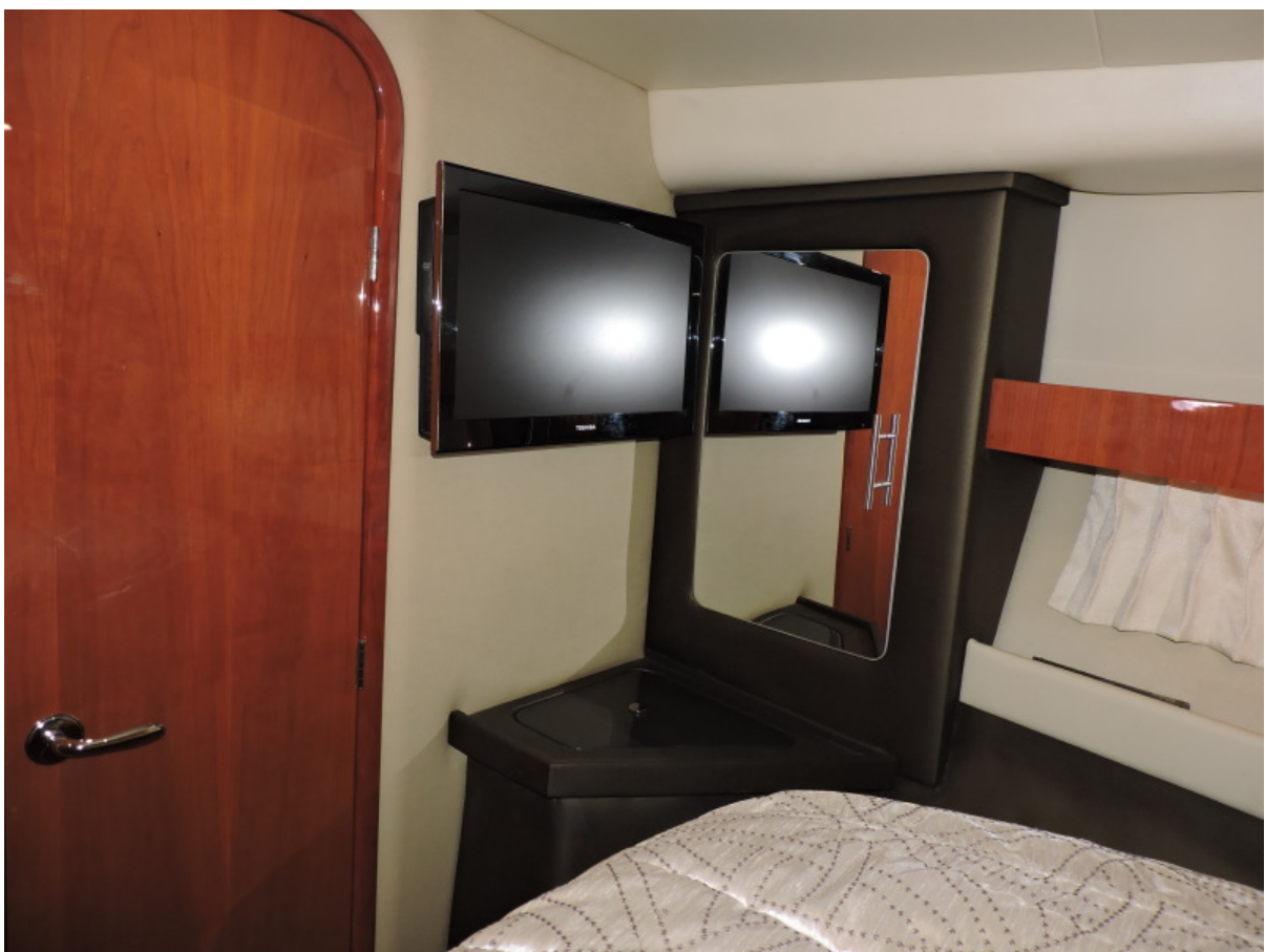
2012 42 Regal Sport Coupe - Sun Storm III - Master Stateroom TV