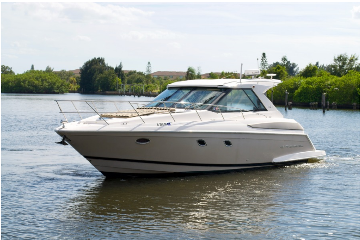
2012 42 Regal Sport Coupe - Sun Storm III - Profile