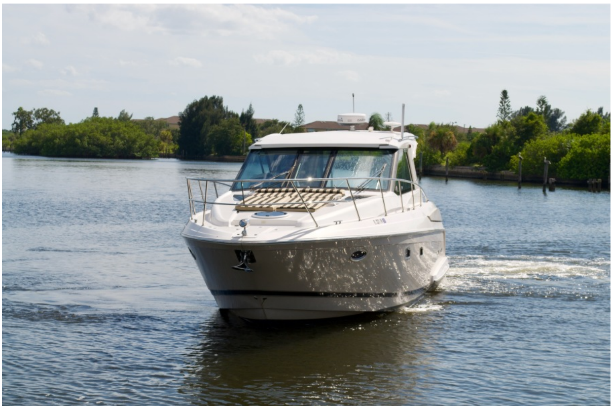
2012 42 Regal Sport Coupe - Sun Storm III - Profile