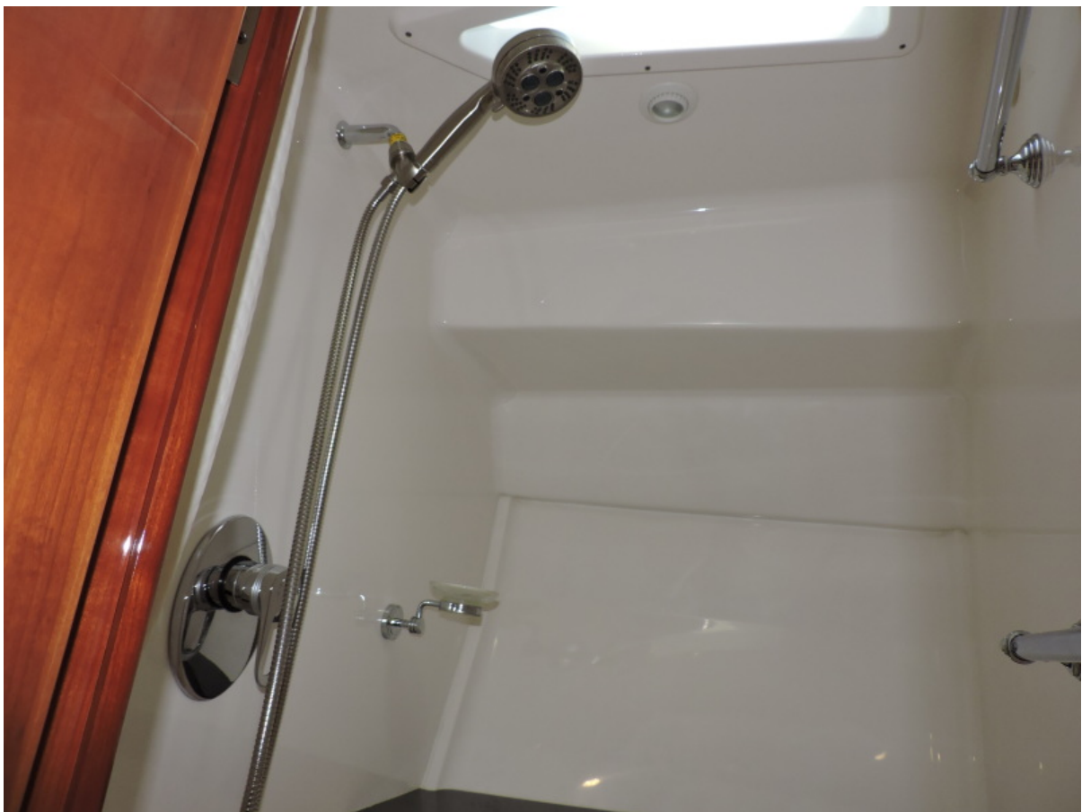
2012 42 Regal Sport Coupe - Sun Storm III - Master Stateroom Shower Stall