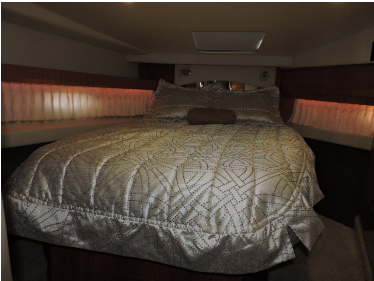
2012 42 Regal Sport Coupe - Sun Storm III - Master Stateroom