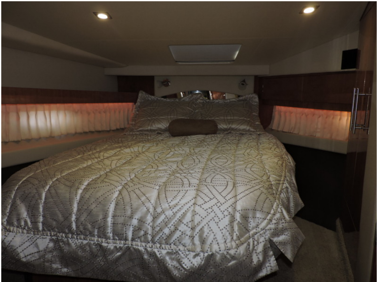
2012 42 Regal Sport Coupe - Sun Storm III - Master Stateroom