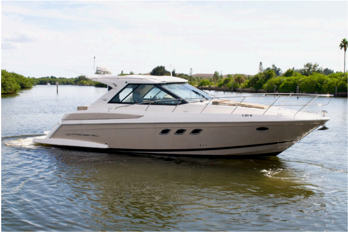
2012 42 Regal Sport Coupe - Sun Storm III - Profile