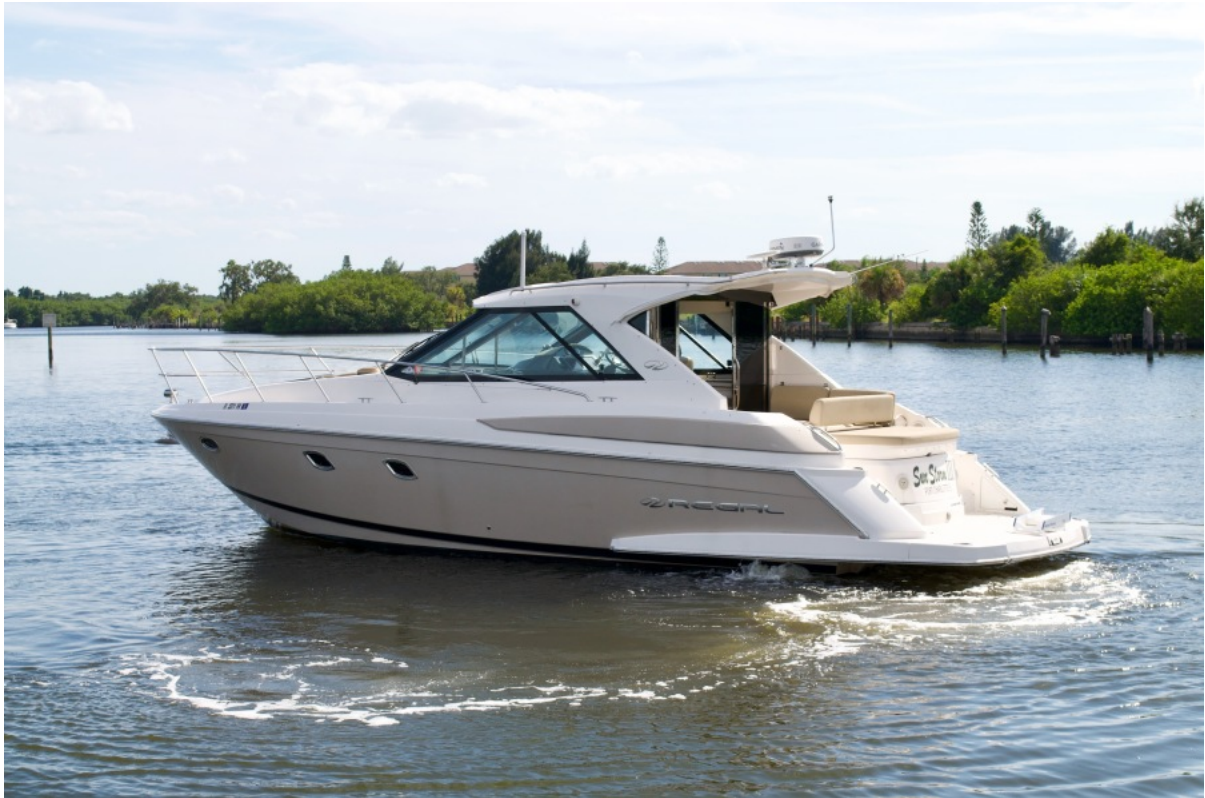
2012 42 Regal Sport Coupe - Sun Storm III - Profile