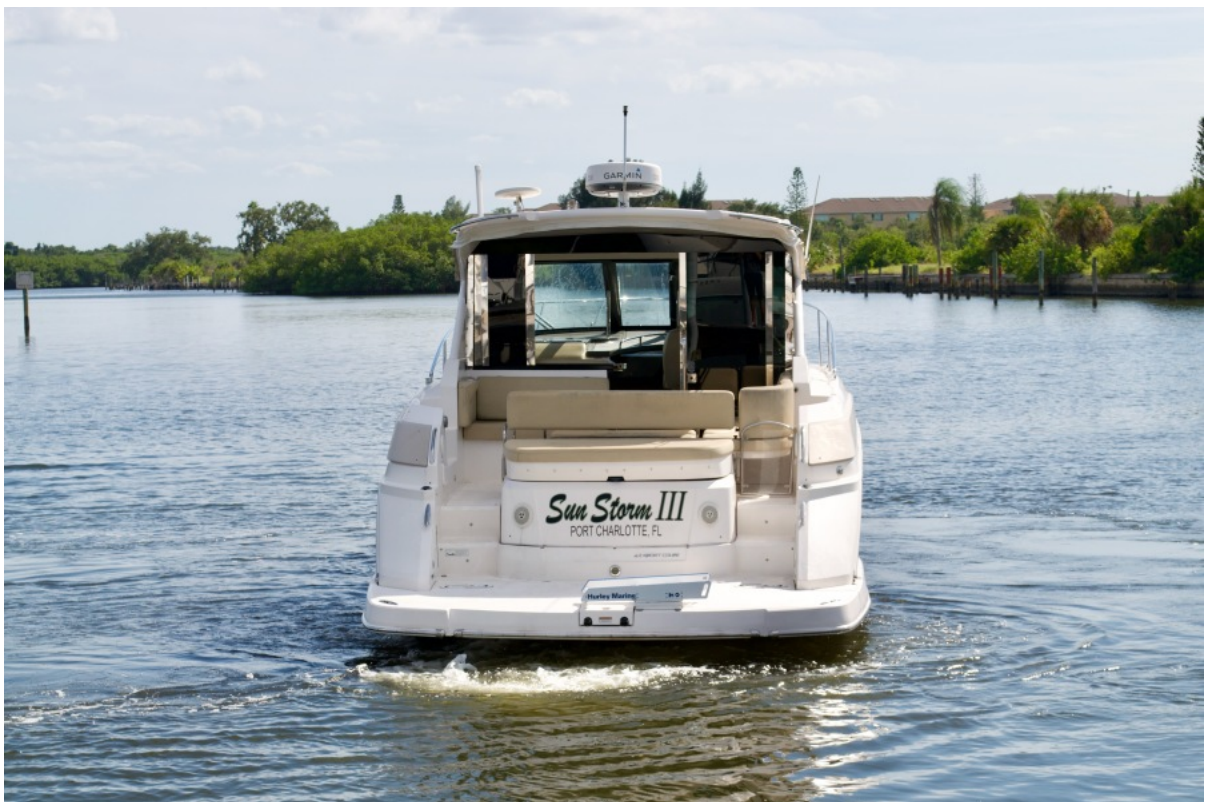
2012 42 Regal Sport Coupe - Sun Storm III - Transom