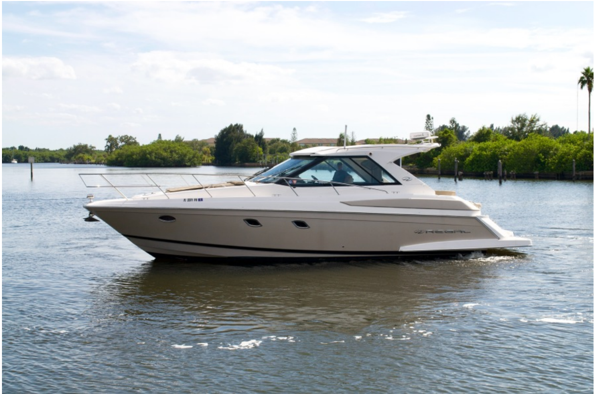
2012 42 Regal Sport Coupe - Sun Storm III - Profile