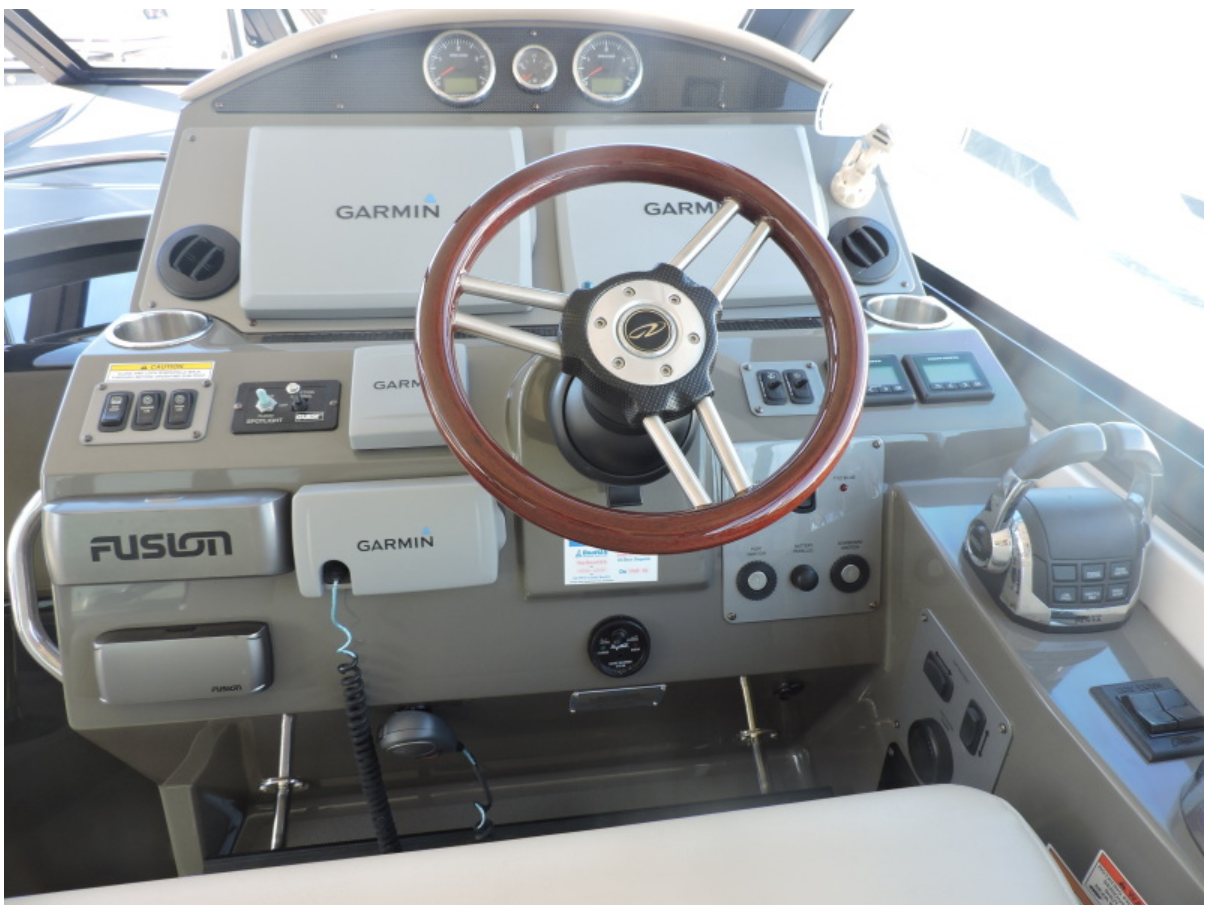
2012 42 Regal Sport Coupe - Sun Storm III - Helm