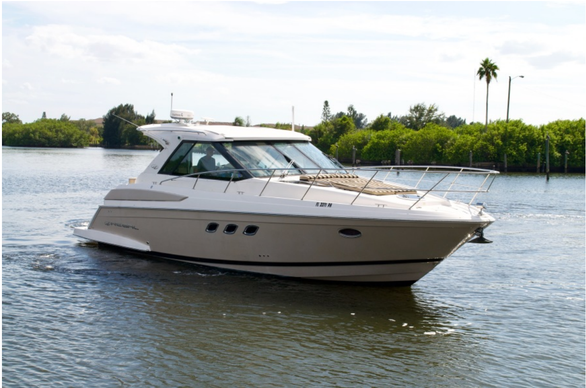
2012 42 Regal Sport Coupe - Sun Storm III - Profile