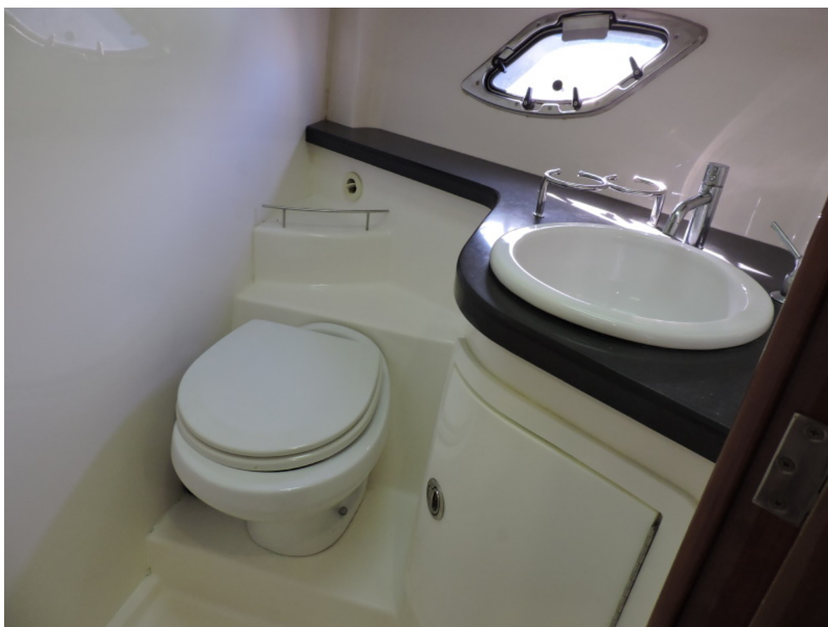
2012 42 Regal Sport Coupe - Sun Storm III - Master Stateroom Head