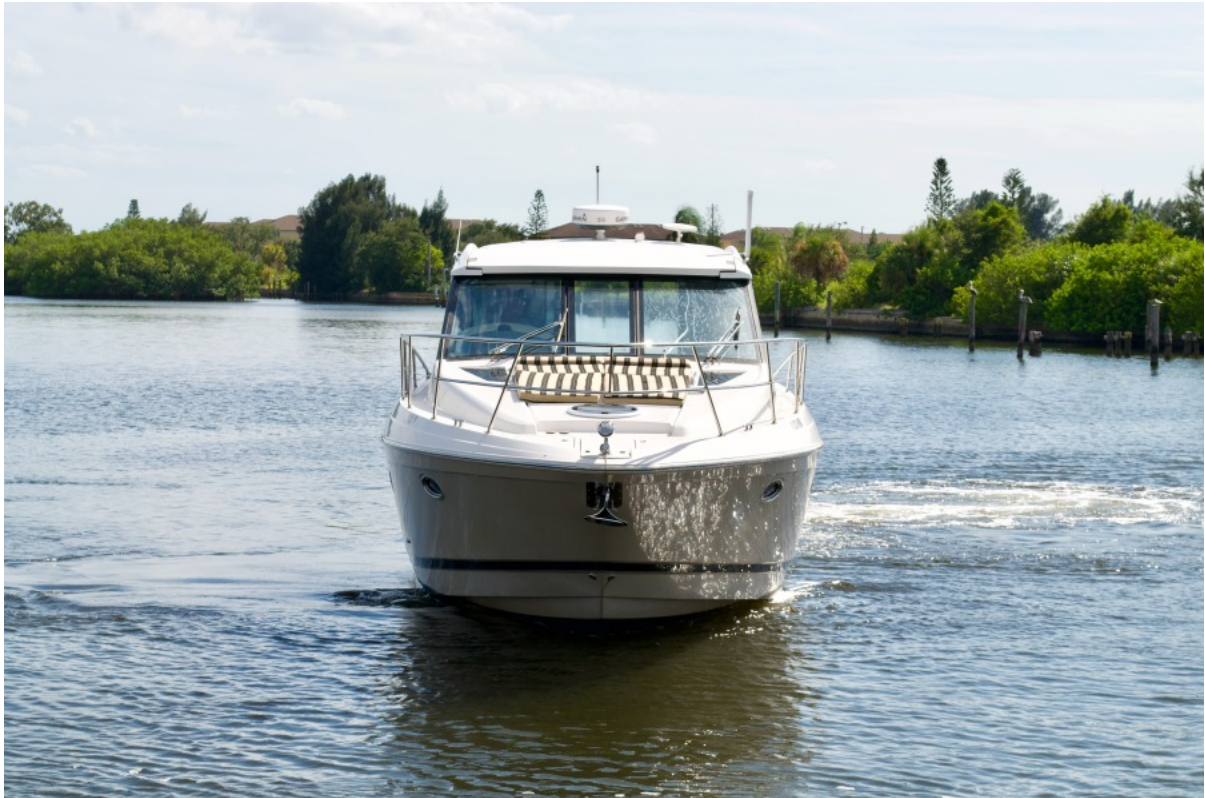
2012 42 Regal Sport Coupe - Sun Storm III - Profile