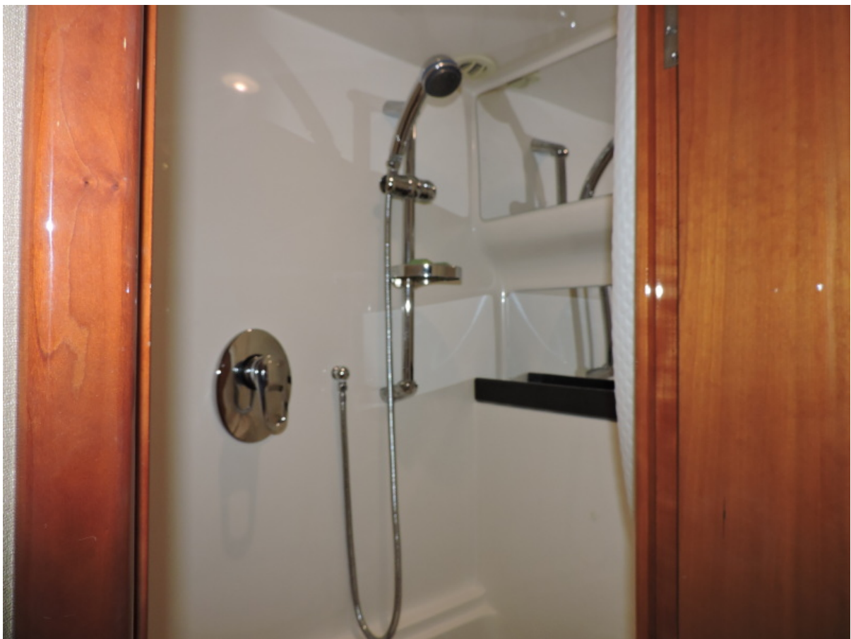
2012 42 Regal Sport Coupe - Sun Storm III - Guest Shower Stall