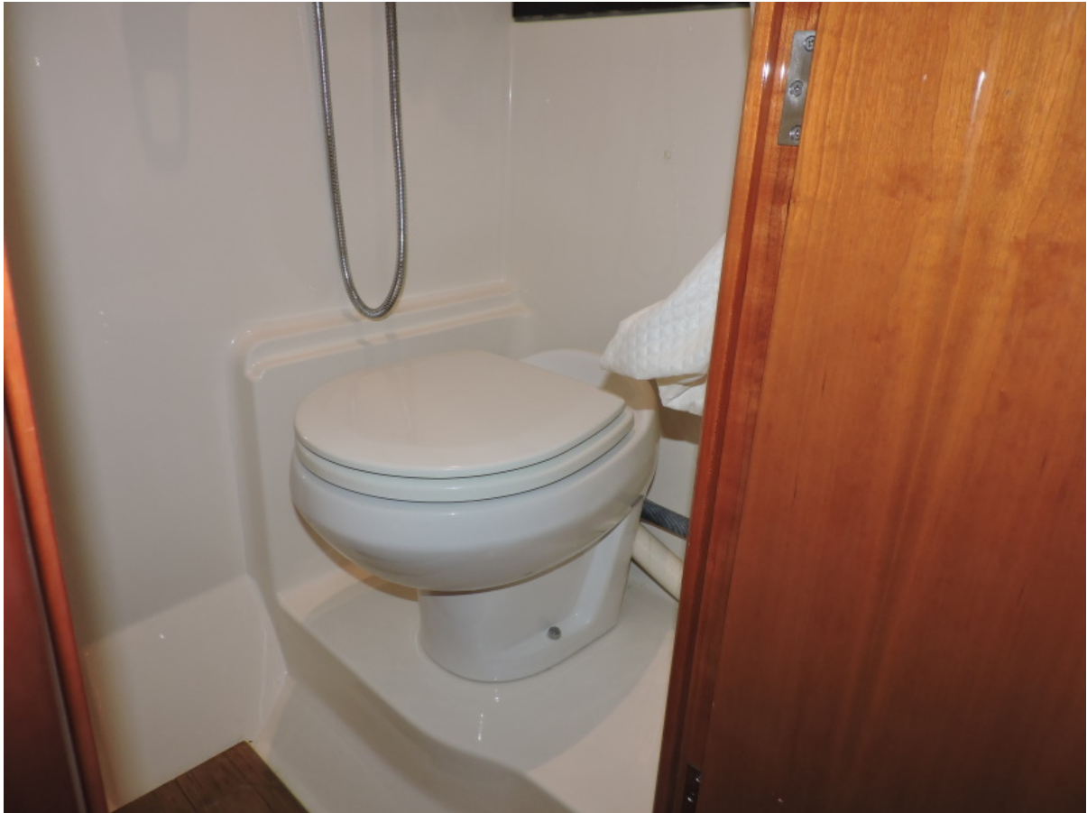
2012 42 Regal Sport Coupe - Sun Storm III - Guest Head