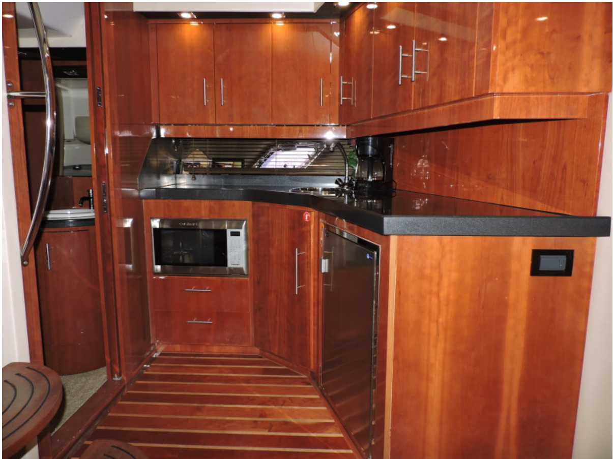
2012 42 Regal Sport Coupe - Sun Storm III - Salon / Galley