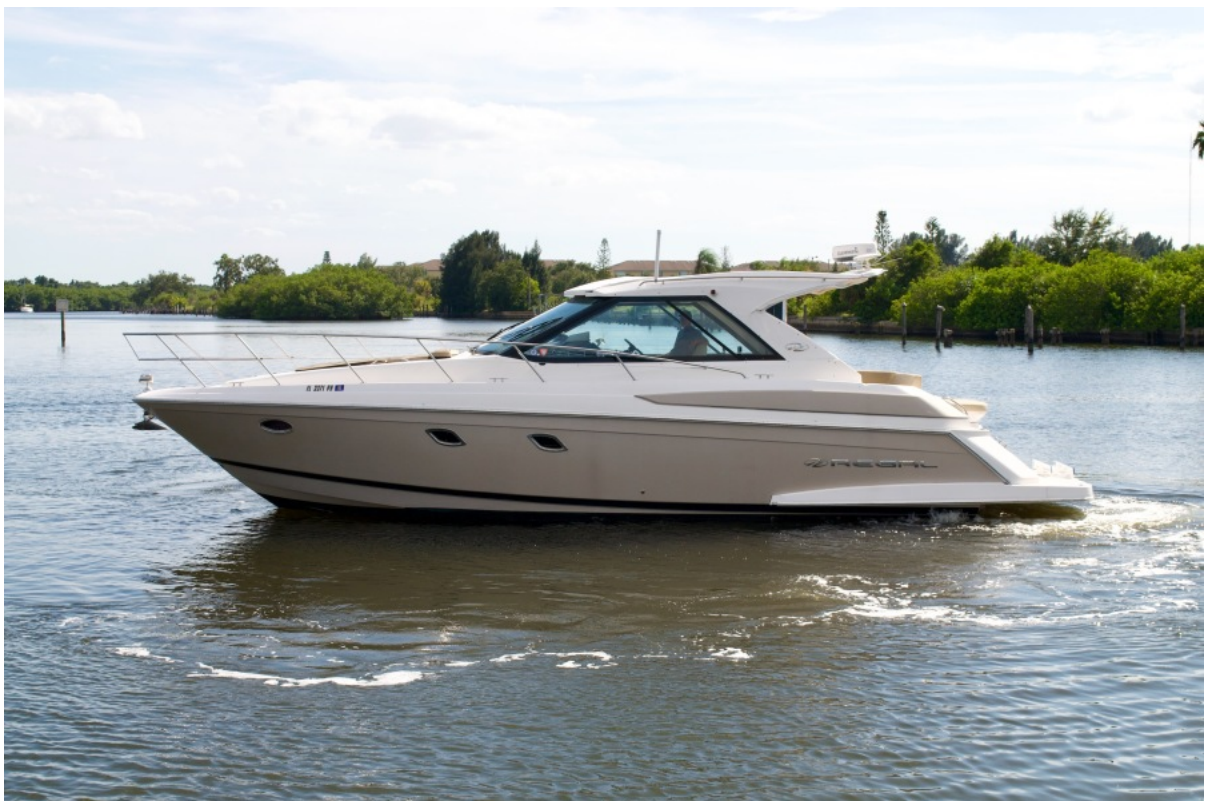
2012 42 Regal Sport Coupe - Sun Storm III - Profile