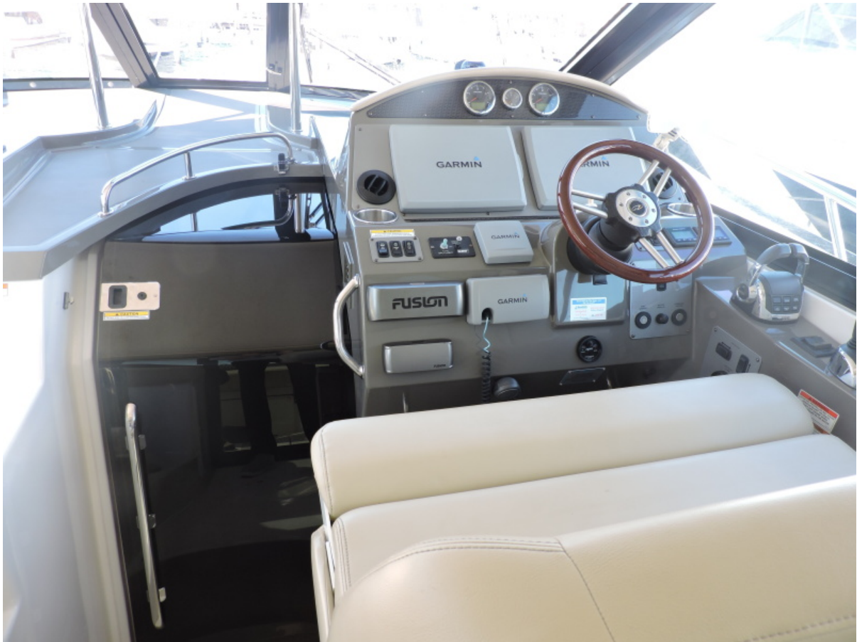
2012 42 Regal Sport Coupe - Sun Storm III - Helm