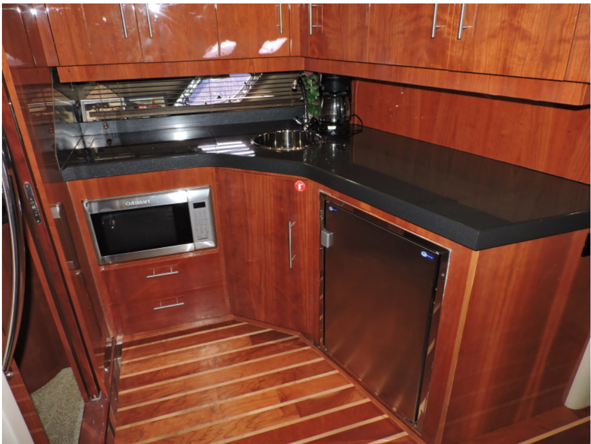
2012 42 Regal Sport Coupe - Sun Storm III - Salon / Galley