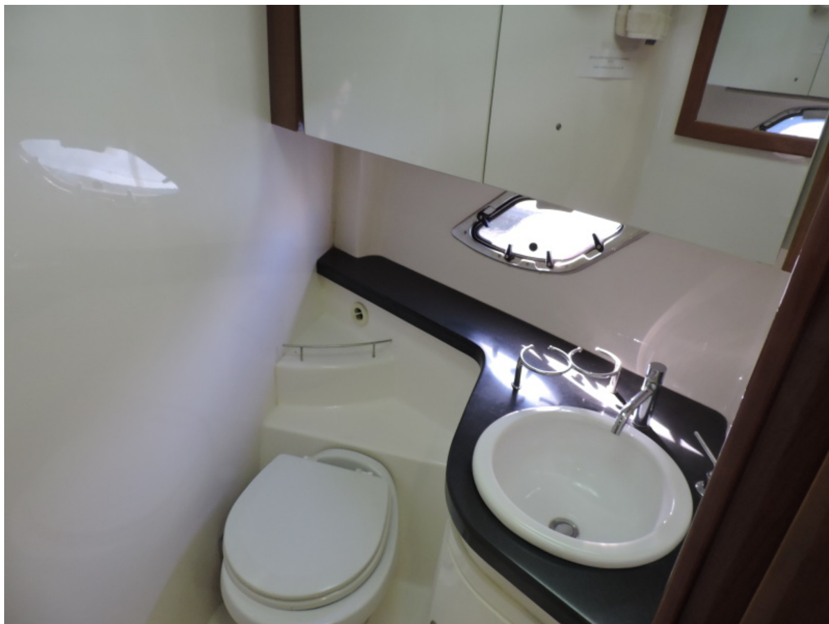
2012 42 Regal Sport Coupe - Sun Storm III - Master Stateroom Head