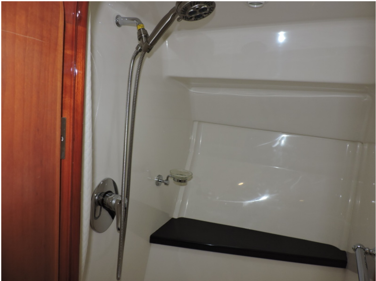
2012 42 Regal Sport Coupe - Sun Storm III - Master Stateroom Shower Stall