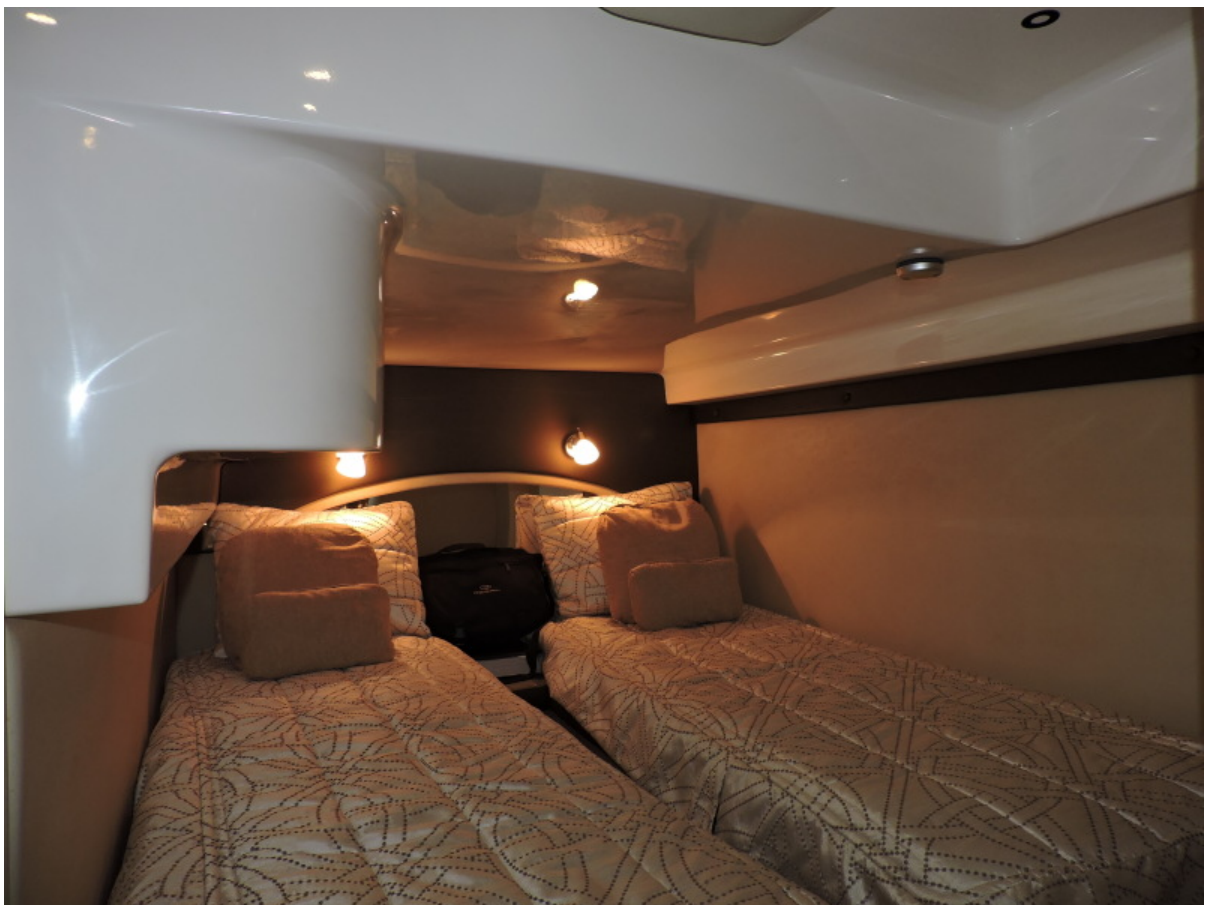
2012 42 Regal Sport Coupe - Sun Storm III - Guest Stateroom