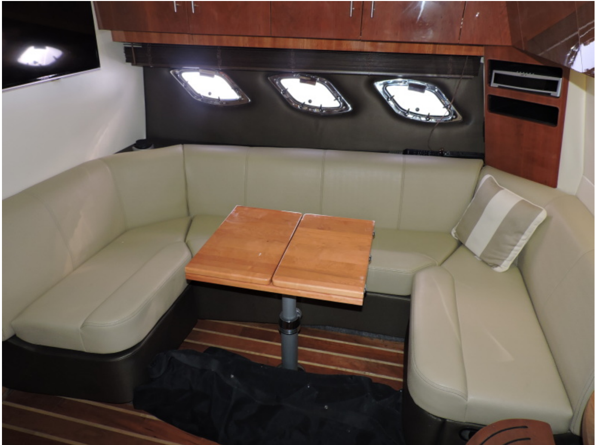
2012 42 Regal Sport Coupe - Sun Storm III - Salon / Dining