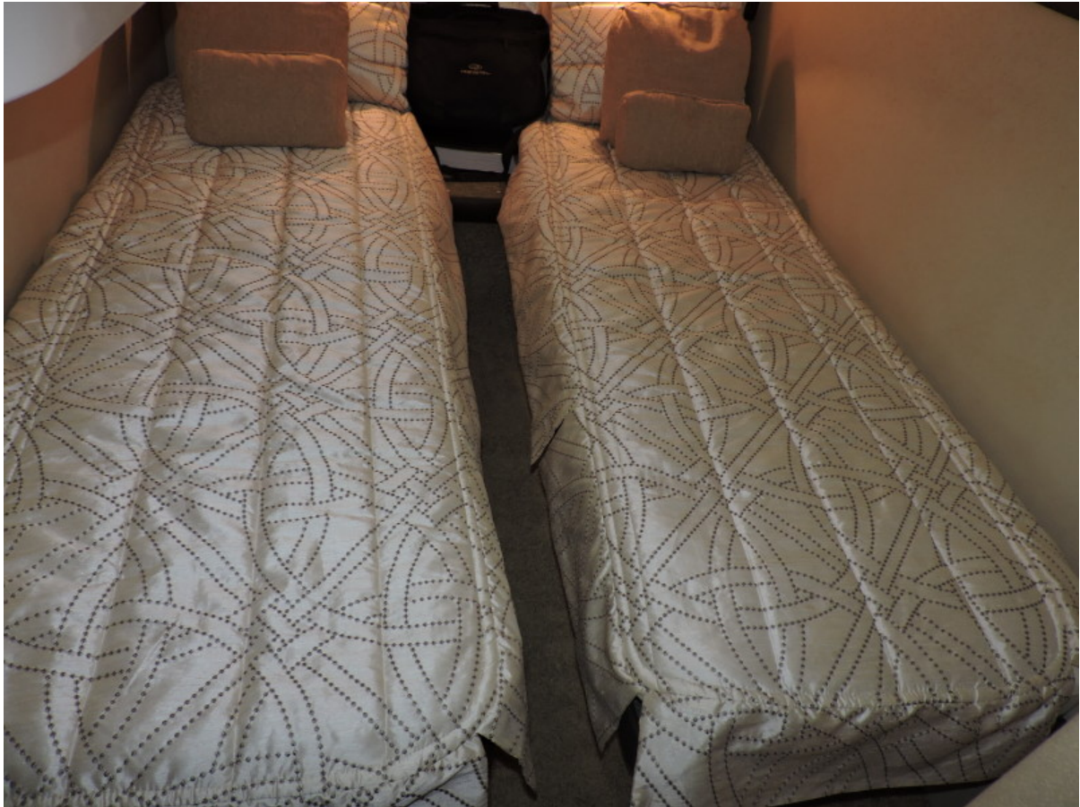
2012 42 Regal Sport Coupe - Sun Storm III - Guest Stateroom