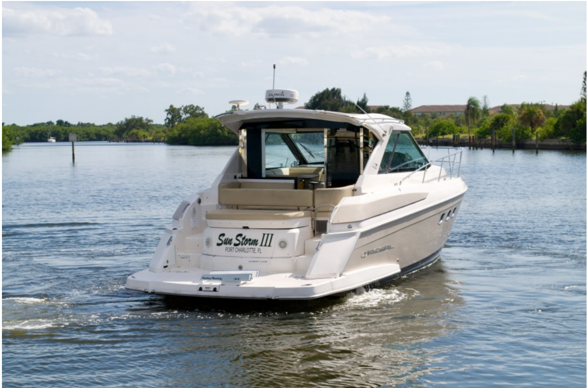
2012 42 Regal Sport Coupe - Sun Storm III - Transom Profile