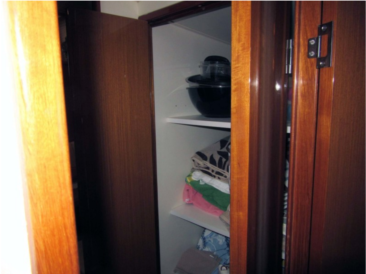
Port Locker In Lieu Of Washer Dryer