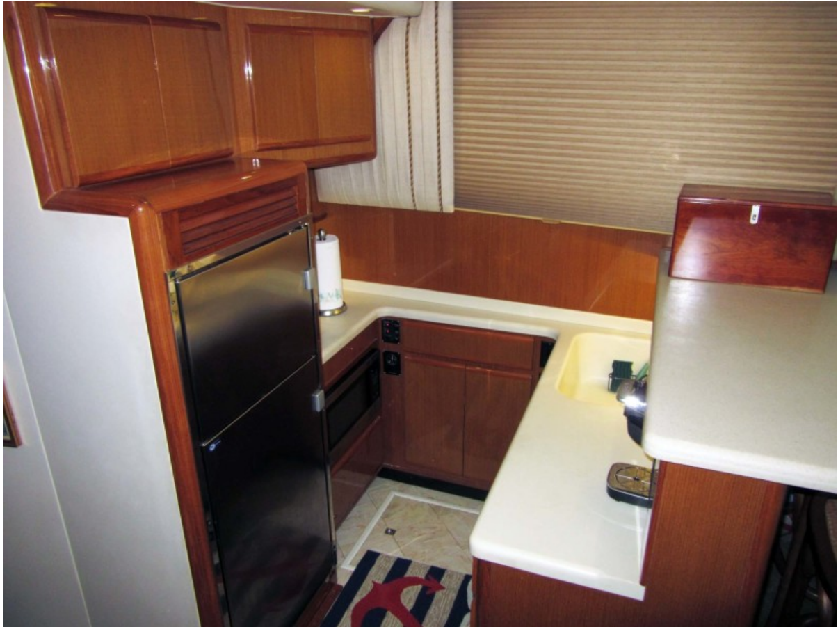
Galley Starboard Mid