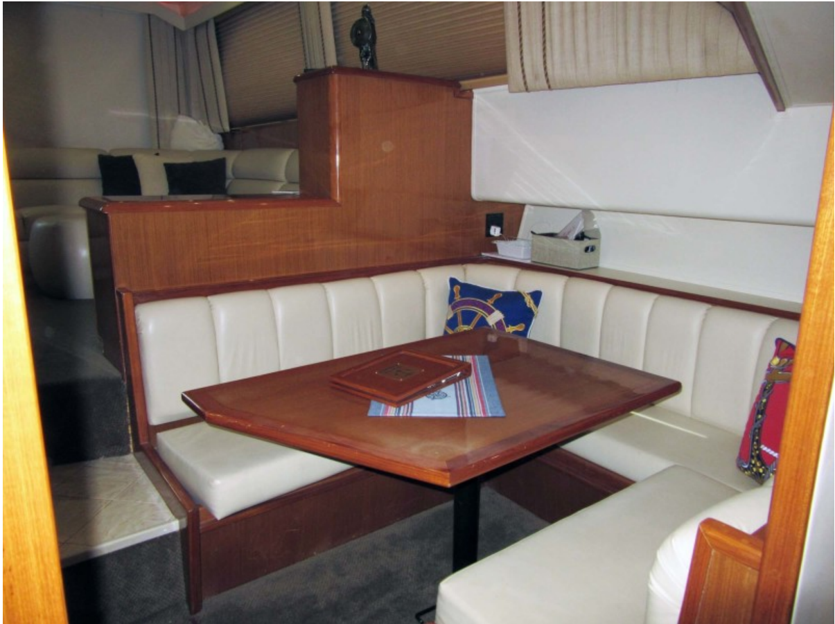
Dinette Looking Aft