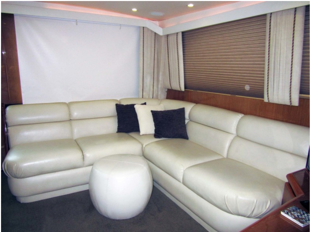
Salon Sofa With Storage Port