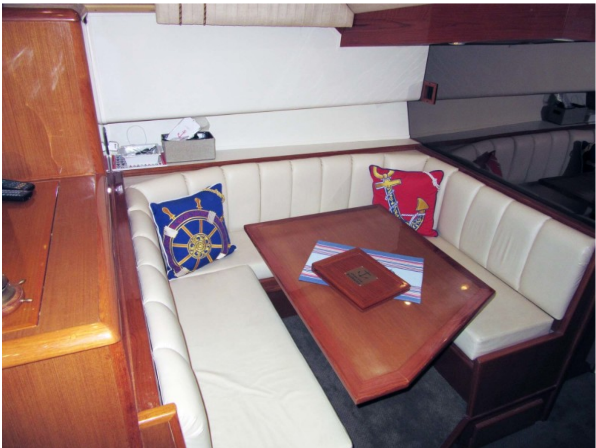
Convertible Dinette Port Mid