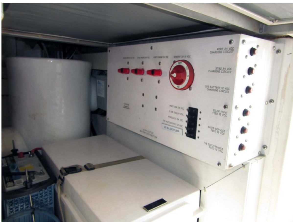
Engine Room Panel