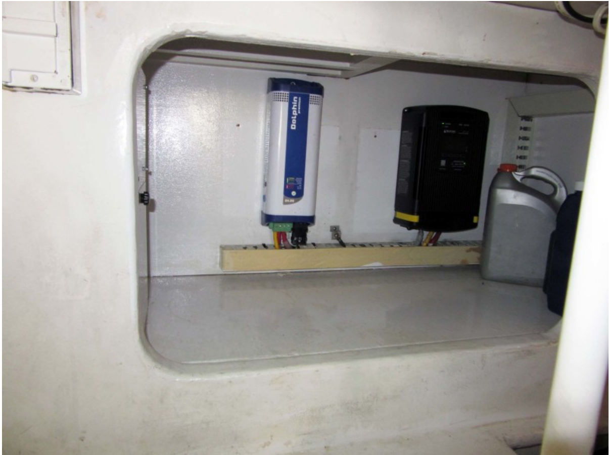
Newer Battery Charger