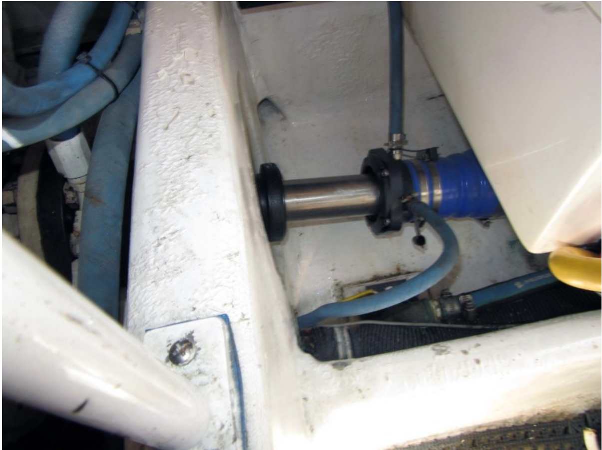
Dripless Shaft Logs