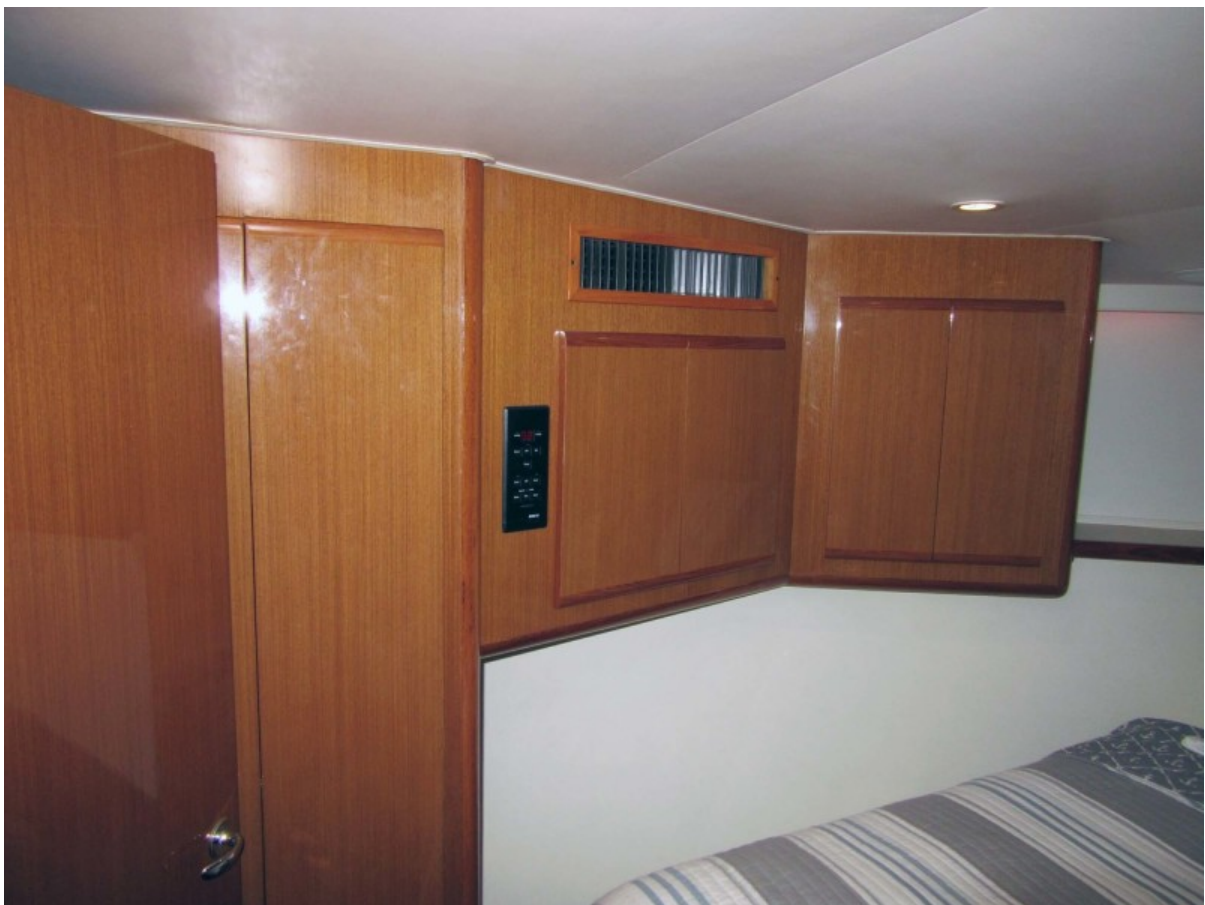
Master Port Cabinets