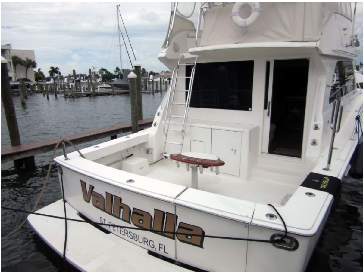
Cockpit Rocket Launcher