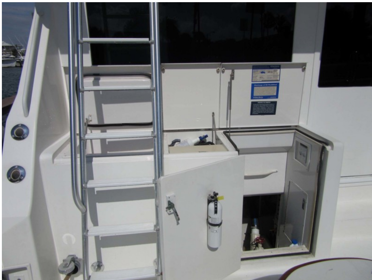
Freezer And Engine Room Access