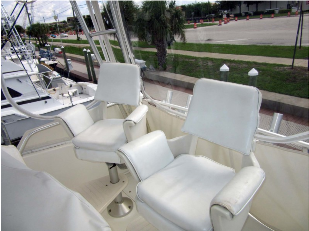
Helm And Companion Chairs