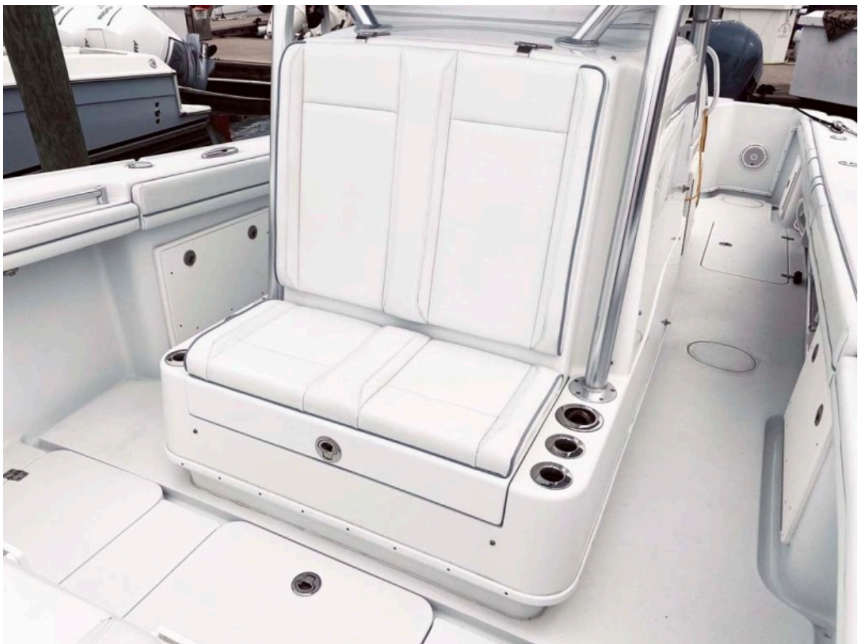
Forward Seating And Storage