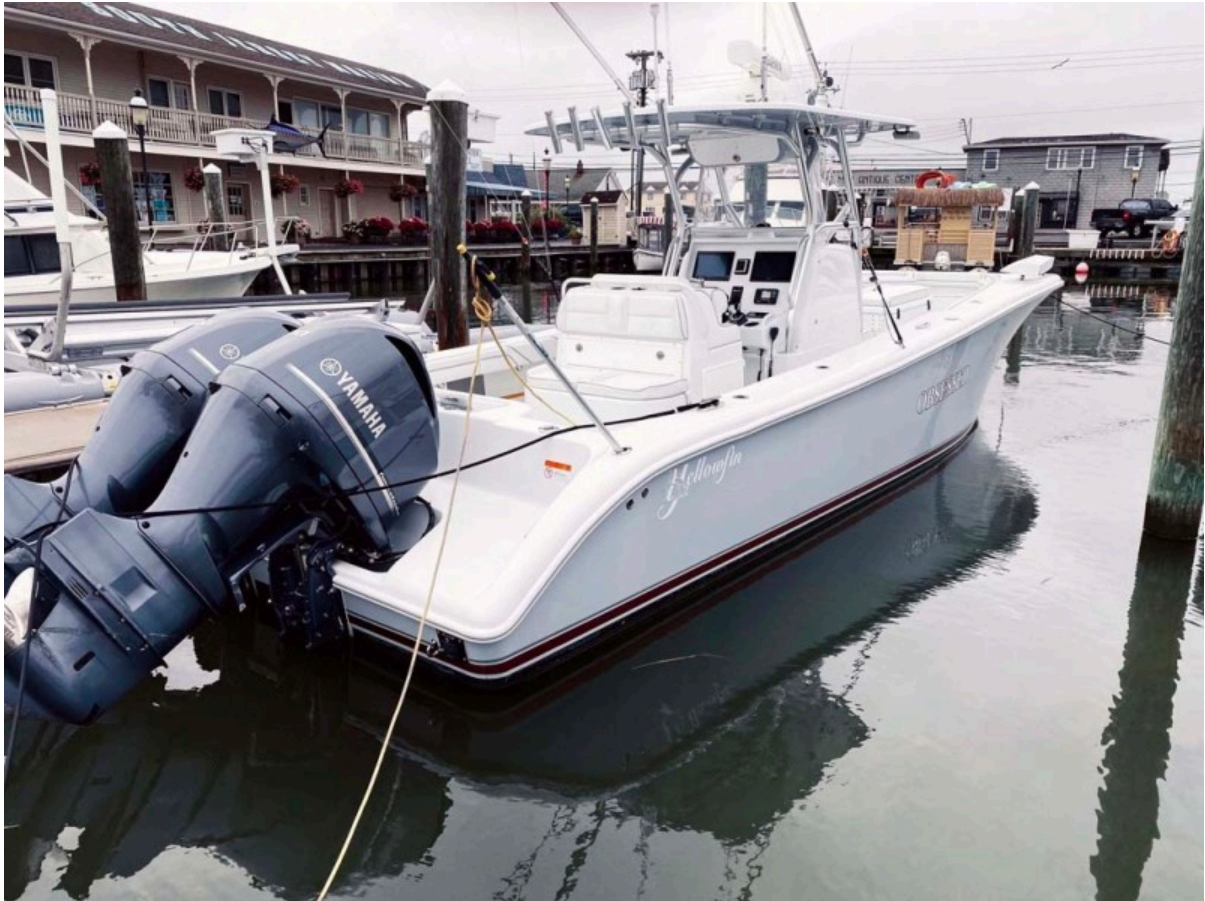
Starboard Aft View