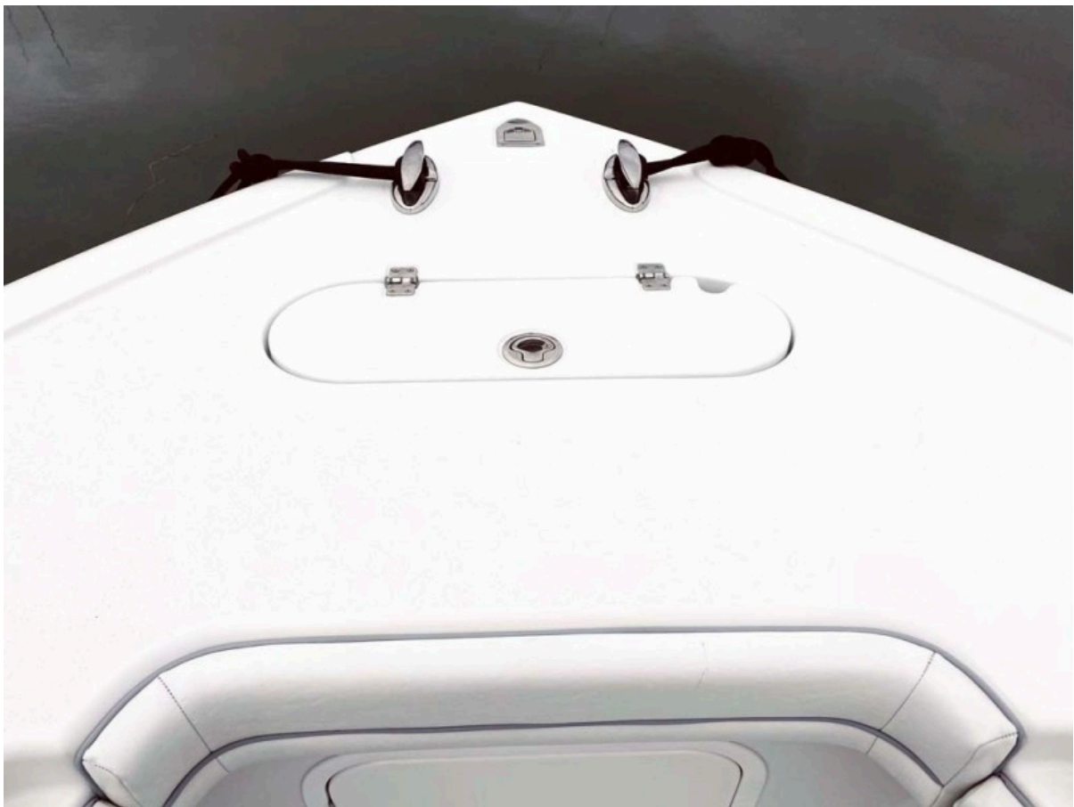
Bow and Anchor Locker