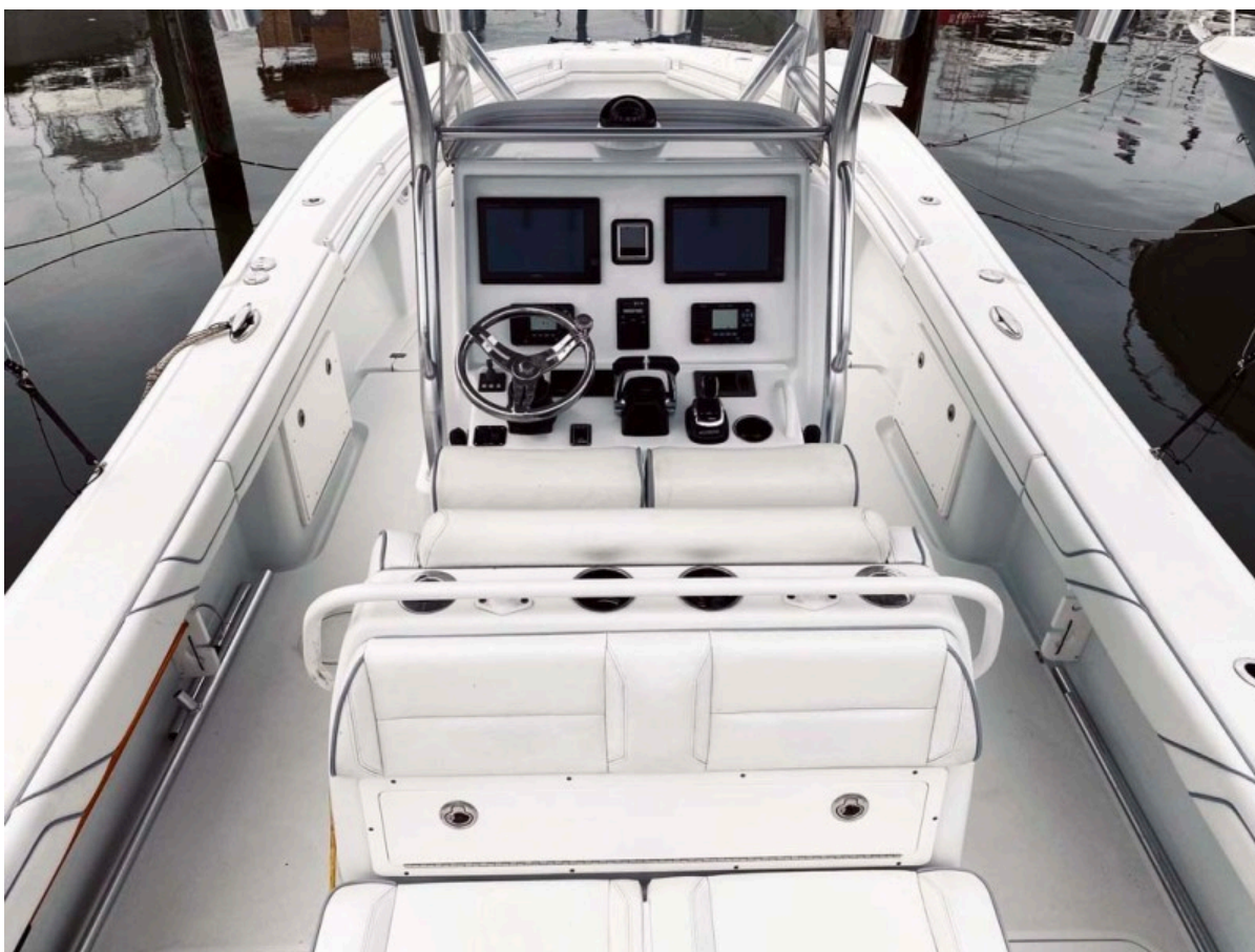
Center Console And Helm