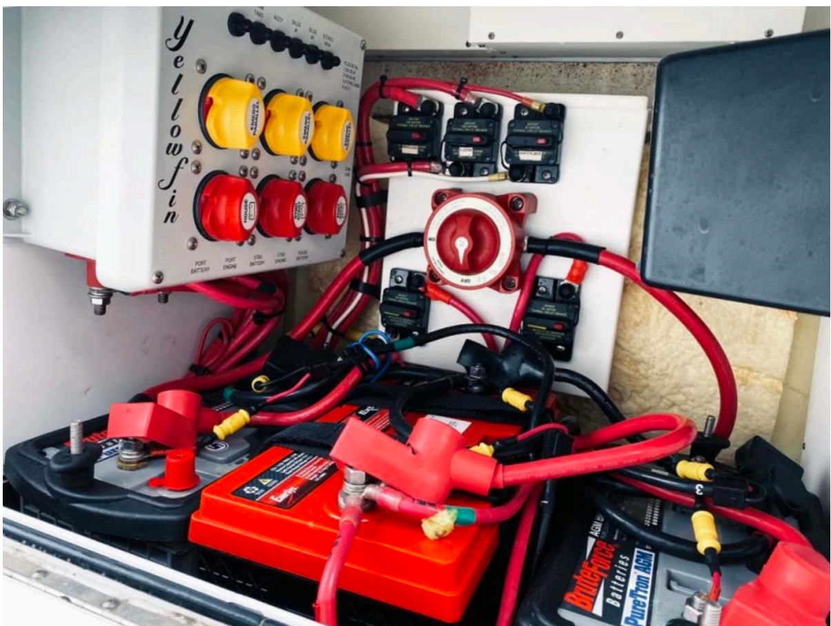
Batteries and Charger