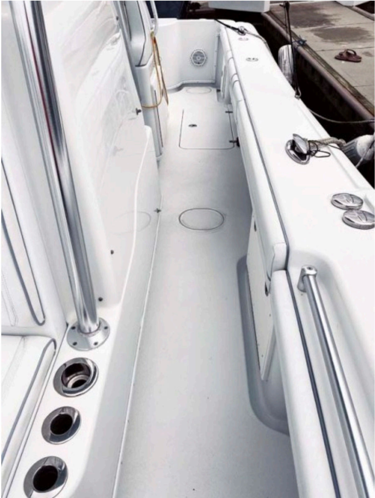
Port Side Walkway