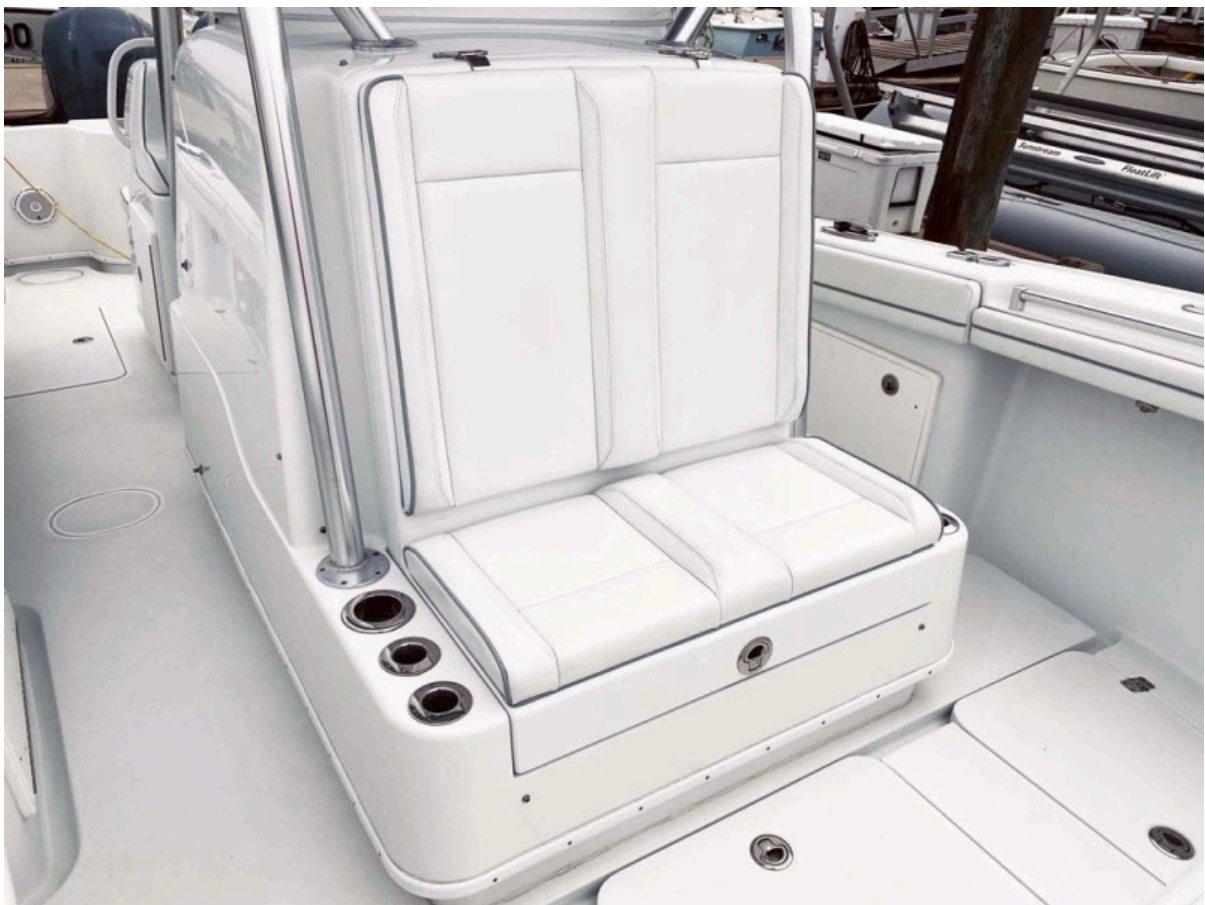
Forward Seating And Storage