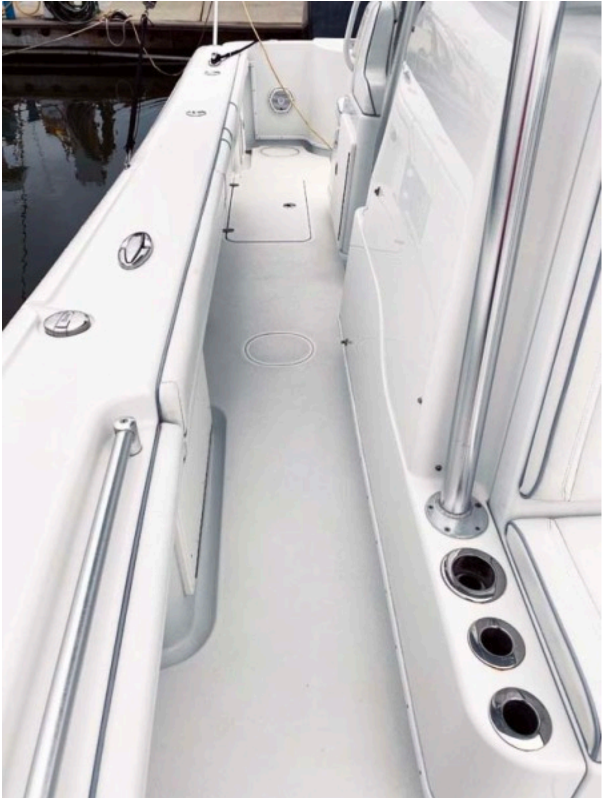
Starboard Side Walkway