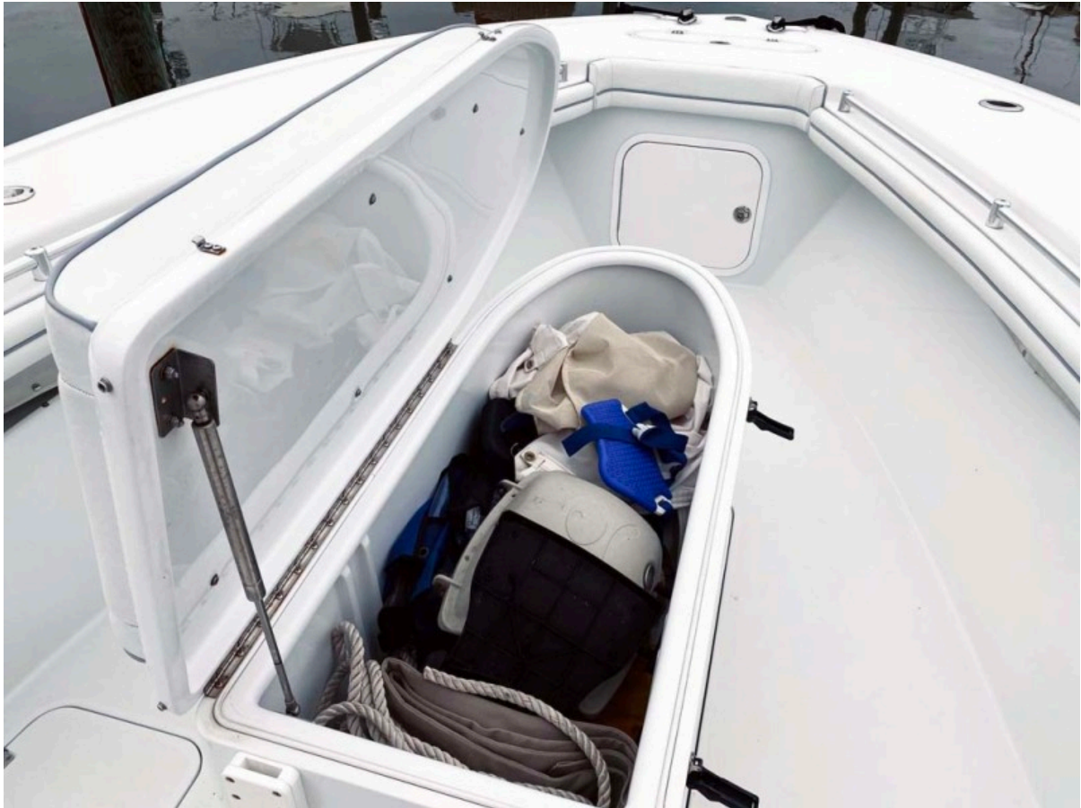
Coffin Box Open