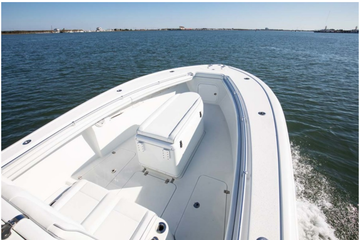
Forward Deck and Padded Coffin Box With Backrest And Storage