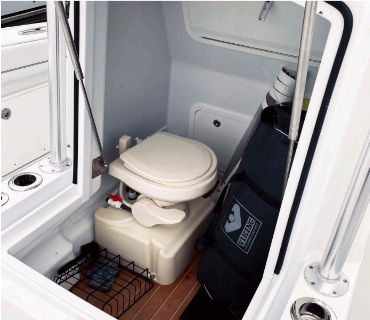
Head In Center Console