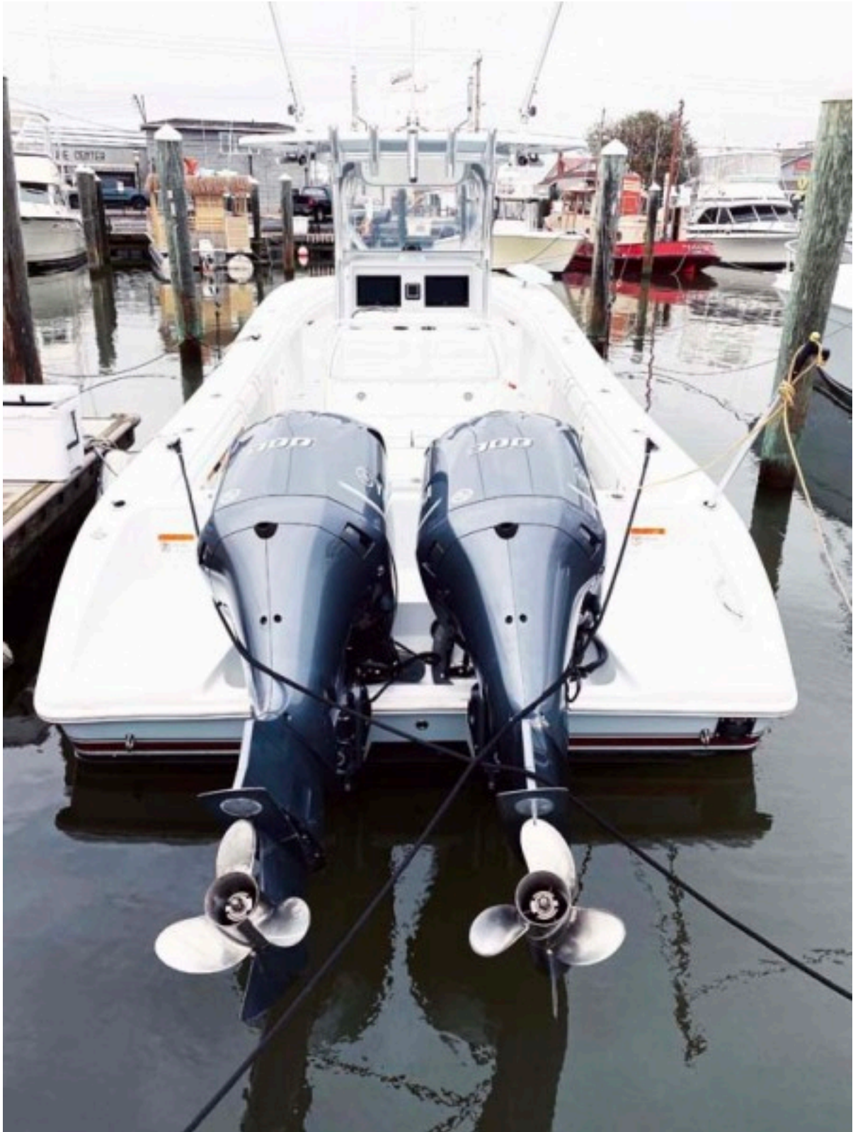
Stern View With Twin Outboards