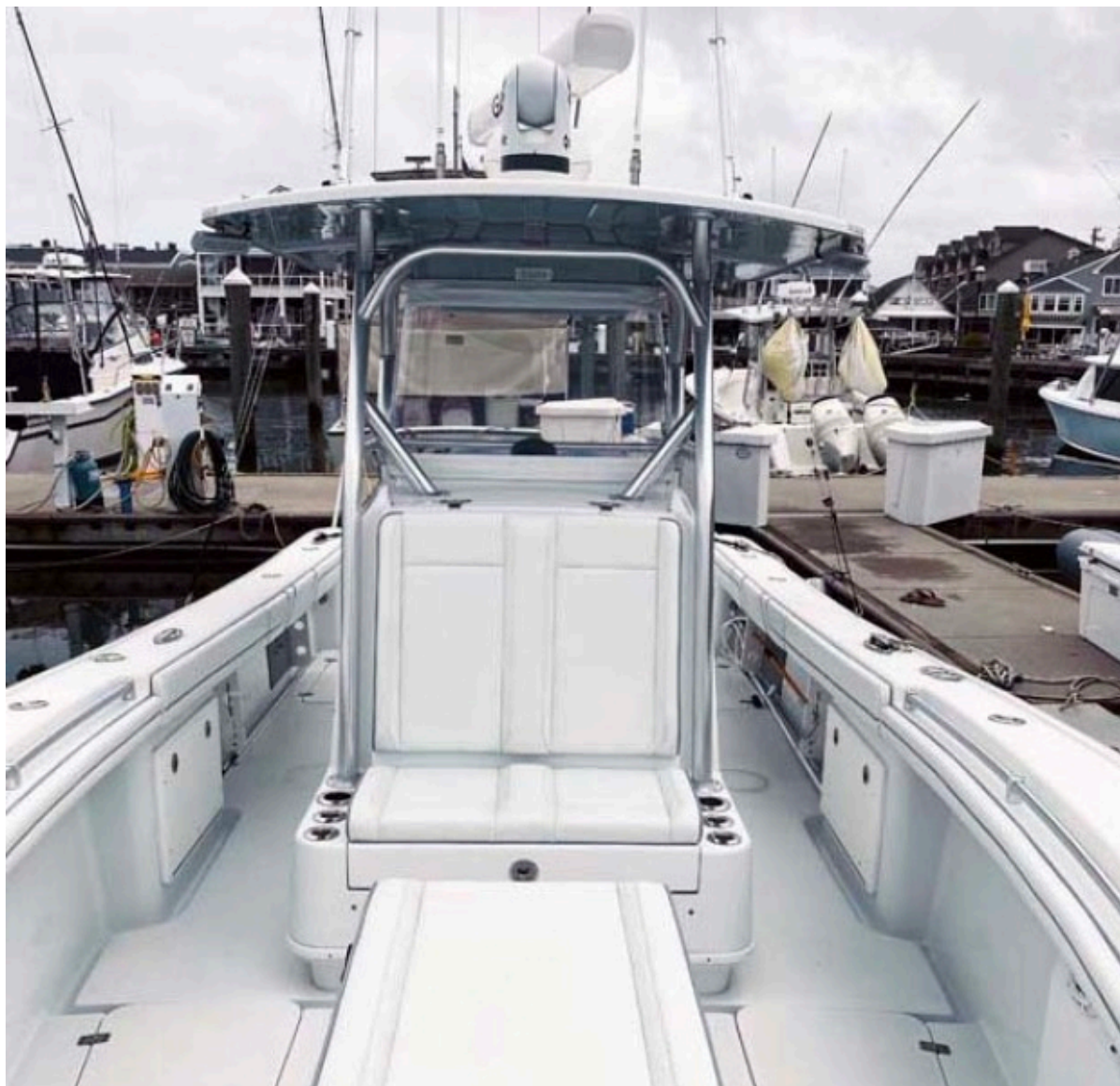
Center Console And Coffin Box