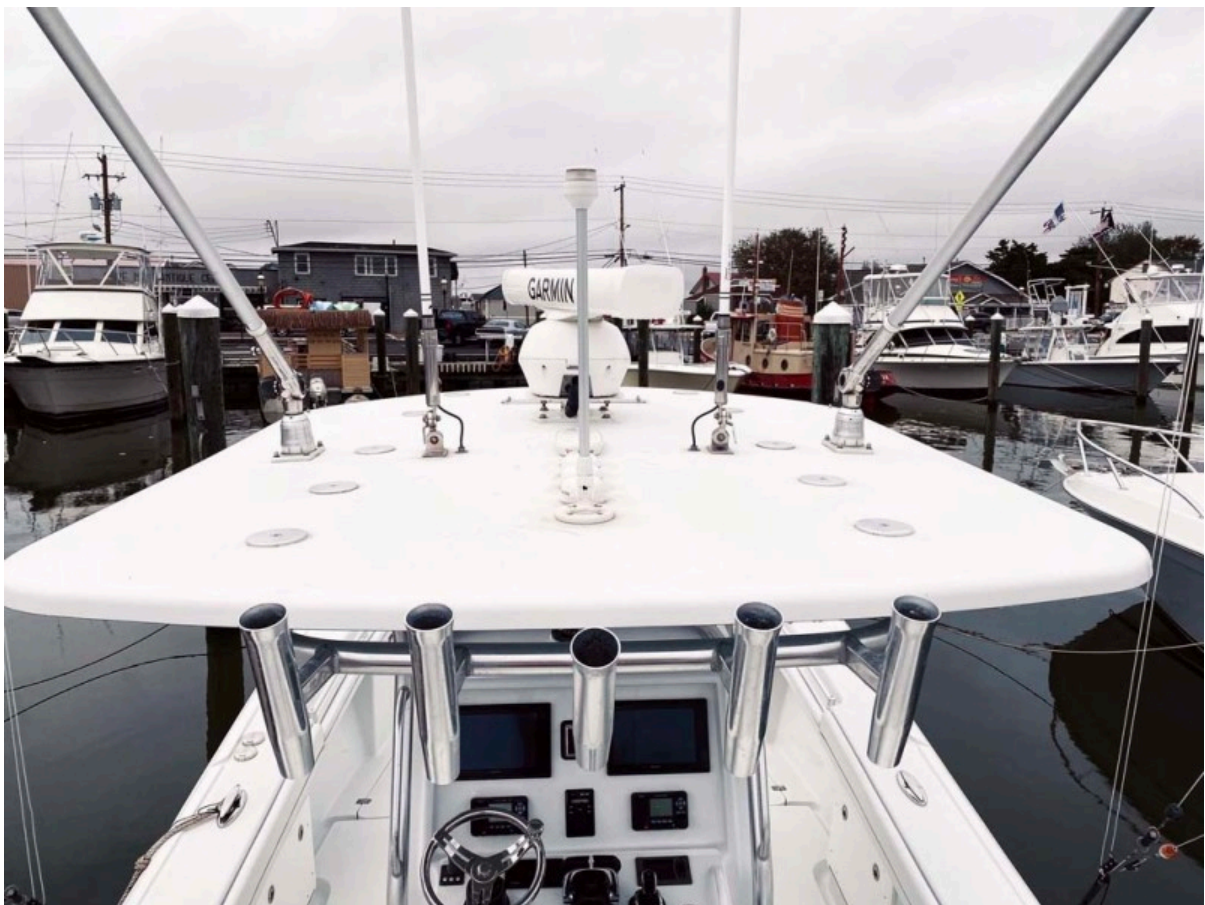
T-Top With Rod Holders