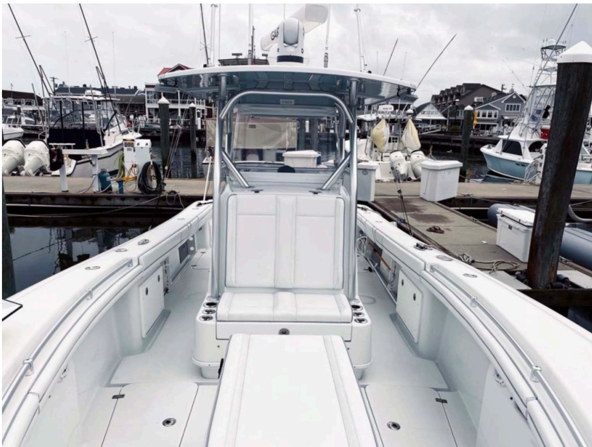
Center Console And Coffin Box