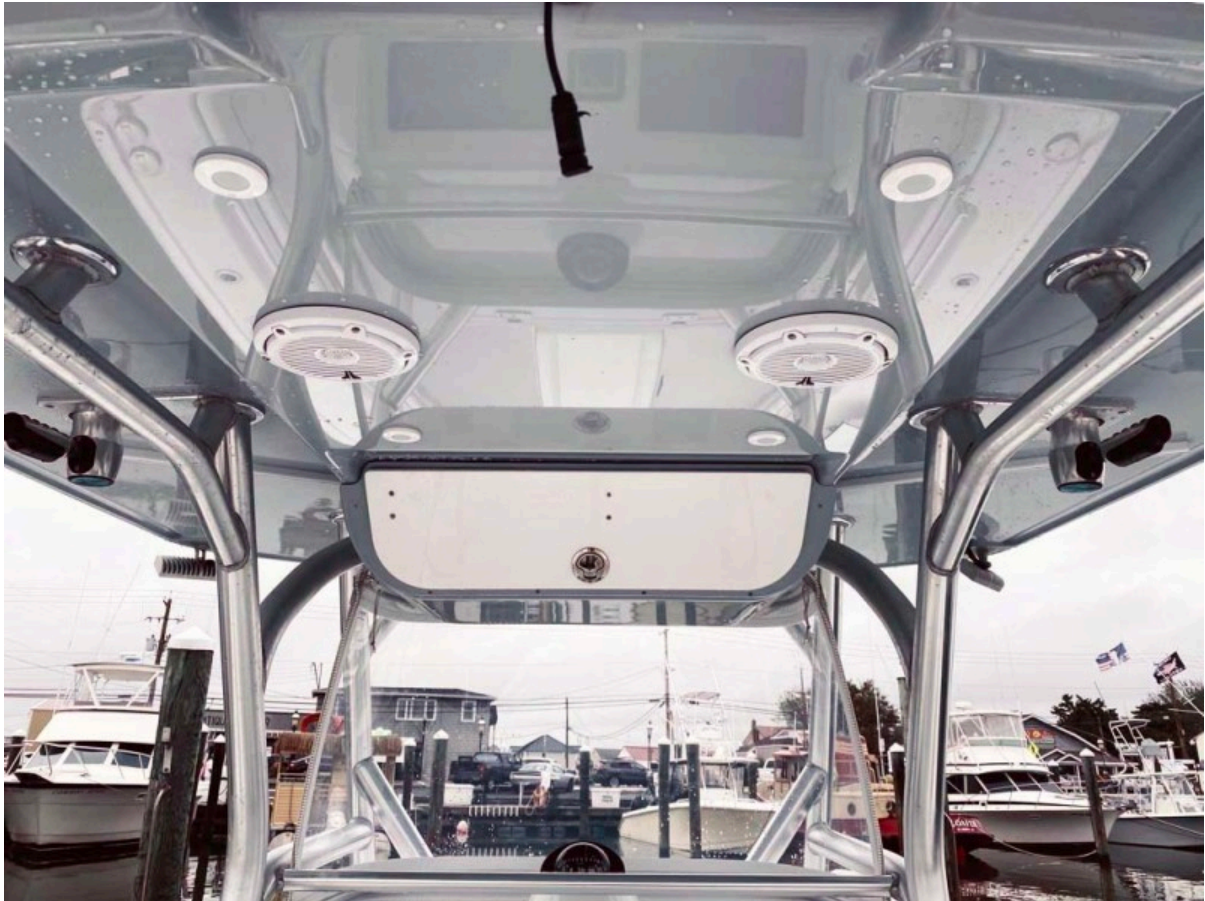
T-Top With Lights And Speakers