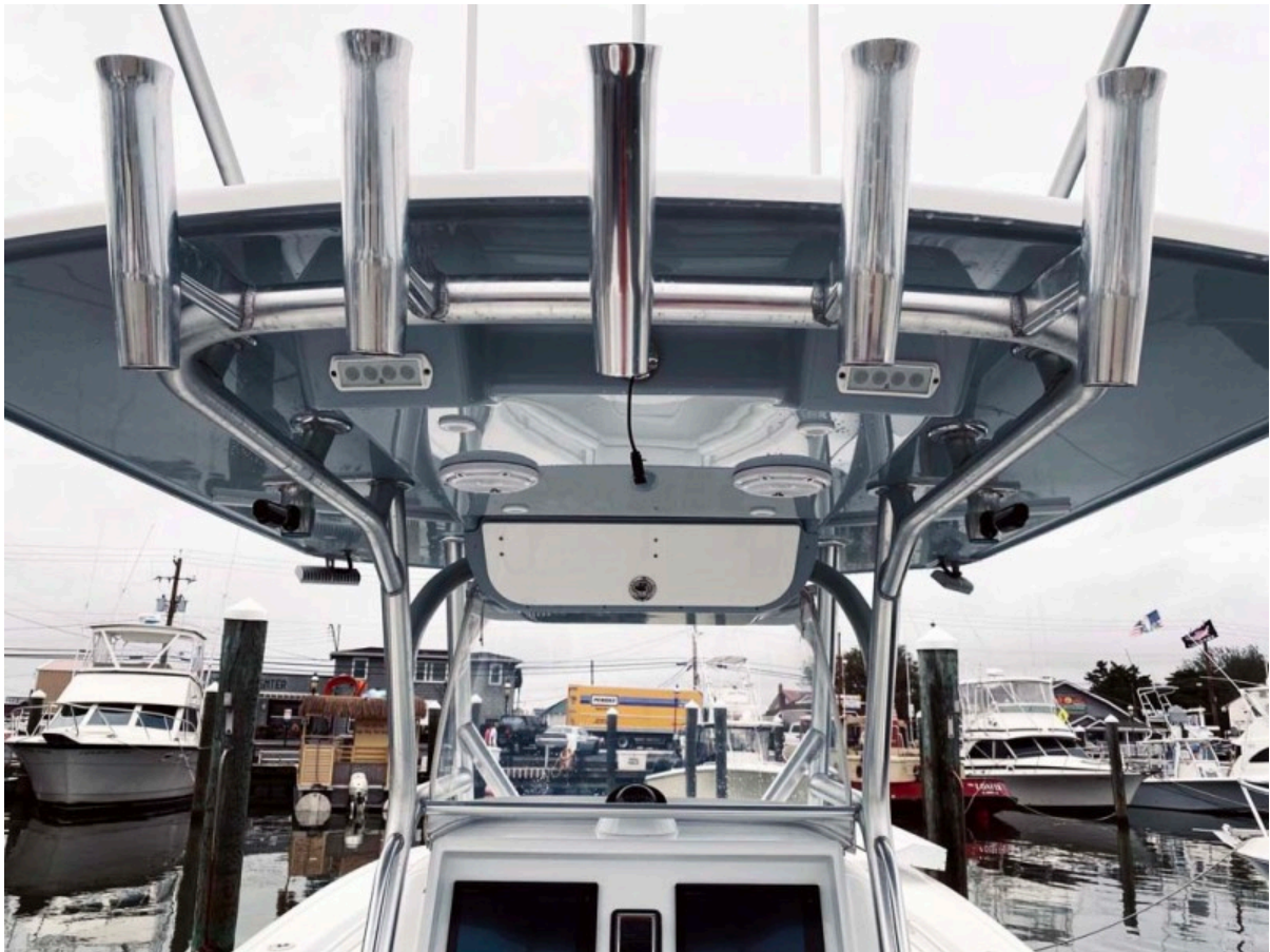
T-Top With Rod Holders