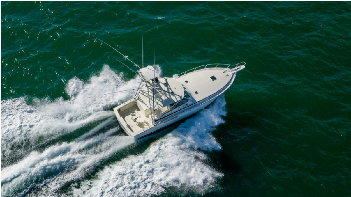
1994 Bertram 46 Mopie - Teazzers