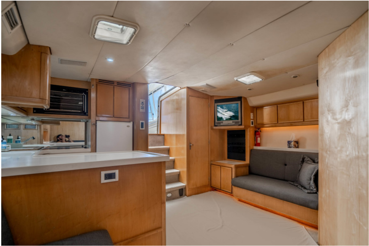
Bertram 46 Mopie