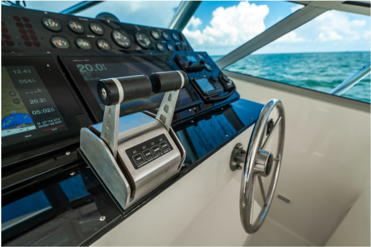
Bertram 46 Moppie