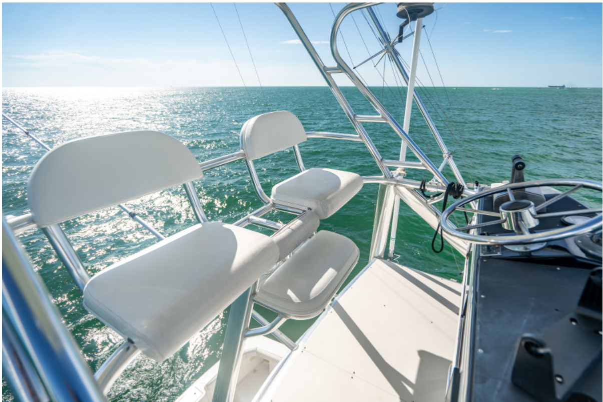
Bertram 46 Moppie