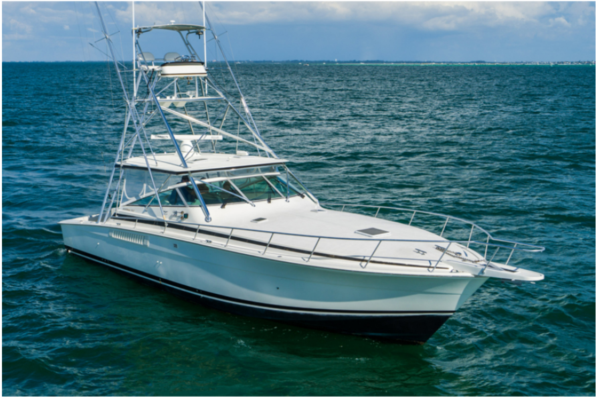
1994 Bertram 46 Mopie - Teazzers