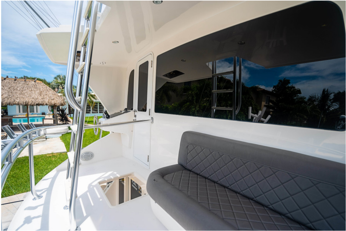
74 Viking Fly