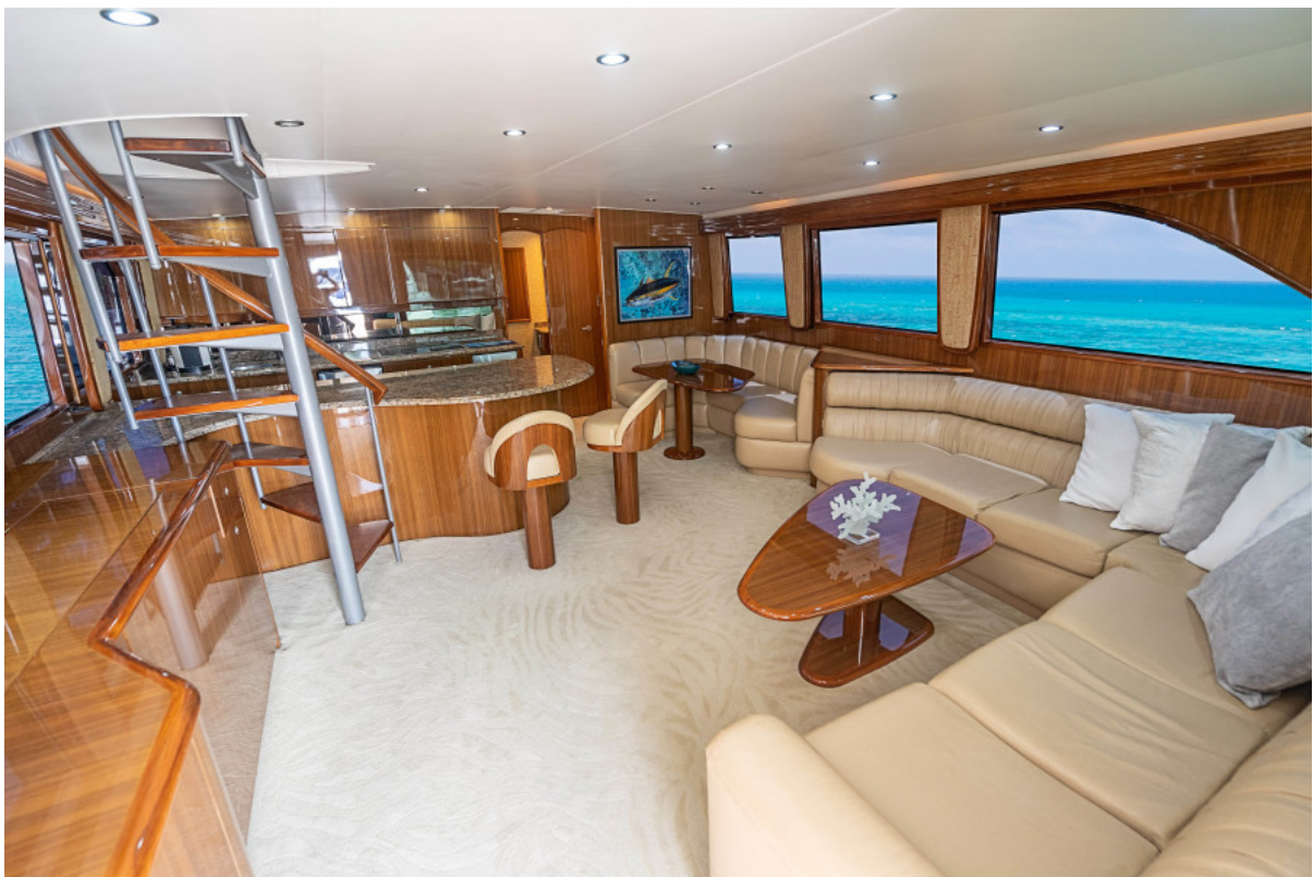
74 Viking Salon