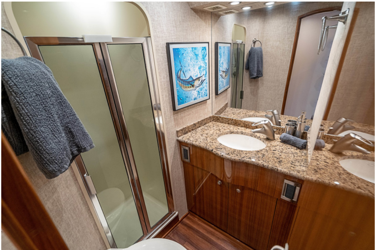
74 Viking Guest Ensuite