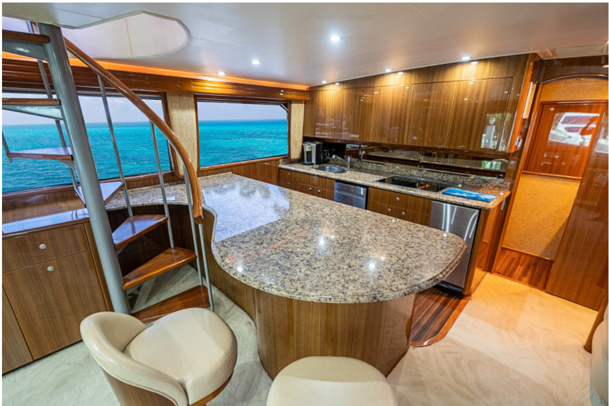
74 Viking Galley