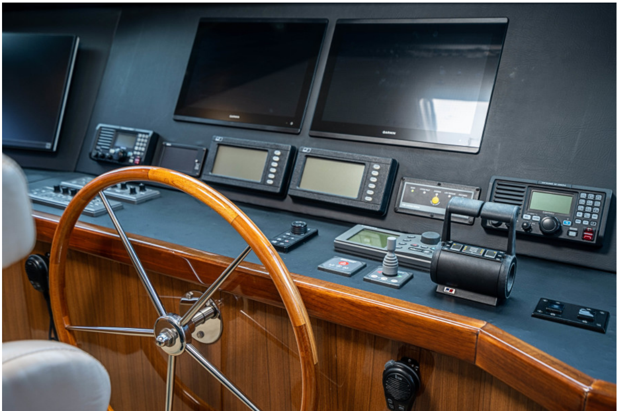
74 Viking Helm