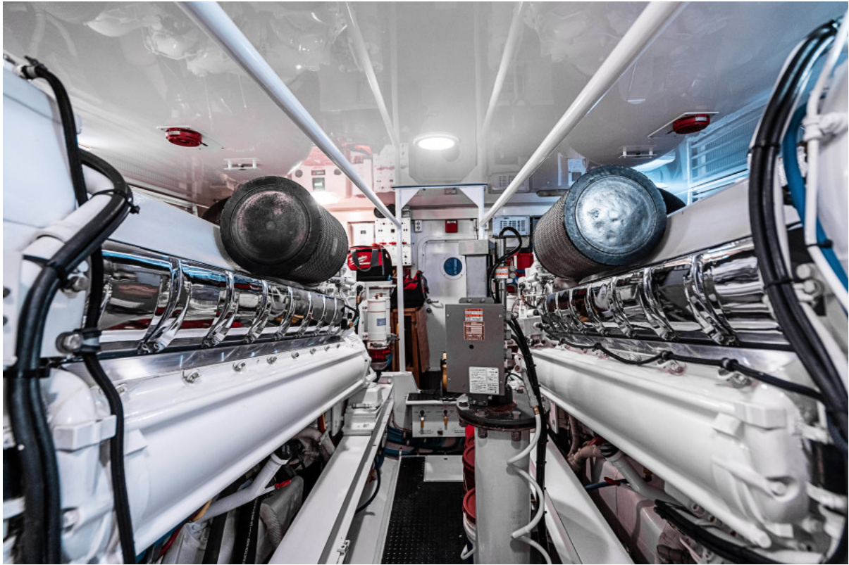
74 Viking Engine Room