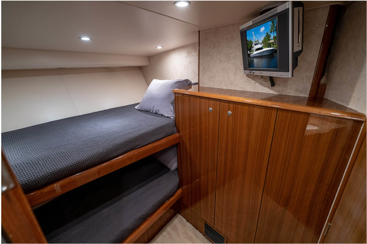
74 Viking Guest