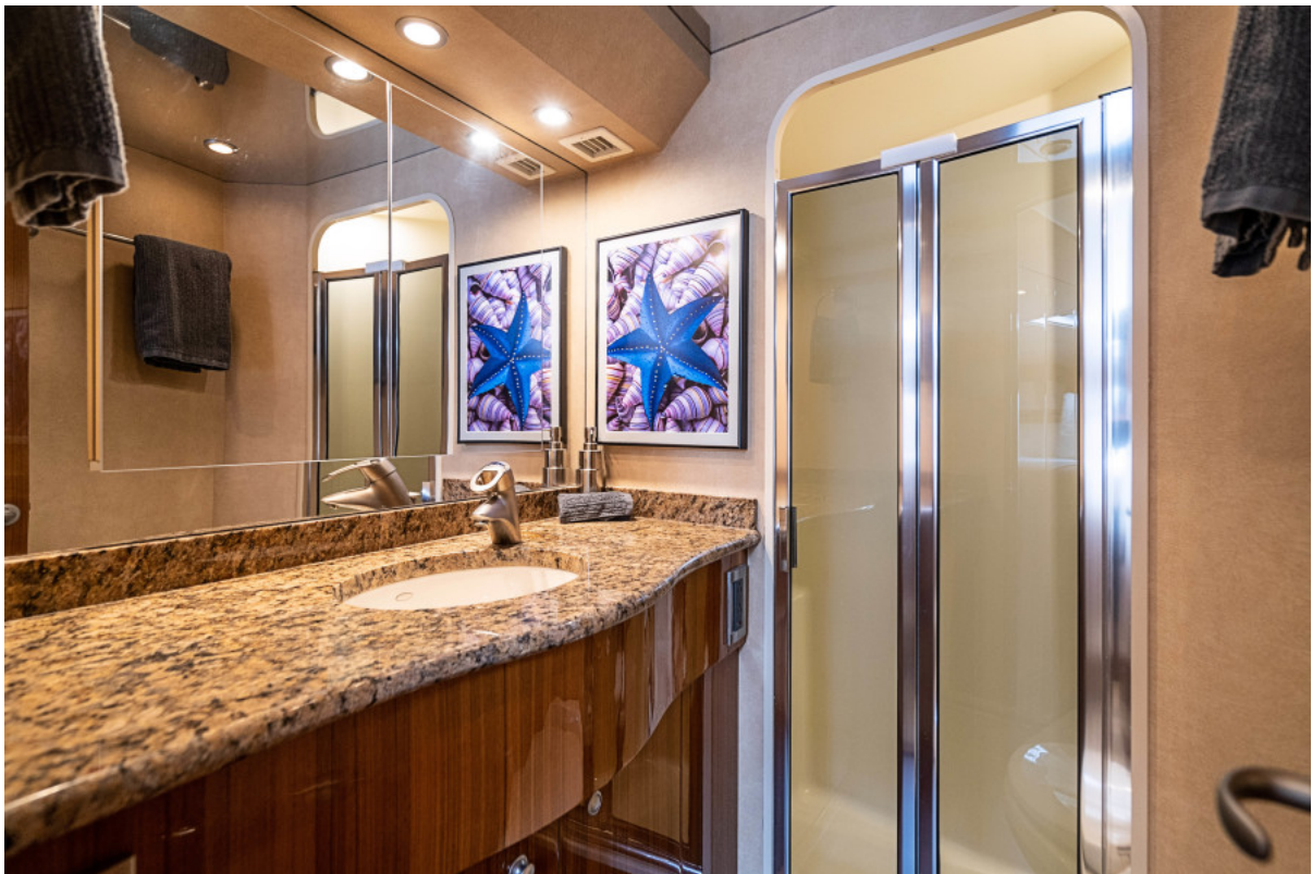
74 Viking VIP Ensuite