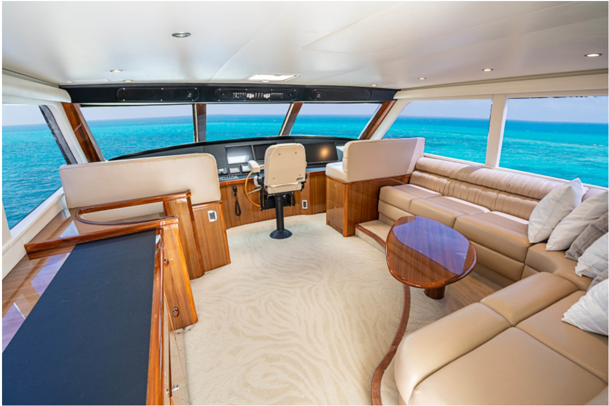
74 Viking Bridge