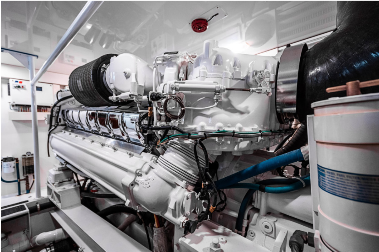
74 Viking Engine Room