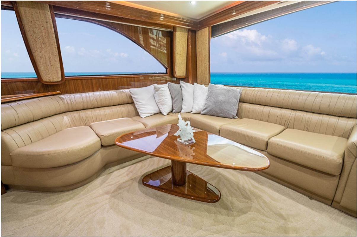
74 Viking Salon