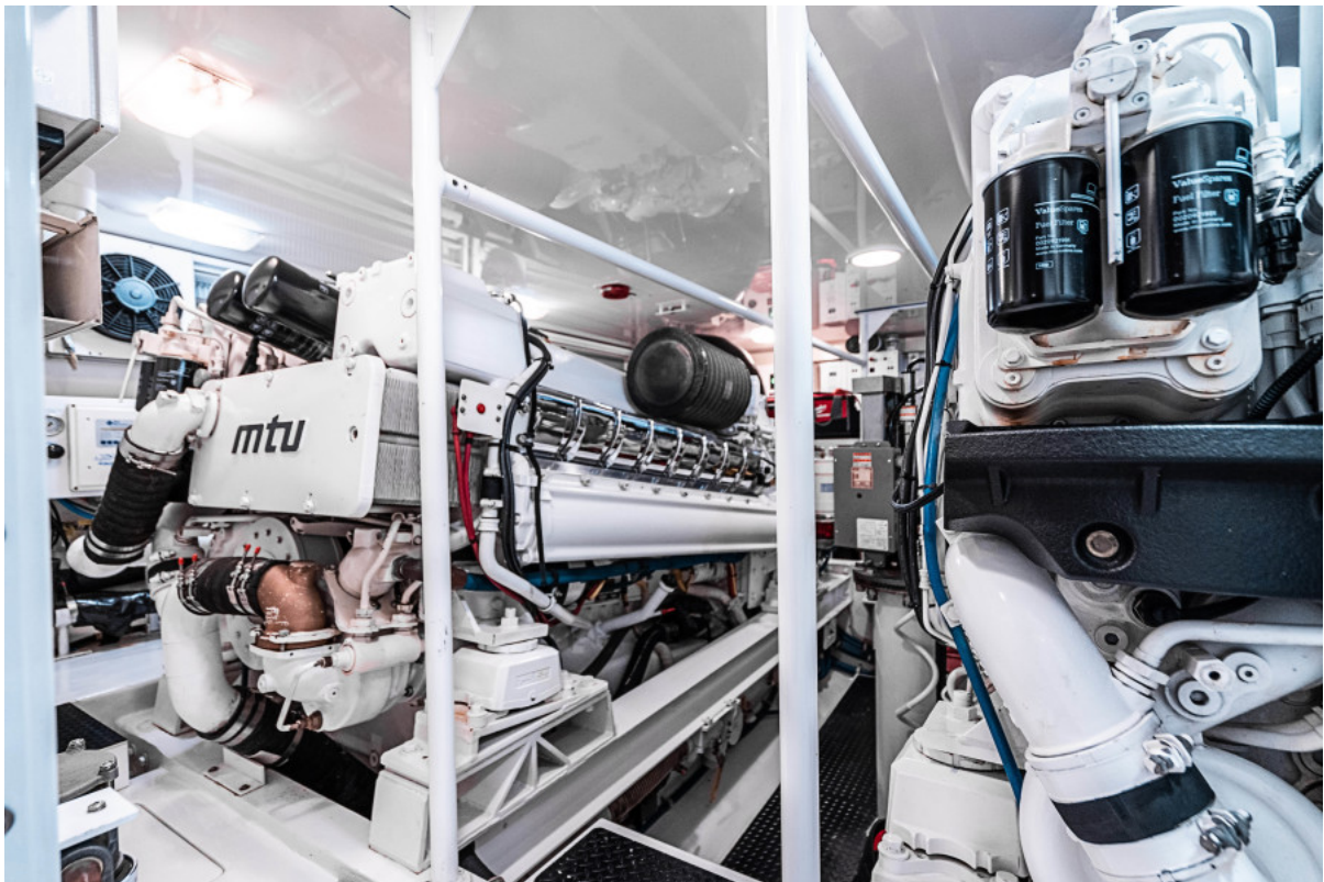
74 Viking Engine Room