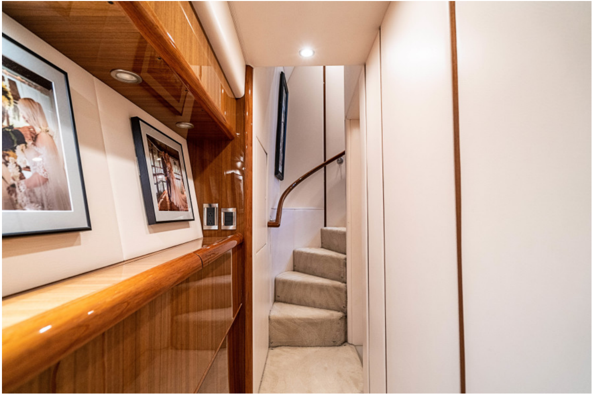
74 Viking Hall