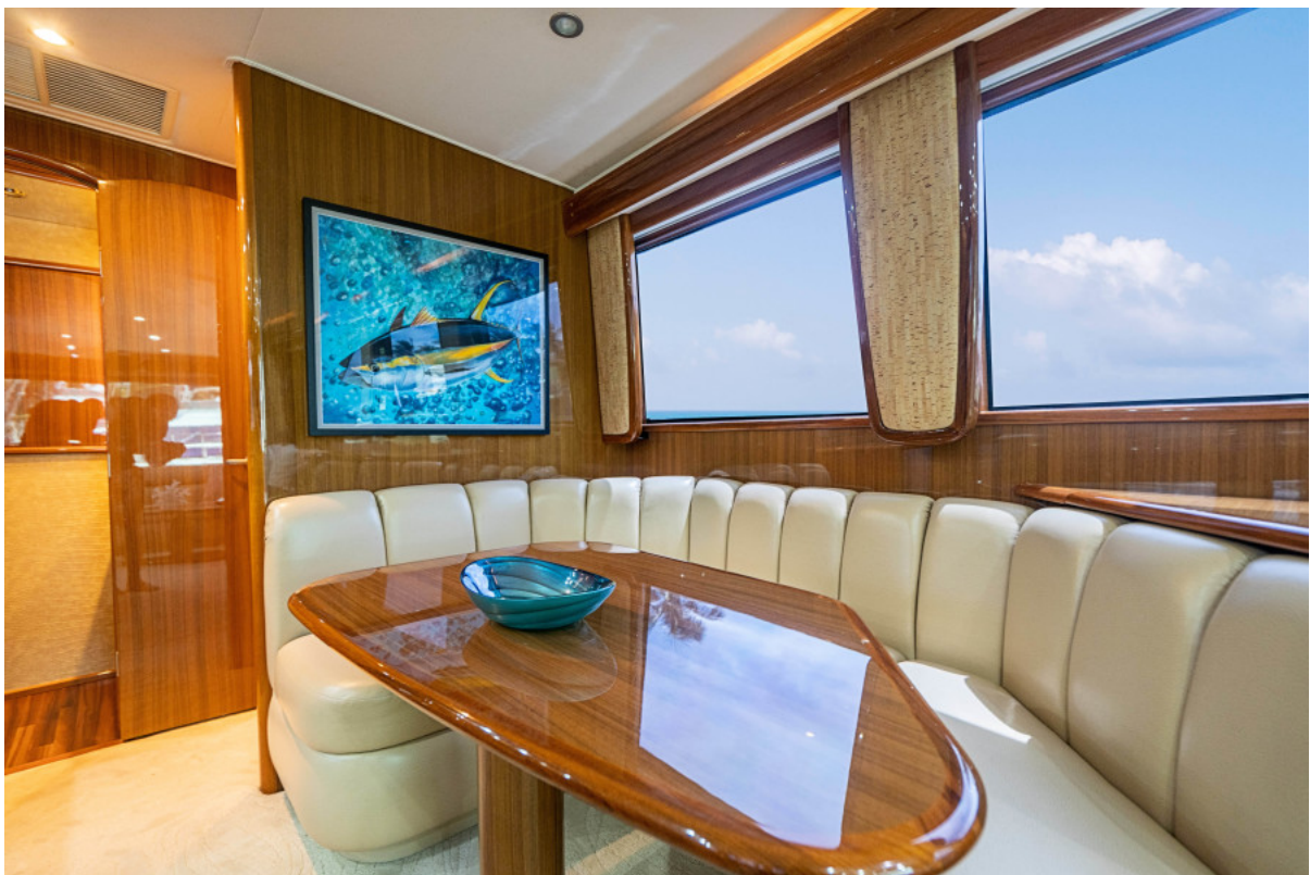
74 Viking Salon