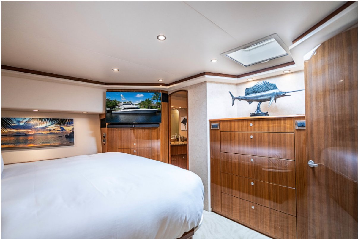
74 Viking Master