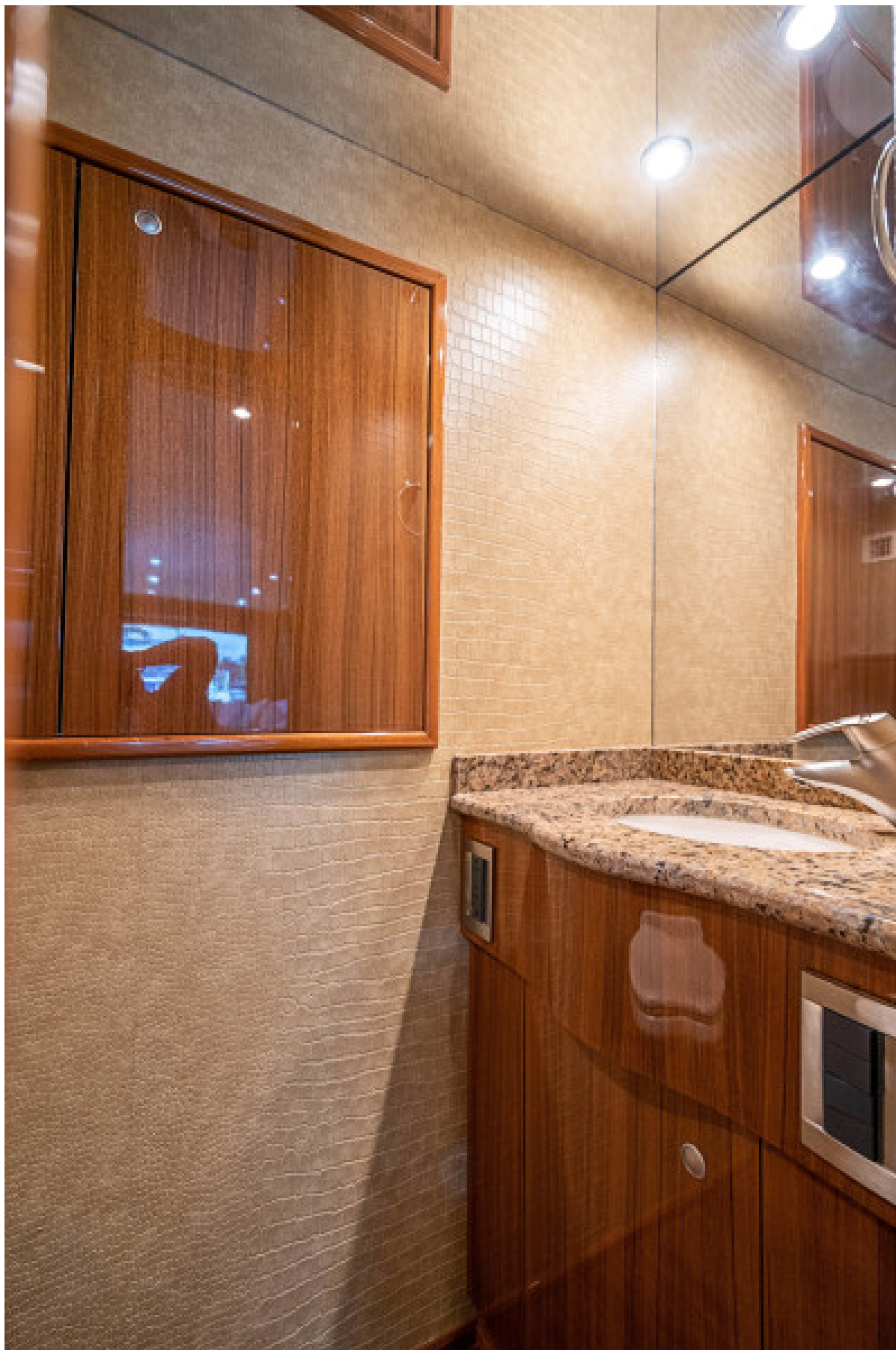
74 Viking Day Head