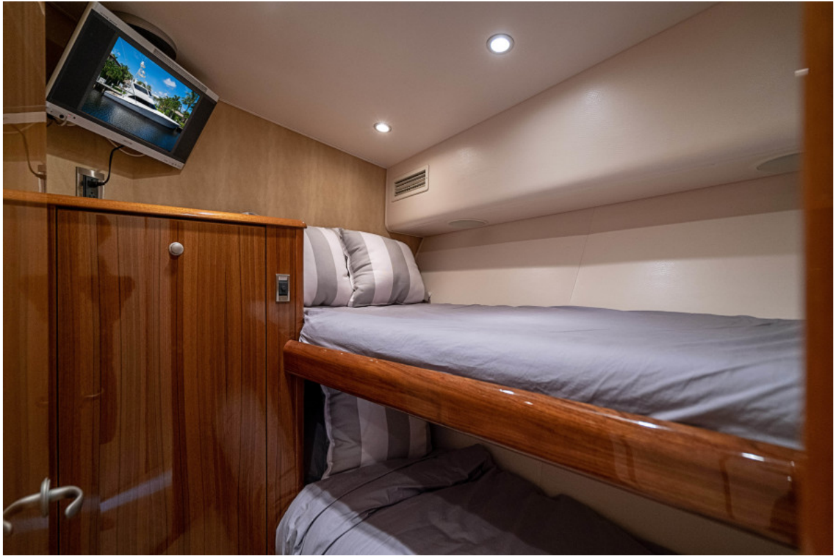
74 Viking Guest