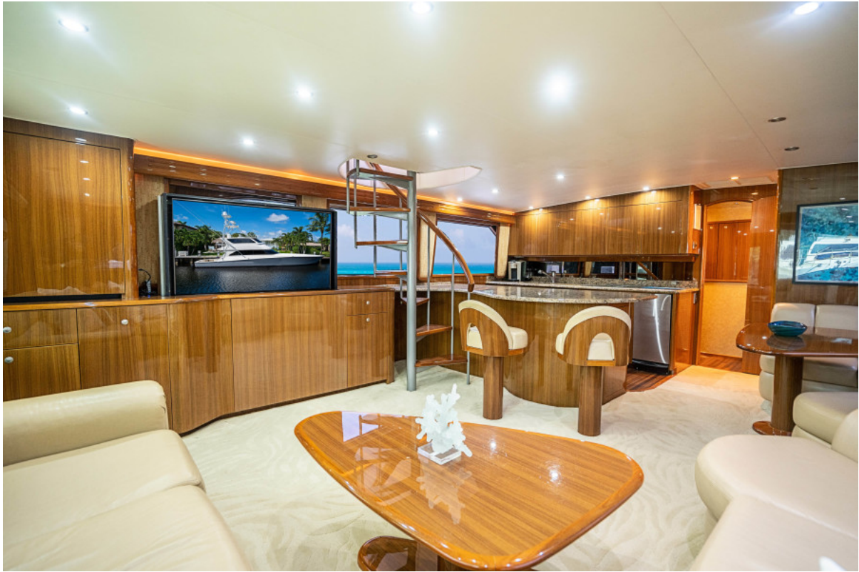
74 Viking Salon