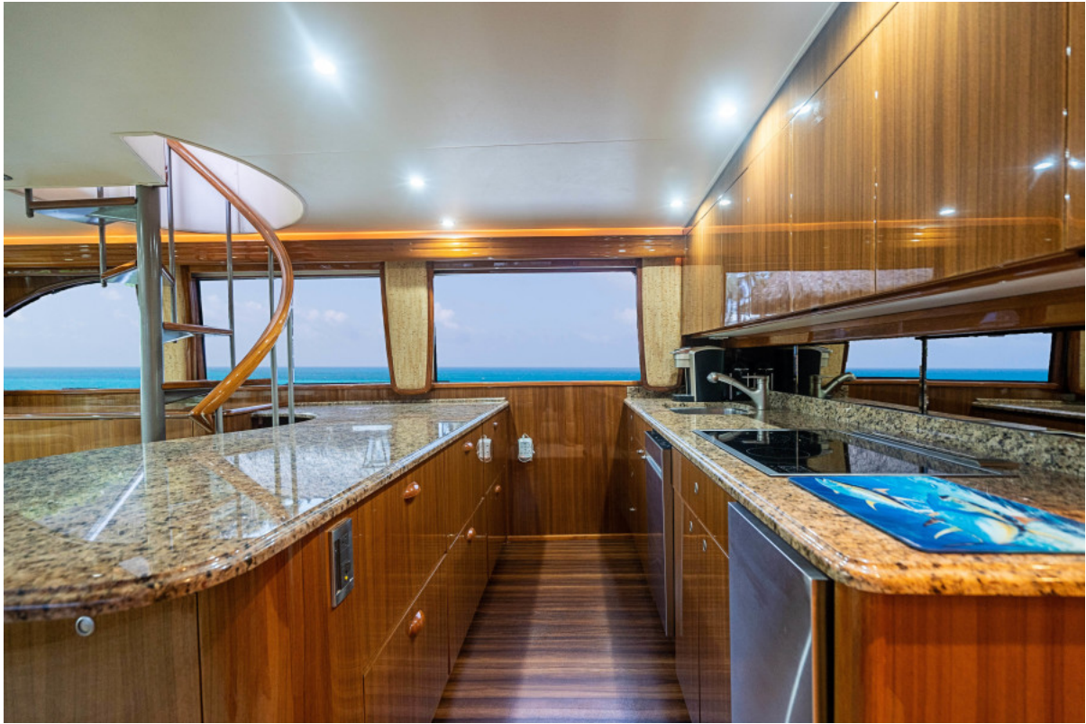
74 Viking Galley