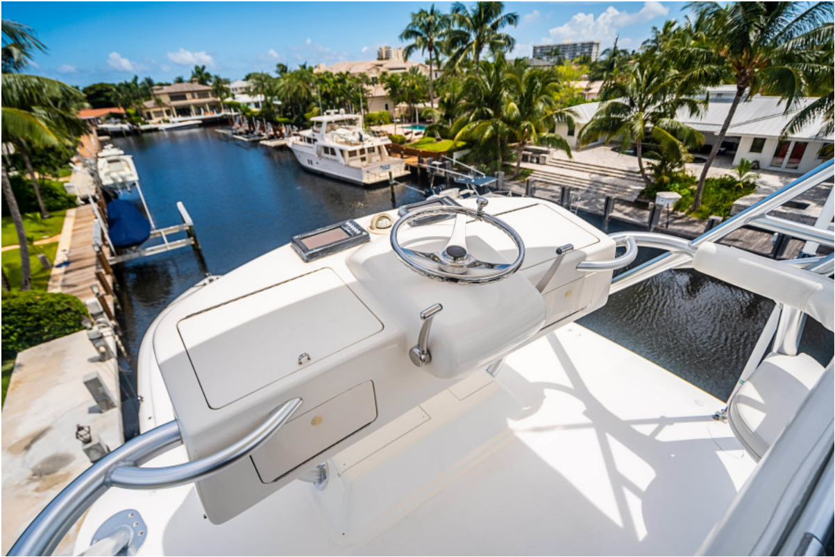
74 Viking Tower