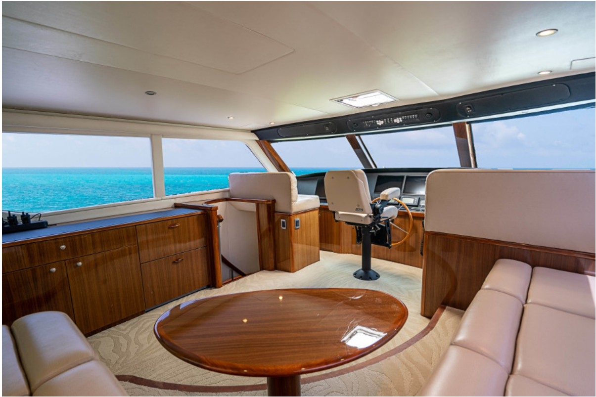
74 Viking Bridge