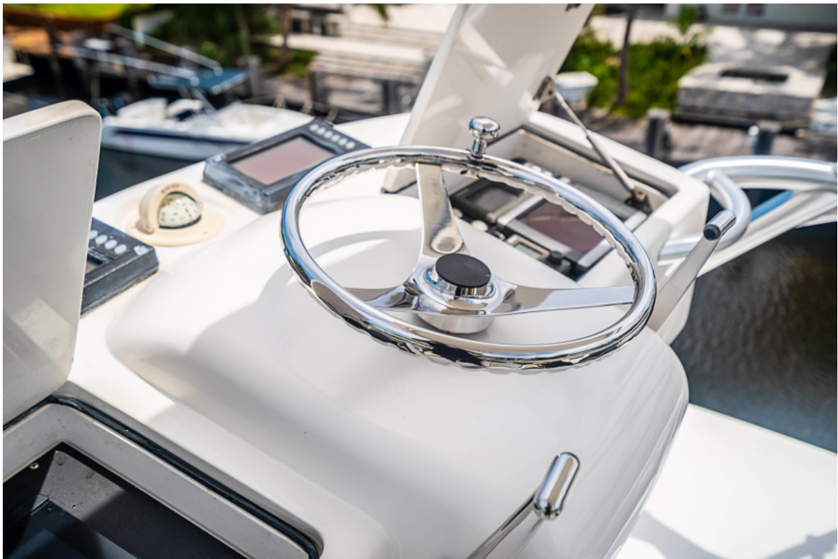
74 Viking Tower