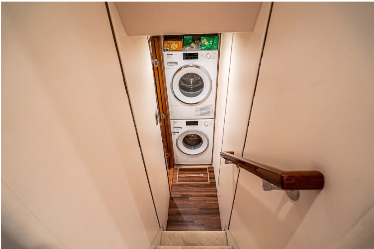
74 Viking Laundry