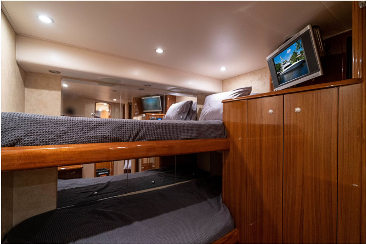
74 Viking Crew