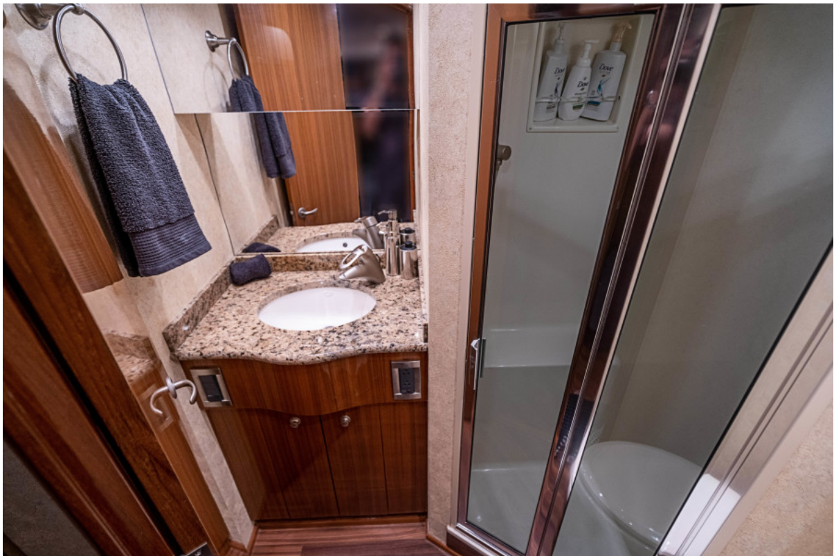
74 Viking Crew ensuite