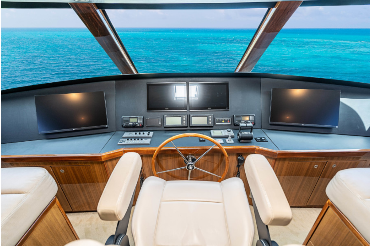
74 Viking Helm