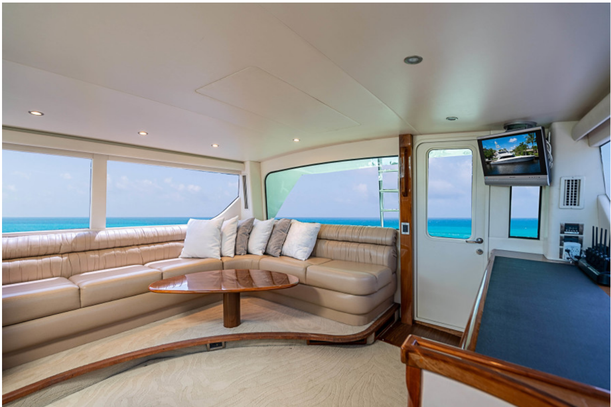
74 Viking Bridge