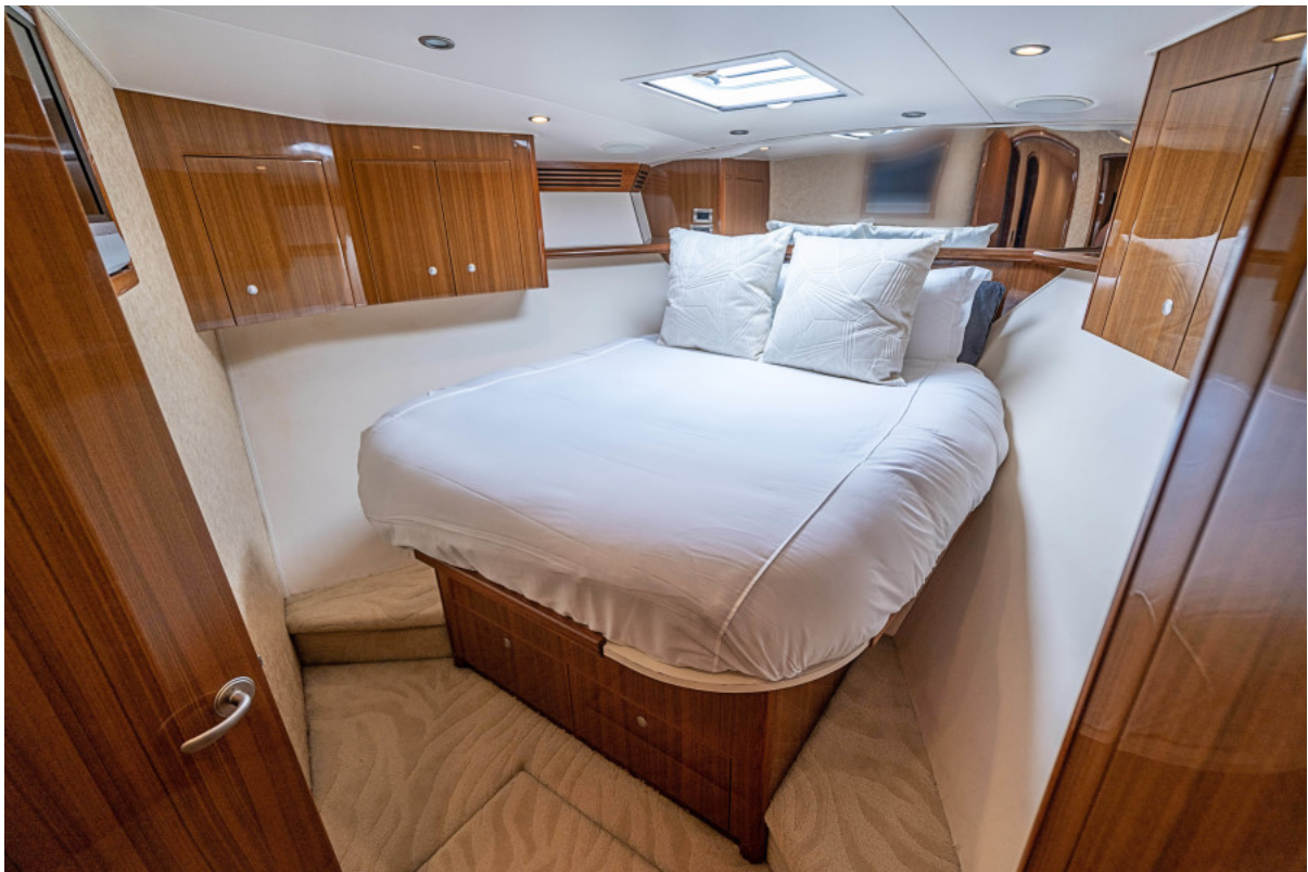
74 Viking VIP