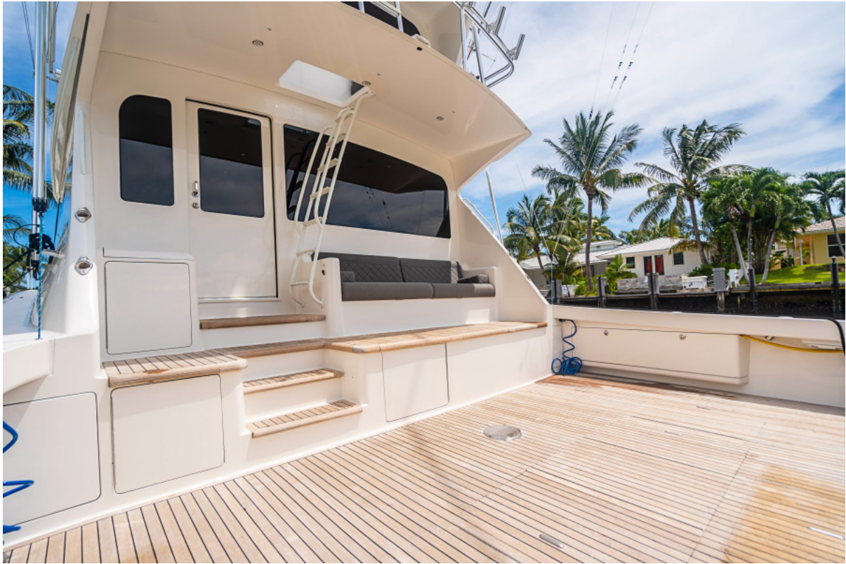
74 Viking Cockpit