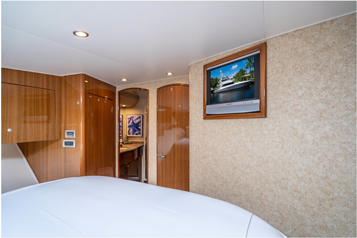
74 Viking VIP