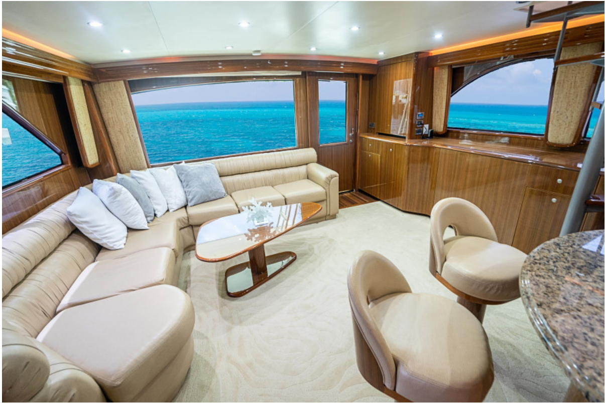
74 Viking Salon