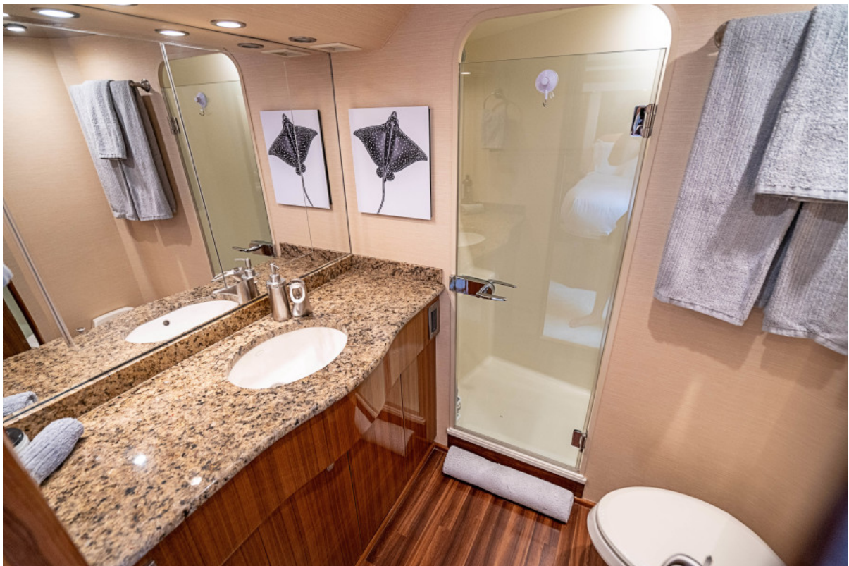
74 Viking Master Ensuite