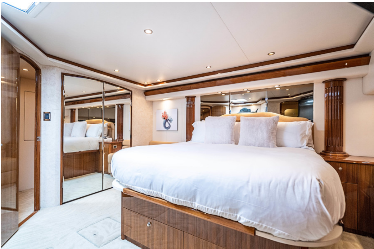
74 Viking Master