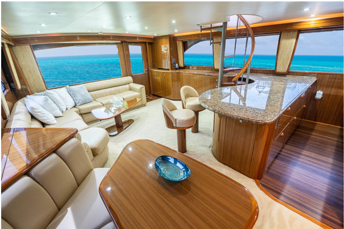
74 Viking Salon