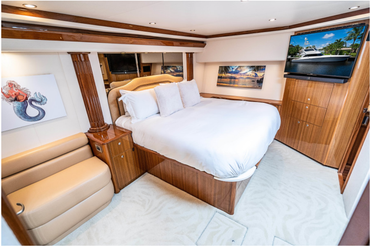
74 Viking Master