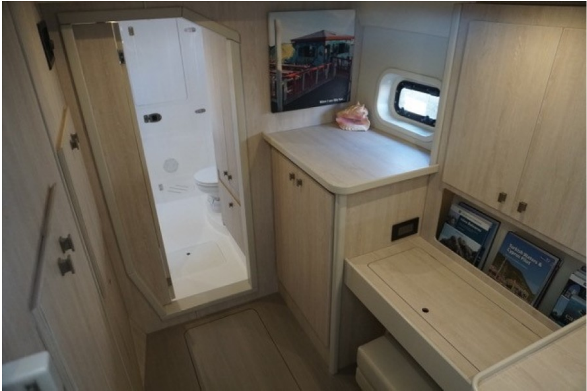
Master Ensuite Head, Storage