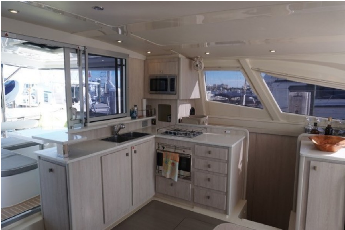
Aft Galley With Pass Through Window