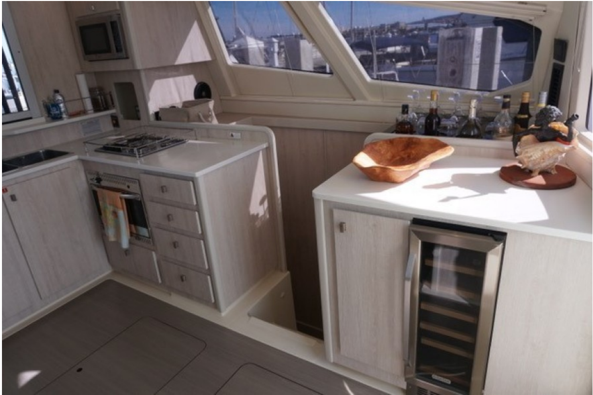
Galley And Bar To Portside