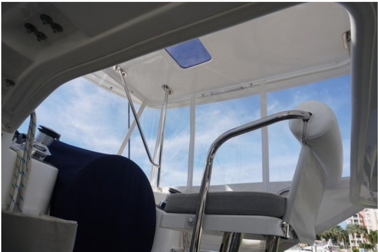
Helm Enclosed Hardtop With Skylight