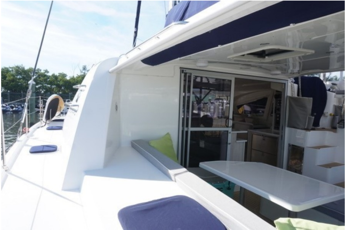
Port Side Deck, Cabin Entry