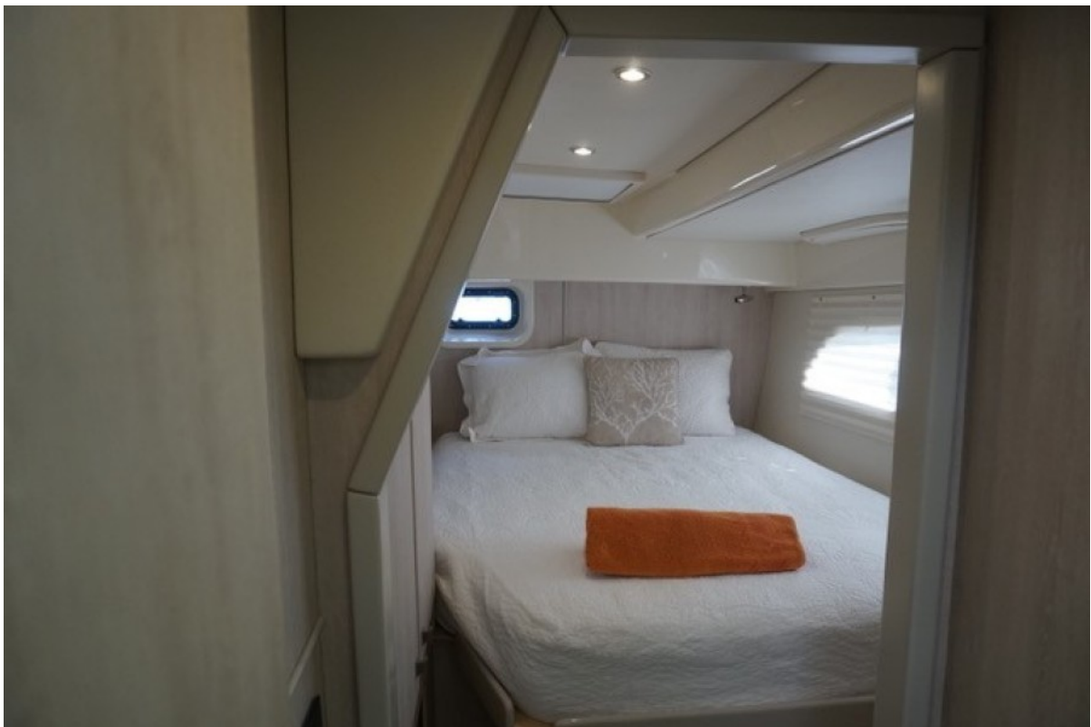
Forward Guest Suite 2