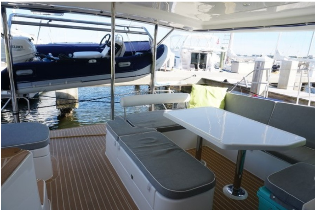
Aft Deck Seating & Table