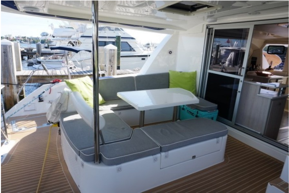
Aft Deck Dining To Port