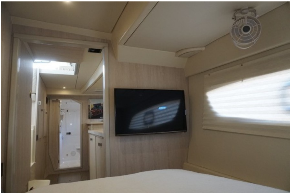
MSR to Aft, TV