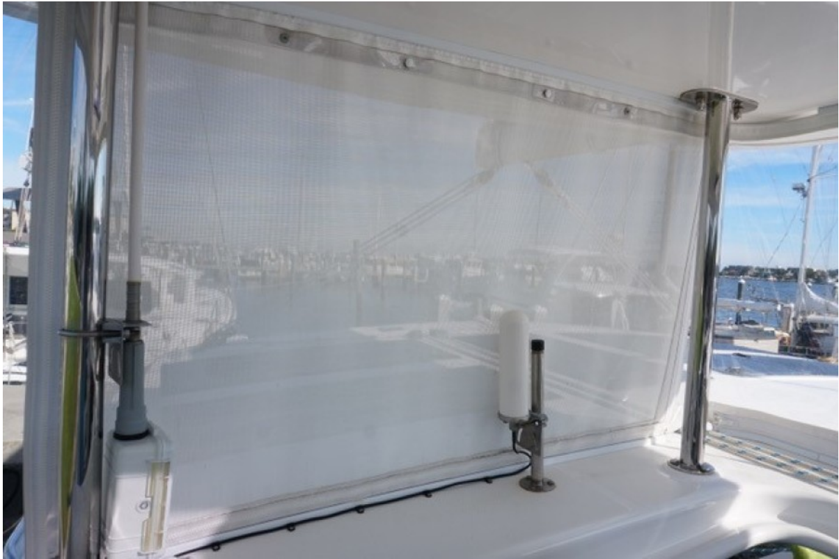
Aft Curtain - Helm