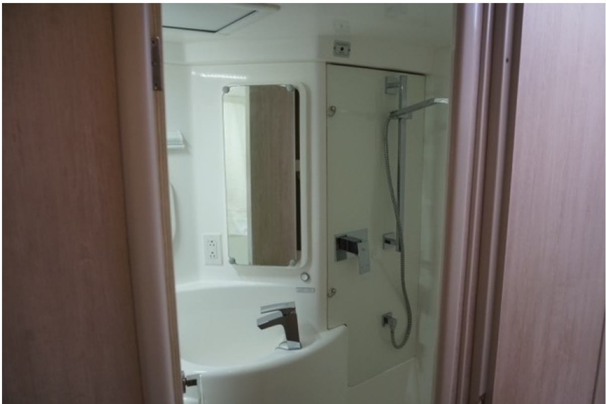
Guest - Ensuite Head 2