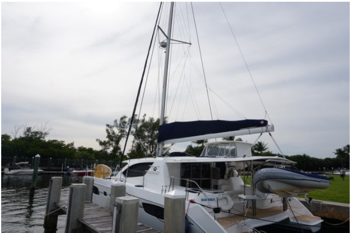
Port Stern View, Mast, Rigging