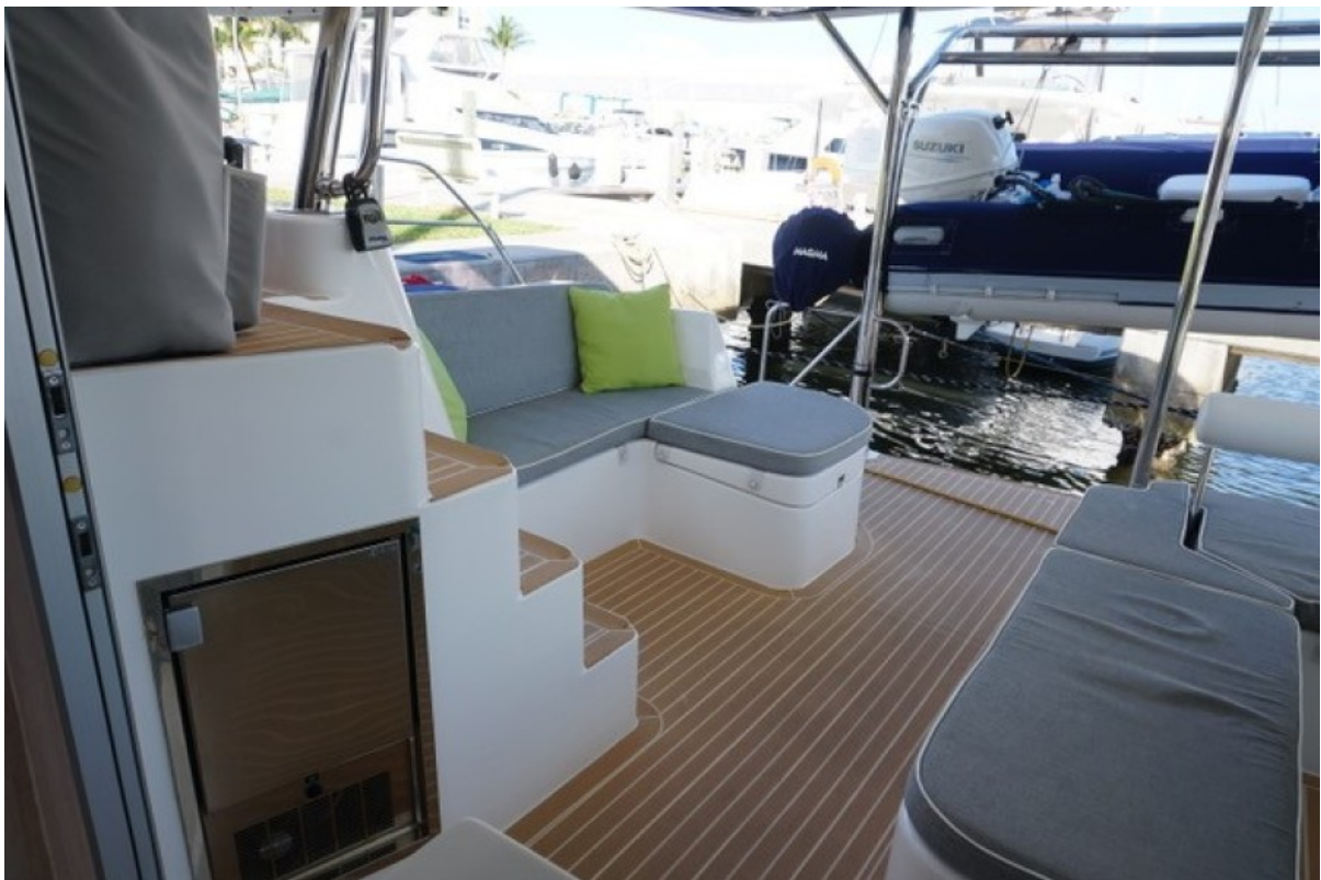
Aft Deck To Stbd Aft