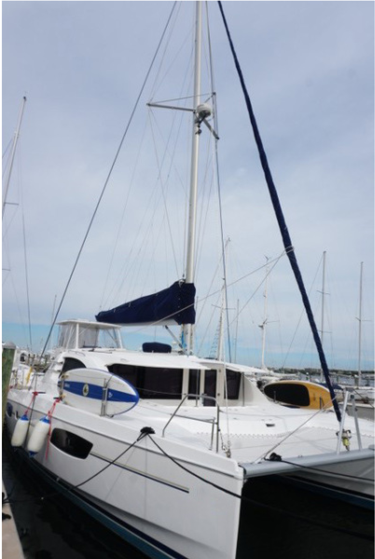
Stbd Bow - Mast, Rigging