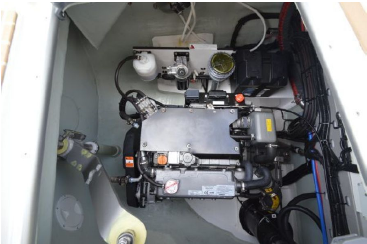
Engine Compartment 3