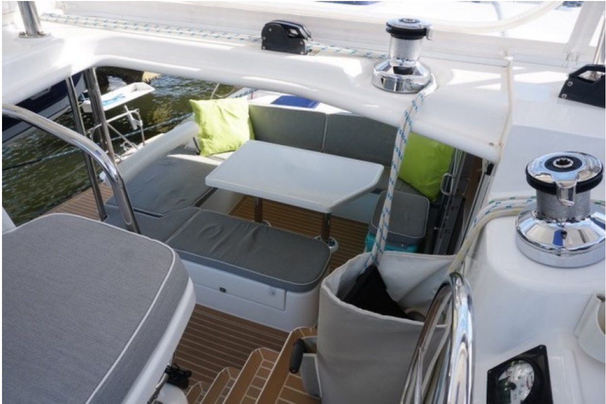
Helm & Seat