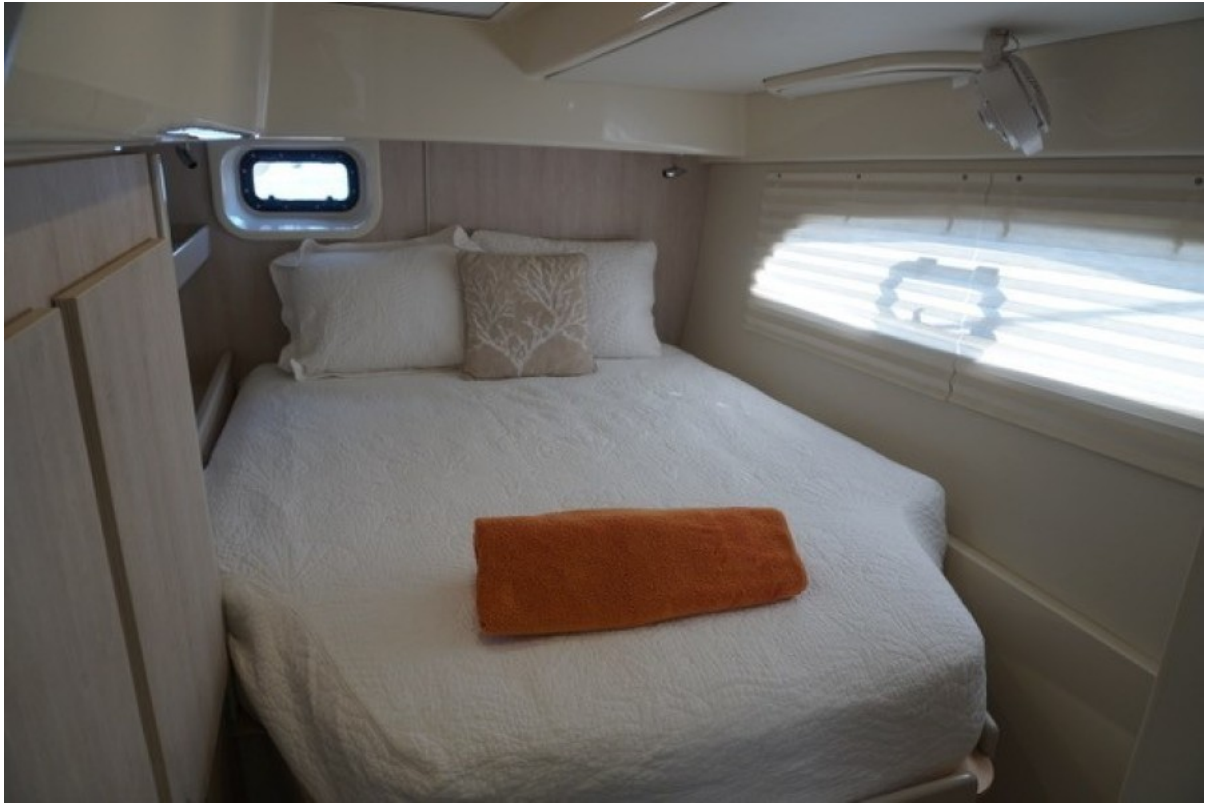
Forward Guest Stateroom