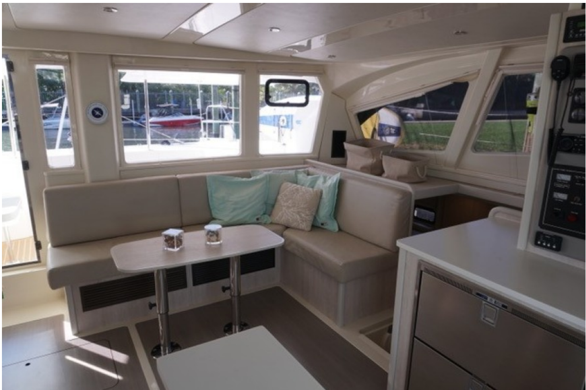
Salon Settee And Table