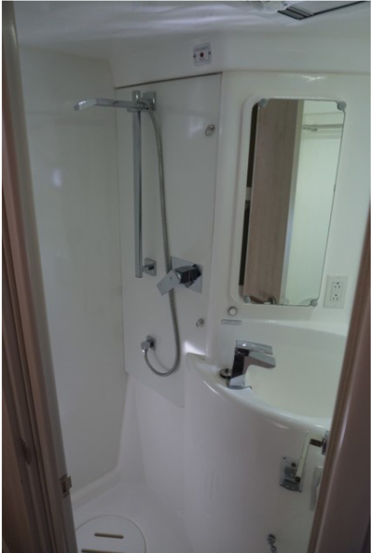
Guest Ensuite Head