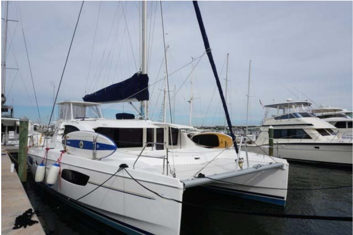
Starboard Bow Profile