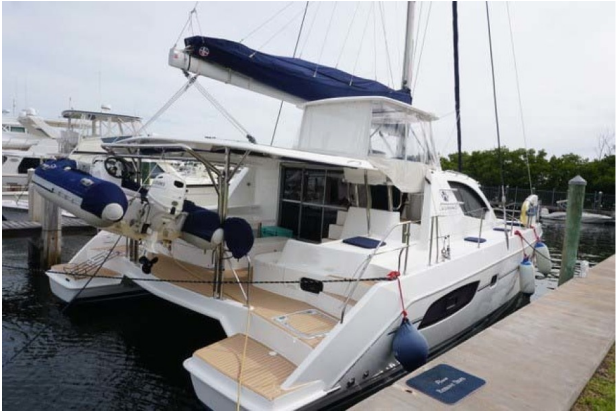
Stbd Stern, Dinghy & Davit