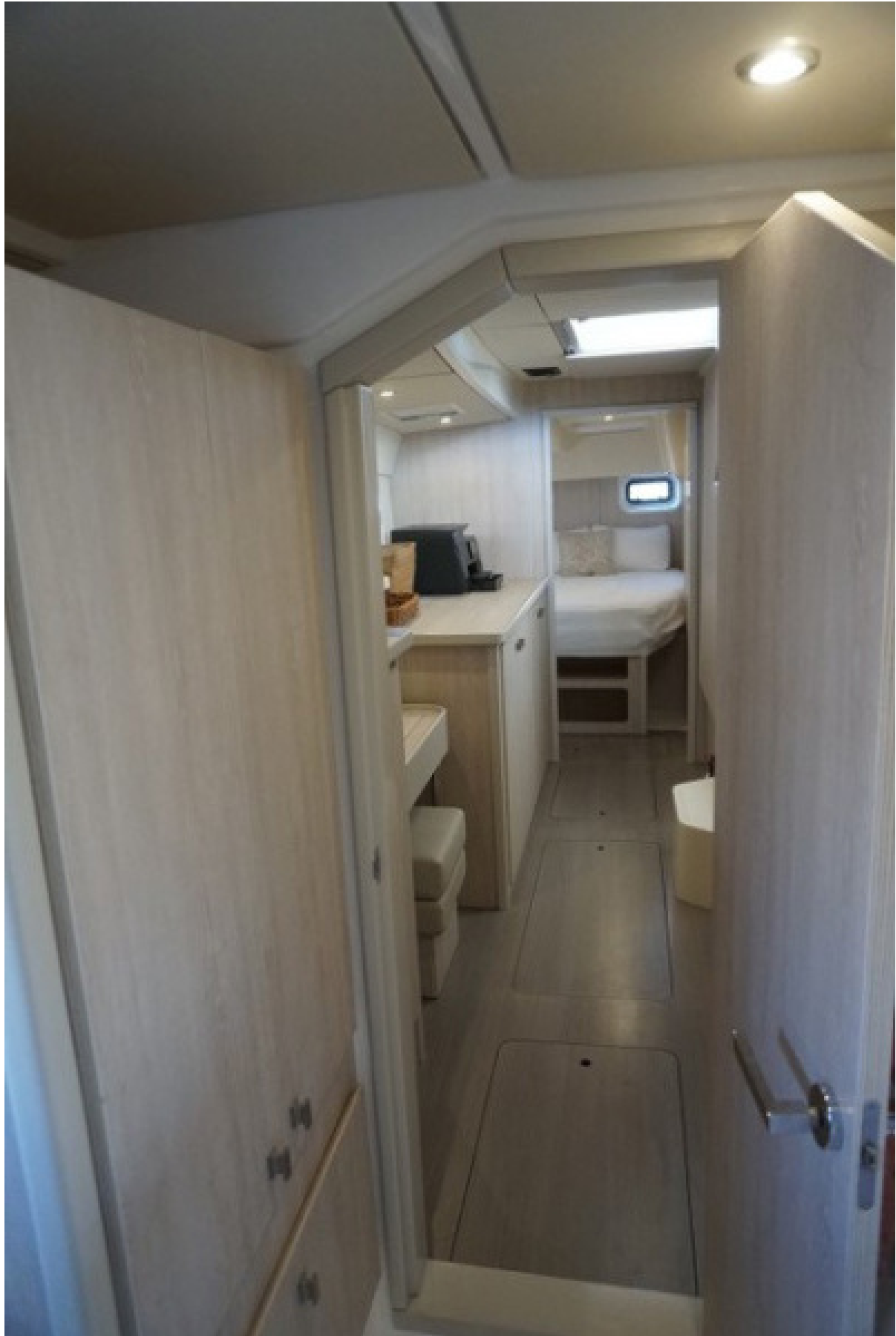
Master Suite From Head