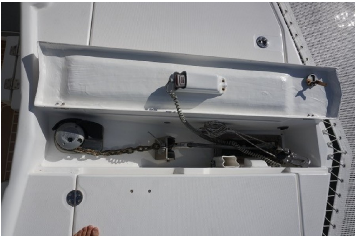
Windlass With Electronic Control