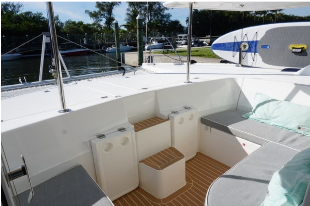
Forward Cockpit Seating