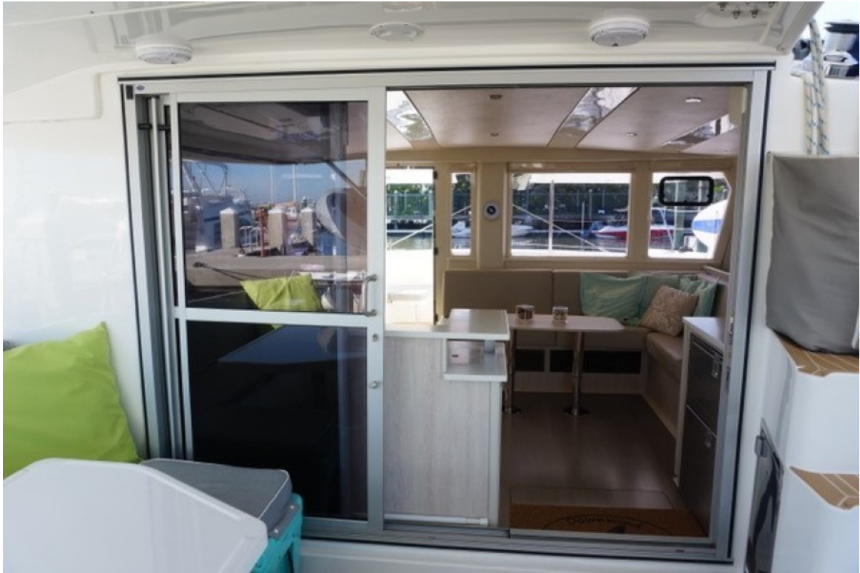
Cabin Interior Entrance