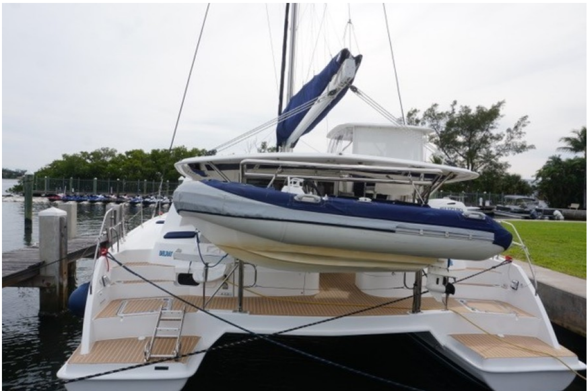
Stern View, Dinghy