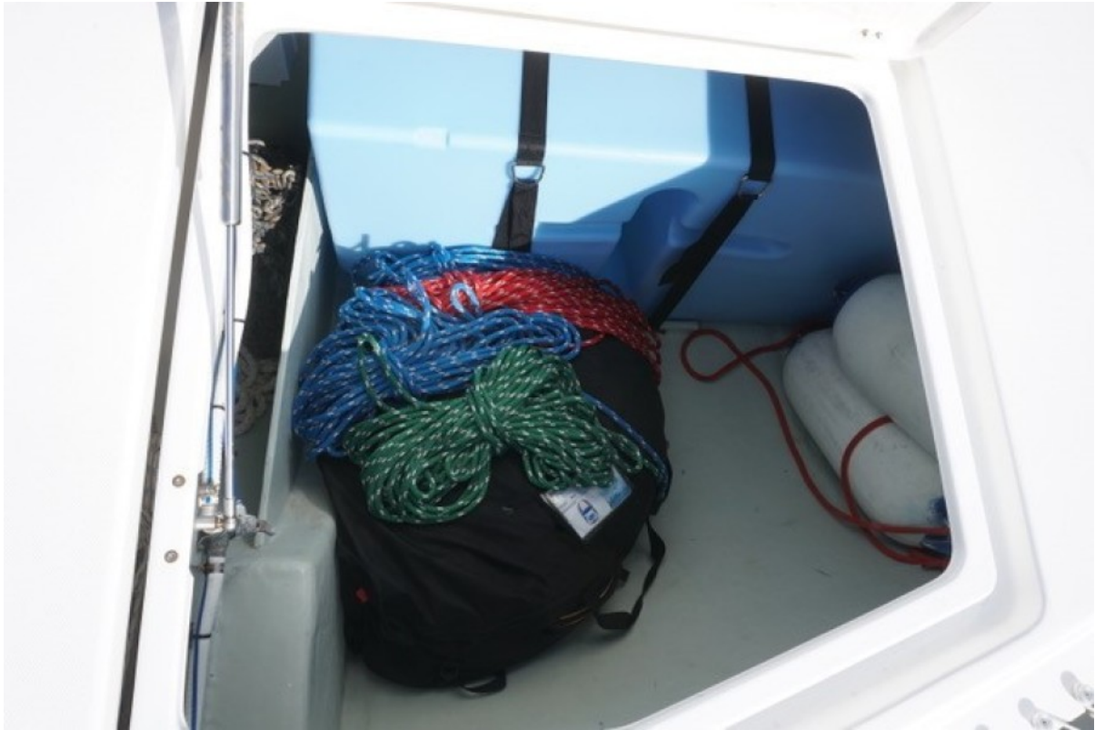
Bow Storage Compartment