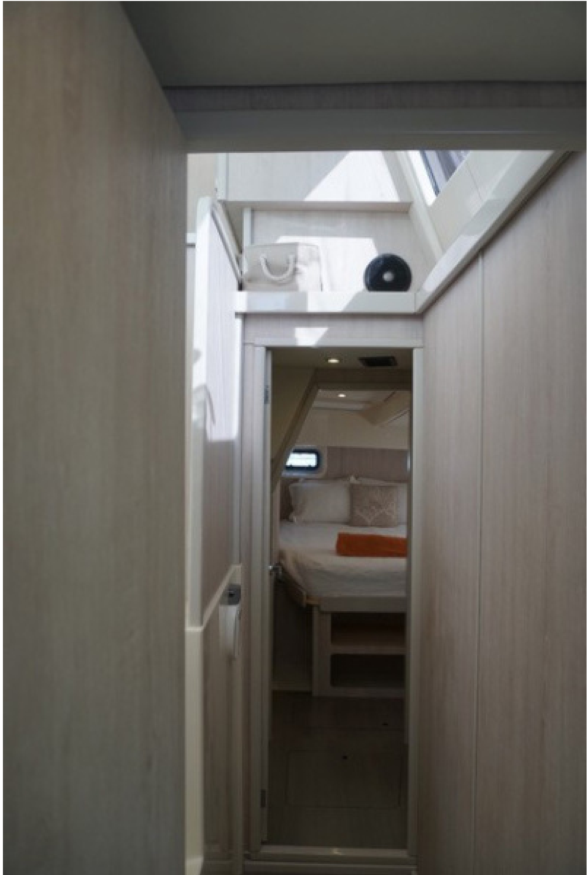
Guest Suite From Companionway