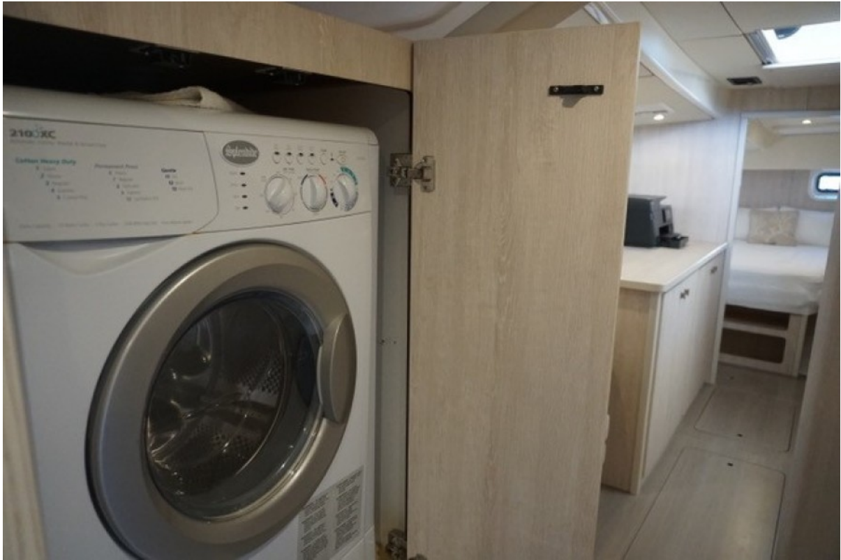
Laundry Cabinet Washer & Dryer