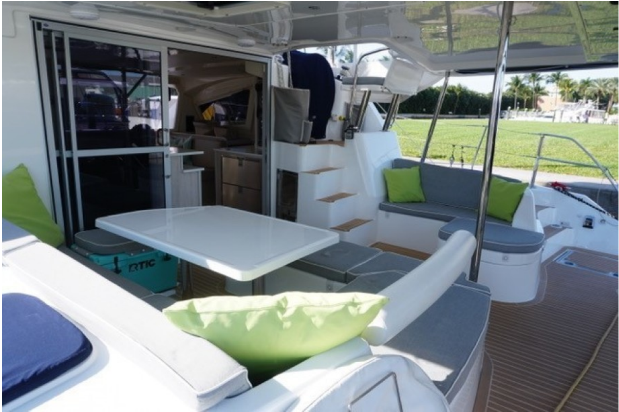
Aft Deck Cabin Entry, Steps To Helm