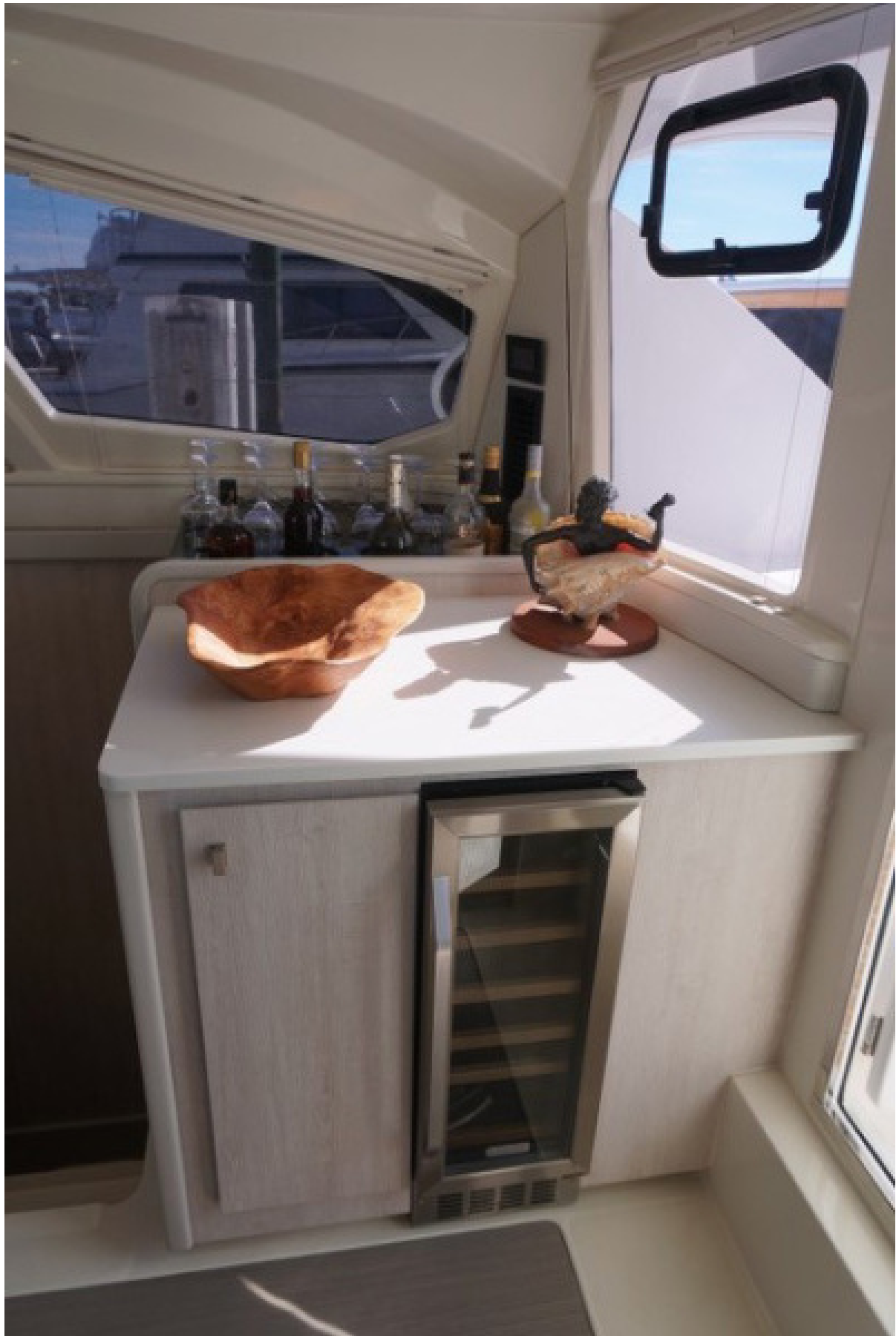
Salon Bar With Bottle Chiller