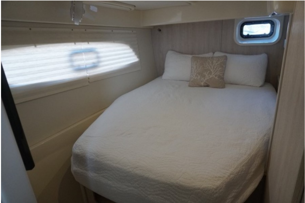
Master Stateroom Queen Berth