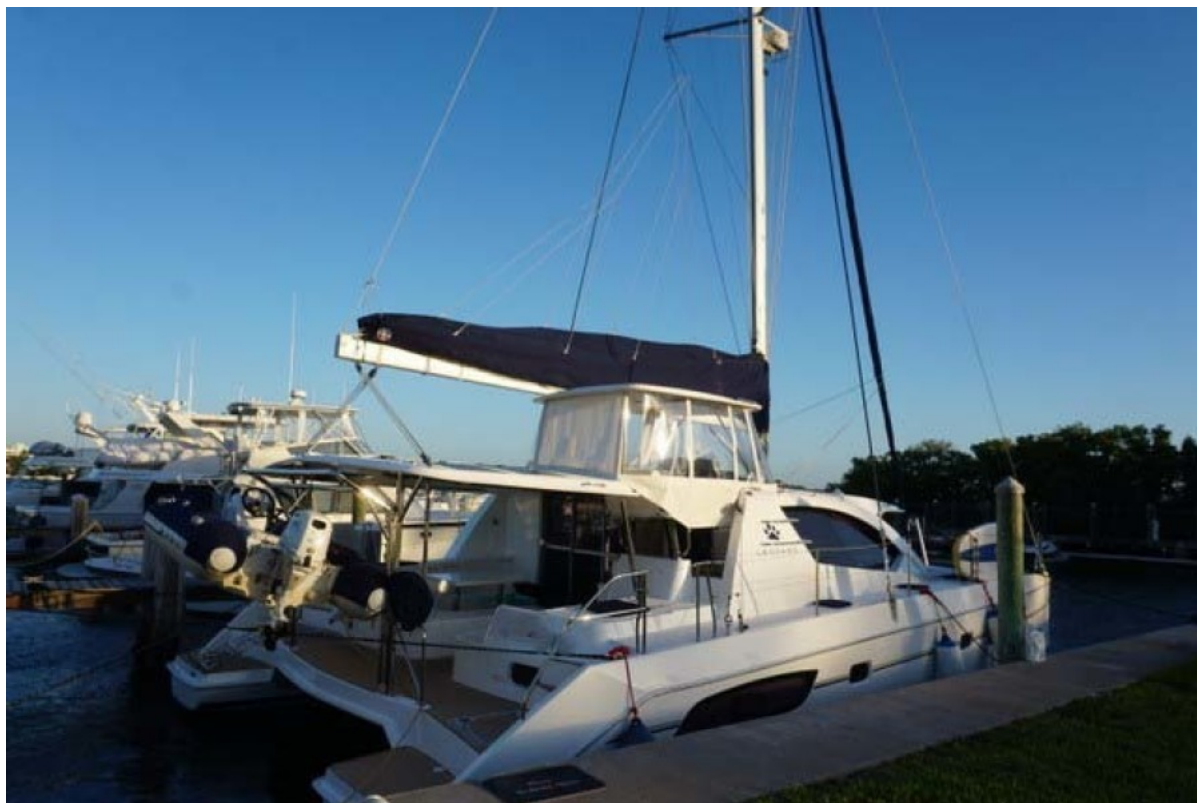
Starboard Aft Profile