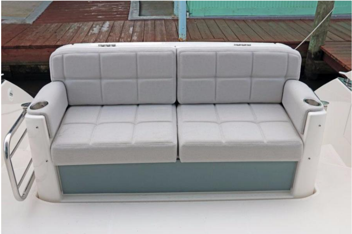
AFT DECK SEATING