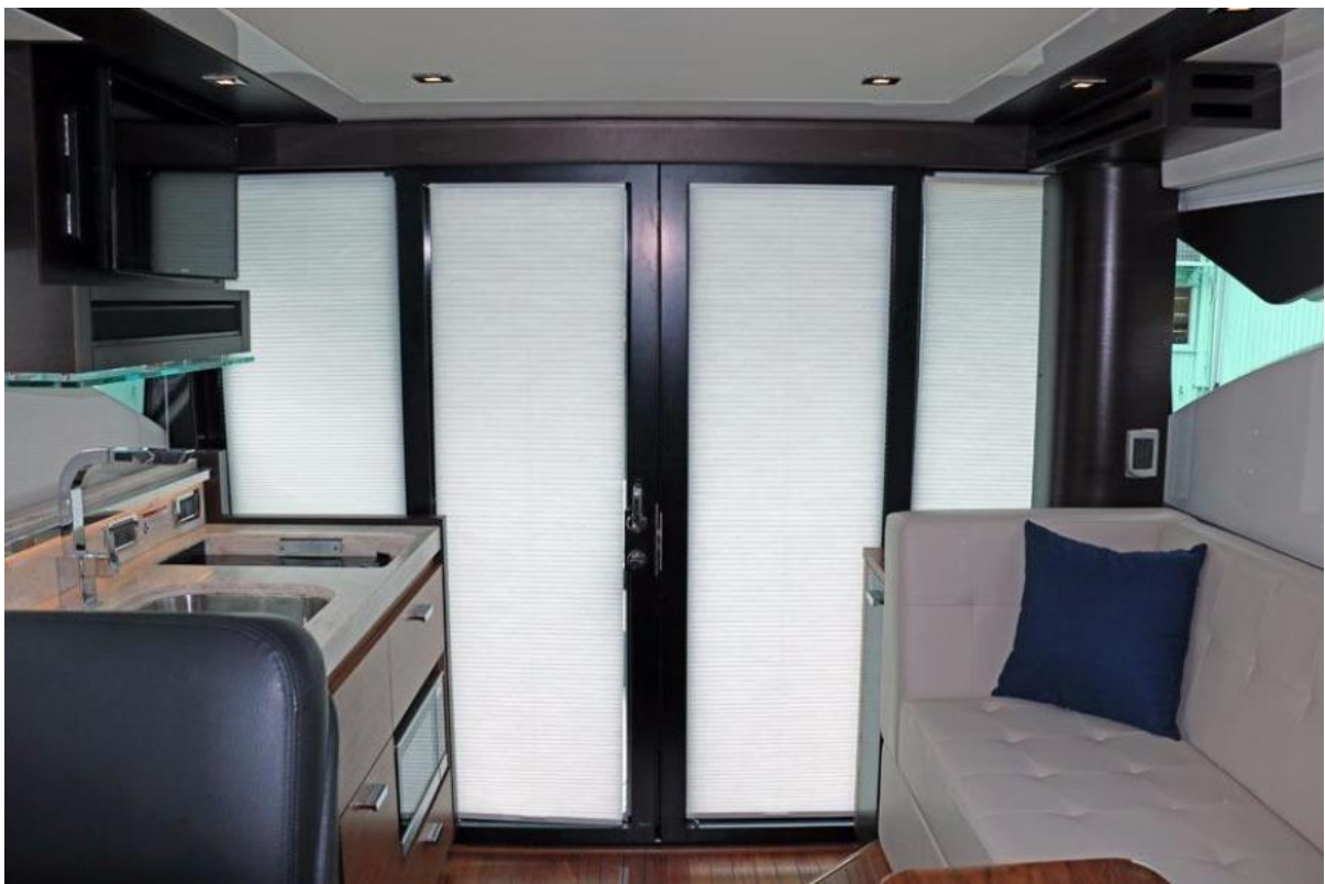
CENTRAL GALLEY SALON