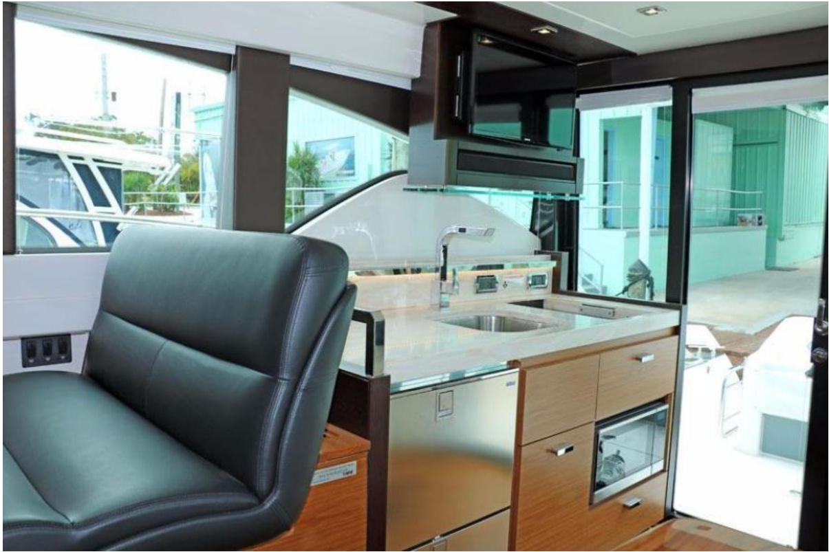
CENTRAL GALLEY HELM