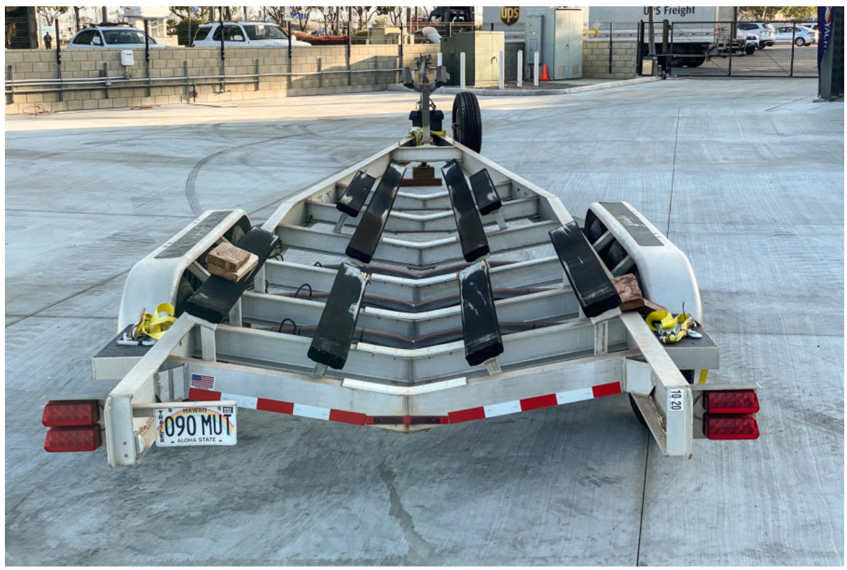
Trailer - three axle