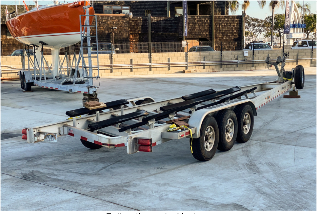
Trailer - three axle side view