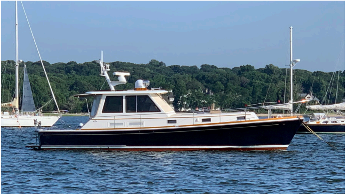
AVANTI 2005 Grand Banks Eastbay 43 HX