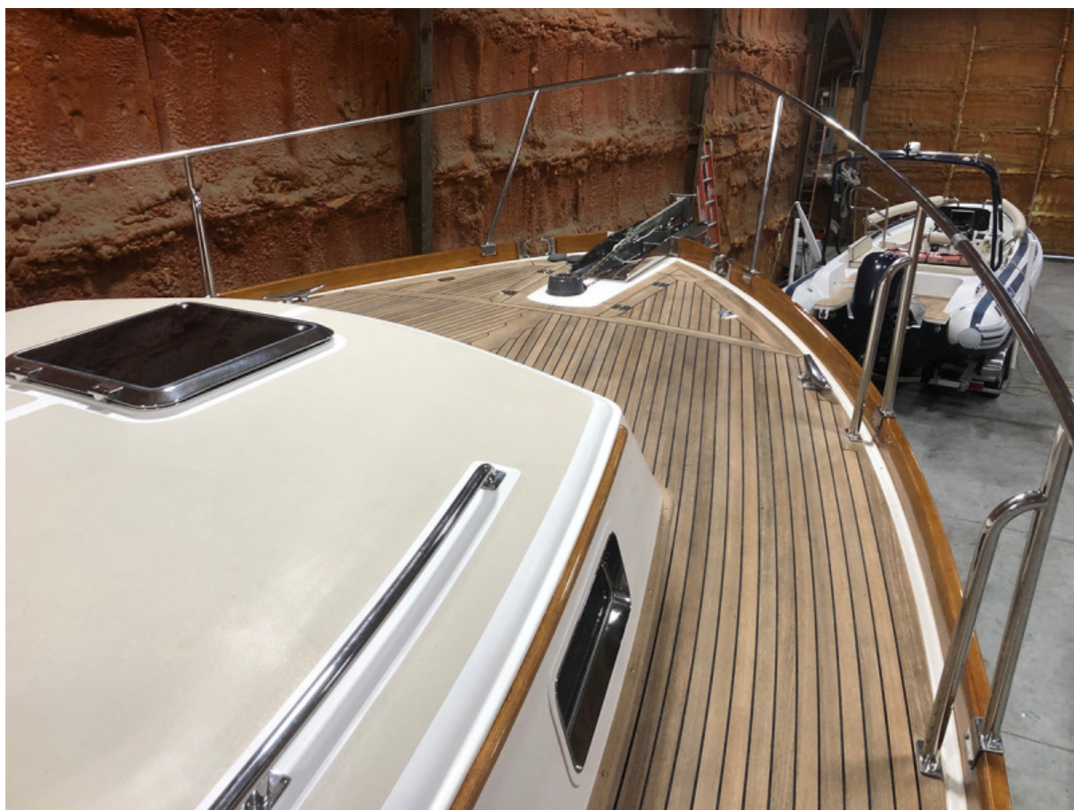
Near-Perfect Teak Decks