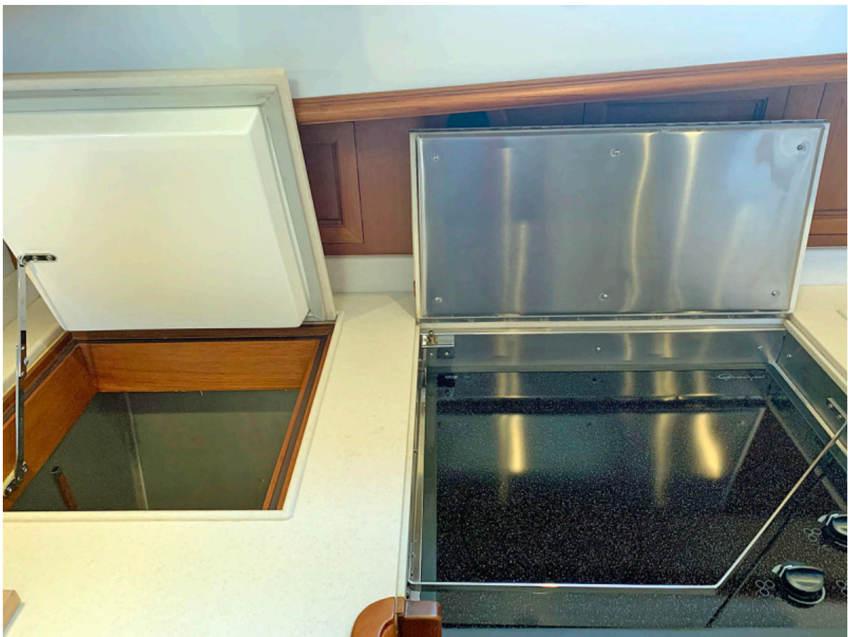
Galley Cold Locker and Stovetop