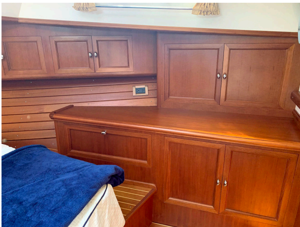
Owner's Stateroom Stbd