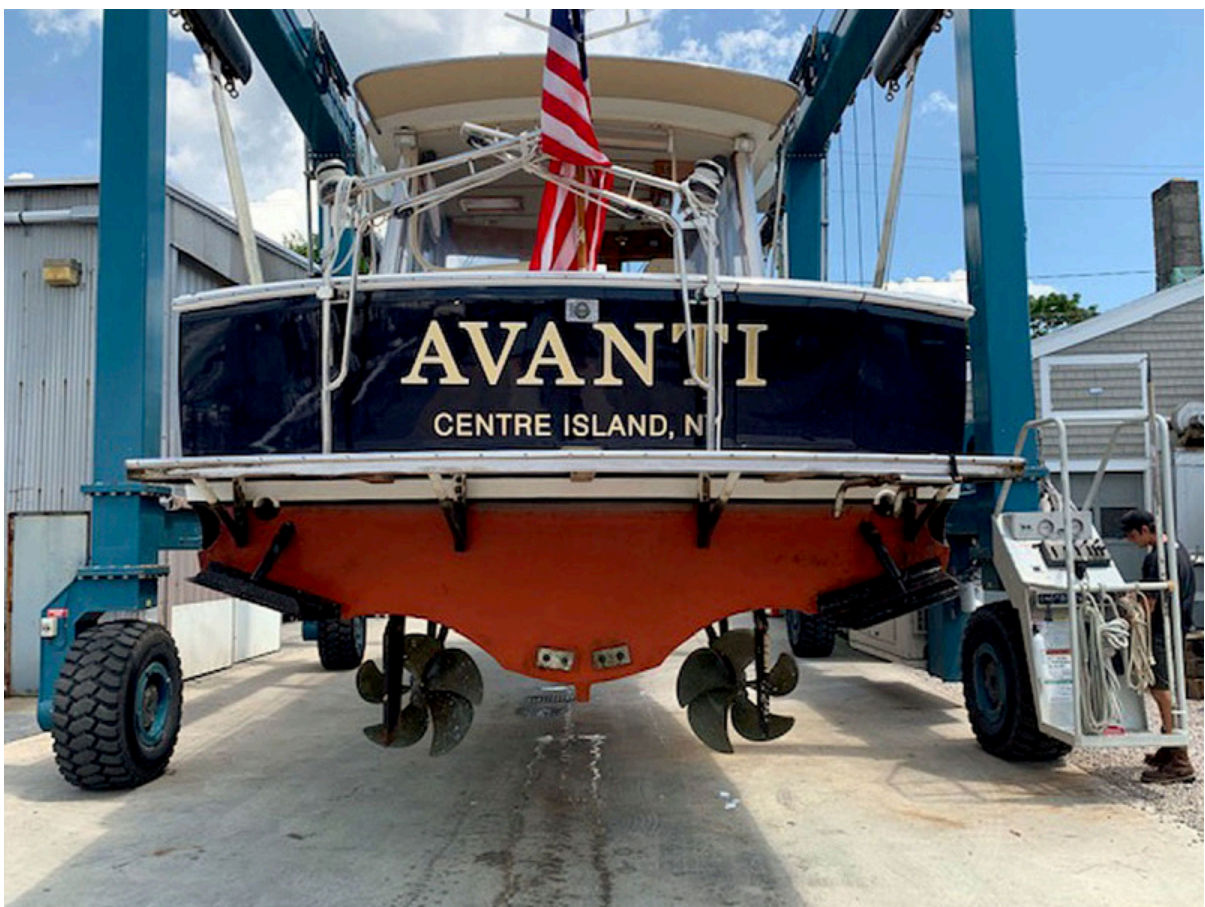
Transom, Prop Pockets, Davits