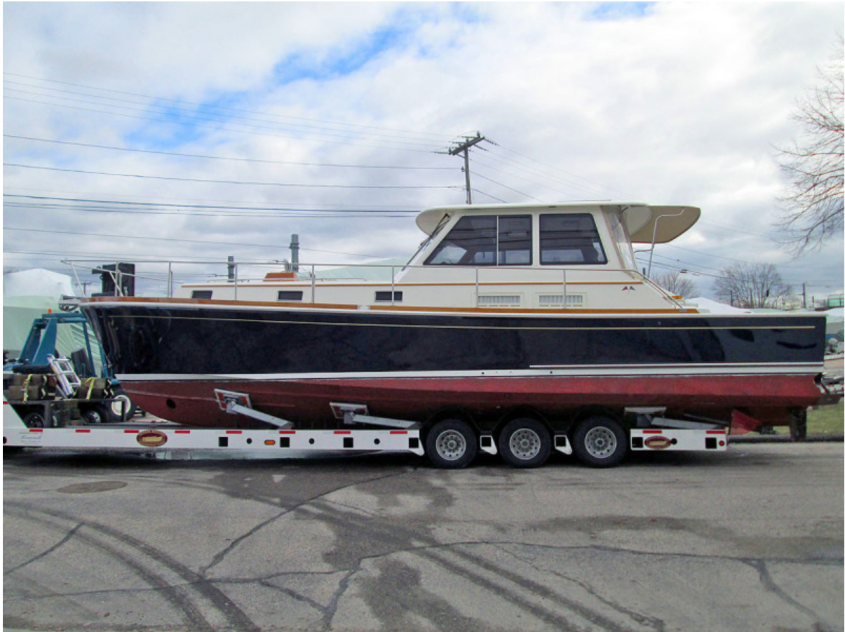
Recent Topsides Awlgrip