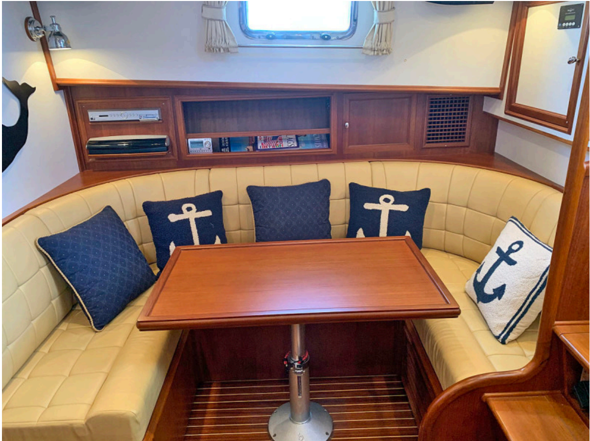
Salon Settee Stbd.