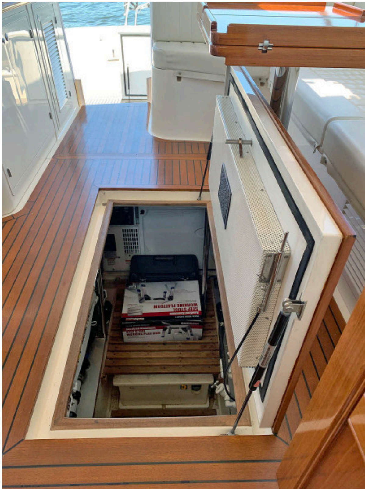
Access to Engine Room