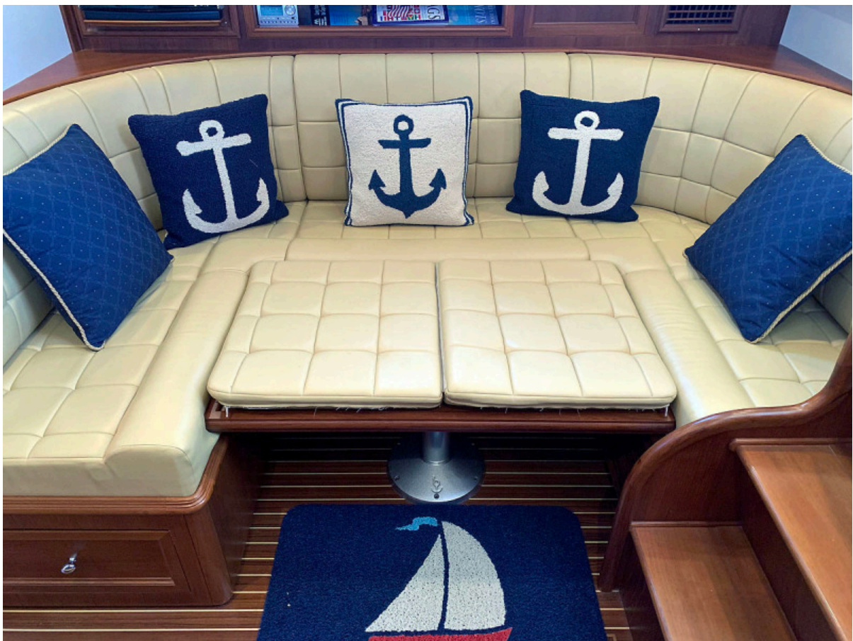
Settee Converts to Double Berth