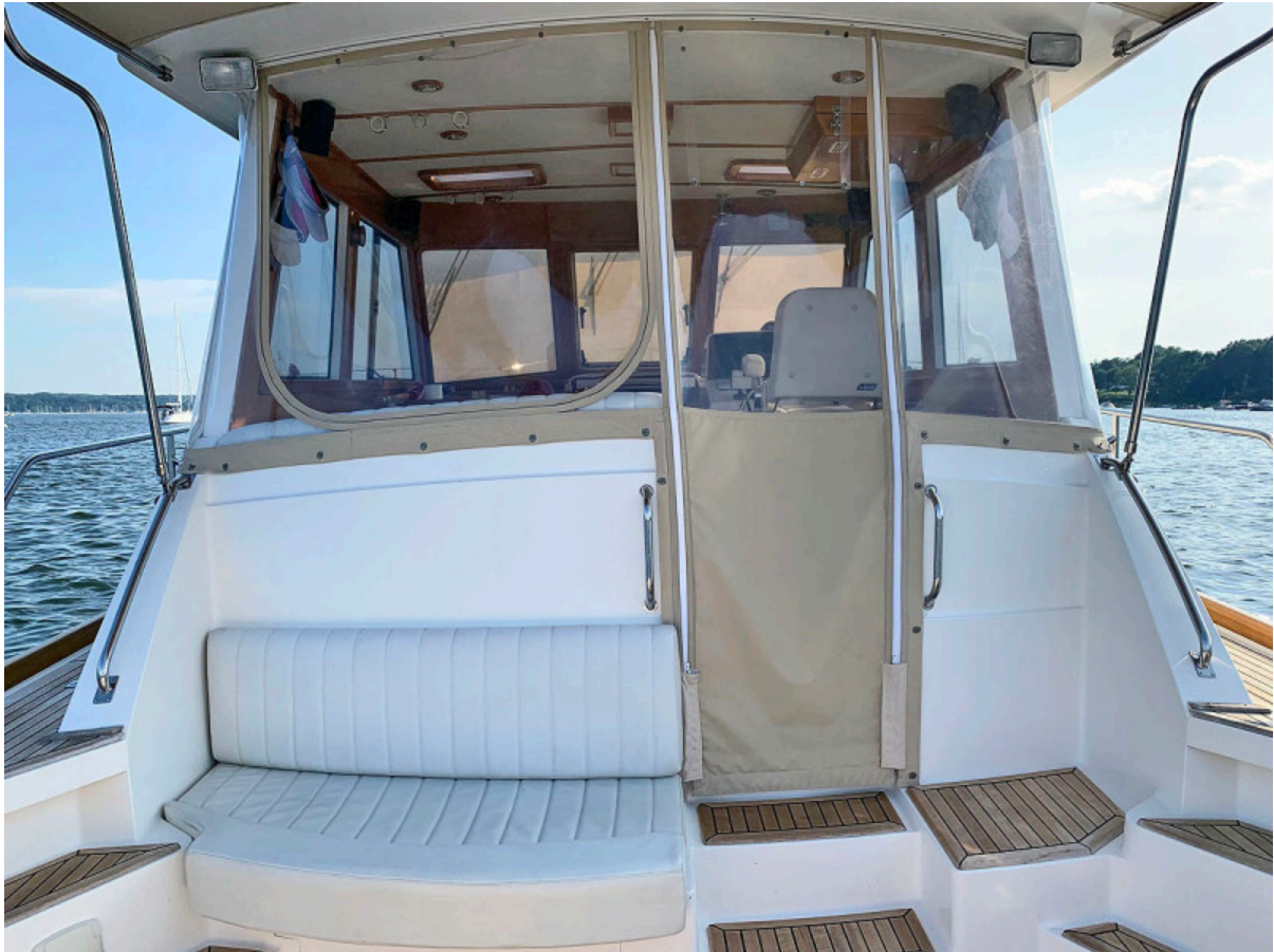
Protected Transition, Cockpit to Helmdeck