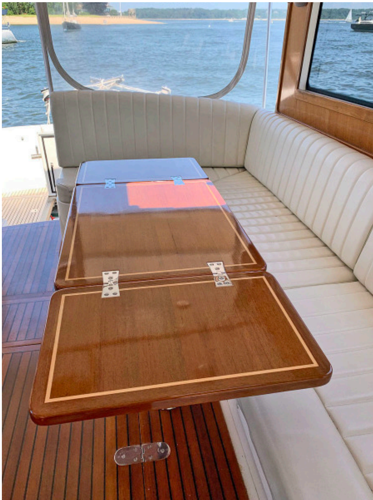
Helmdeck Table Extended