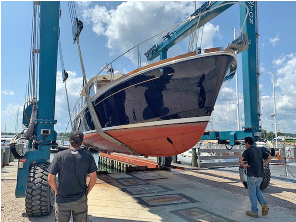
In the Slings