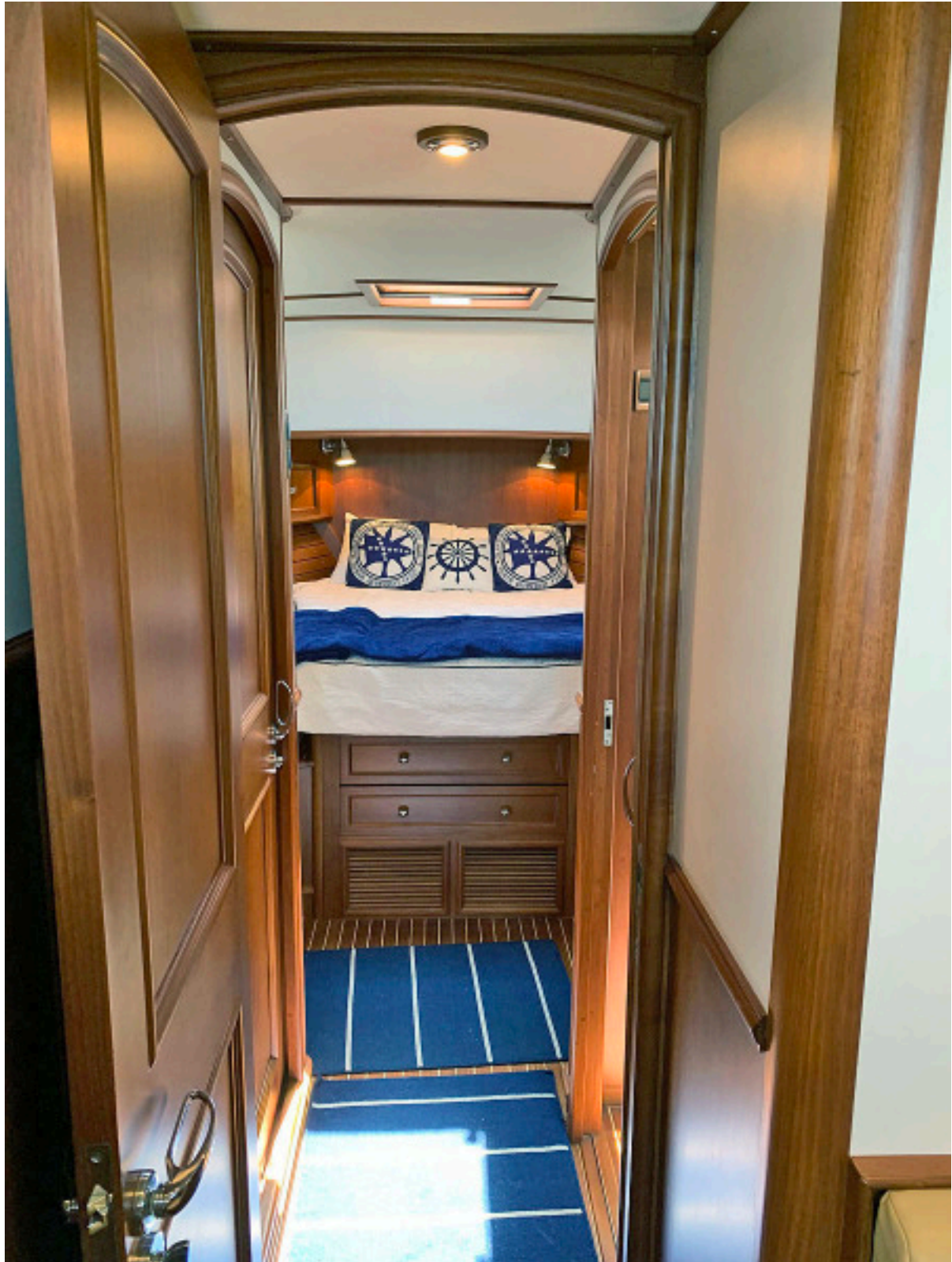
Passageway Fwd. to Stateroom