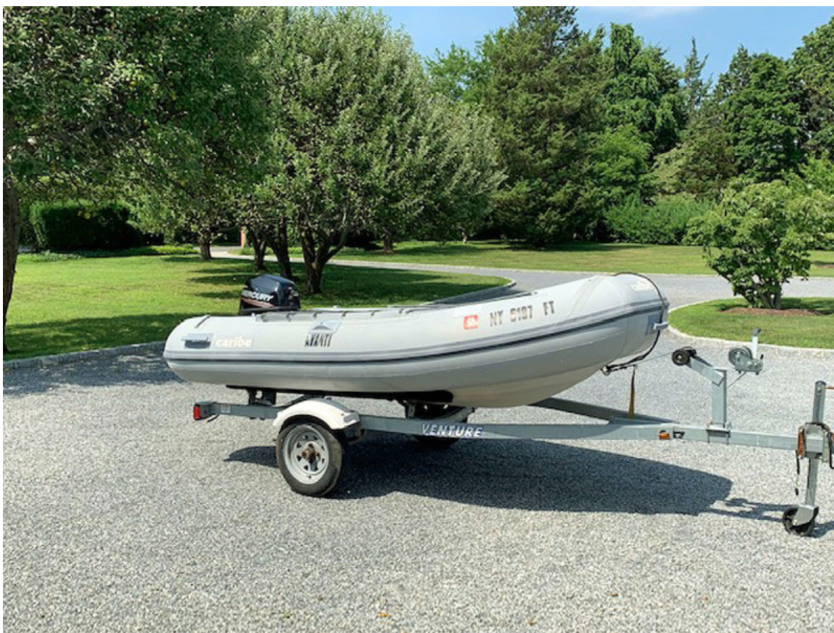
Dinghy Trailer and Outboard