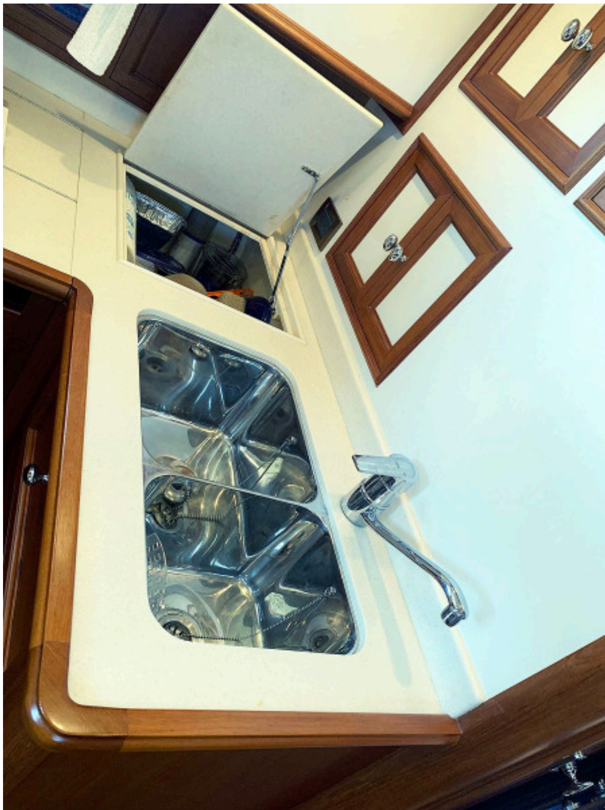
Galley Sinks and Storage