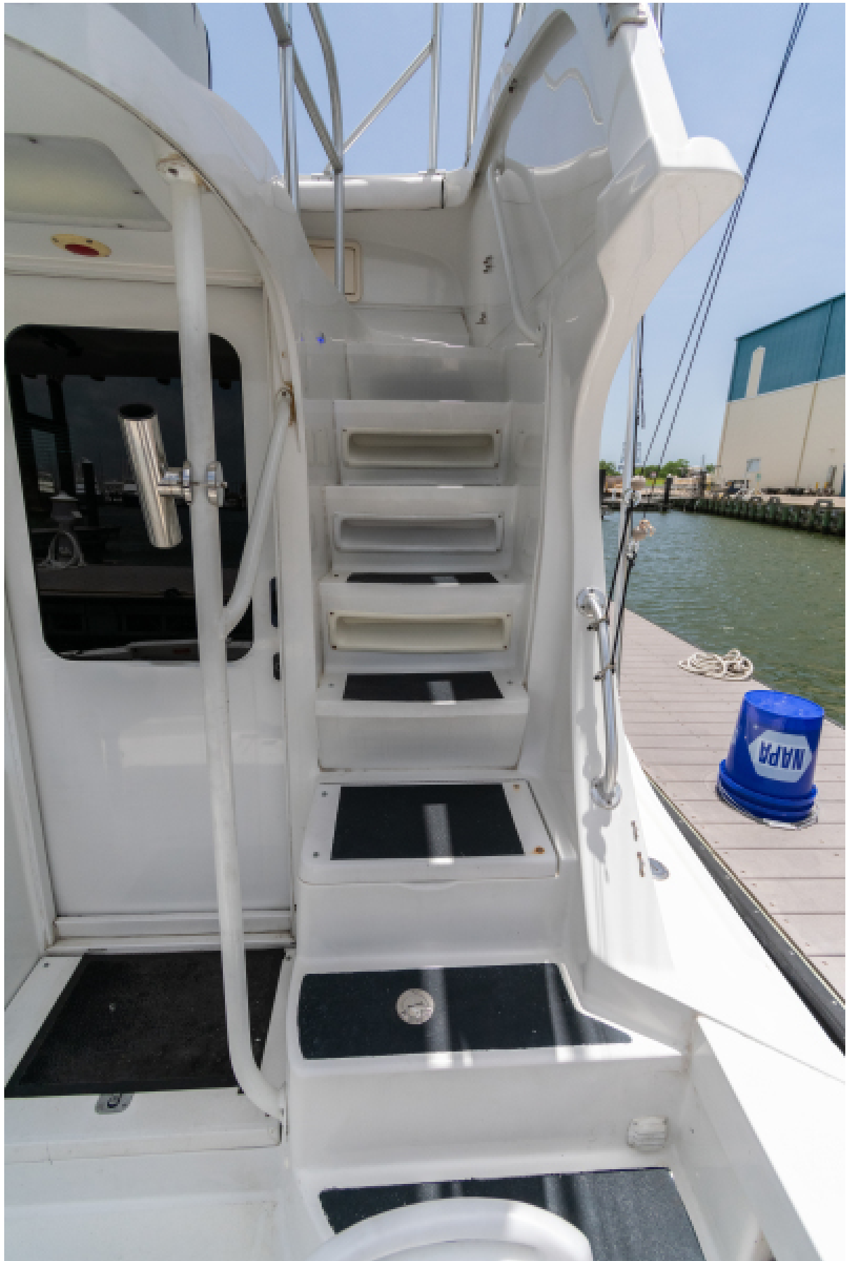
Luhrs 32 Convertible 2001 Ready or Knot