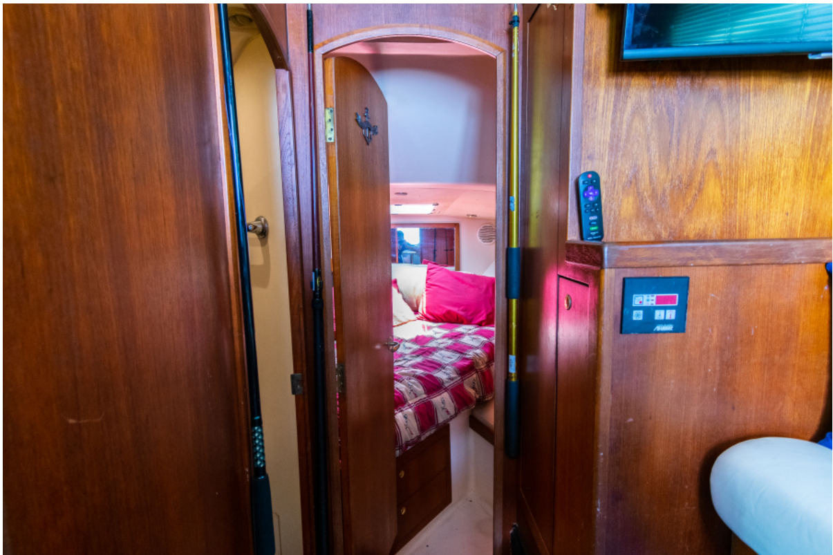
Luhrs 32 Convertible 2001 Ready or Knot