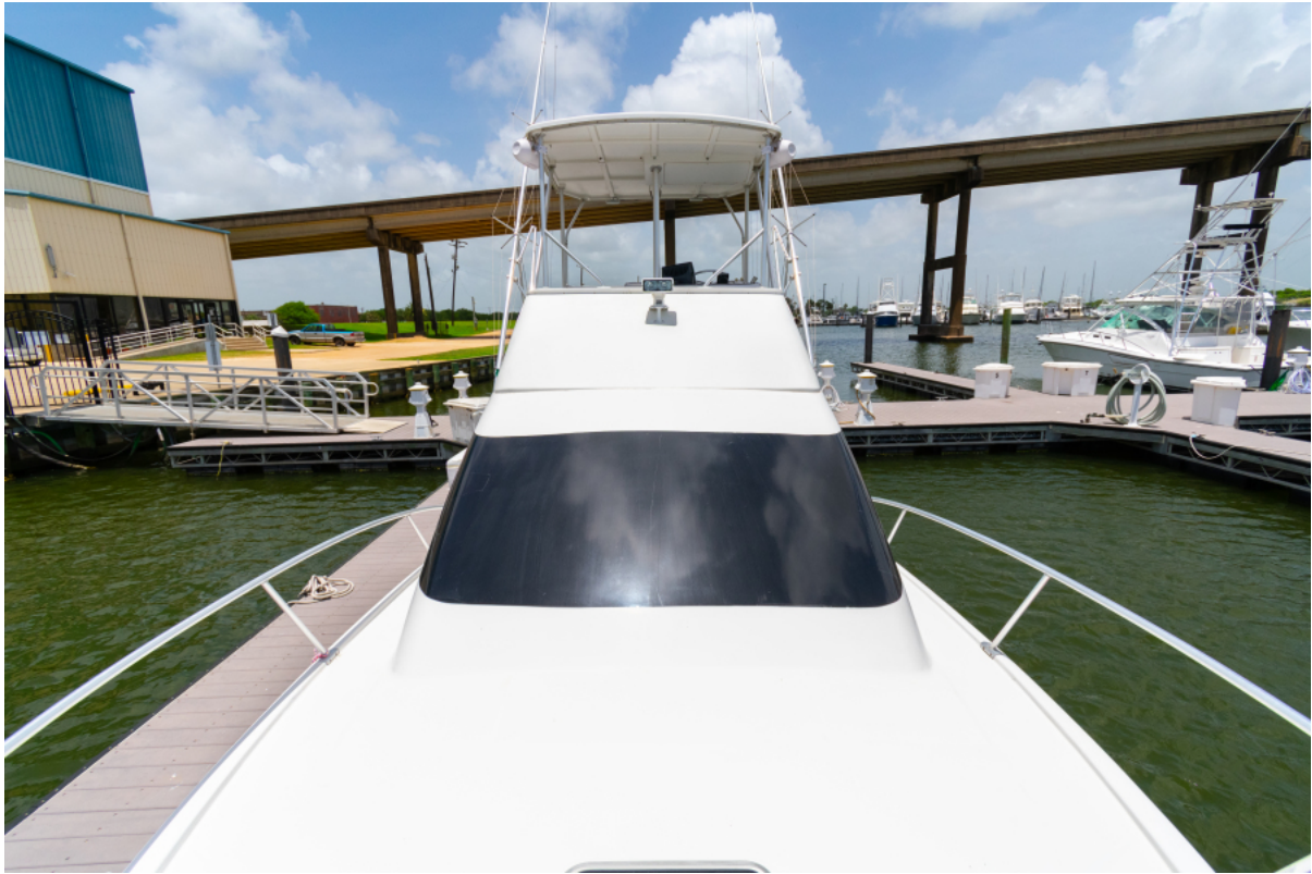
Luhrs 32 Convertible 2001 Ready or Knot