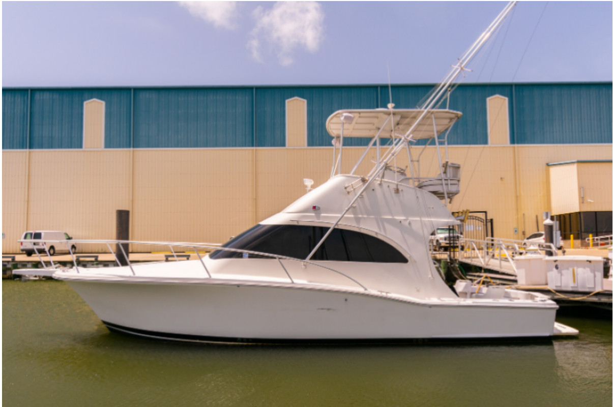
Luhrs 32 Convertible 2001 Ready or Knot