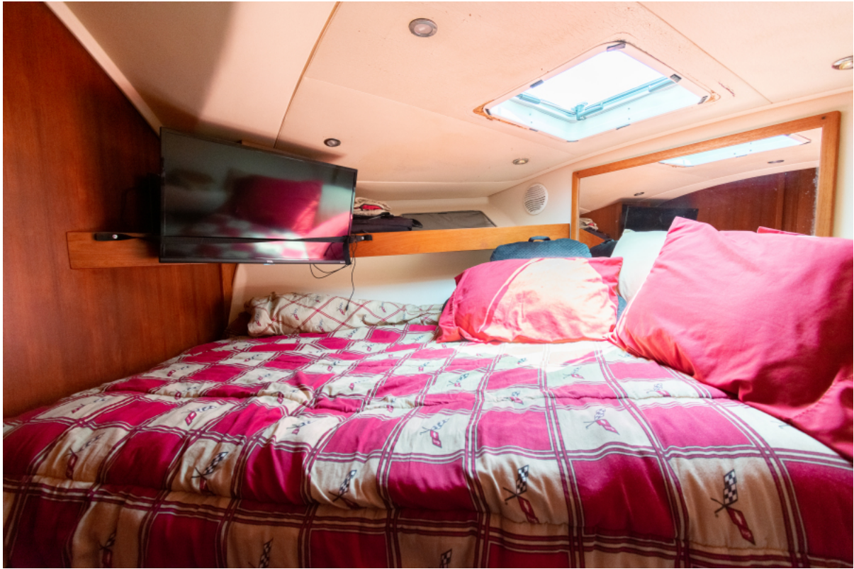
Luhrs 32 Convertible 2001 Ready or Knot