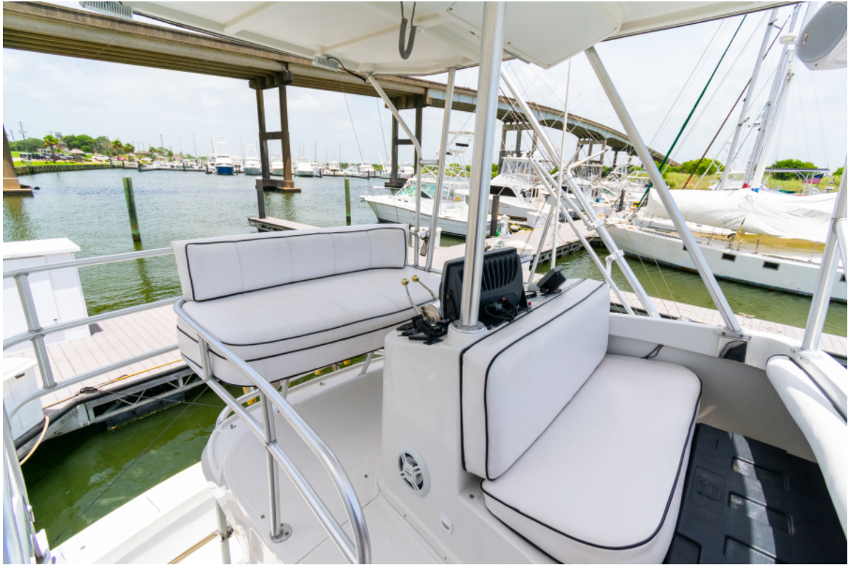
Luhrs 32 Convertible 2001 Ready or Knot