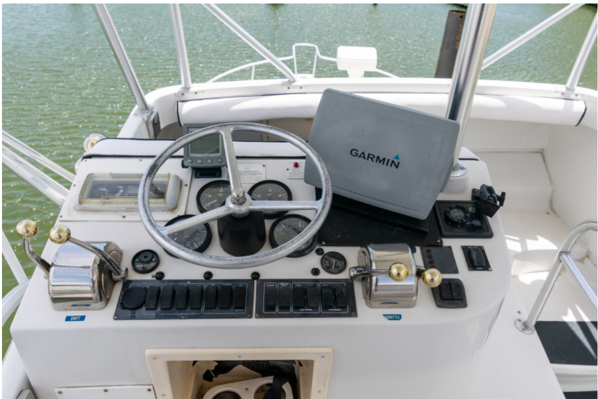
Luhrs 32 Convertible 2001 Ready or Knot