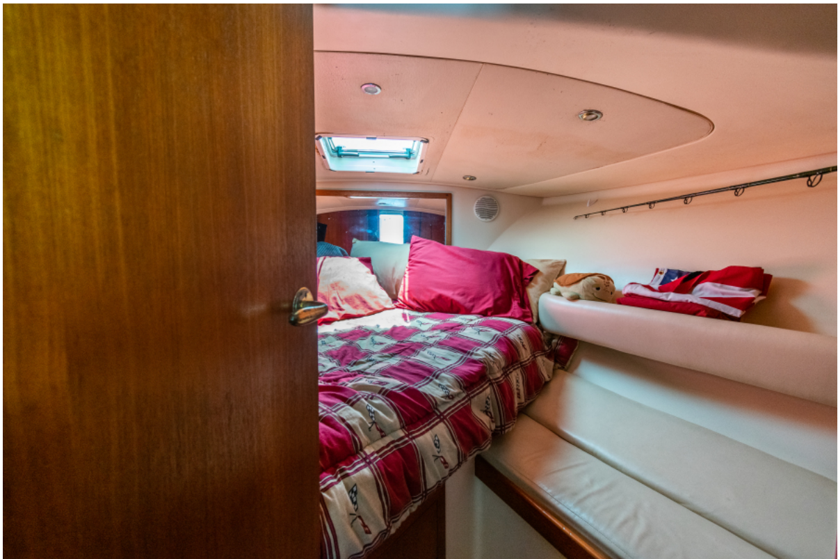
Luhrs 32 Convertible 2001 Ready or Knot