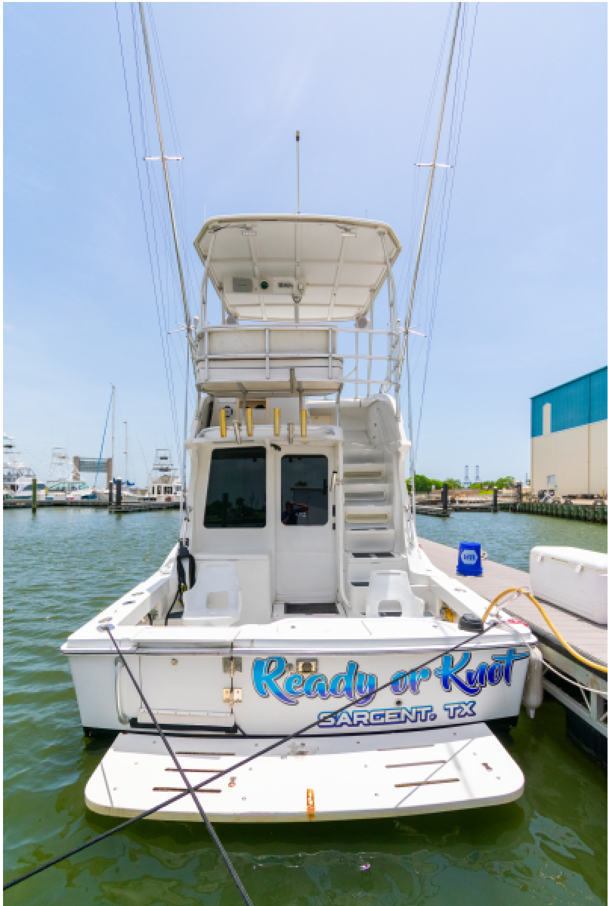
Luhrs 32 Convertible 2001 Ready or Knot