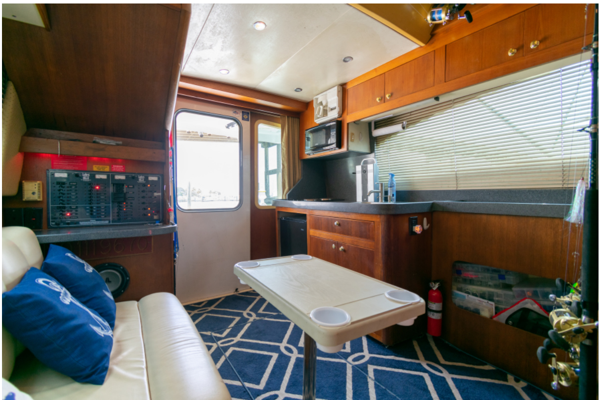
Luhrs 32 Convertible 2001 Ready or Knot