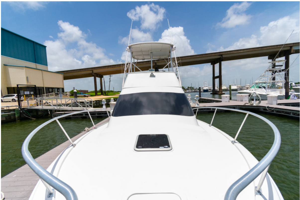
Luhrs 32 Convertible 2001 Ready or Knot