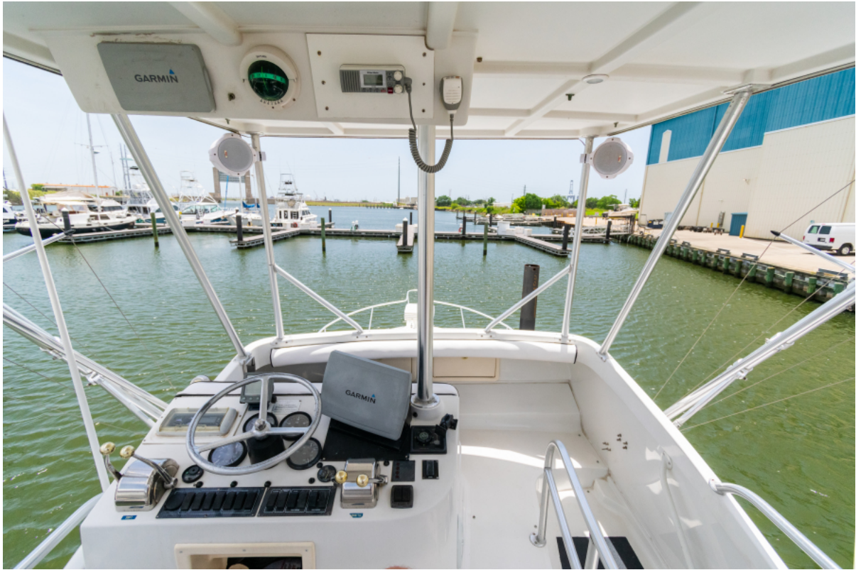
Luhrs 32 Convertible 2001 Ready or Knot