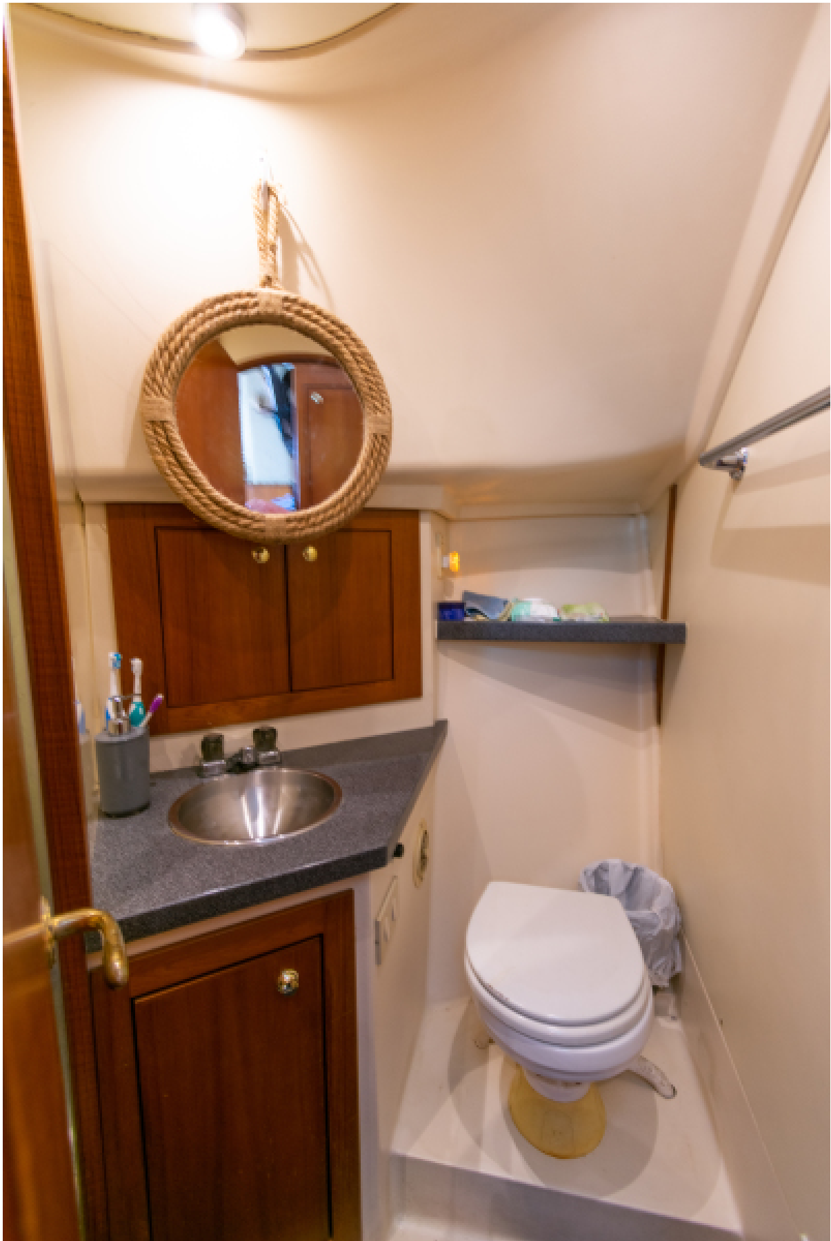
Luhrs 32 Convertible 2001 Ready or Knot