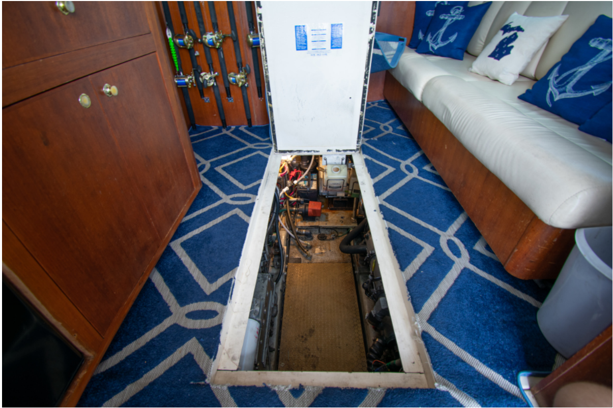
Luhrs 32 Convertible 2001 Ready or Knot