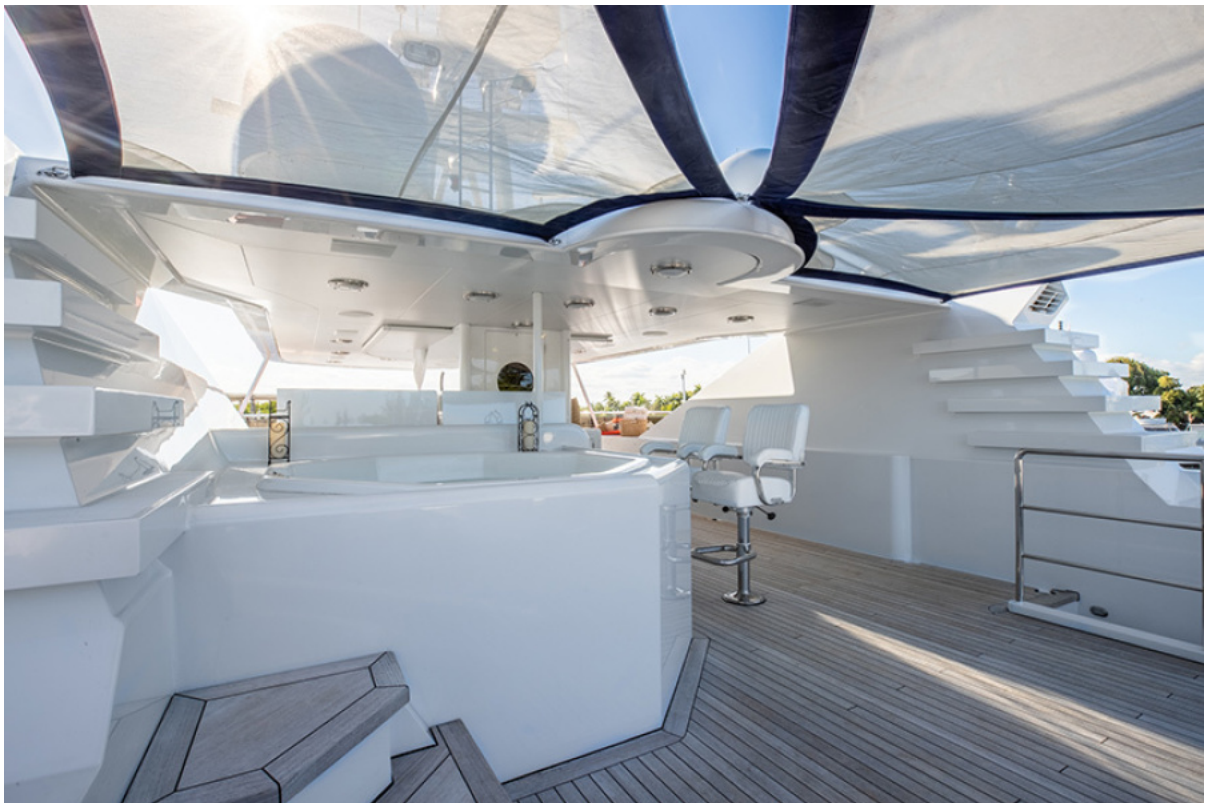
Flybridge Jacuzzi and Bar