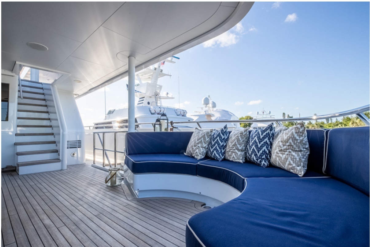
Bridge Deck Seating