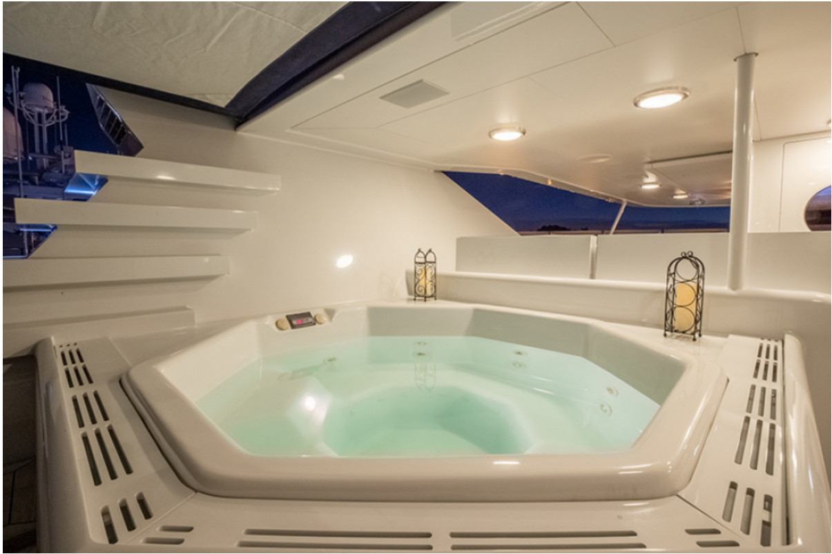
Jacuzzi at Night