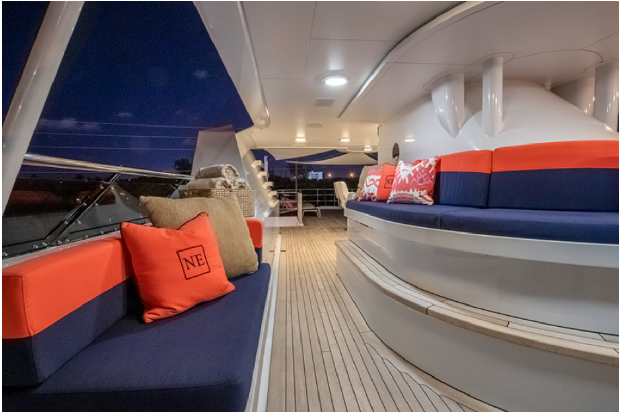
Forward Sundeck Seating