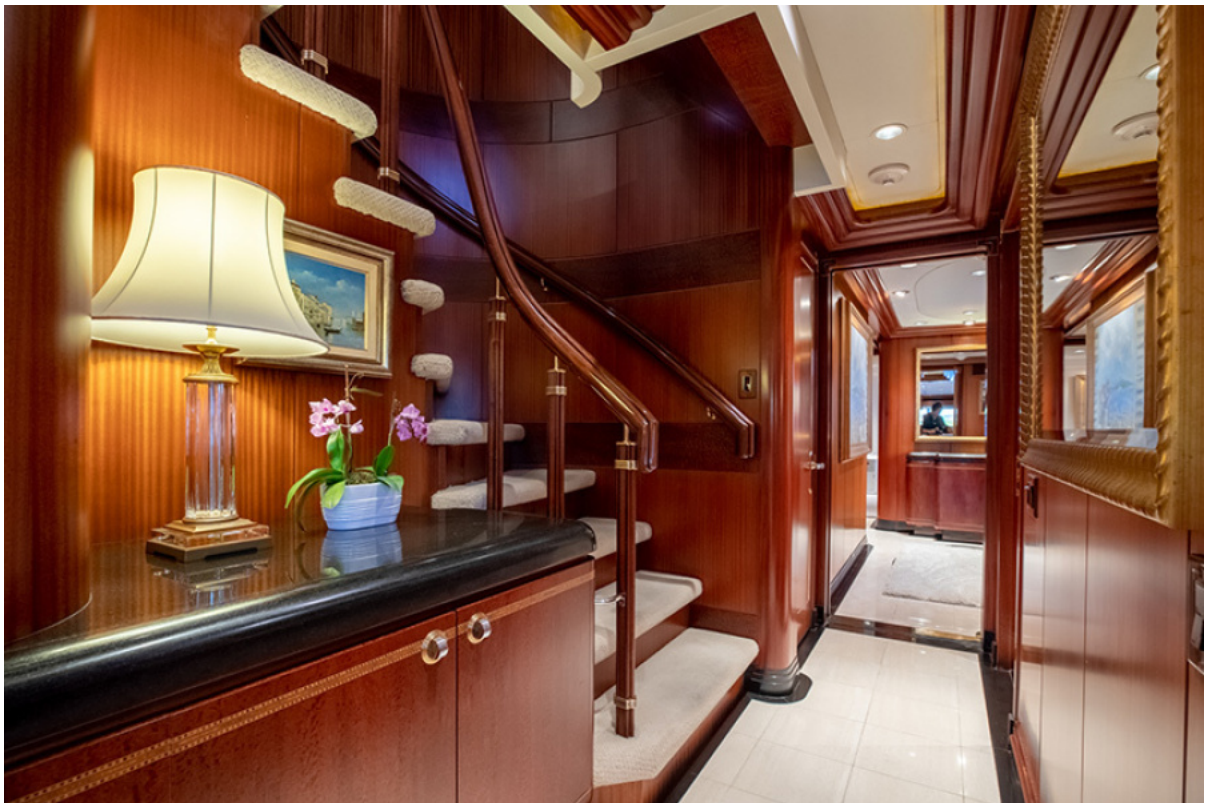
Stairway to Upper Deck