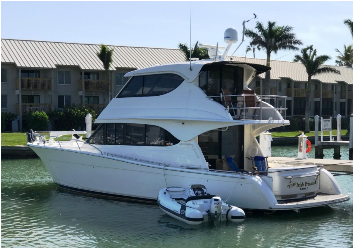
Irish Princess Port Side