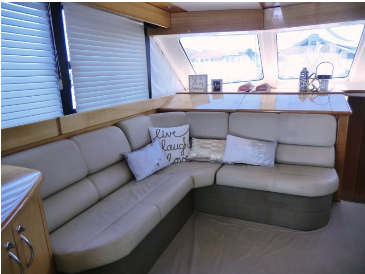
Salon Port Settee