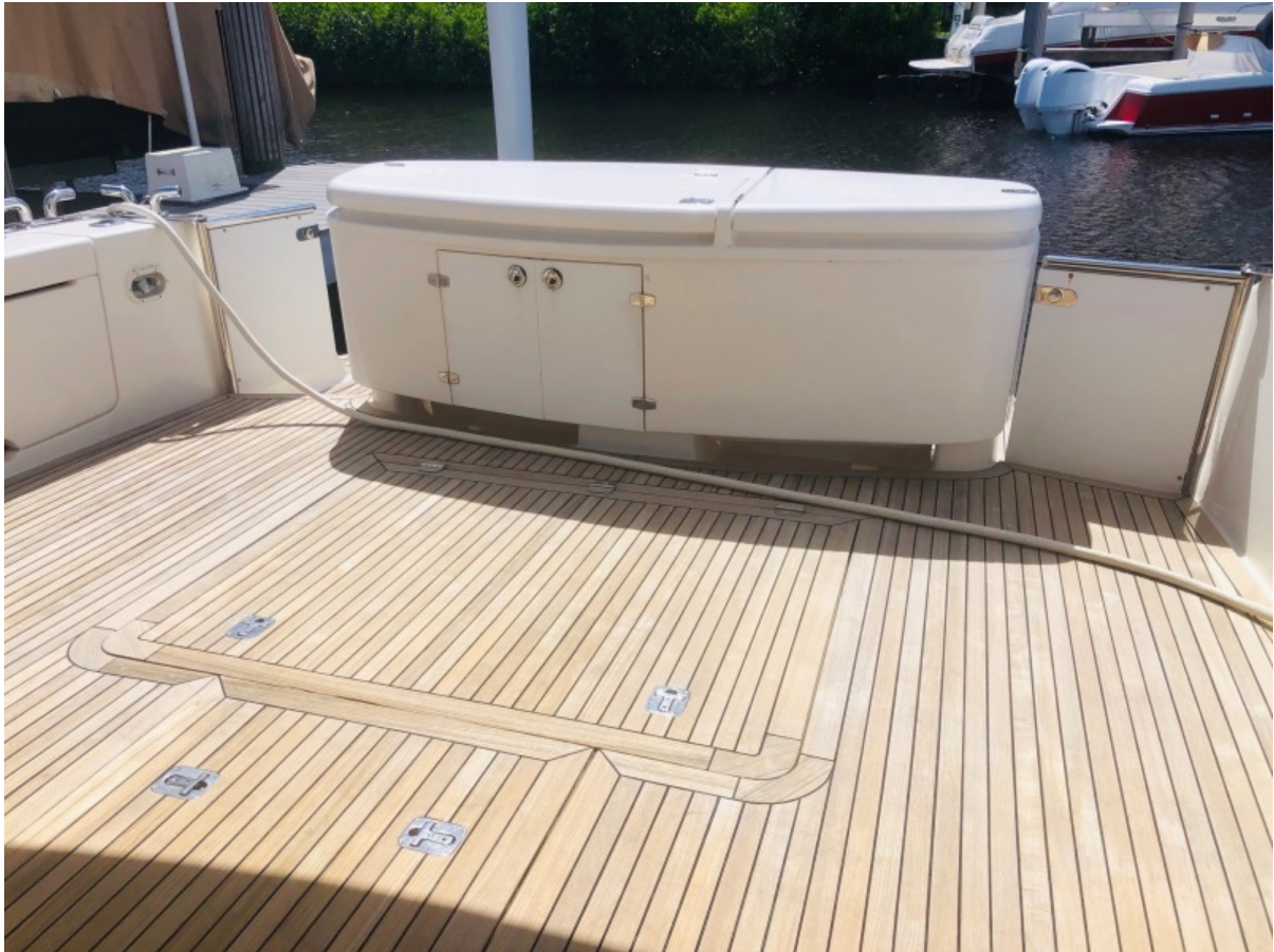
Upper Teak Deck