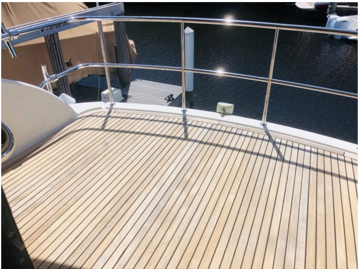
Upper Teak Deck