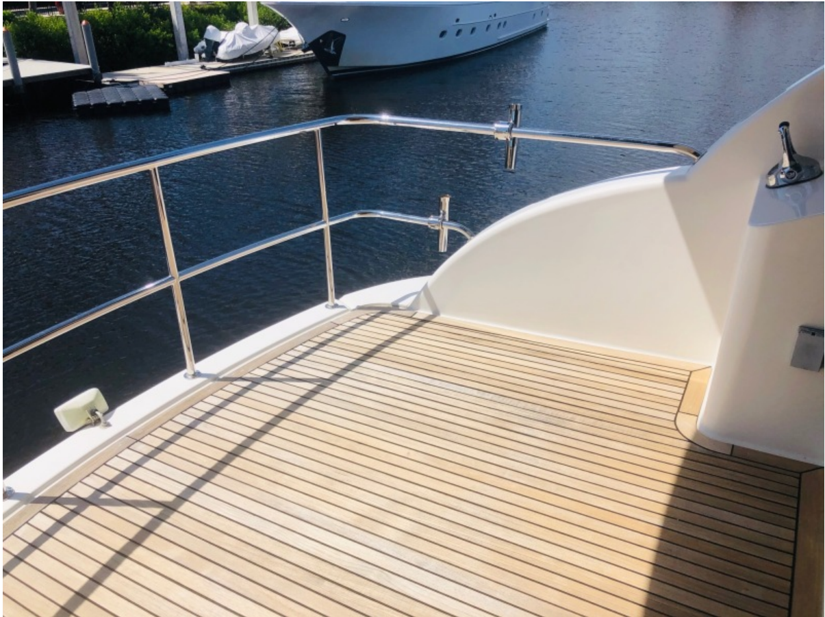
Upper Teak Deck