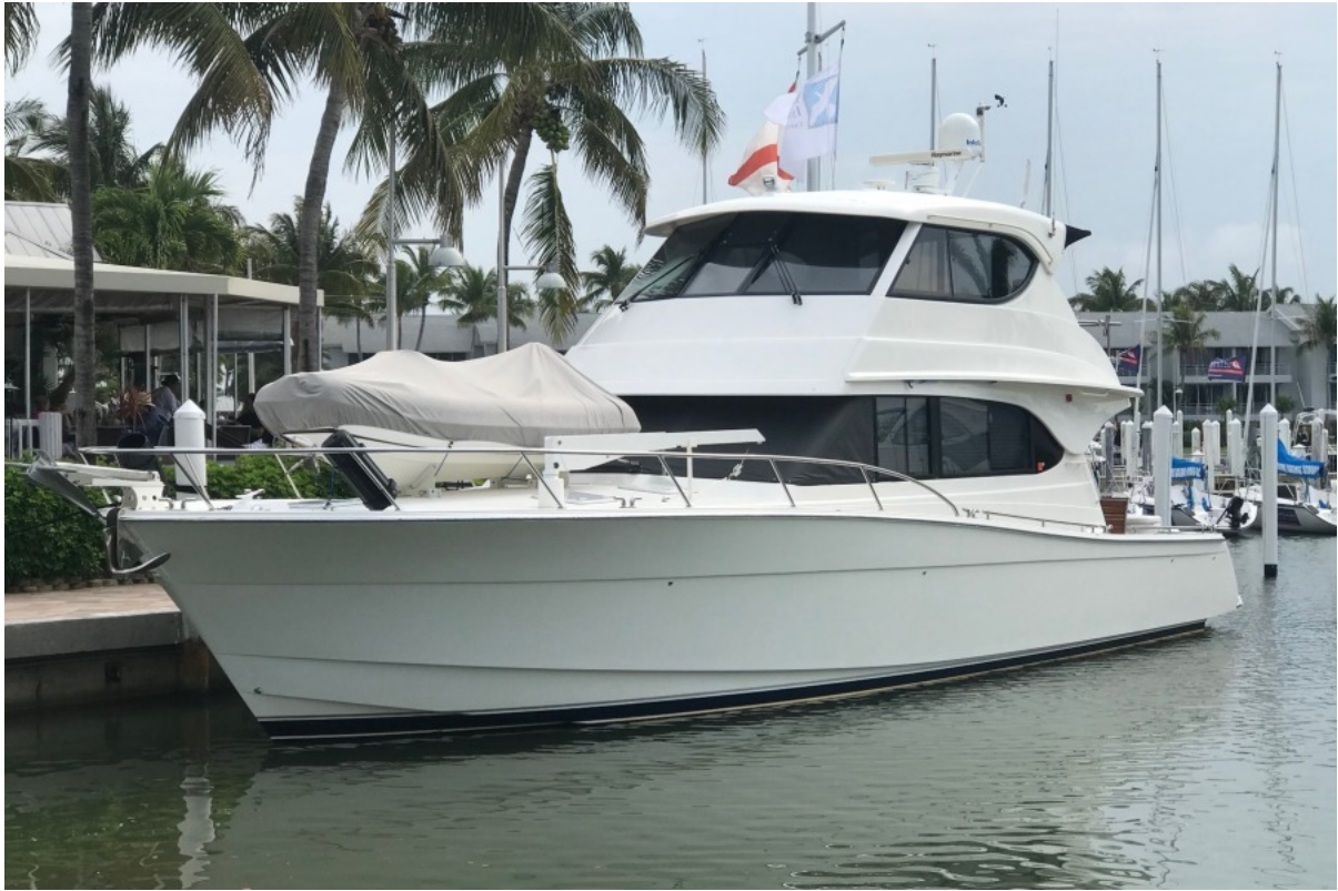
IRISH PRINCESS Profile