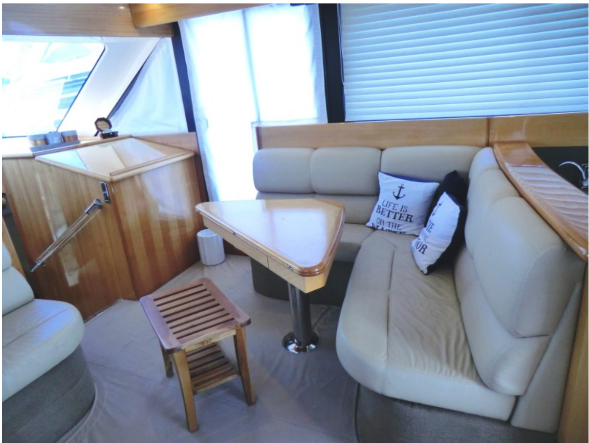
Salon Stb Settee