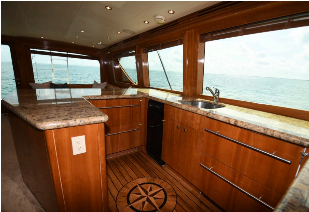
65 Hatteras Convertible Galley