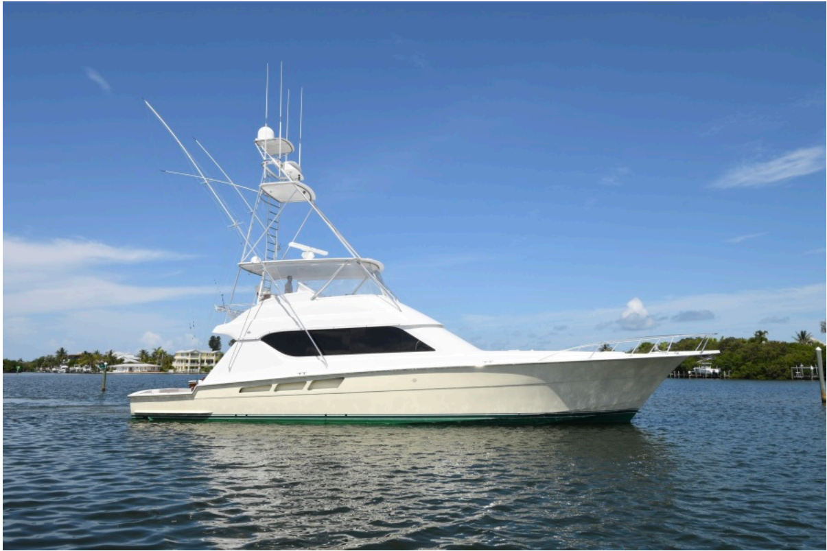
2003 Hatteras 65 Convertible