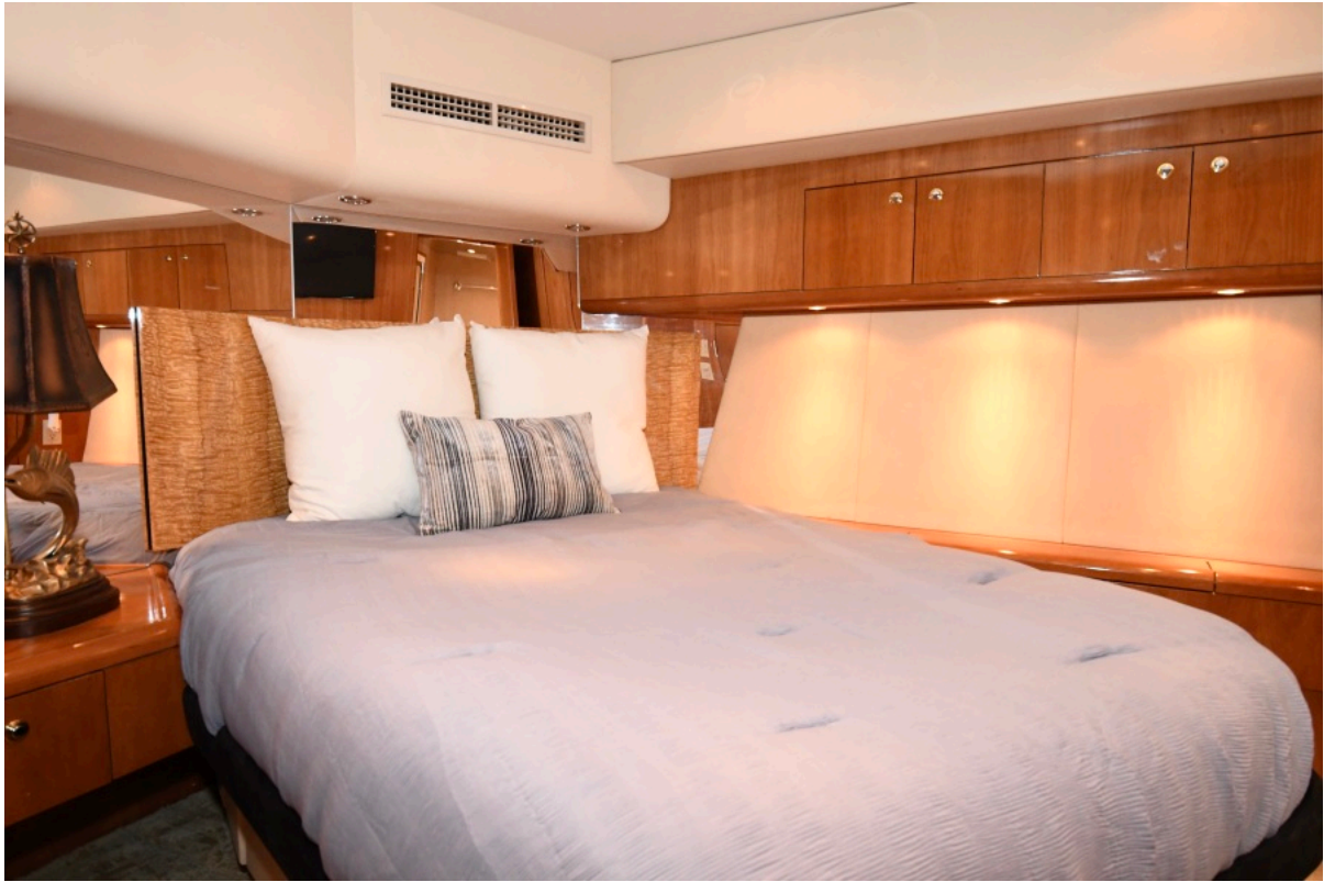
65 Hatteras Convertible Stateroom