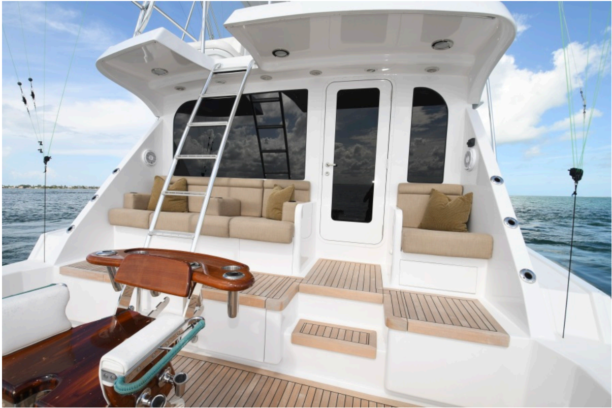
65 Hatteras Convertible Cockpit