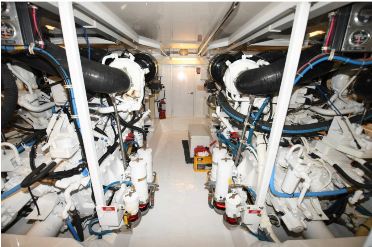
65 Hatteras Convertible Engine Room