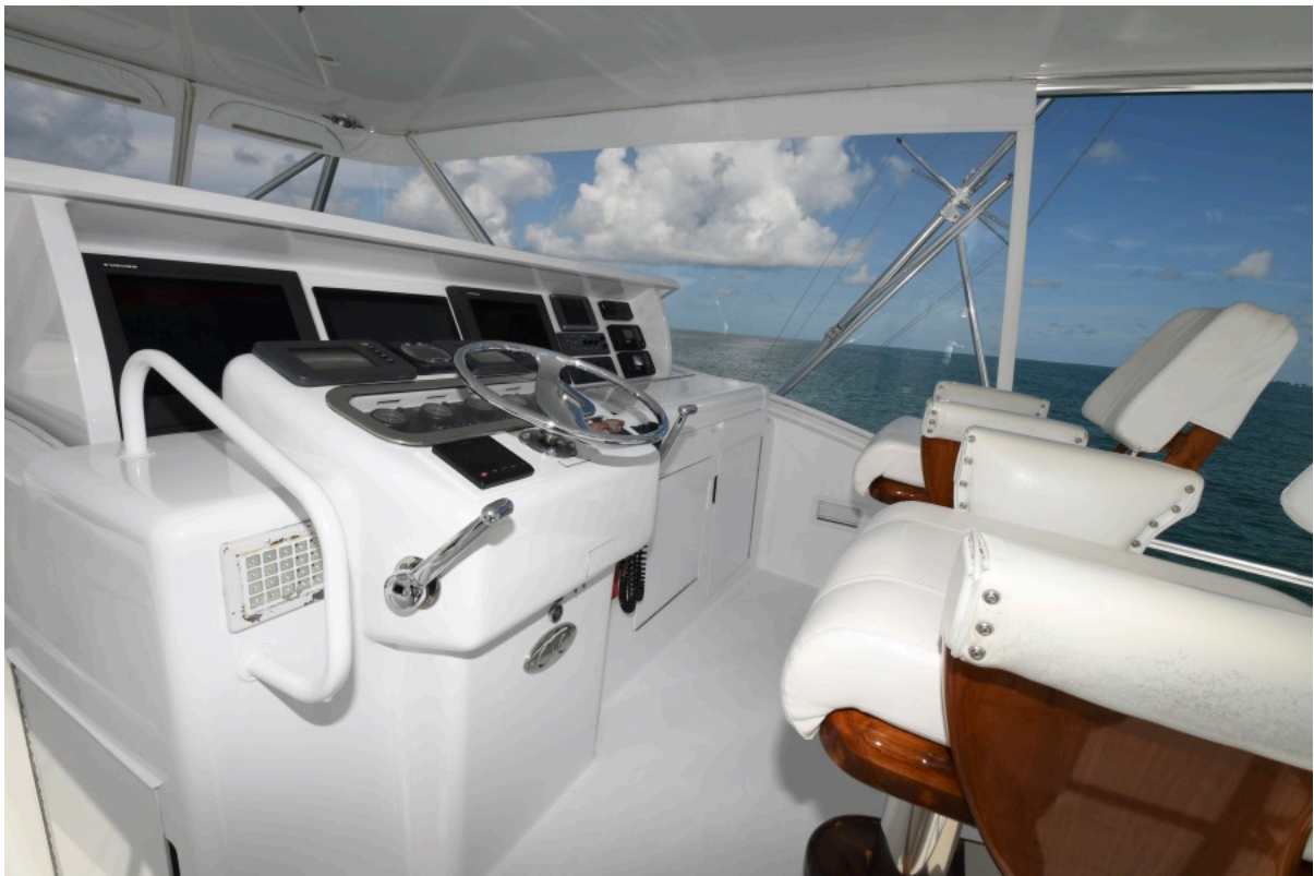
65 Hatteras Convertible Helm