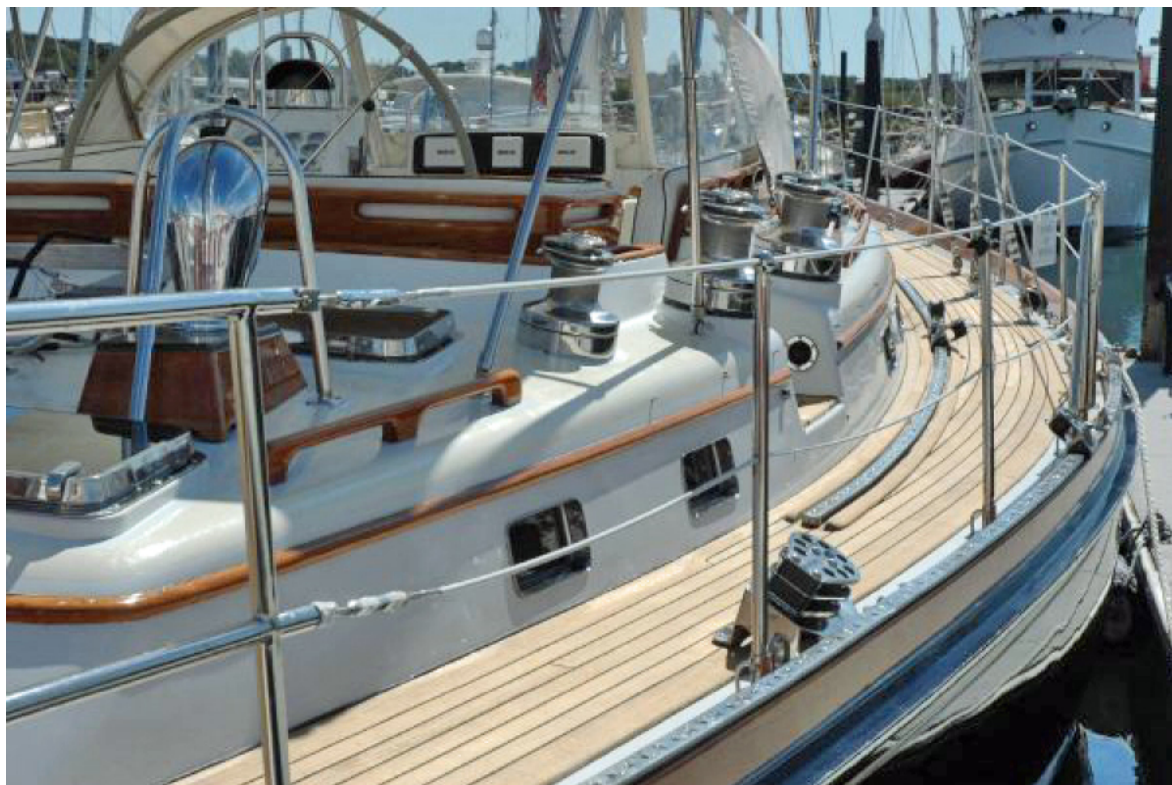
Stbd. Cockpit Fwd