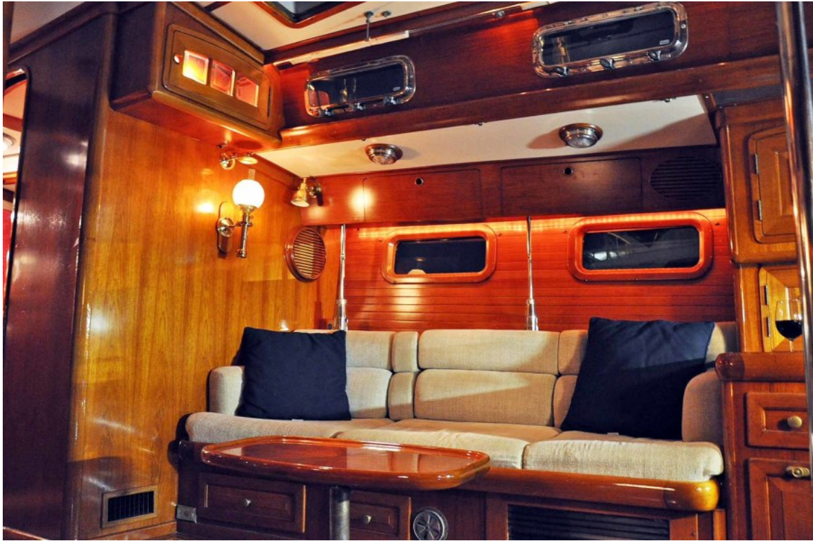
Saloon Starboard Side