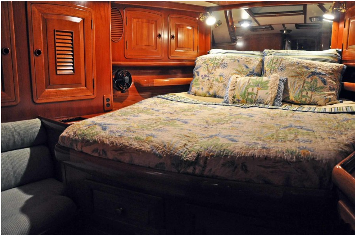
Fwd. Queen VIP Cabin