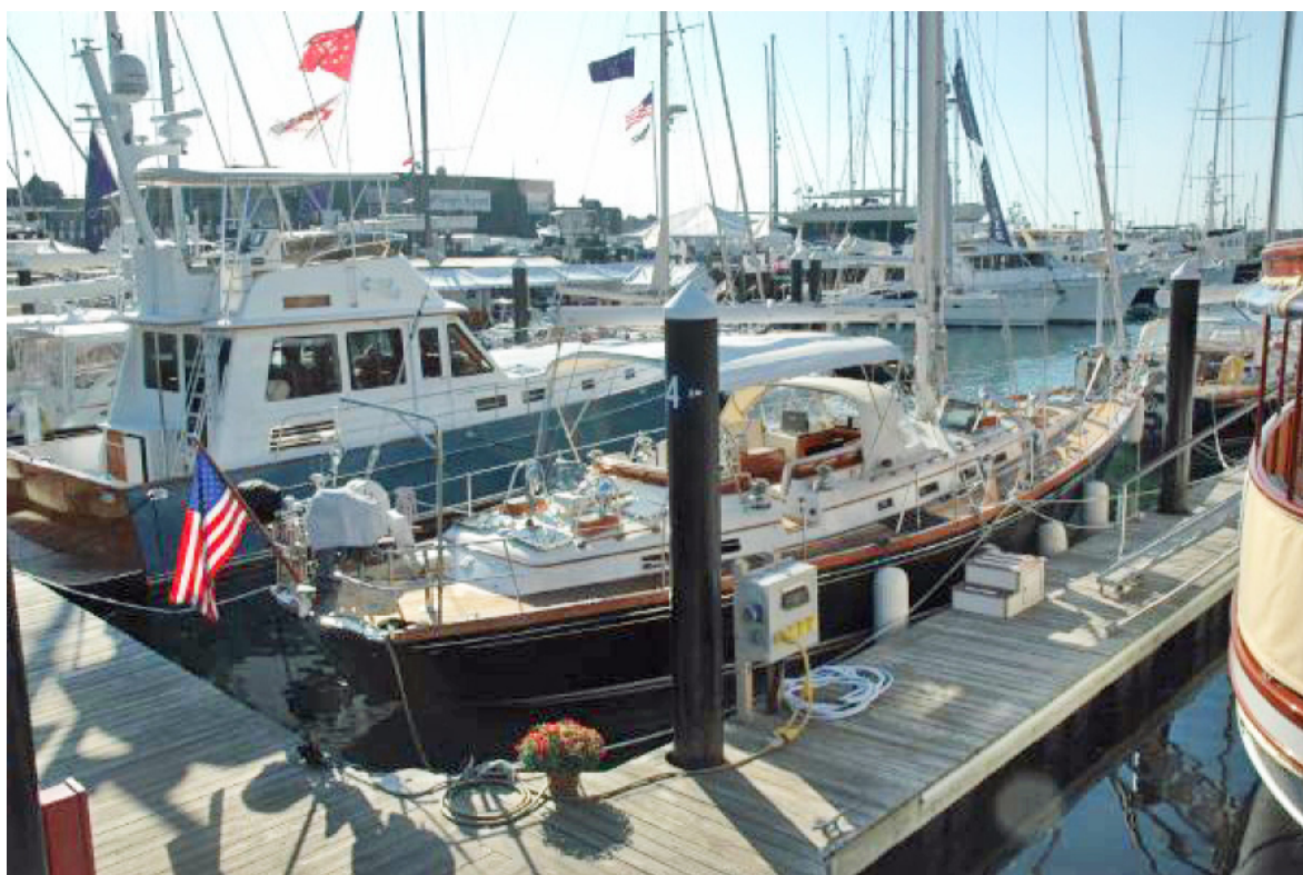
Stbd. At Dock