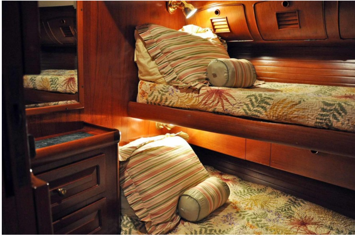
Upper Lower Berths, Guest Cabin