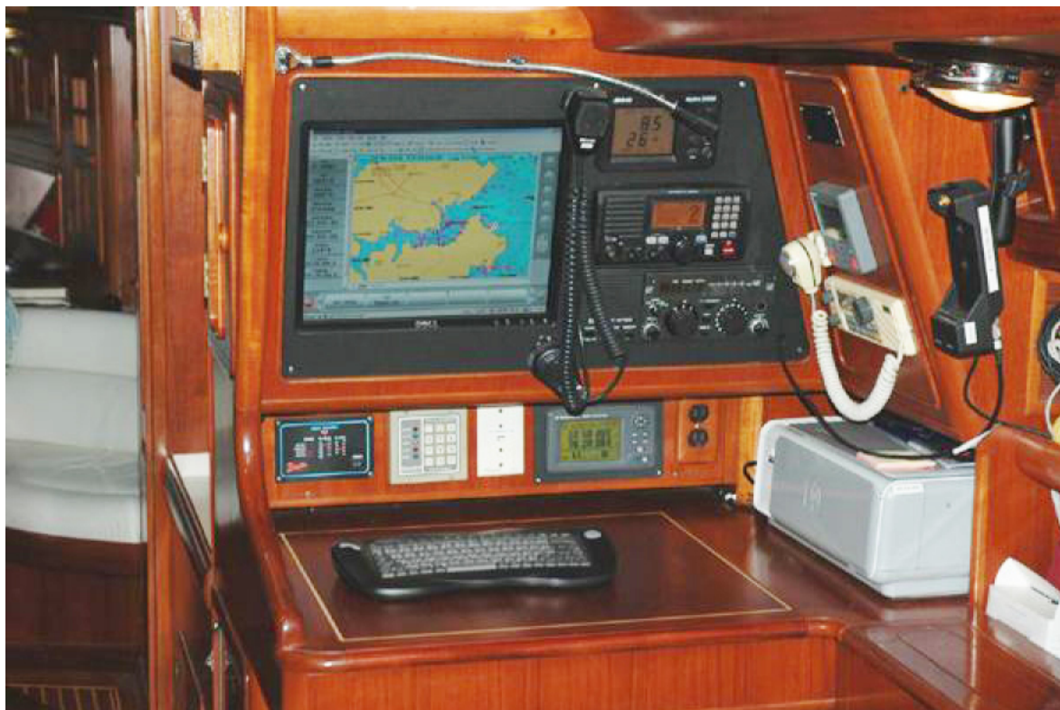
Nav Station Details