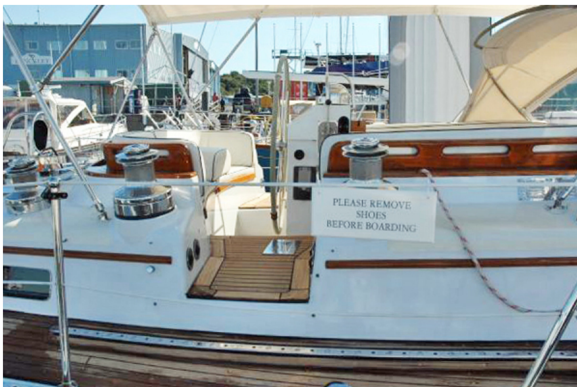
Stbd. cockpit Access