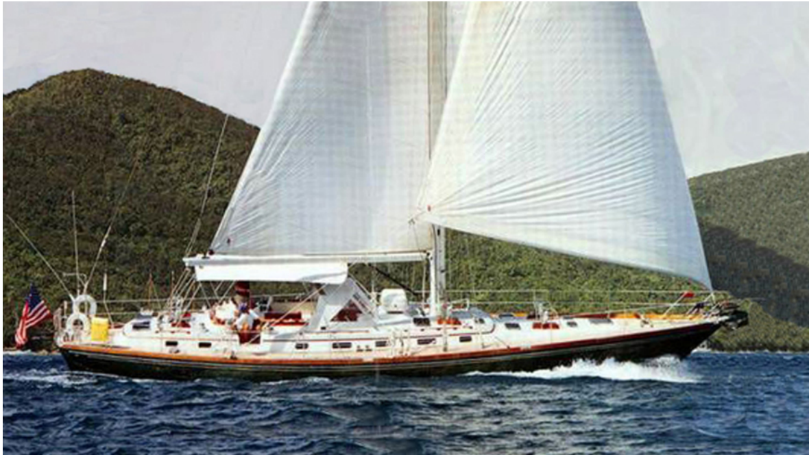
GALADRIEL Little Harbor 54