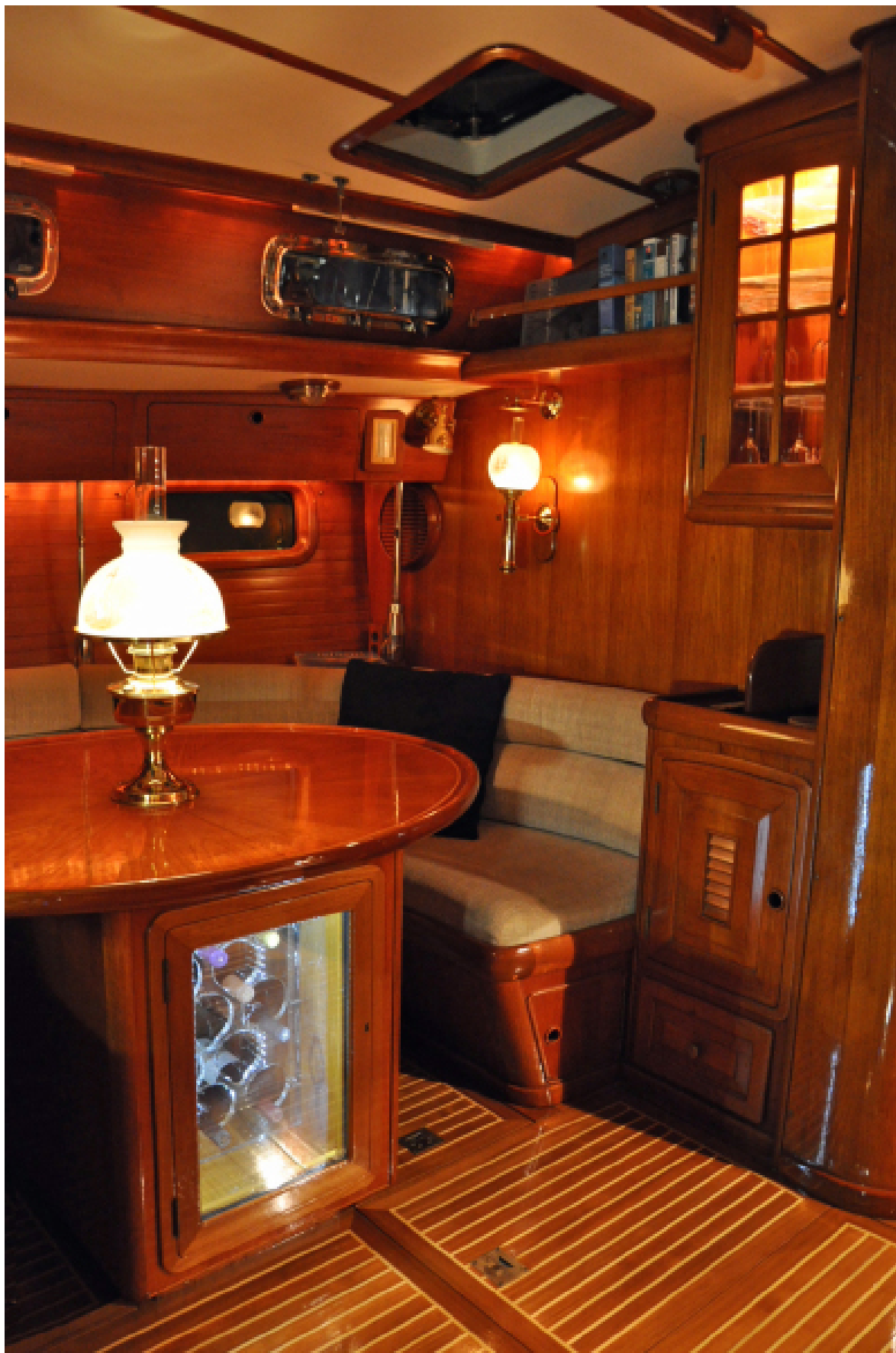
Saloon Wine Fridge