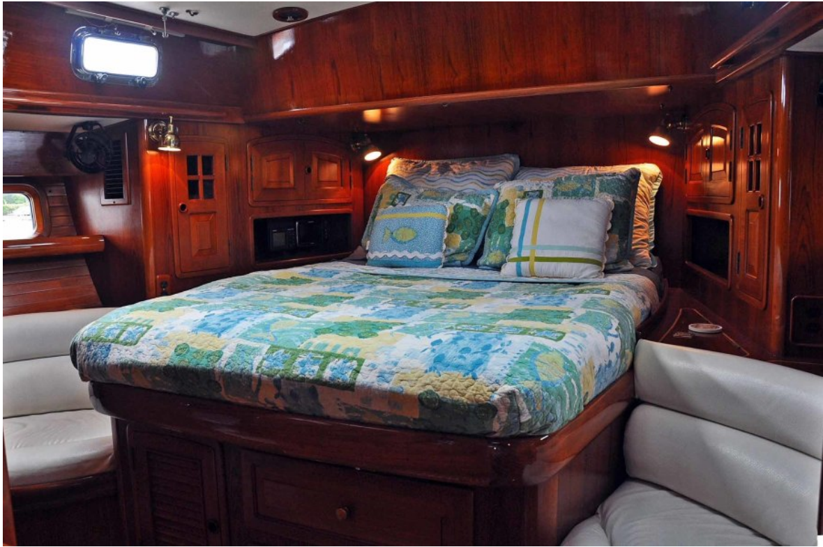
Aft Queen Owner's Cabin