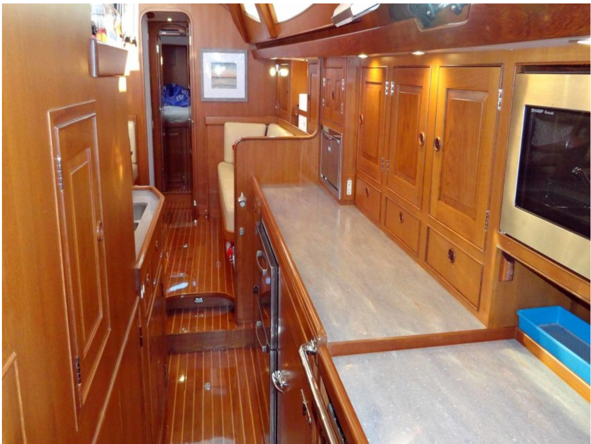
Galley, Looking Fwd.