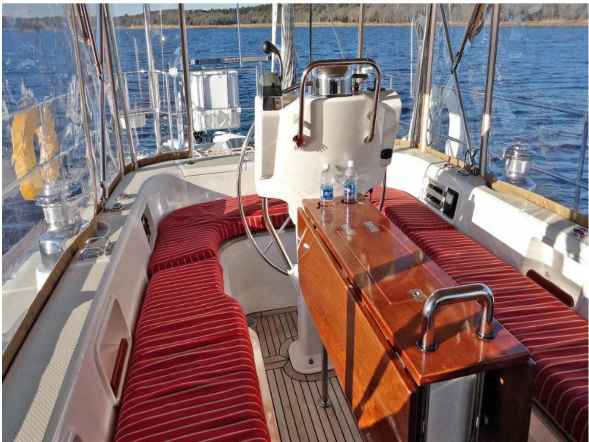
Cockpit, Looking Aft