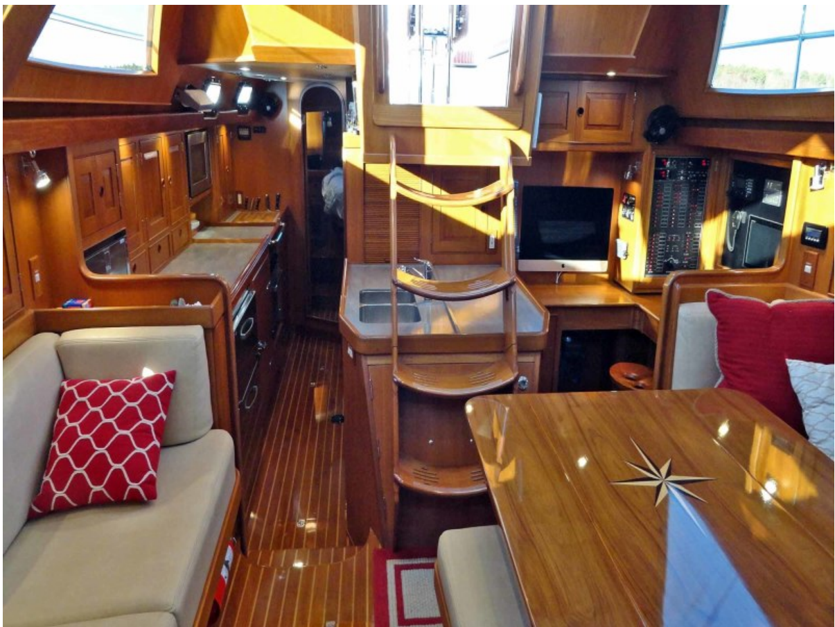
Main Salon, Looking Aft