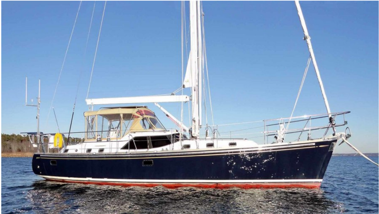
HOPE 2012 Hylas 56 Raised Salon