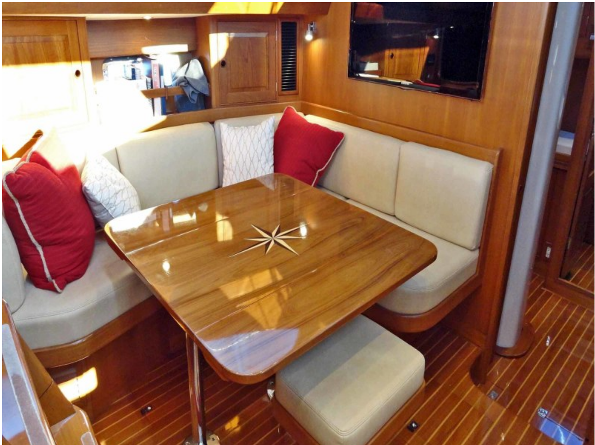
Main Salon, Port Side