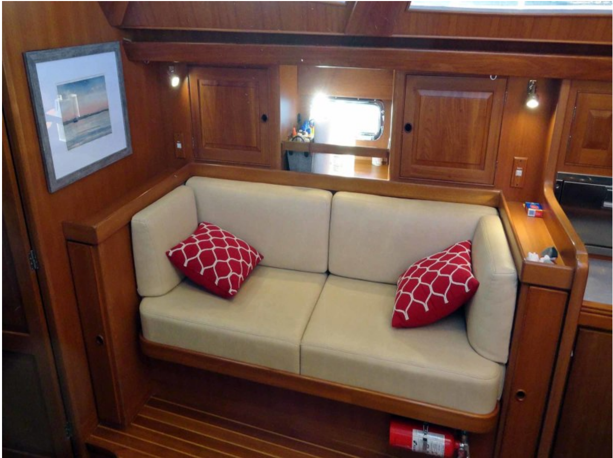
Main Salon, Stbd. Side