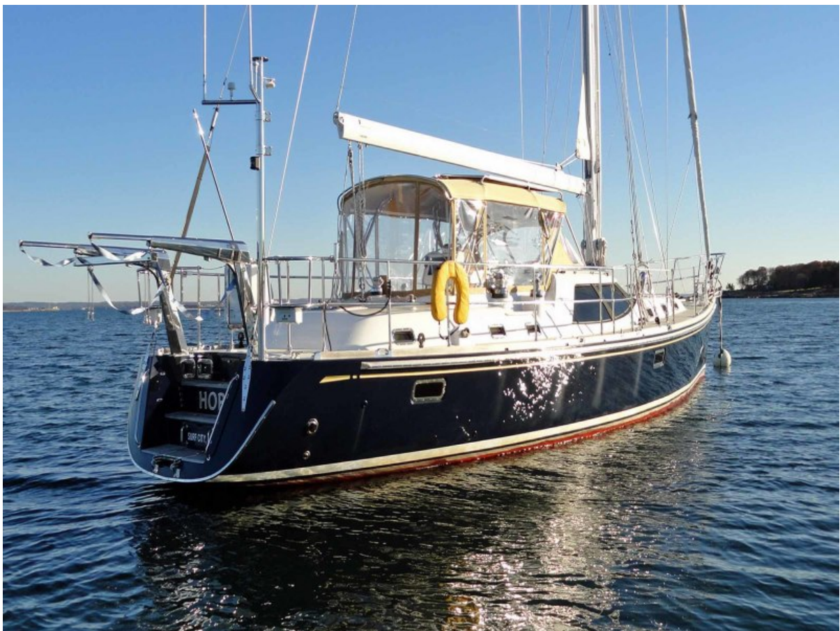
Aft Qtr. View