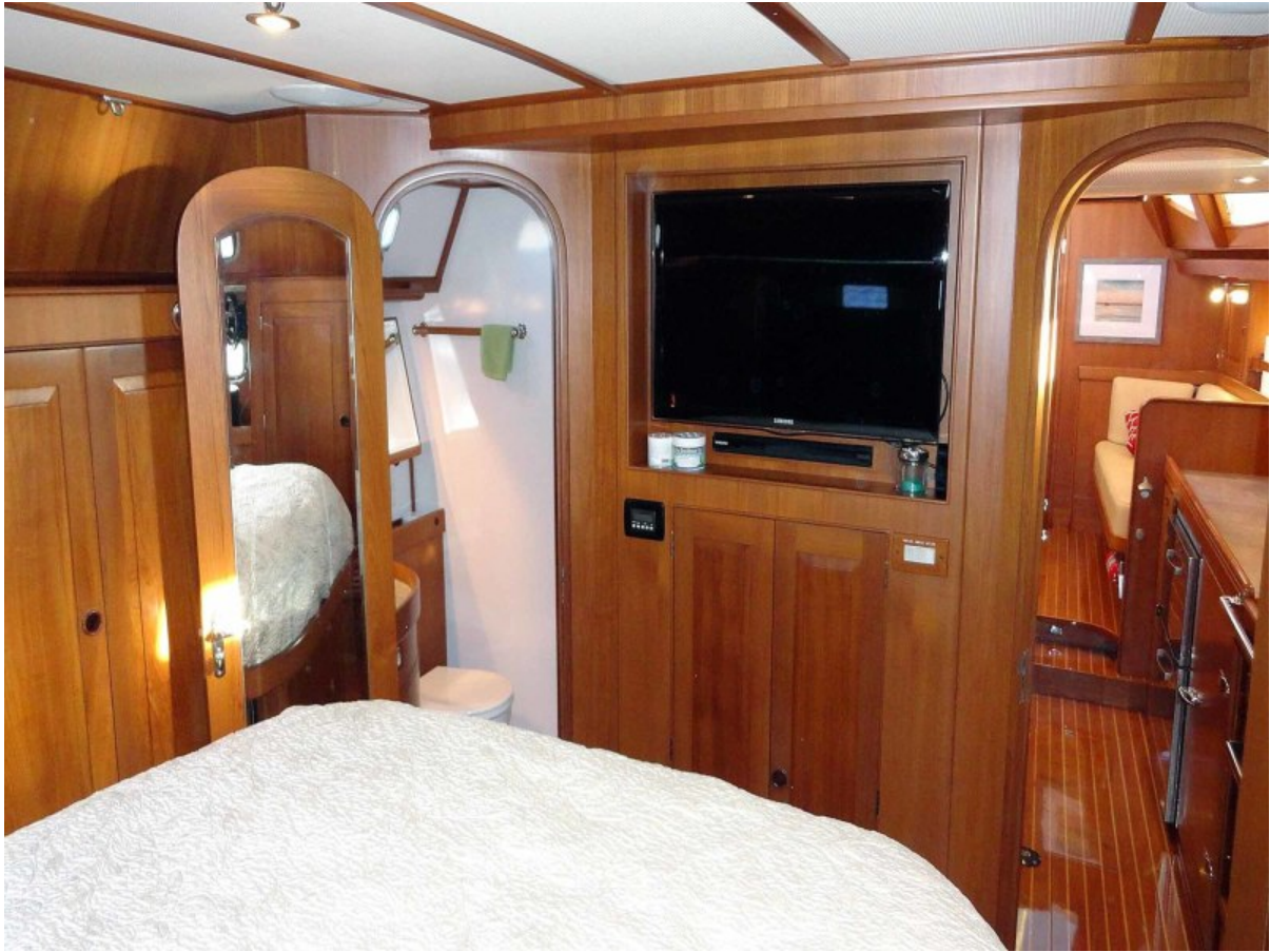
Owner's Cabin, Fwd.