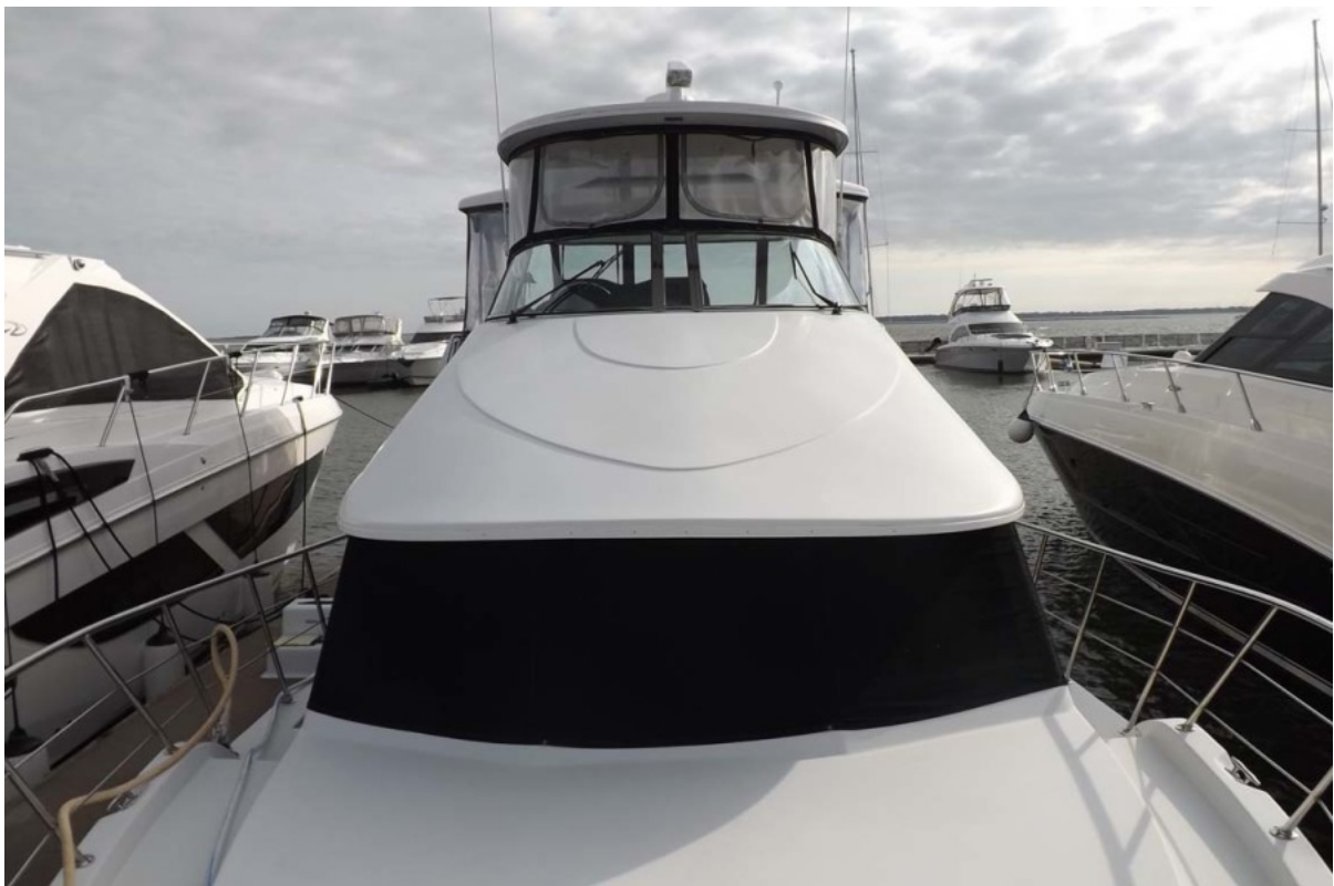
Flybridge viewed from Foredeck