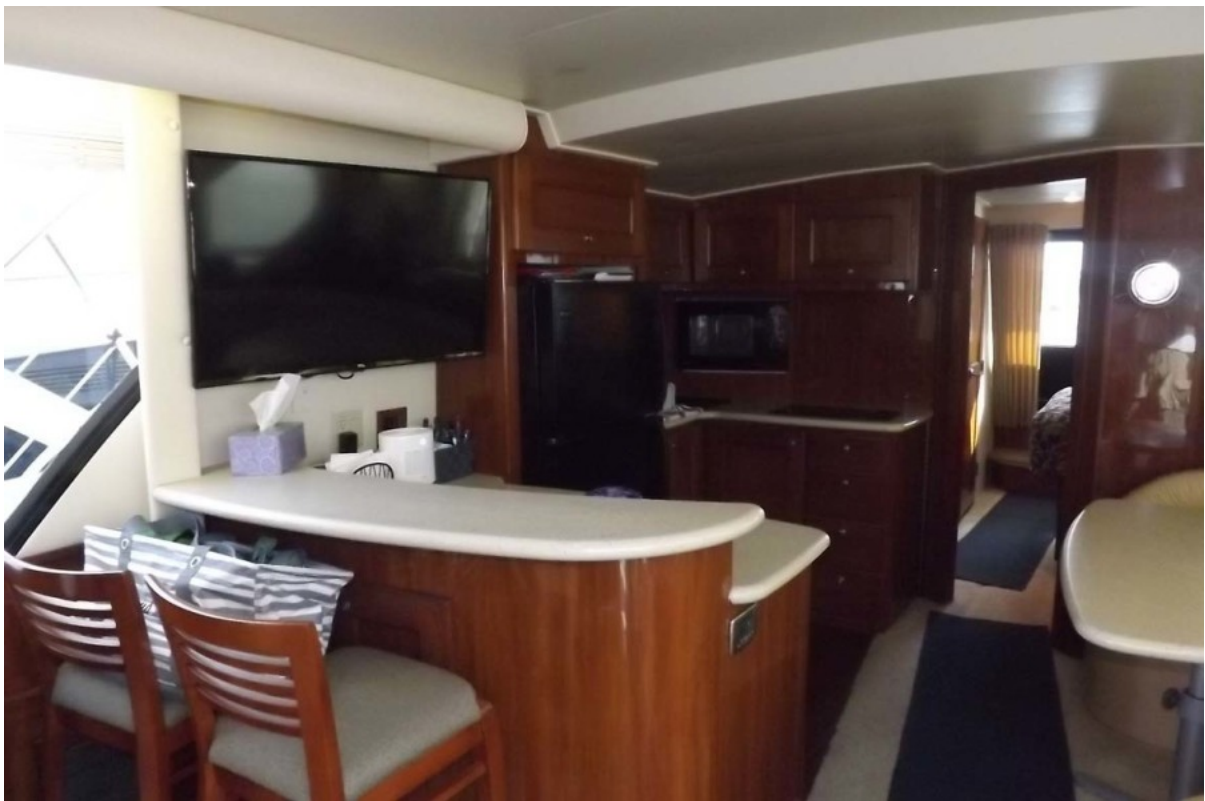
Galley, Breakfast Counter