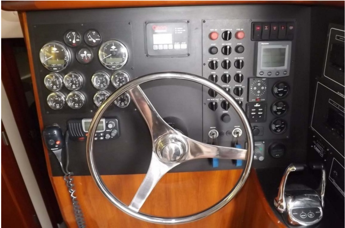
Lower Helm Gauges, Switches