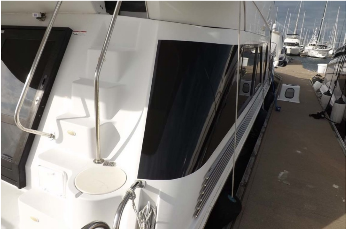
Molded Stairs to Sundeck/Flybridge