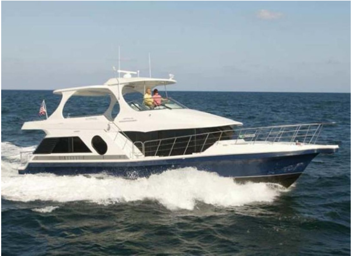
Blue Water 5200 Manufacturer Provided Image