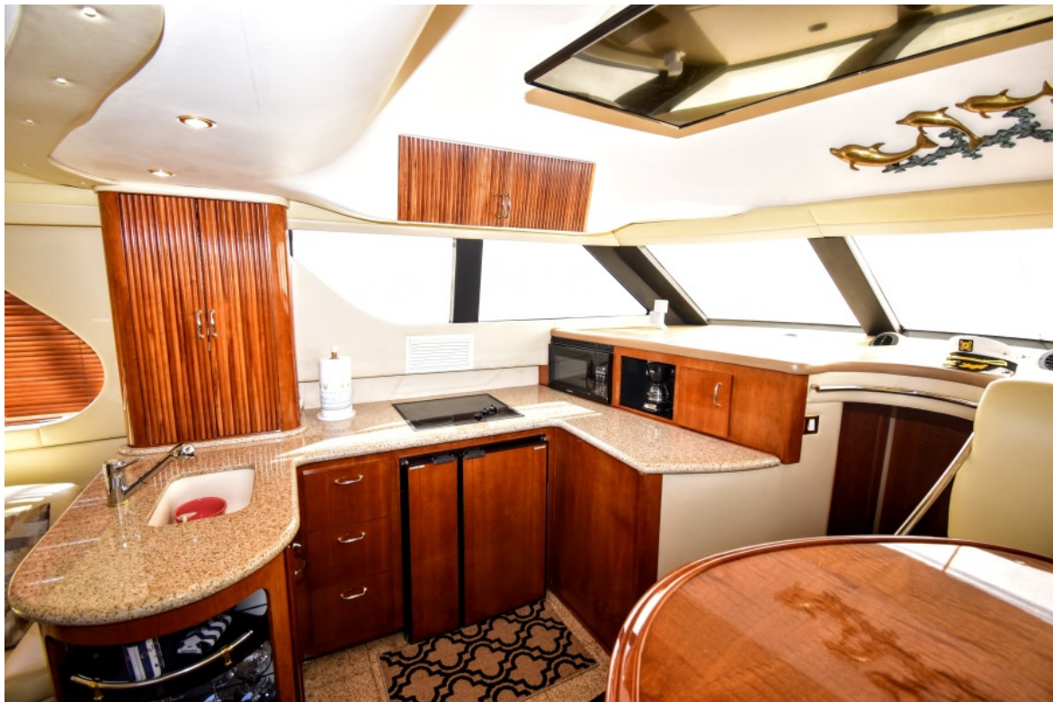
Carver 46 Voyager 2003 Dos Locos Galley