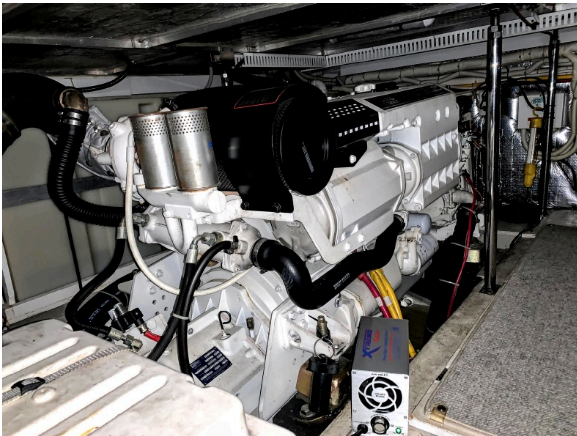
Carver 46 Voyager 2003 Dos Locos