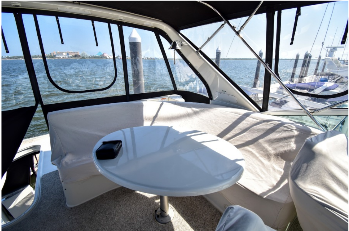
Carver 46 Voyager 2003 Dos Locos