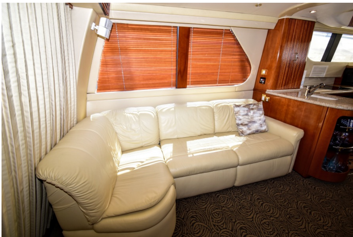
Carver 46 Voyager 2003 Dos Locos Salon