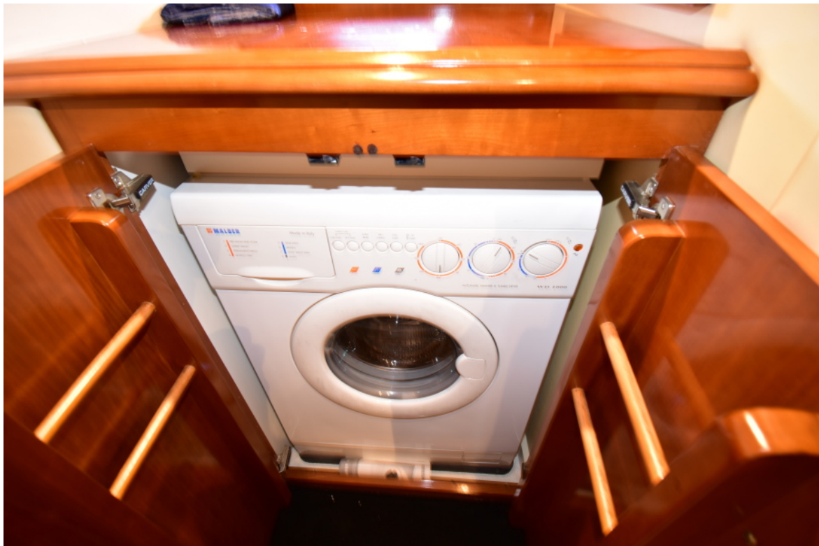
Carver 46 Voyager 2003 Dos Locos Washer/Dryer