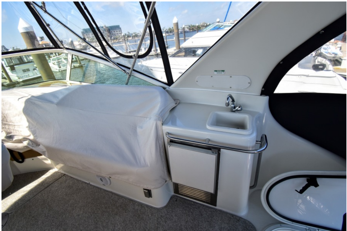
Carver 46 Voyager 2003 Dos Locos