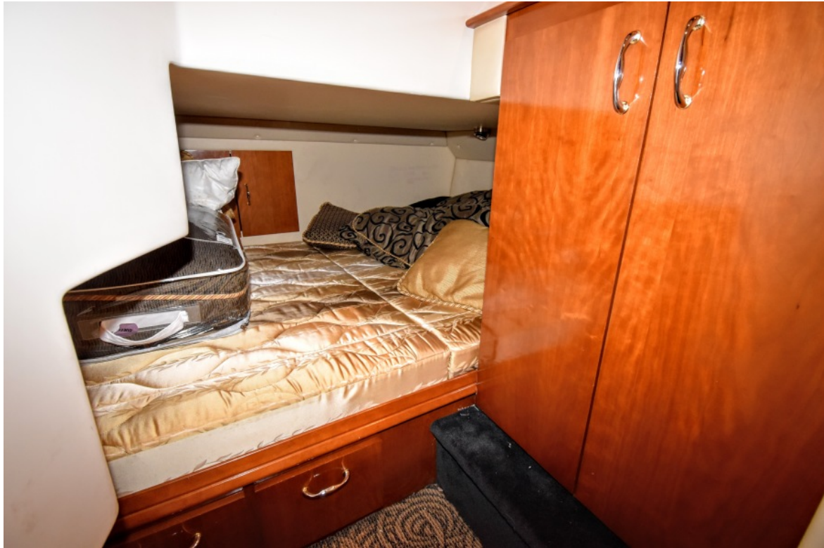
Carver 46 Voyager 2003 Dos Locos Guest Stateroom