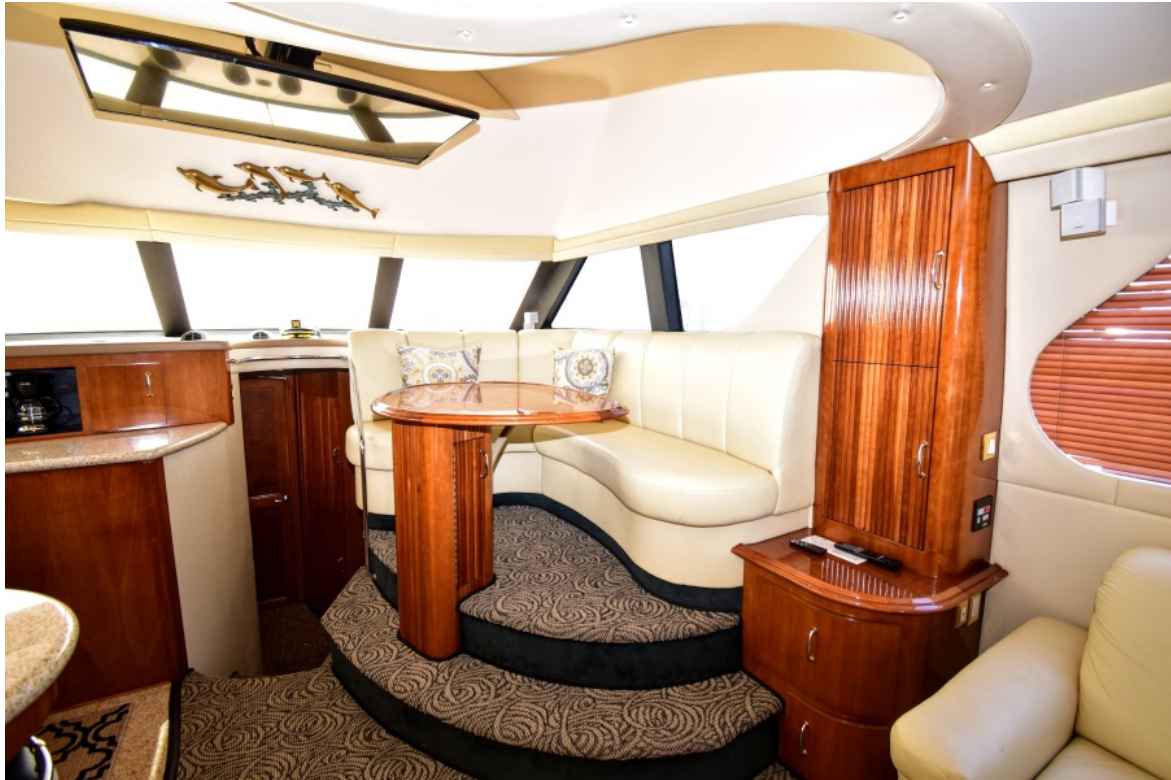
Carver 46 Voyager 2003 Dos Locos Dinette