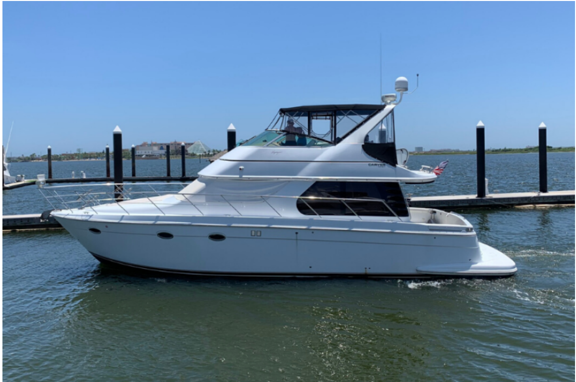
Carver 46 Voyager 2003 Dos Locos