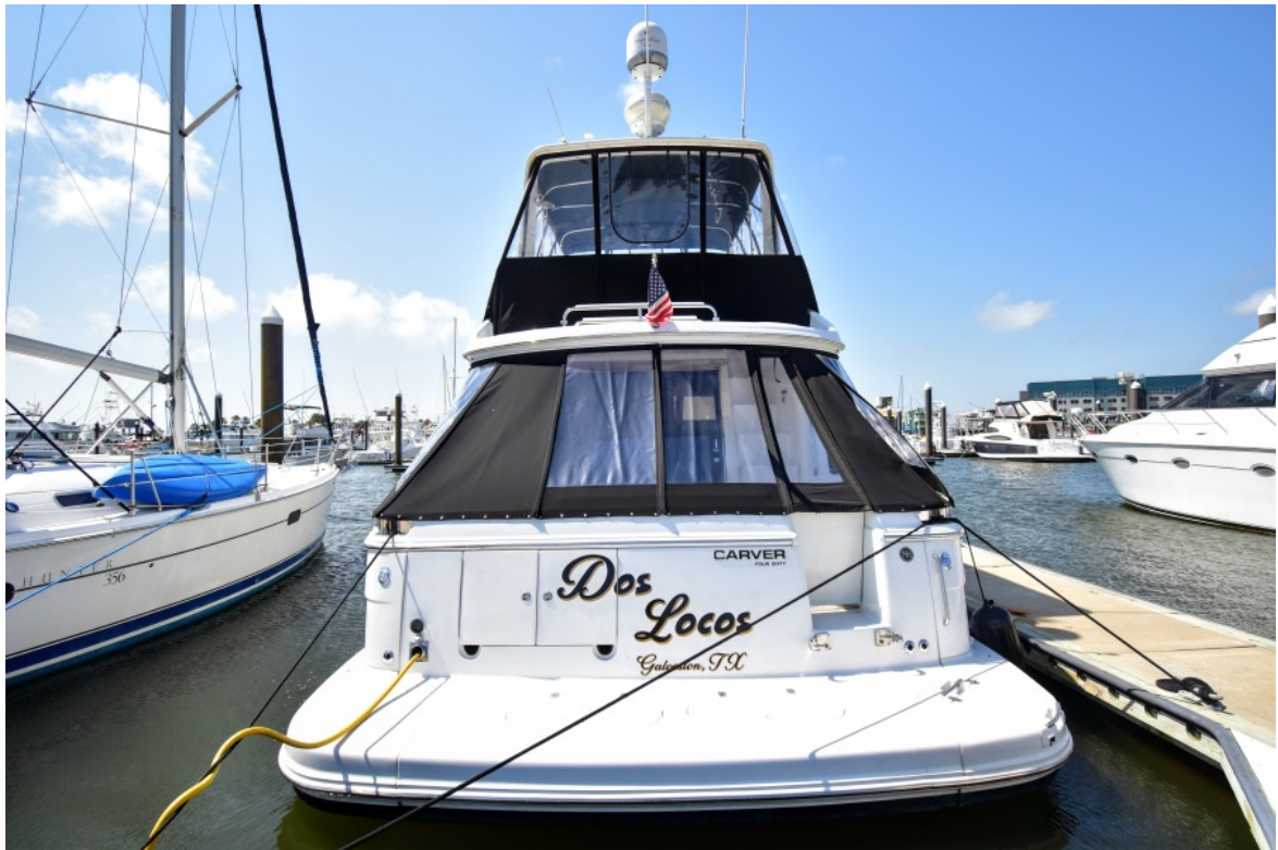
Carver 46 Voyager 2003 Dos Locos