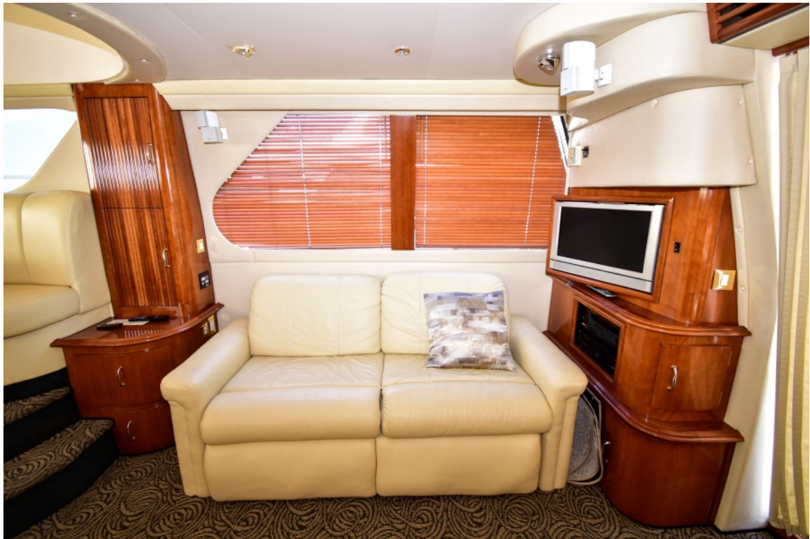
Carver 46 Voyager 2003 Dos Locos