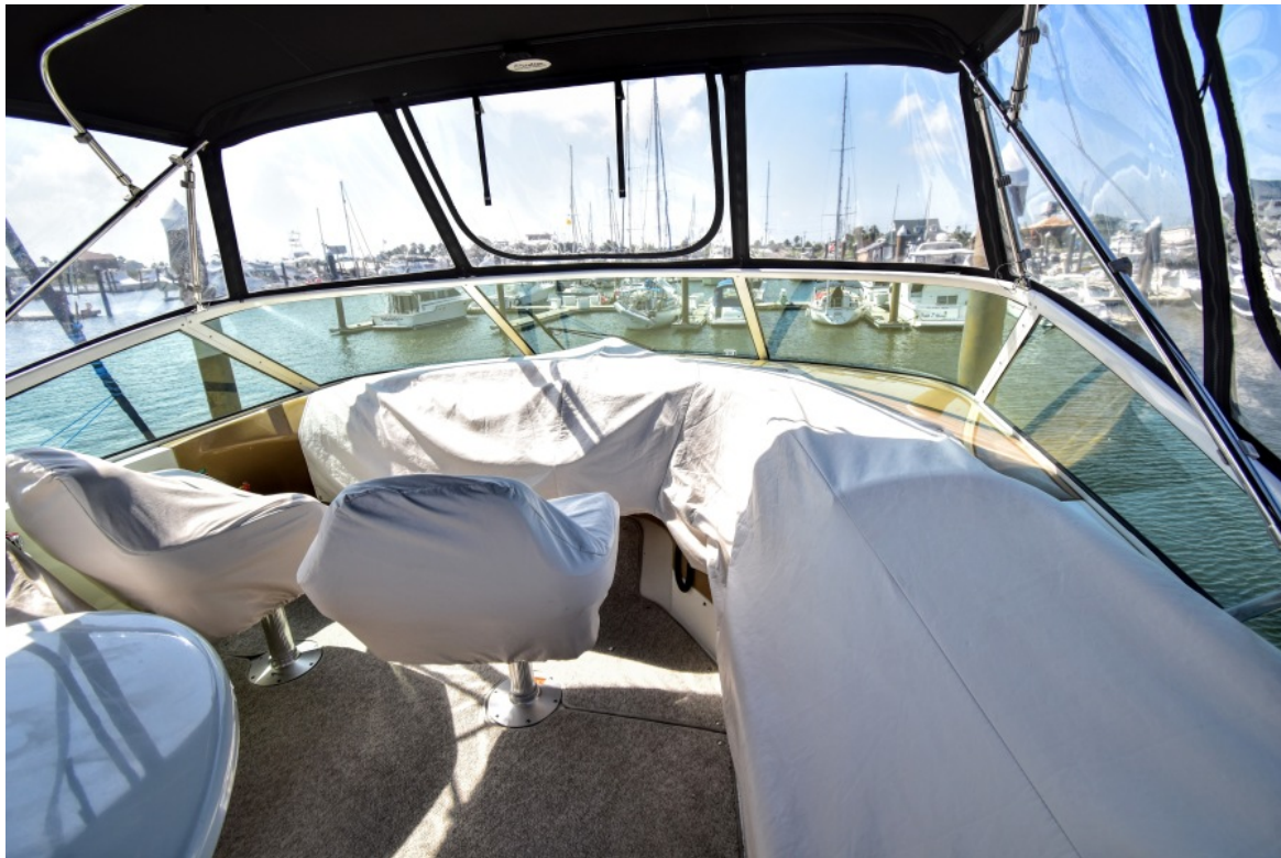
Carver 46 Voyager 2003 Dos Locos