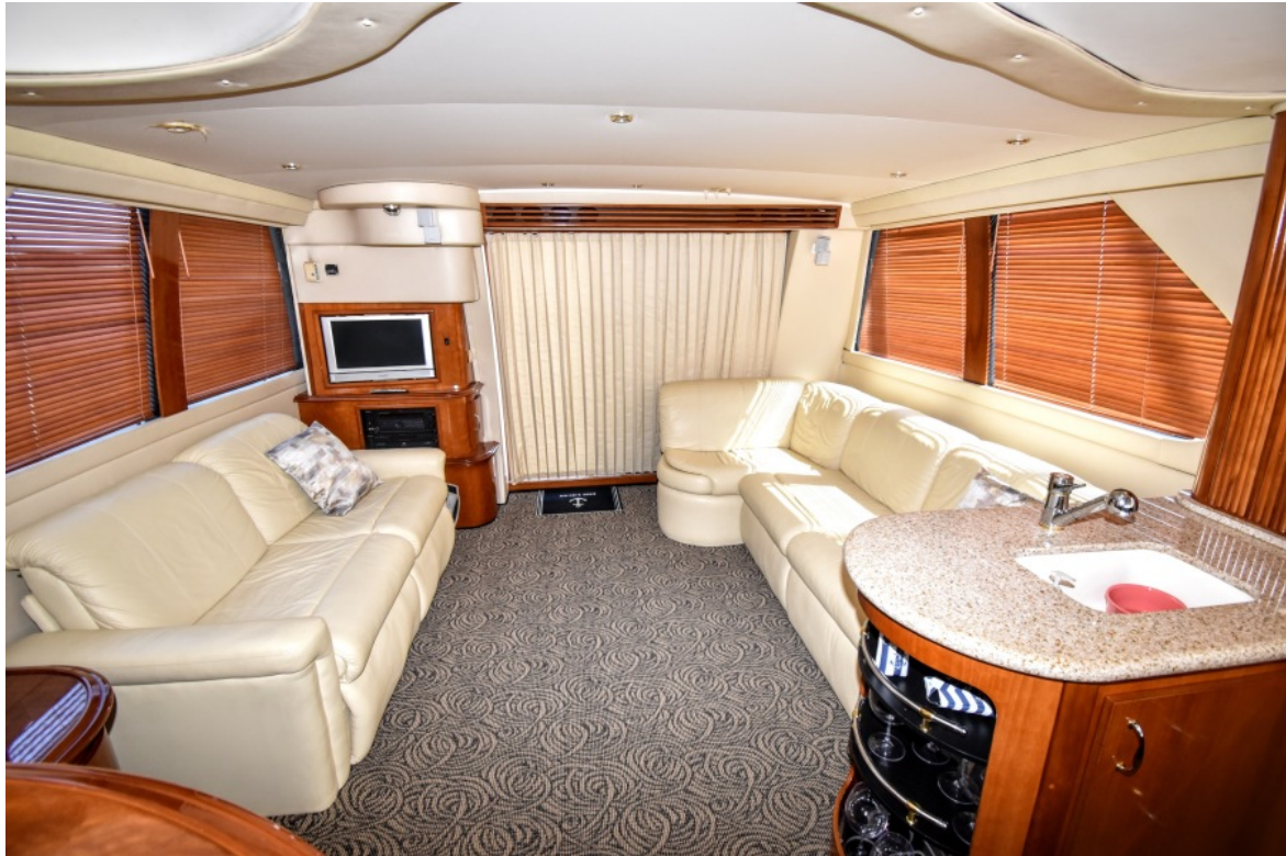
Carver 46 Voyager 2003 Dos Locos