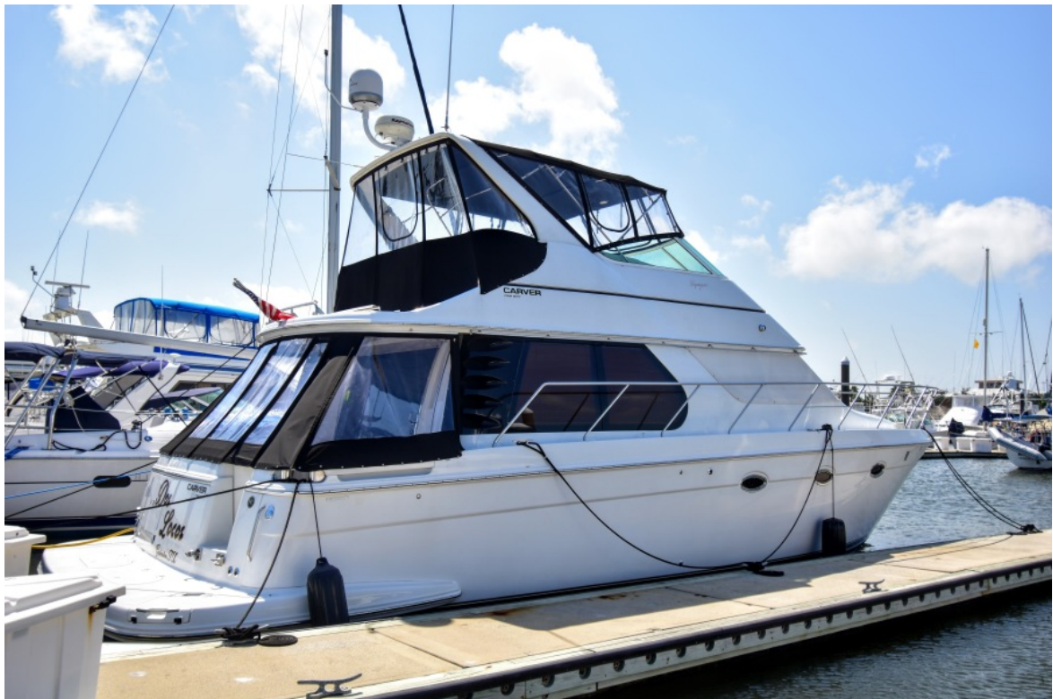
Carver 46 Voyager 2003 Dos Locos