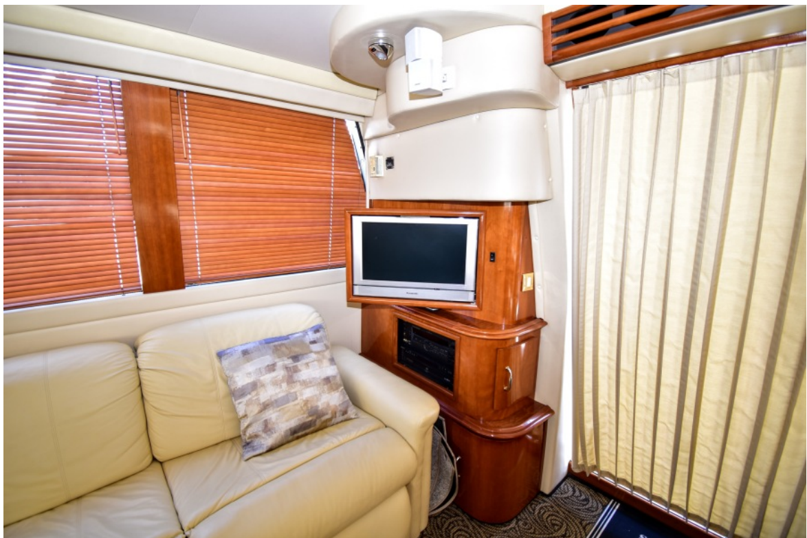
Carver 46 Voyager 2003 Dos Locos