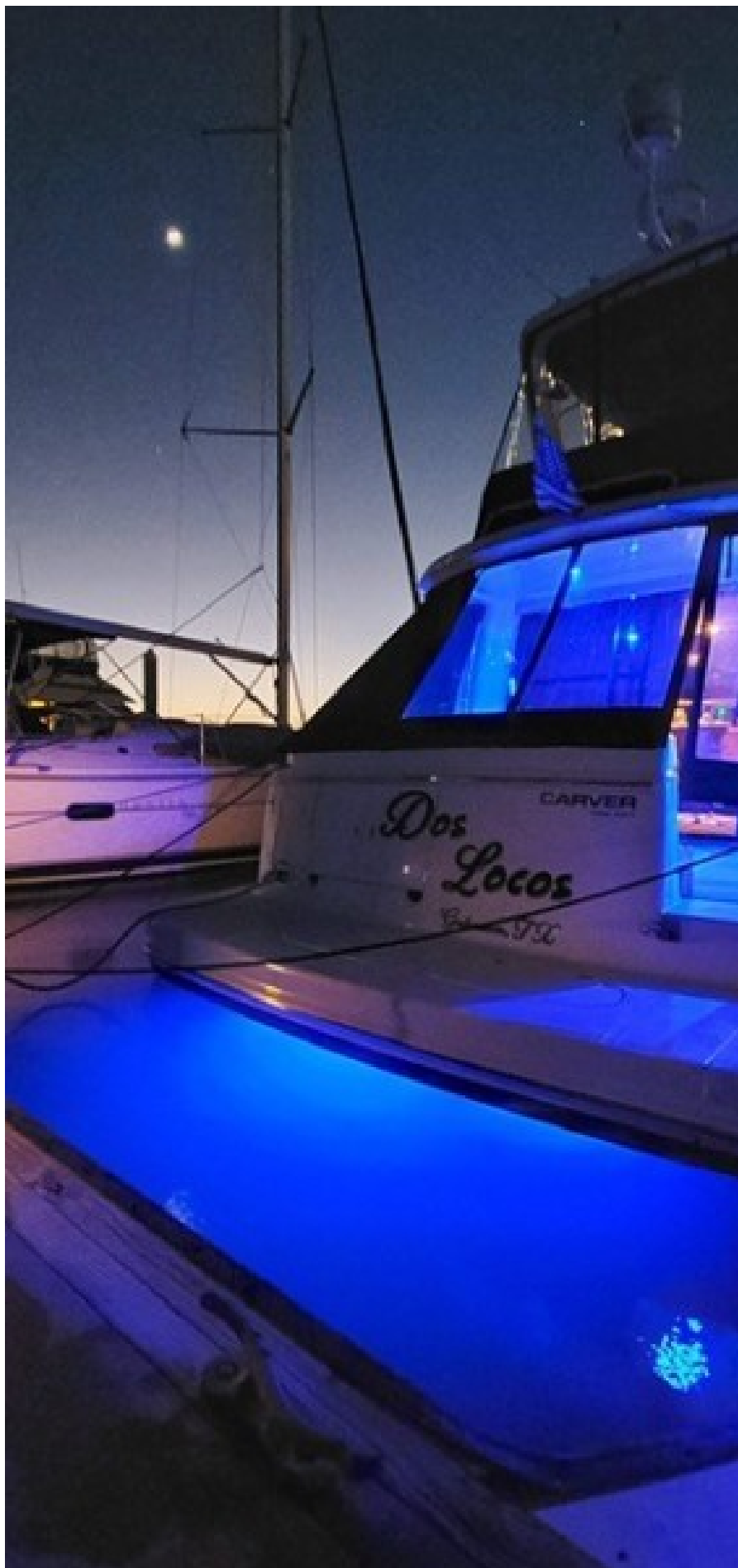
Carver 46 Voyager 2003 Dos Locos