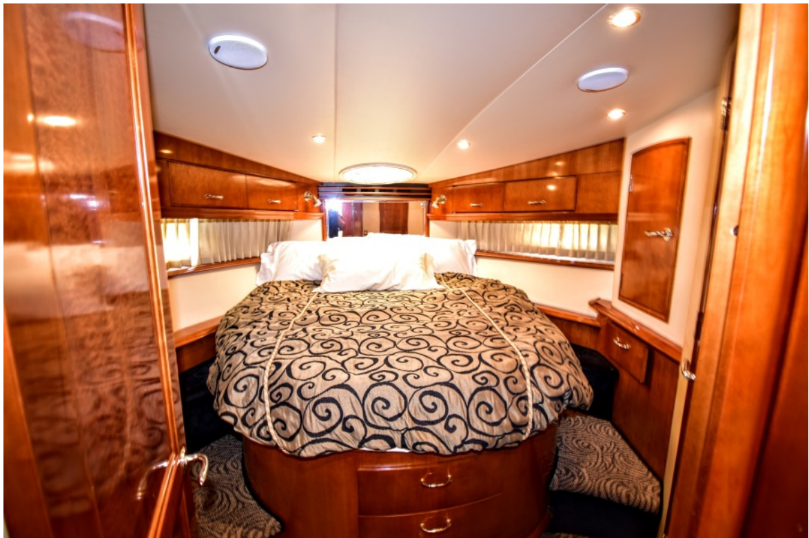
Carver 46 Voyager 2003 Dos Locos Master Stateroom