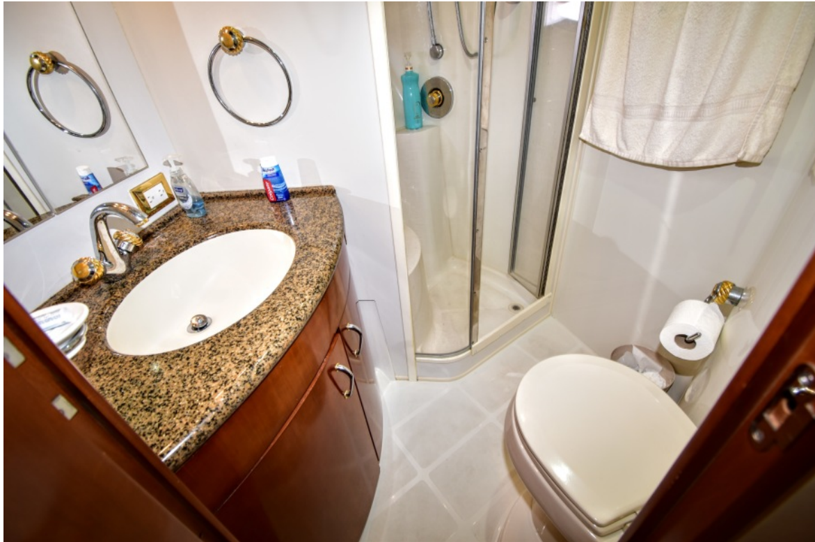
Carver 46 Voyager 2003 Dos Locos Head