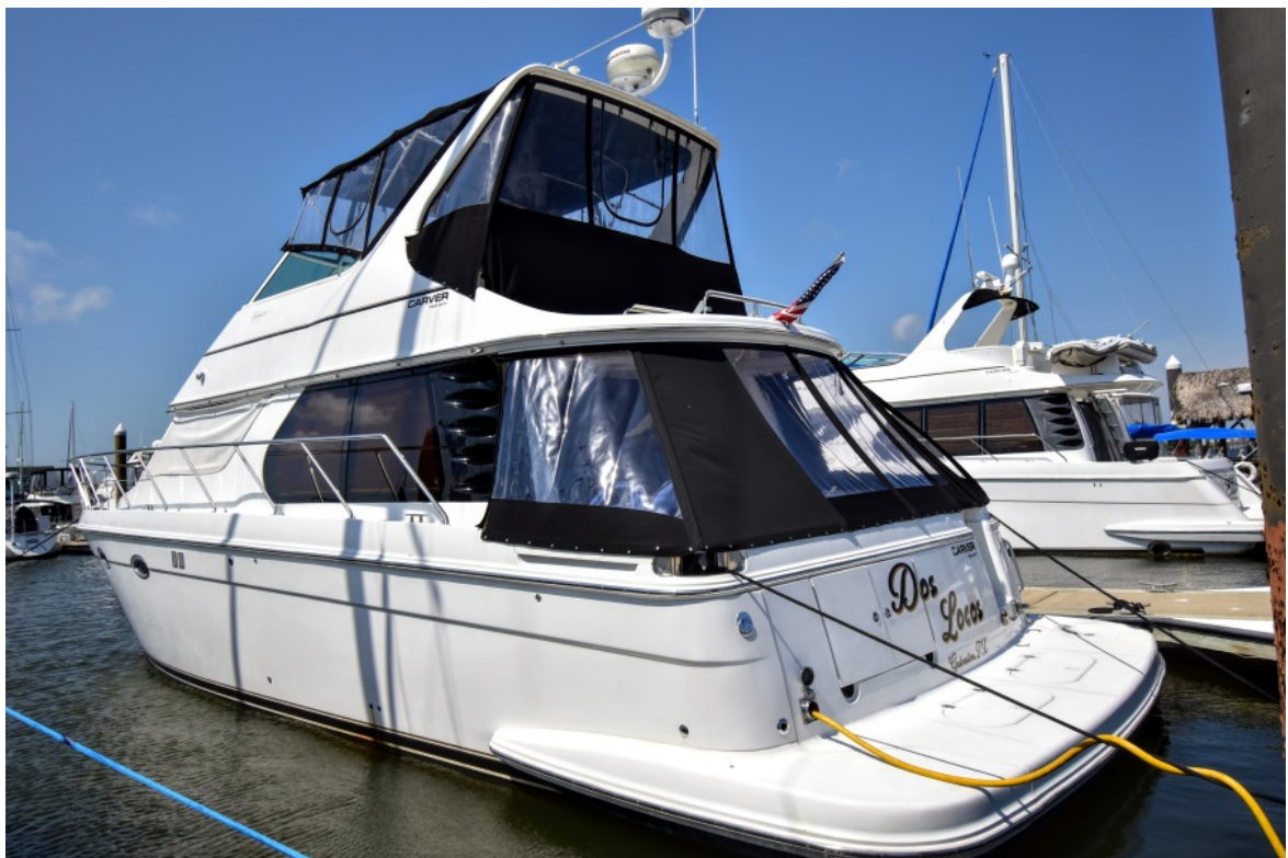
Carver 46 Voyager 2003 Dos Locos