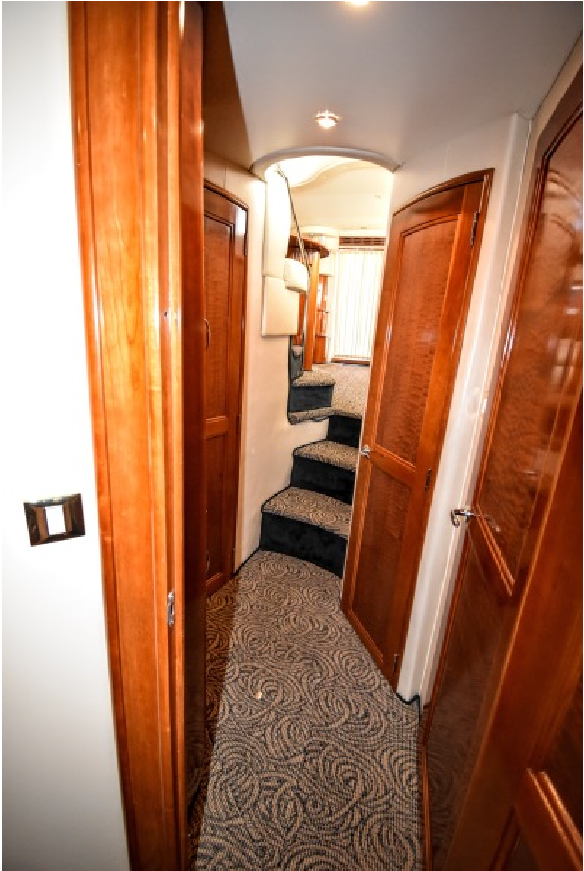
Carver 46 Voyager 2003 Dos Locos