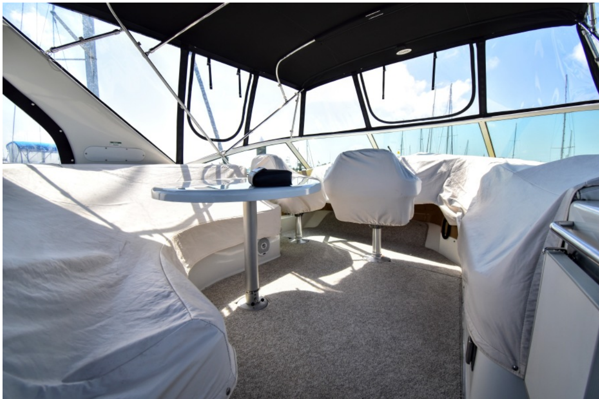
Carver 46 Voyager 2003 Dos Locos