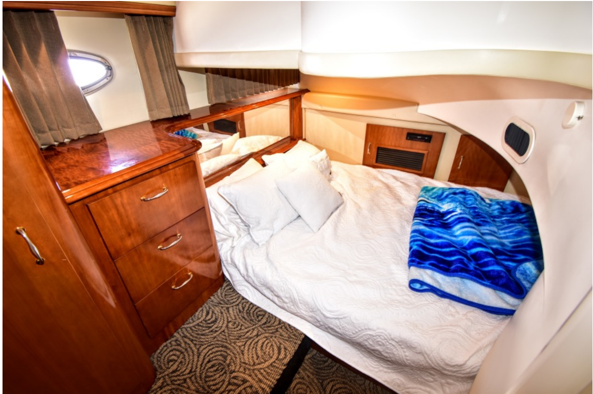
Carver 46 Voyager 2003 Dos Locos Guest Stateroom