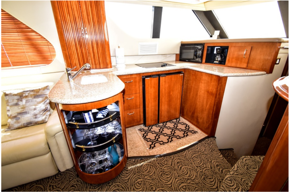
Carver 46 Voyager 2003 Dos Locos