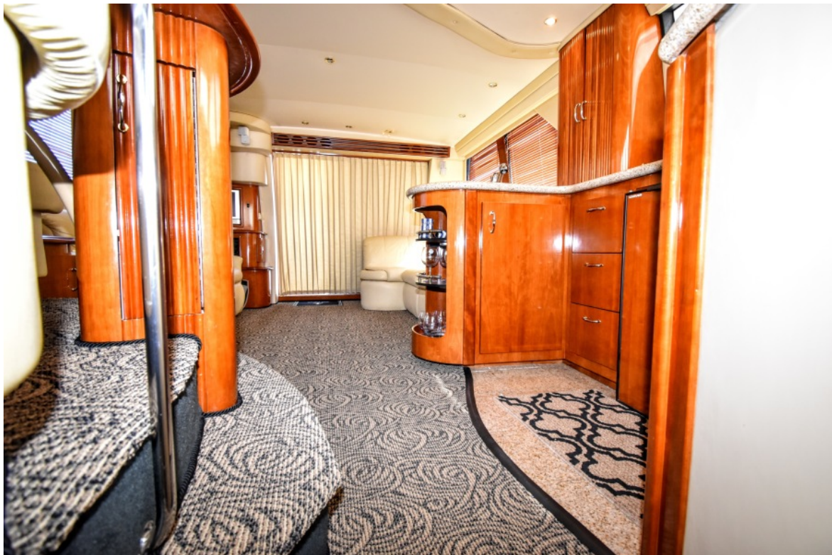
Carver 46 Voyager 2003 Dos Locos