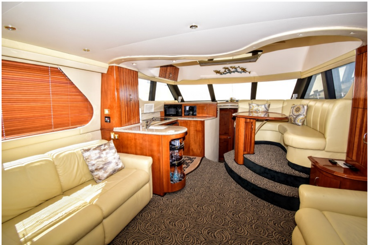
Carver 46 Voyager 2003 Dos Locos