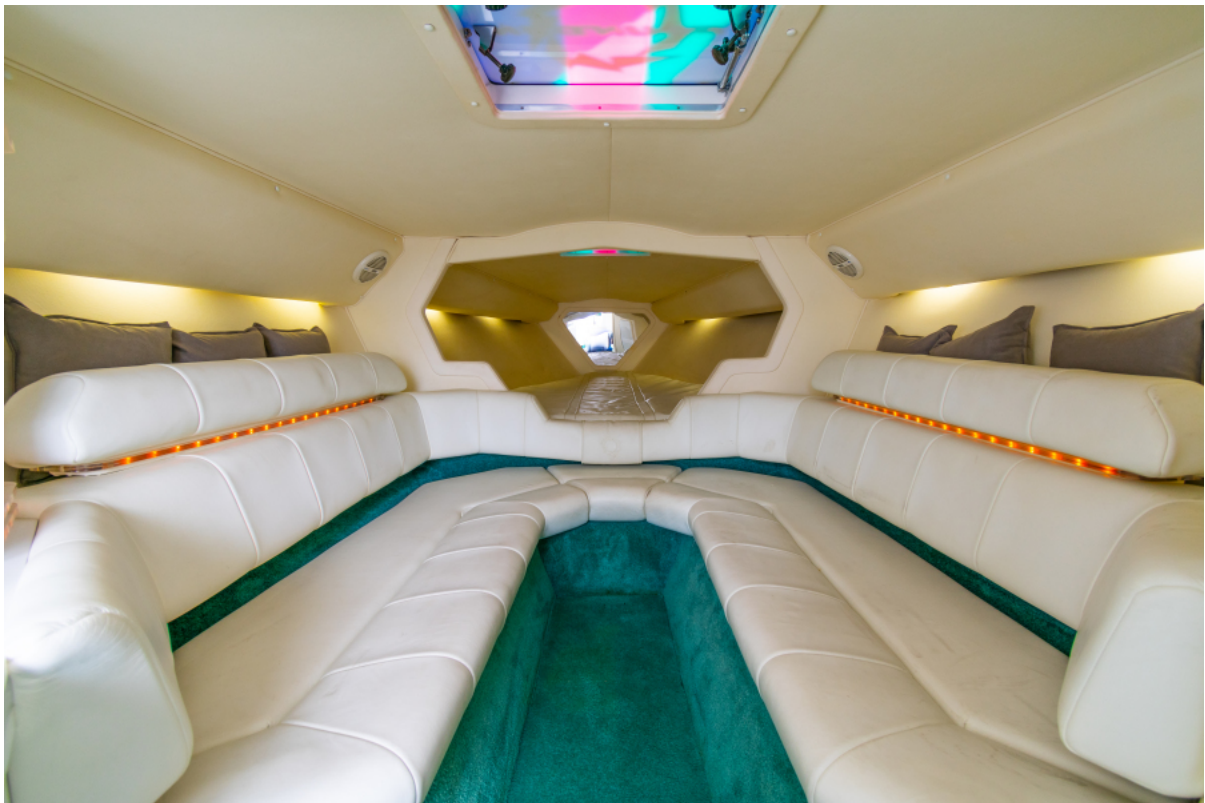
Fountain 42 Lightening 1997