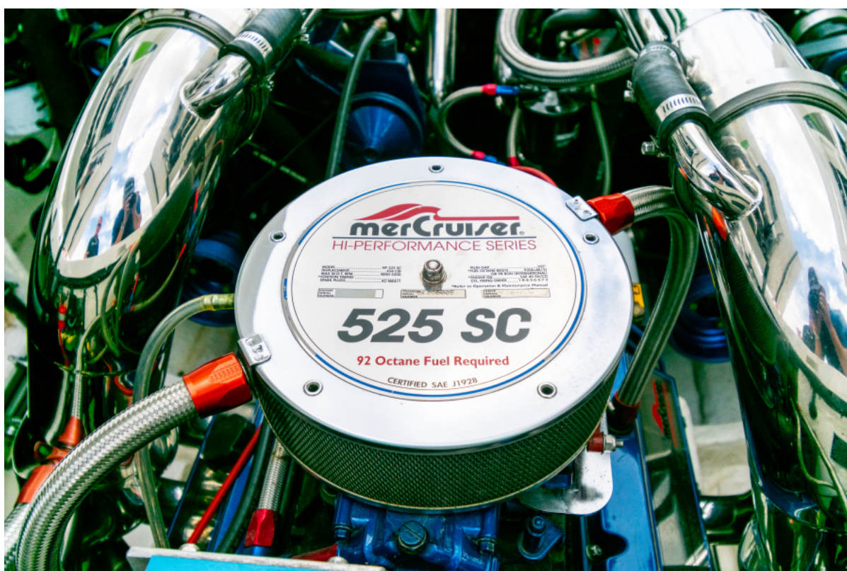
Fountain 42 Lightening 1997