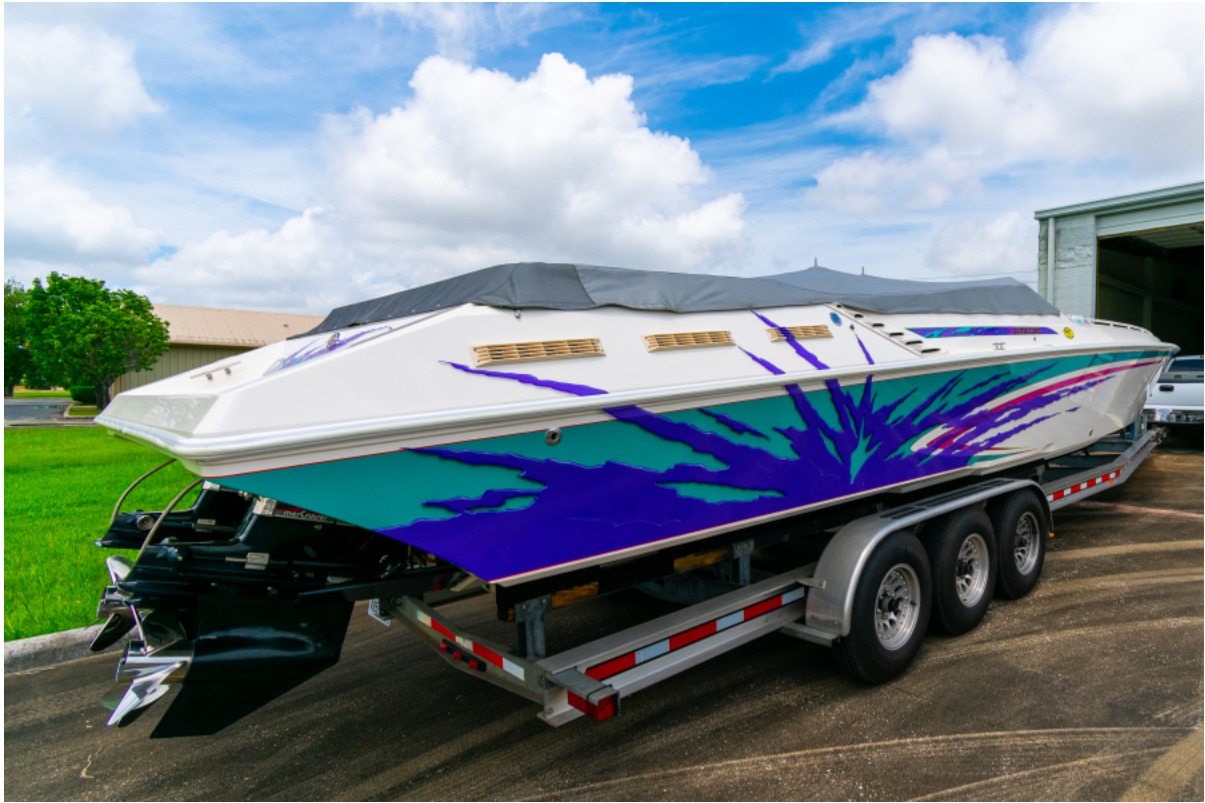
Fountain 42 Lightening 1997