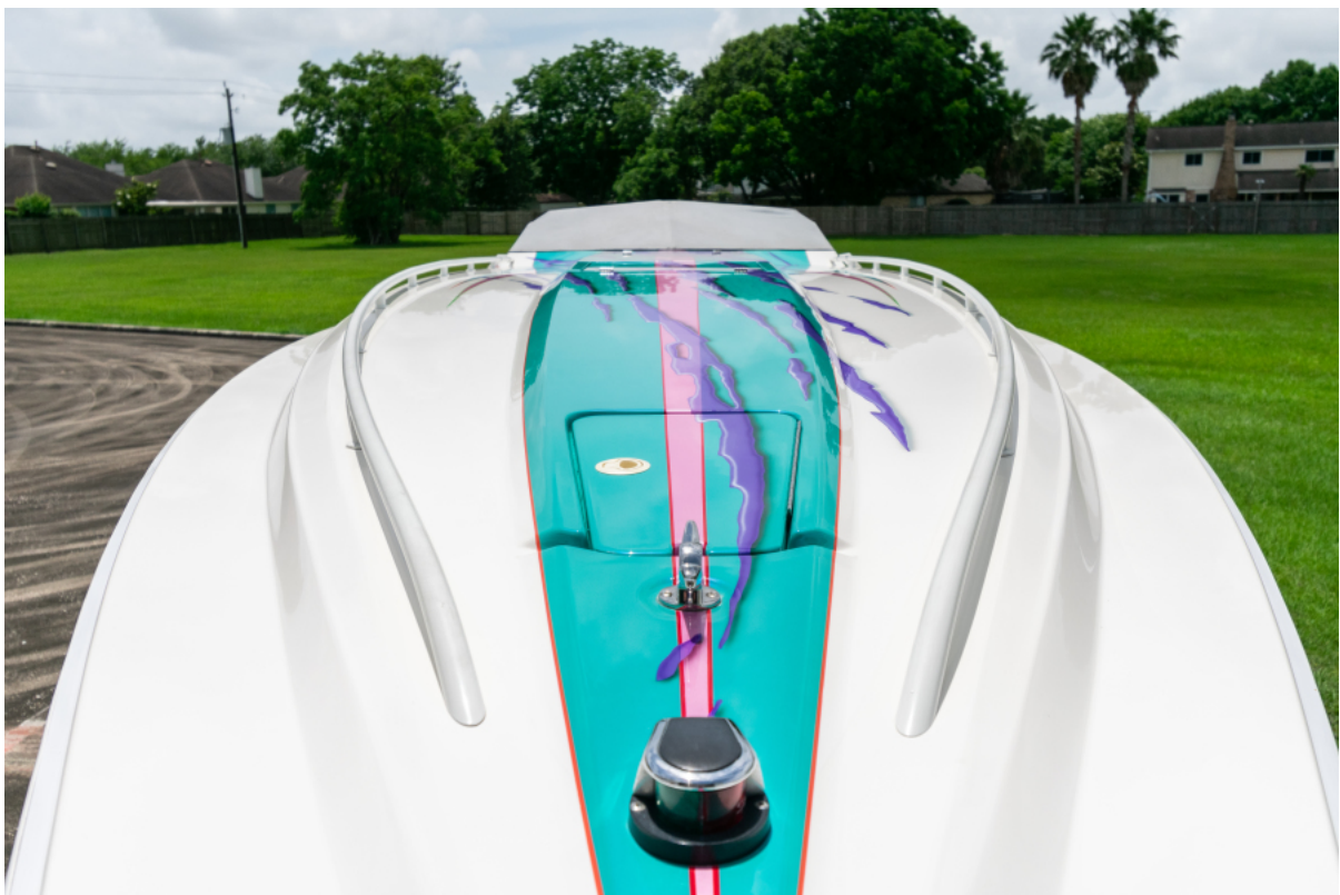
Fountain 42 Lightning 1997