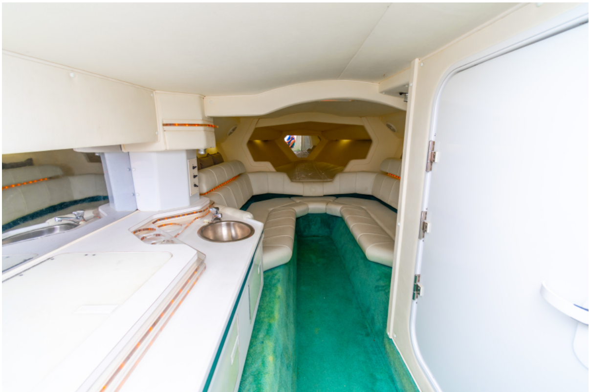
Fountain 42 Lightening 1997