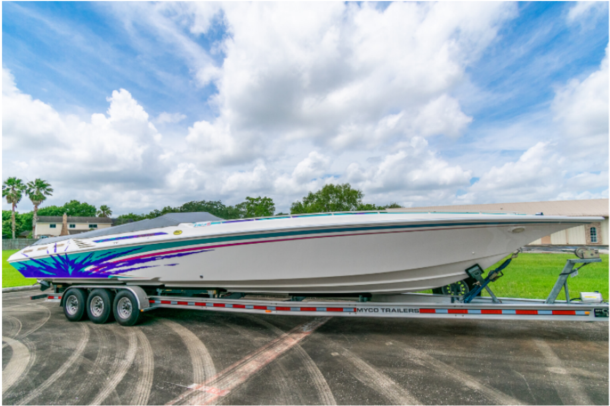
Fountain 42 Lightening 1997