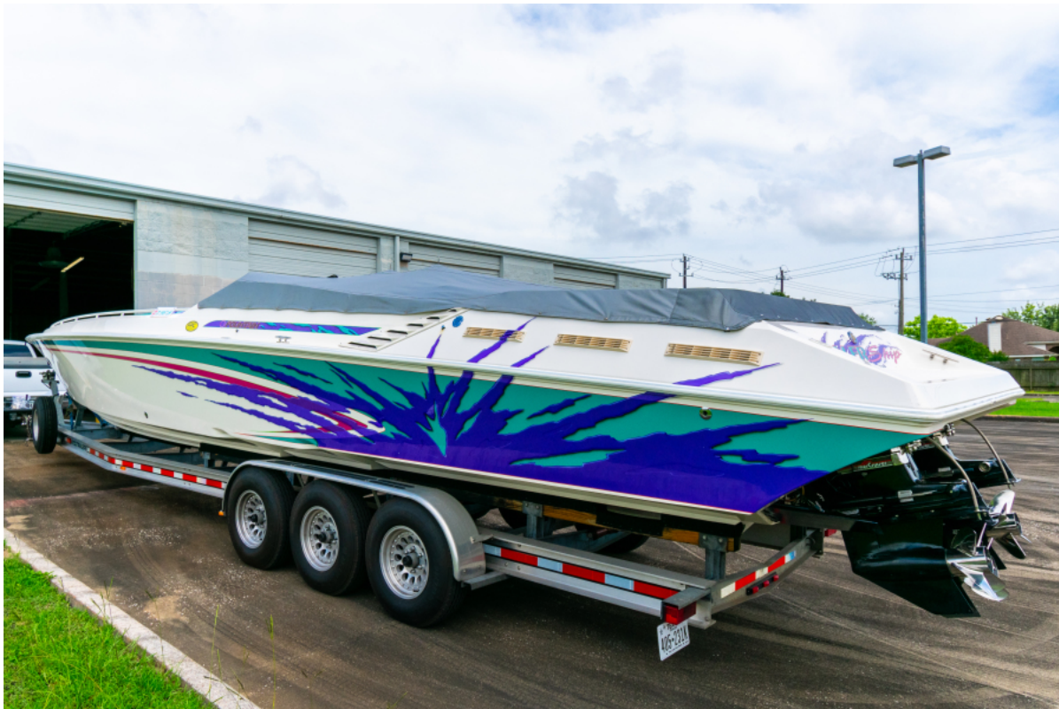
Fountain 42 Lightening 1997