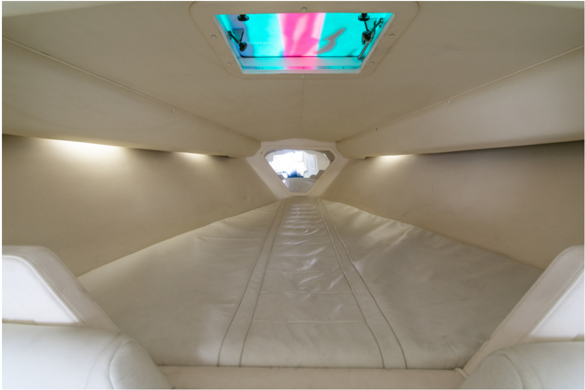
Fountain 42 Lightening 1997