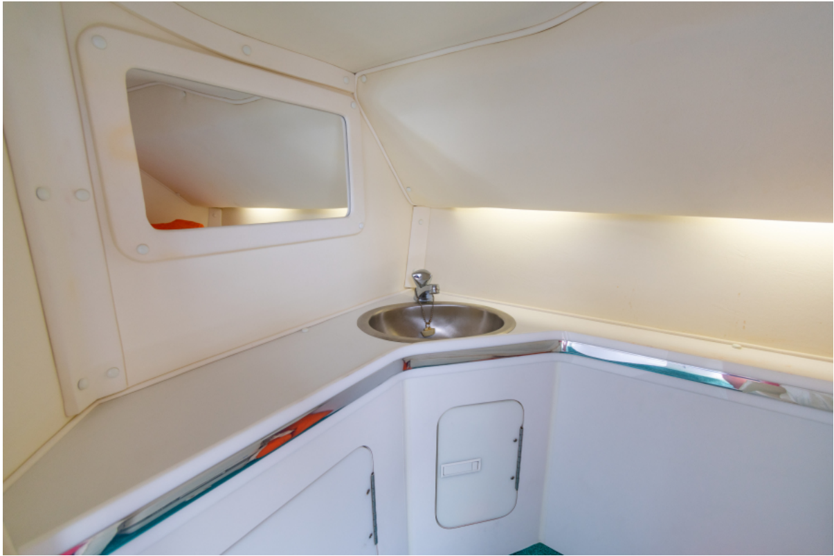
Fountain 42 Lightening 1997