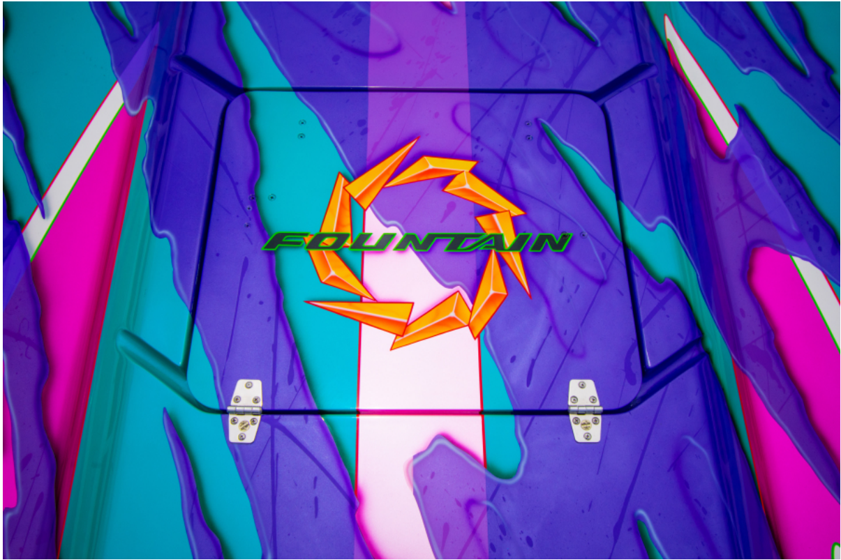
Fountain 42 Lightening 1997