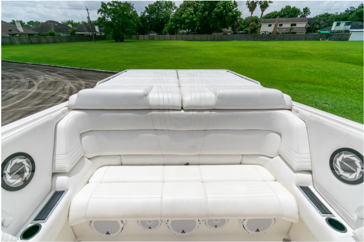
Fountain 42 Lightening 1997