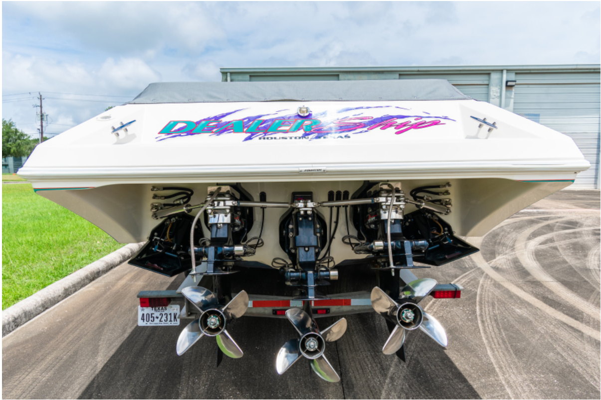
Fountain 42 Lightening 1997