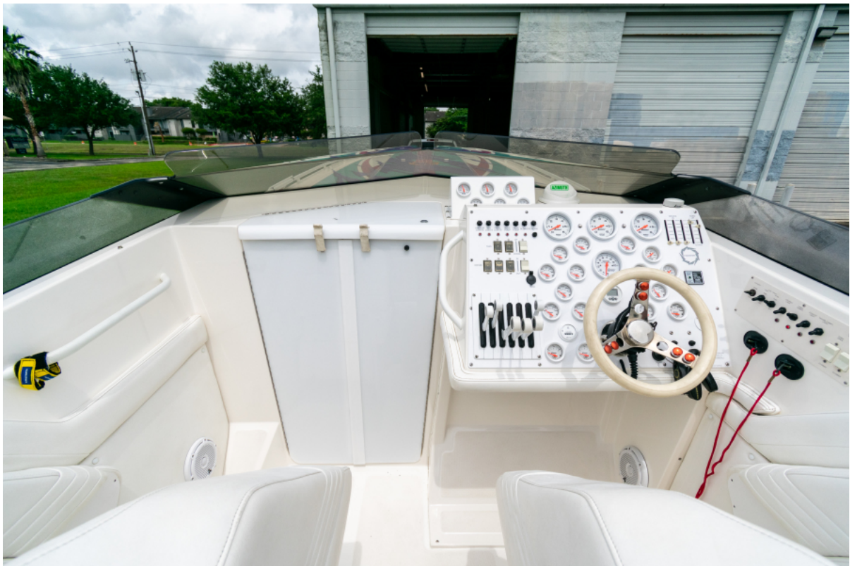
Fountain 42 Lightening 1997