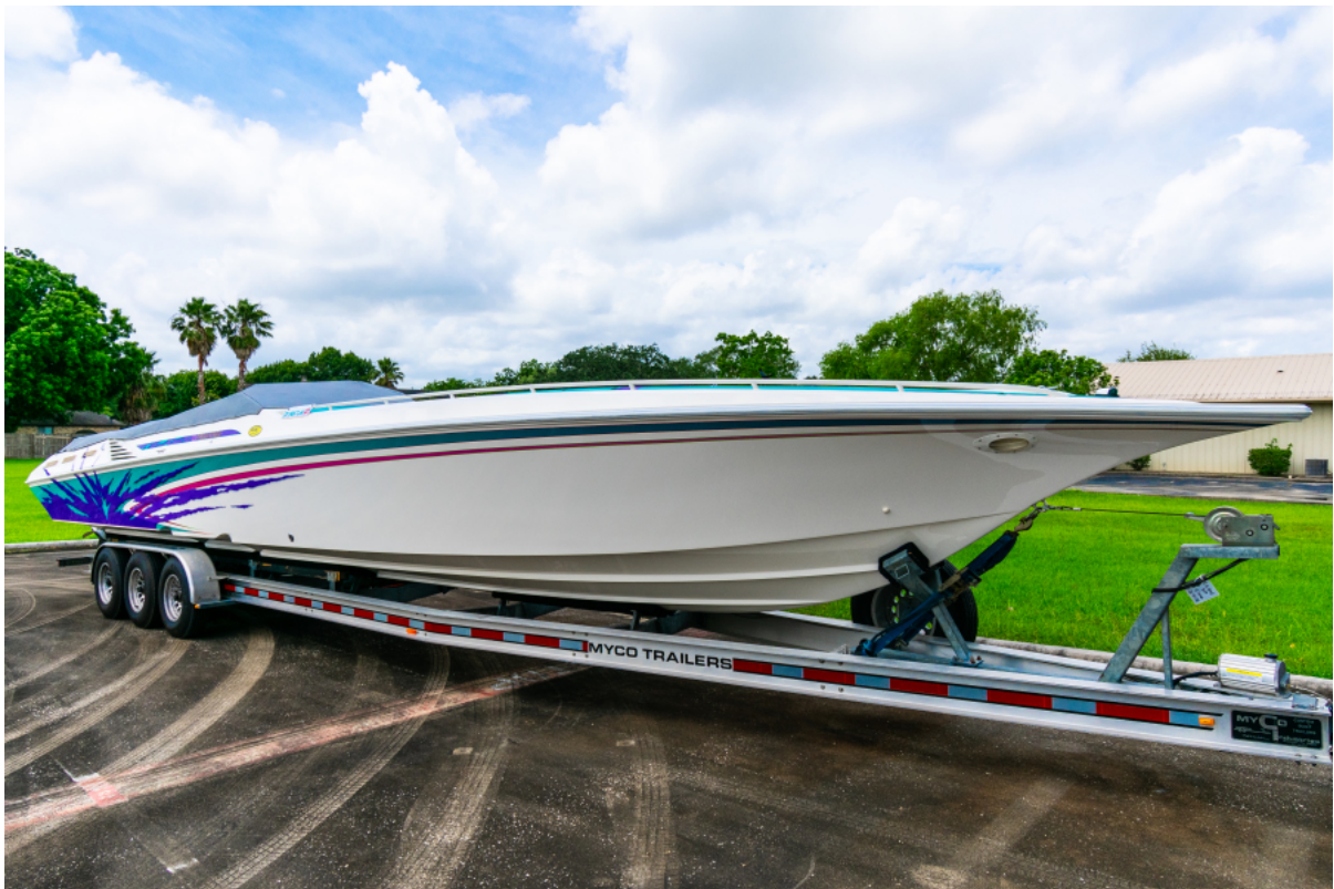
Fountain 42 Lightening 1997