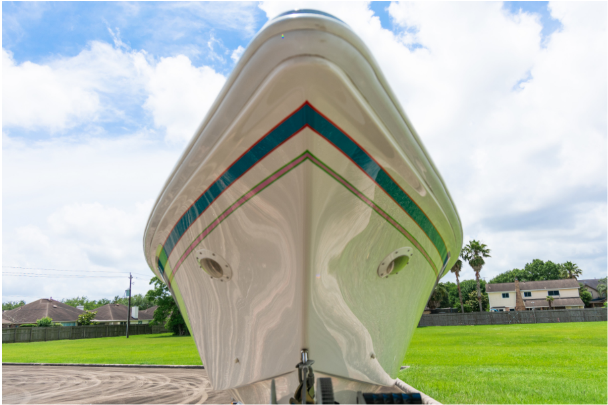
Fountain 42 Lightning 1997