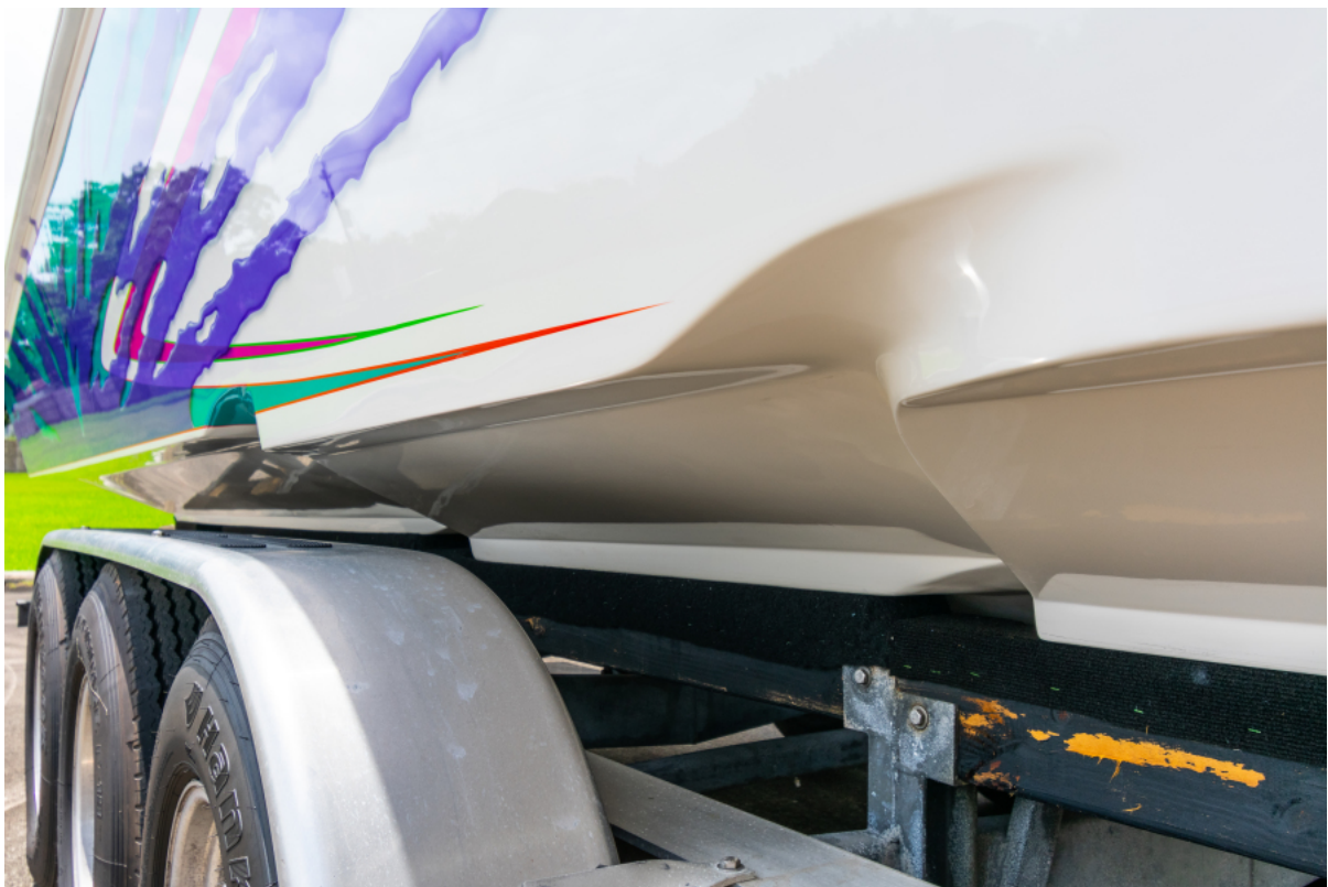
Fountain 42 Lightening 1997