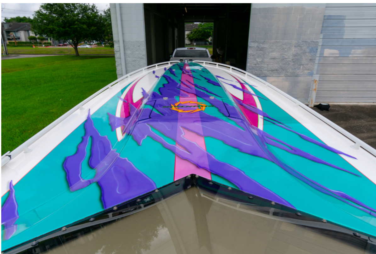
Fountain 42 Lightening 1997