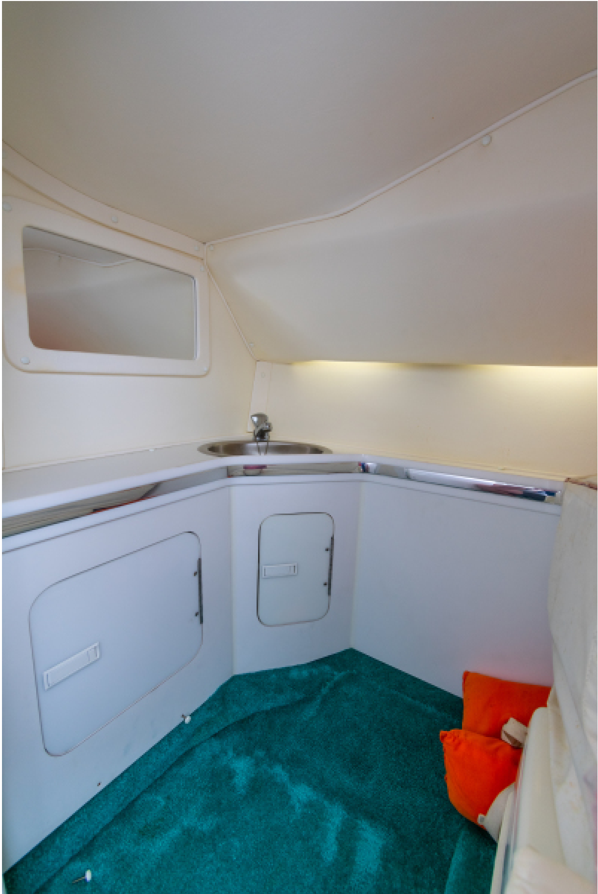
Fountain 42 Lightening 1997