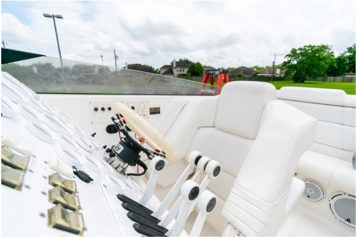
Fountain 42 Lightening 1997