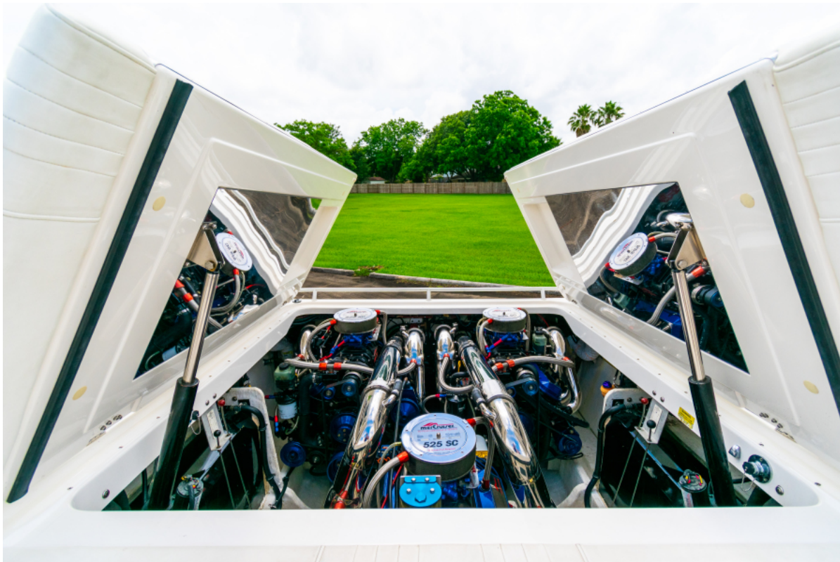
Fountain 42 Lightening 1997