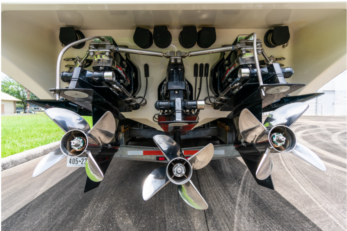
Fountain 42 Lightening 1997