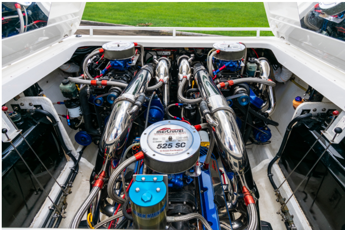
Fountain 42 Lightening 1997