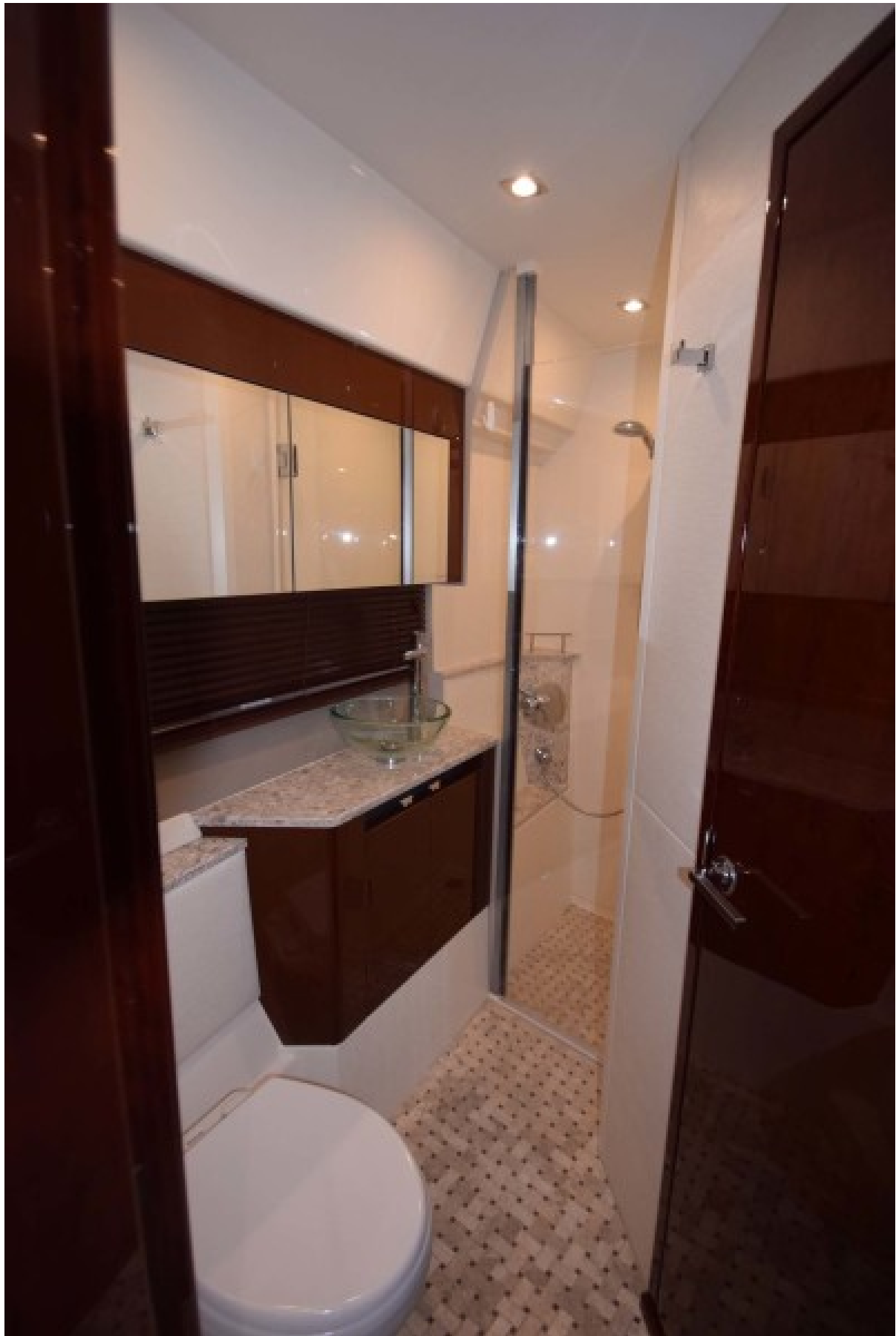
VIP En-Suite Head And Shower Stall