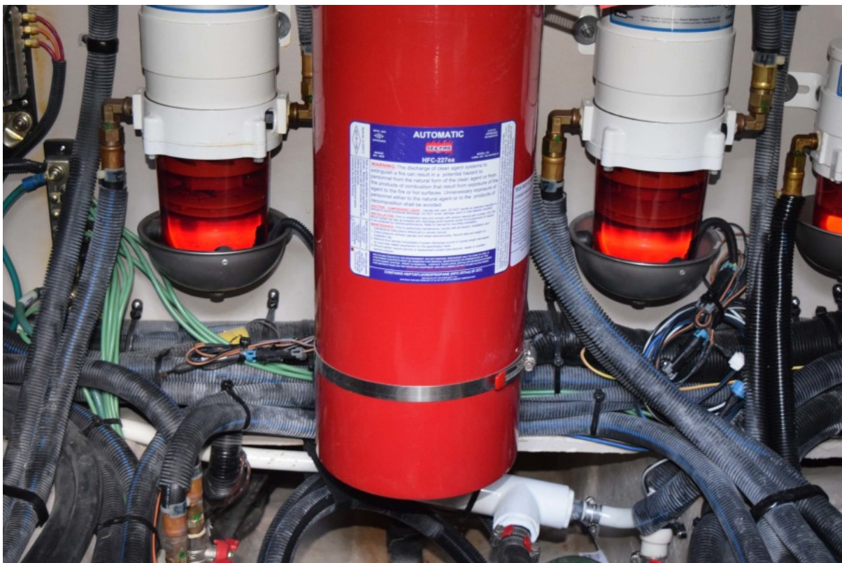
Sea Fire and Fuel Filters