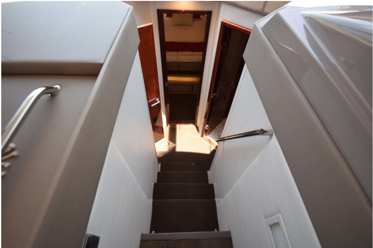
View To Below Deck And Cabins