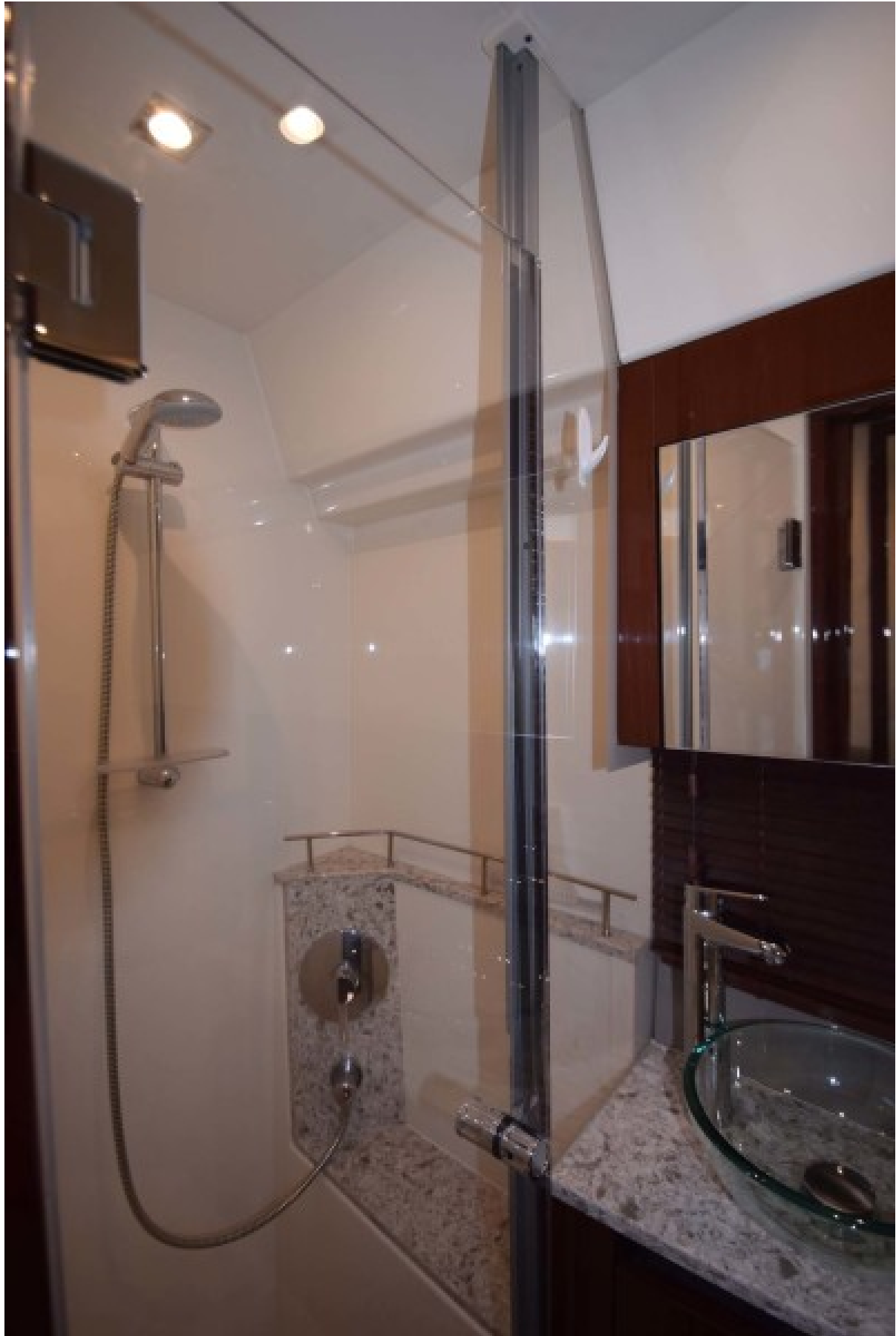
Master Head And Shower