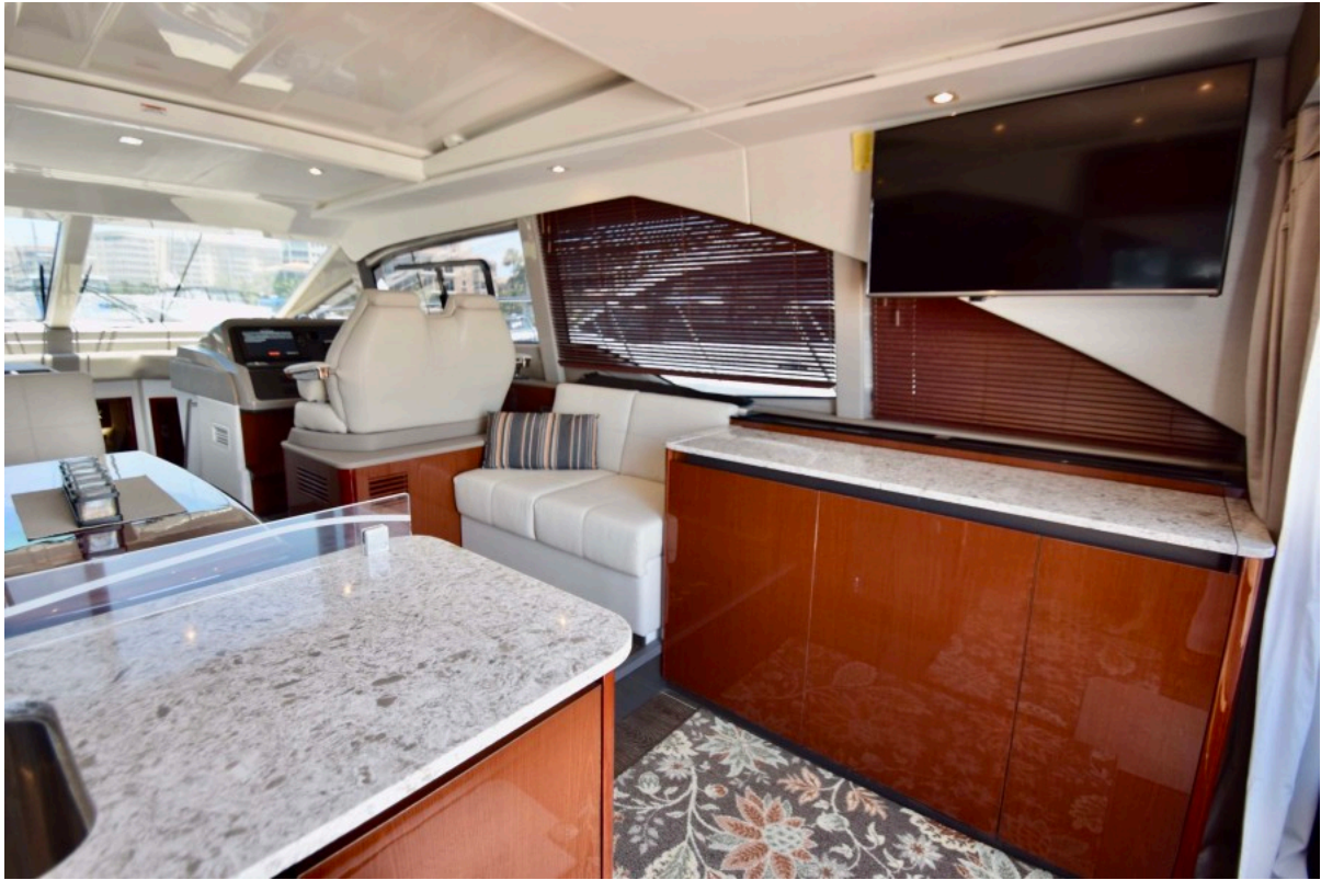
Salon View To Helm And Starboard Side