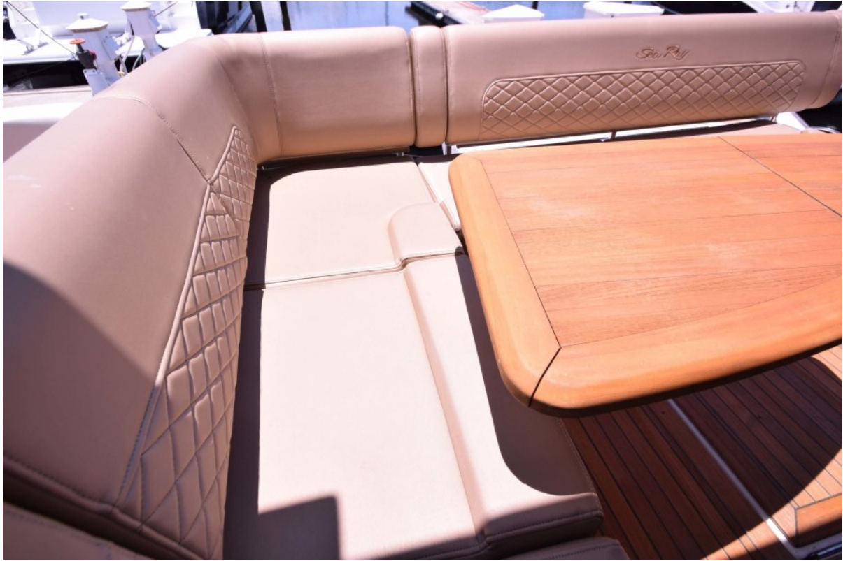
Aft Seating Detail