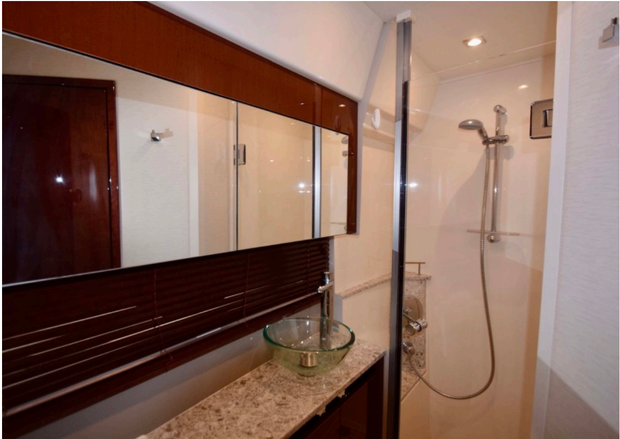
VIP Head and Vanity Detail