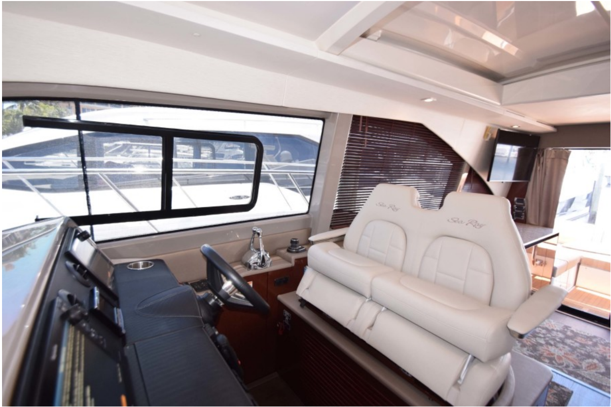
Helm Seating Overview