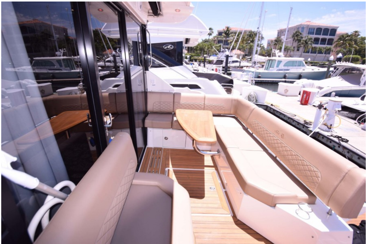
Aft Seating Without Covers From Port Side