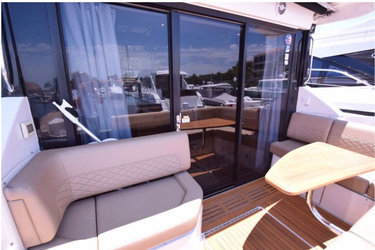
View Towards Sliding Glass Doors Aft Deck