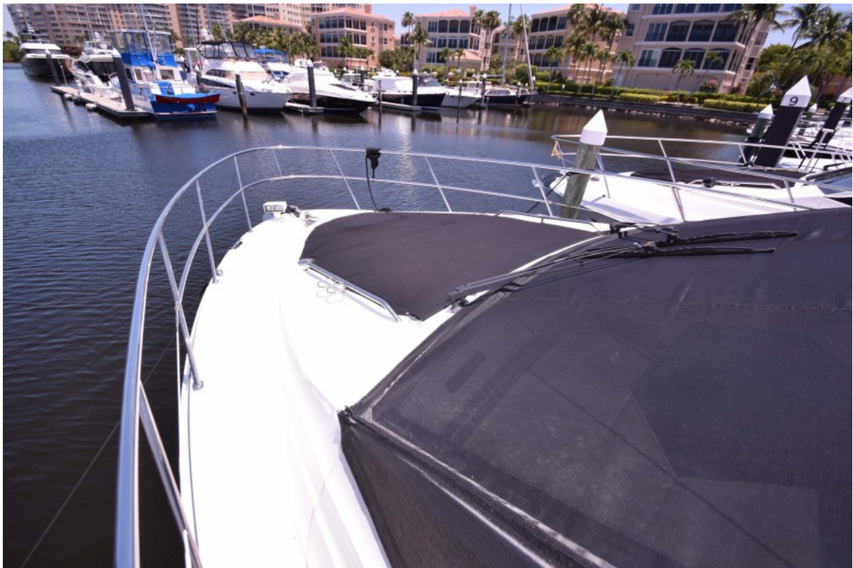
Bow With Windshield Covers And Bunny Pads And Covers