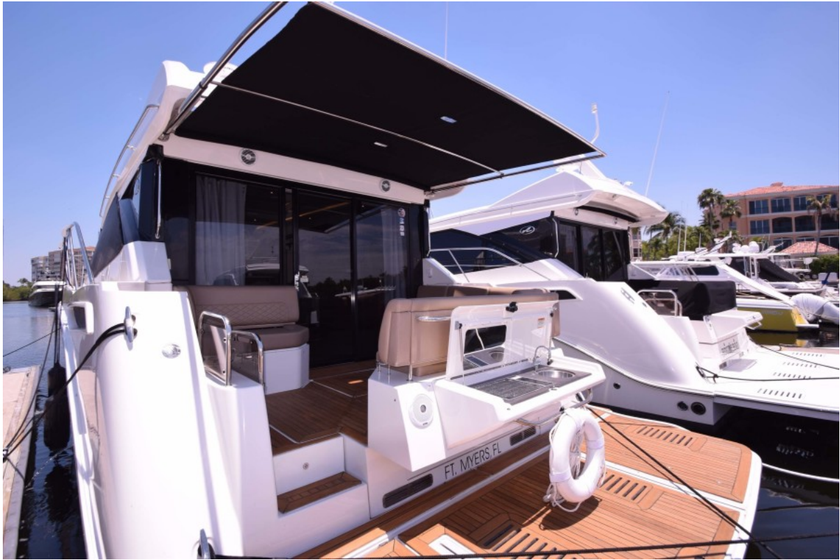
Aft Seating With Sunshade