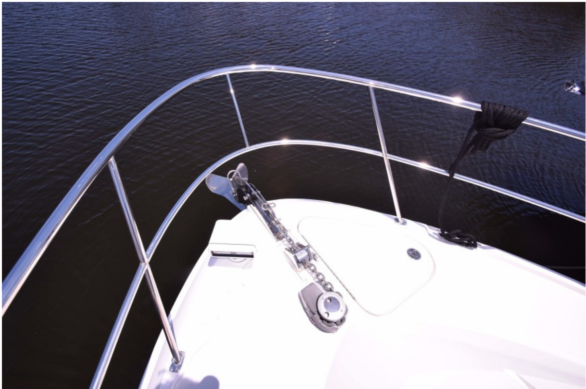
Windlass and Bow