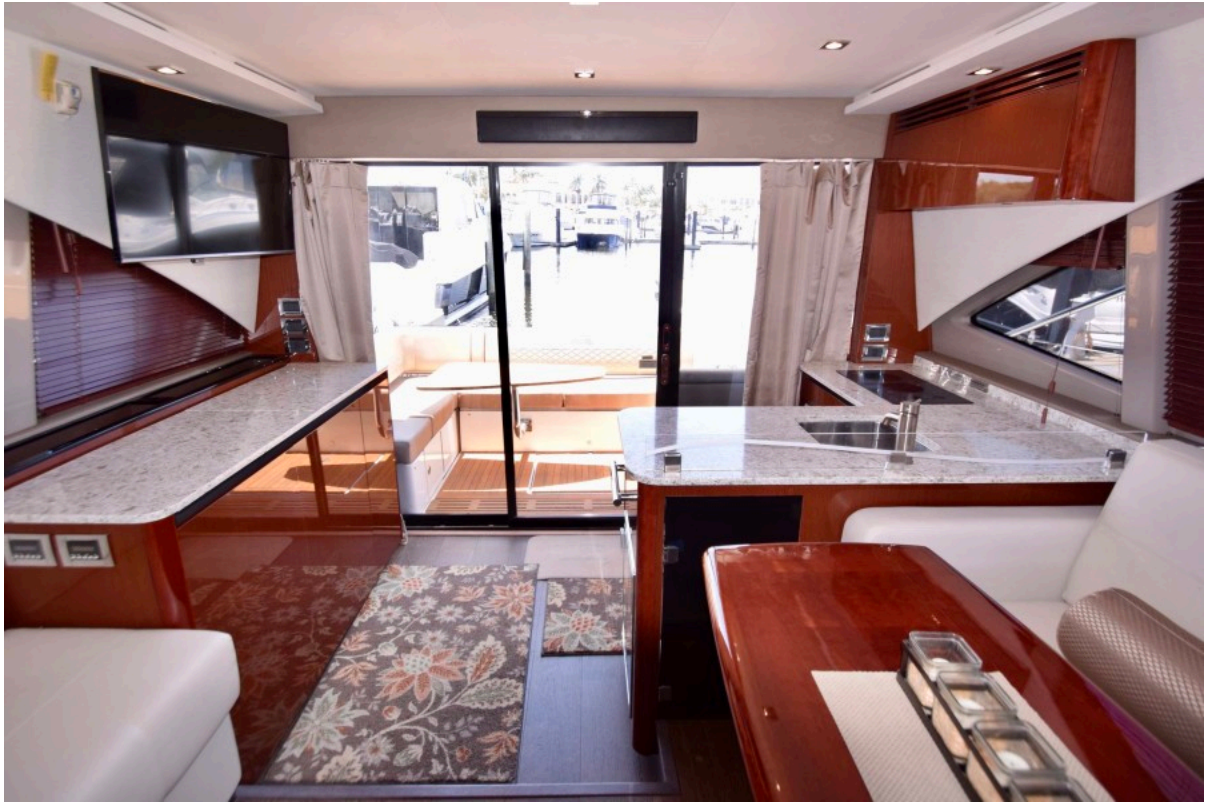
View To Sliding Glass Doors From Mid Ship Salon