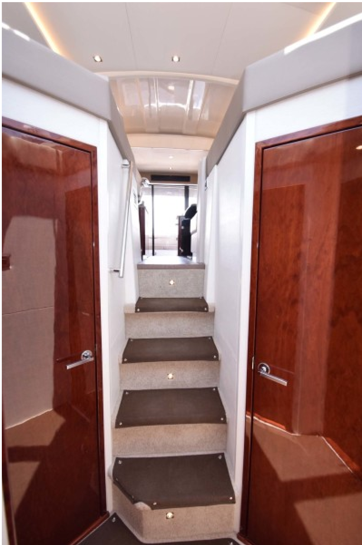
Stairs To Upper Salon, Helm And Galley