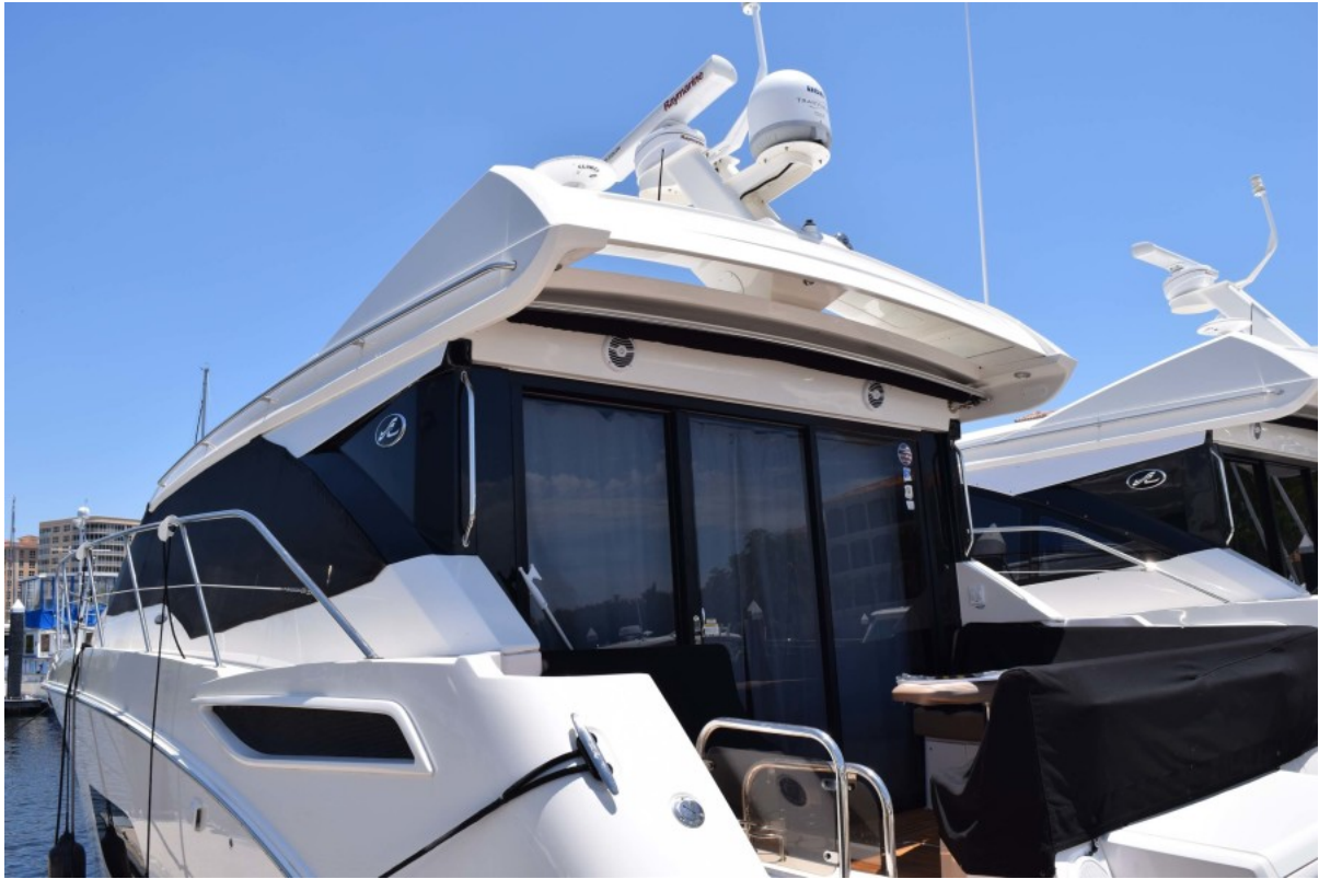
Stern View Closer To Sliding Glass Doors