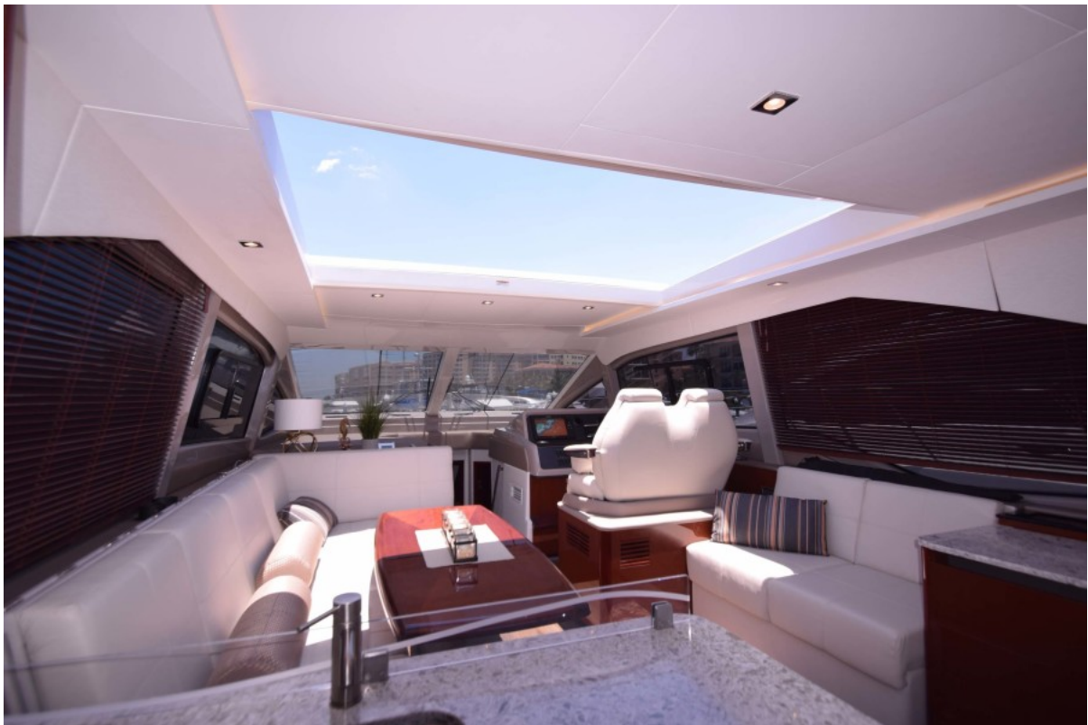
Salon With Retractable Sunroof Open