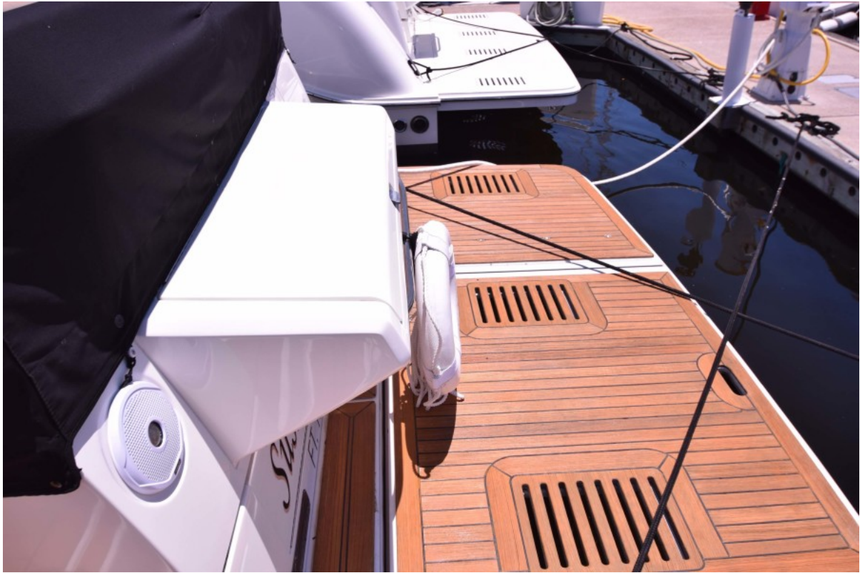
Teak Platform View From Dock