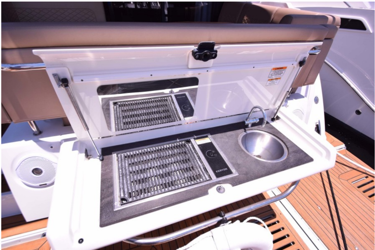
Wet Bar and Grill On Aft Deck Swim Platform