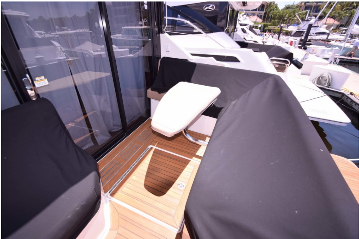
Aft Deck With Covers