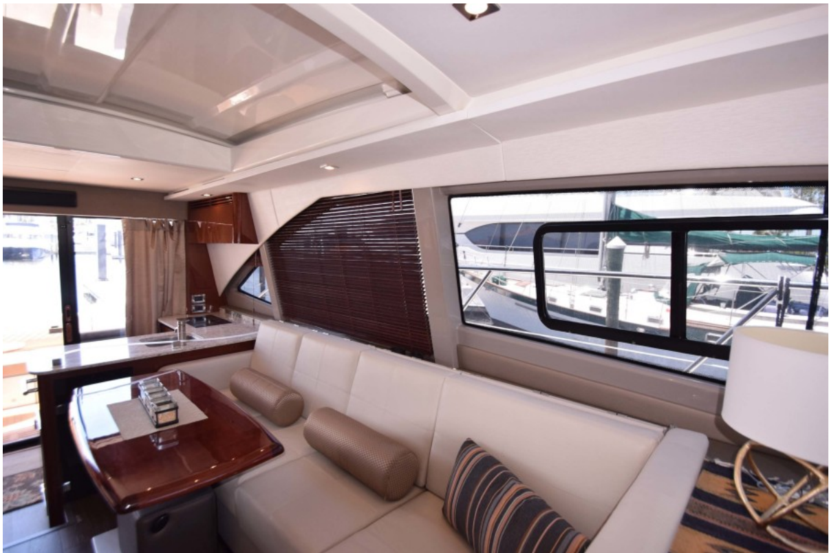
Salon Sofa Seating To Port