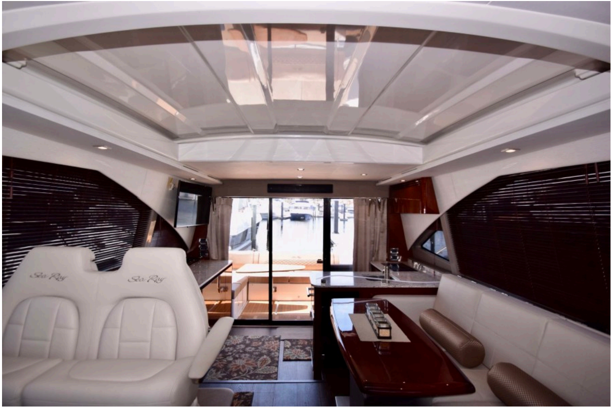
Salon To Sliding Glass Doors With Helm Seating