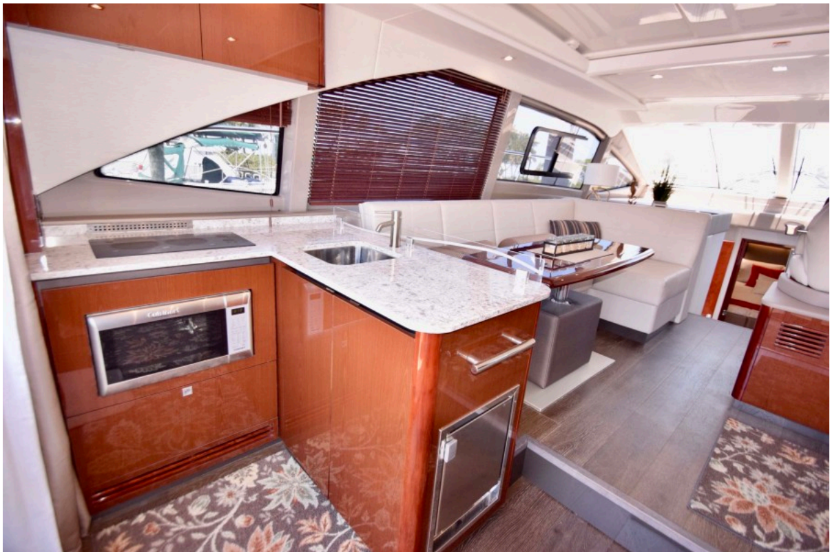
Galley Aft View From Sliding Glass Doors