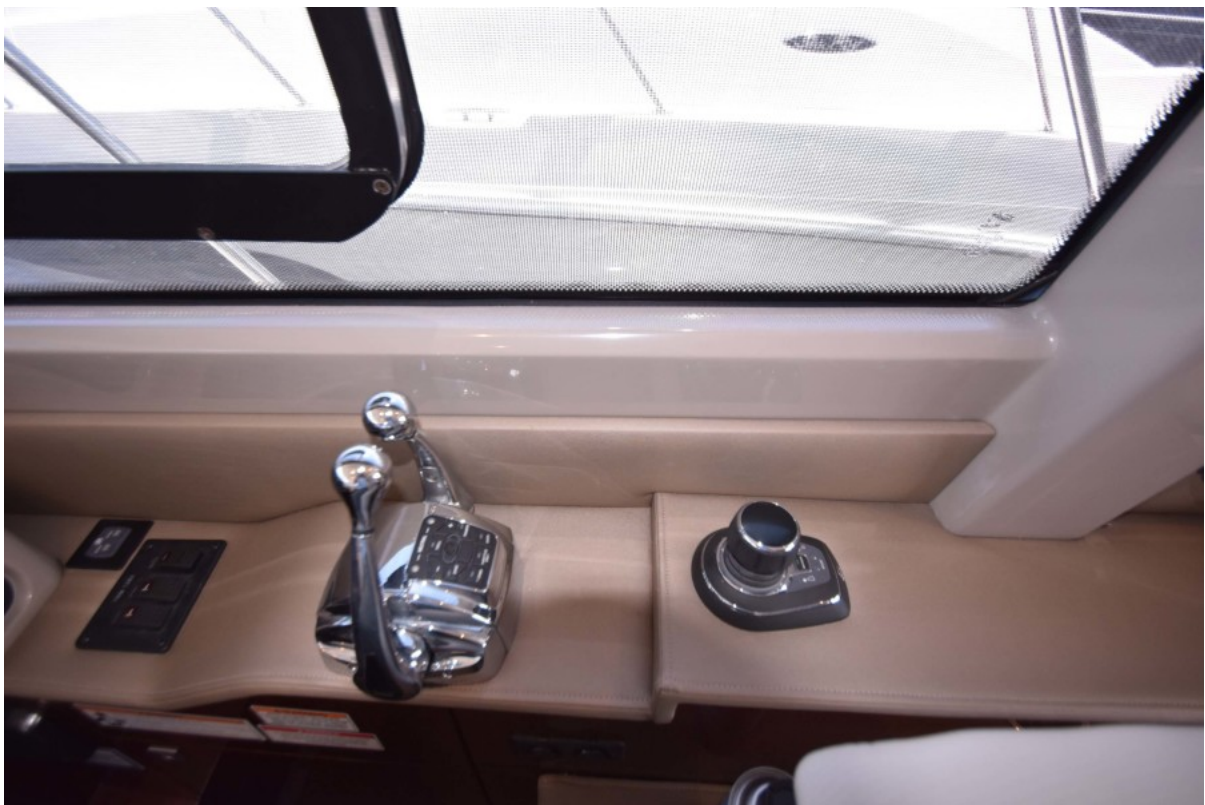
Throttle and Axis Drives