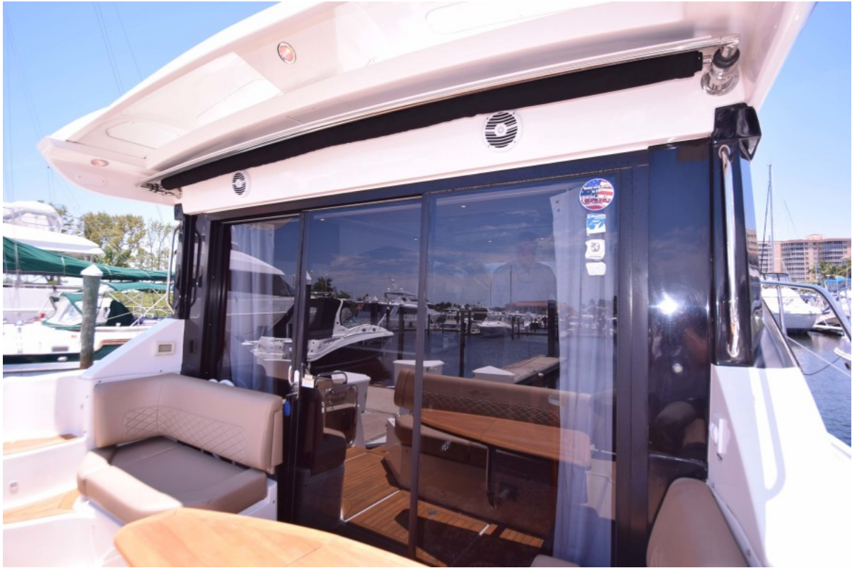
Aft Seating From Starboard Side Corner