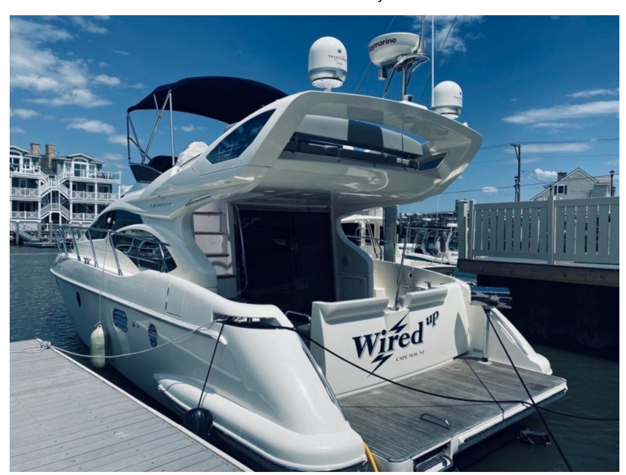
Aft Port Qtr View