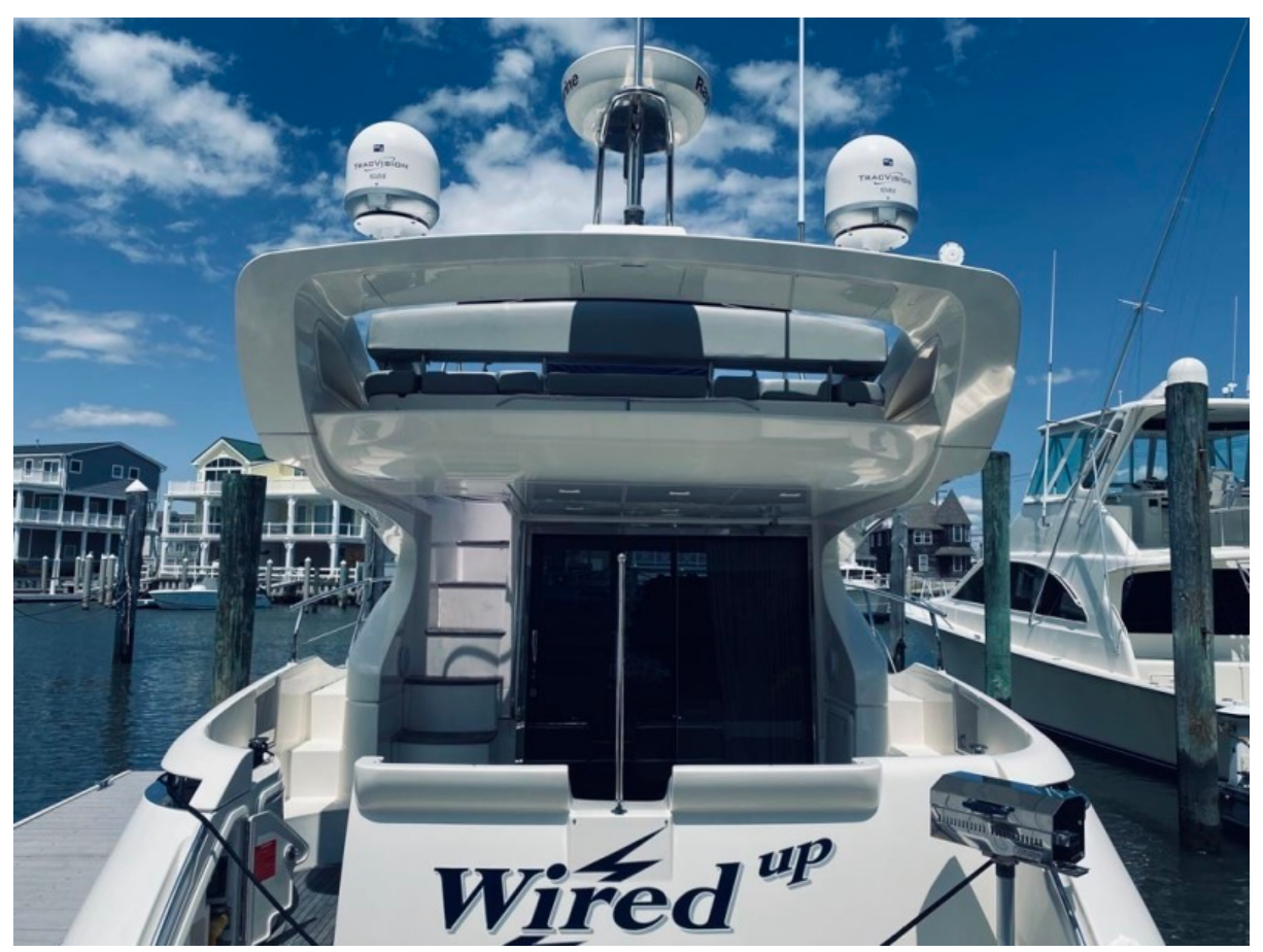
Stern View - Flybridge Radar Arch