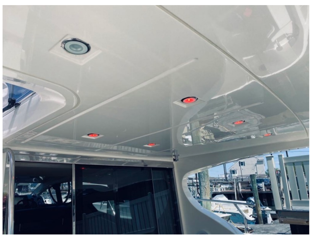
Recessed Lighting - Flybridge Overhang