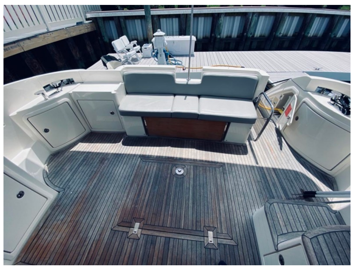
Cockpit Aft Seating