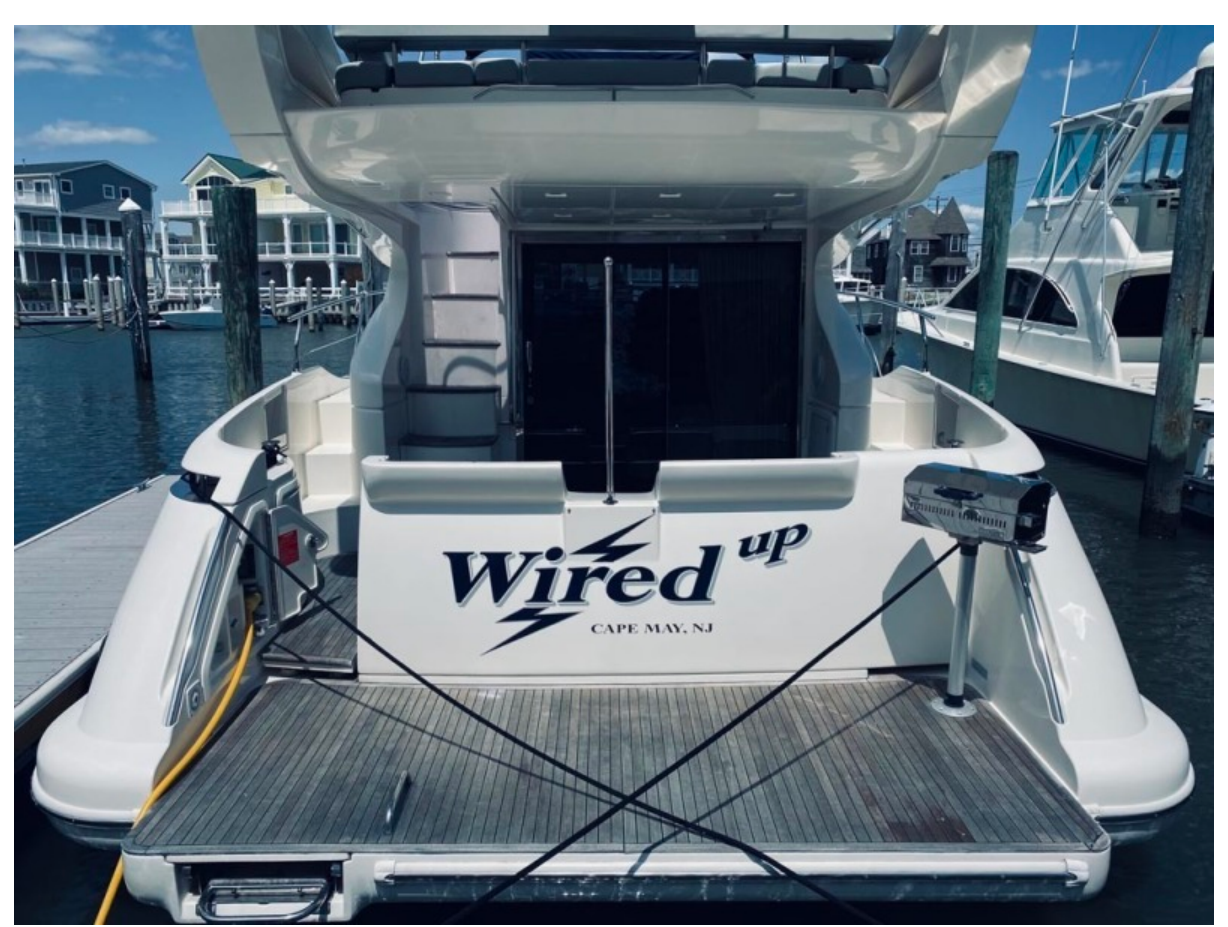
Stern, Swim Platform