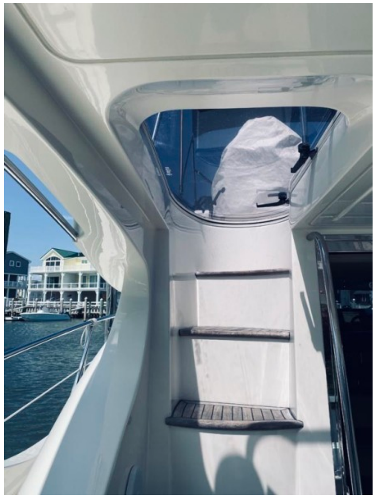
Cockpit to Flybridge Stairs