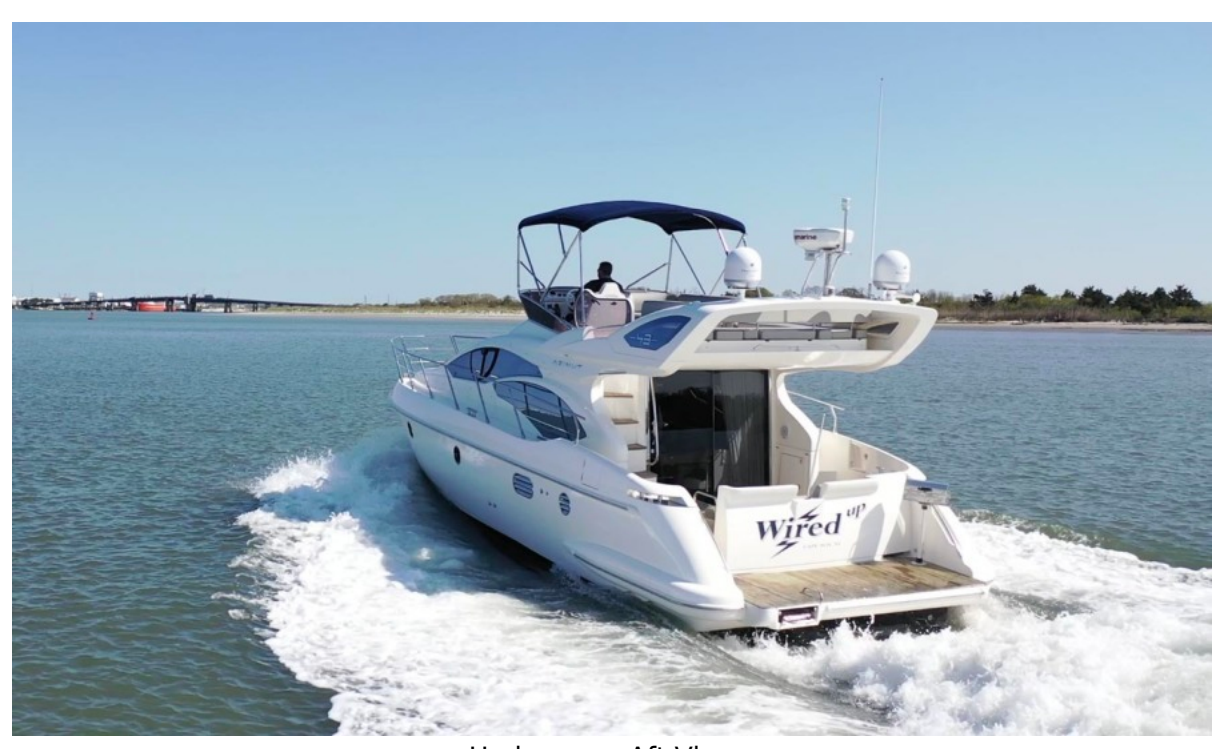
Underway - Aft View