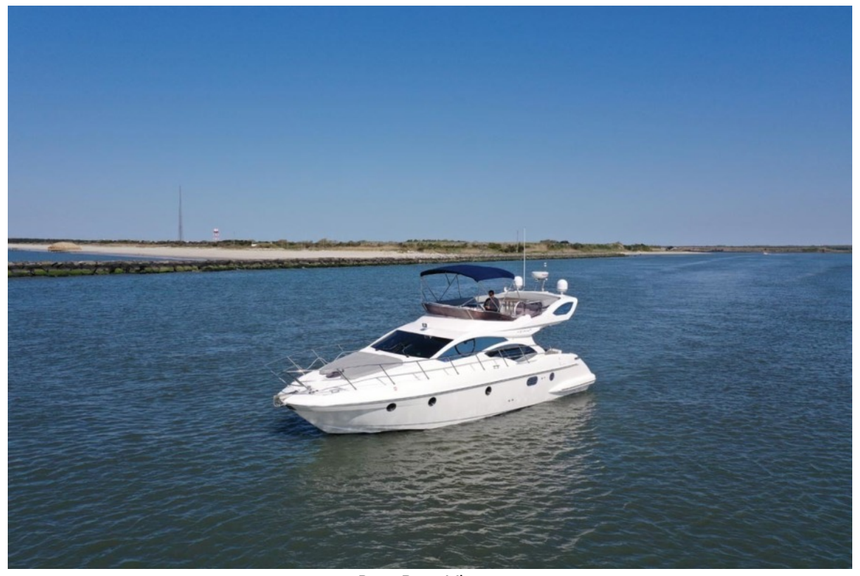
Port Bow View