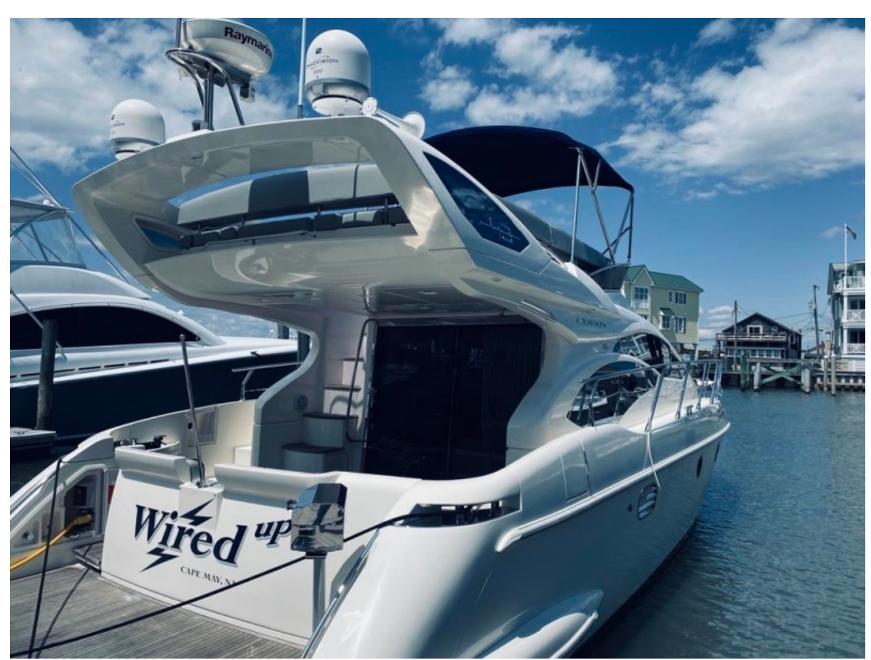
Aft Starboard Qtr View