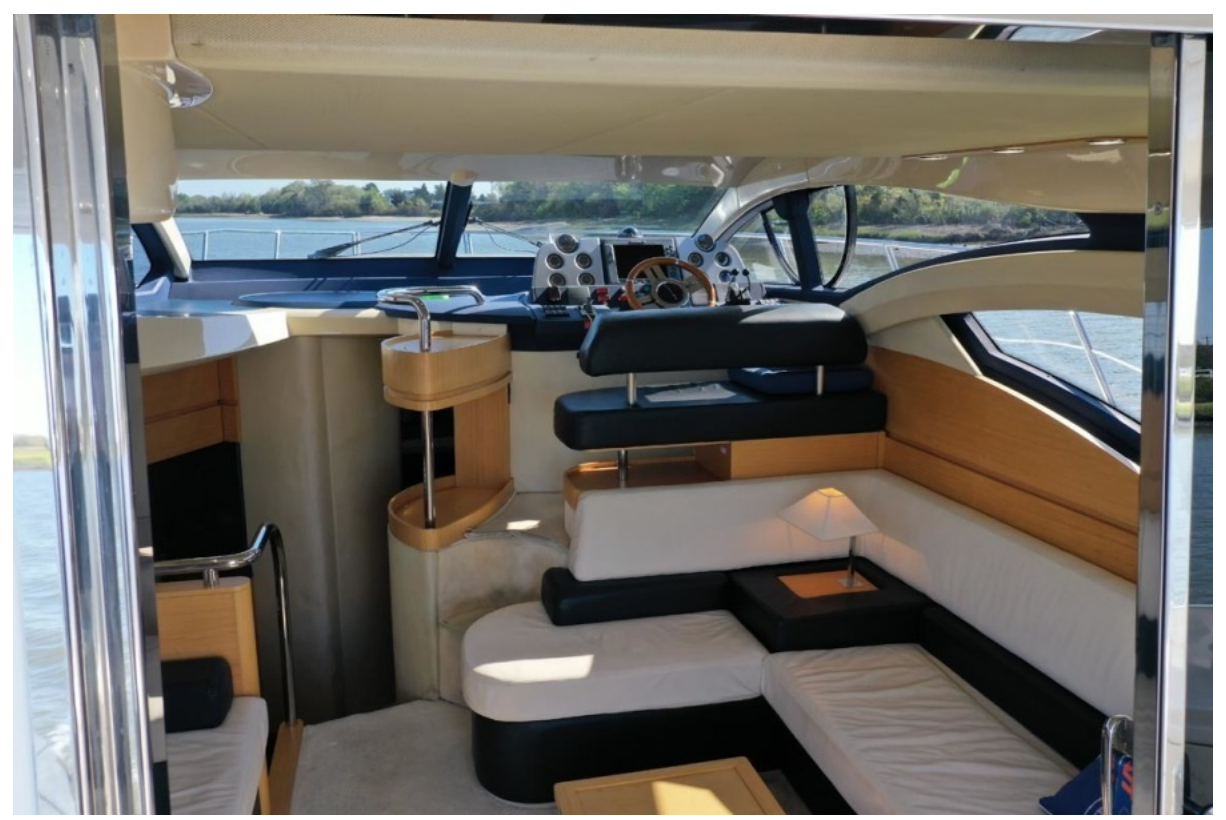
alon, Lower Helm