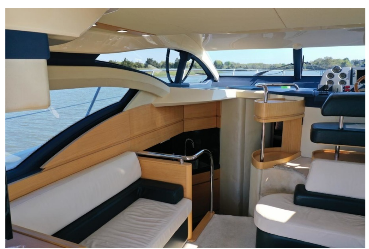
Salon Forward Portside