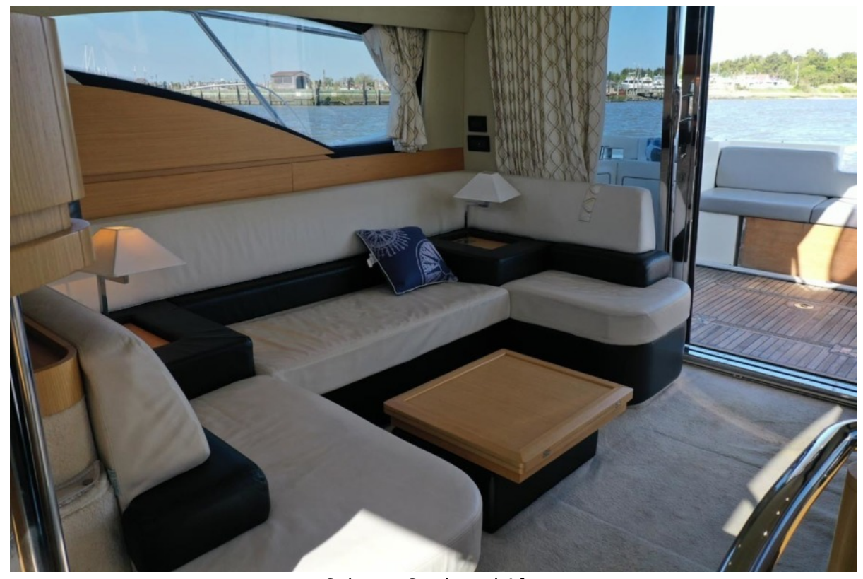
Salon to Starboard Aft