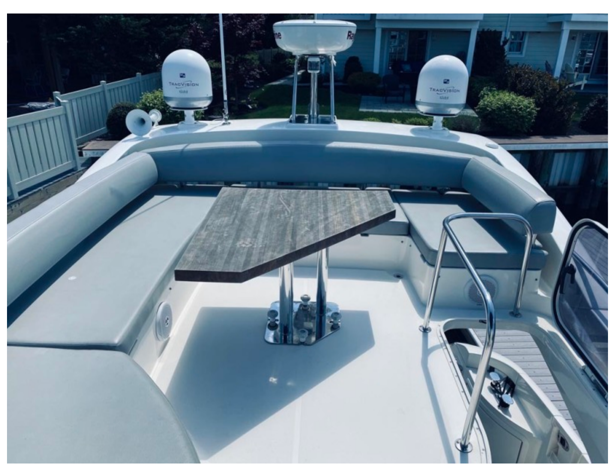
Flybridge Seating And Table