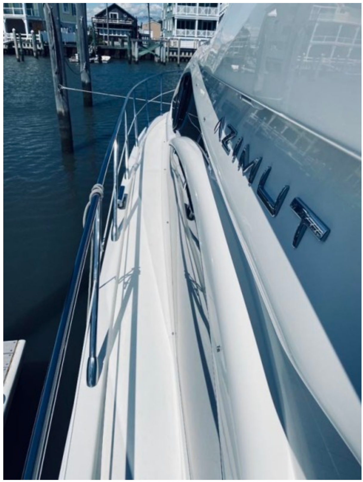
Port Side Deck Forward