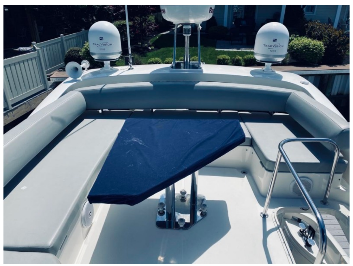
Flybridge Table Covered