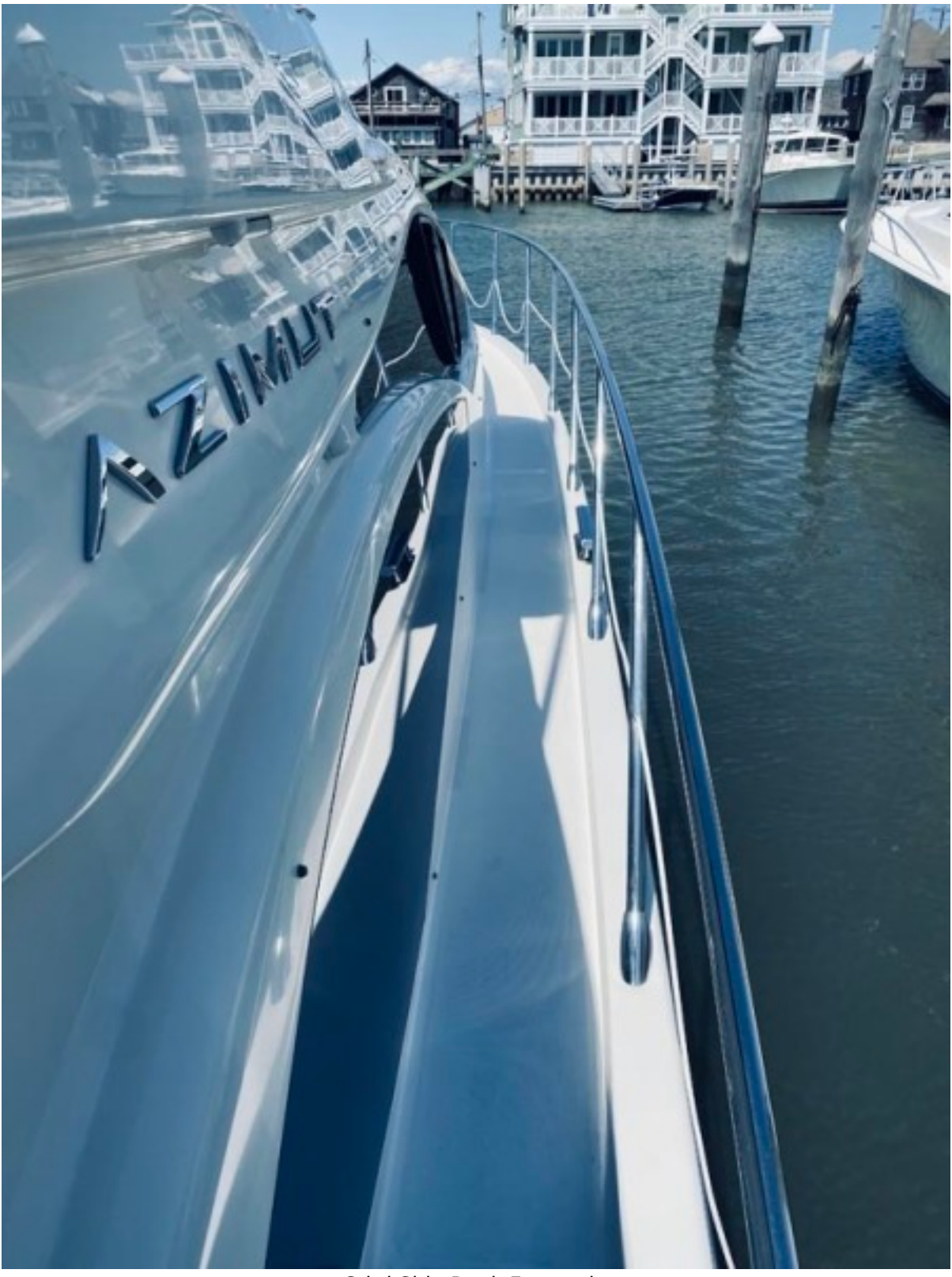
Stbd Side Deck Forward