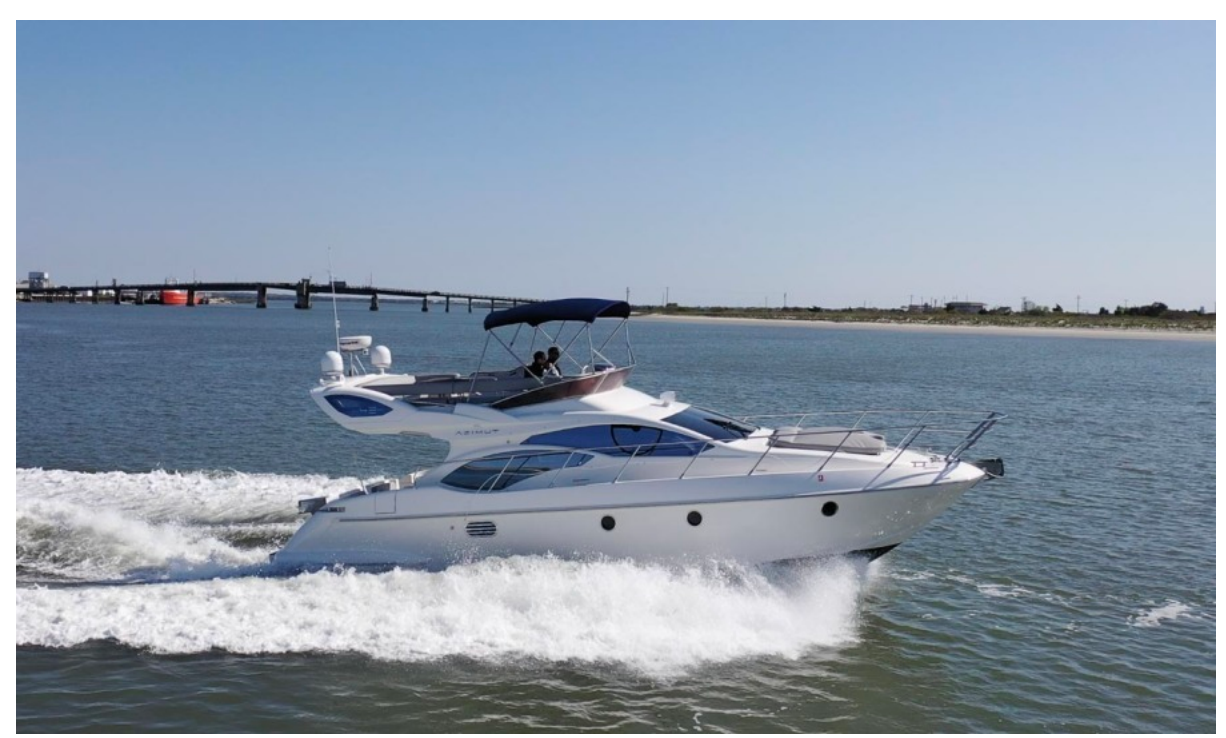
Main Profile Underway