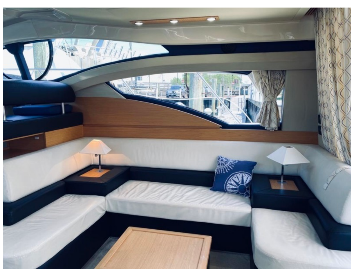
Salon Seating Starboard