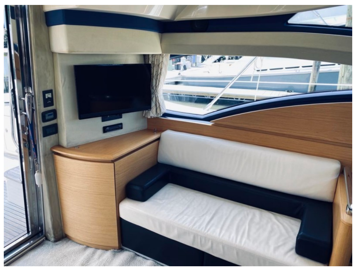
Salon TV, Aft Port