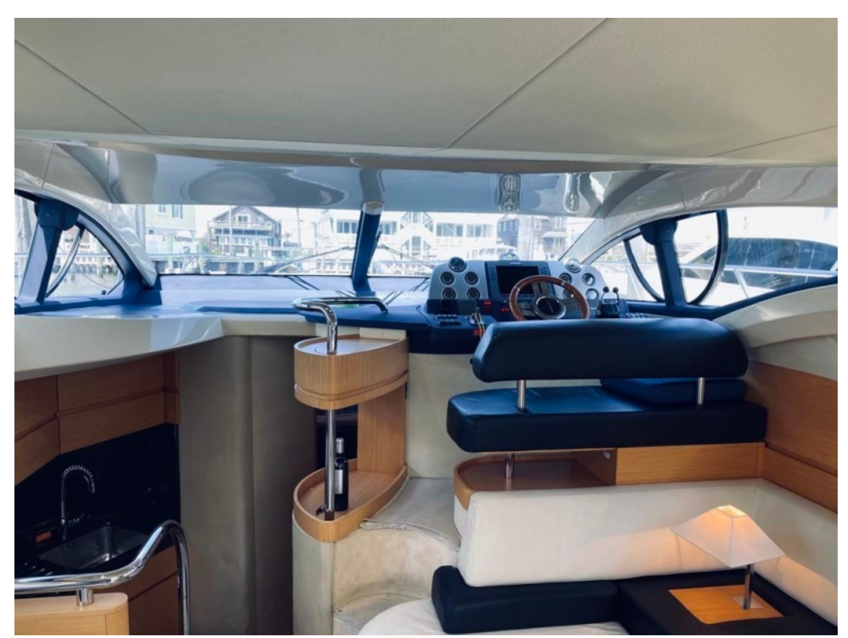
Lower Helm, Cabin Entry