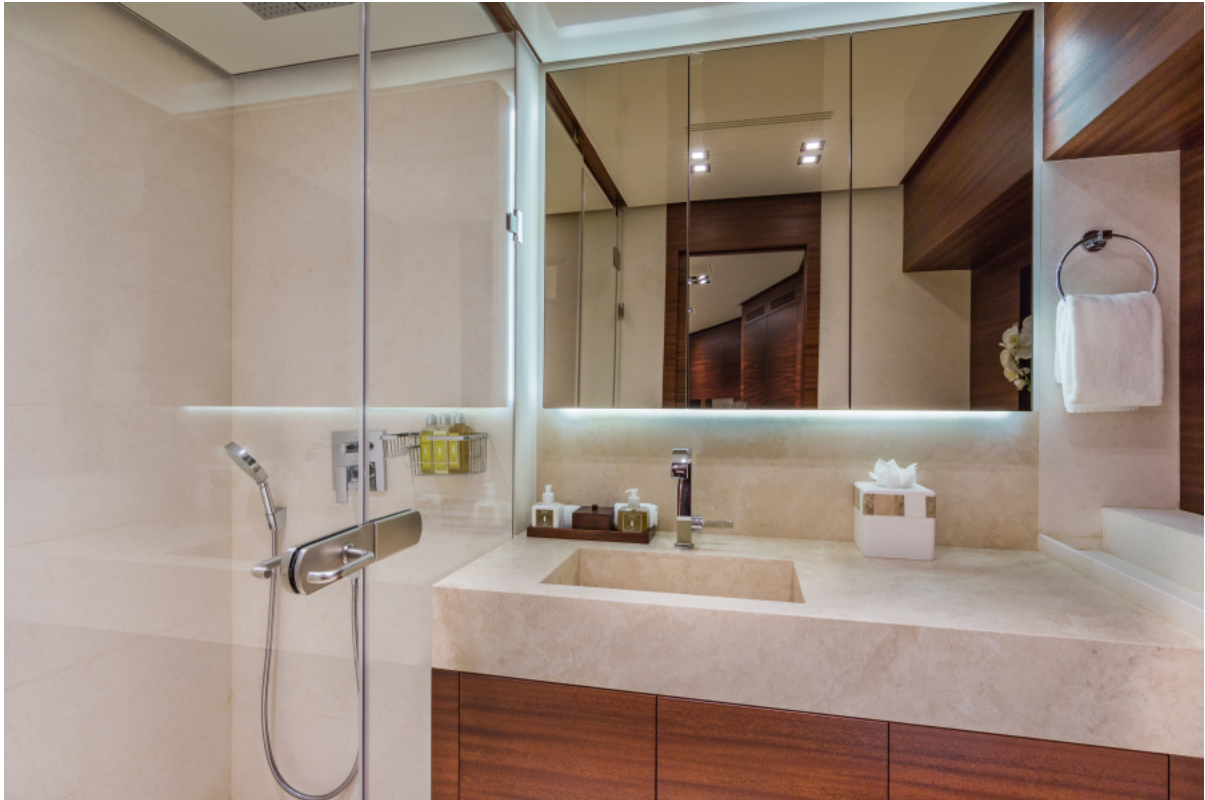
GUEST BATHROOM MONI 107' 2013 Vicem Motor Yacht