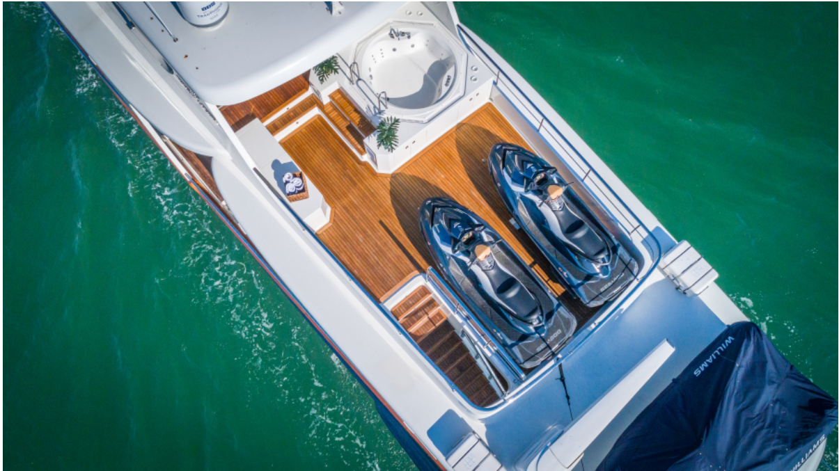
AERIAL MONI 107' 2013 Vicem Motor Yacht