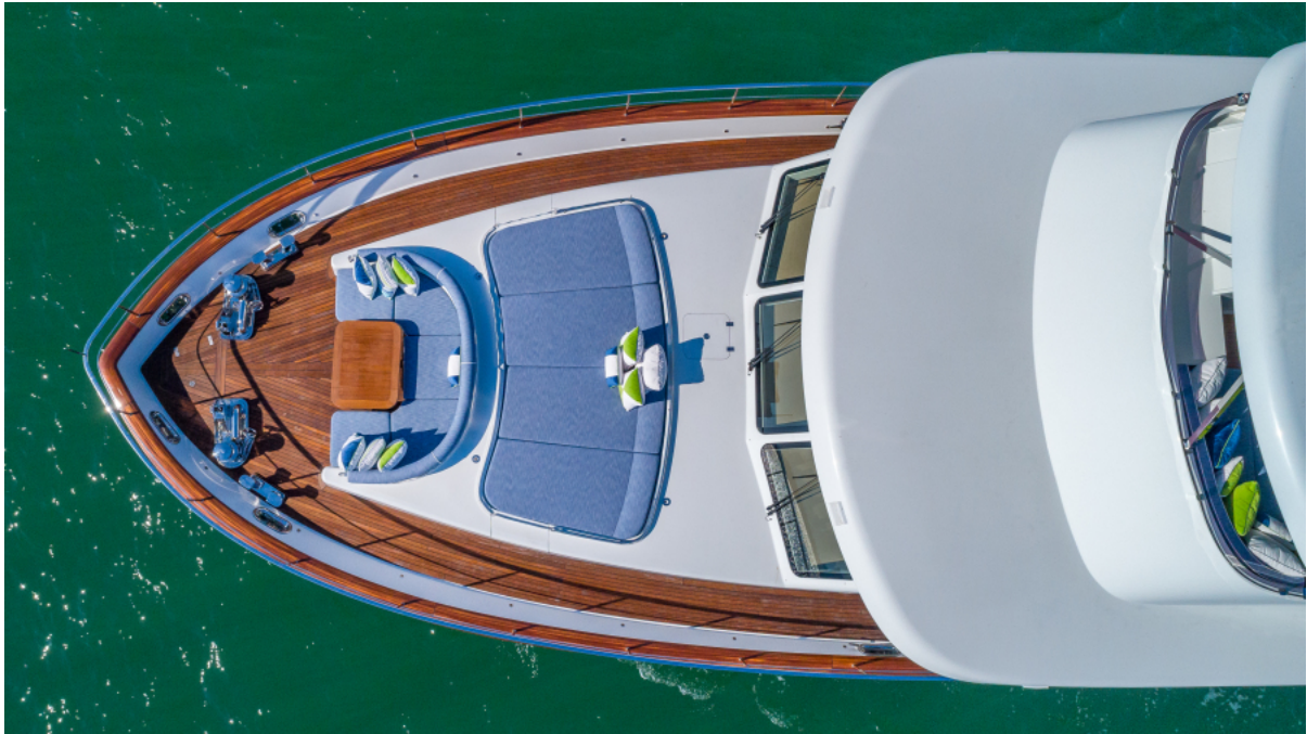
BOW MONI 107' 2013 Vicem Motor Yacht