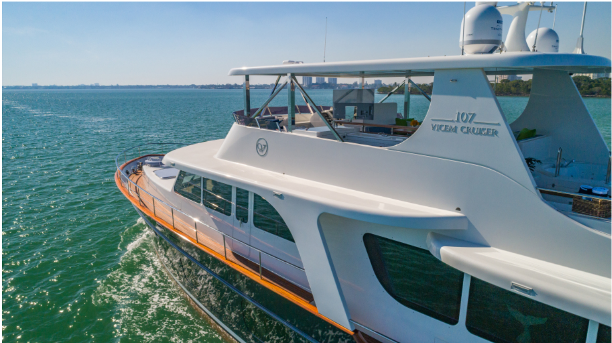
MONI 107' 2013 Vicem Motor Yacht