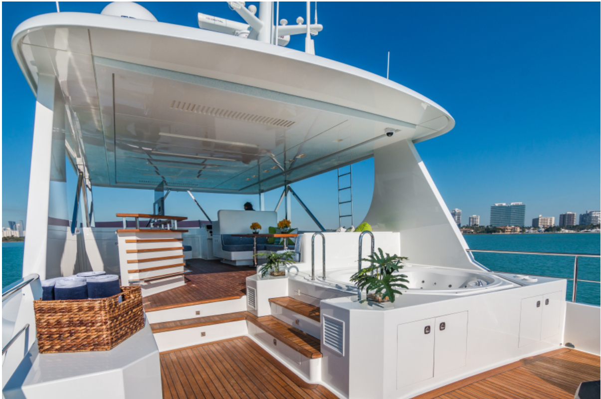
SUN DECK MONI 107' 2013 Vicem Motor Yacht