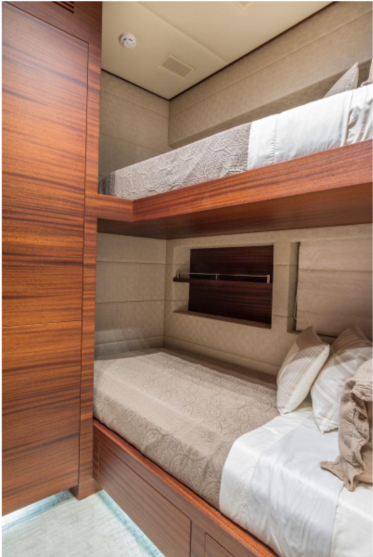
TWIN STATEROOM MONI 107' 2013 Vicem Motor Yacht