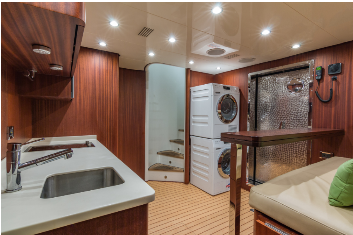
CREW MESS MONI 107' 2013 Vicem Motor Yacht