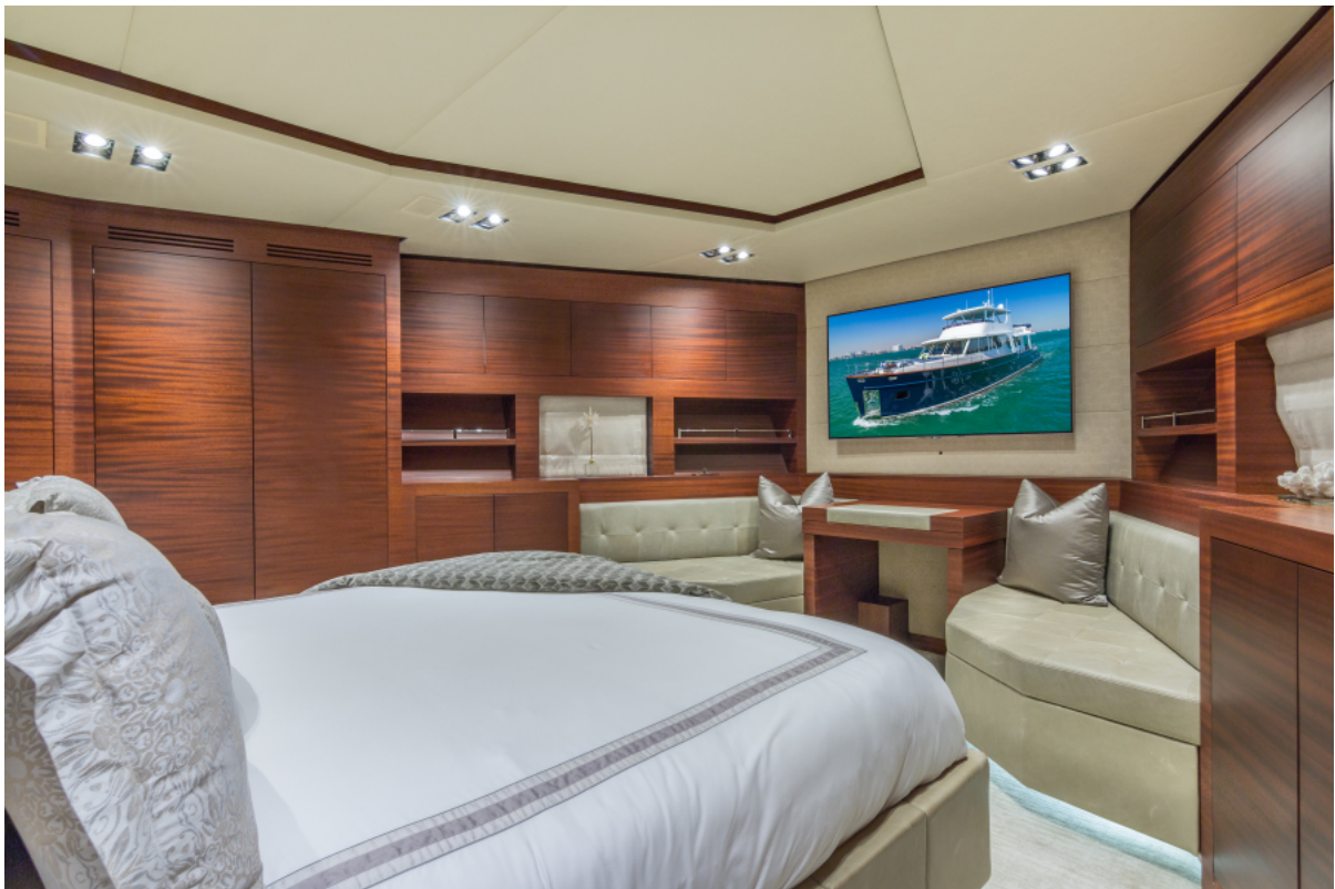
GUEST STATEROOM 3 MONI 107' 2013 Vicem Motor Yacht