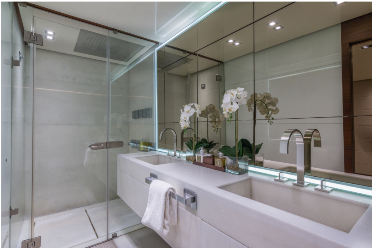
MASTER BATHROOM MONI 107' 2013 Vicem Motor Yacht