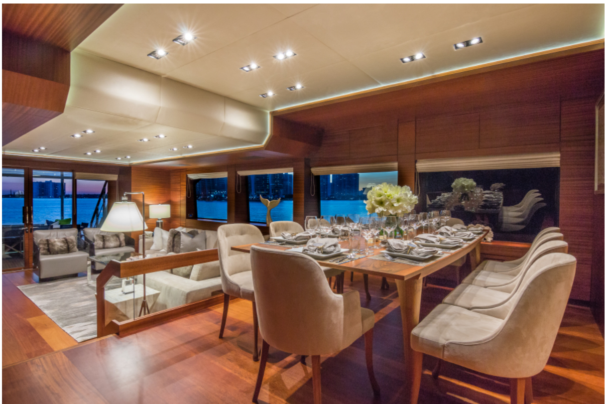
DINING MONI 107' 2013 Vicem Motor Yacht