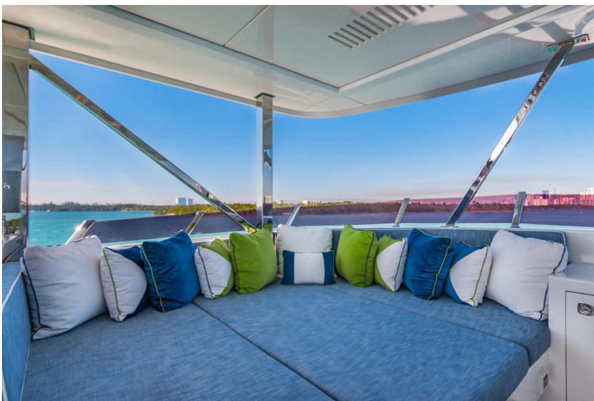
SUN DECK LOUNGING MONI 107' 2013 Vicem Motor Yacht