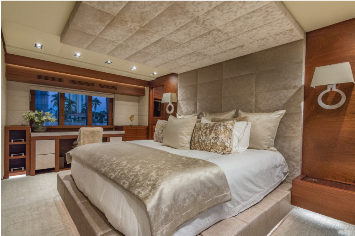
MASTER STATEROOM MONI 107' 2013 Vicem Motor Yacht