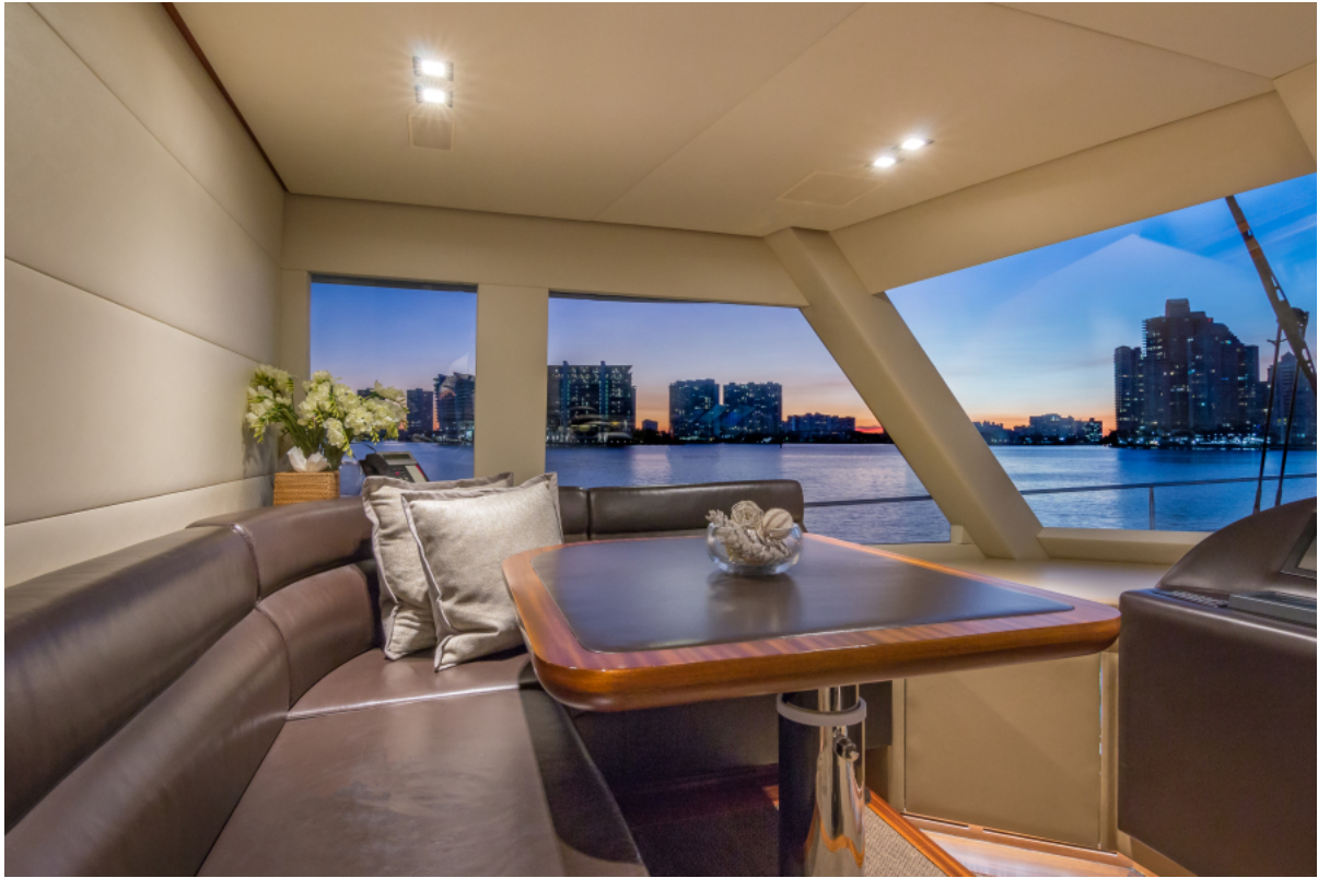
WHEELHOUSE MONI 107' 2013 Vicem Motor Yacht