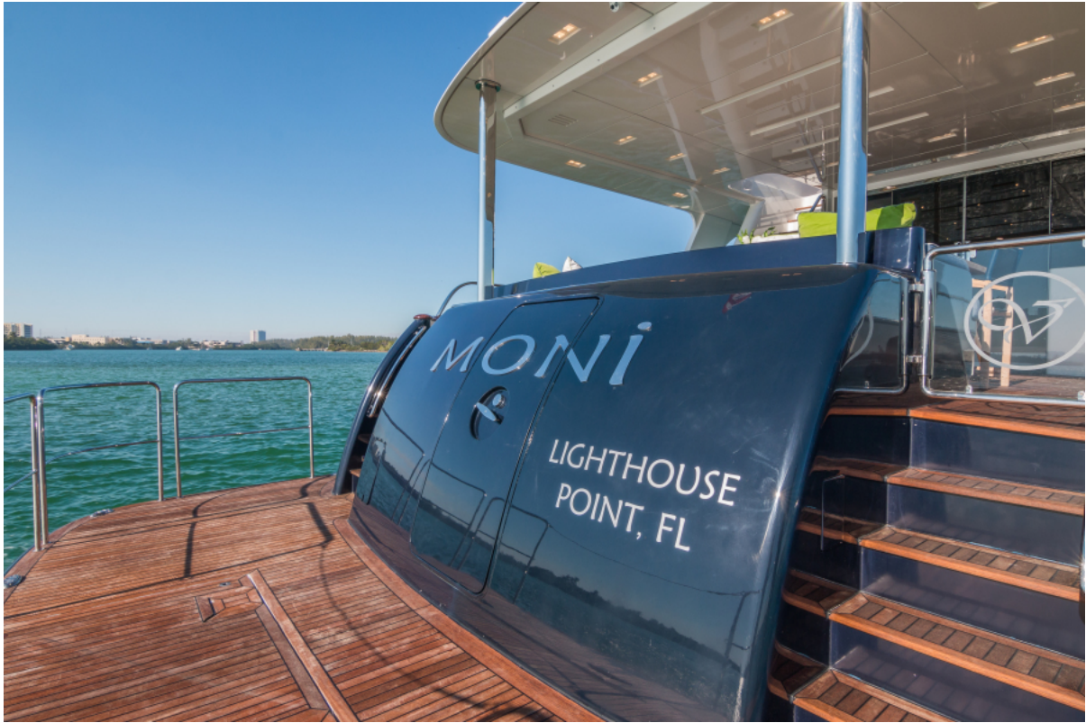
STERN MONI 107' 2013 Vicem Motor Yacht