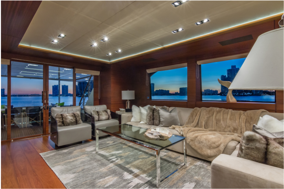
MAIN SALON MONI 107' 2013 Vicem Motor Yacht