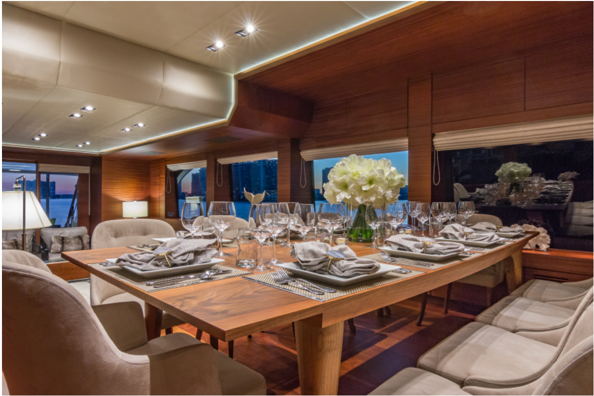
DINING MONI 107' 2013 Vicem Motor Yacht