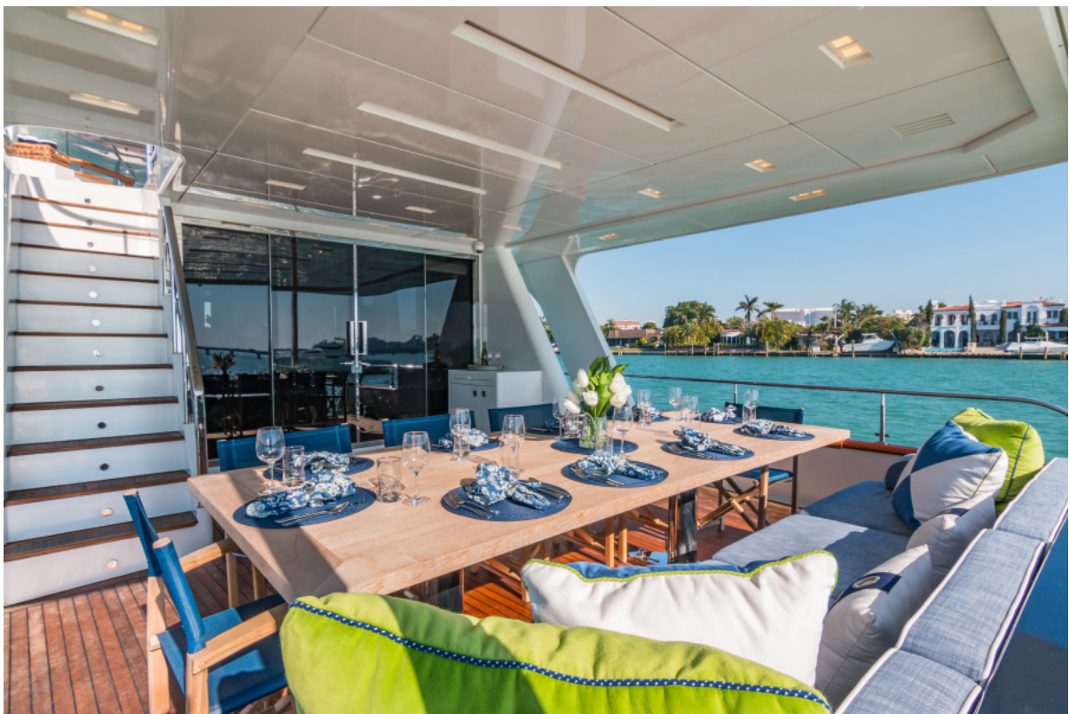
AFT DECK DINING MONI 107' 2013 Vicem Motor Yacht