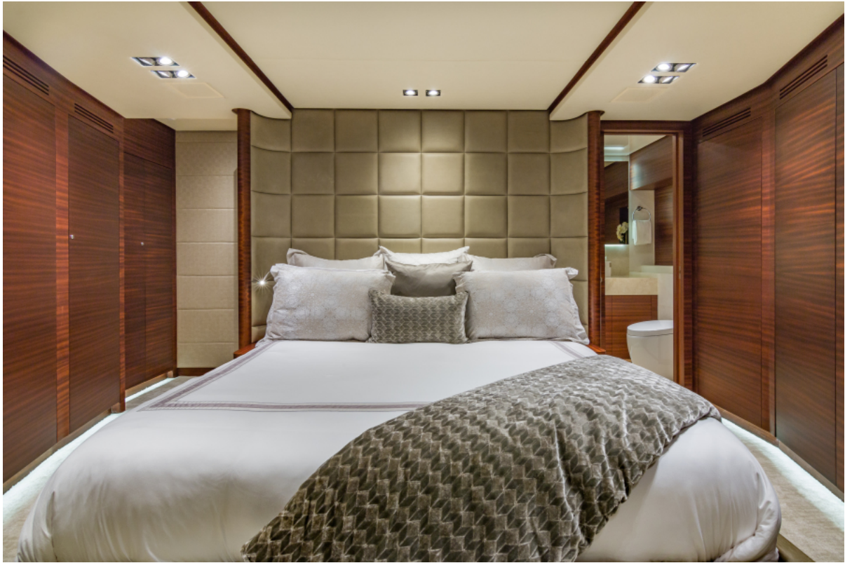
GUEST STATEROOM 4 MONI 107' 2013 Vicem Motor Yacht