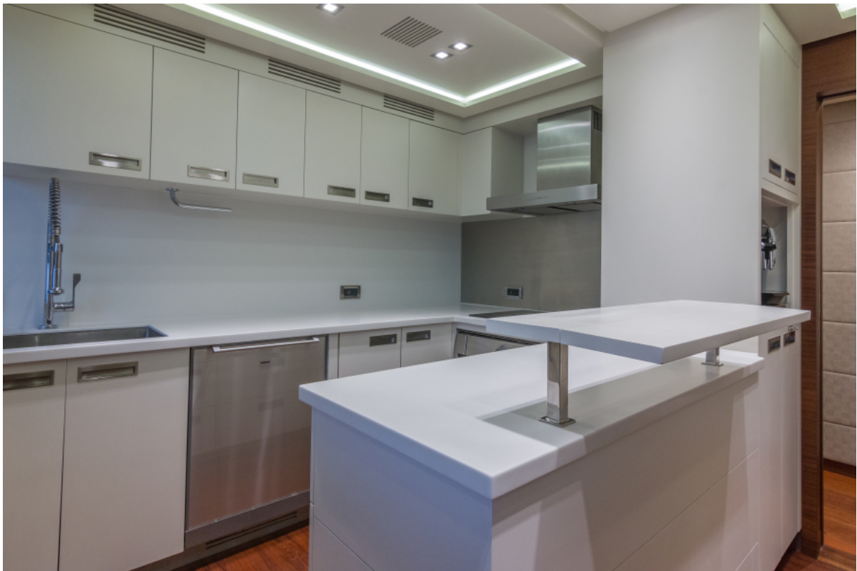
GALLEY MONI 107' 2013 Vicem Motor Yacht