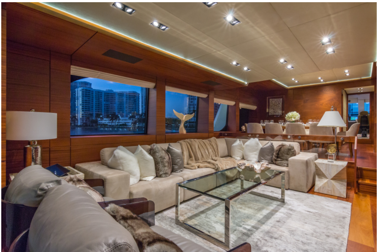
MAIN SALON MONI 107' 2013 Vicem Motor Yacht