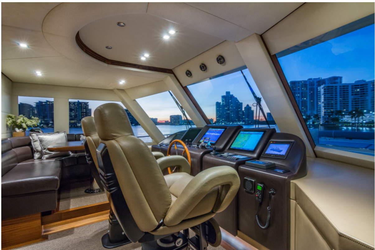
WHEELHOUSE MONI 107' 2013 Vicem Motor Yacht