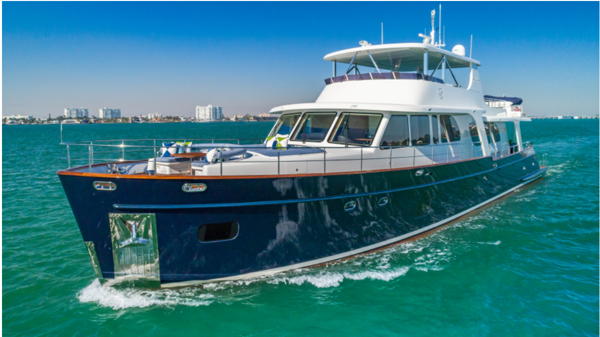
PROFILE MONI 107' 2013 Vicem Motor Yacht