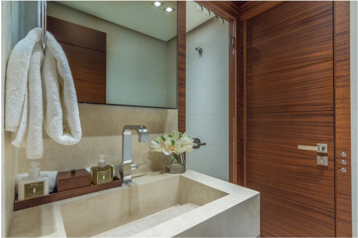
GUEST BATHROOM MONI 107' 2013 Vicem Motor Yacht