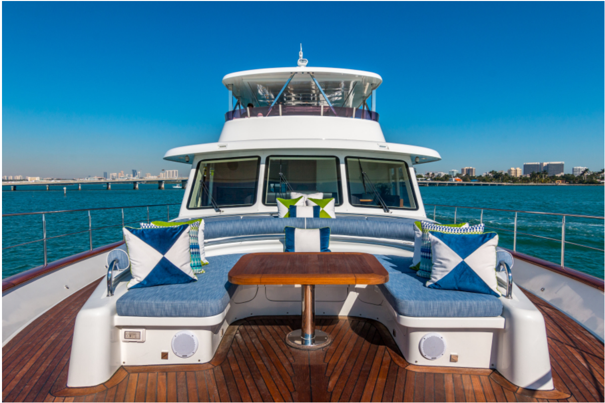
BOW SEATING MONI 107' 2013 Vicem Motor Yacht