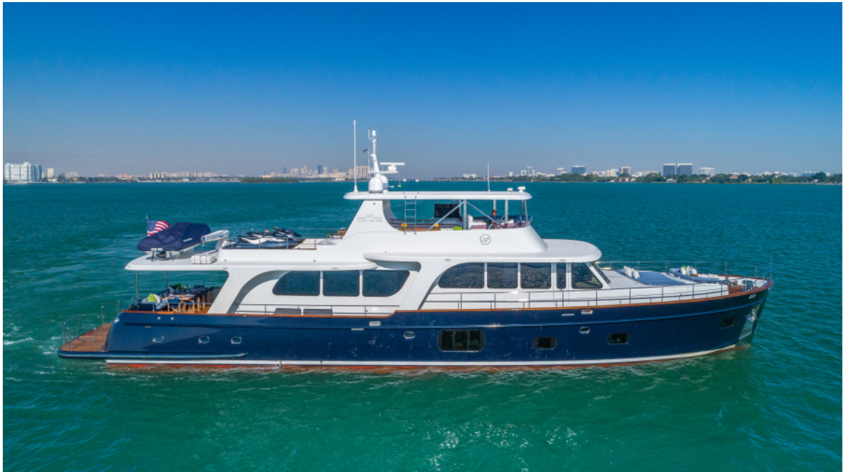
PROFILE MONI 107' 2013 Vicem Motor Yacht