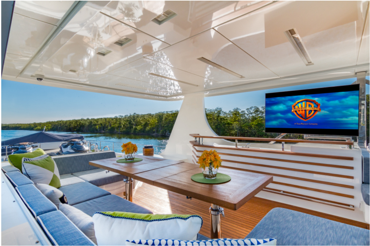
SUN DECK DINING MONI 107' 2013 Vicem Motor Yacht