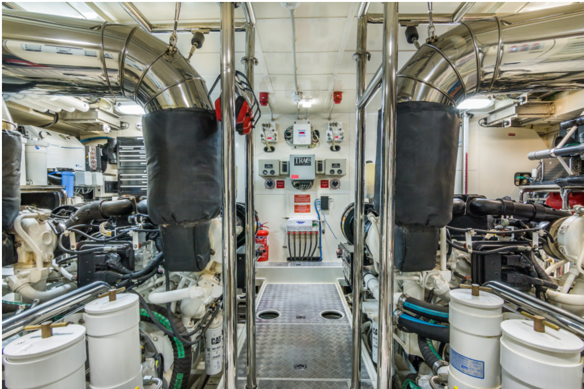
ENGINE ROOM MONI 107' 2013 Vicem Motor Yacht