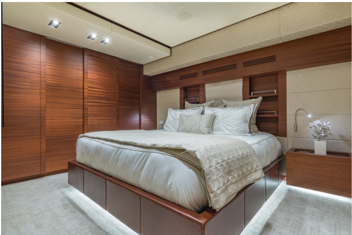
VIP STATEROOM MONI 107' 2013 Vicem Motor Yacht