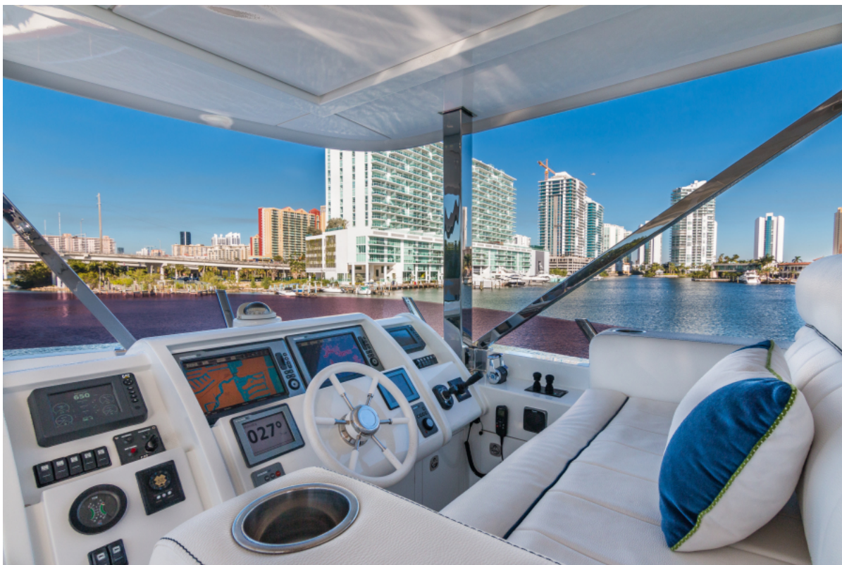
SUN DECK MONI 107' 2013 Vicem Motor Yacht