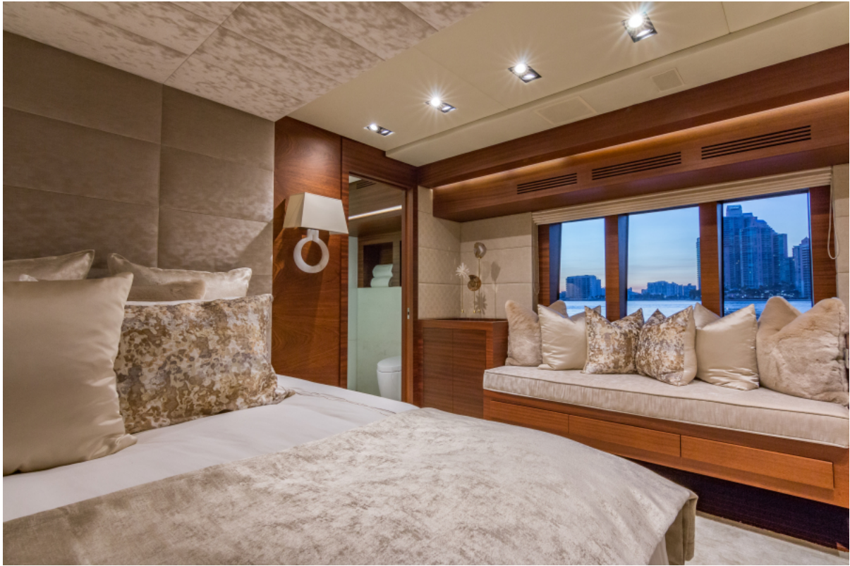
MASTER STATEROOM MONI 107' 2013 Vicem Motor Yacht