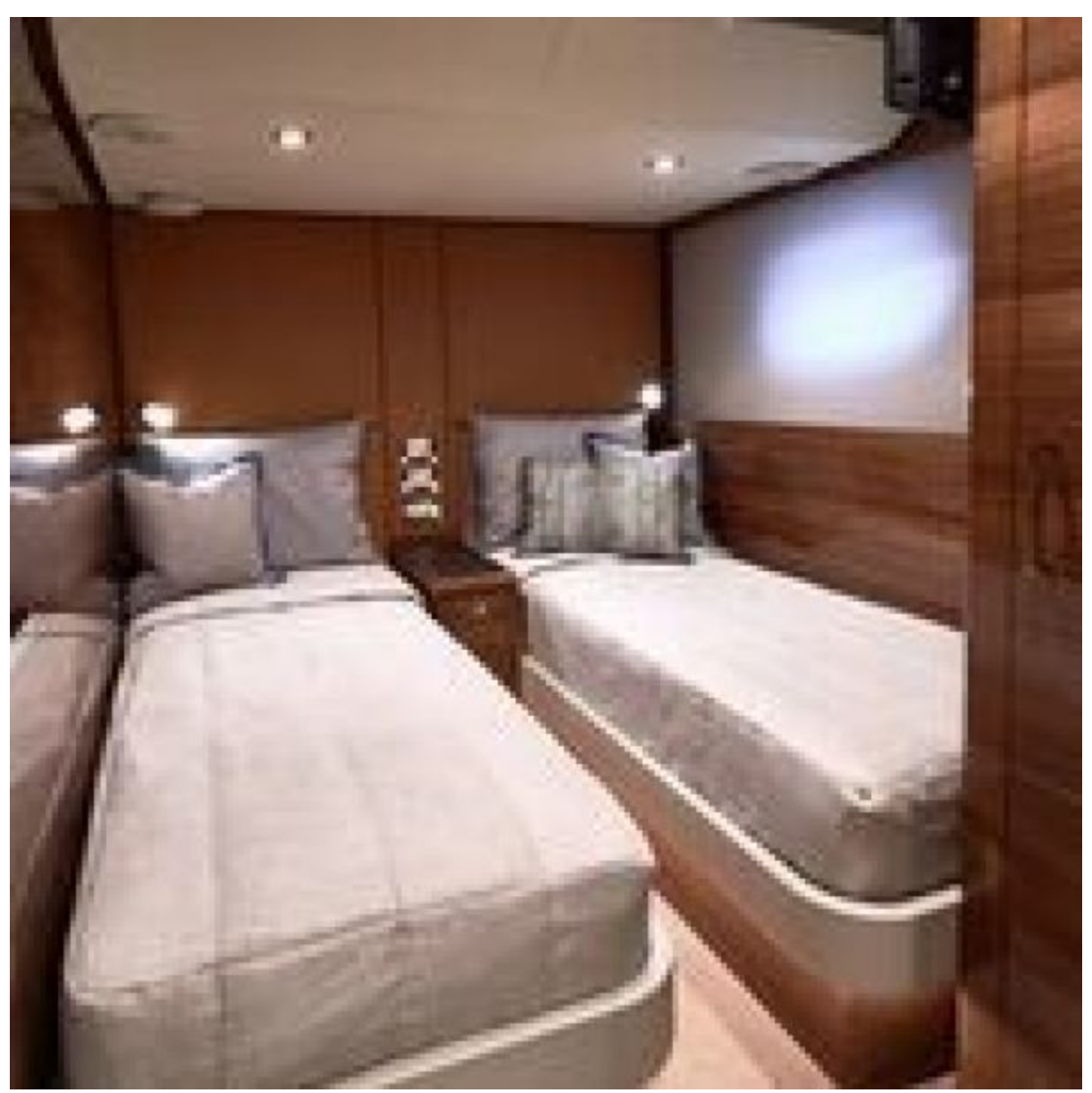
Guest 1 strm