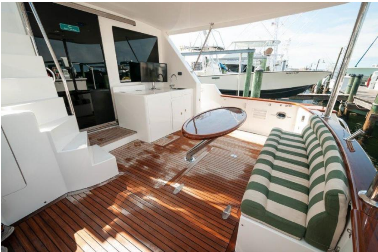
2009 64 Ocean Alexander, Olivia Cockpit (3)