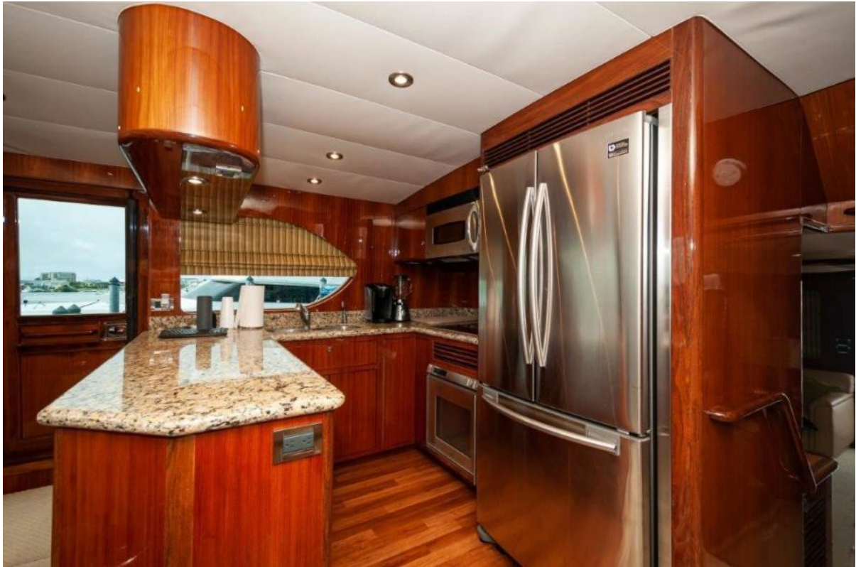
2009 64 Ocean Alexander, Olivia Galley (2)