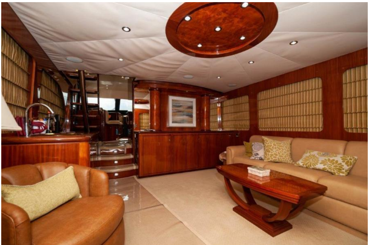
2009 64 Ocean Alexander, Olivia Salon (1)