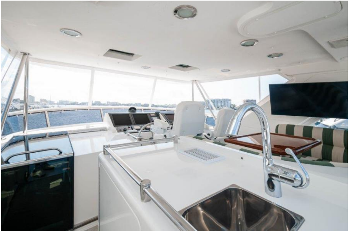
2009 64 Ocean Alexander, Olivia Flybridge (3)