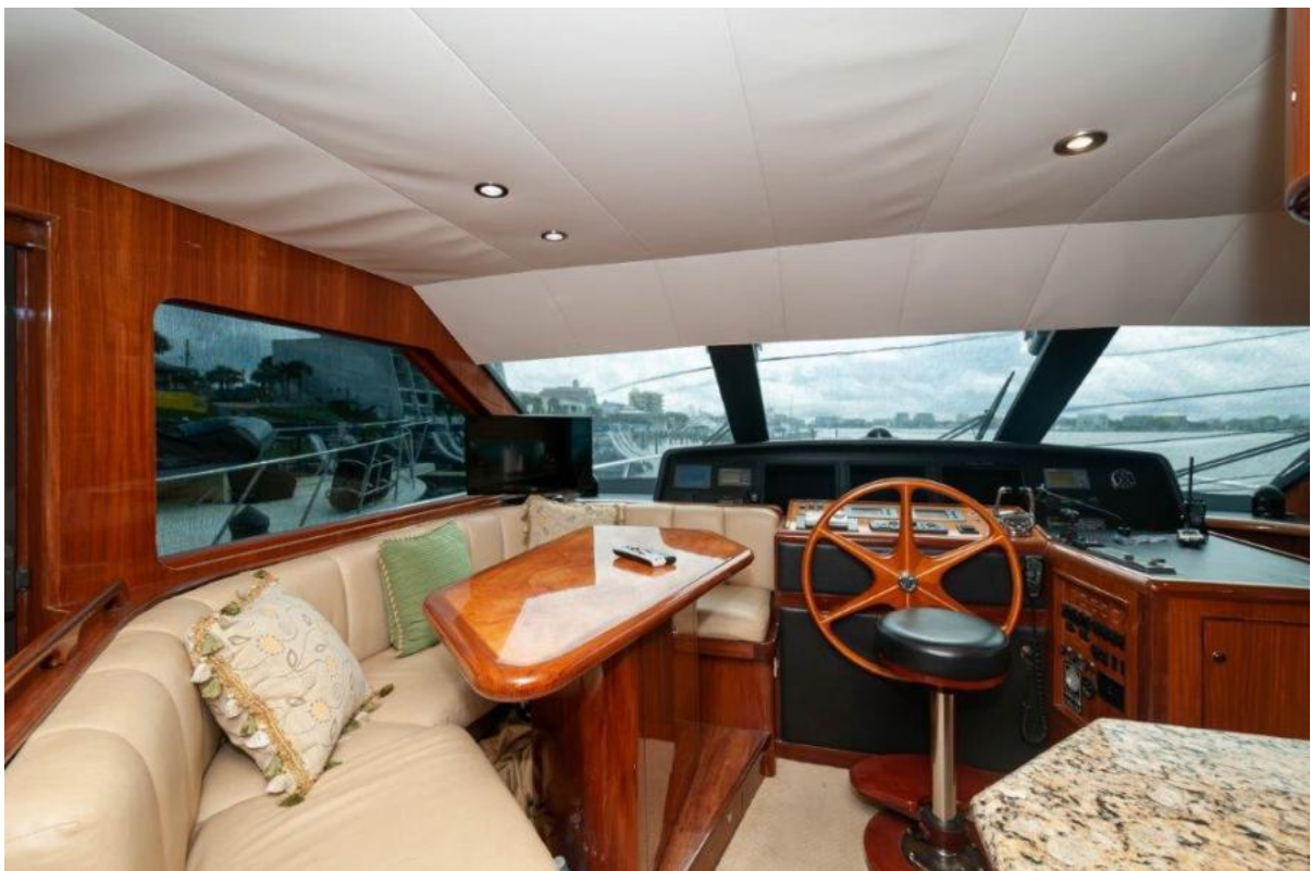
2009 64 Ocean Alexander, Olivia Pilot House (1)