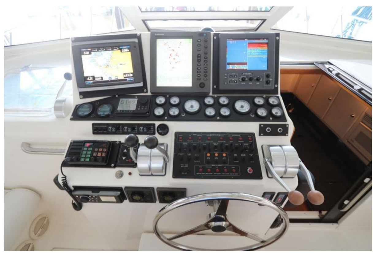
1997 45 Cabo Express - Helm