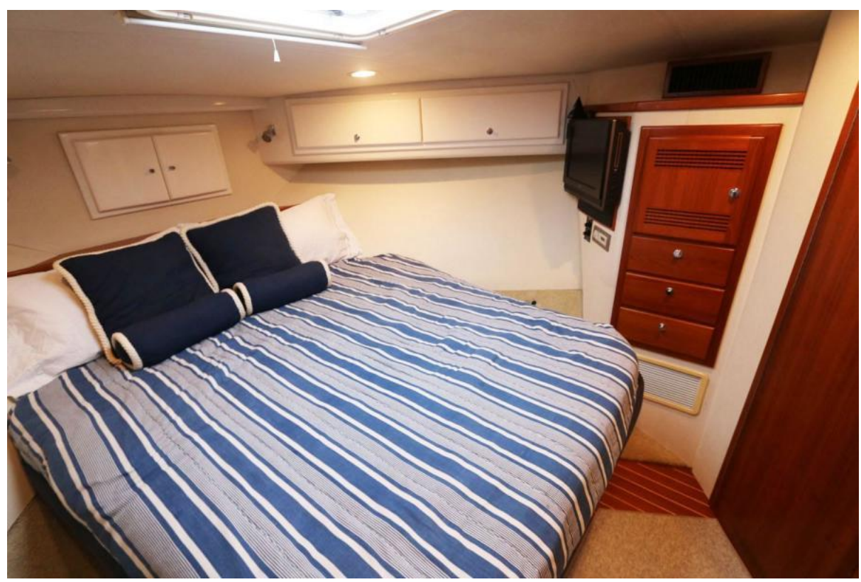
1997 45 Cabo Express - Stateroom