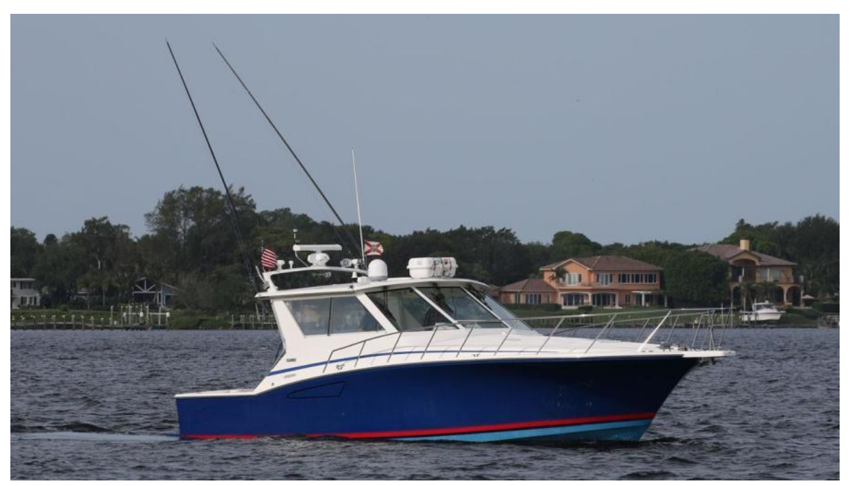
1997 45 Cabo Express - Reel Life - Profile