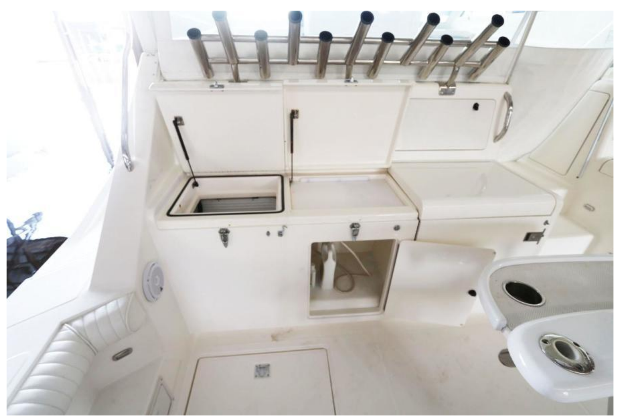
1997 45 Cabo Express - Cockpit