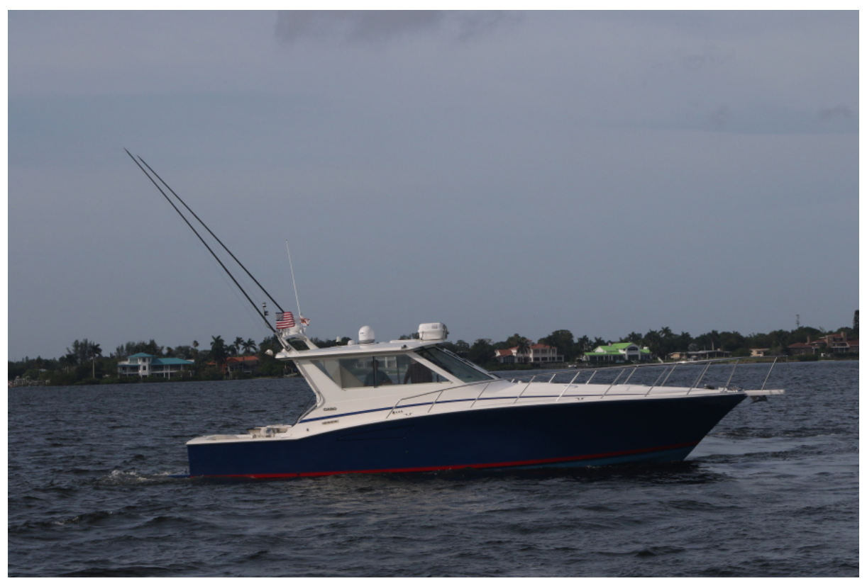
45 Cabo Express