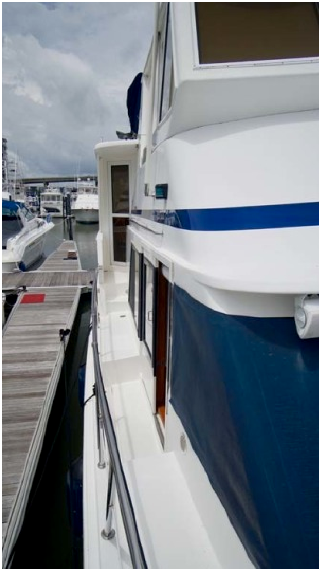
Starboard Side Deck