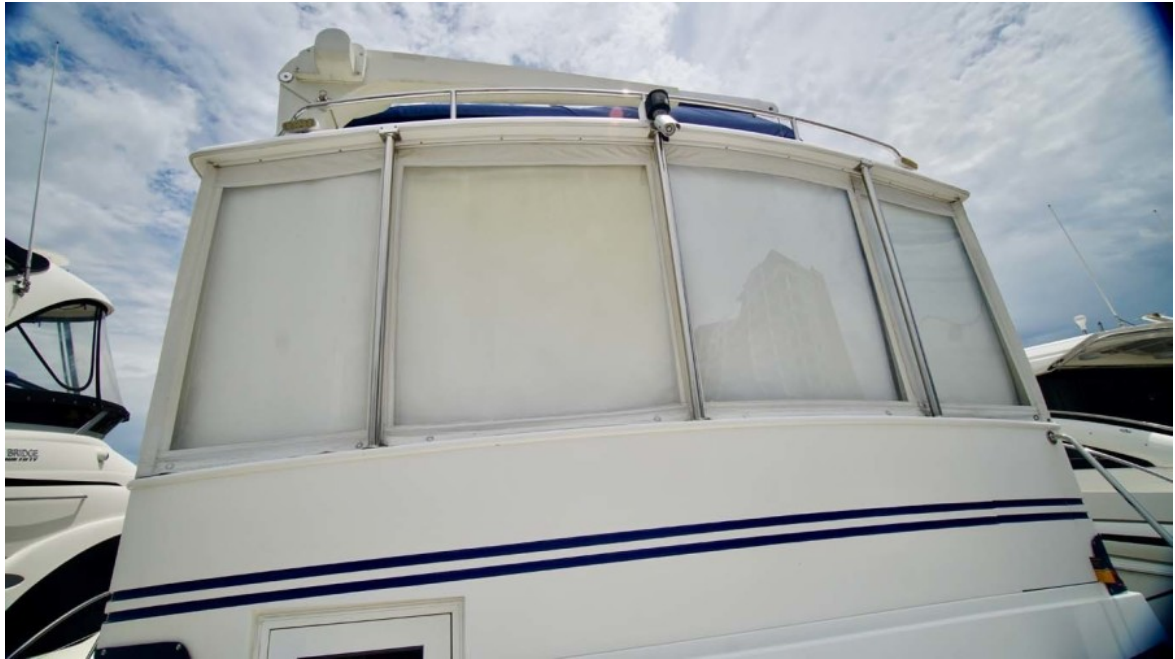
Aft Sun Deck Windows