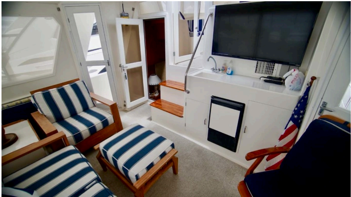
Aft Sun Deck TV