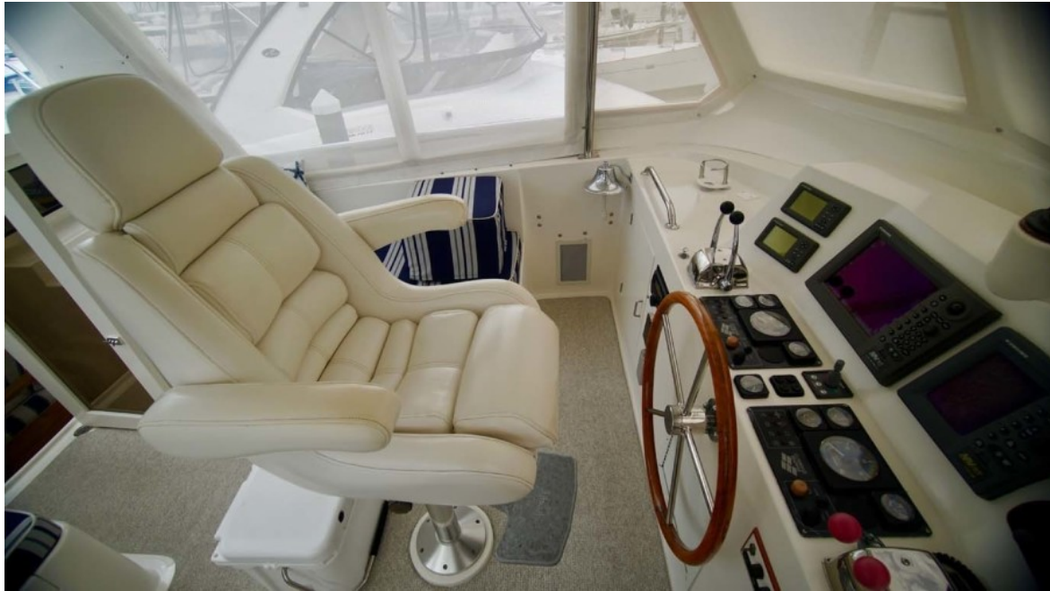
Upper Helm Seat