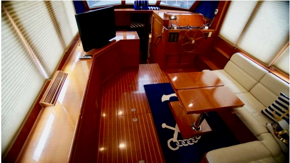
Salon Seating, Table And TV