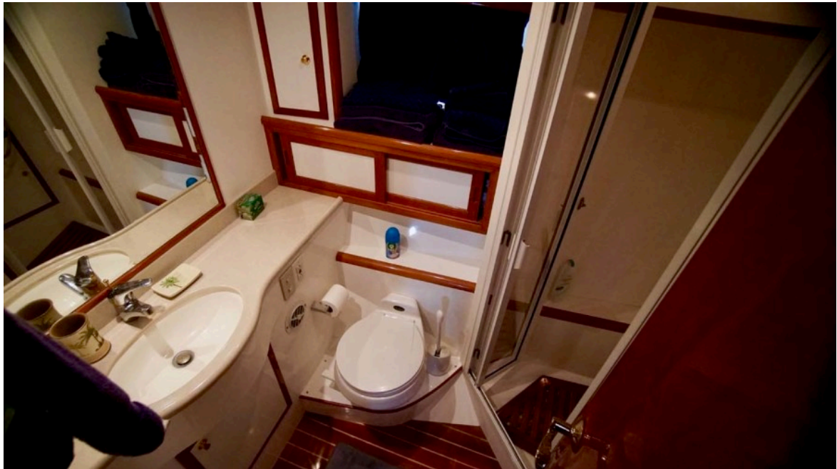
Guest En-Suite Head