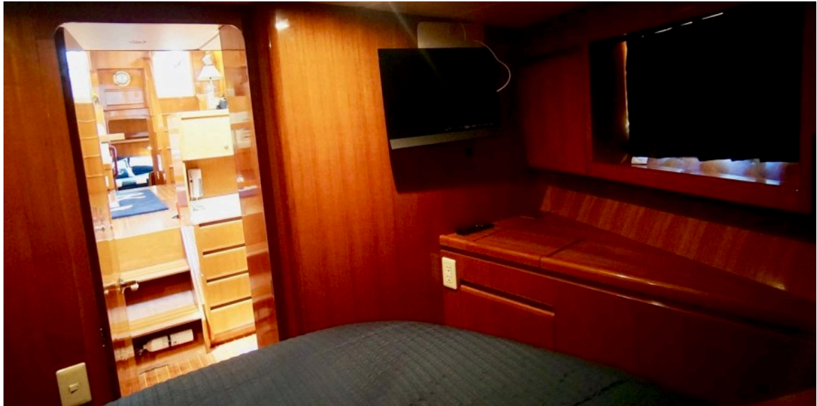
Guest Stateroom TV