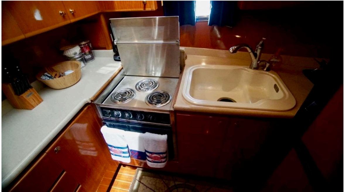
Galley Sink And Stove