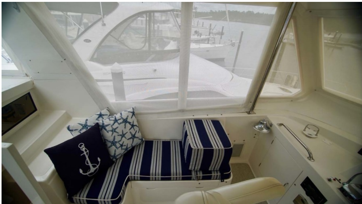
Flybridge Seating Port