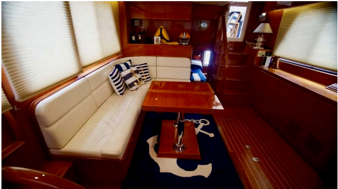
Salon Seating And Table