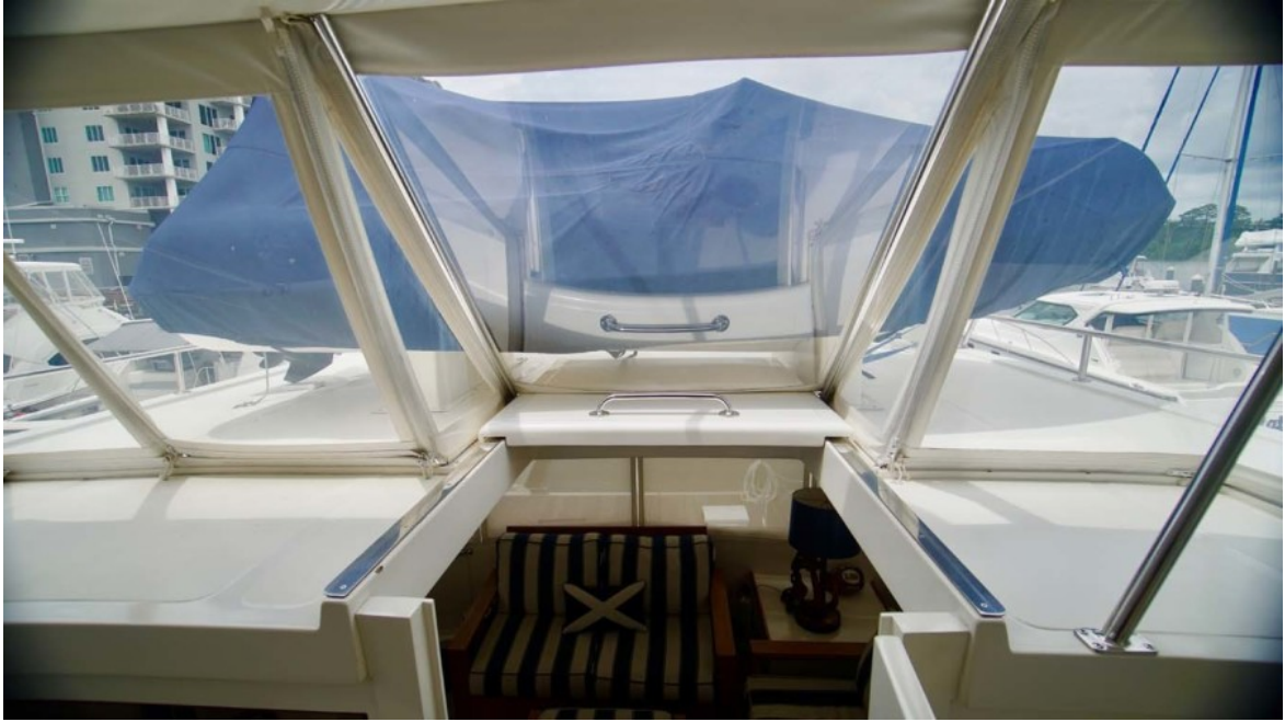
Enclosure Looking Aft