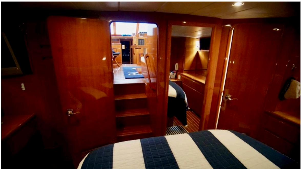
Master Hanging Locker