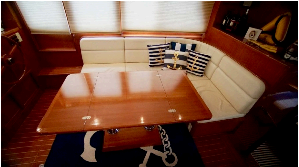
Salon Seating And Table