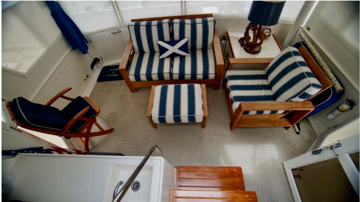
Aft Sun Deck Seating