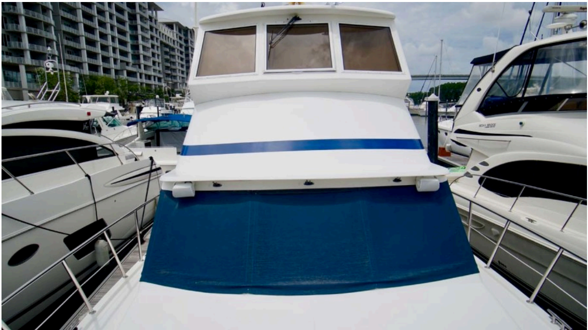
Bow Looking Aft