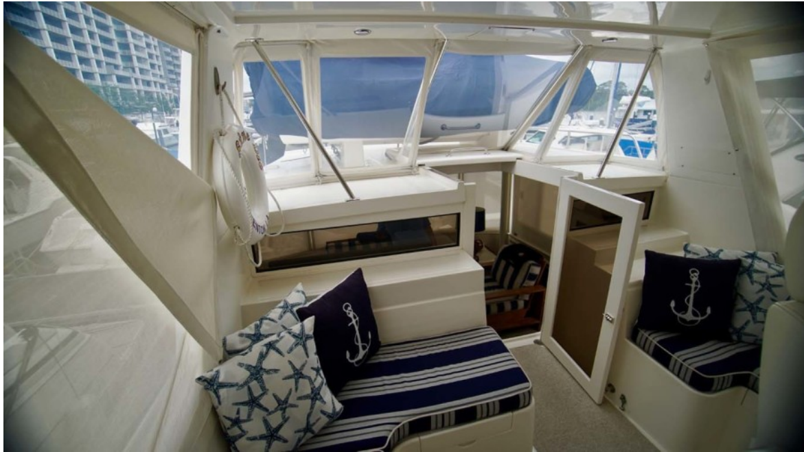
Flybridge Looking Aft