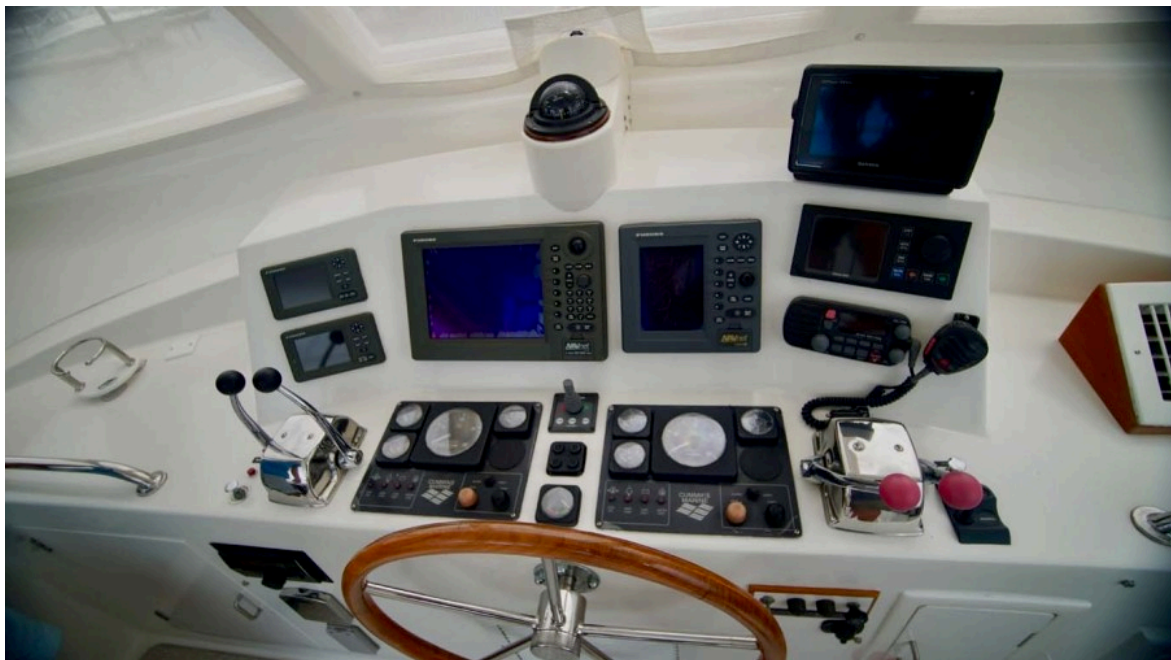
Upper Helm Electronics