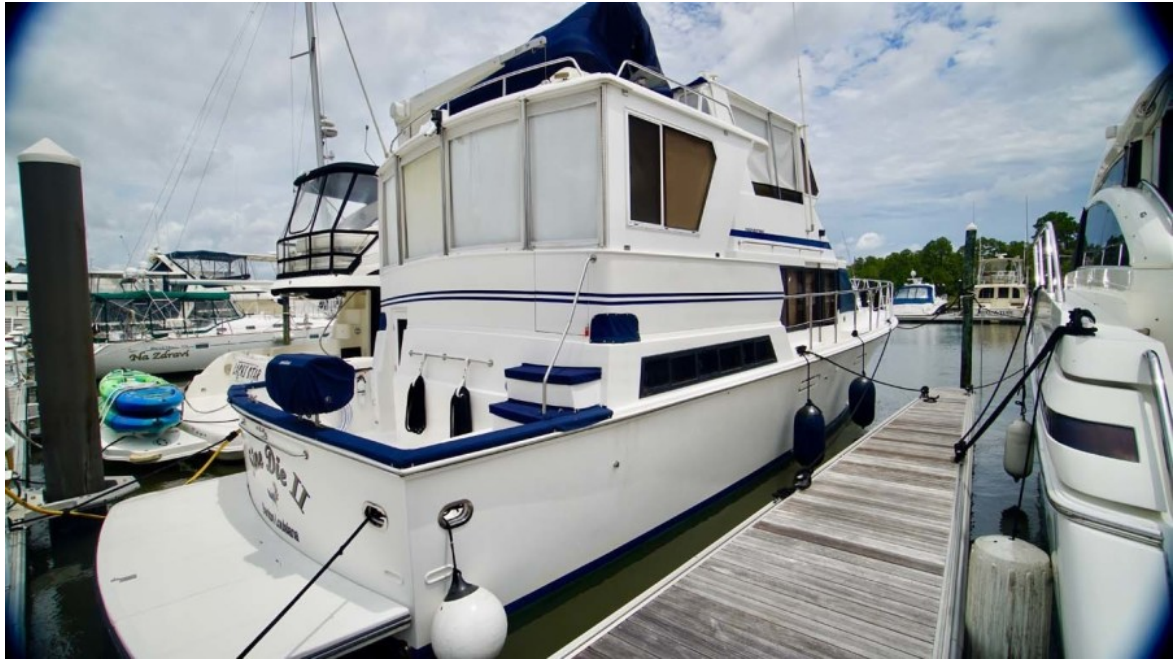
Starboard Aft View