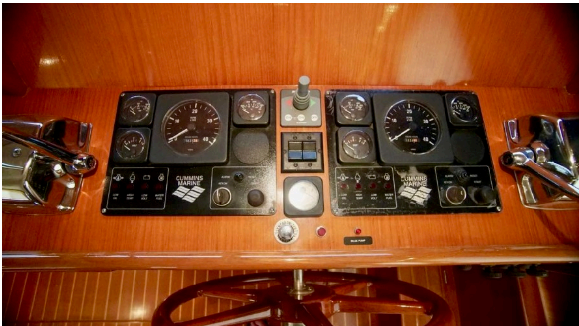
Lower Helm Electronics