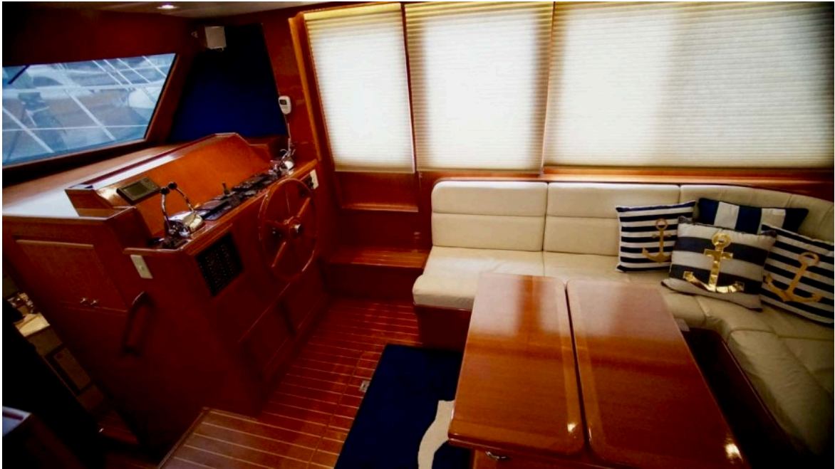
Salon Seating And Lower Helm