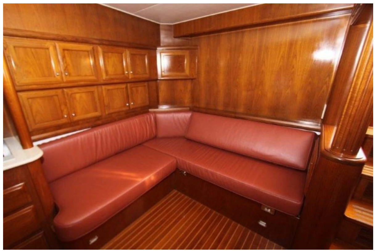
Salon Starboard L-Shaped Settee