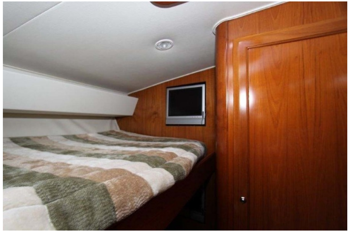
Guest Stateroom TV