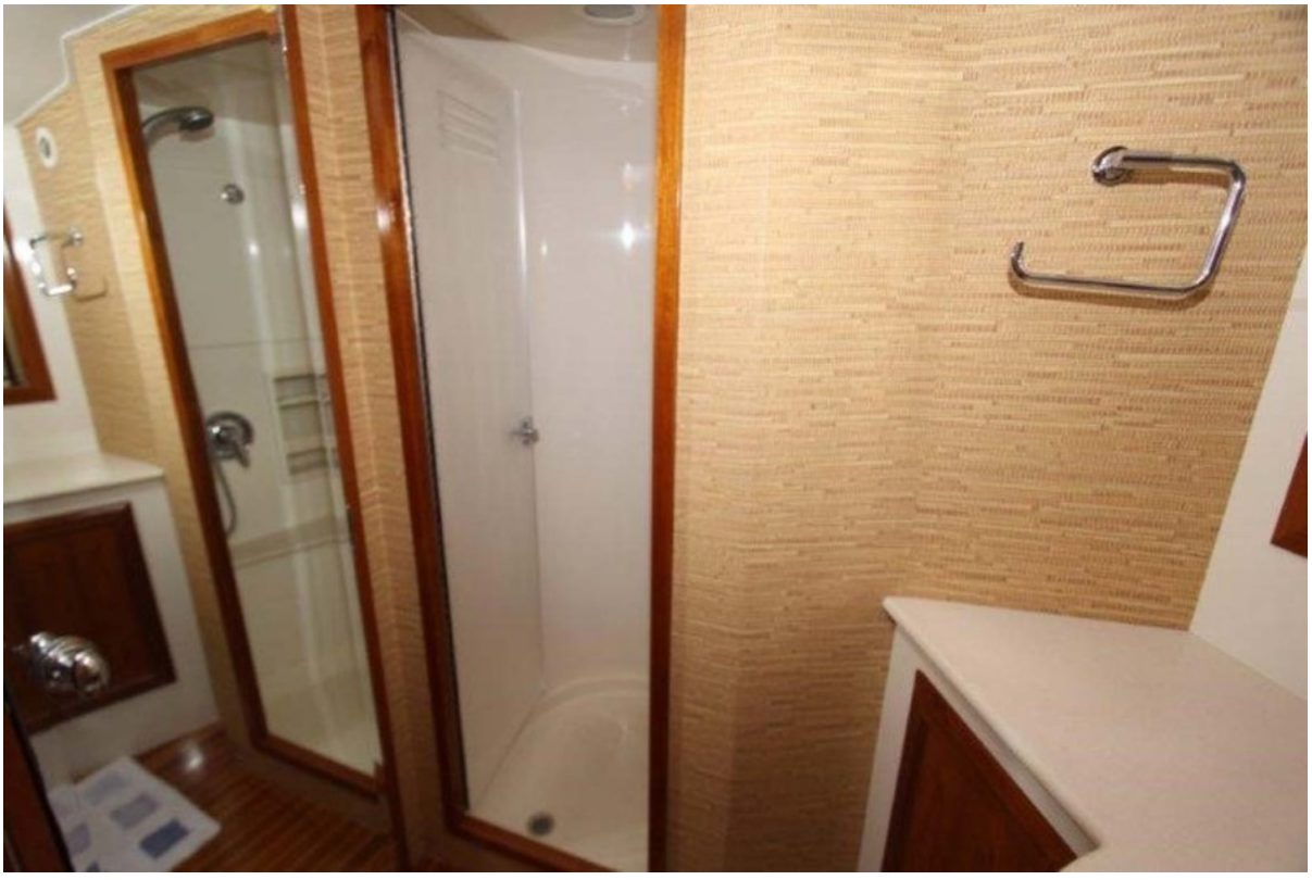
Head and Shower