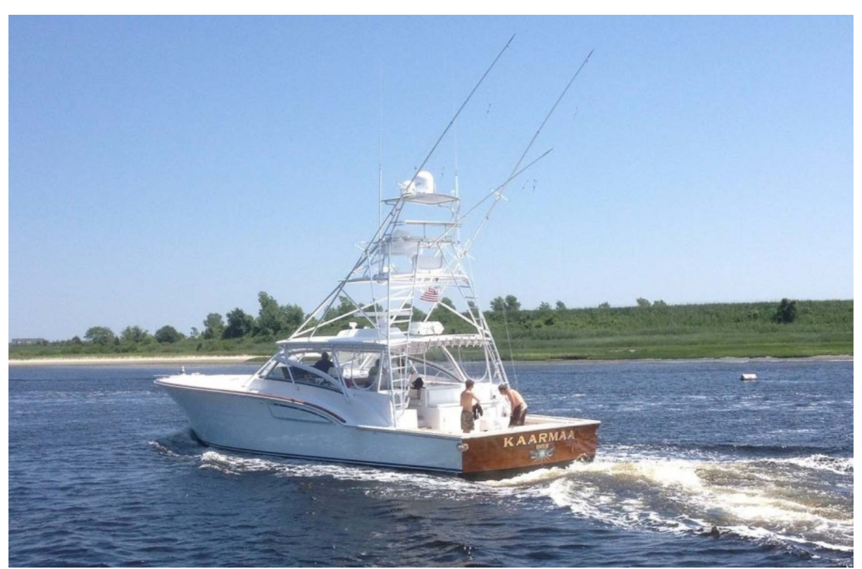
Port Aft Running View