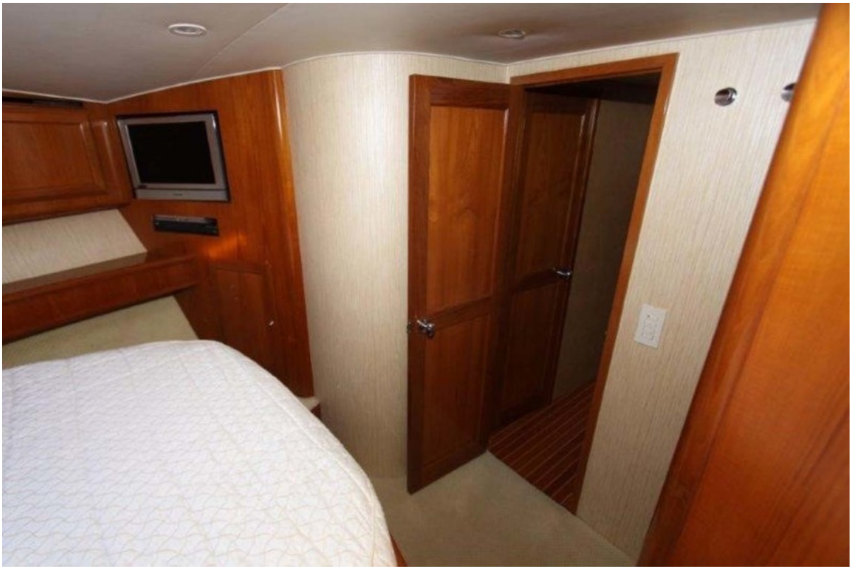
Forward Stateroom Looking Aft