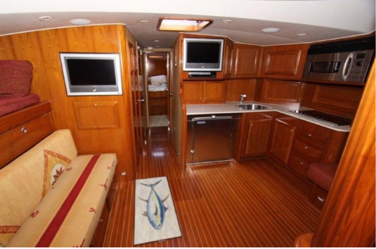
Salon and Galley