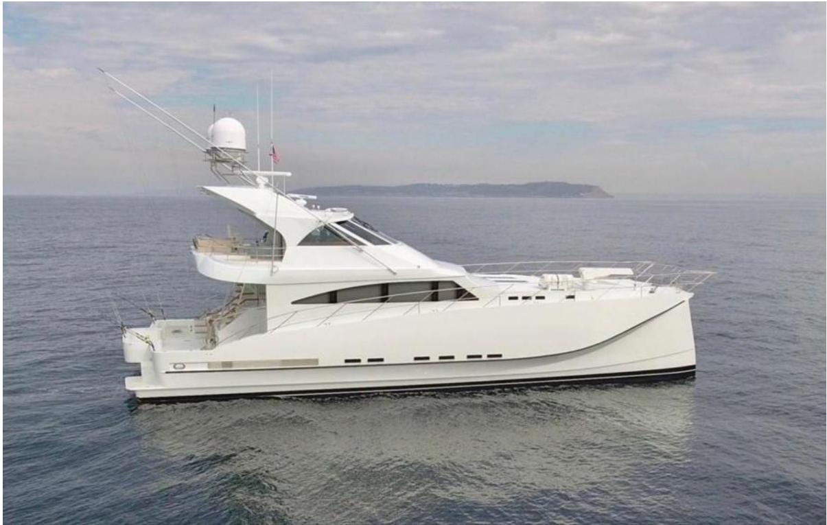
2012 / 2016 Custom 75 Catamaran - Gato Blanco