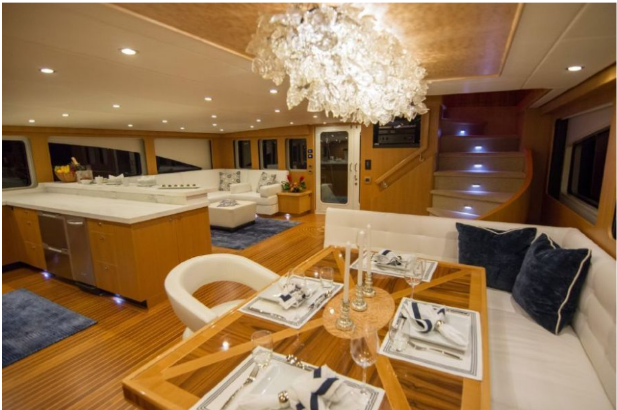
2012 / 2016 Custom 75 Catamaran - Gato Blanco - Dinette