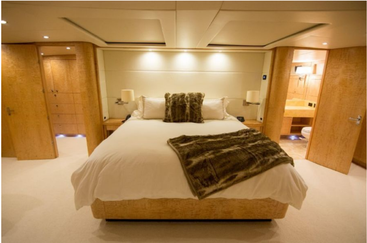
2012 / 2016 Custom 75 Catamaran - Gato Blanco - Master Stateroom