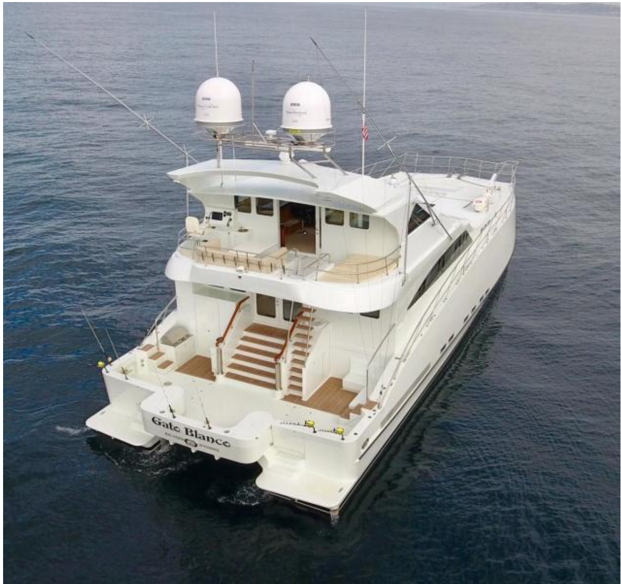
2012 / 2016 Custom 75 Catamaran - Gato Blanco