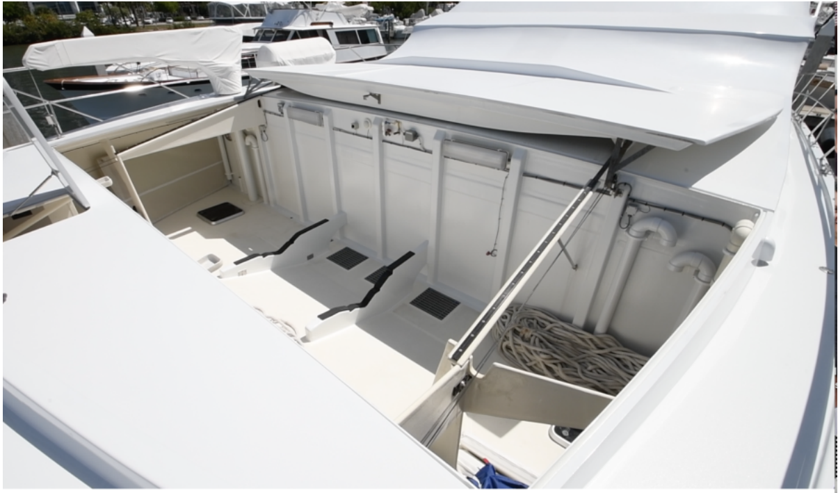
2012 / 2016 Custom 75 Catamaran - Gato Blanco - Tender and Storage Area