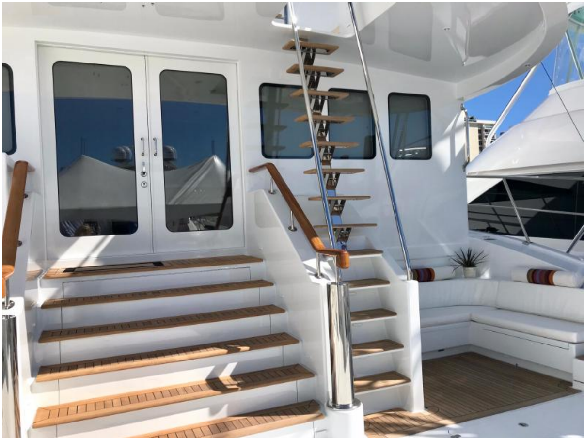
2012 / 2016 Custom 75 Catamaran - Gato Blanco - Aft Deck