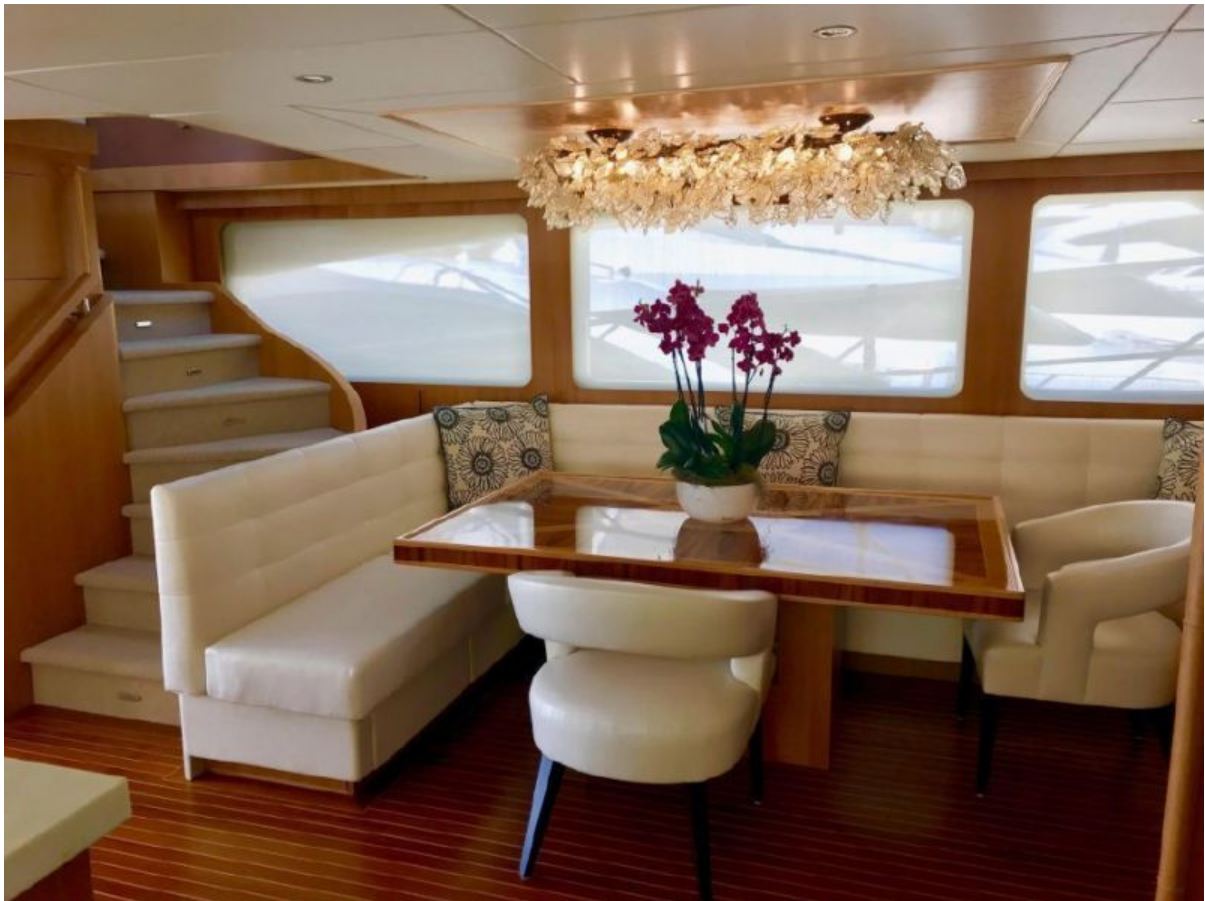
2012 / 2016 Custom 75 Catamaran - Gato Blanco - Dinette