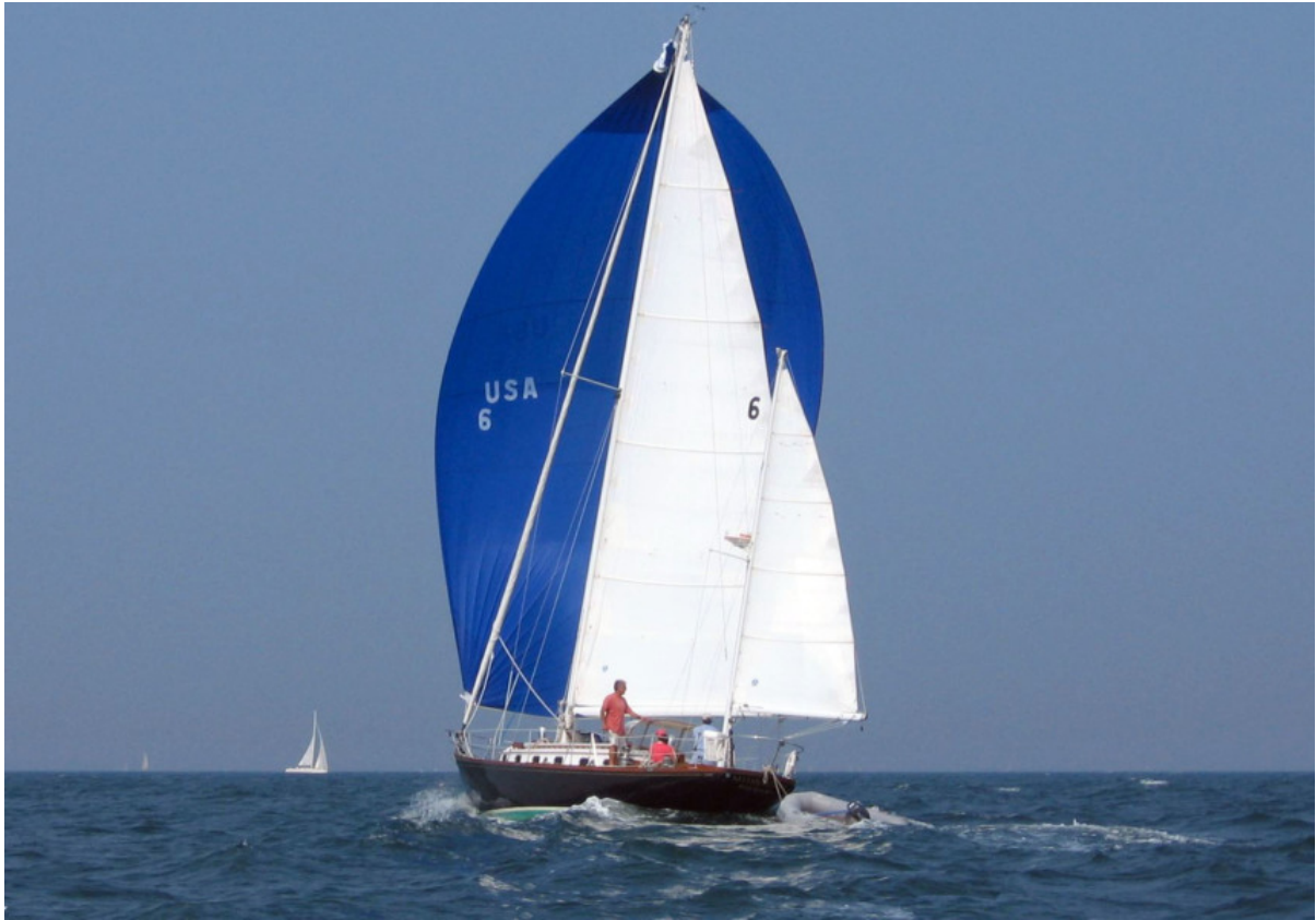
Midnight Running Downwind