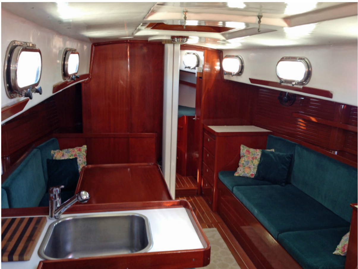
Midnight Main Salon