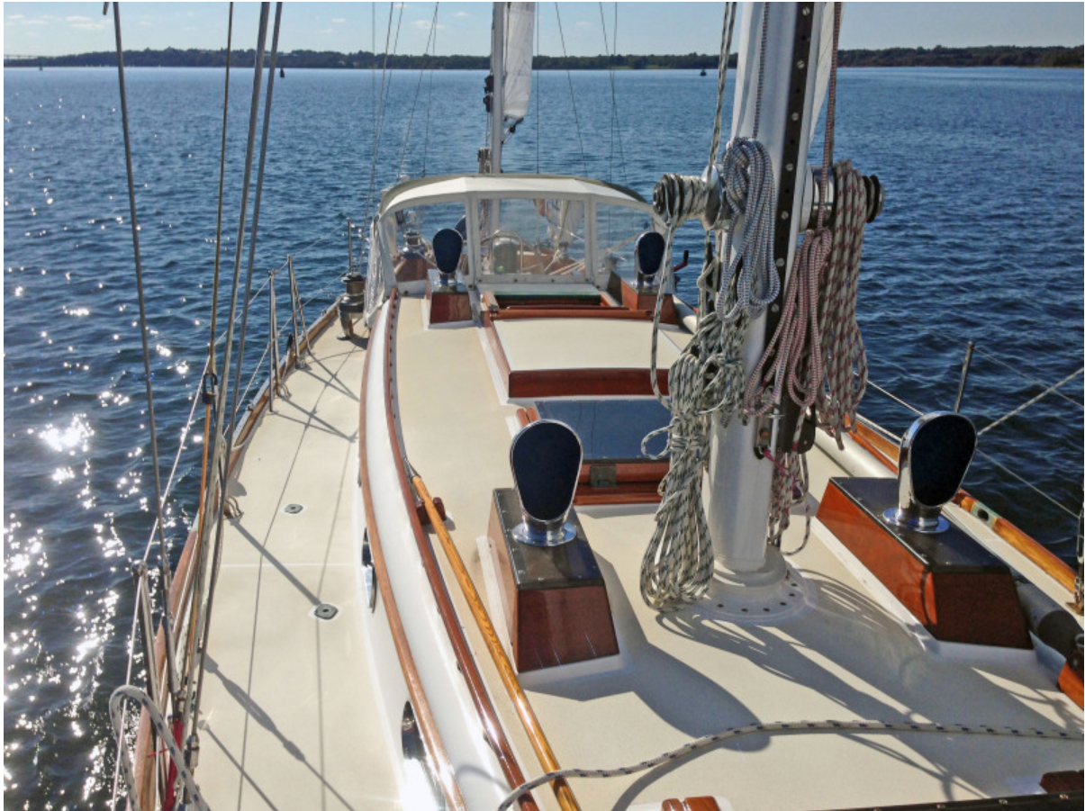
Midnight Looking Aft