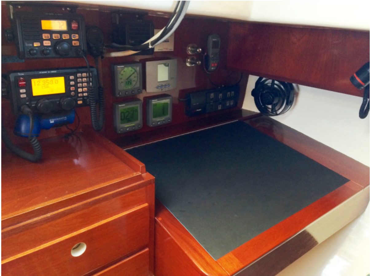
Midnight Nav Station