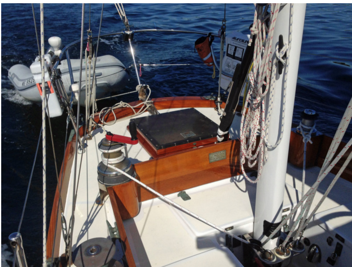
Midnight Aft Cockpit