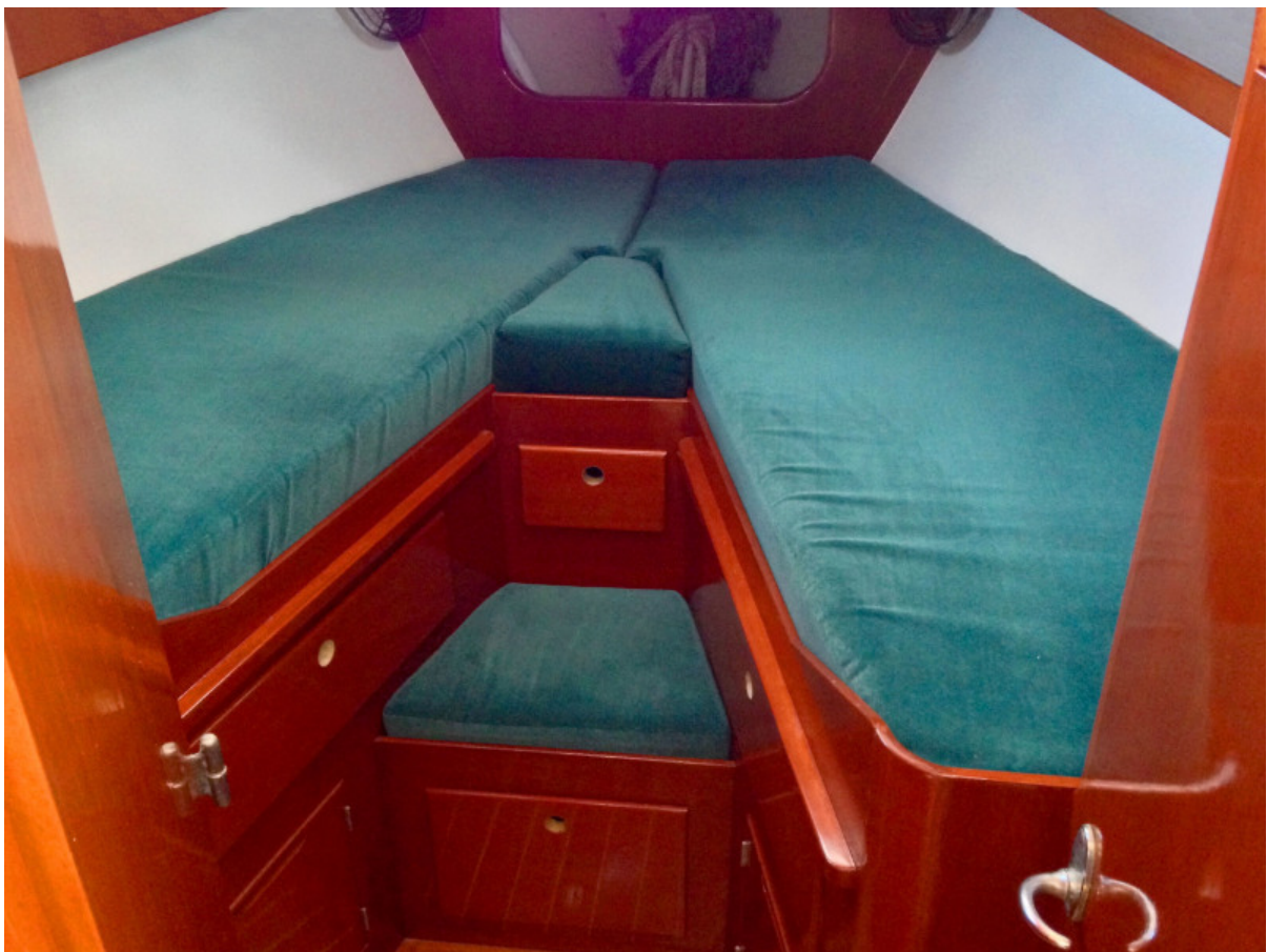
Midnight V-Berth Fwd