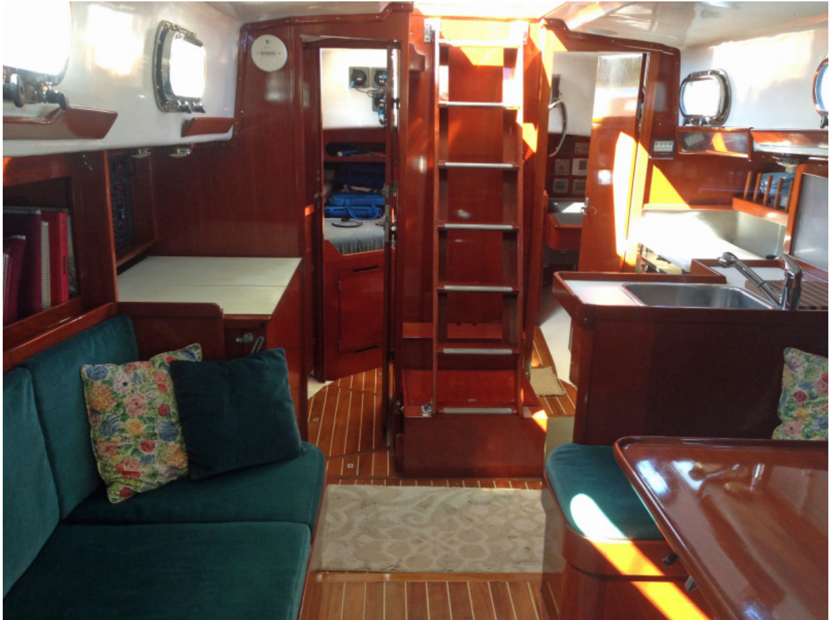
Midnight Salon Aft