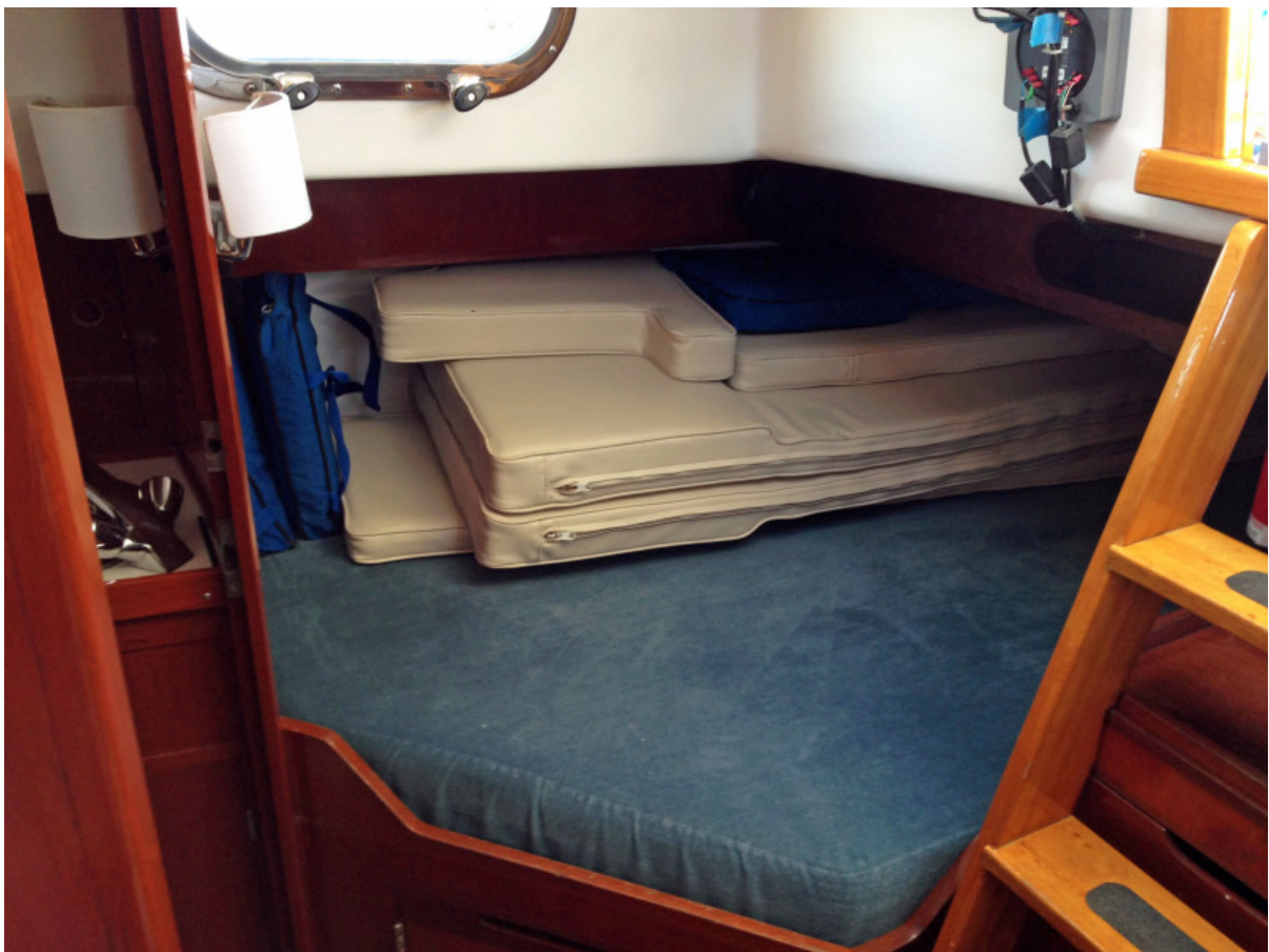
Midnight Owner's Cabin