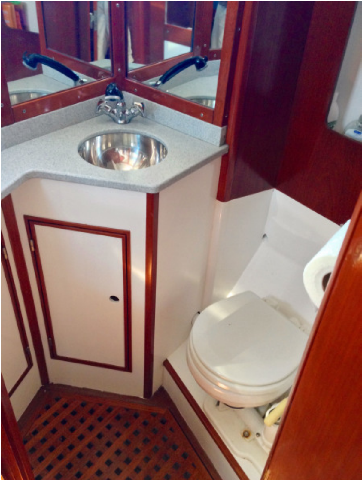
Midnight Guest Head