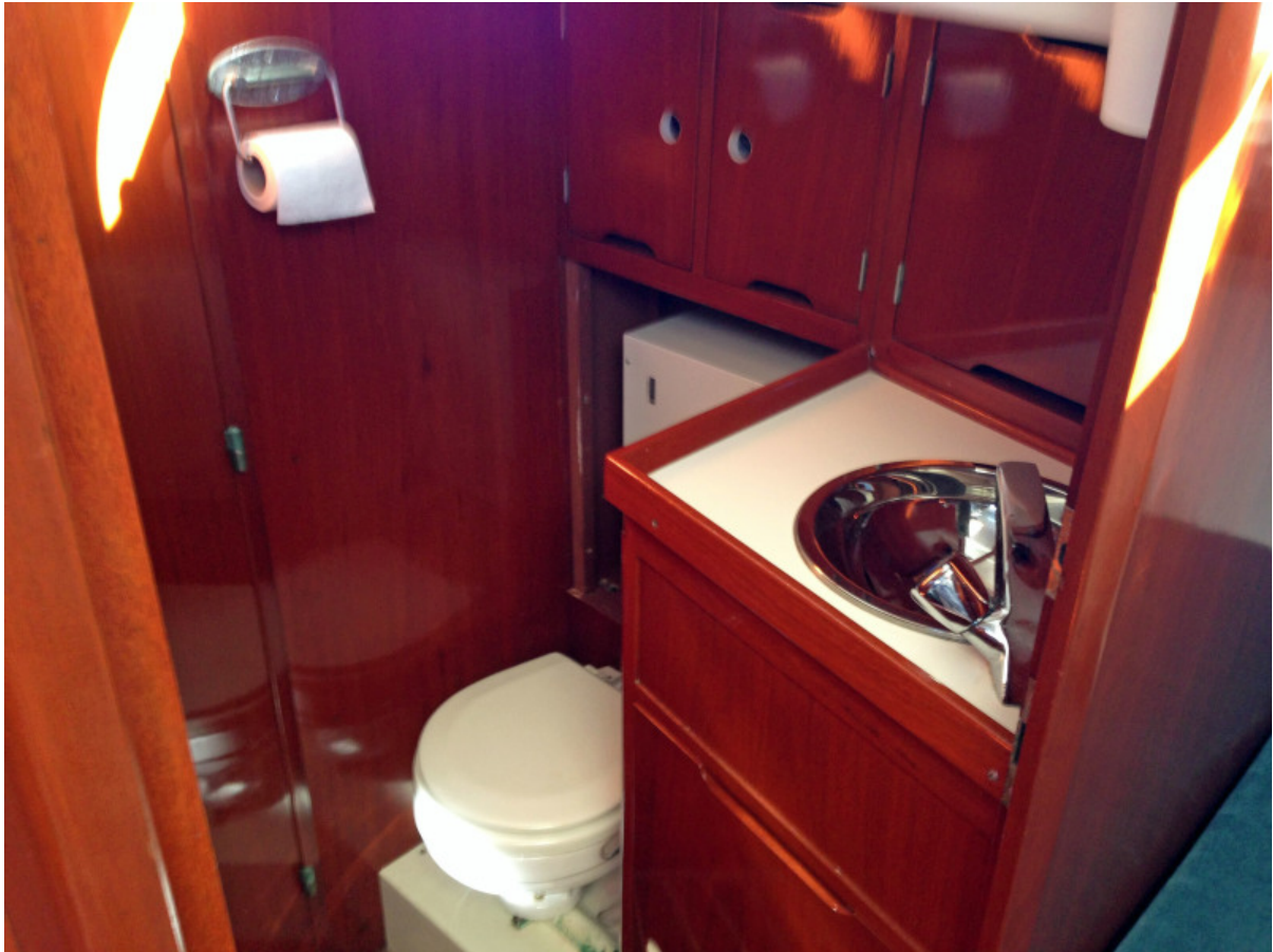
Midnight Owner's Head