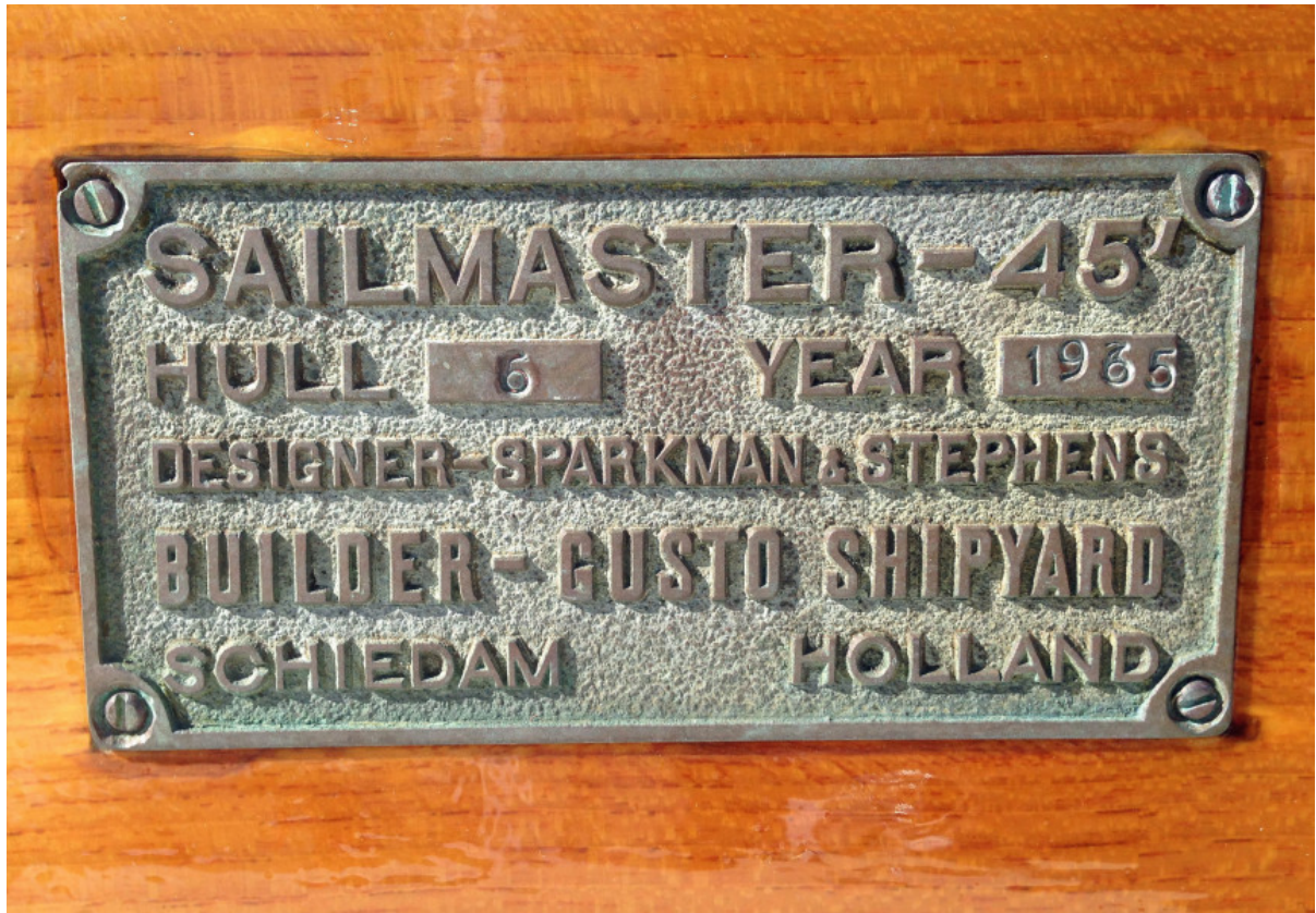
Midnight Sailmaster Plaque