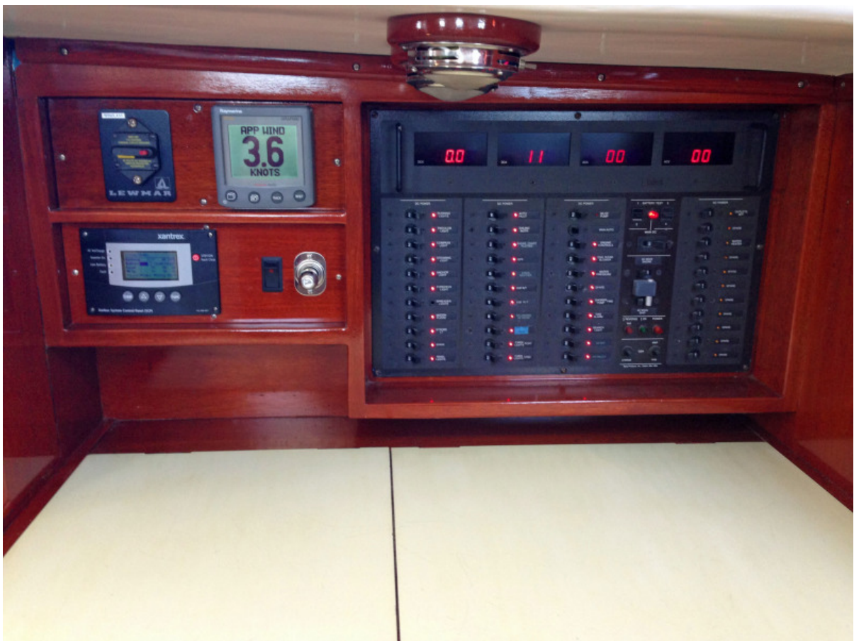
Midnight Nav Instruments