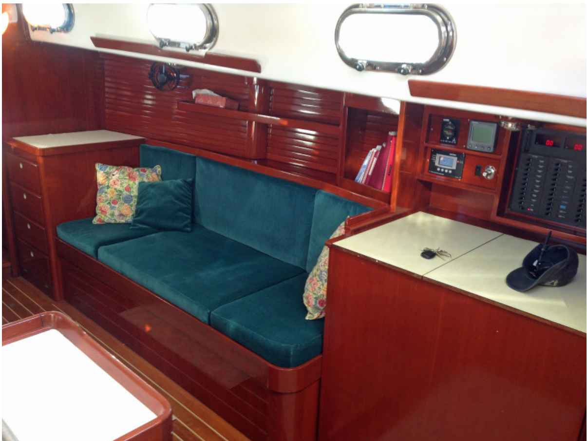
Midnight Salon to Stbd