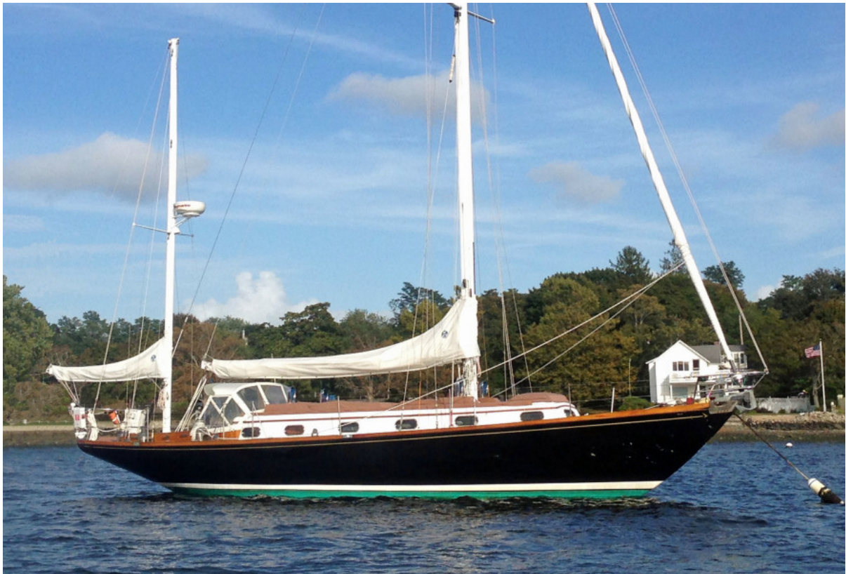
MIDNIGHT Sparkman & Stephens Sailmaster 45' Yawl