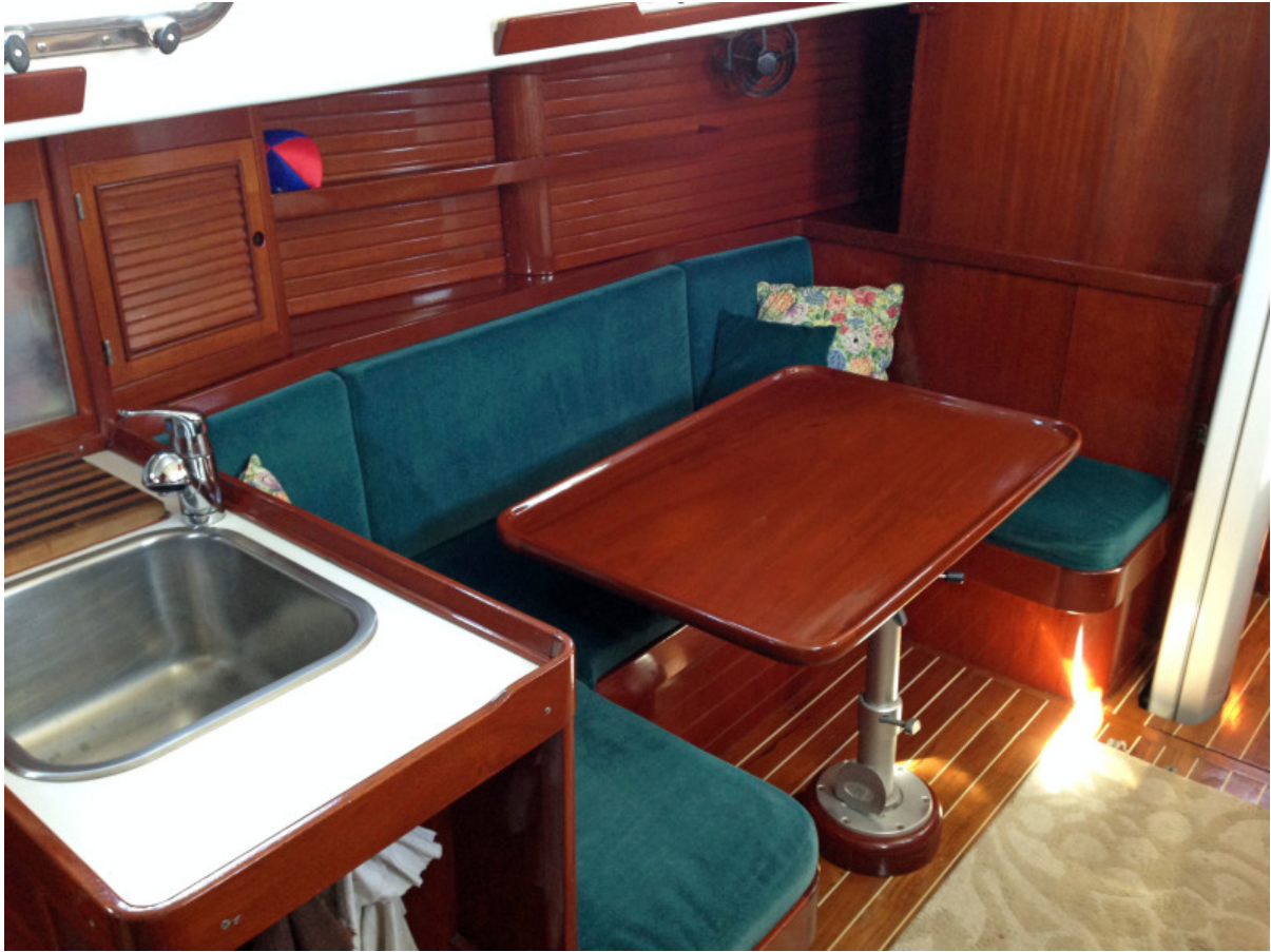
Midnight Salon to Port