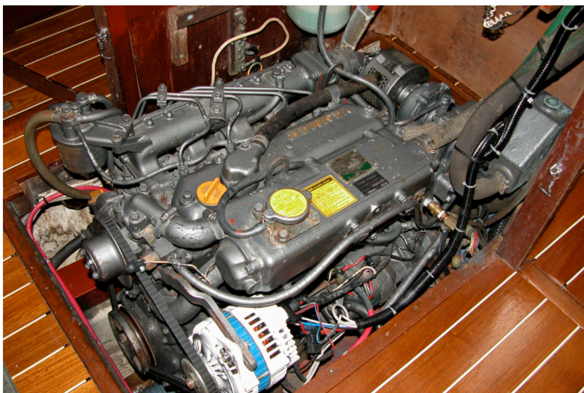
Midnight Access To Engine