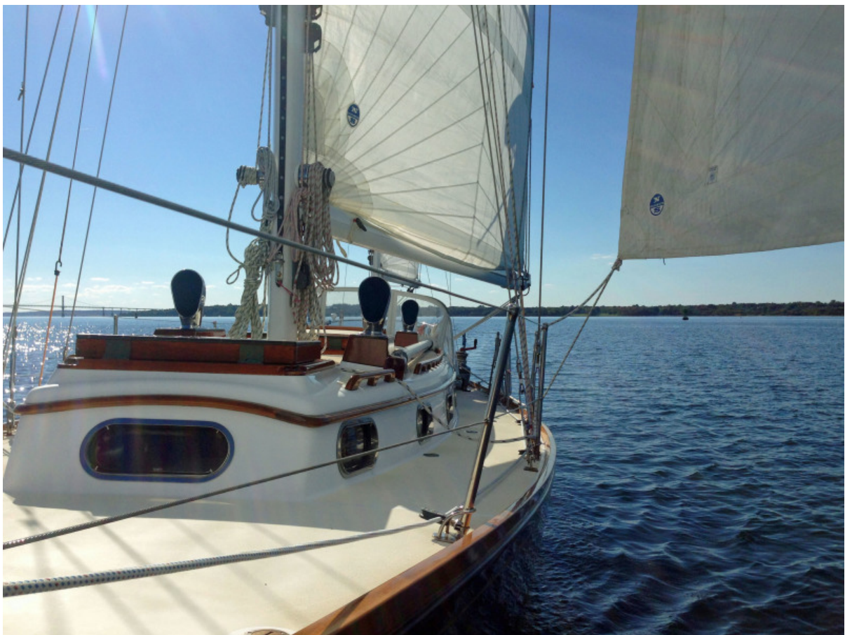
Midnight Port Deck Looking Aft