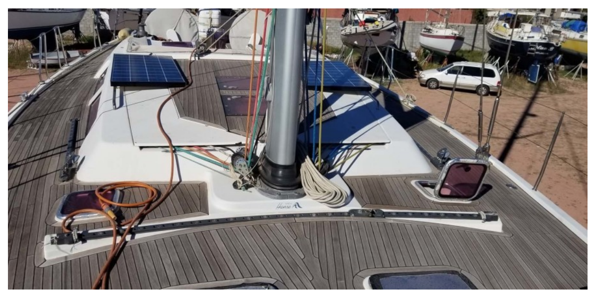
Foredeck Looking Aft