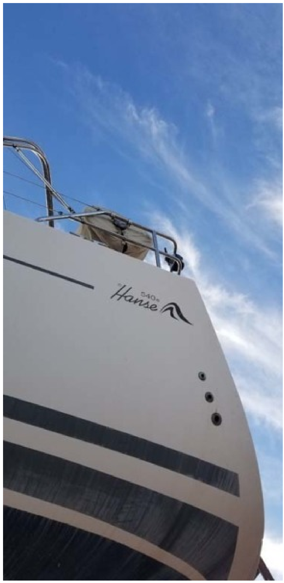
Port Aft Hull