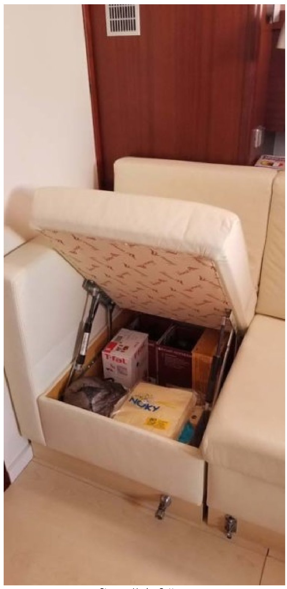
Storage Under Settee