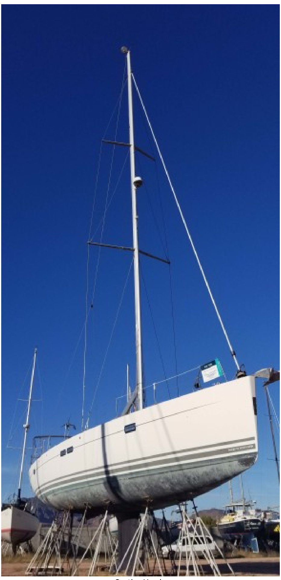
On the Hard