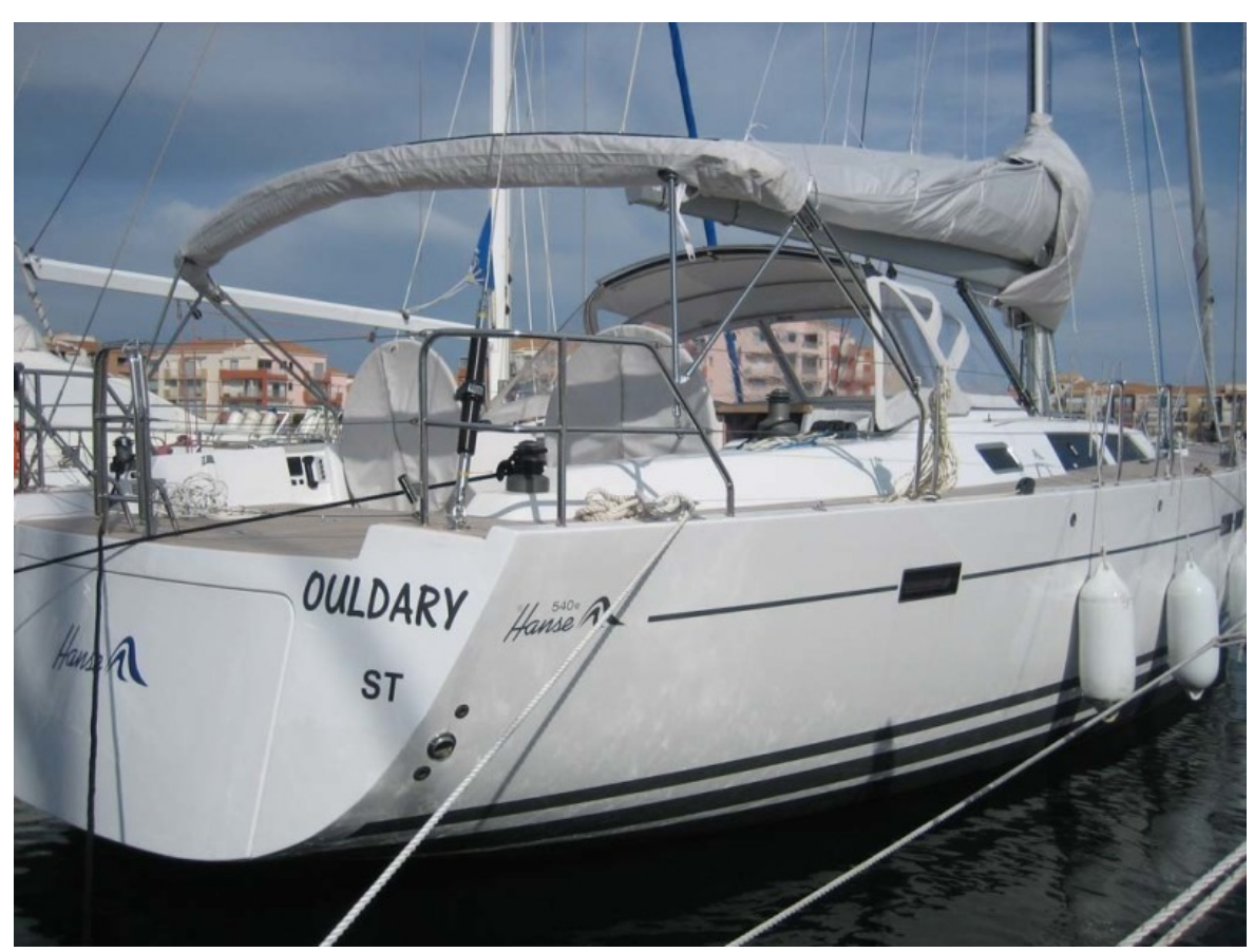
Starboard aft Quarter at the Dock