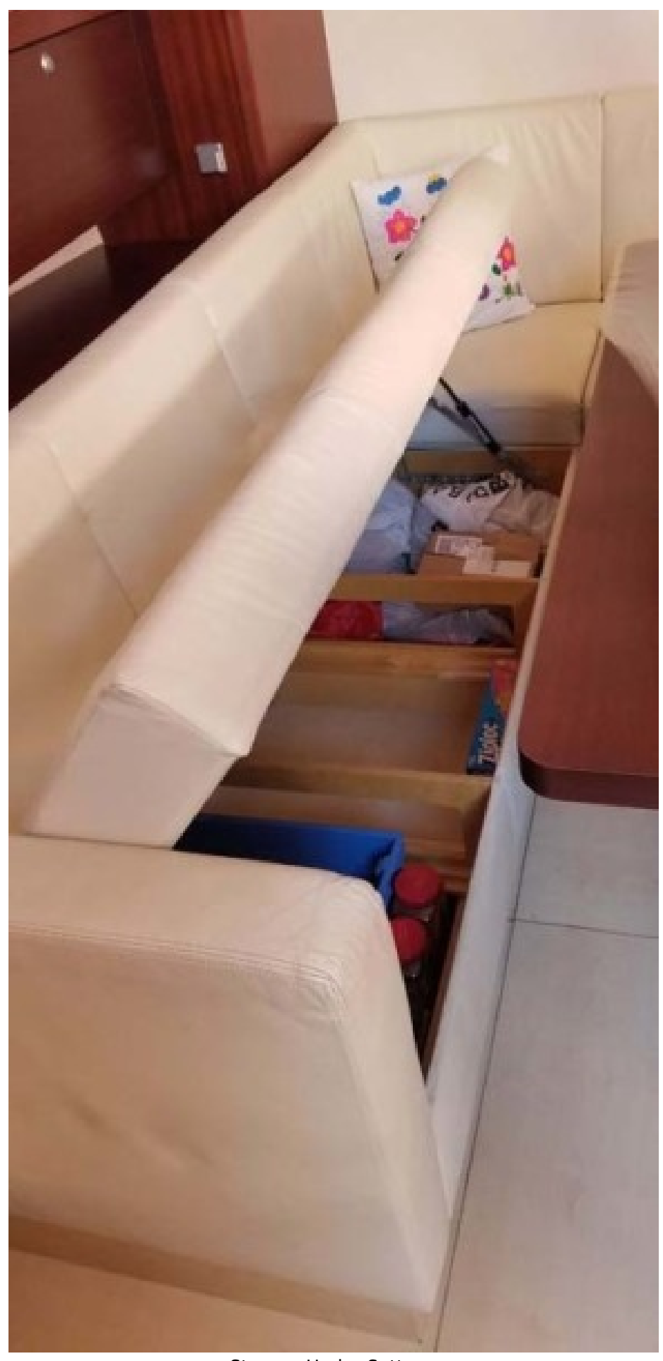
Storage Under Settee