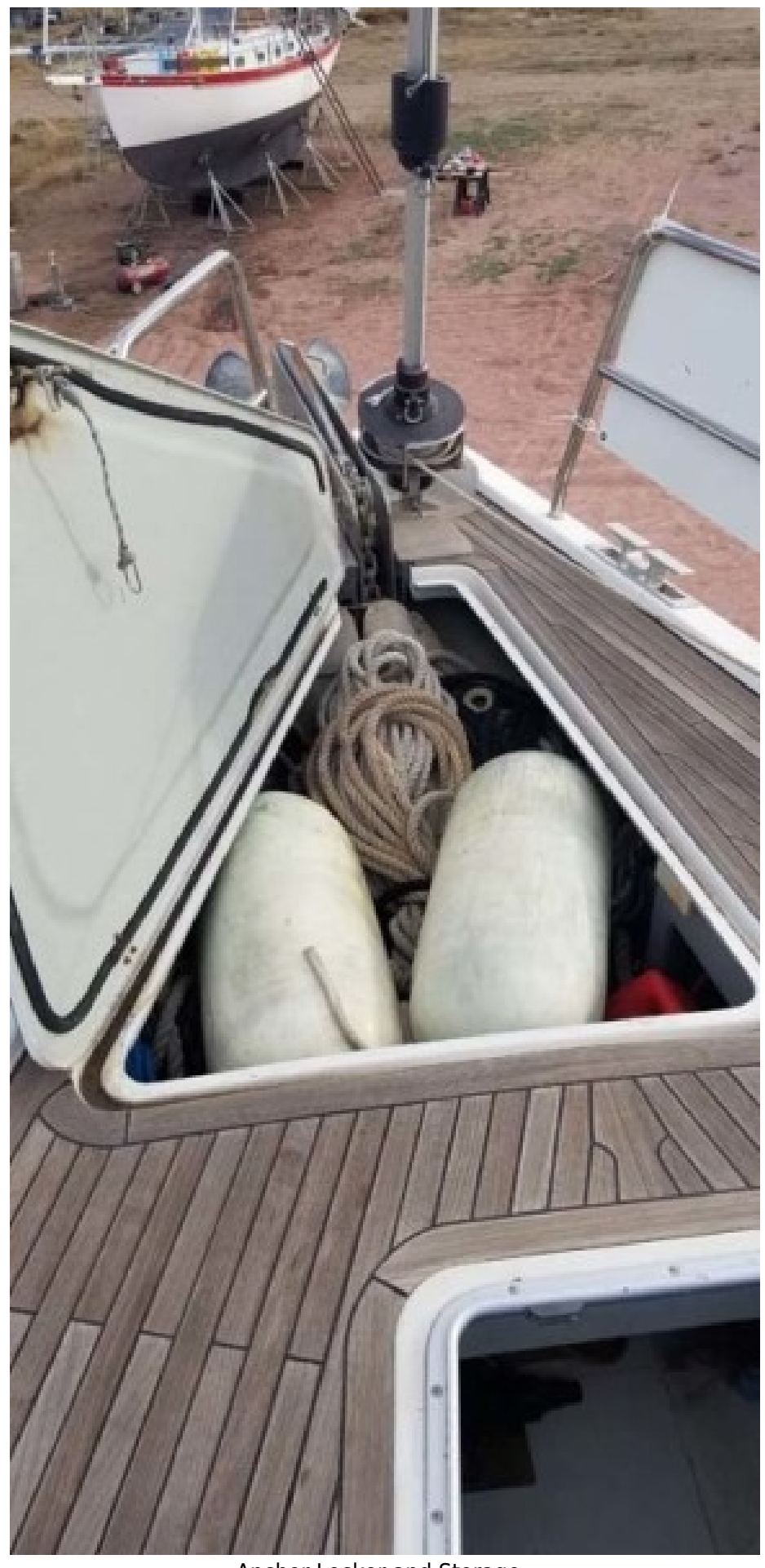
Anchor Locker and Storage