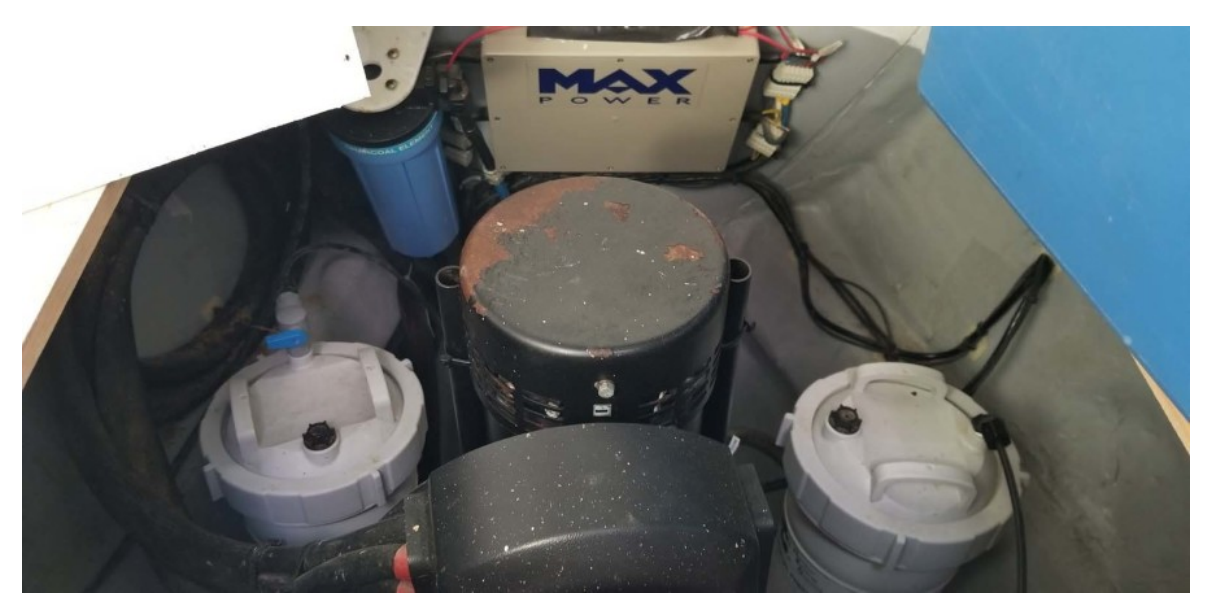
Maxpower Bow Thruster