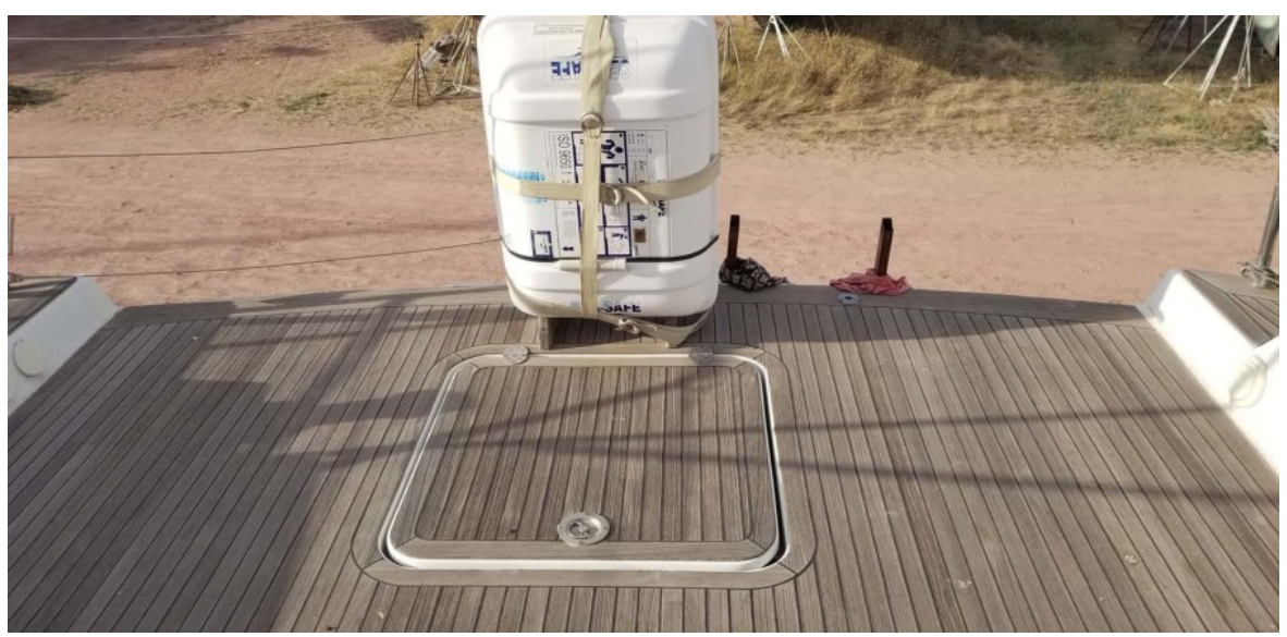
Aft Deck and Life Raft