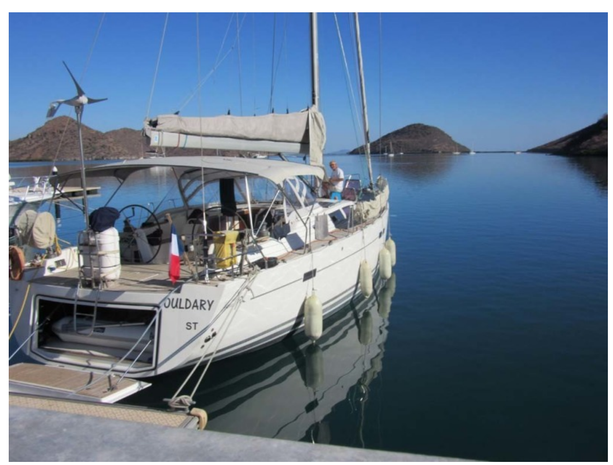
Stern and the Dock with Transom Open