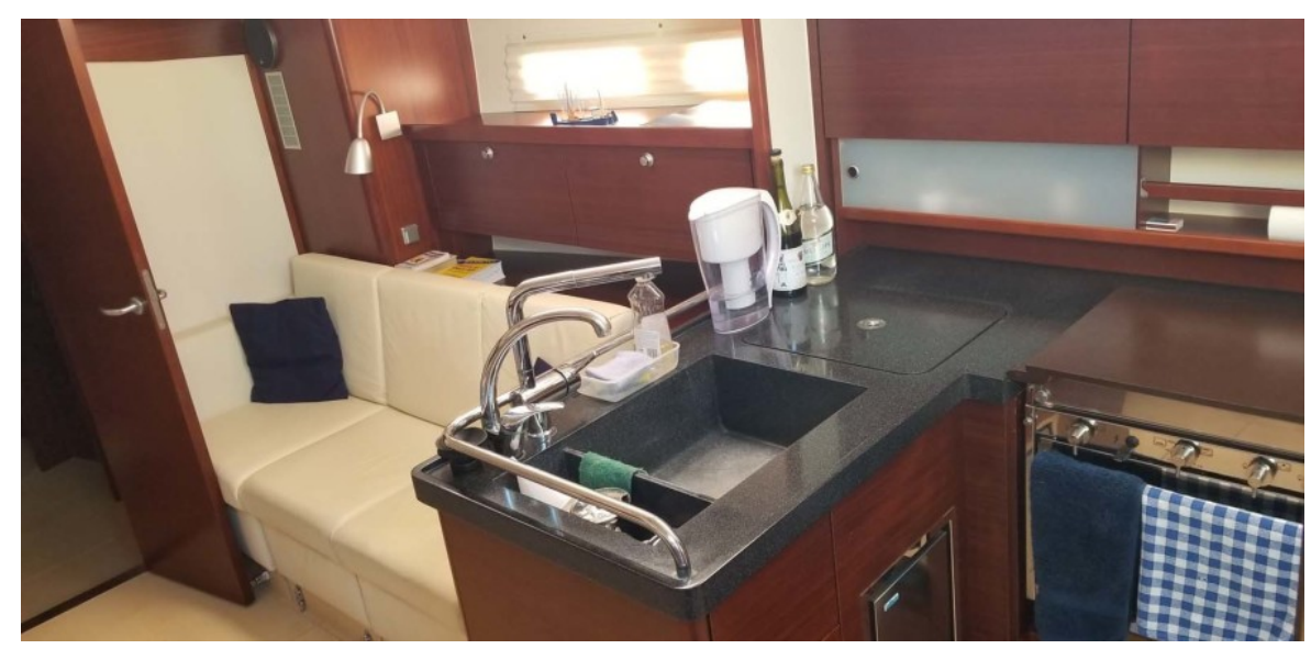
Salon And Galley