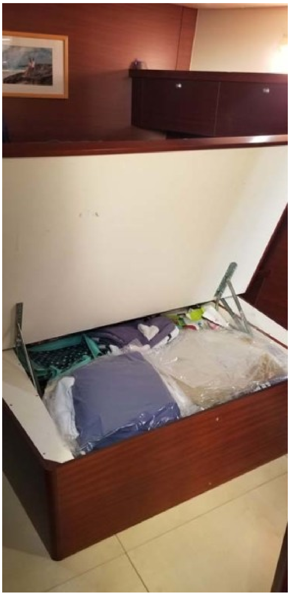
Stoarge Under Berth