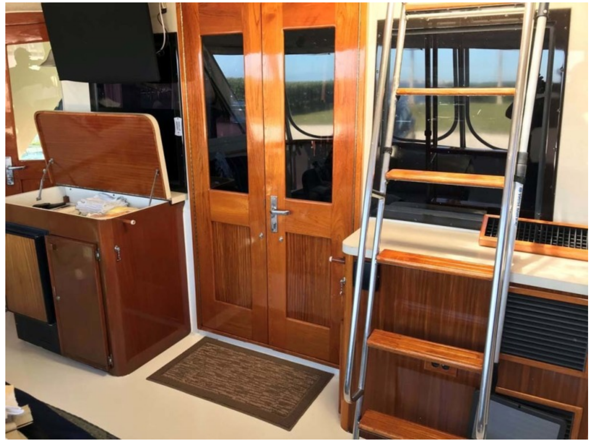
Aft Deck Forward