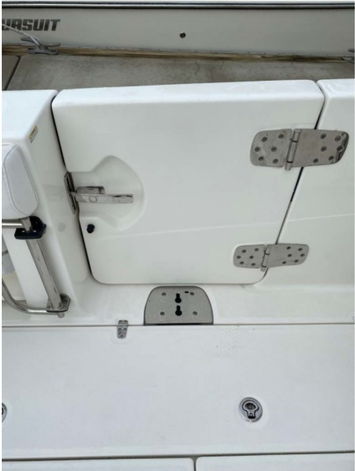
Port Side Dive Boarding Door