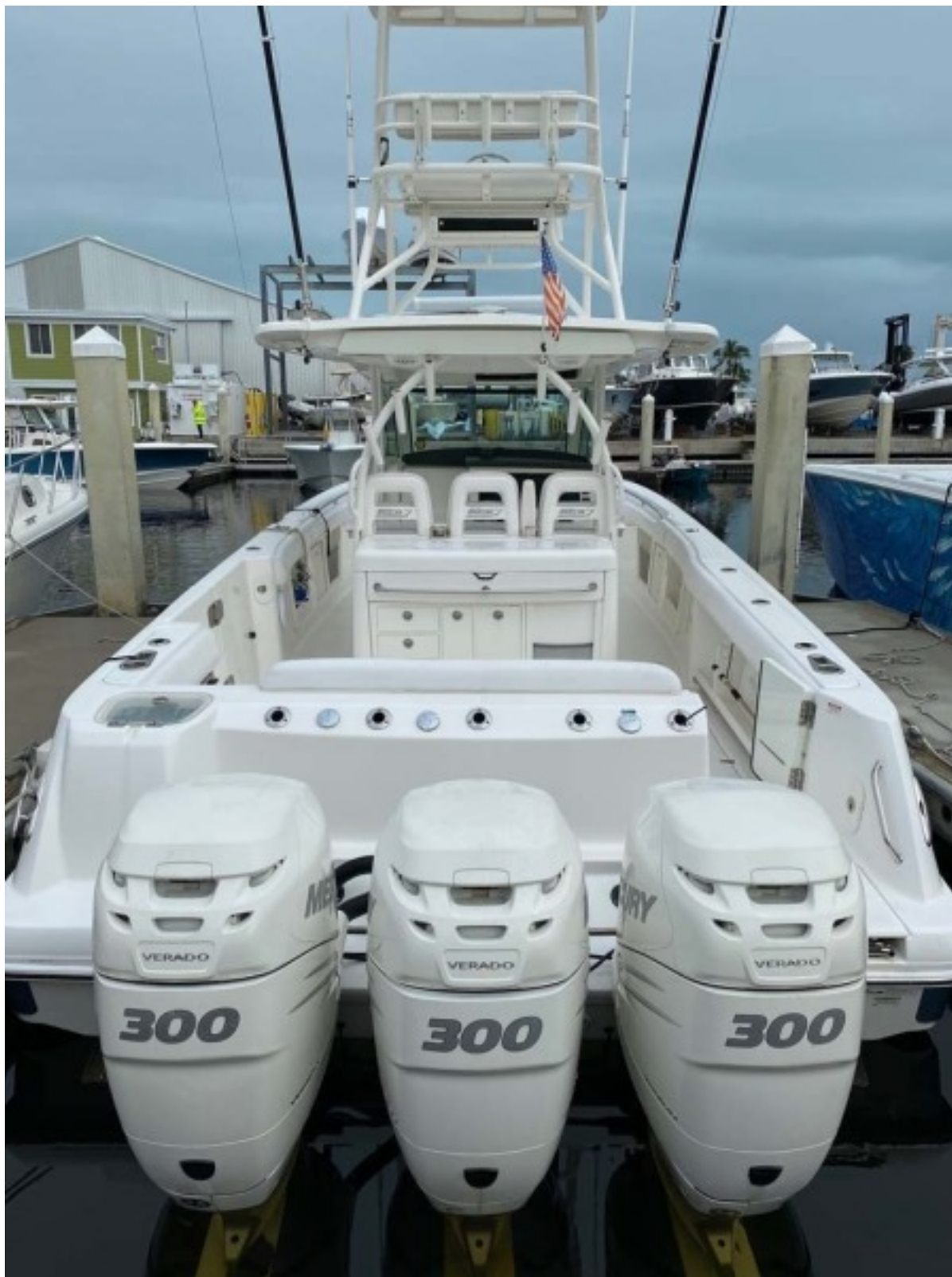
Triple 300HP Mercury