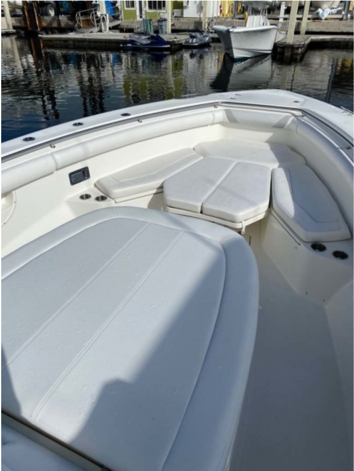
Bow Seating And Storage