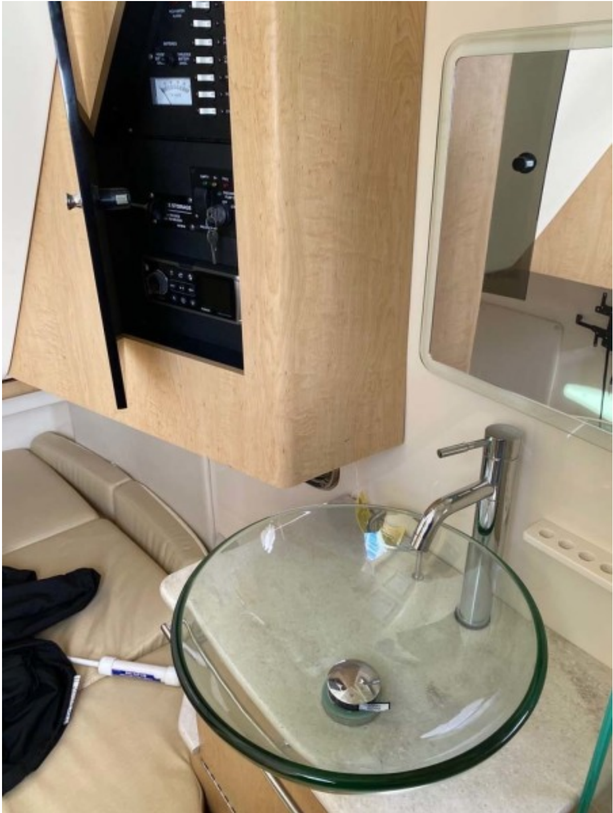
Electrical Panel And Sink