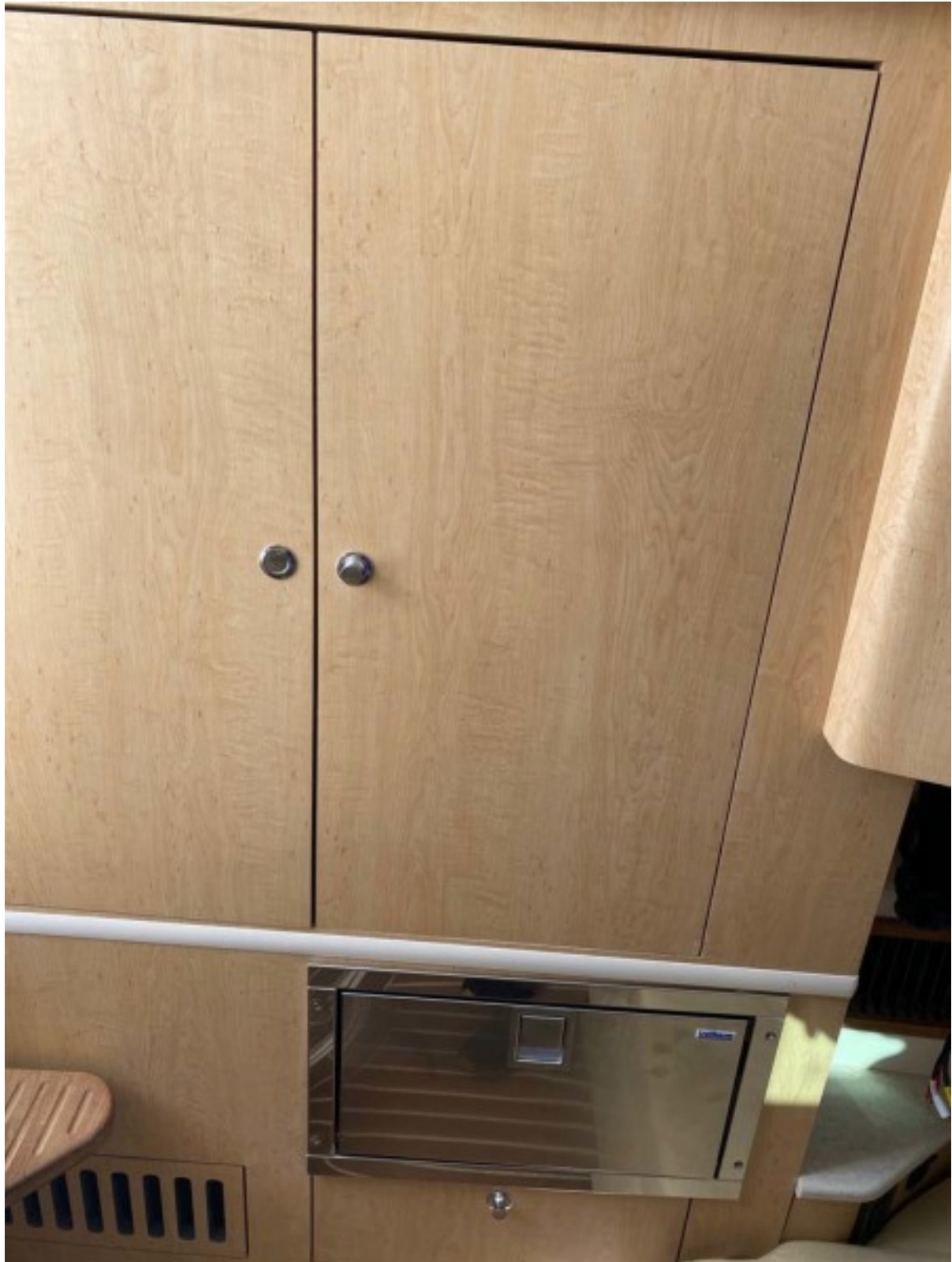
Cabin Entry And Storage