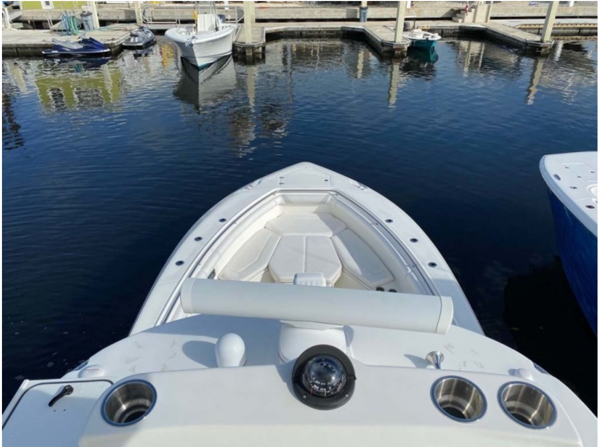
Bow From Tower