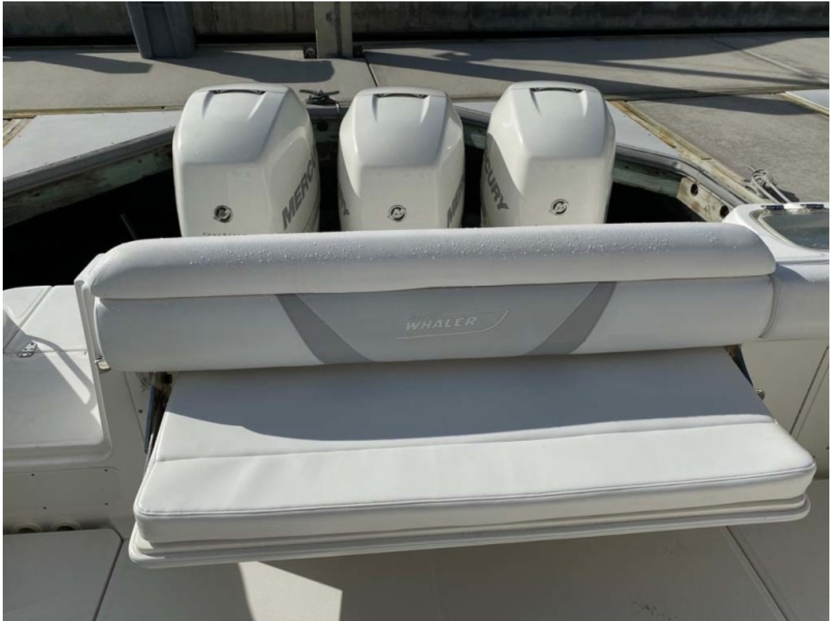
Fold Down Transom Bench