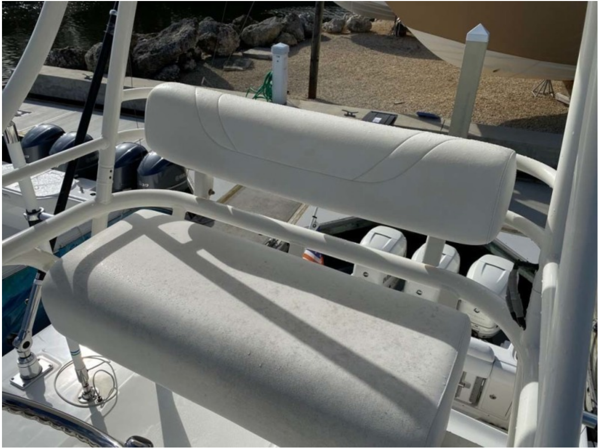
Tower Helm Seat