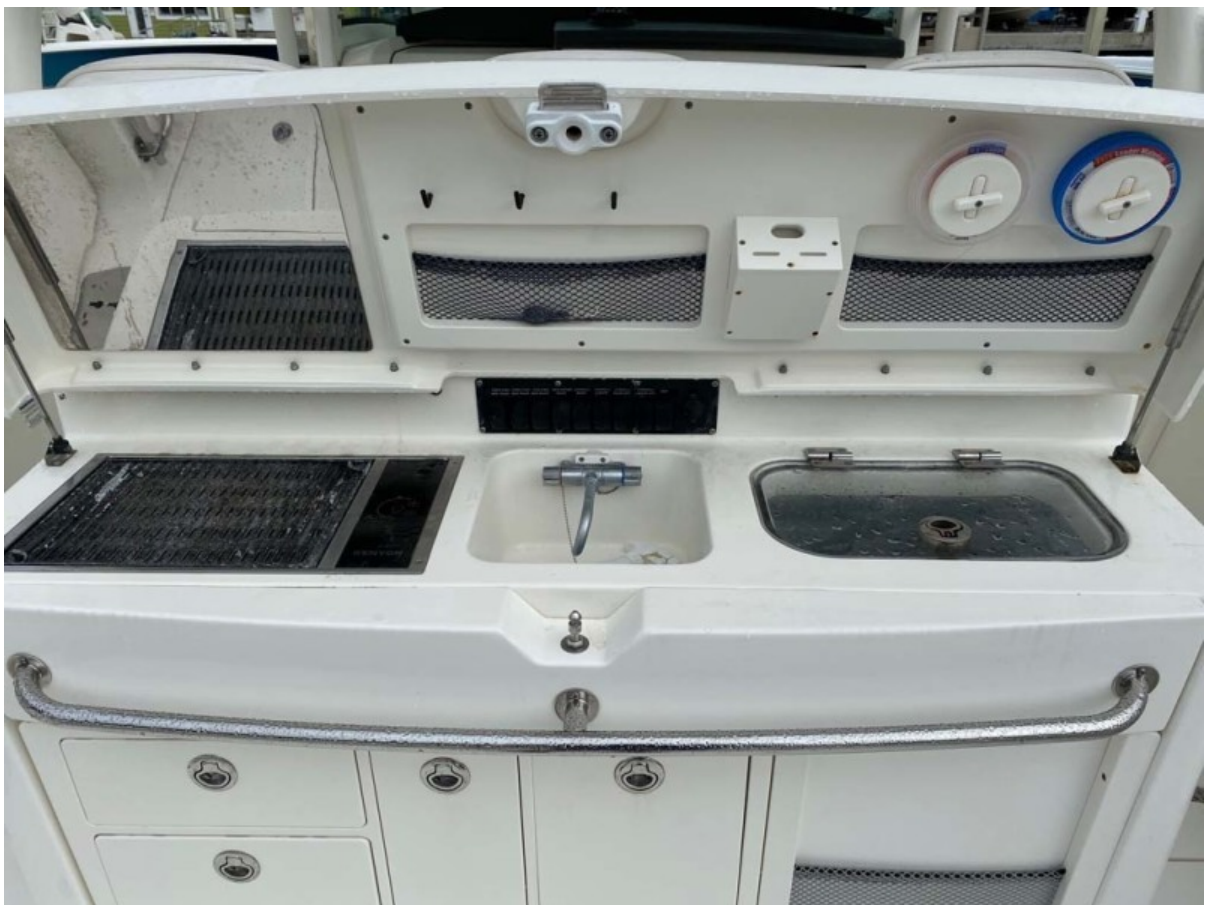
Grill, Refrigerator Freezer And Live Well