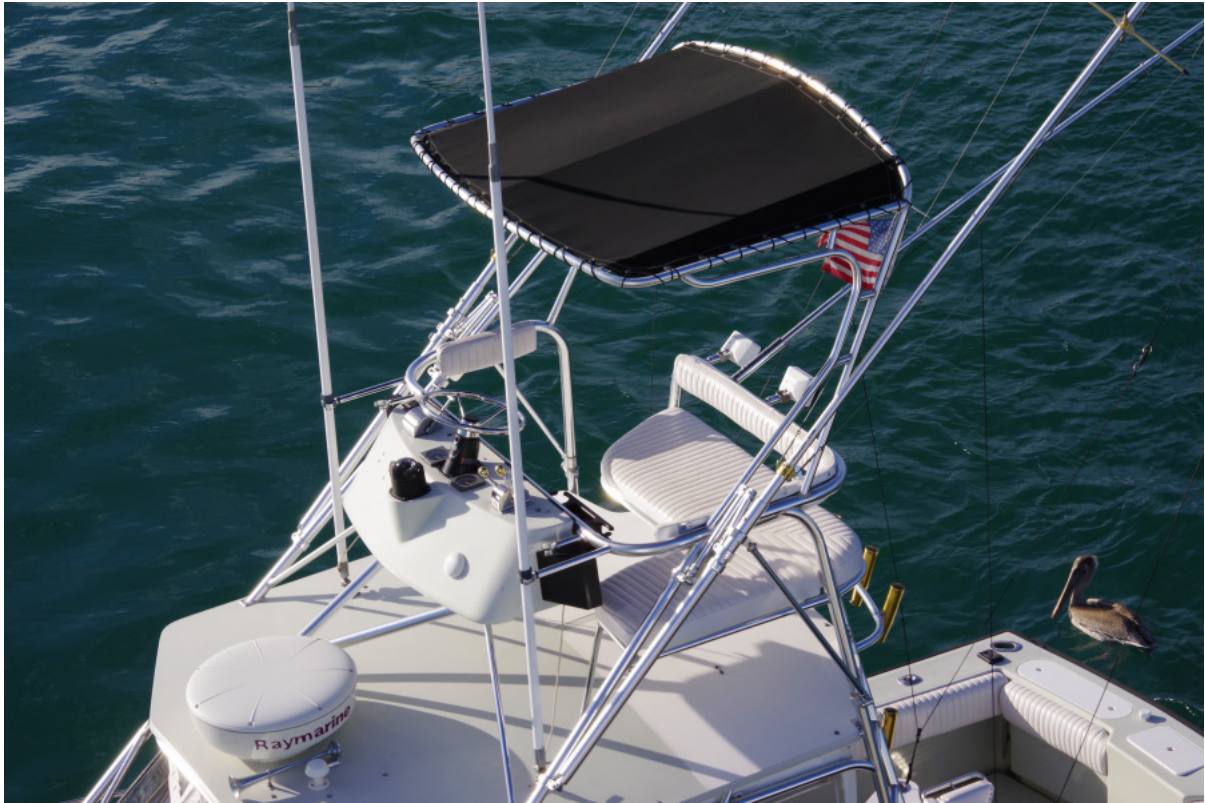
1990 31 Rampage Express - Weekend hooker