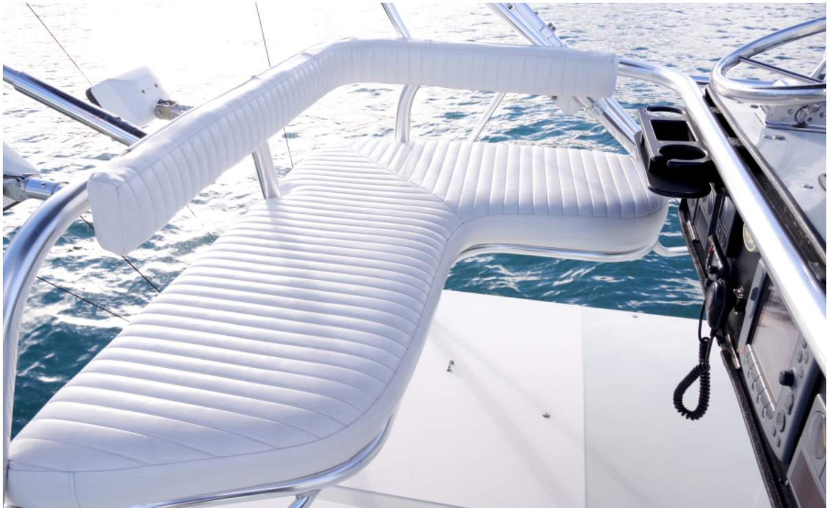
1990 31 Rampage Express - Weekend hooker