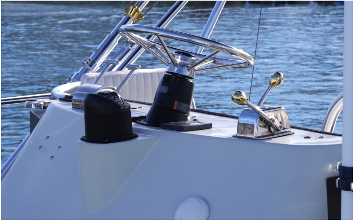
1990 31 Rampage Express - Weekend hooker