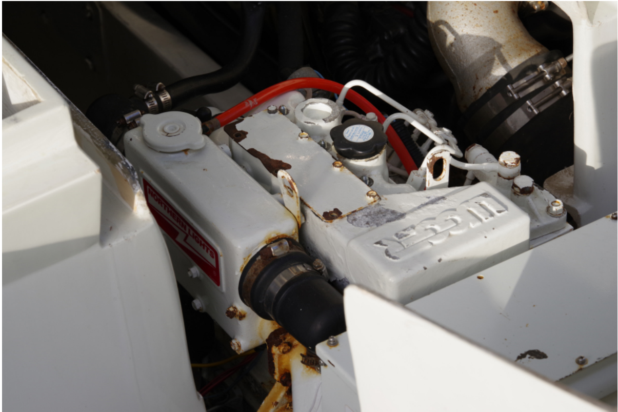
1990 31 Rampage Express - Weekend hooker