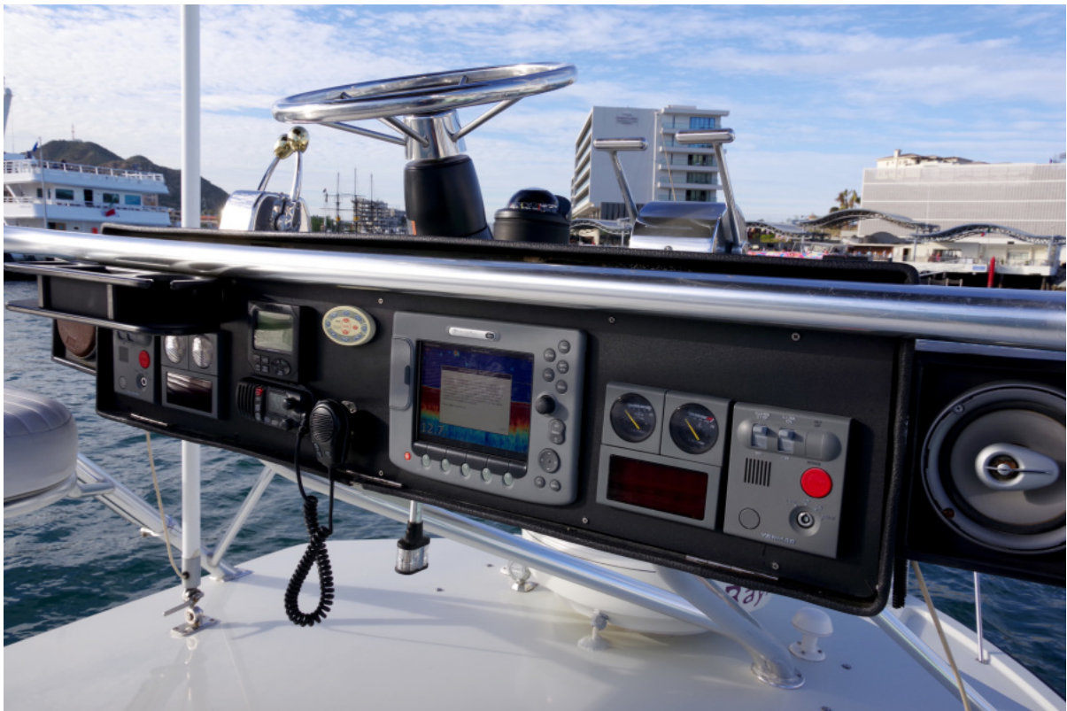
1990 31 Rampage Express - Weekend hooker