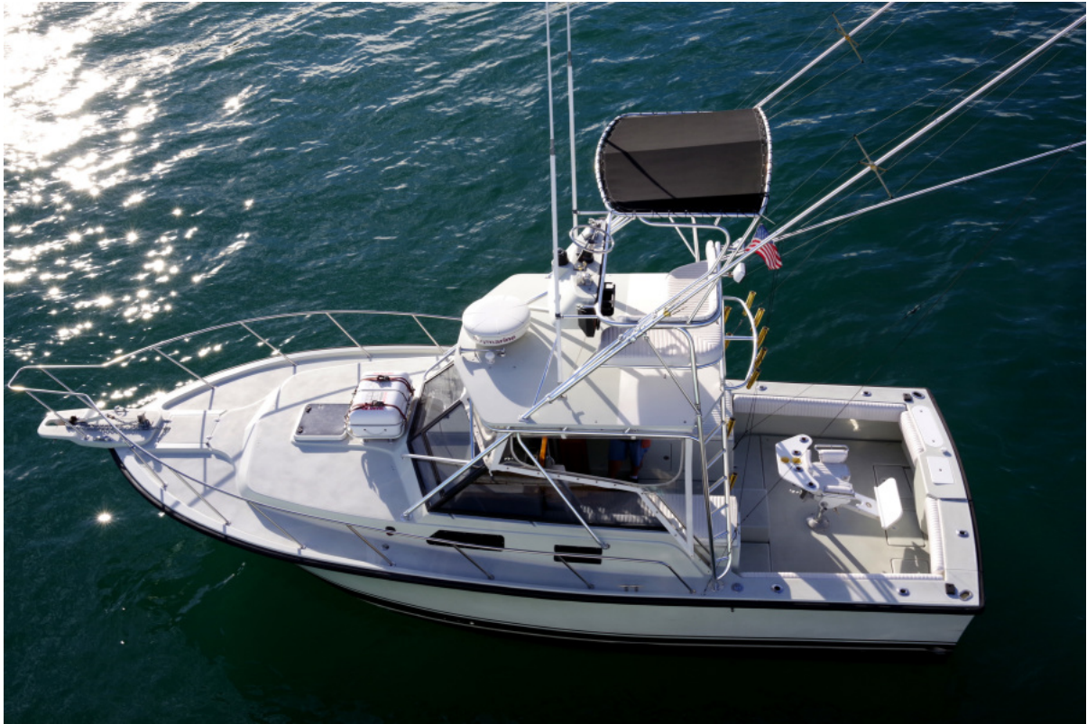
1990 31 Rampage Express - Weekend hooker