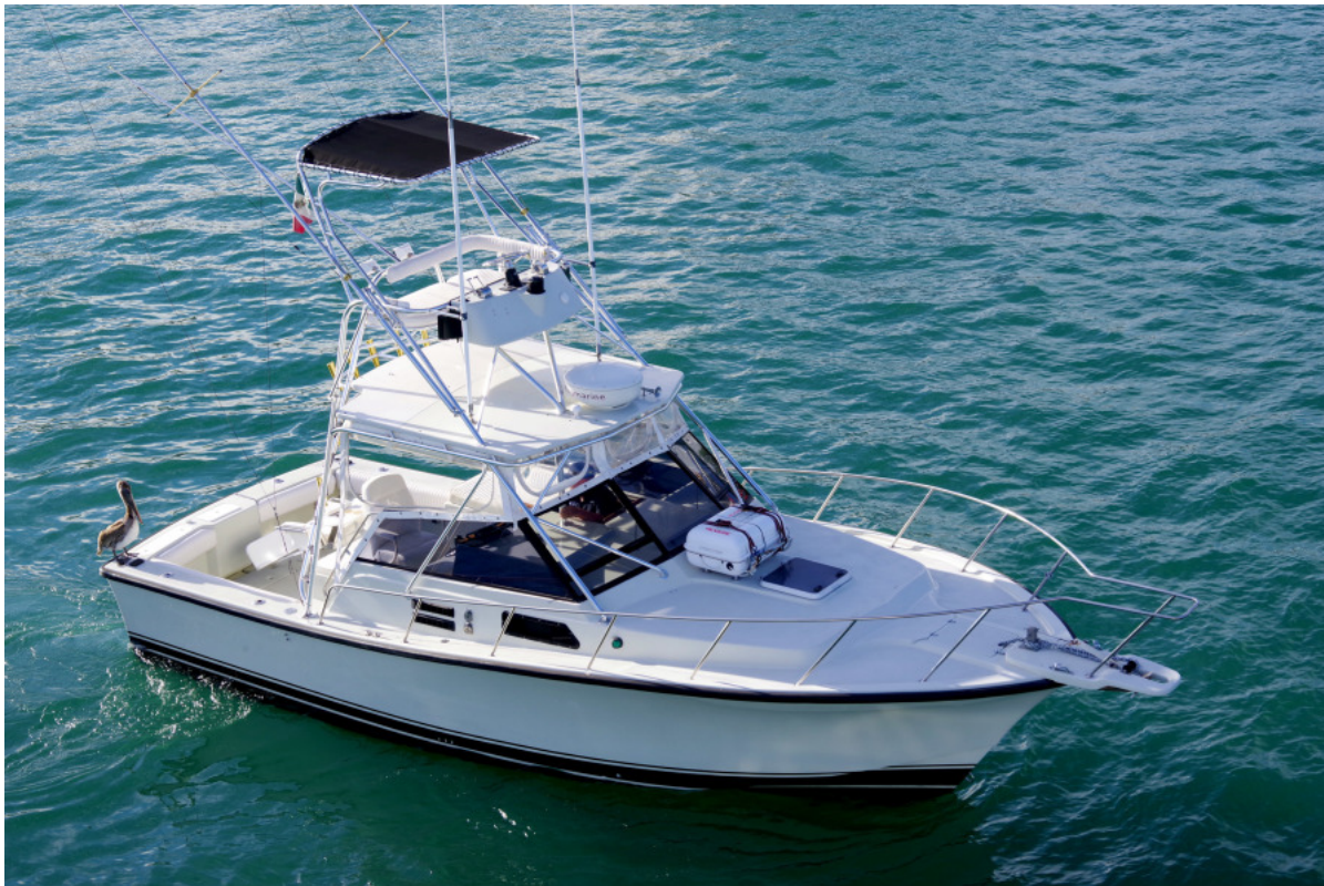
1990 31 Rampage Express - Weekend hooker