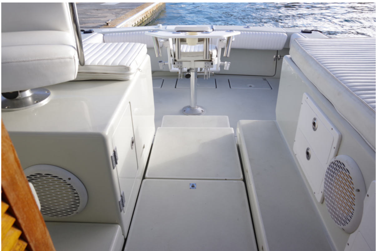
1990 31 Rampage Express - Weekend hooker