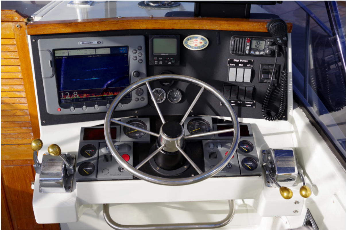
1990 31 Rampage Express - Weekend hooker