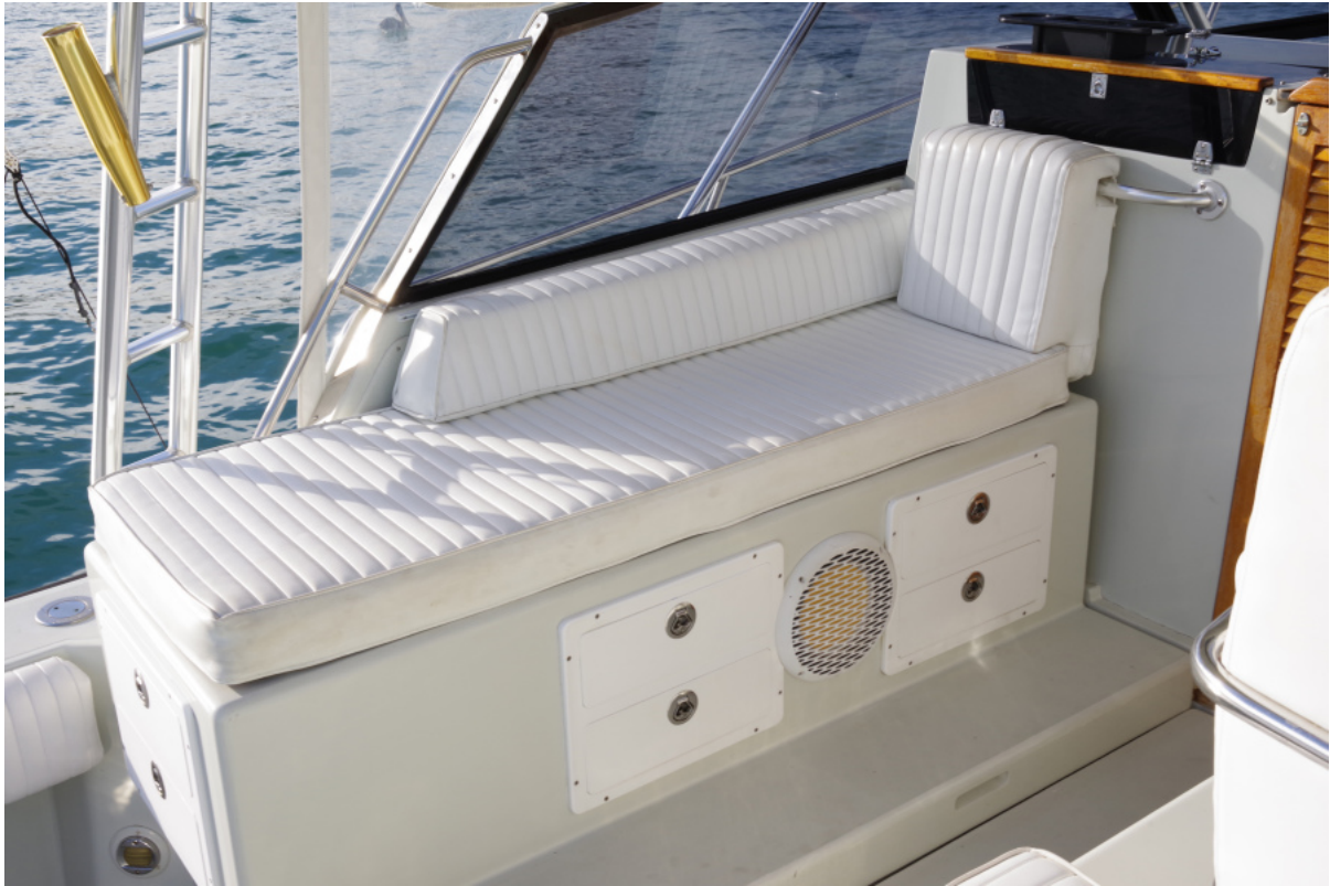
1990 31 Rampage Express - Weekend hooker