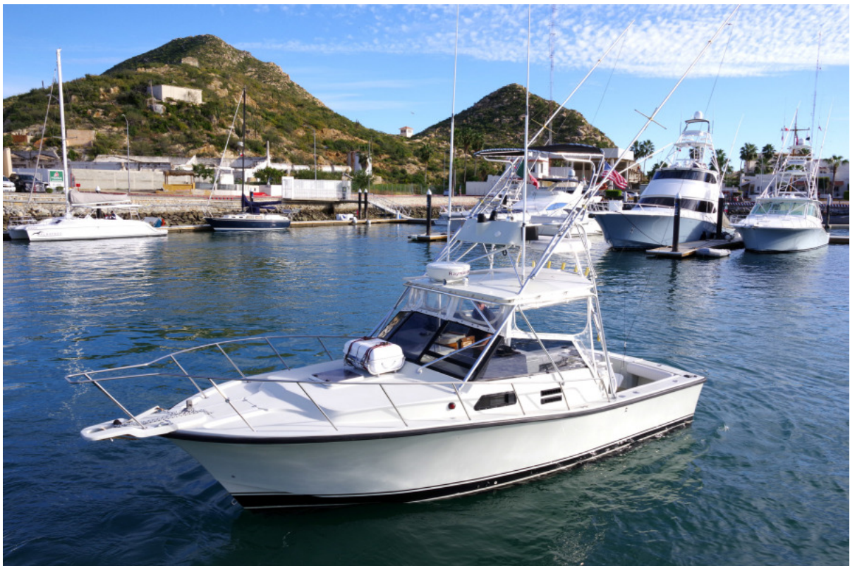
1990 31 Rampage Express - Weekend hooker