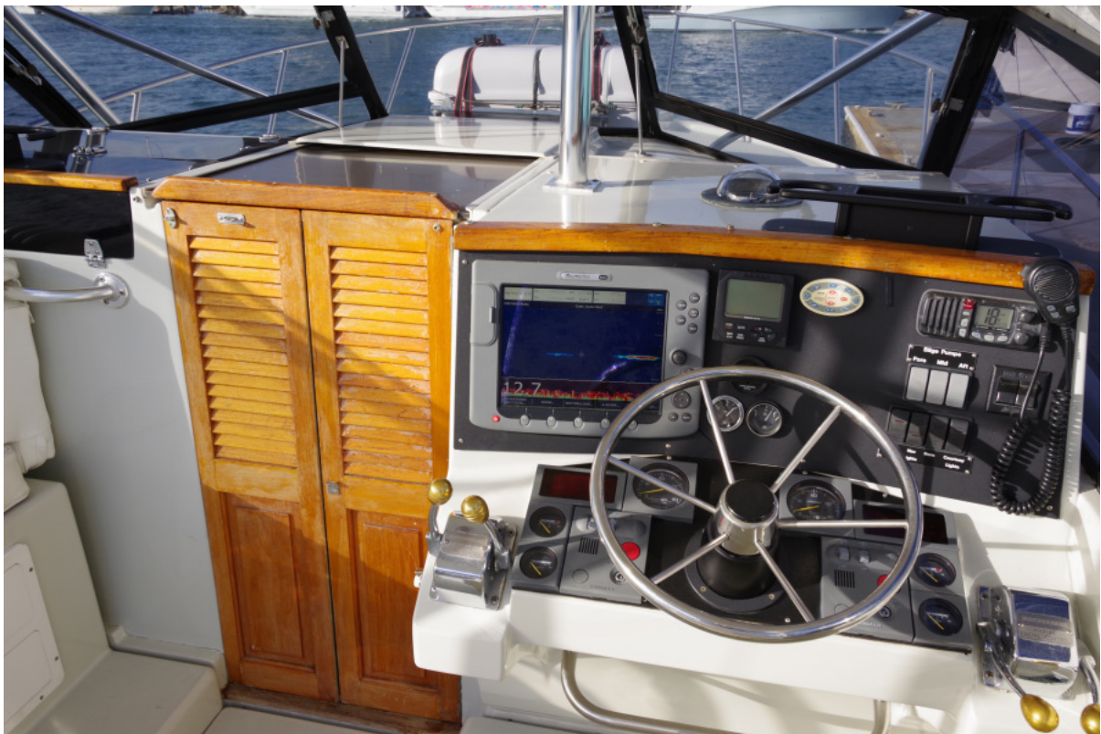
1990 31 Rampage Express - Weekend hooker