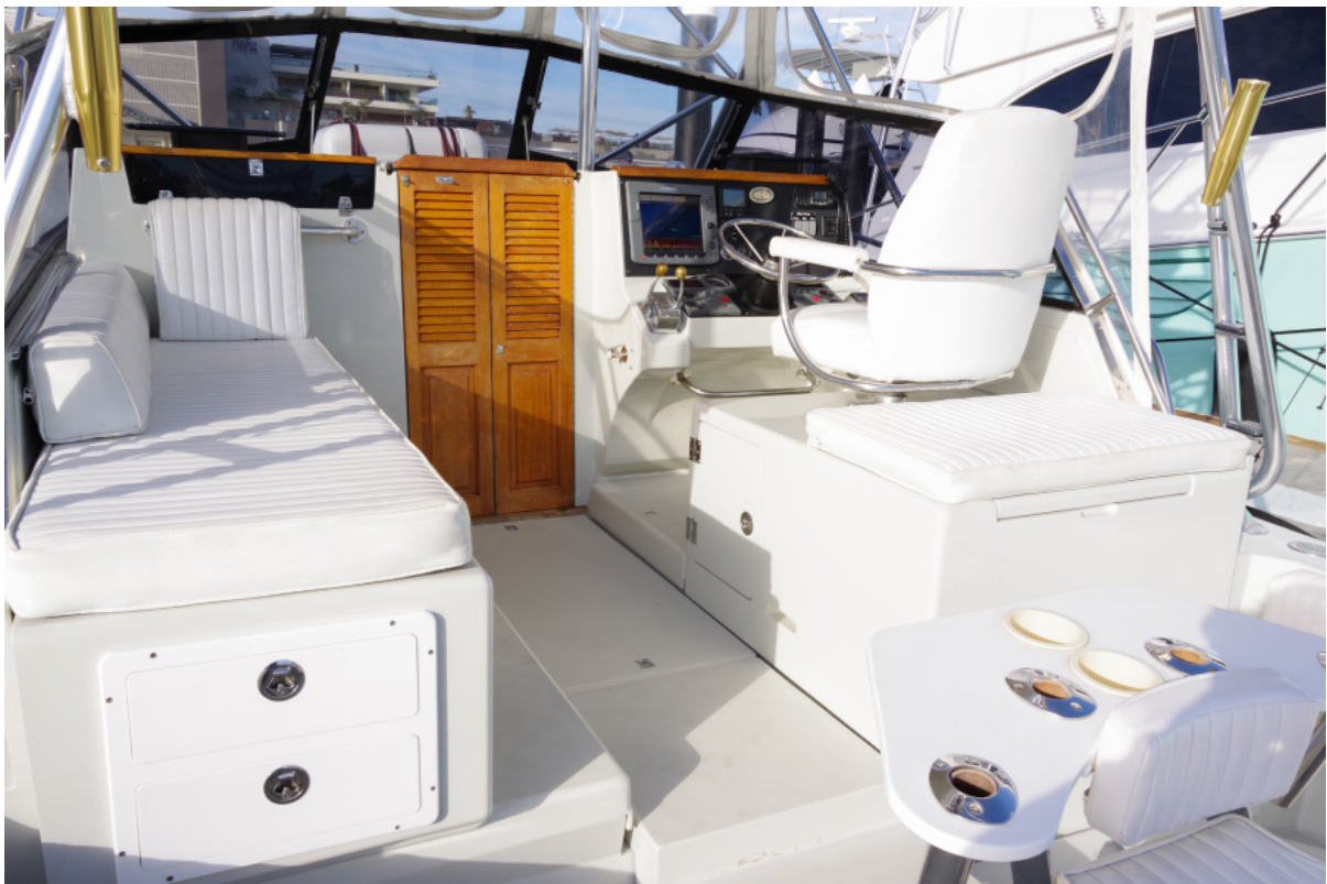
1990 31 Rampage Express - Weekend hooker