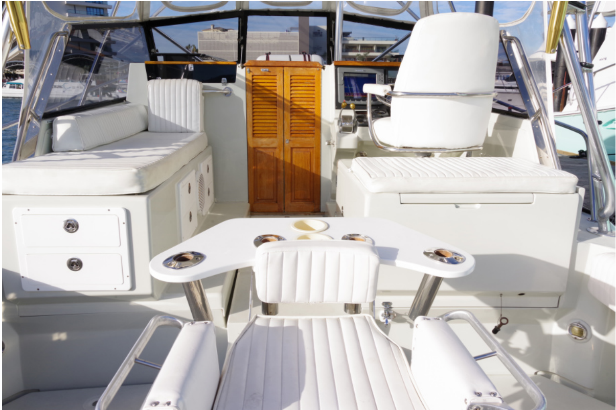
1990 31 Rampage Express - Weekend hooker