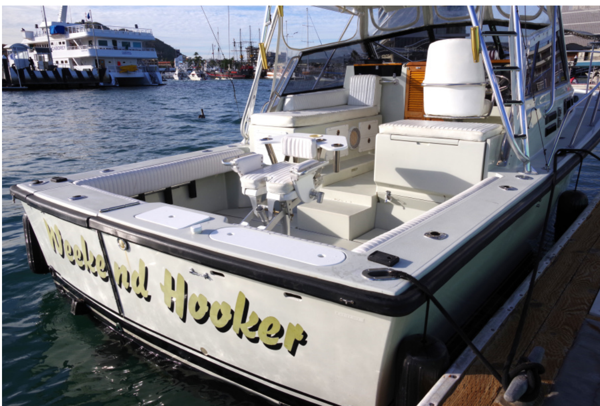
1990 31 Rampage Express - Weekend hooker