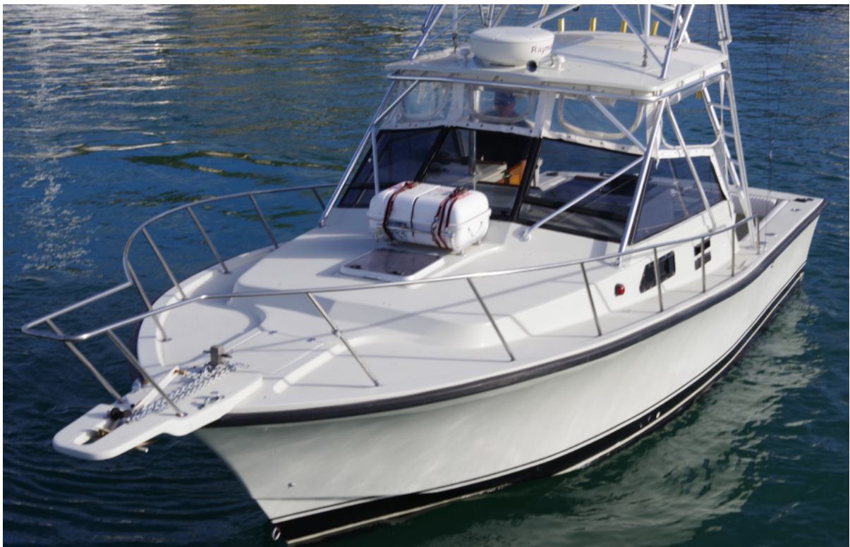
1990 31 Rampage Express - Weekend hooker