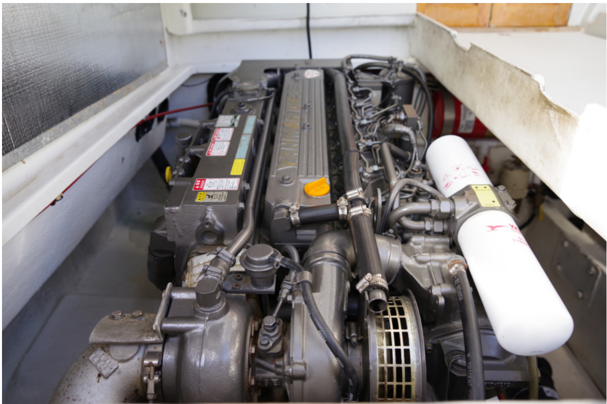
1990 31 Rampage Express - Weekend hooker