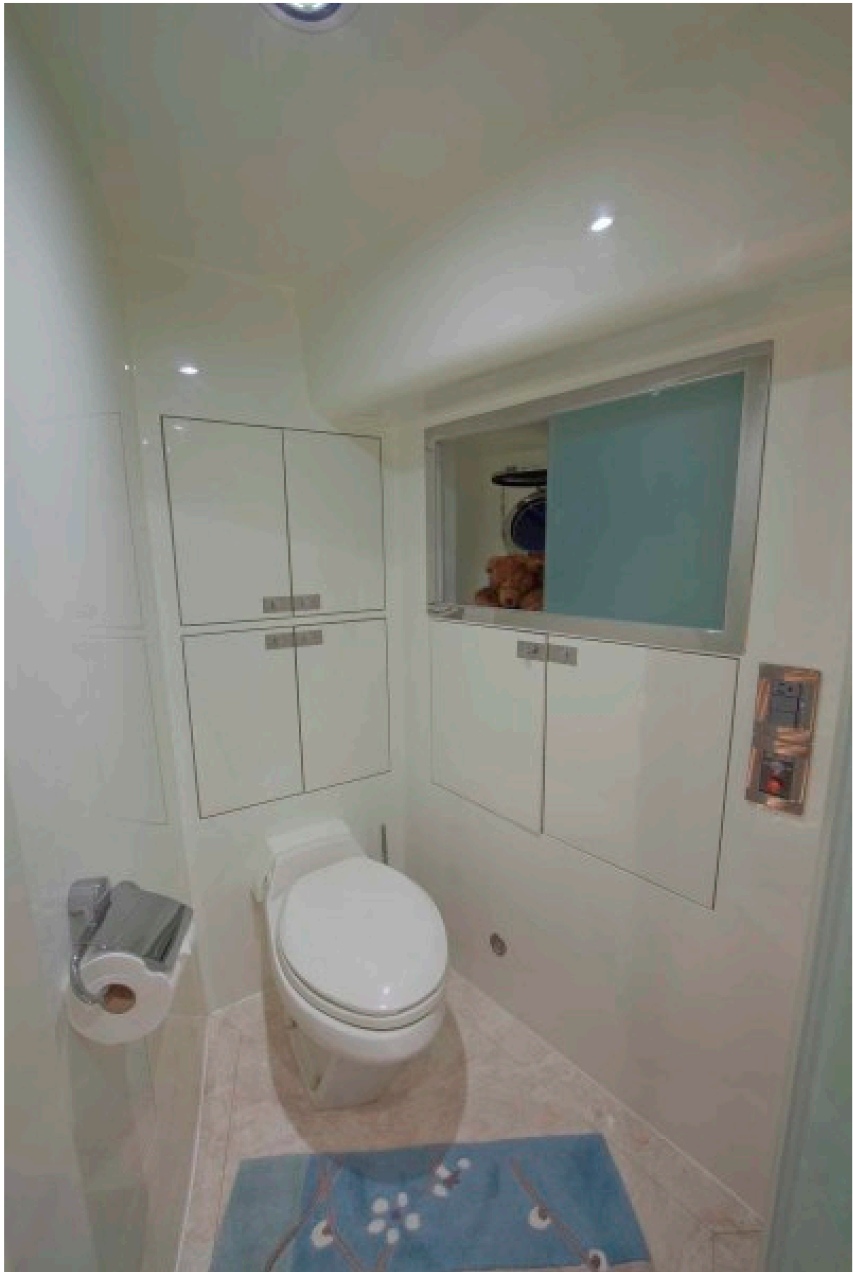
Private Master Head