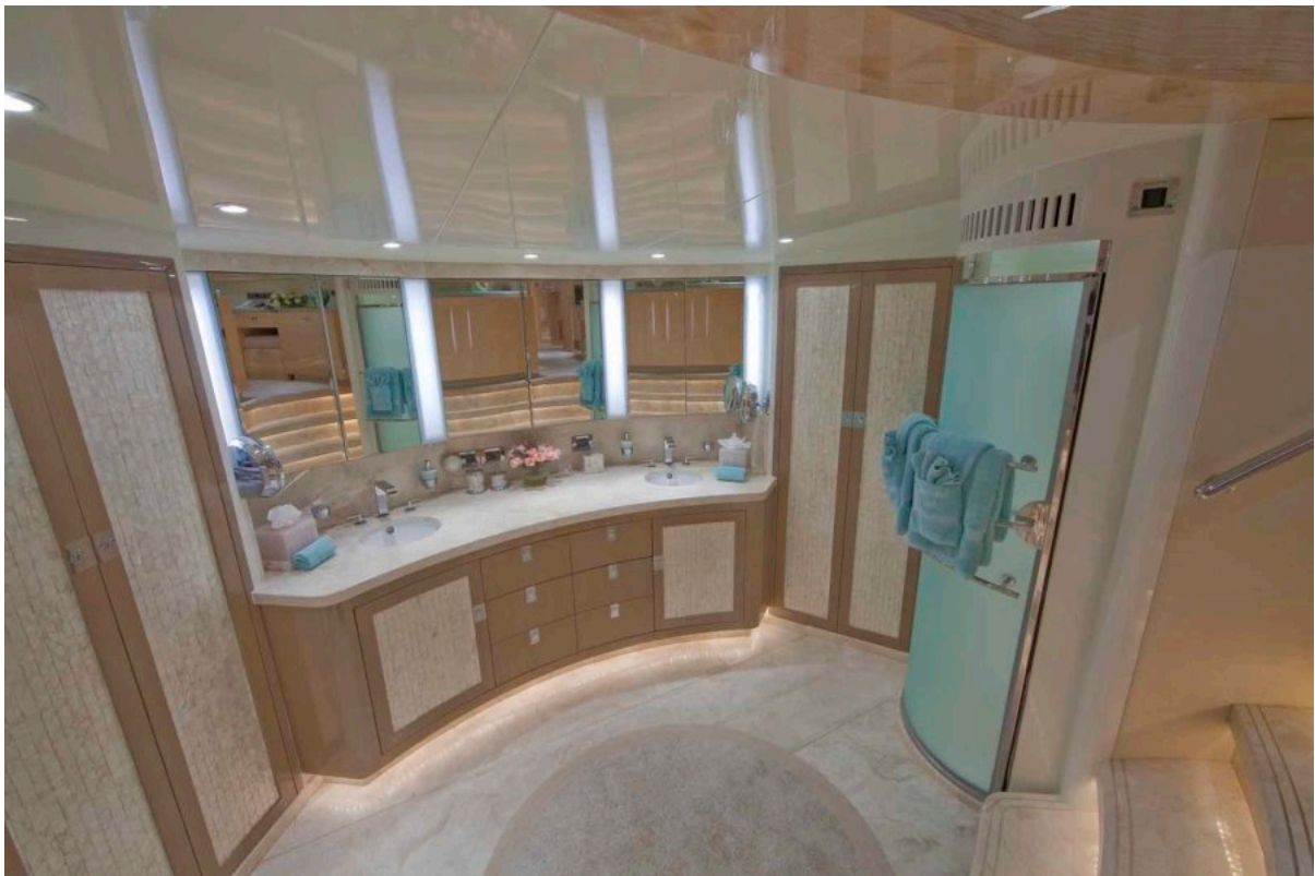
Master Head Looking Forward