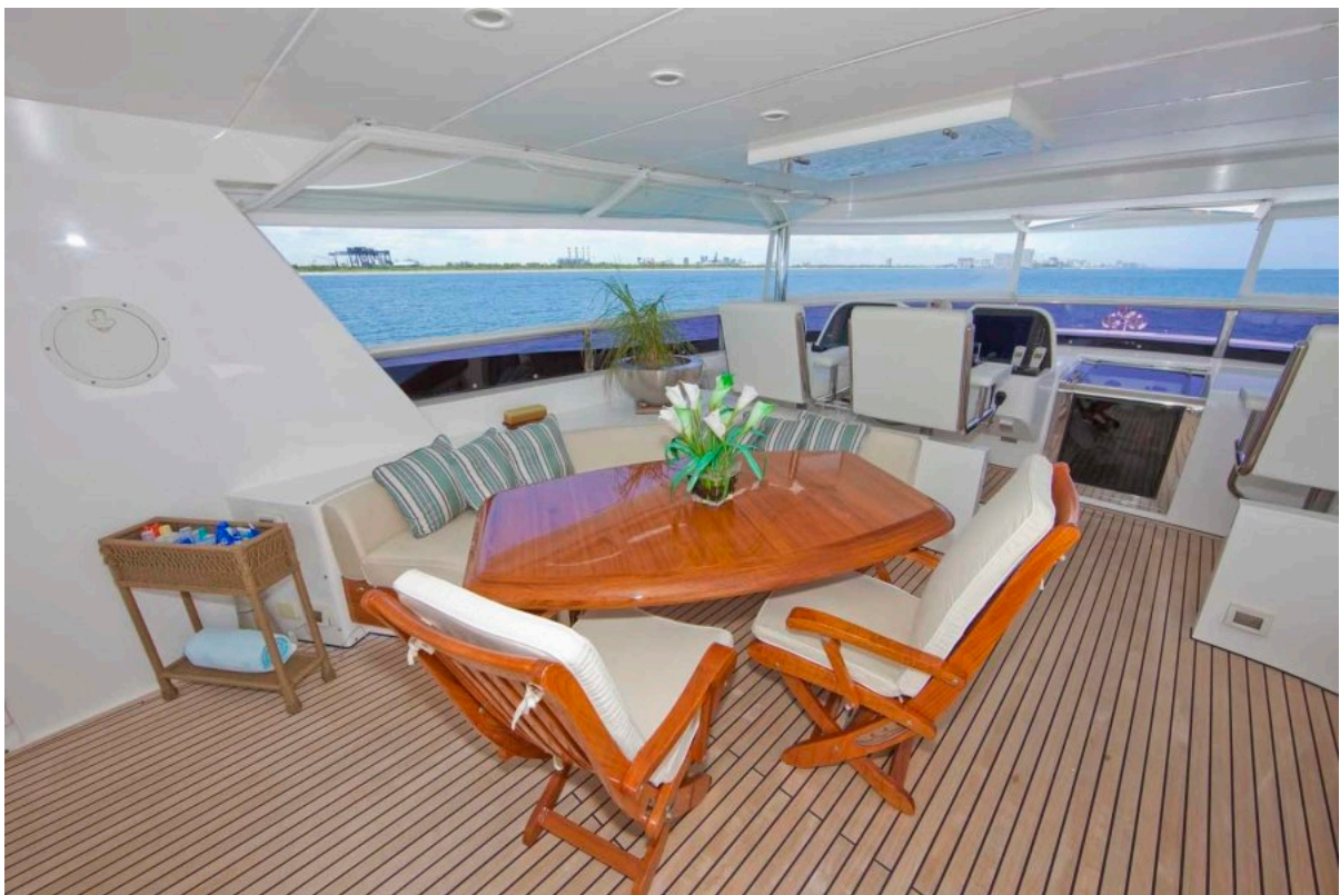
Portside Forward Seating Looking Forward