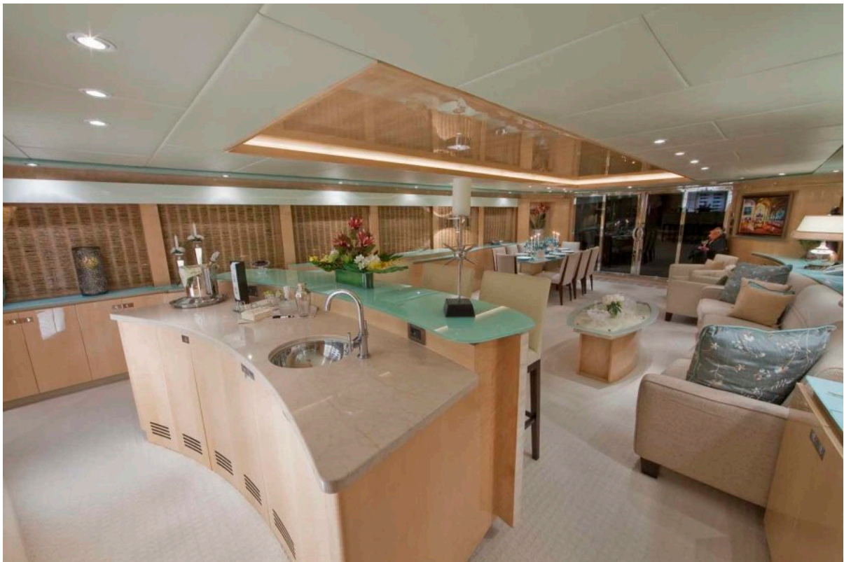
Bar Forward in Salon