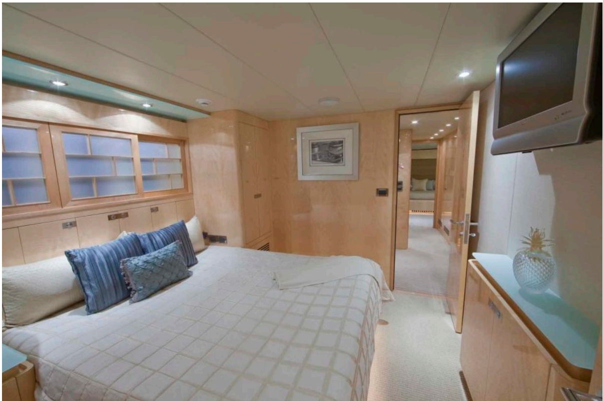
Portside VIP Looking Forward