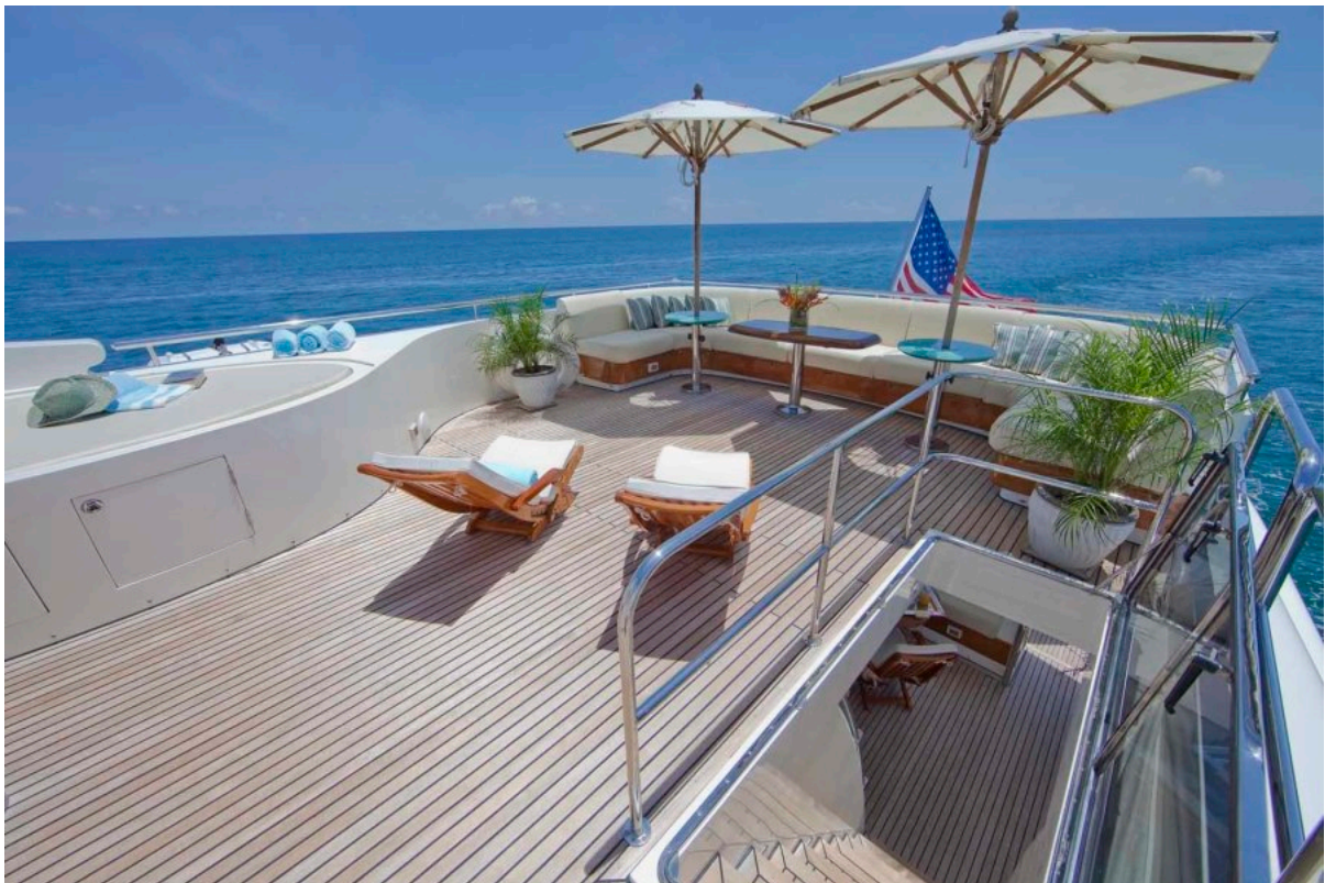
Sun Deck Looking Aft