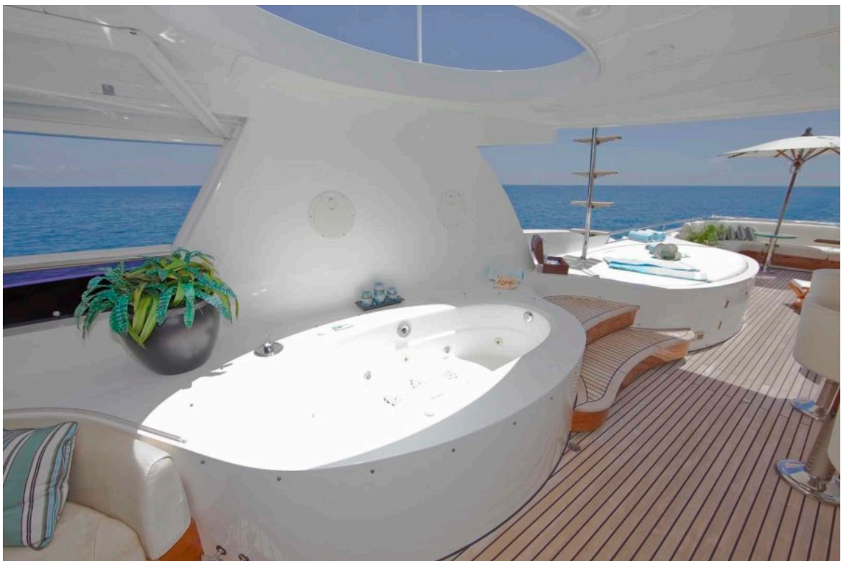
Jacuzzi Tub Looking Aft