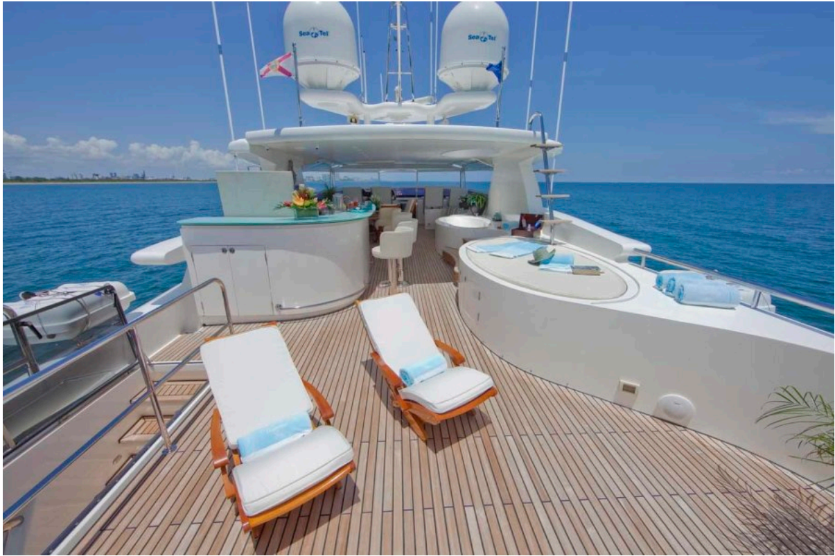
Sun Deck Aft Looking Forward