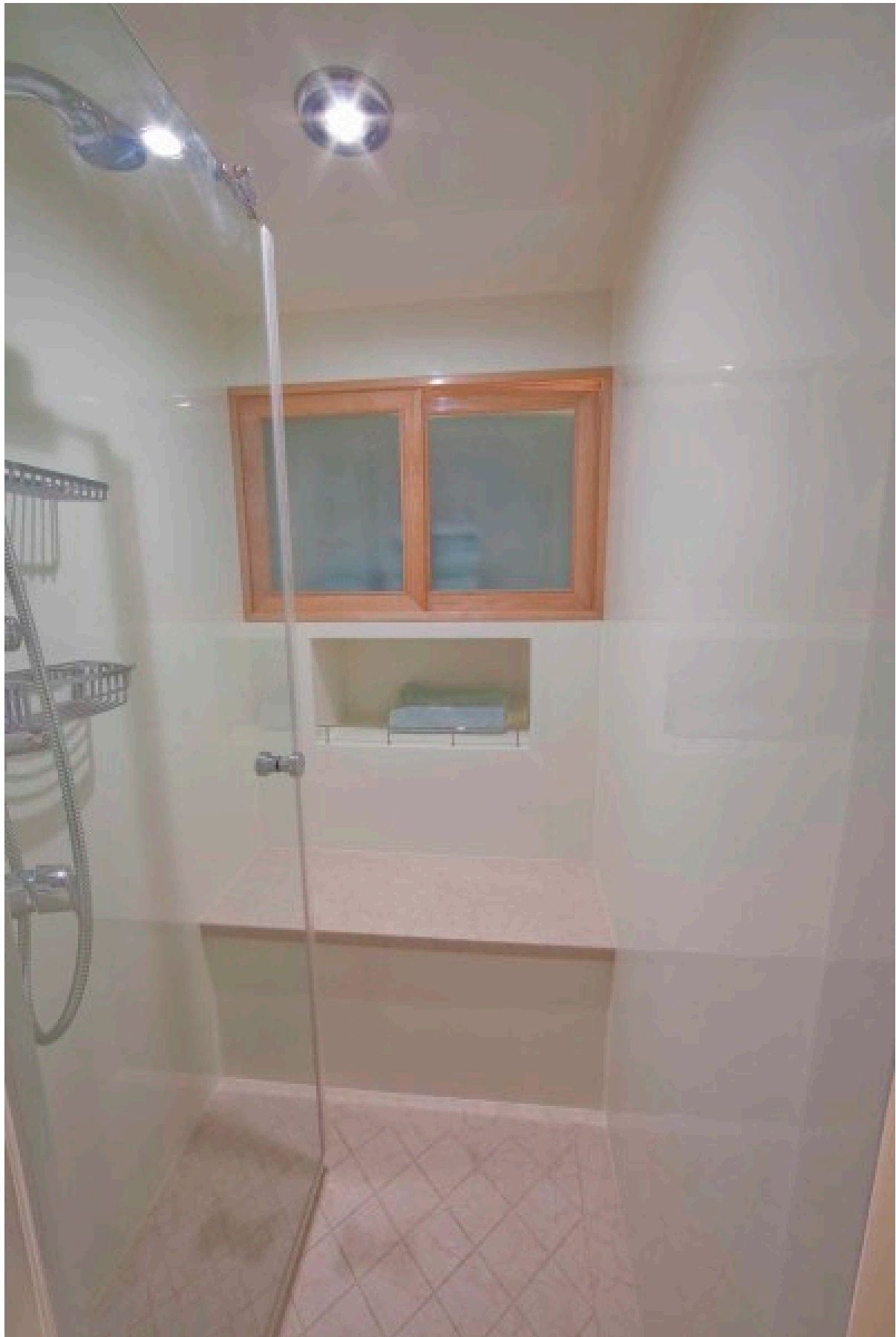
Starboard VIP Shower