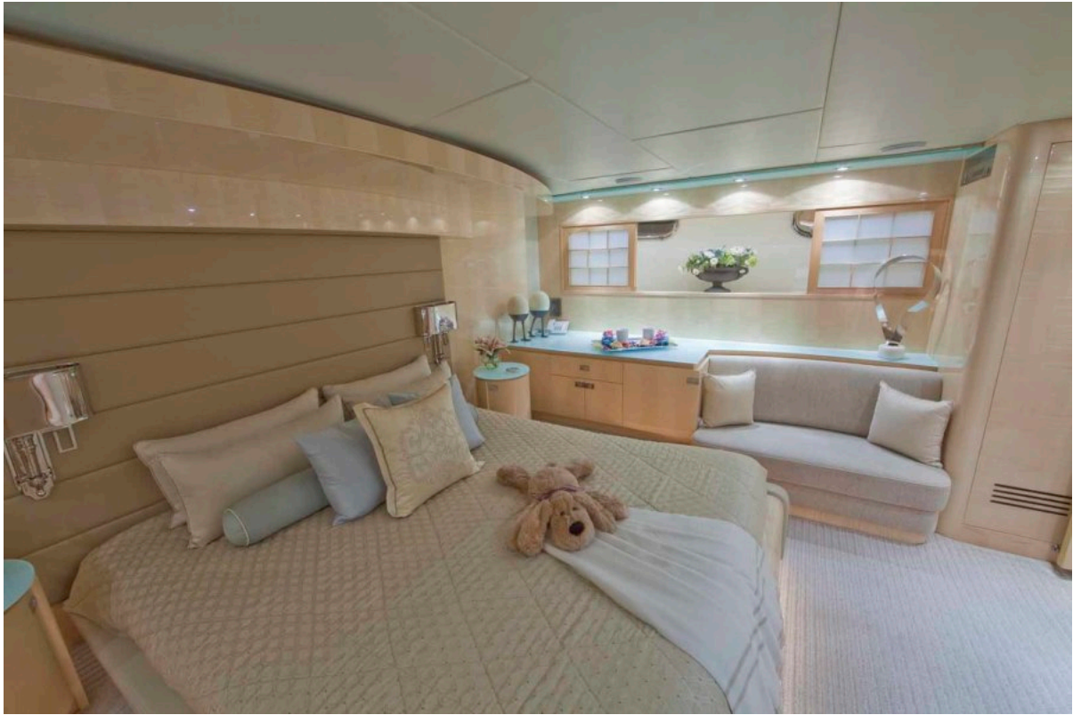
VIP to Starboard