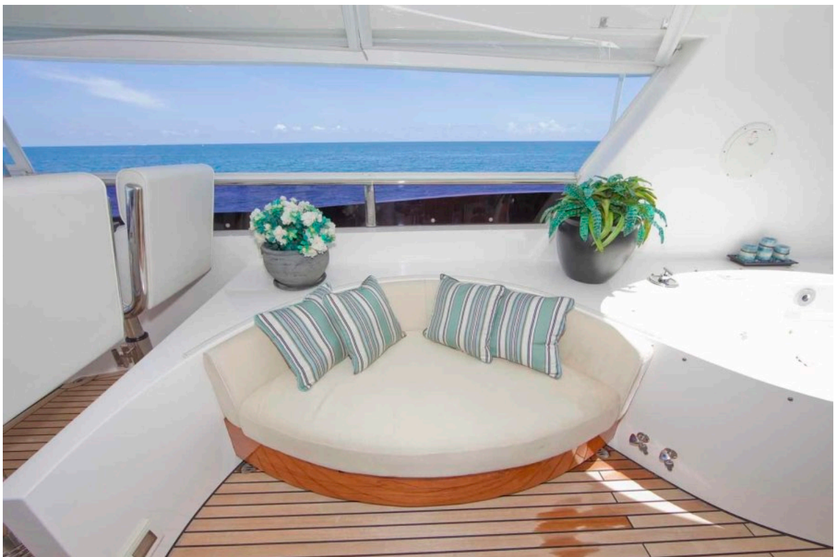
Starboard Side Settee