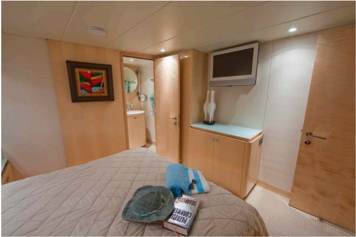
Starboard Side VIP Looking Inboard