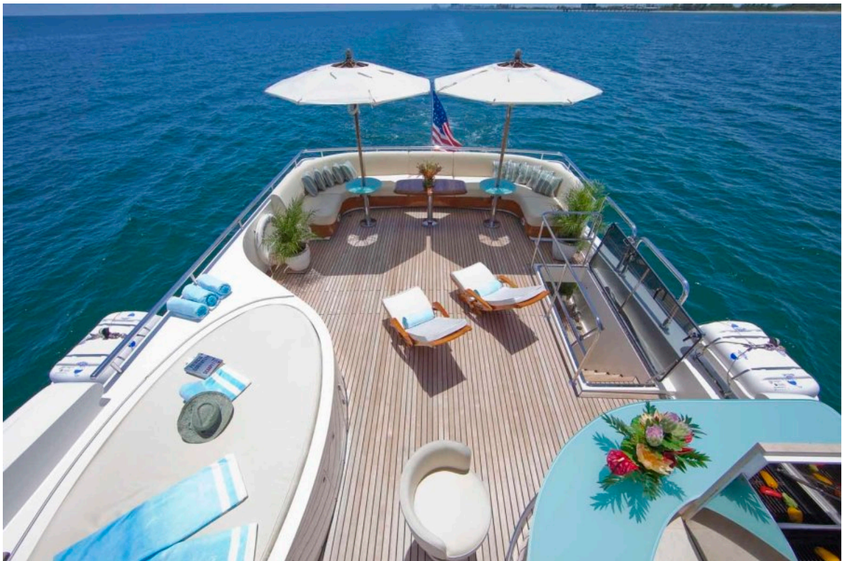
Sun Deck Aft From Above