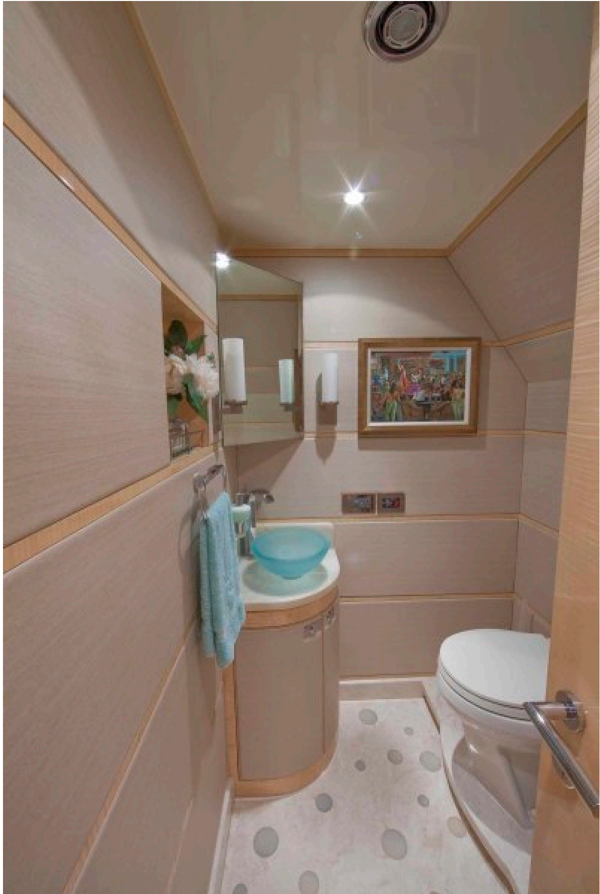
Main Deck Day Head