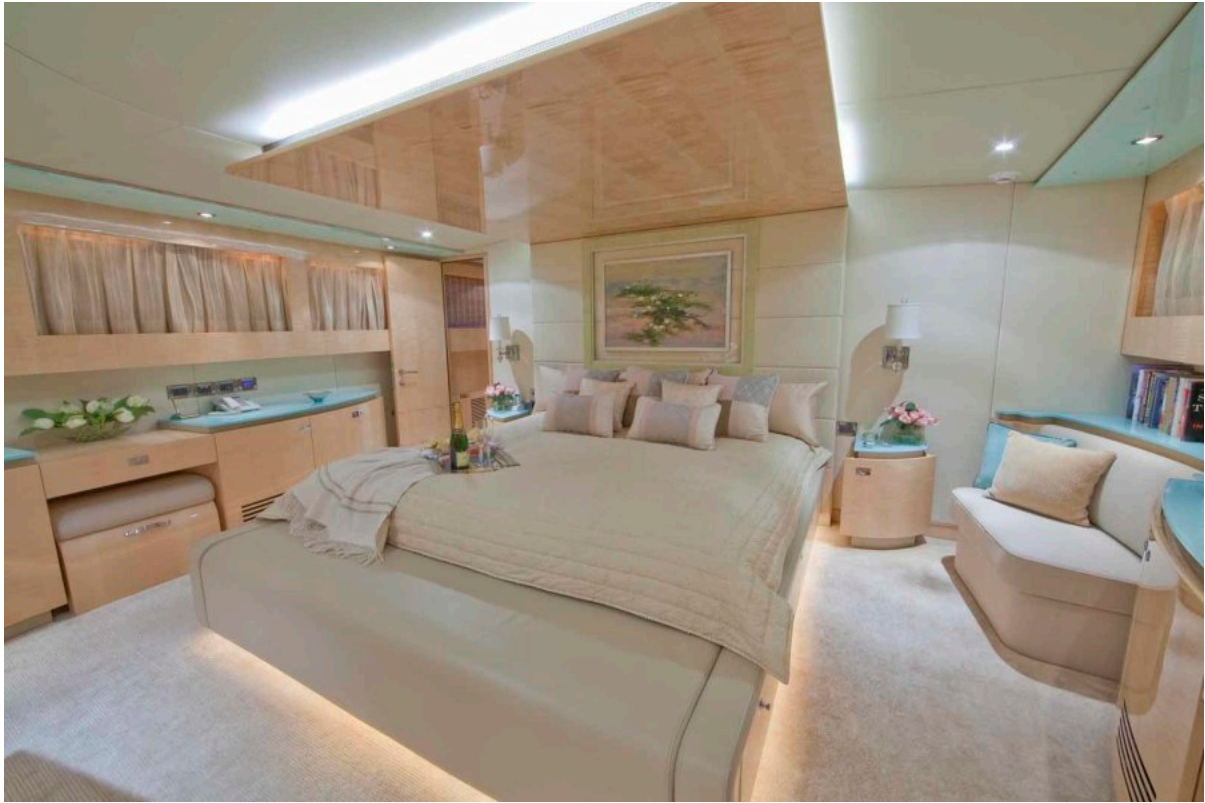
Master Looking Aft