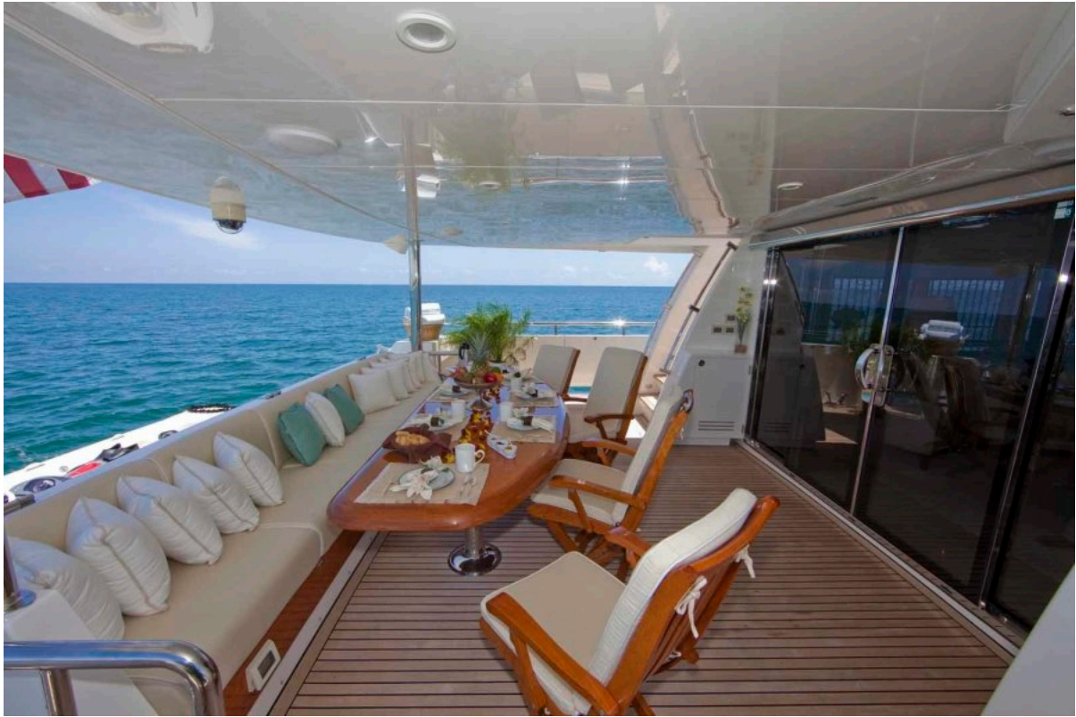
Aft Deck to Starboard