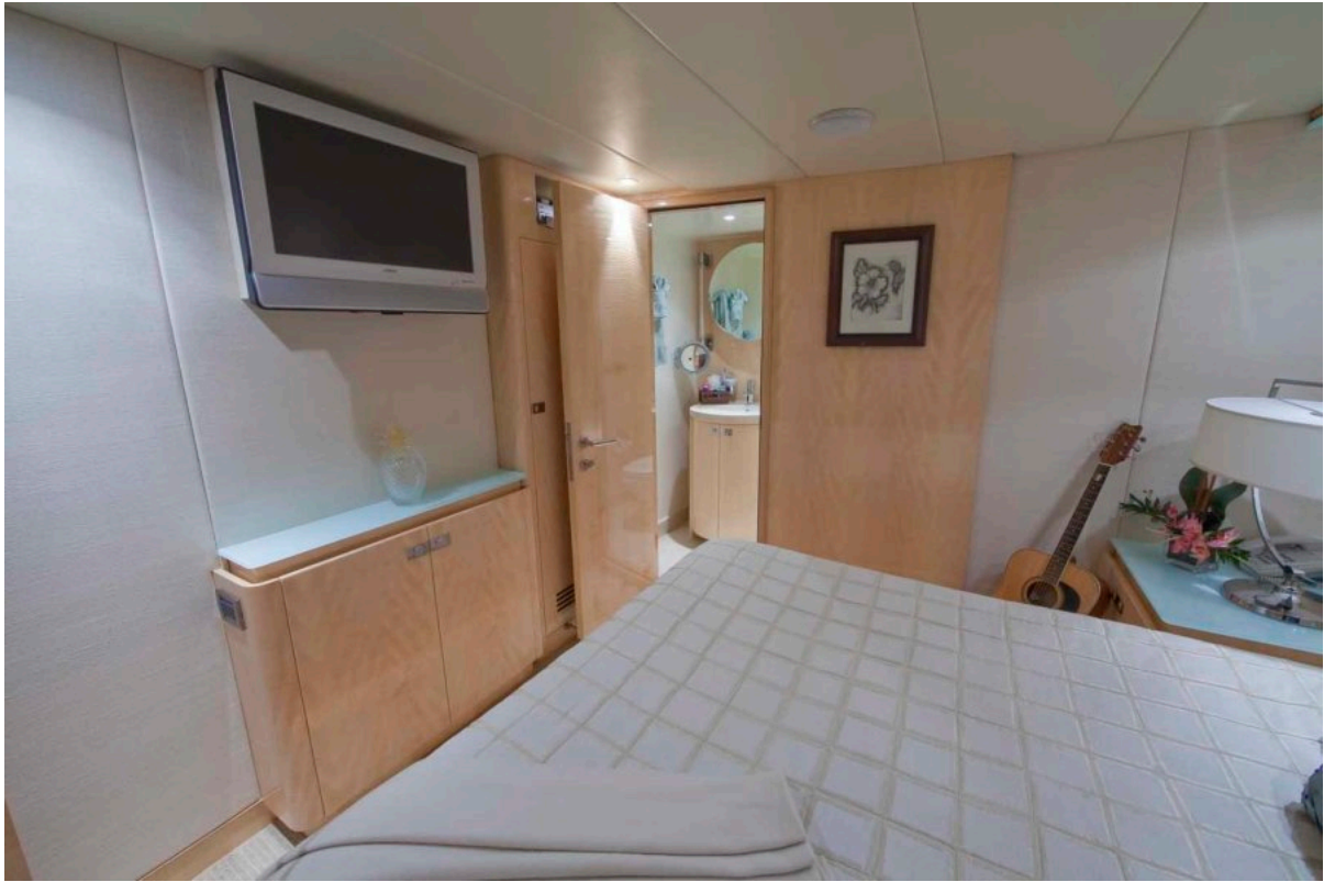
Portside VIP Looking Inboard