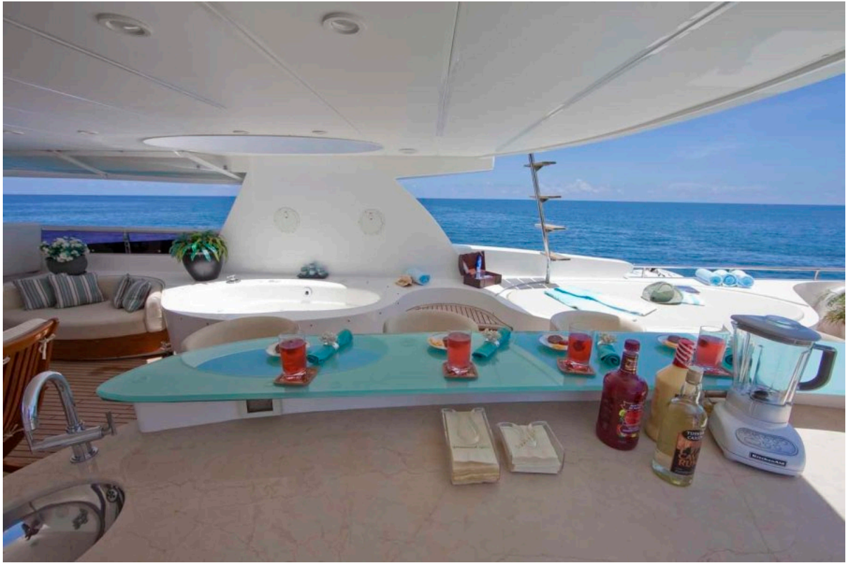
Bar Looking to Starboard