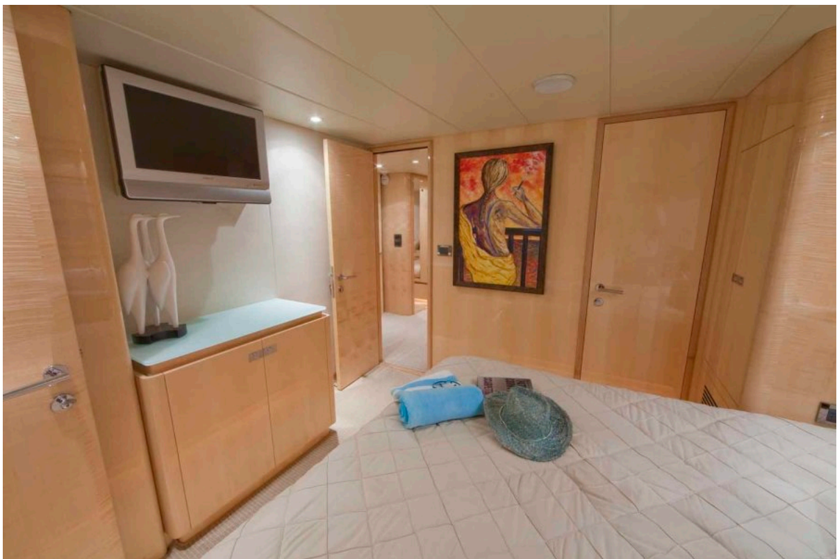
Starboard Side VIP Looking Forward