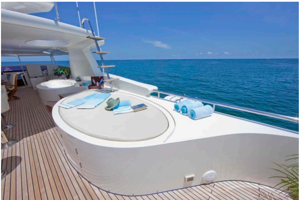
Starboard Side Sun Bed