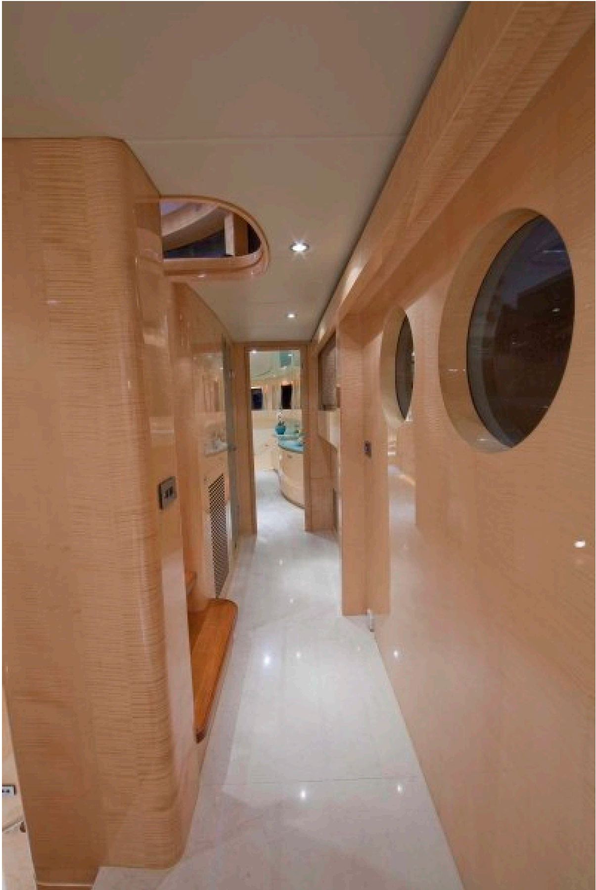
Starboard Side Main Deck Companionway