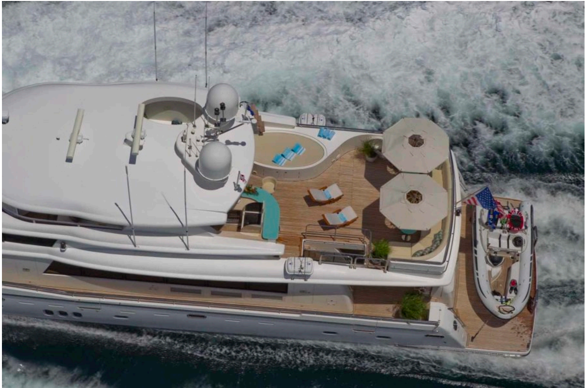
Sun Deck From Above