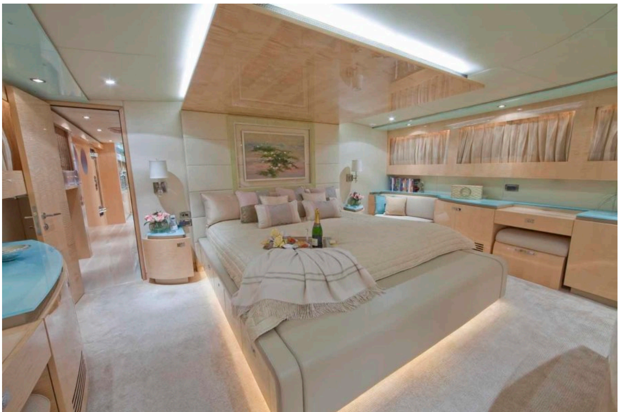
Master Looking Aft