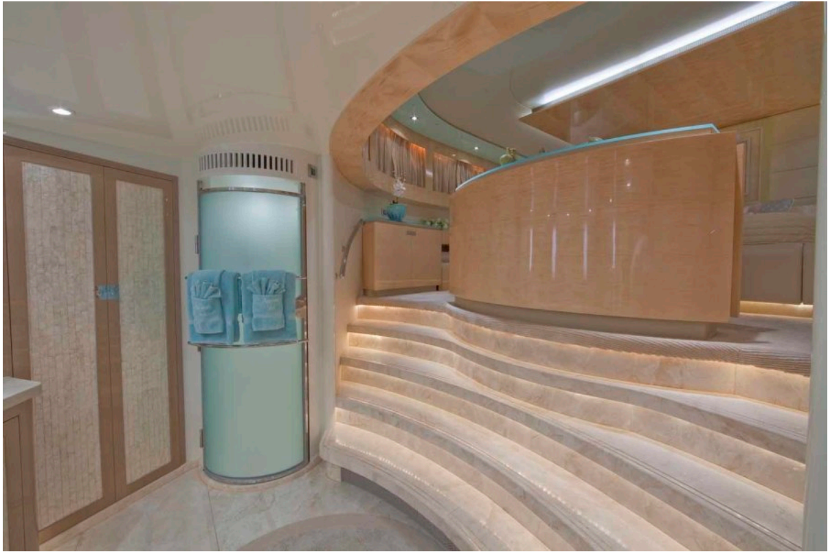
Master Head Looking Aft