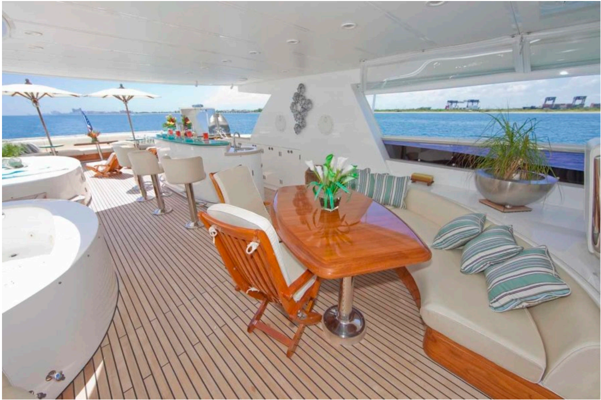
Portside Dining Looking Aft