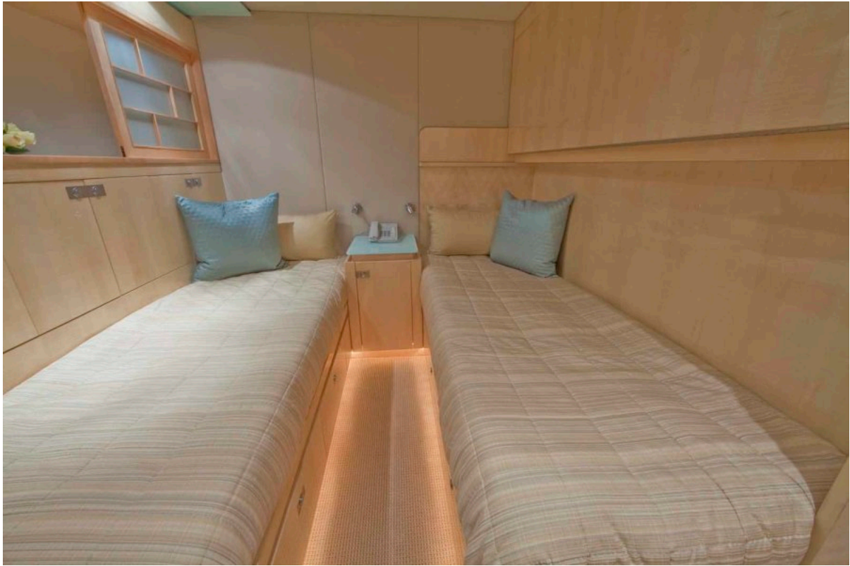
Midship Twin Cabin