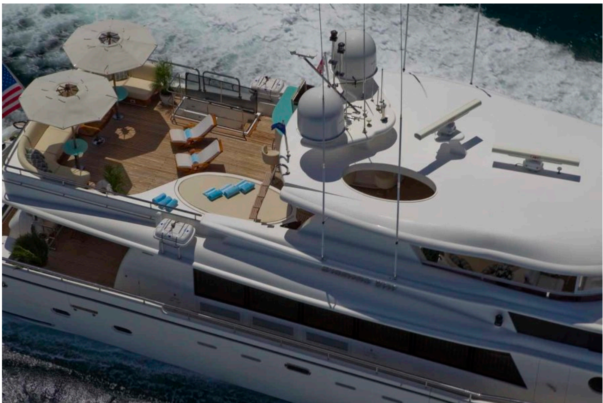
Sun Deck From Above