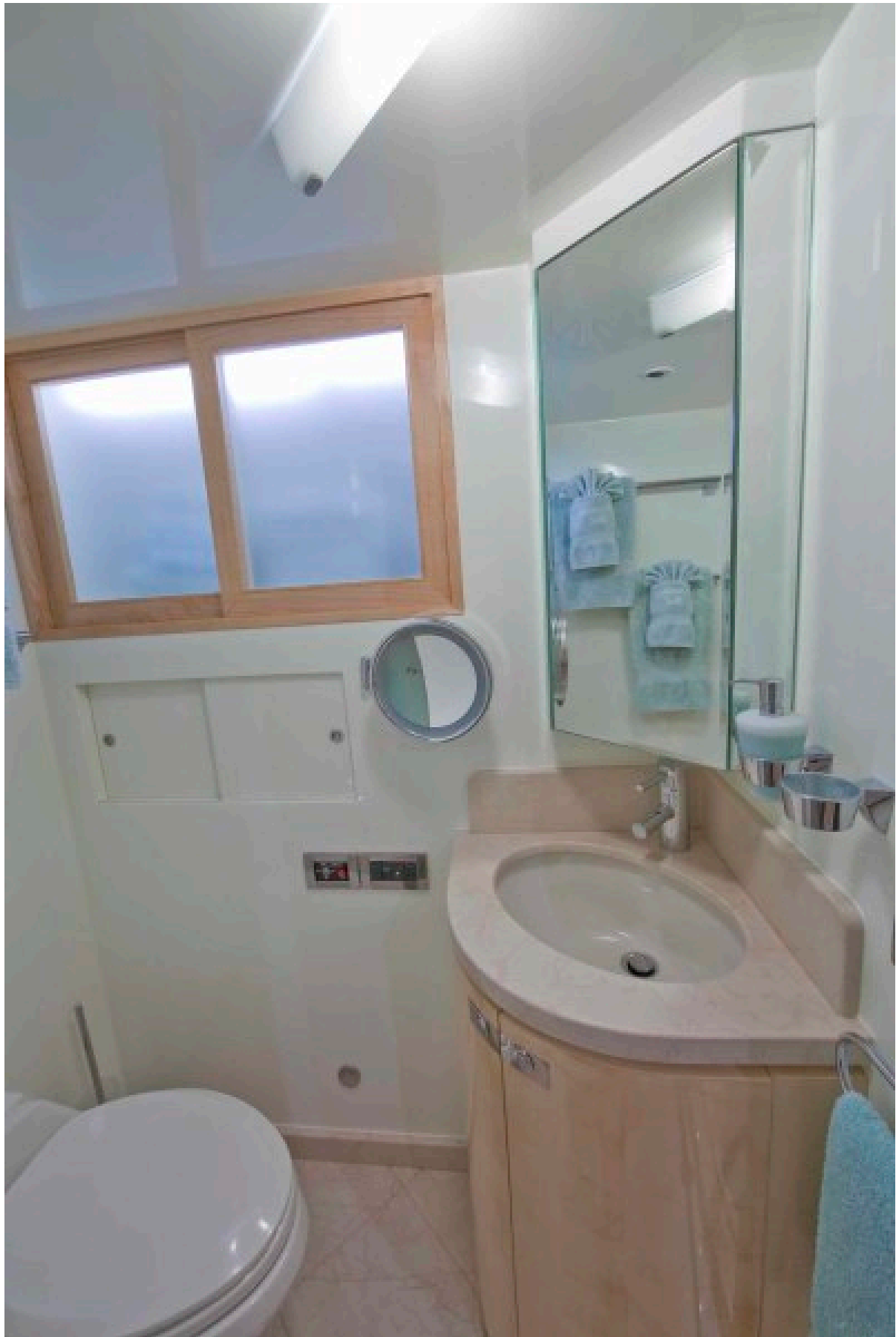
Midship Twin Head