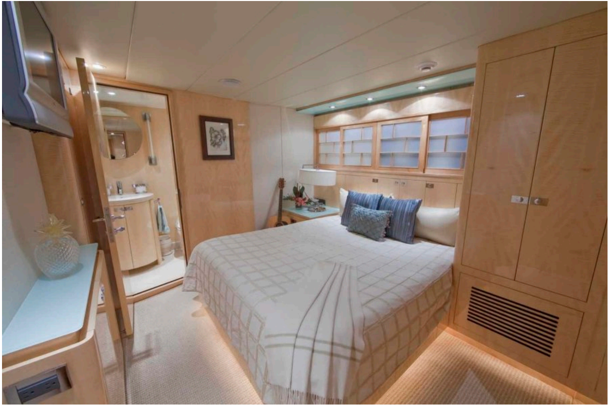
Portside VIP Looking Aft