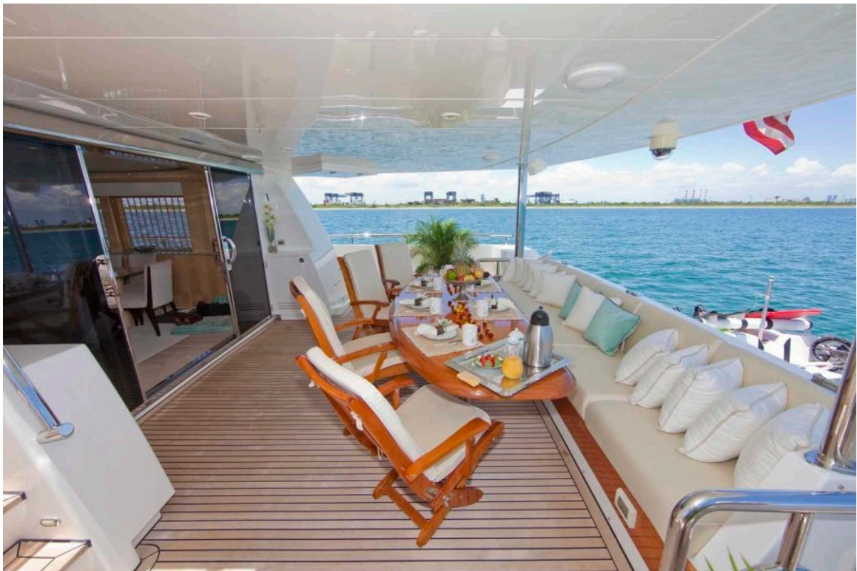
Aft Deck to Port