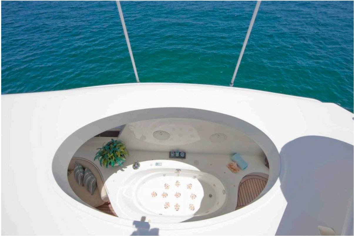
Jacuzzi Area Opening in Hardtop