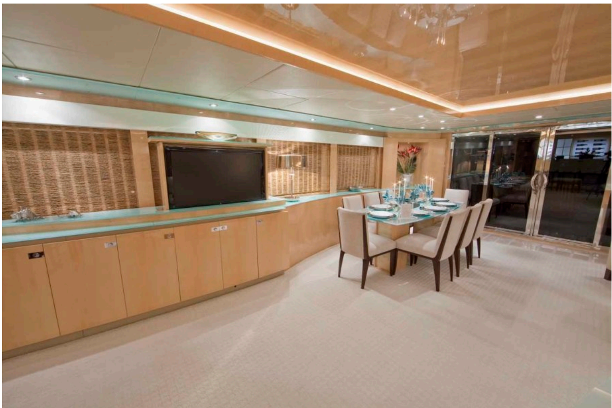
Salon Looking Aft to Starboard