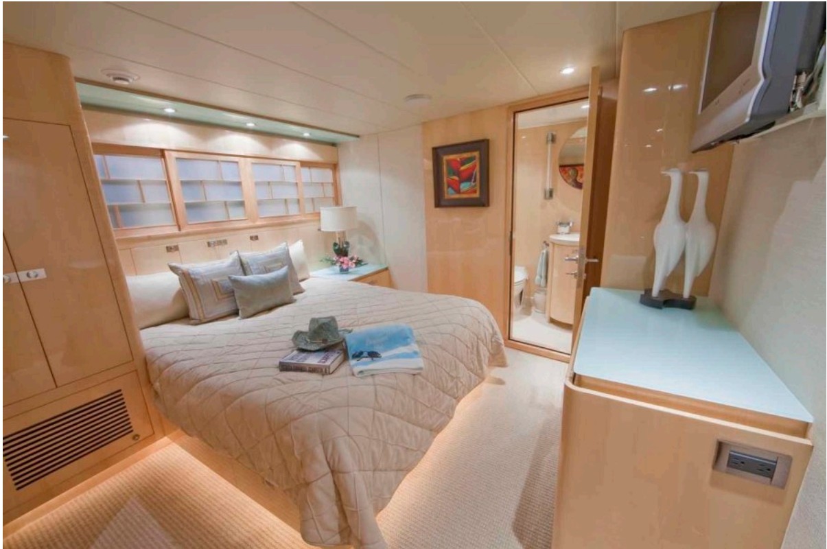
Starboard Side VIP Looking Aft