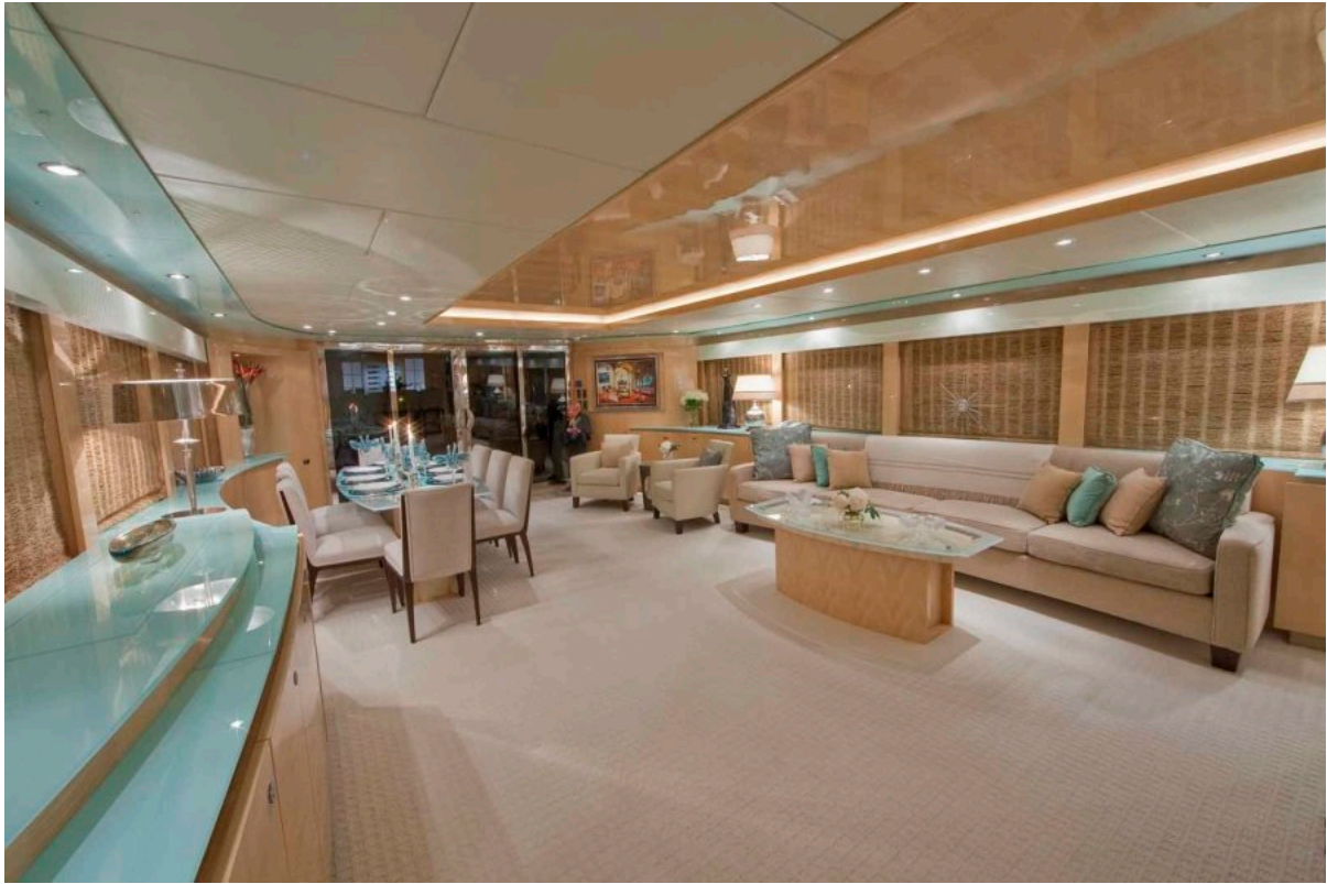
Salon Looking Aft to Port