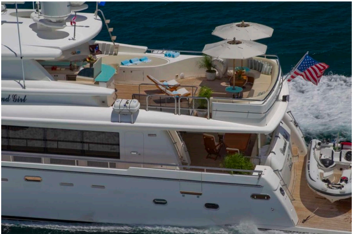
Sun Deck Detail