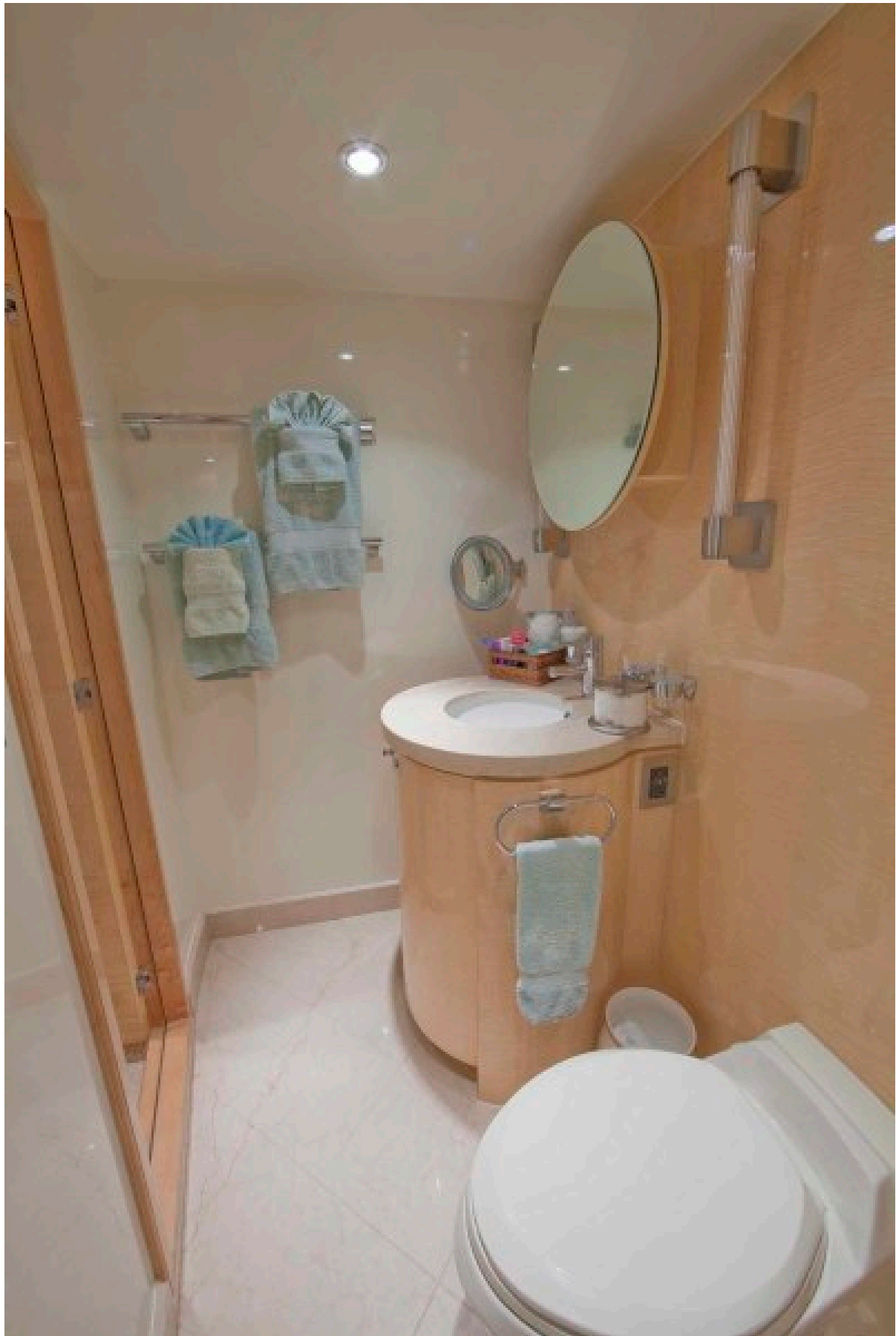
Portside VIP Head