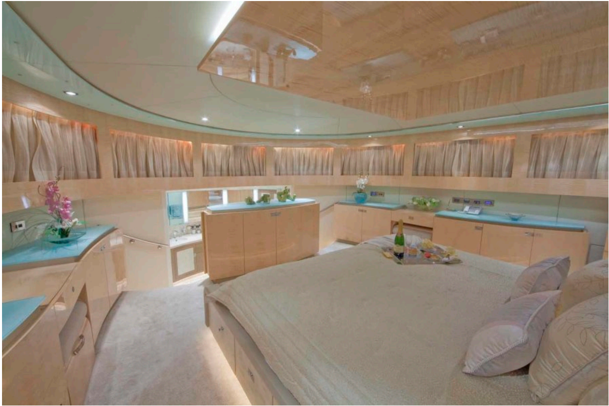
Master with Electric Drapes Closed