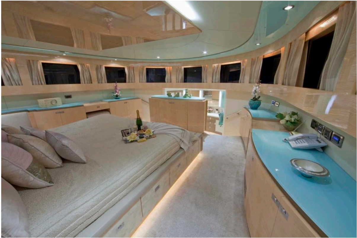
Master Looking Forward