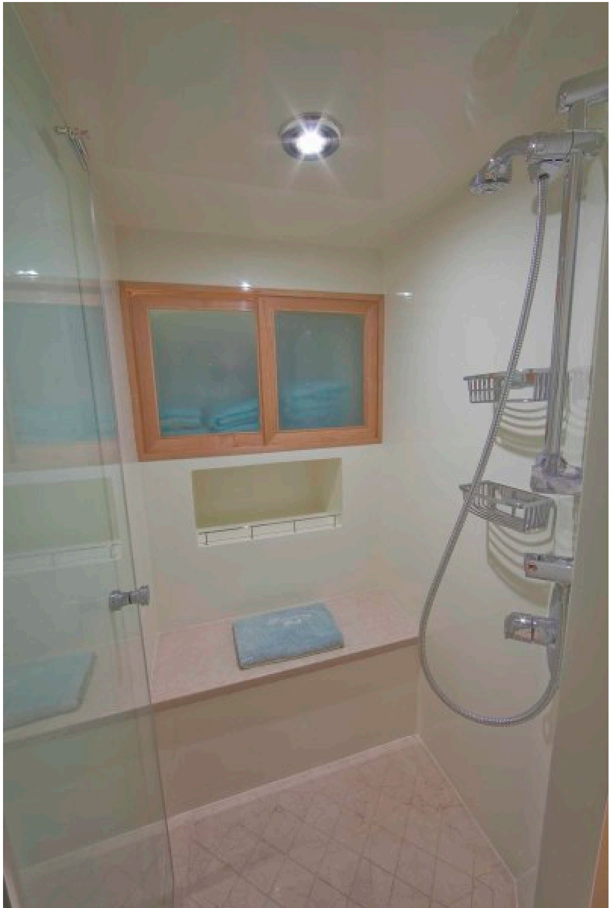
Portside VIP Shower