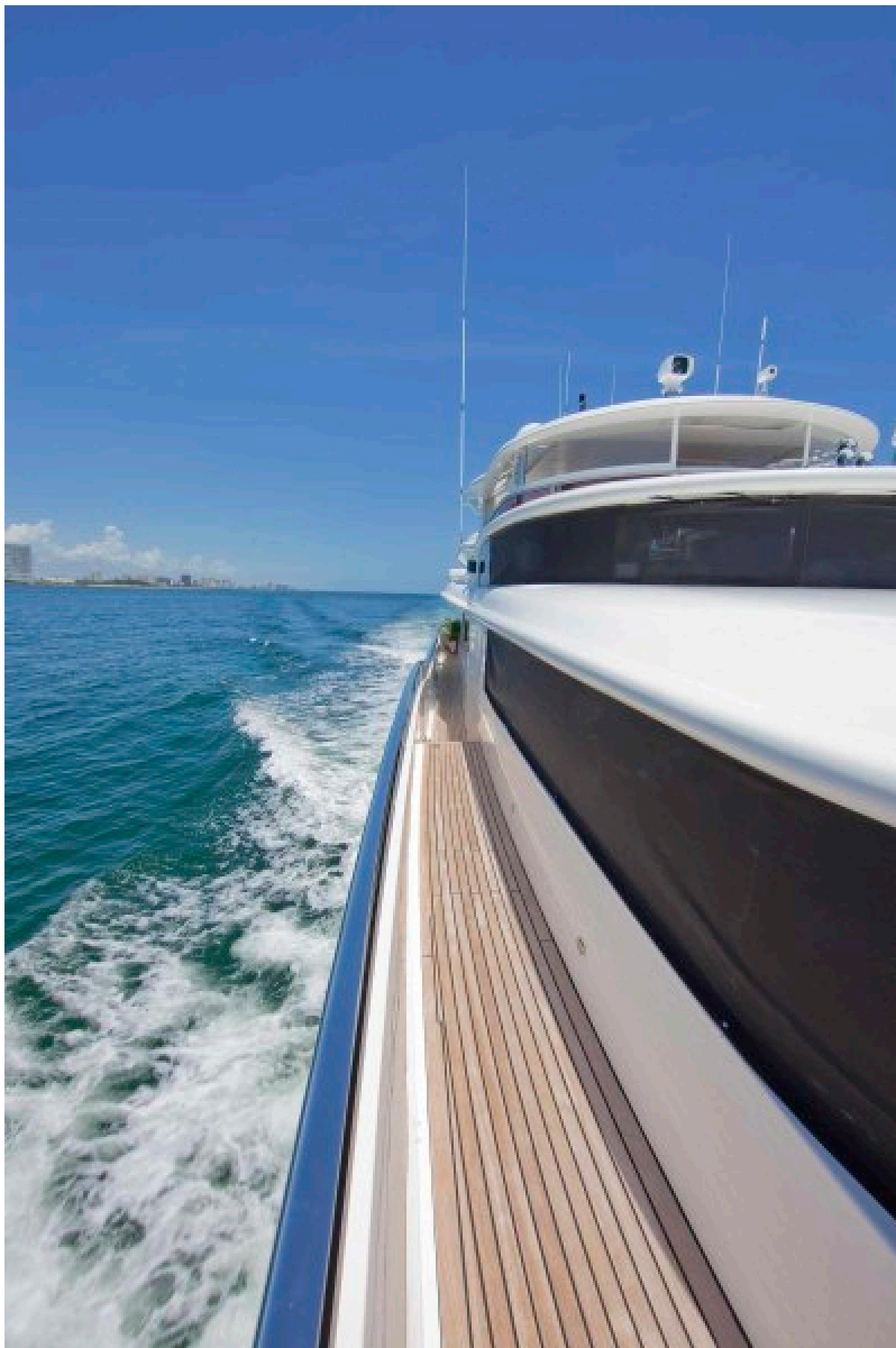
Wide Side Decks