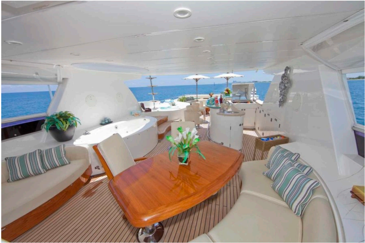
Portside Forward Seating Looking Aft