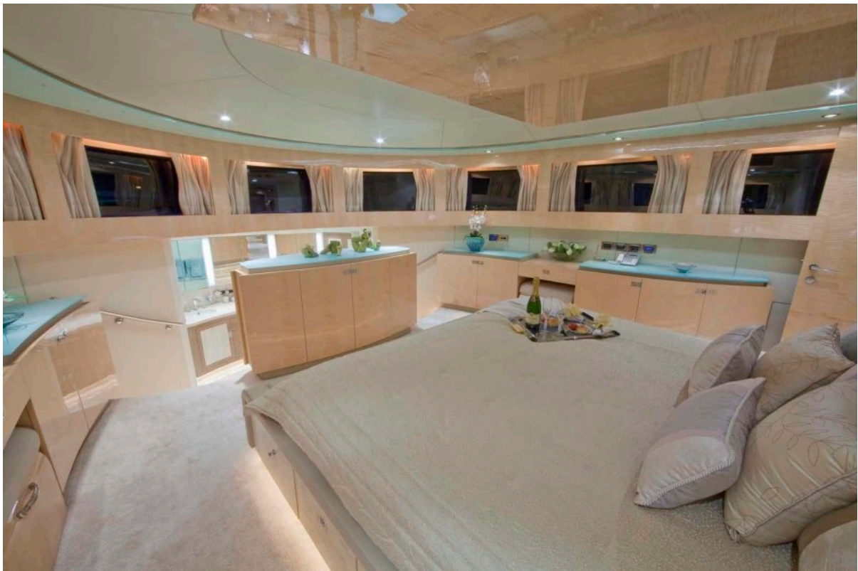
Master Looking Forward