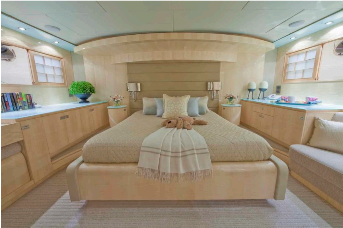
VIP Looking Forward