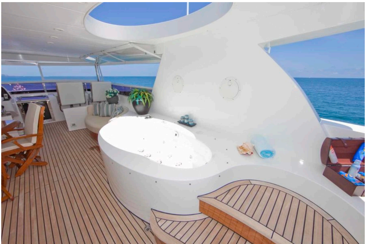
Jacuzzi Tub Looking Forward