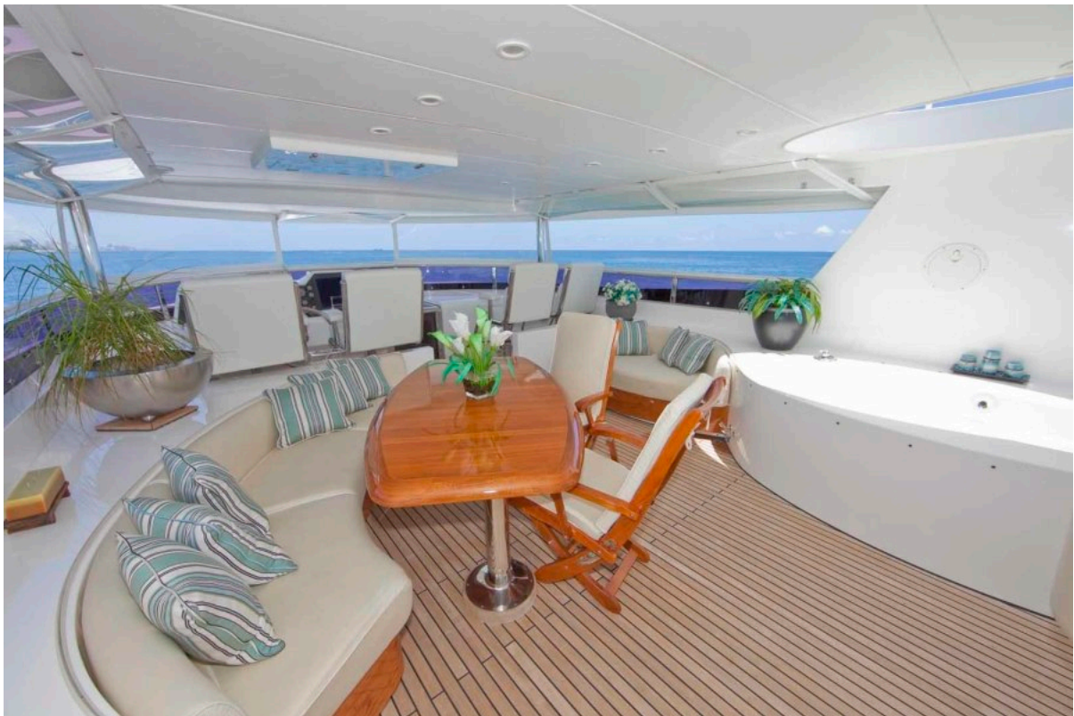
Portside Dining Looking Forward