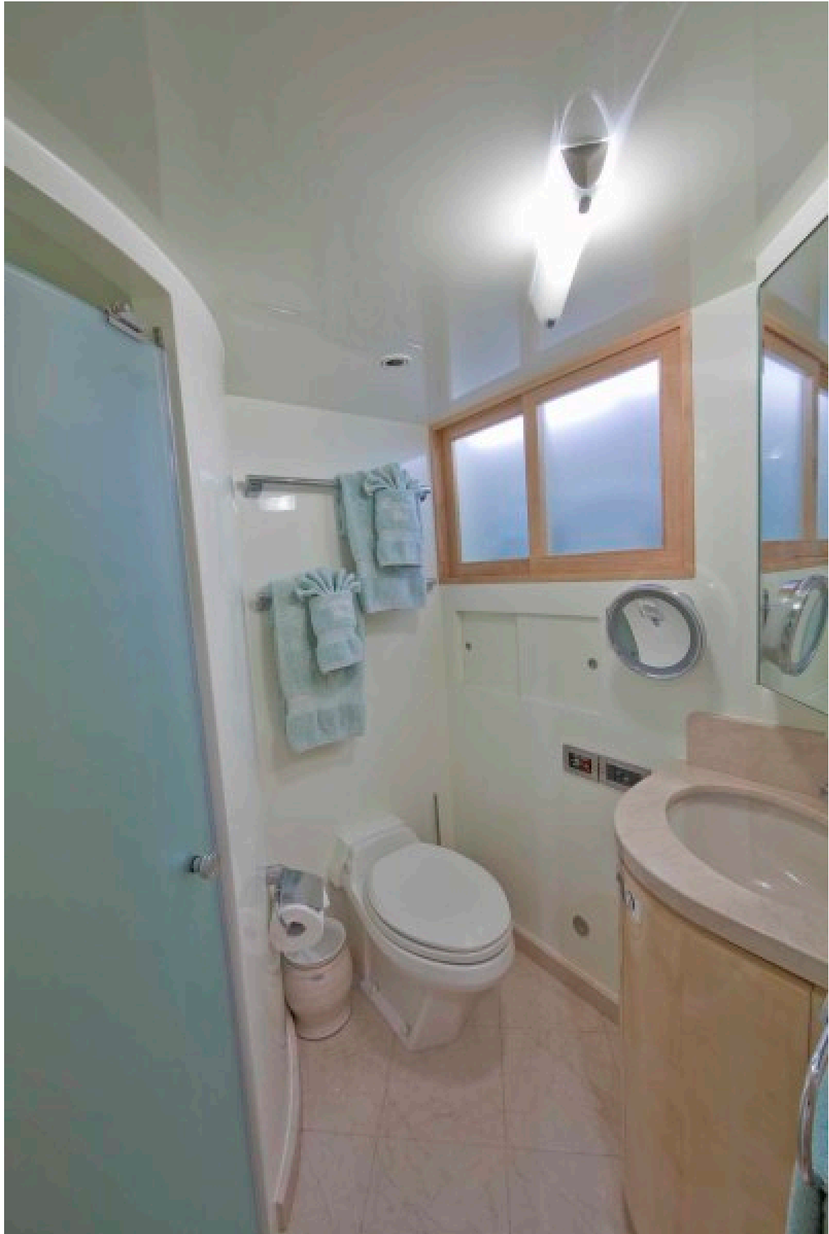
Midship Twin Head