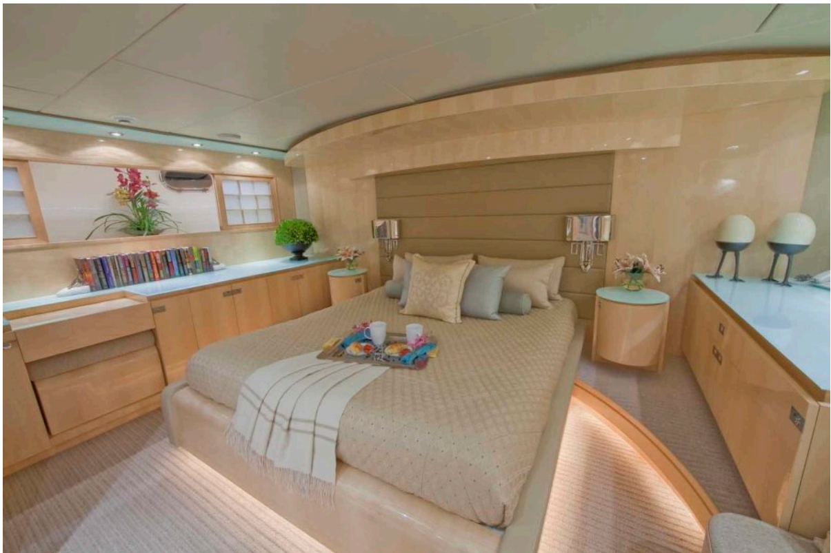
VIP to Port