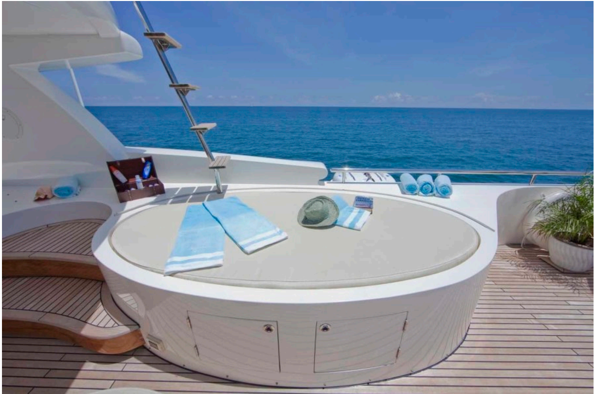
Starboard Side Sun Bed