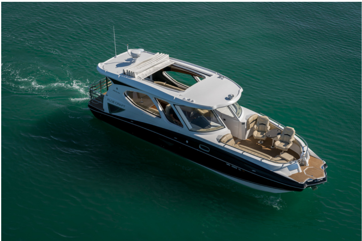
Afina 3950 Inverted V Hull