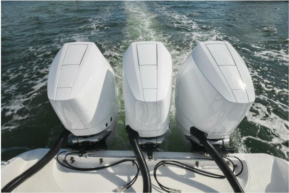
2014 41 Bahama CC Engines