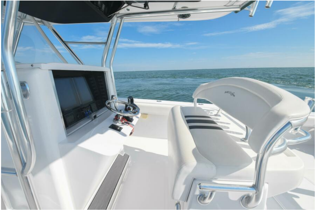
2014 41 Bahama CC Helm