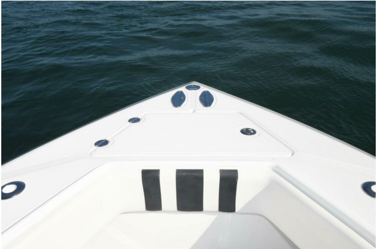
2014 41 Bahama CC Bow