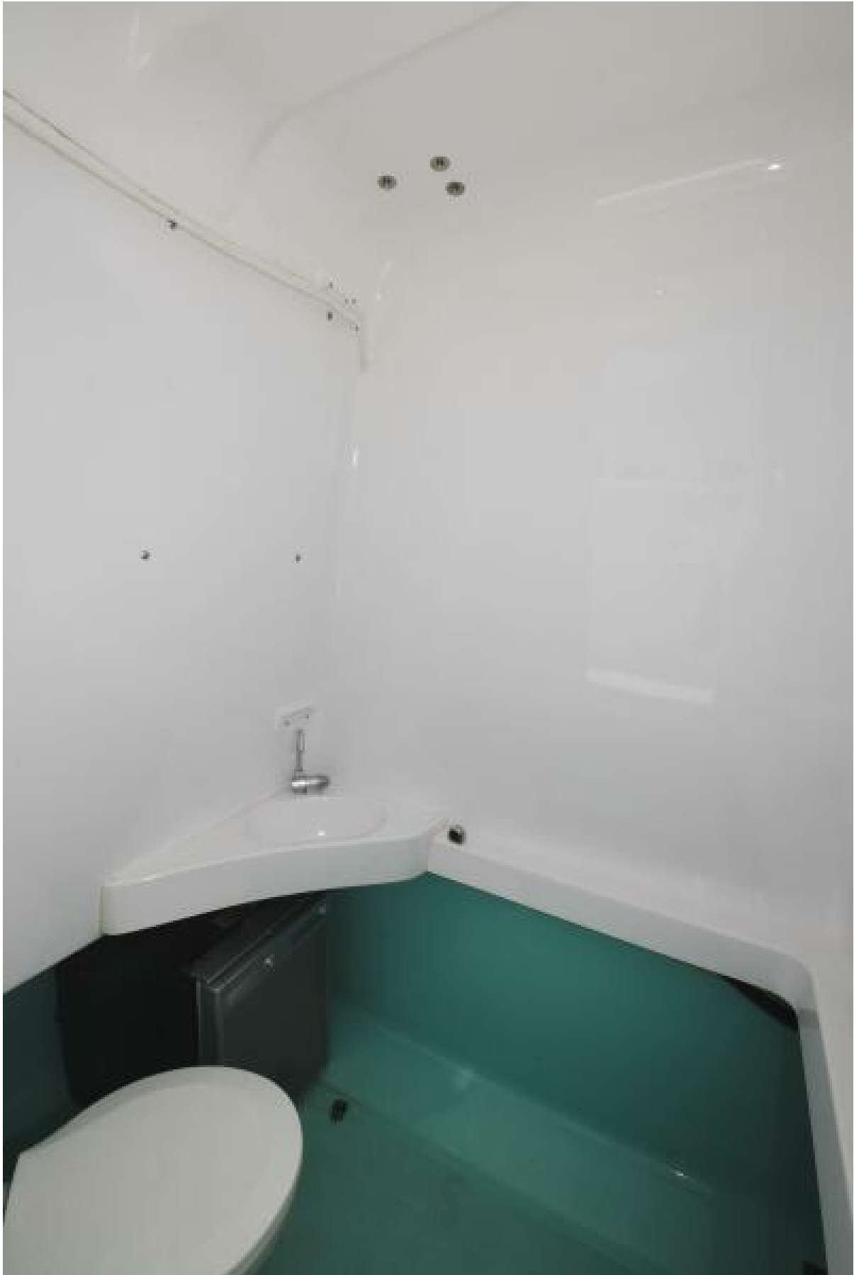
2014 41 Bahama CC Head