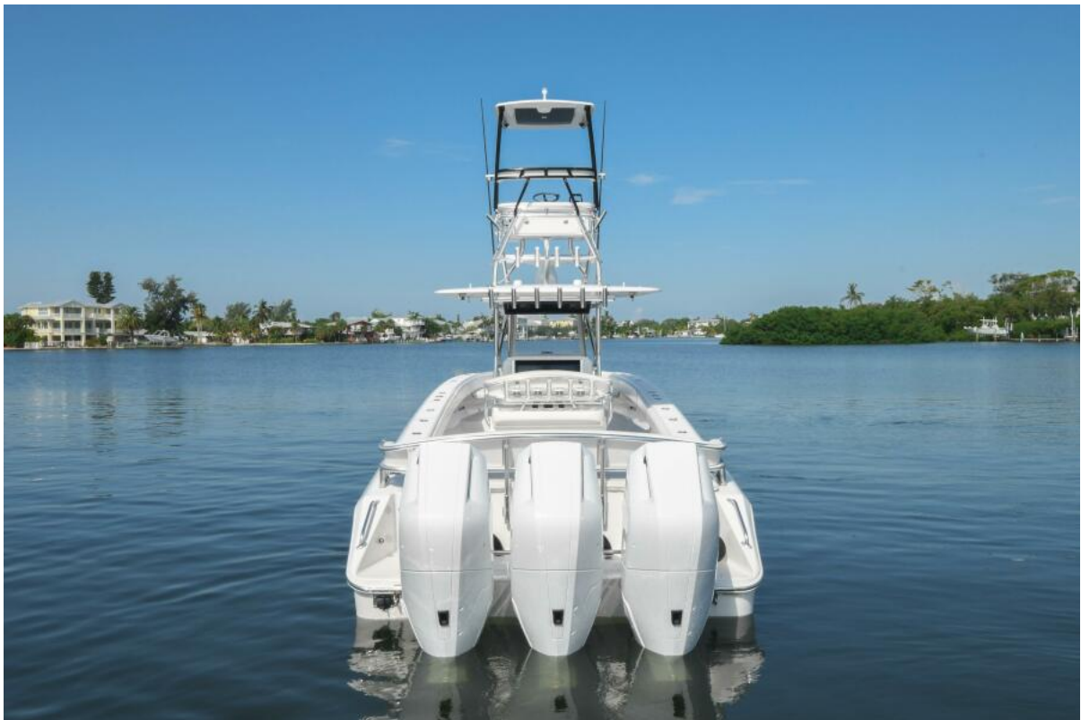
2014 41 Bahama CC