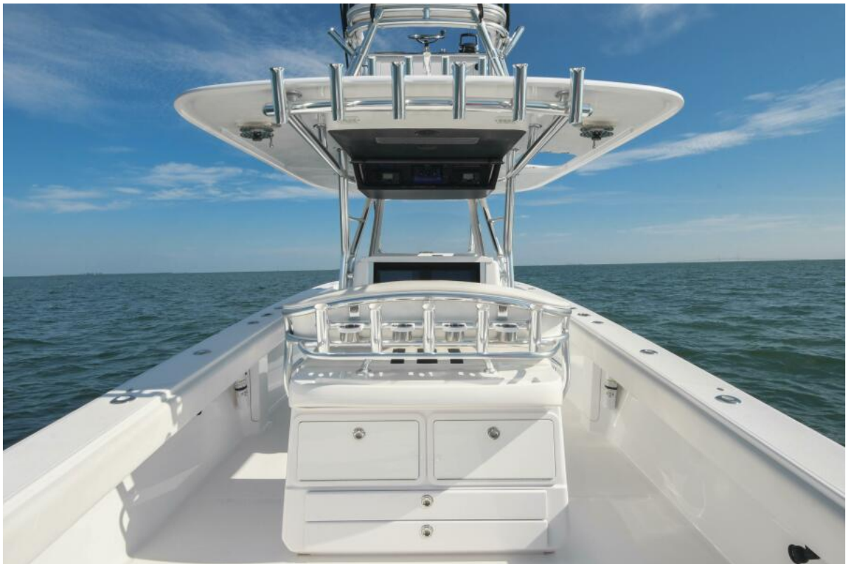
2014 41 Bahama CC Cockpit