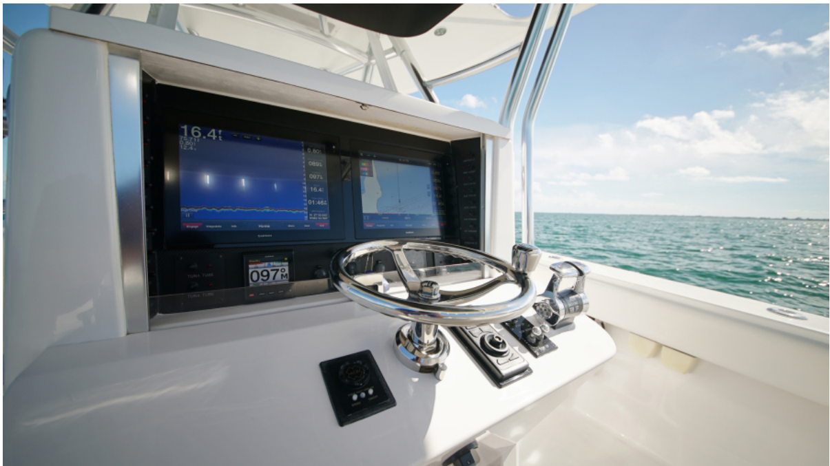
2014 41 Bahama CC Helm