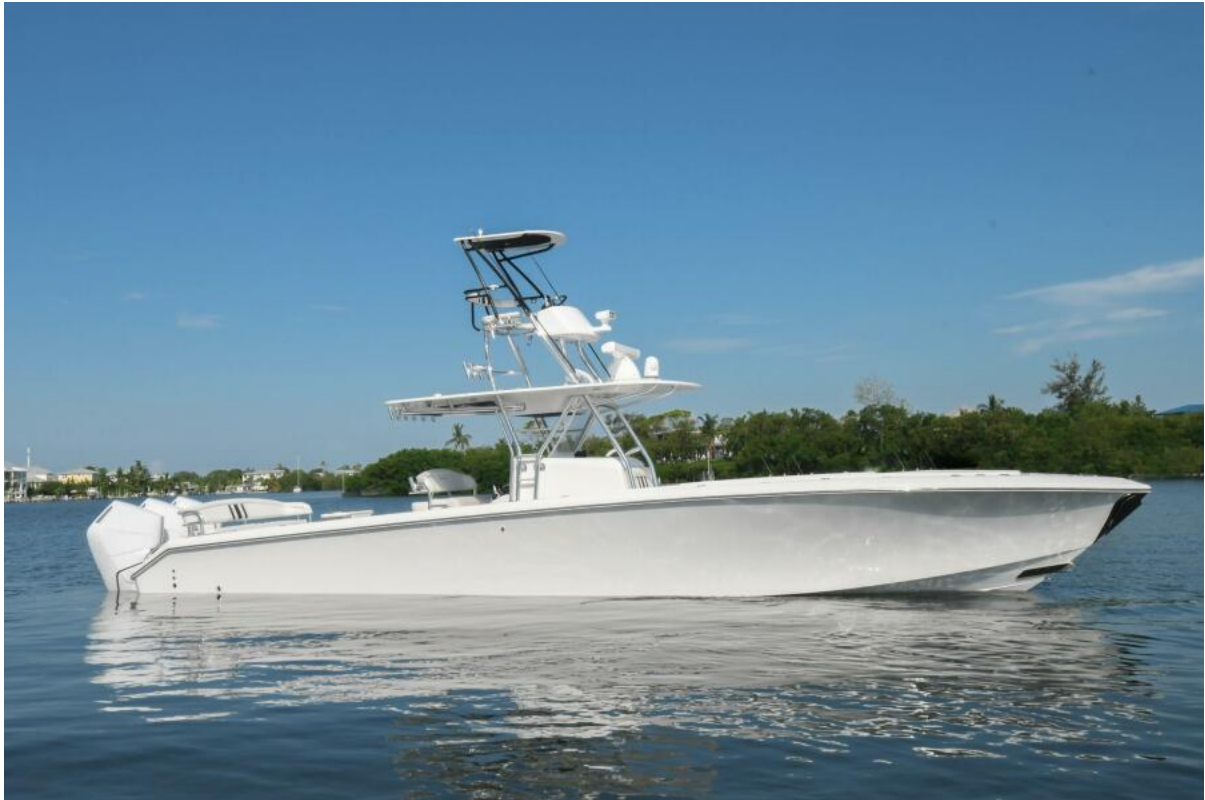
2014 41 Bahama CC Profile