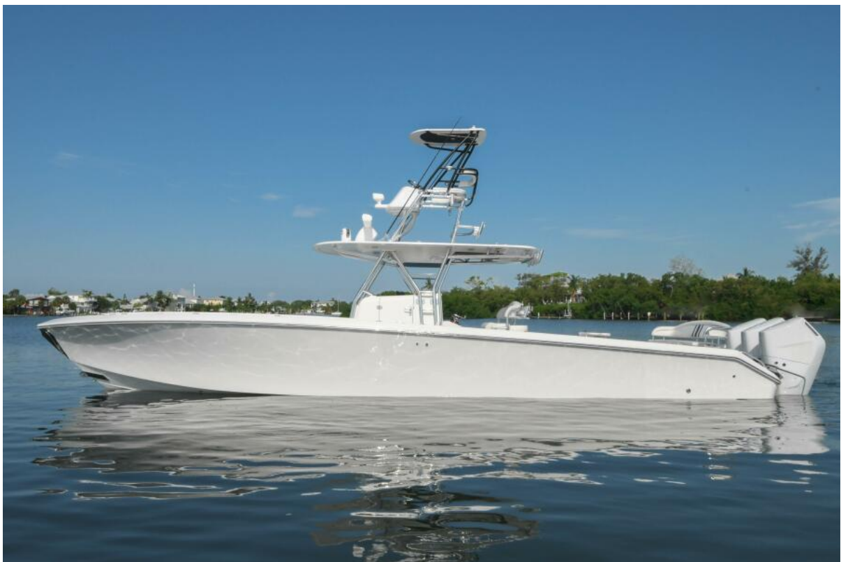
2014 41 Bahama CC