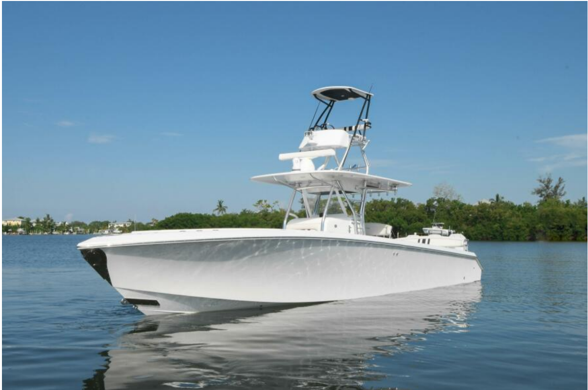
2014 41 Bahama CC