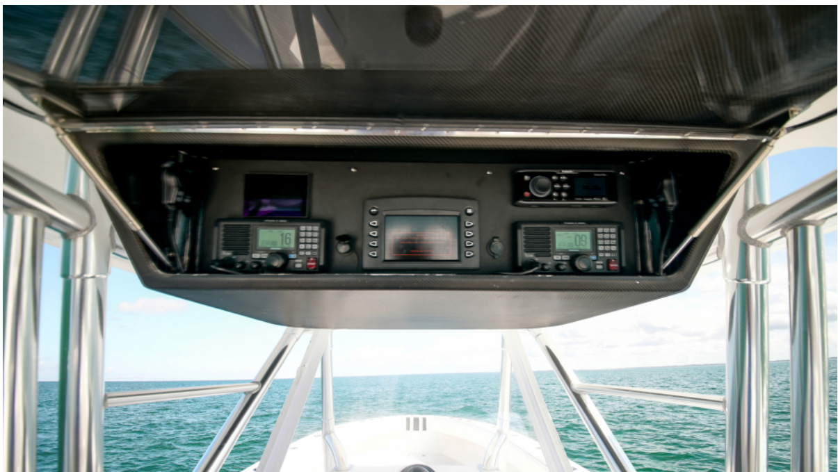
2014 41 Bahama CC Tower