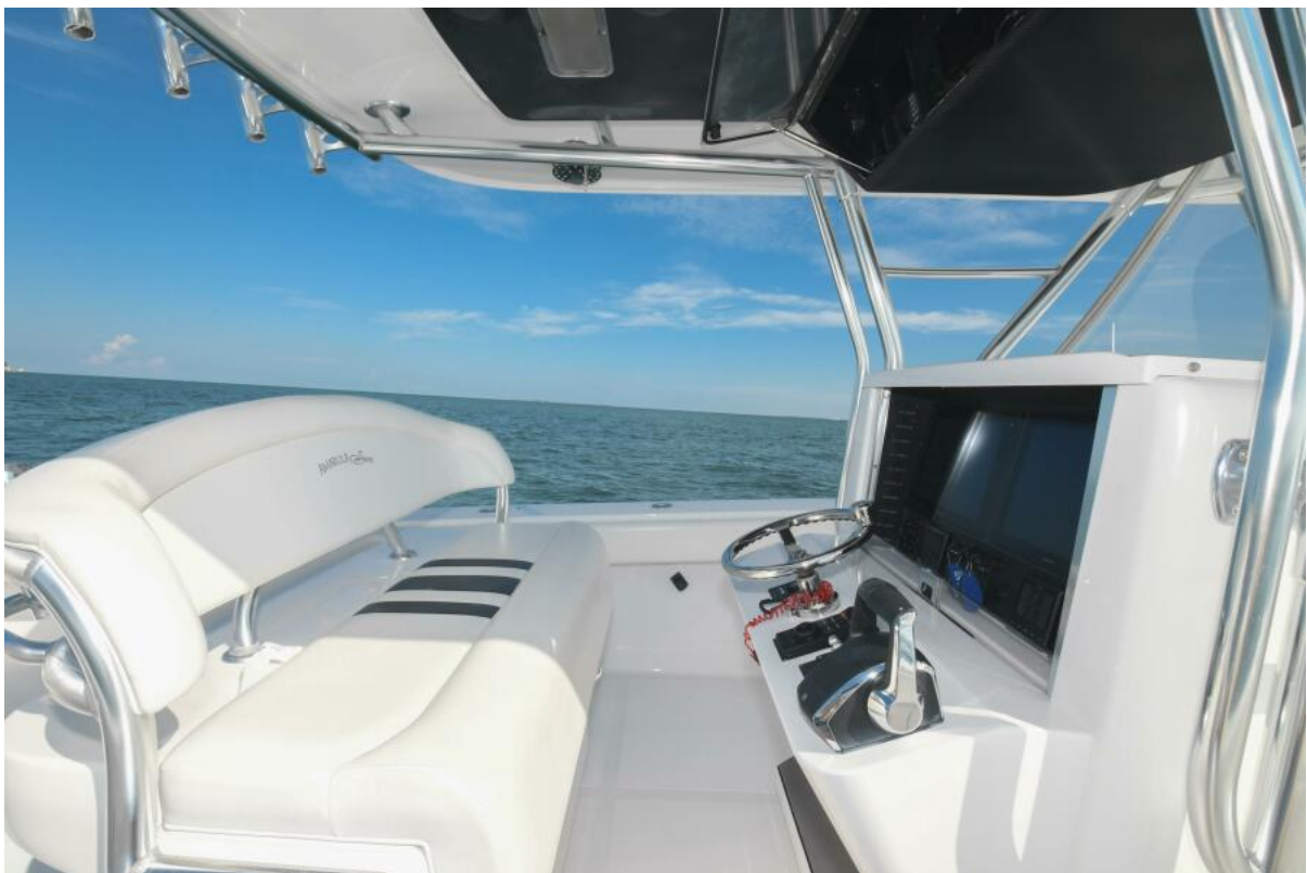
2014 41 Bahama CC Helm