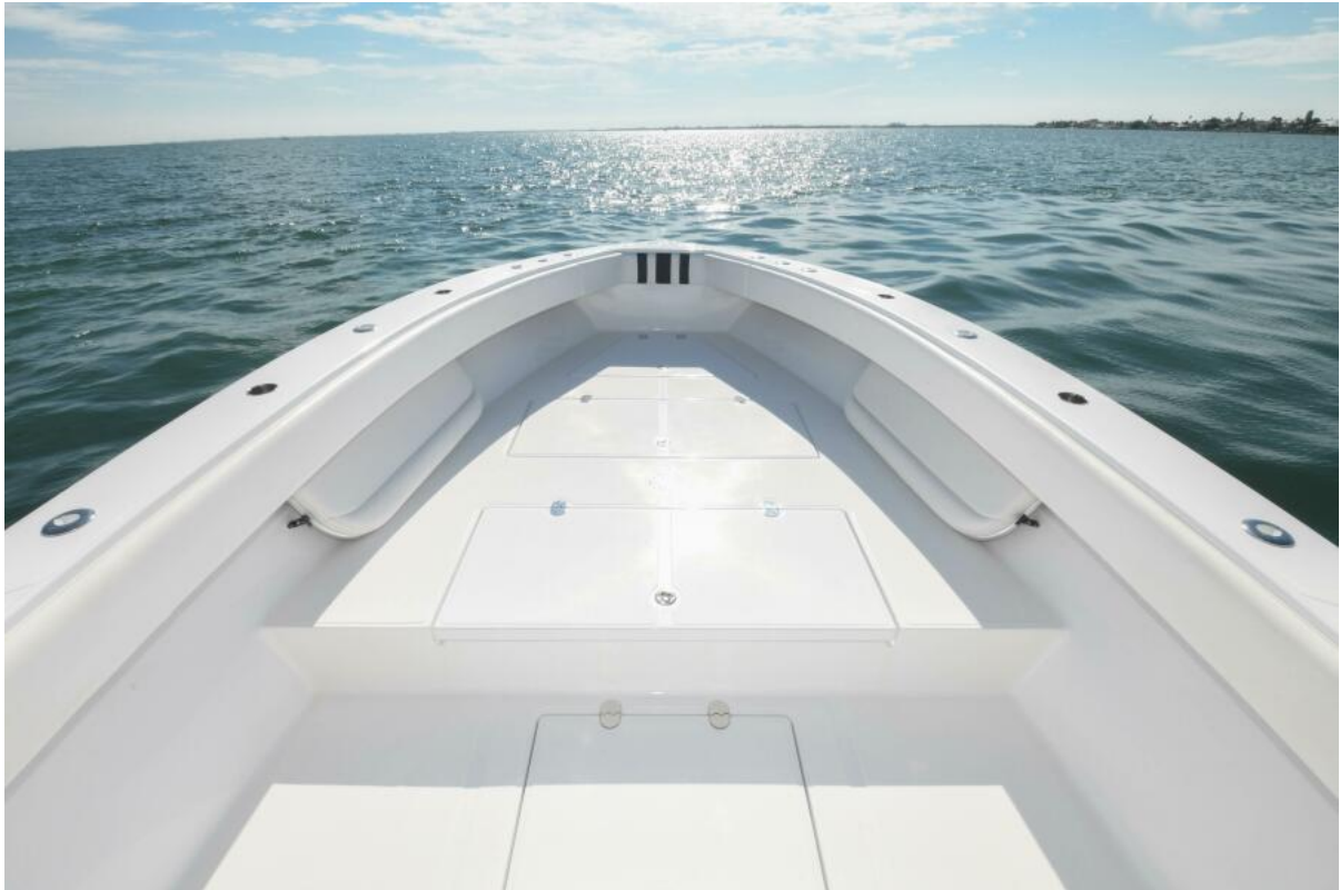
2014 41 Bahama CC Bow