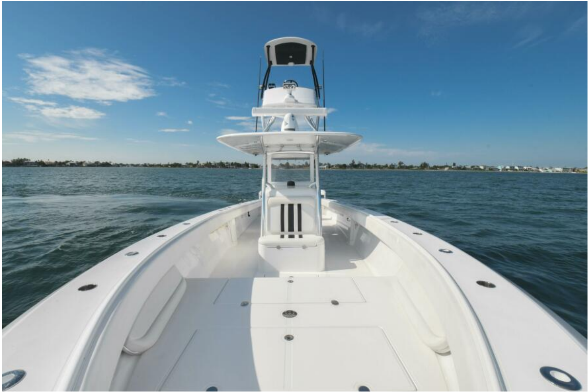
2014 41 Bahama CC Bow