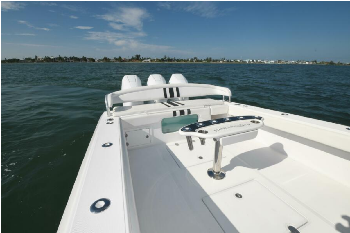
2014 41 Bahama CC