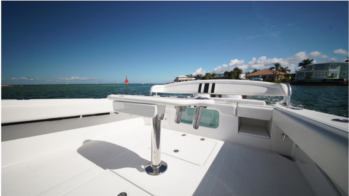
2014 41 Bahama CC Cockpit