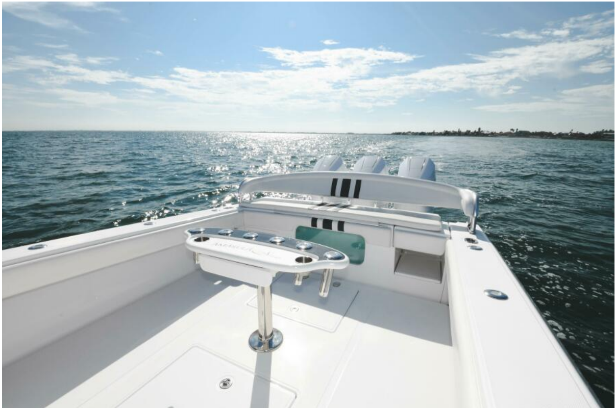
2014 41 Bahama CC