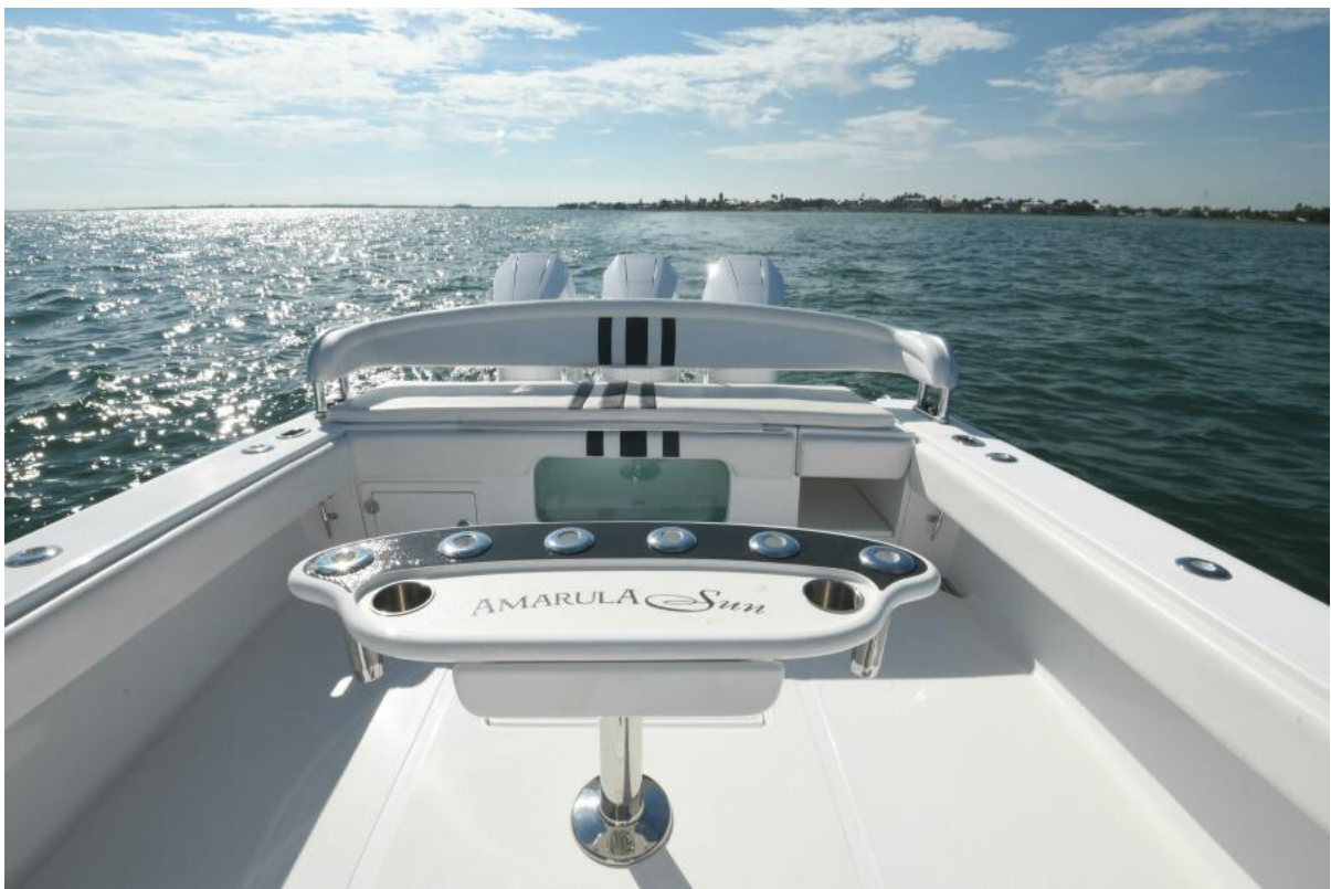
2014 41 Bahama CC Cockpit