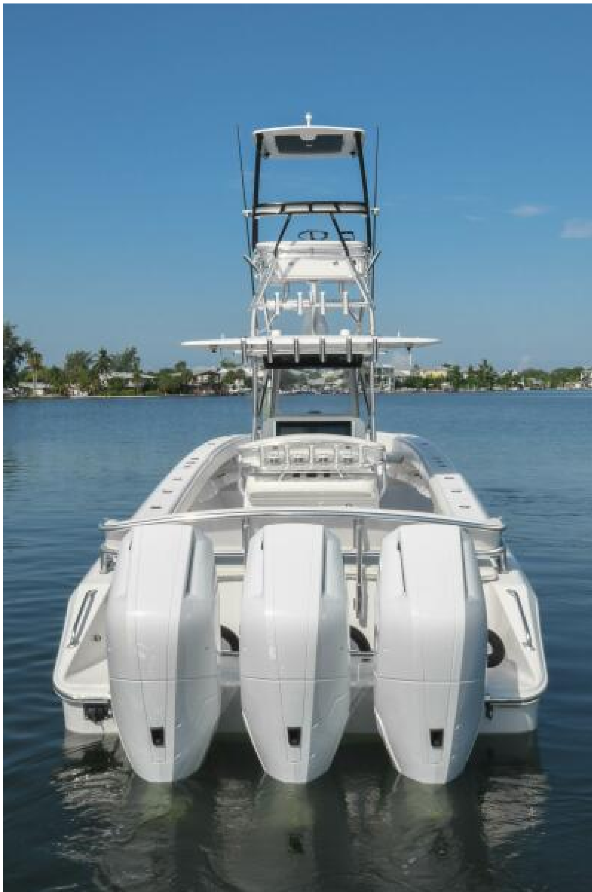
2014 41 Bahama CC