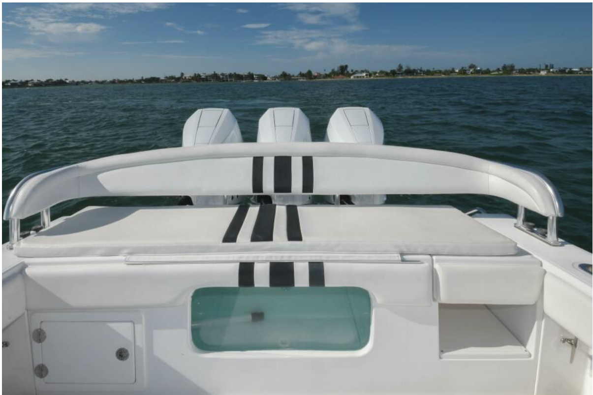
2014 41 Bahama CC