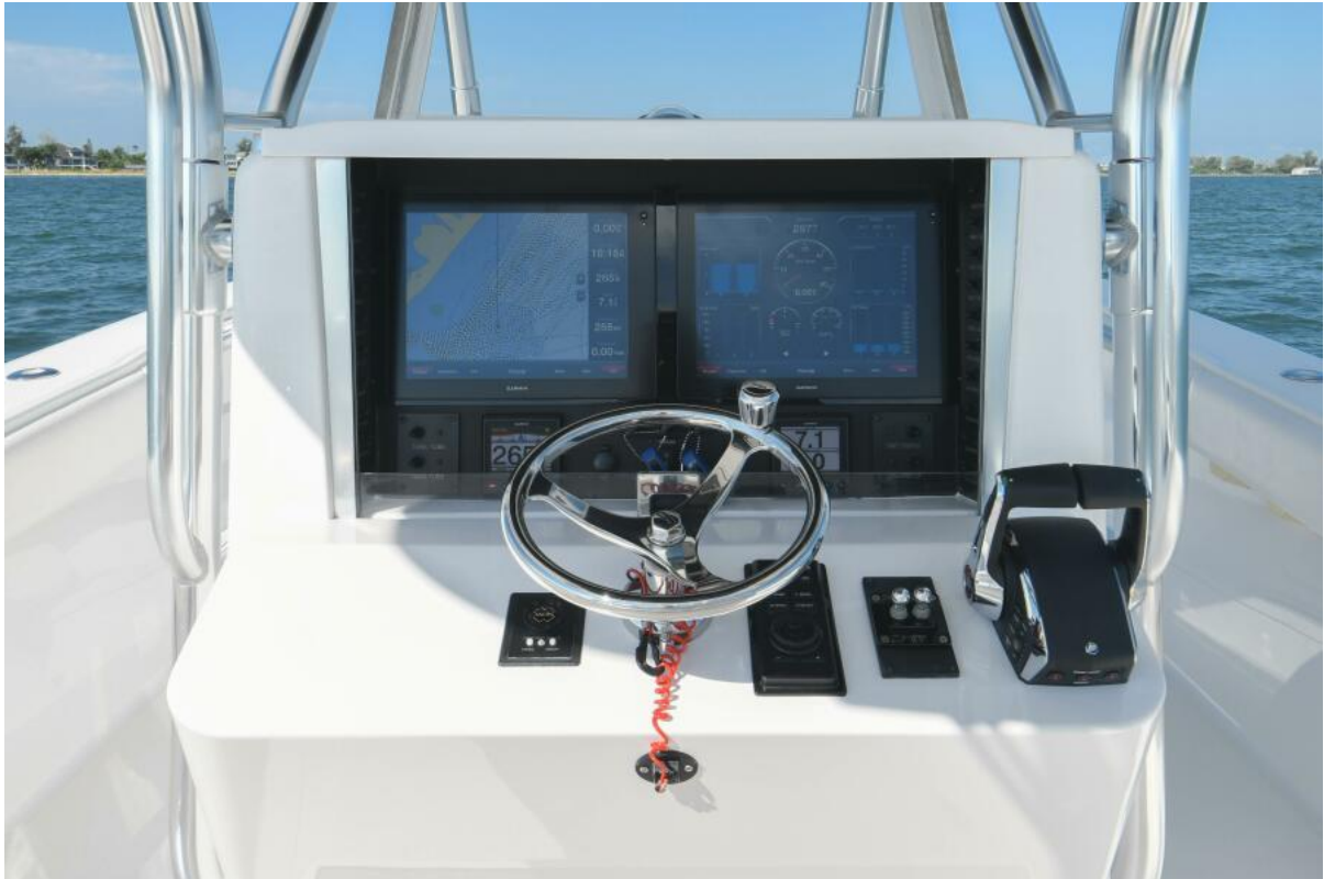
2014 41 Bahama CC Helm