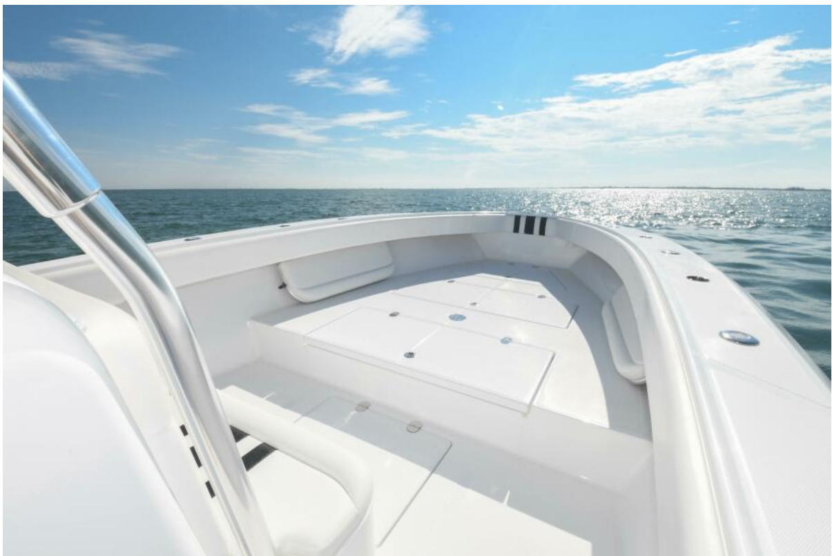
2014 41 Bahama CC Bow