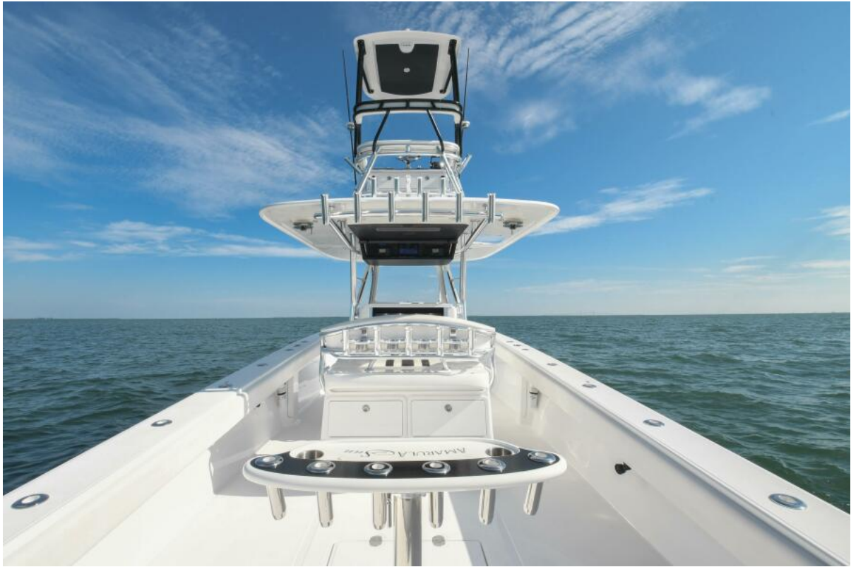
2014 41 Bahama CC Cockpit