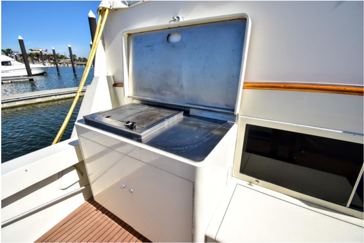
Hatteras Cockpit Motor Yacht 1989 Why Knot Just Because