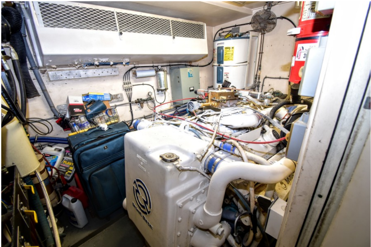
Hatteras Cockpit Motor Yacht 1989 Why Knot Just Because