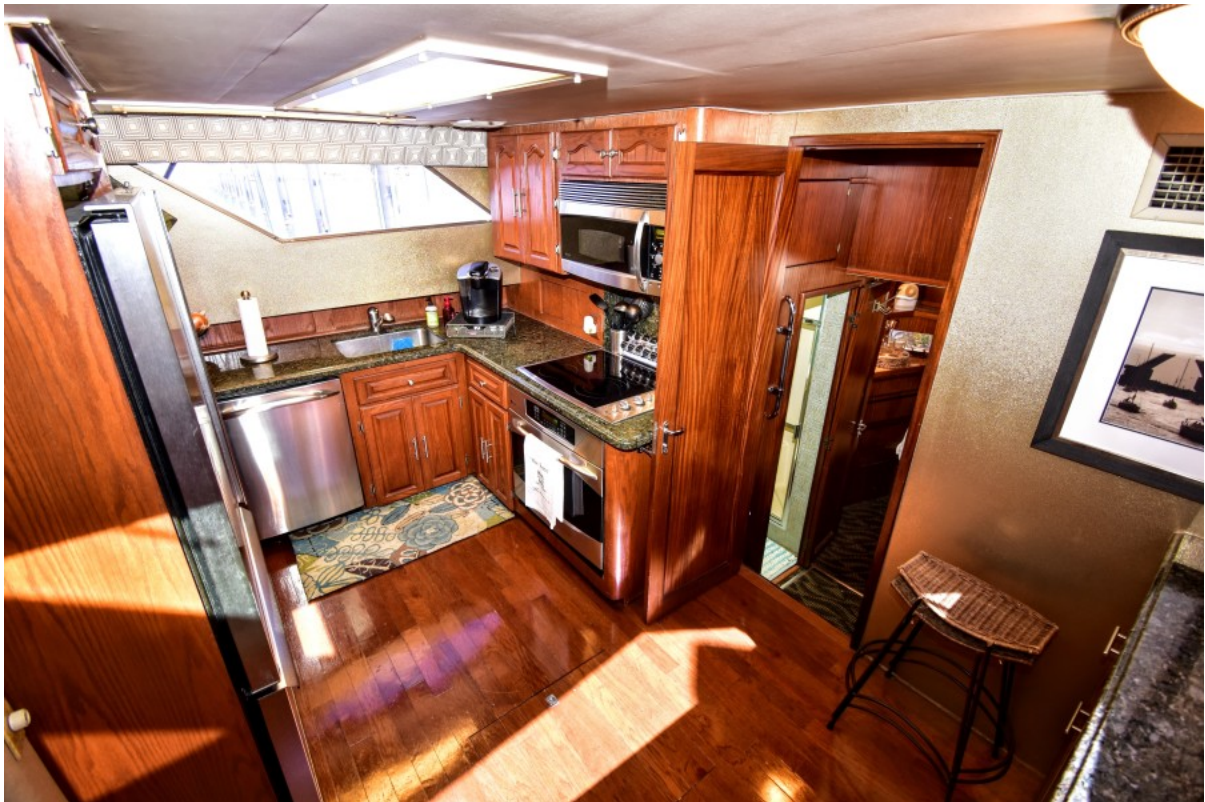
Hatteras Cockpit Motor Yacht 1989 Why Knot Just Because