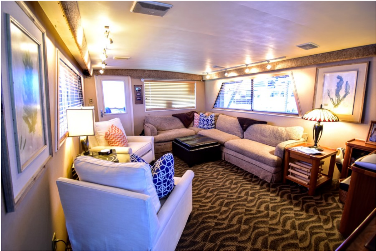
Hatteras Cockpit Motor Yacht 1989 Why Knot Just Because