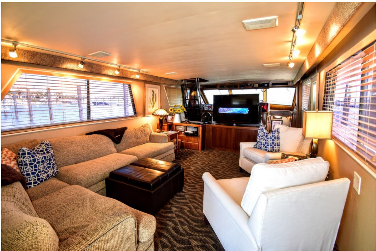
Hatteras Cockpit Motor Yacht 1989 Why Knot Just Because