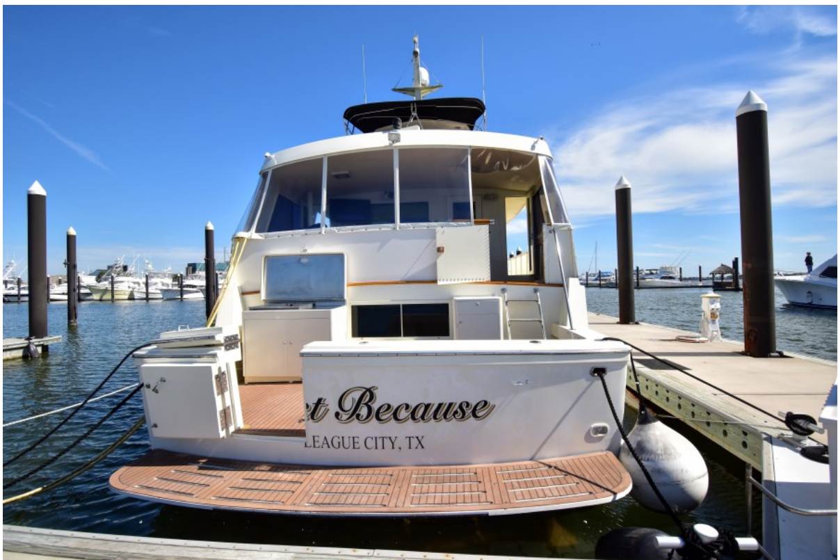
Hatteras Cockpit Motor Yacht 1989 Why Knot Just Because