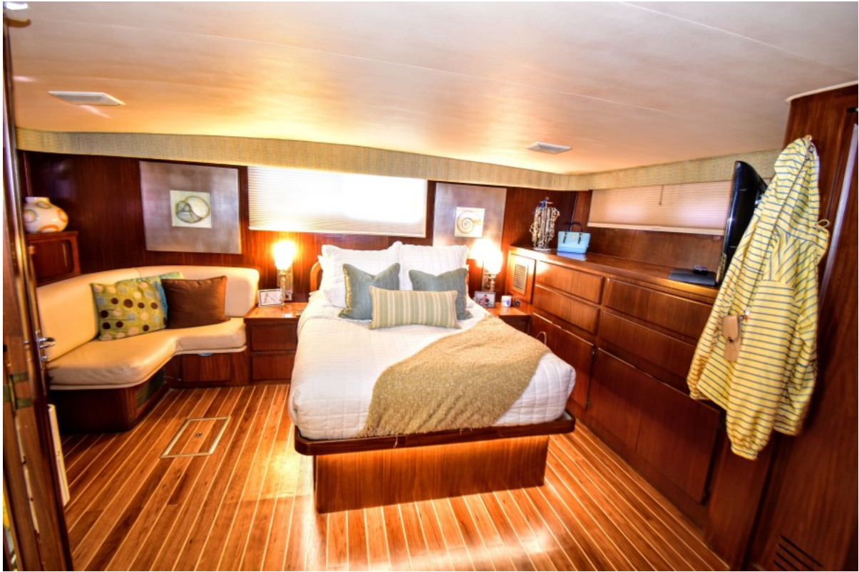
Hatteras Cockpit Motor Yacht 1989 Why Knot Just Because