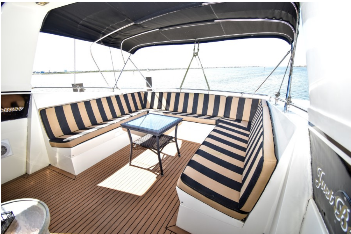
Why Knot Just Because Hatteras 1989 67 Cockpit Motor Yacht