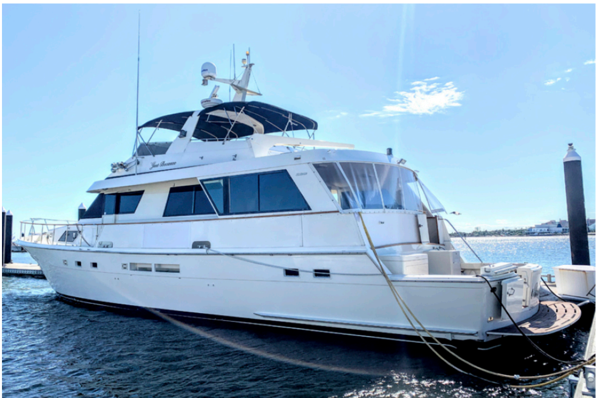
Hatteras Cockpit Motor Yacht 1989 Why Knot Just Because