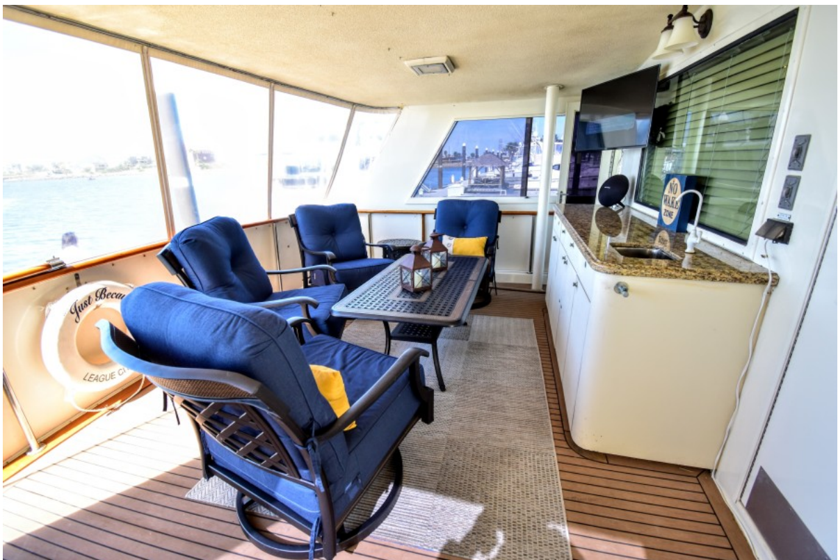
Hatteras Cockpit Motor Yacht 1989 Why Knot Just Because