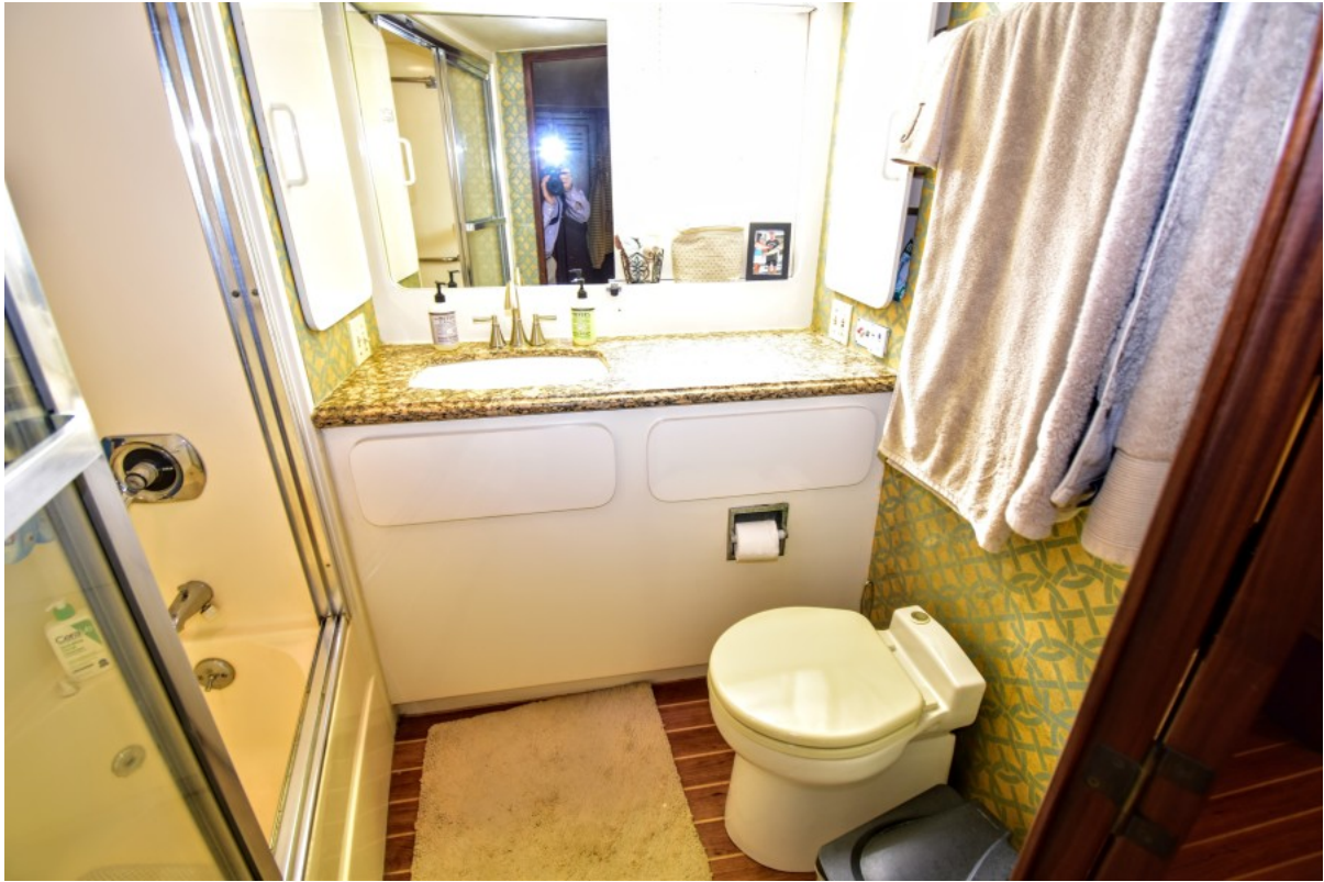
Hatteras Cockpit Motor Yacht 1989 Why Knot Just Because