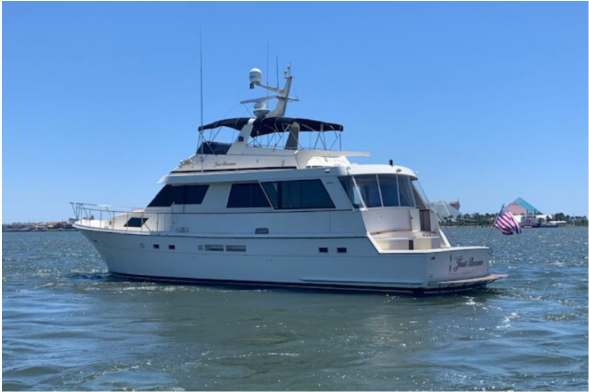
Hatteras Cockpit Motor Yacht 1989 Why Knot Just Because