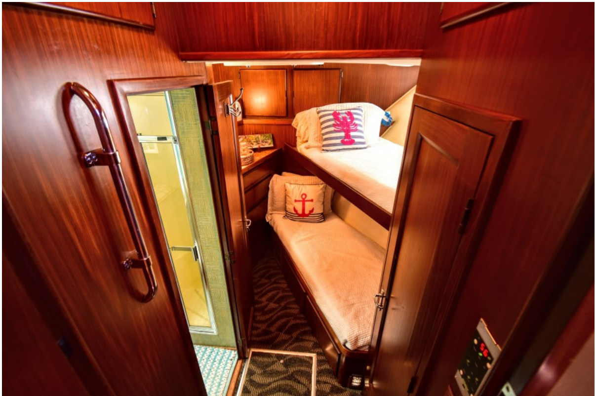
Hatteras Cockpit Motor Yacht 1989 Why Knot Just Because