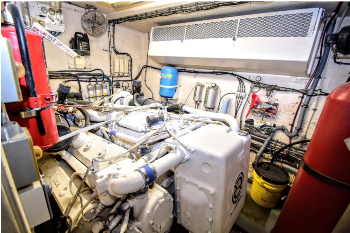
Hatteras Cockpit Motor Yacht 1989 Why Knot Just Because