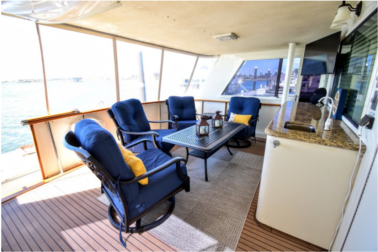
Hatteras Cockpit Motor Yacht 1989 Why Knot Just Because