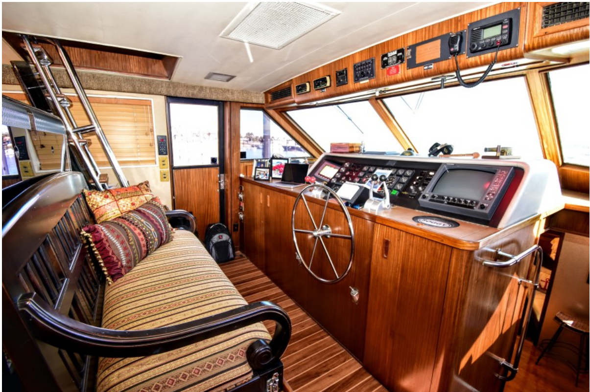
Hatteras Cockpit Motor Yacht 1989 Why Knot Just Because