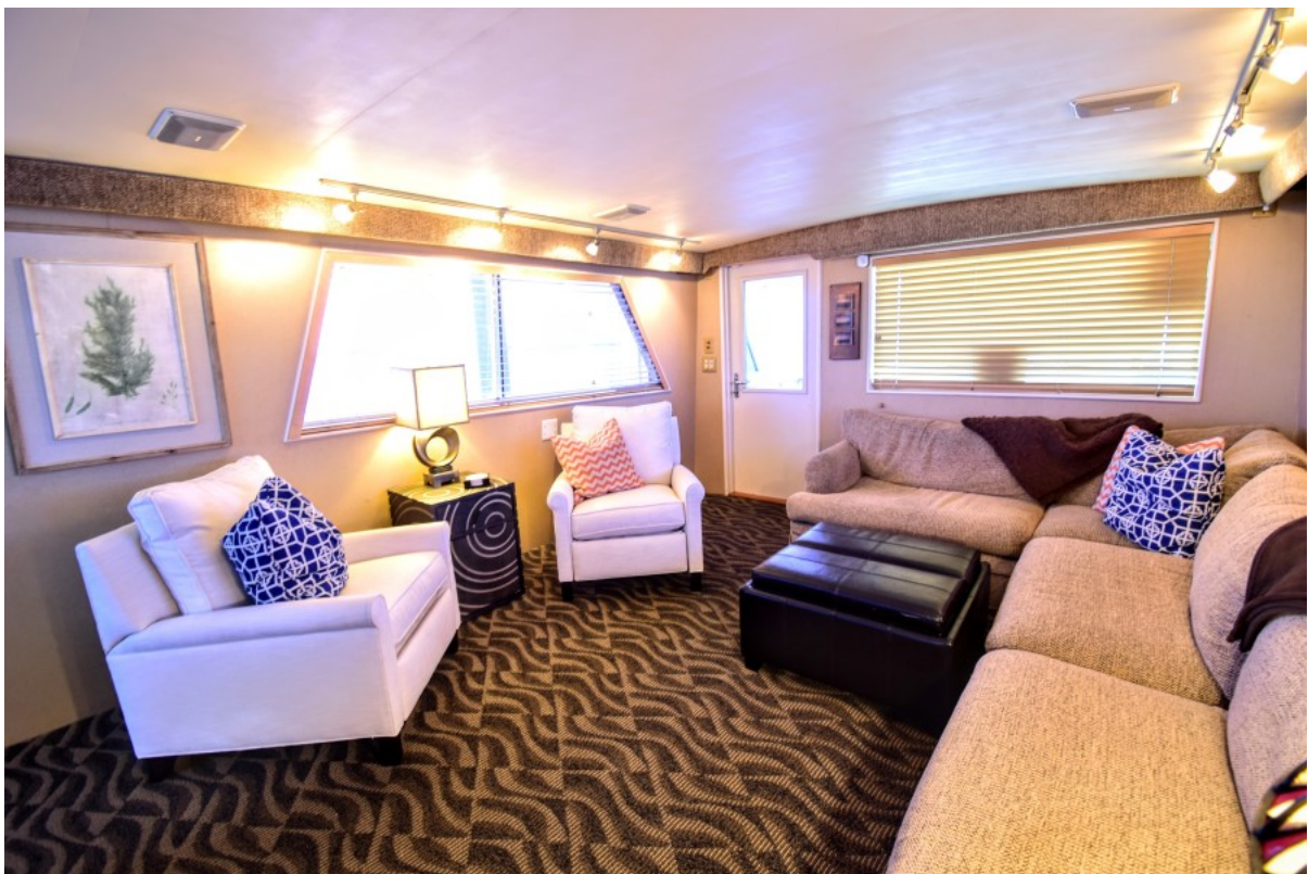
Hatteras Cockpit Motor Yacht 1989 Why Knot Just Because