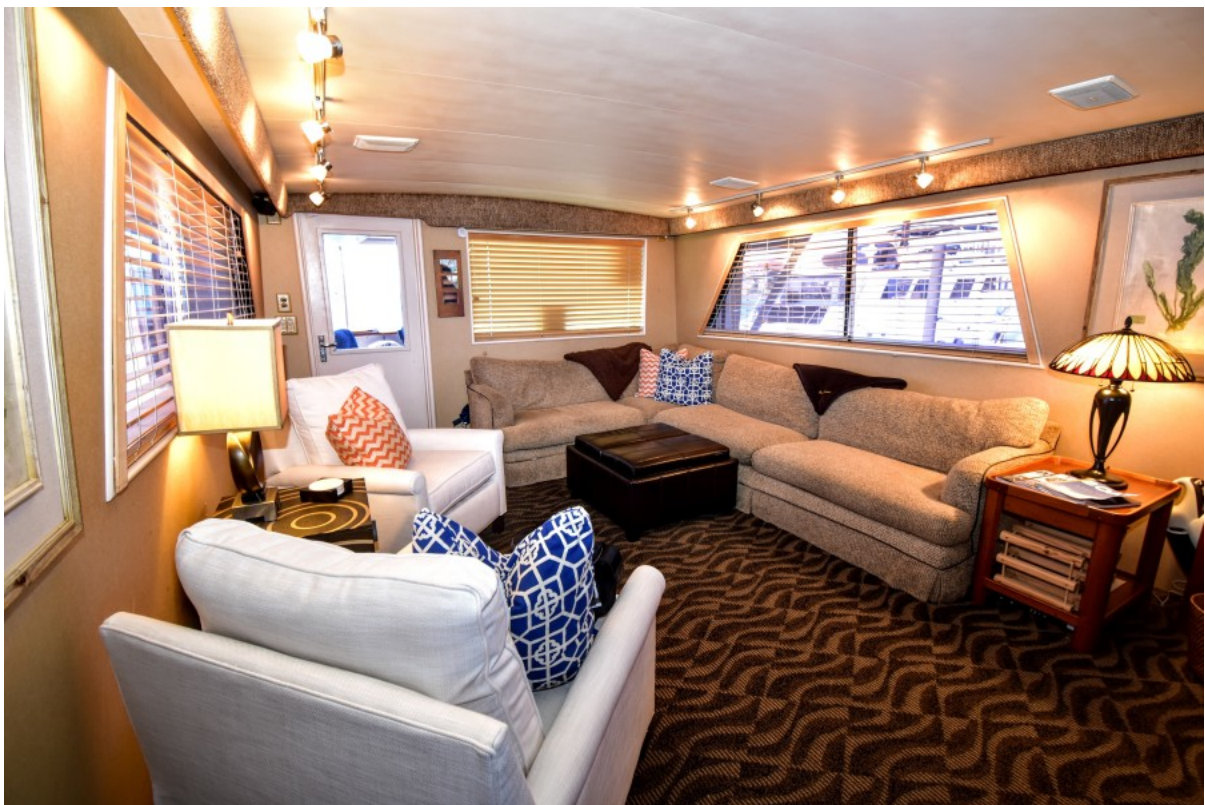
Hatteras Cockpit Motor Yacht 1989 Why Knot Just Because