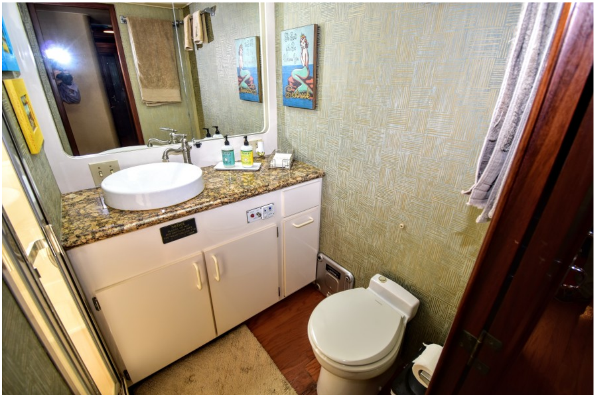
Hatteras Cockpit Motor Yacht 1989 Why Knot Just Because