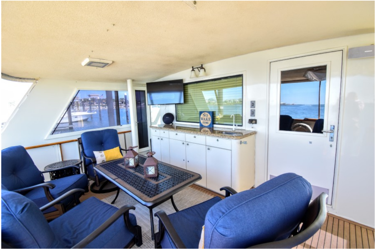
Hatteras Cockpit Motor Yacht 1989 Why Knot Just Because