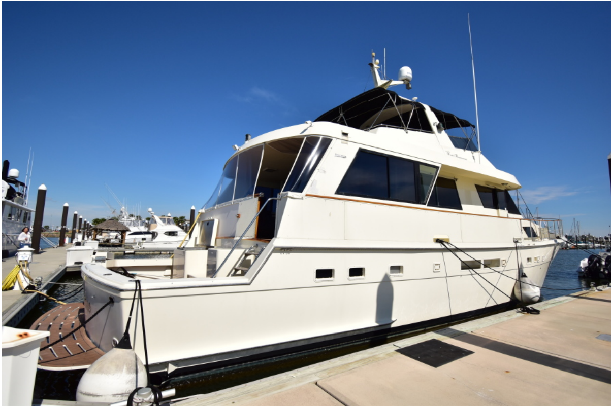
Hatteras Cockpit Motor Yacht 1989 Why Knot Just Because