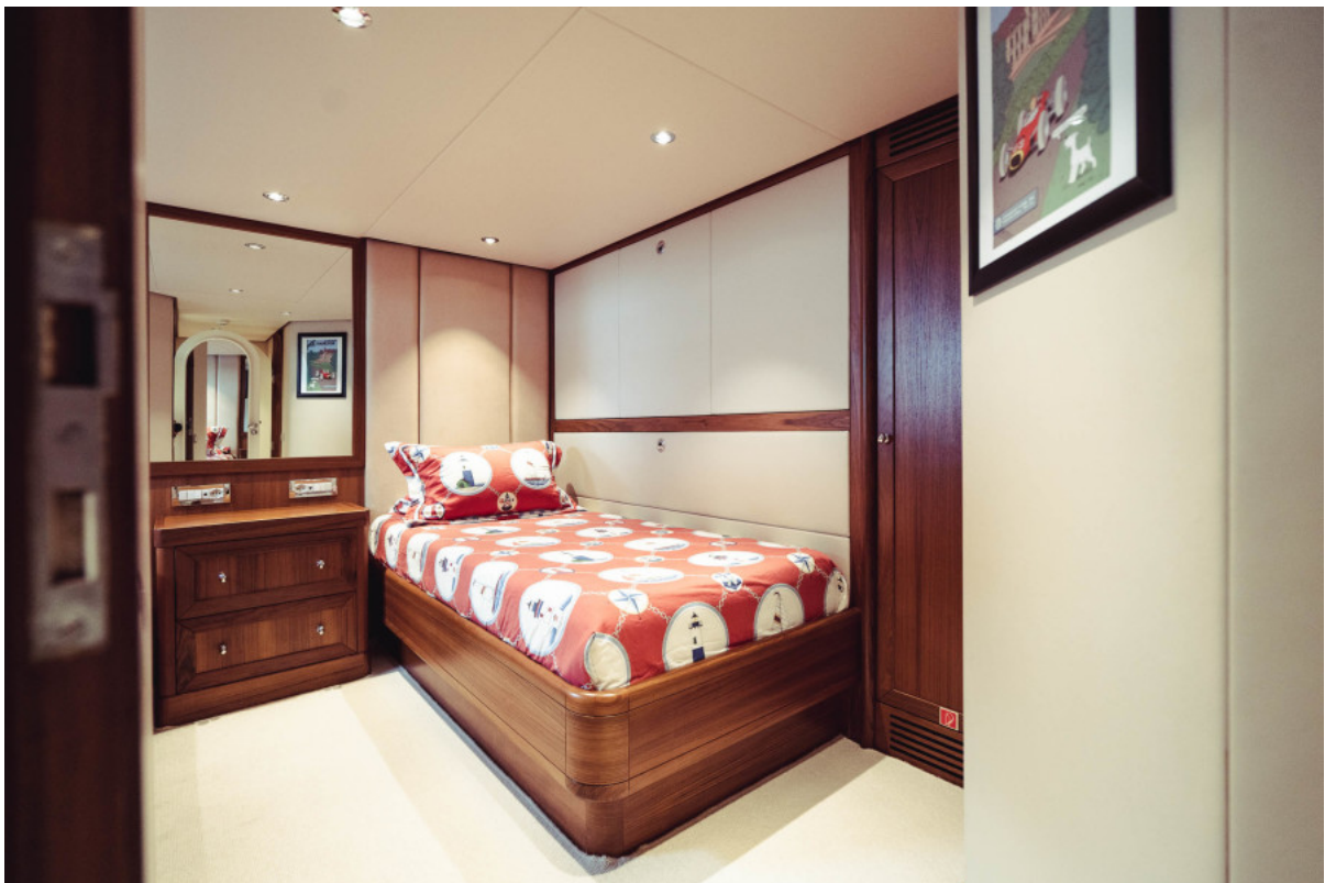
Twin Guest Stateroom with Pullman