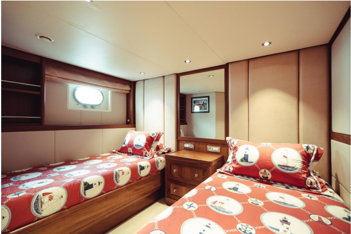
Twin Guest Stateroom with Pullman