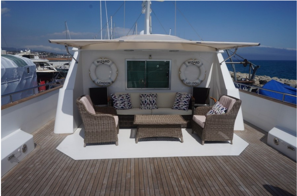
Upper Deck Seating