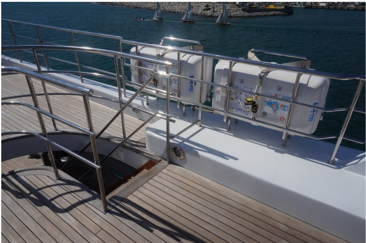
Stairway to Lower Deck