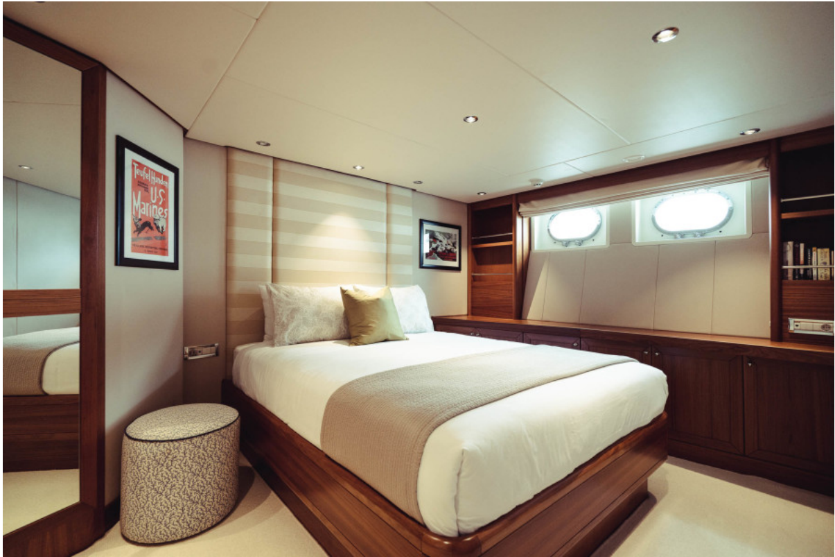
VIP Guest Stateroom