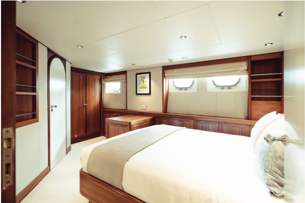
Queen Guest Stateroom #2