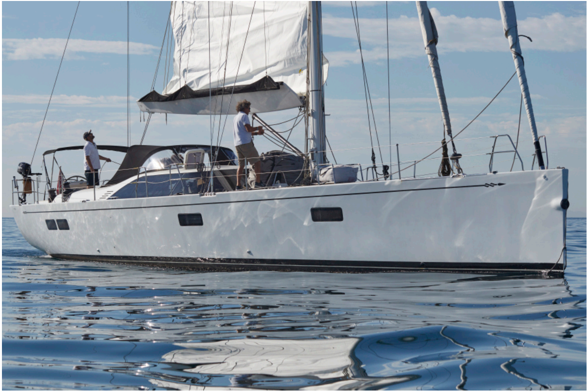
Tripp 65 Underway