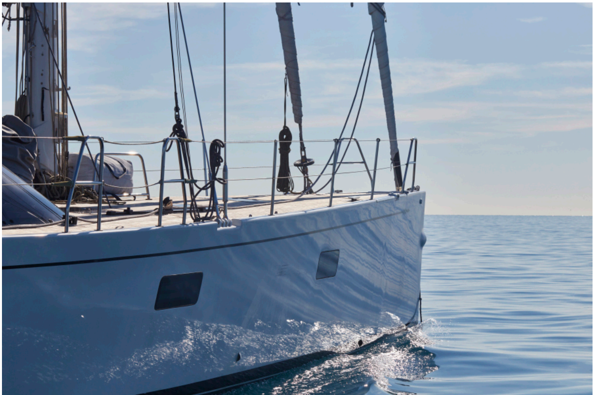
Tripp 65 Bow