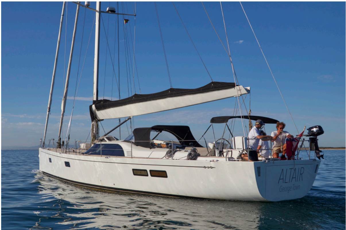
Tripp 65 Underway