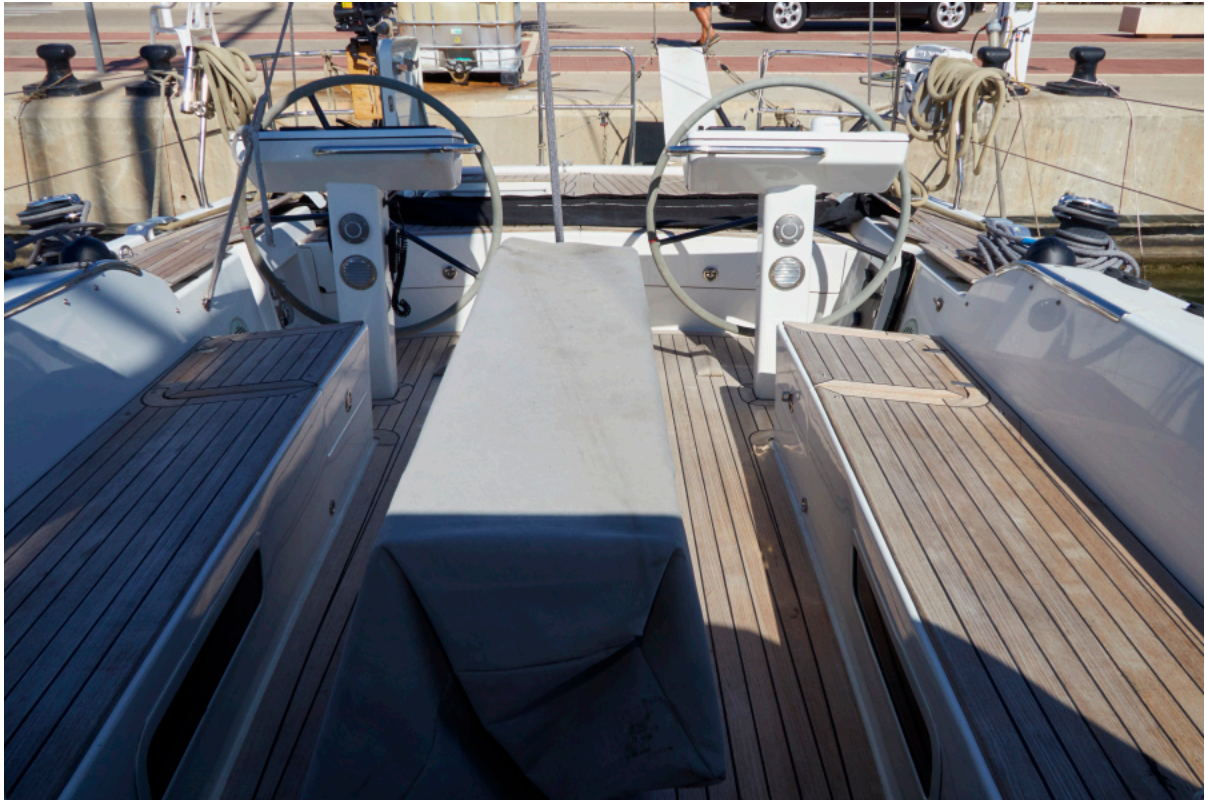
Tripp 65 Cockpit