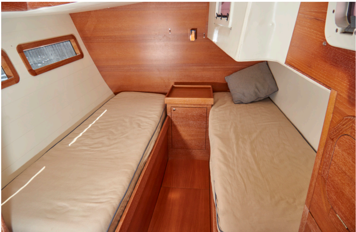
Aft Guest Cabin