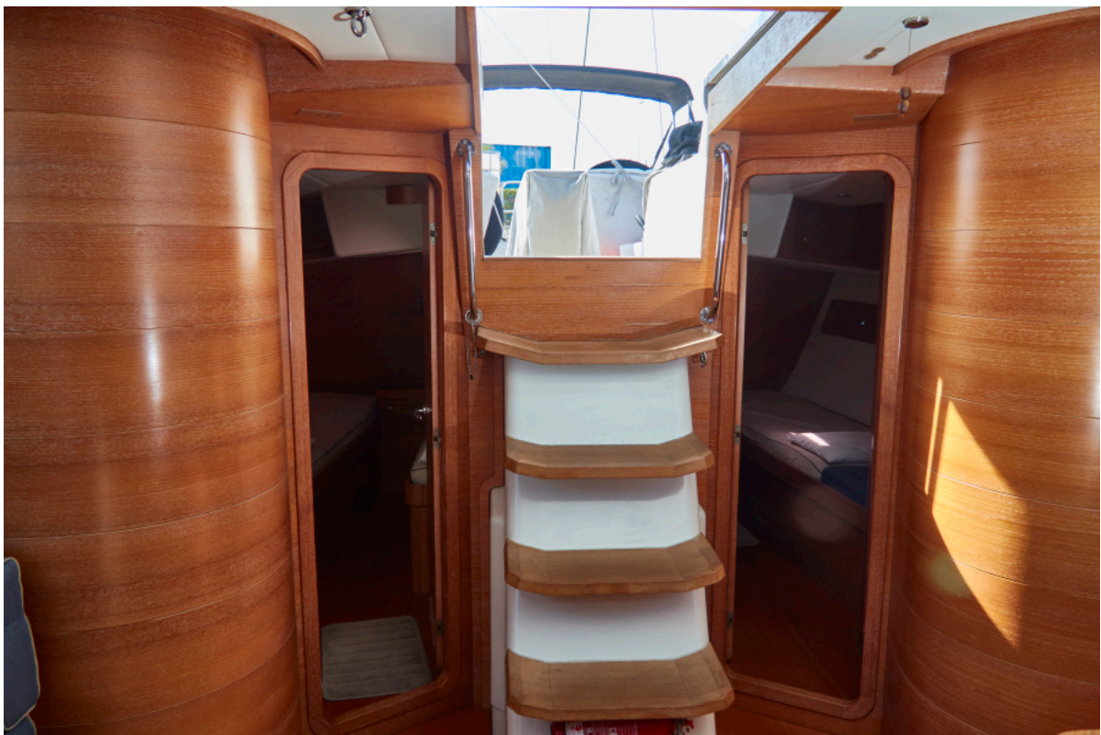
Tripp 65 Stairs from deck to saloon