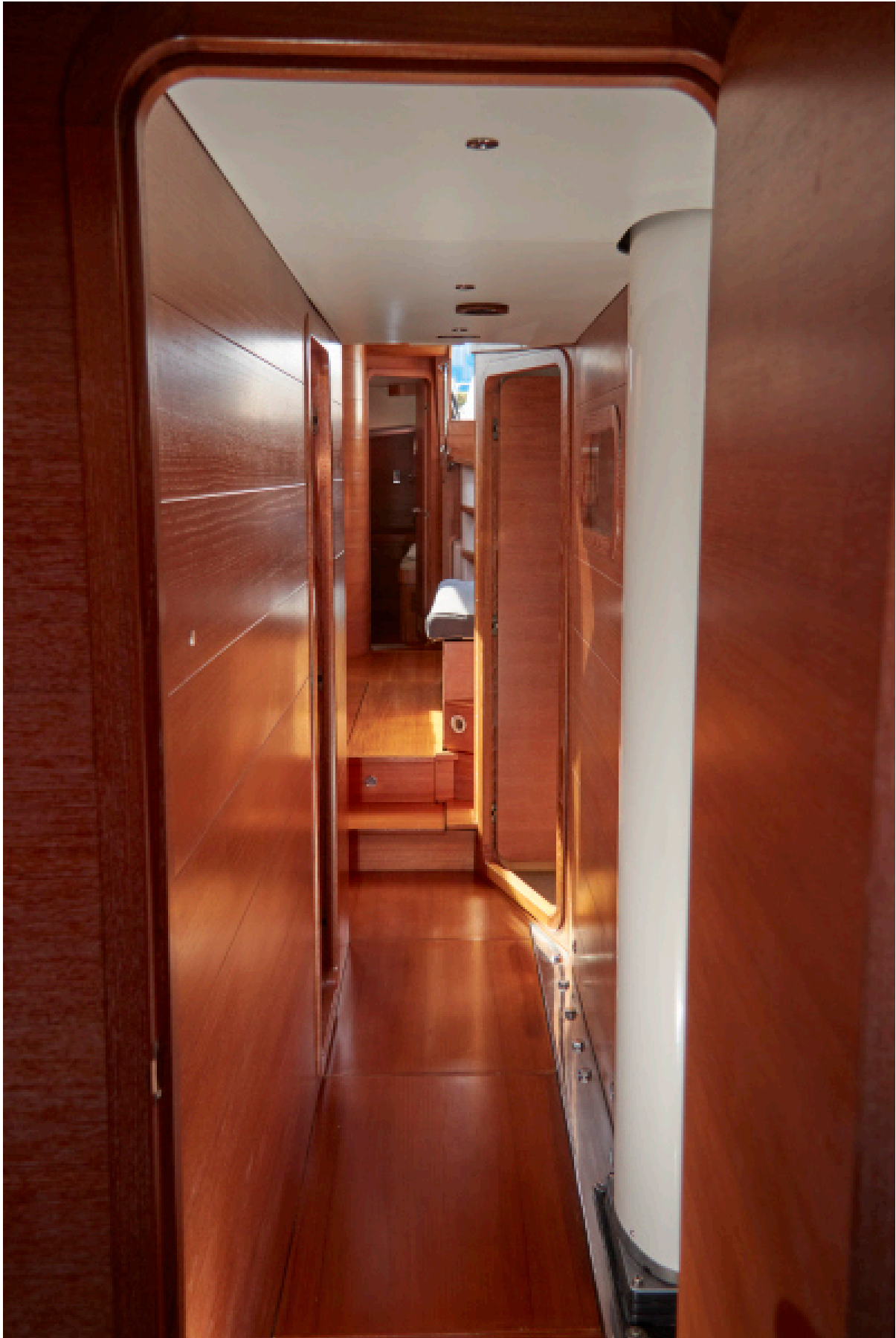
Hallway to cabins