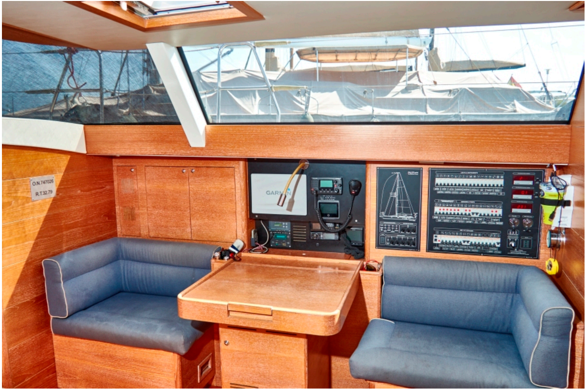
Tripp 65 Saloon/Navigation Area