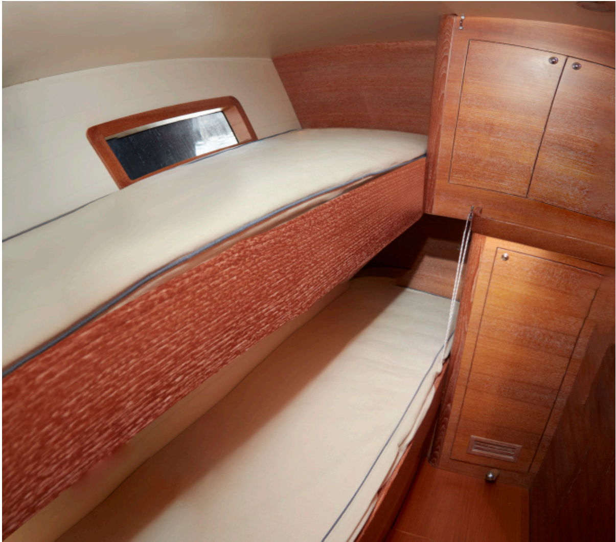
Forward Guest Cabin