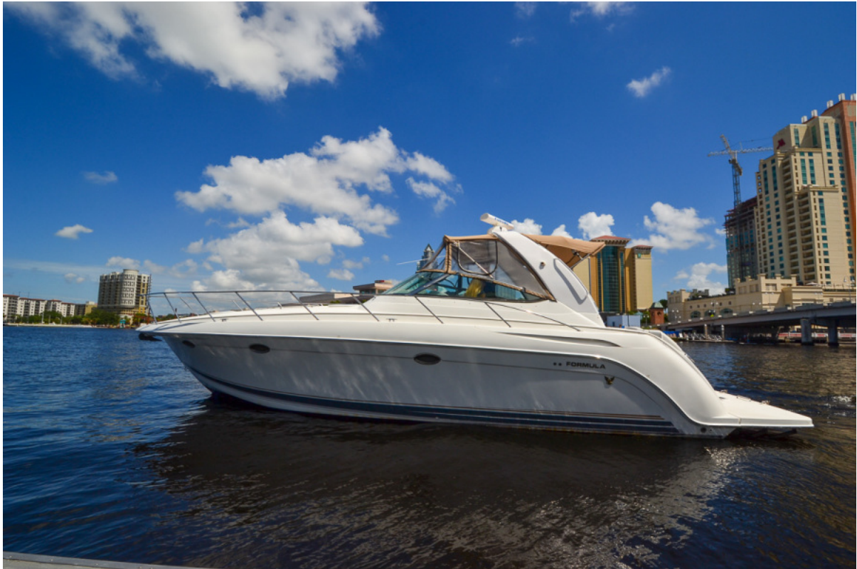
Formula 37 PC