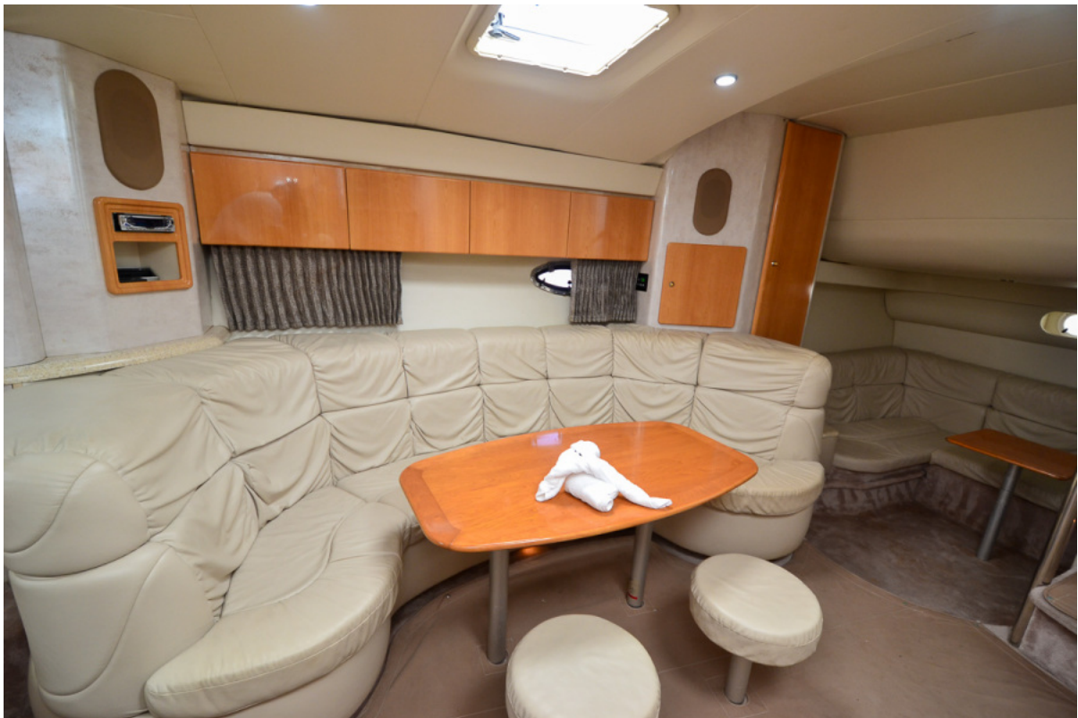
Sofa & Dinette