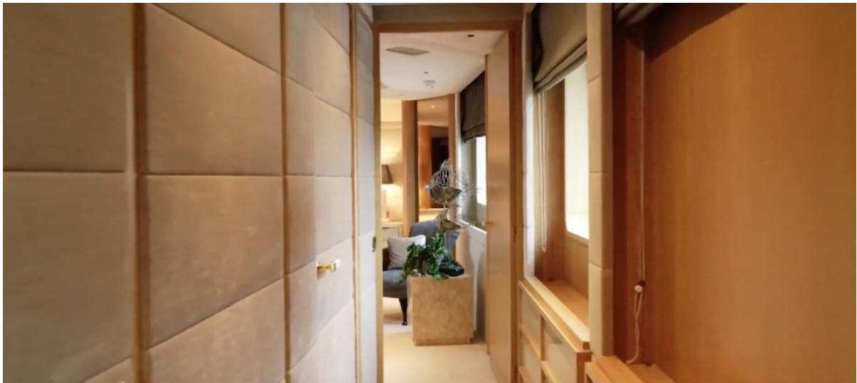
Owner Stateroom Hallway