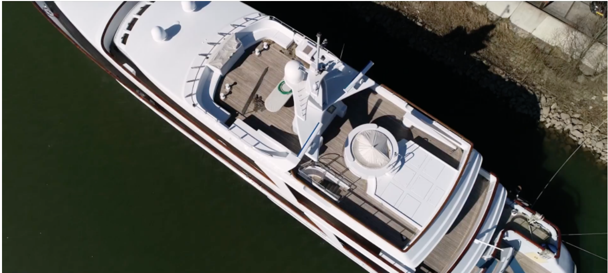
Aerial Upper Deck