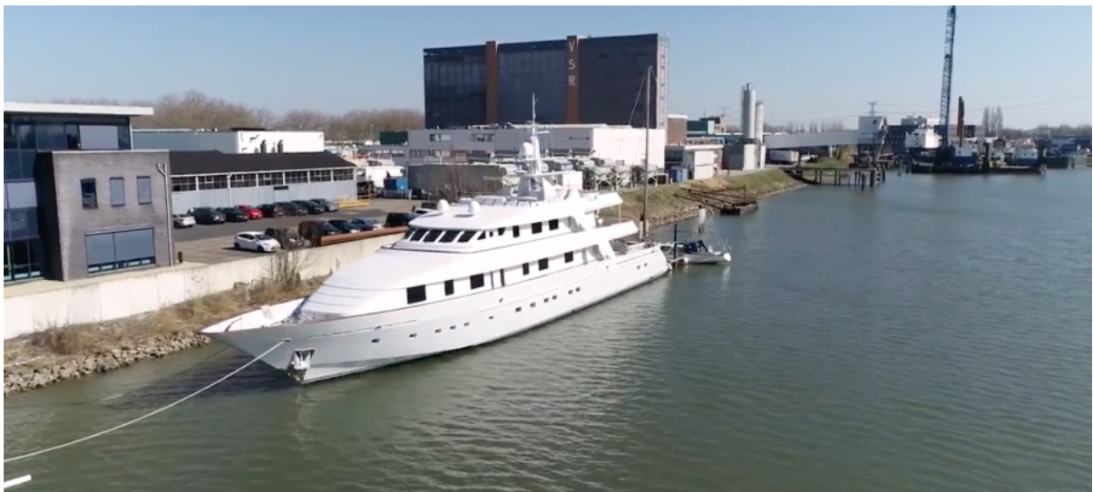
Port Bow Profile