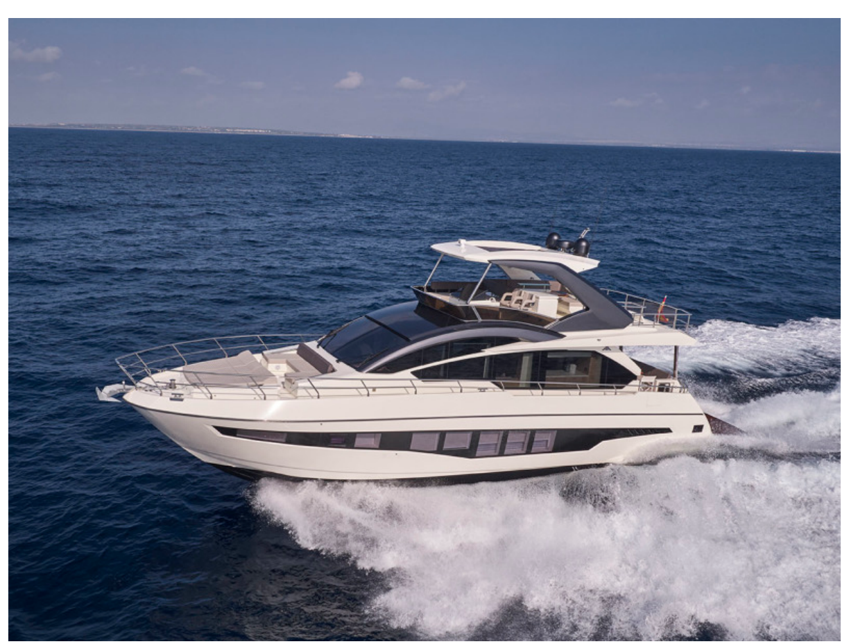
Astondoa 66 Flybridge