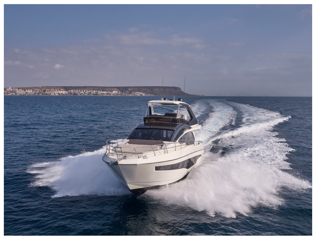
Astondoa 66 Flybridge