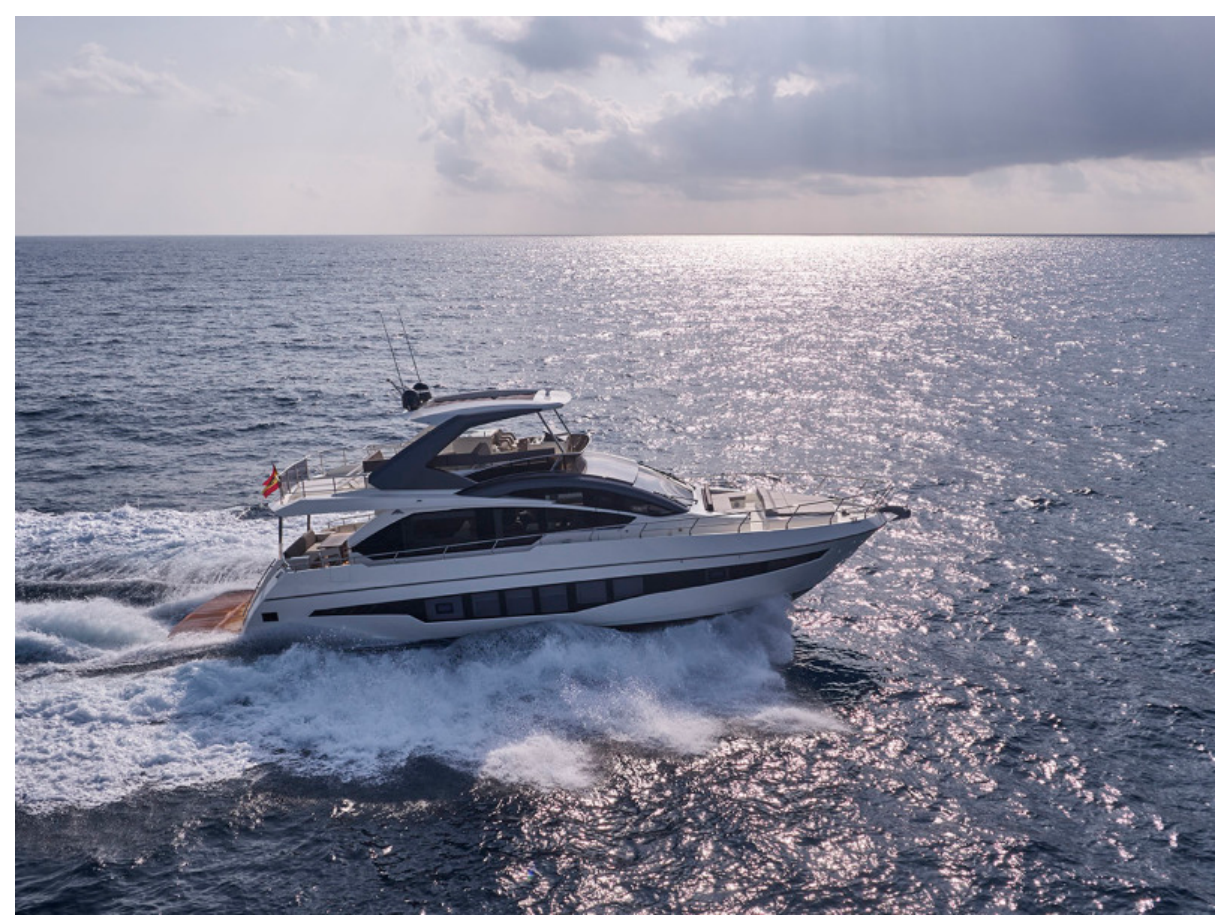
Astondoa 66 Flybridge