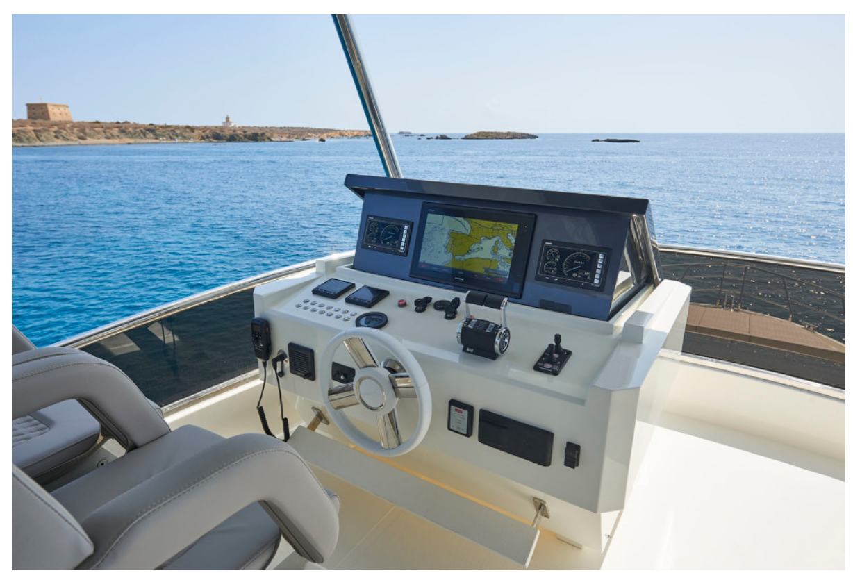
Astondoa 66 Flybridge Upper Helm Station