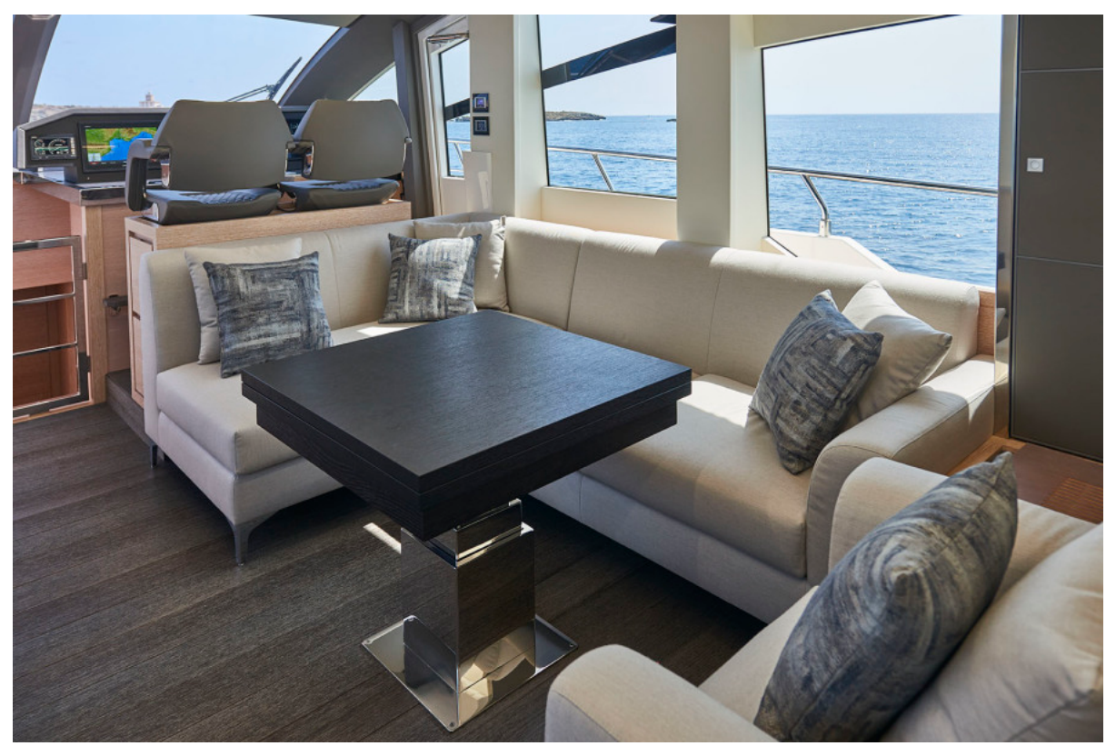
Astondoa 66 Flybridge Salon