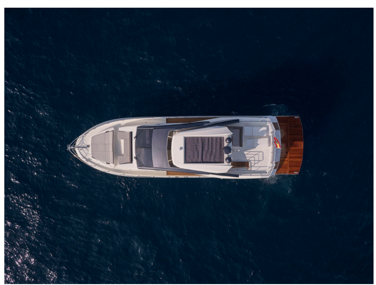
Astondoa 66 Flybridge