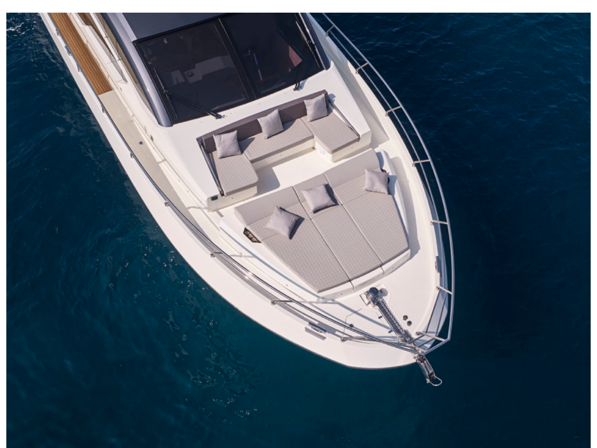
Astondoa 66 Flybridge Foredeck seating and large sunpads