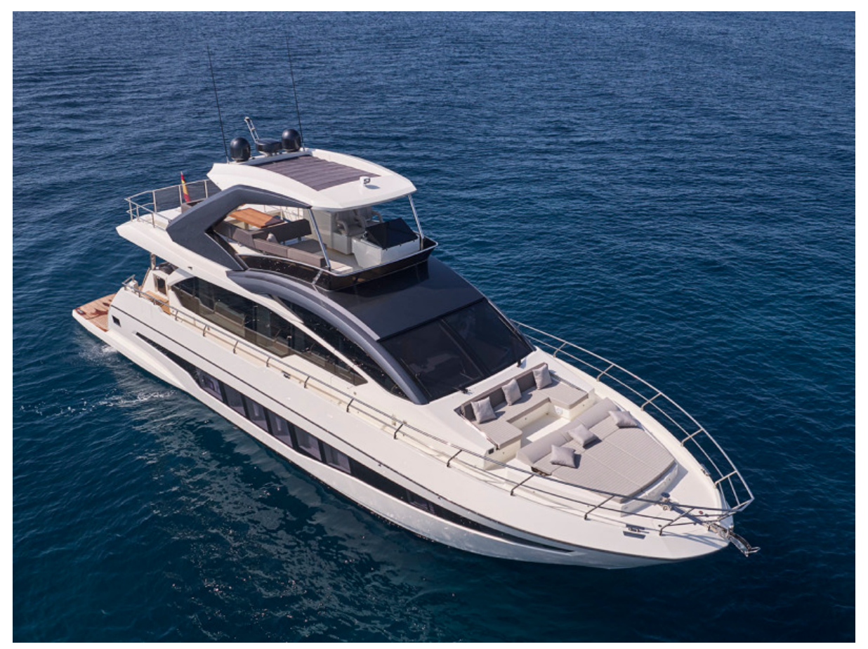
Astondoa 66 Flybridge