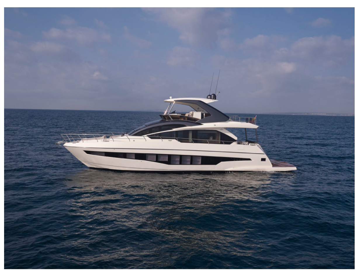
Astondoa 66 Flybridge