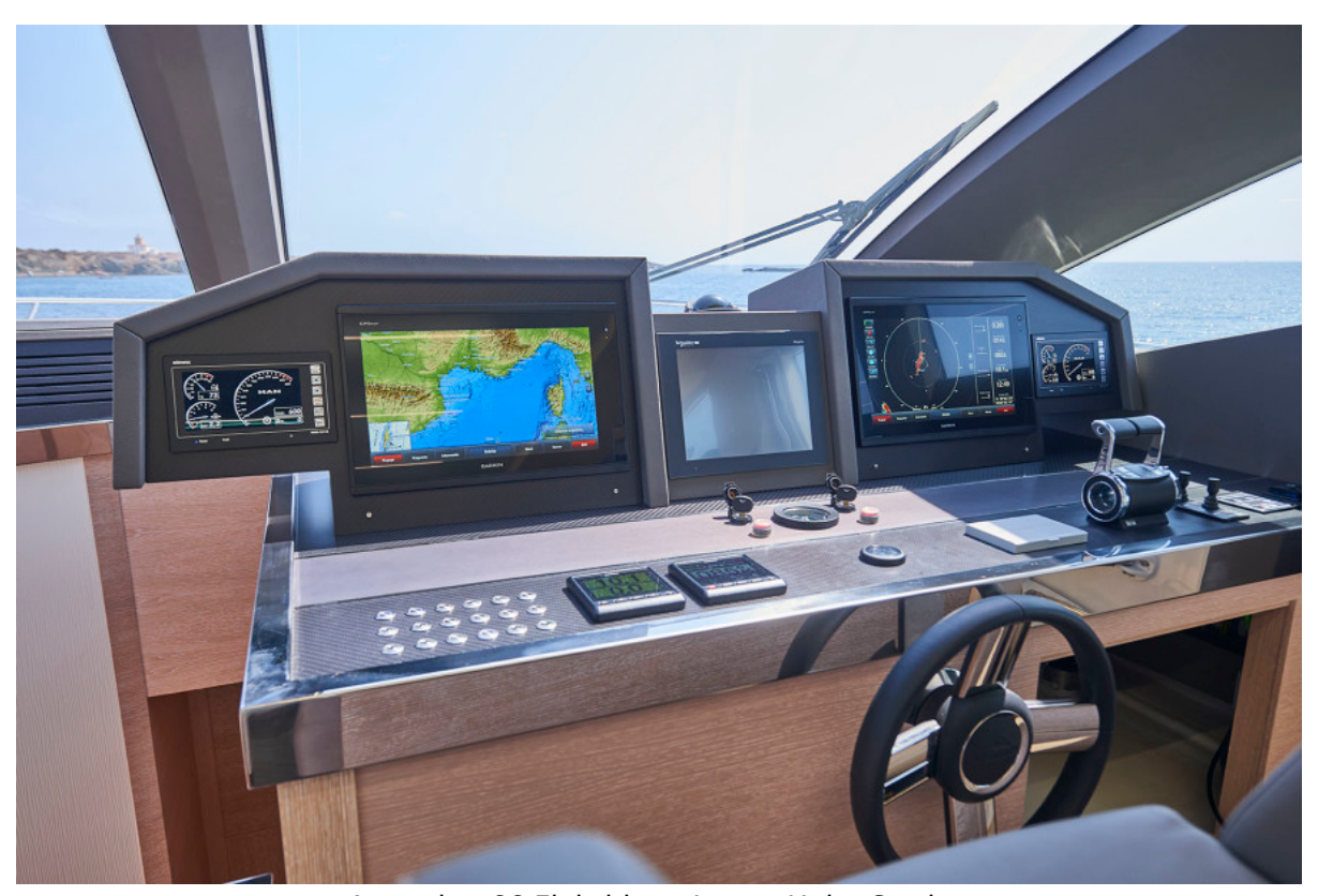
Astondoa 66 Flybridge Lower Helm Station