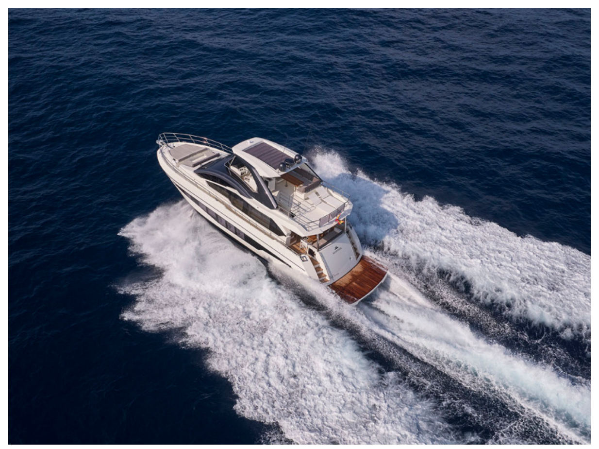
Astondoa 66 Flybridge