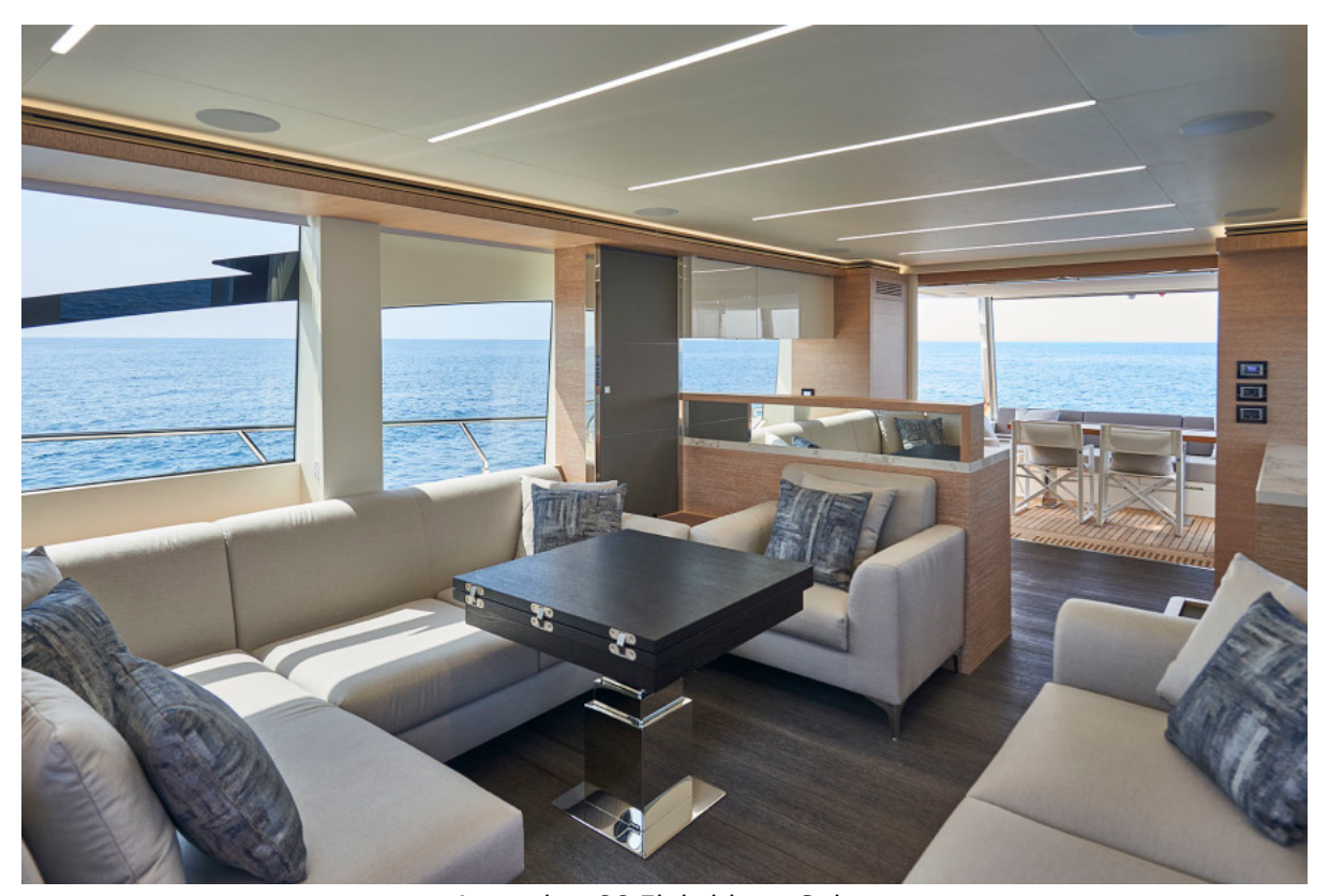
Astondoa 66 Flybridge Salon