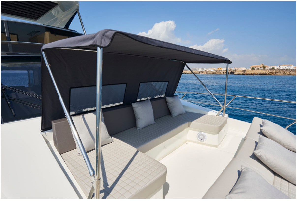
Astondoa 66 Flybridge