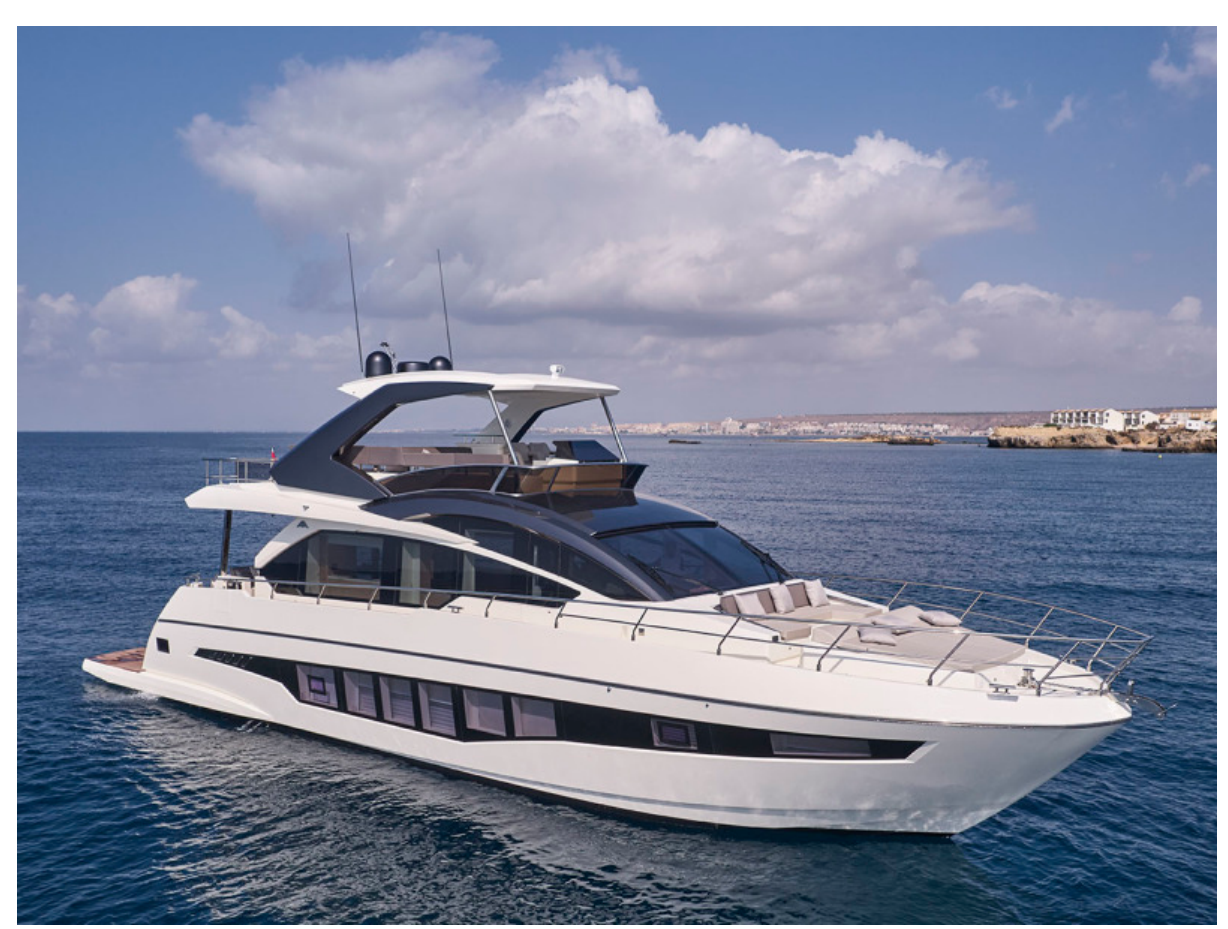
Astondoa 66 Flybridge