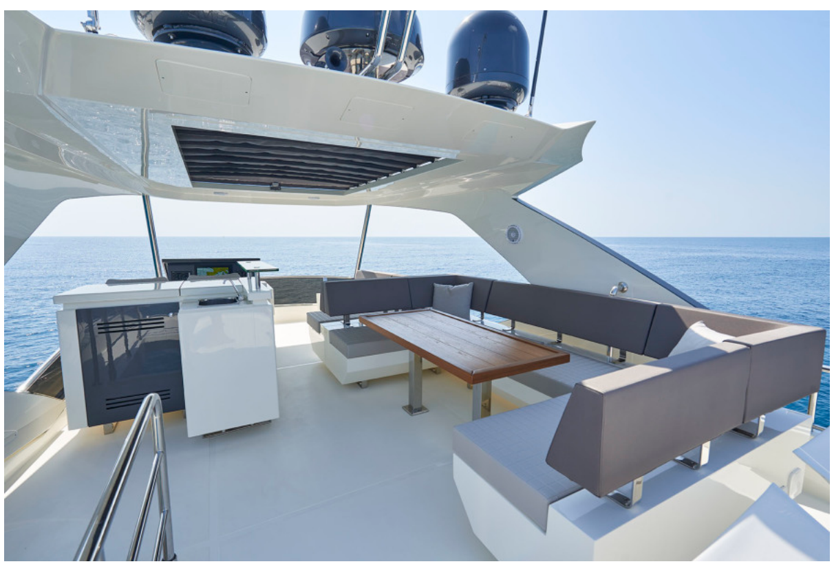
Astondoa 66 Flybridge