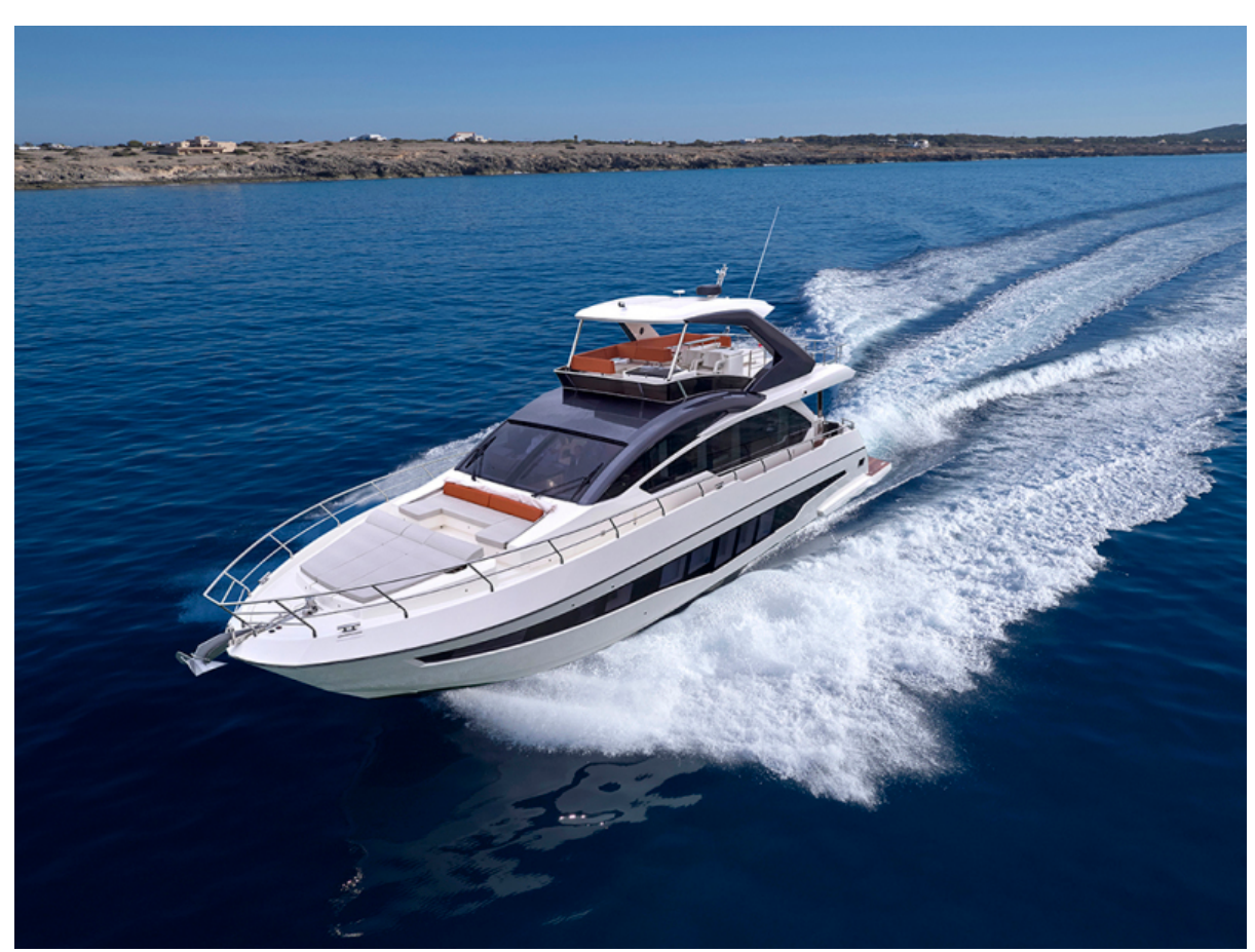
Astondoa 66 Flybridge