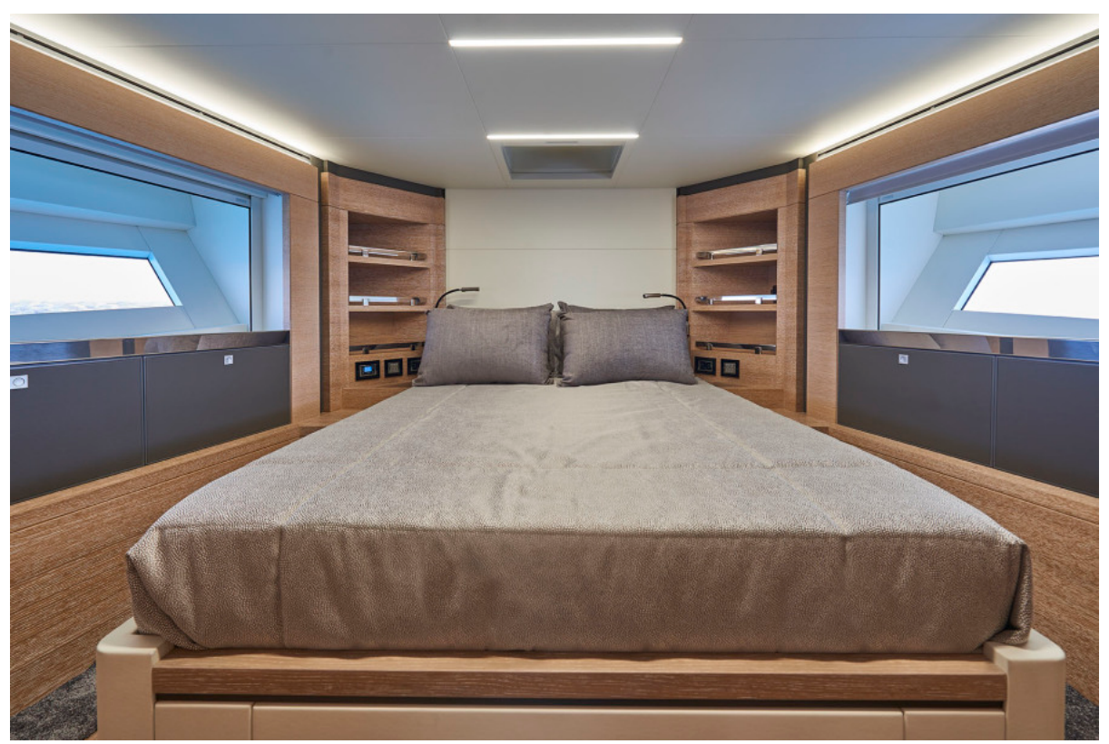
Astondoa 66 Flybridge VIP Cabin