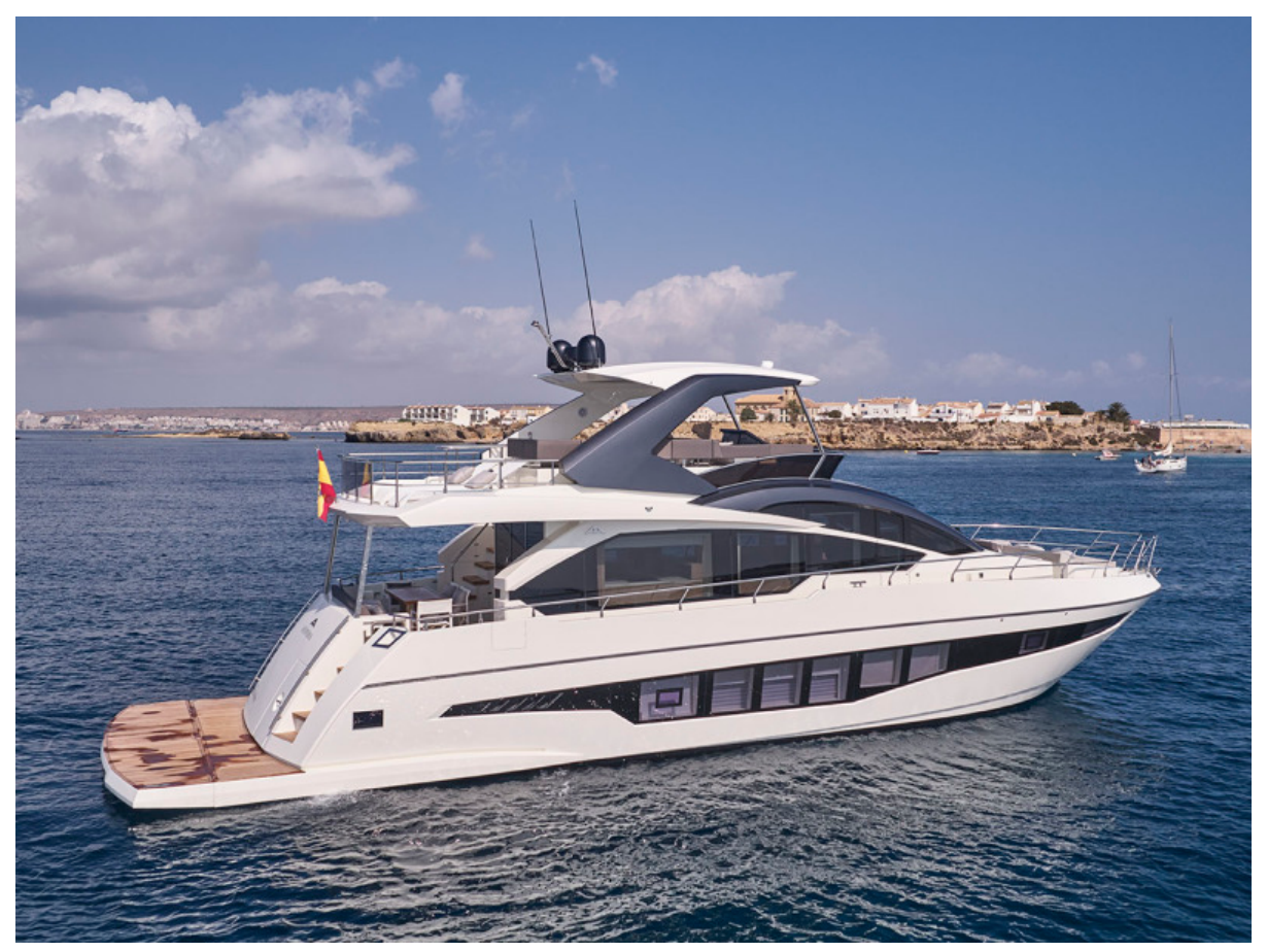
Astondoa 66 Flybridge