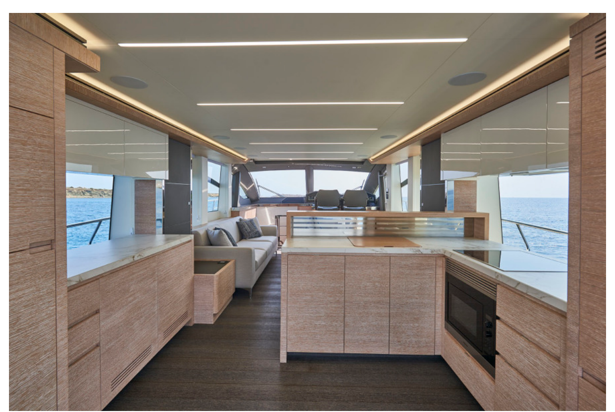
Astondoa 66 Flybridge Open galley