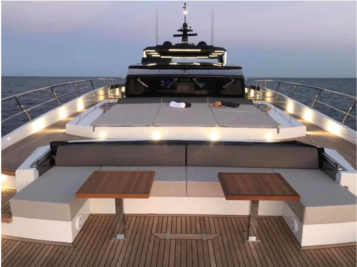
Astondoa 100 Century Foredeck