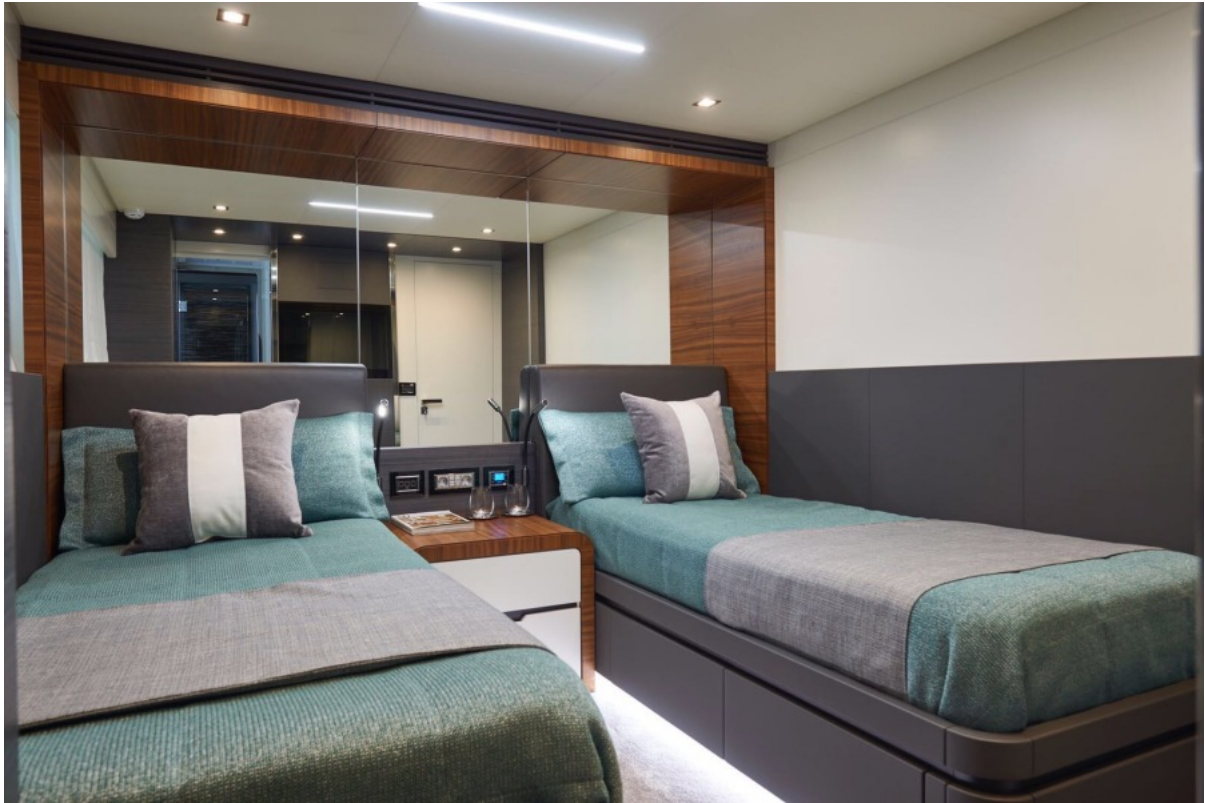
Astondoa 100 Century Twin cabins