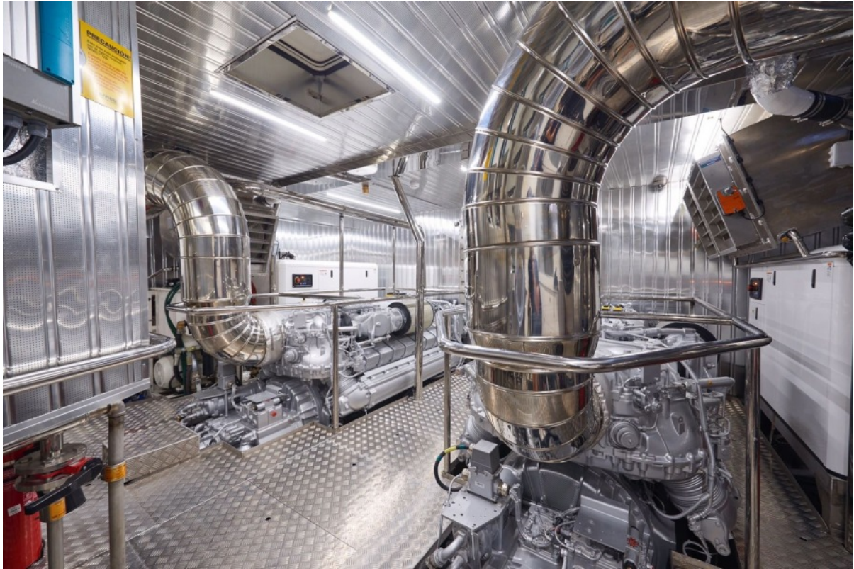
Astondoa 100 Century Engine Room