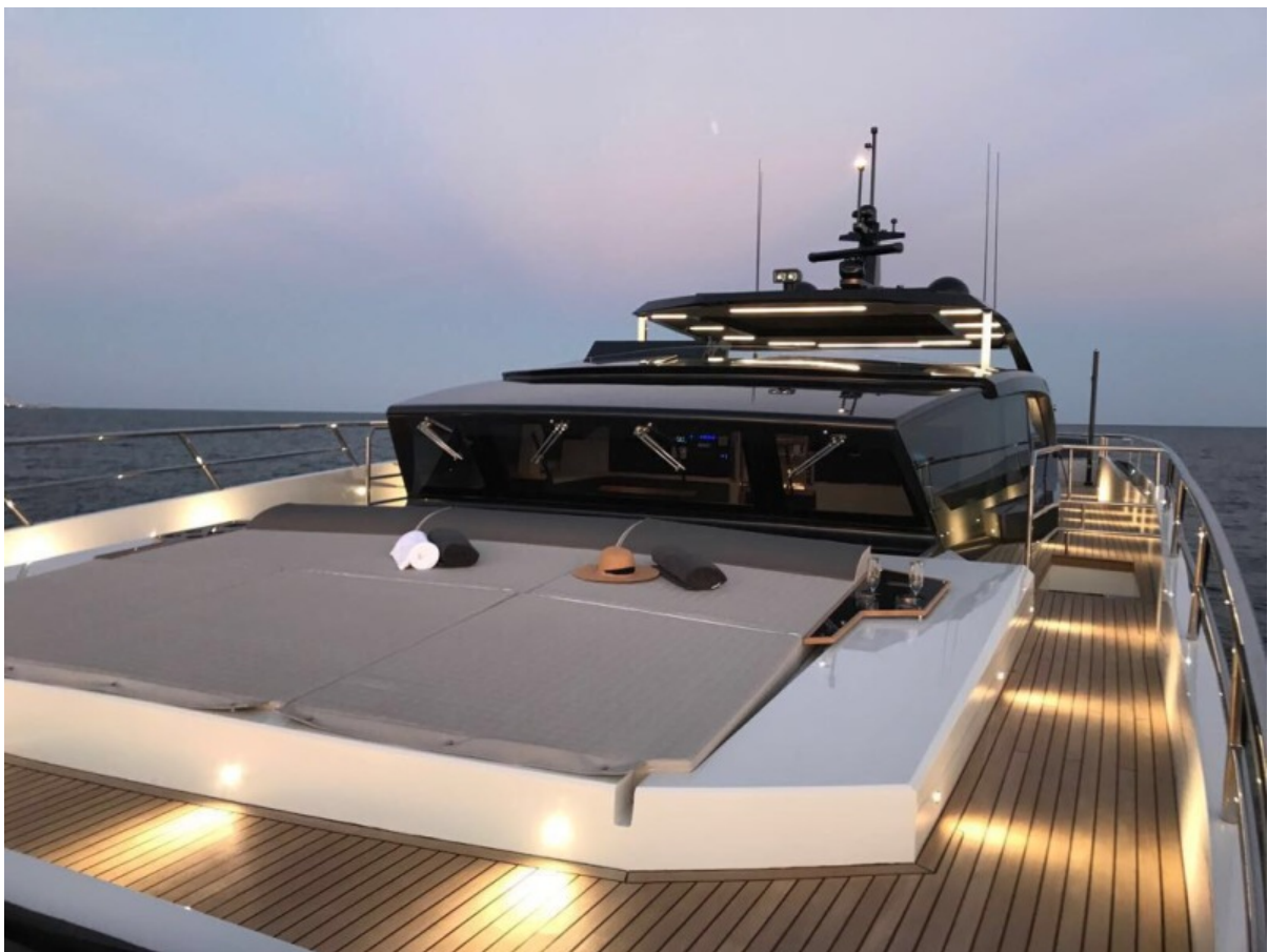
Astondoa 100 Century Foredeck