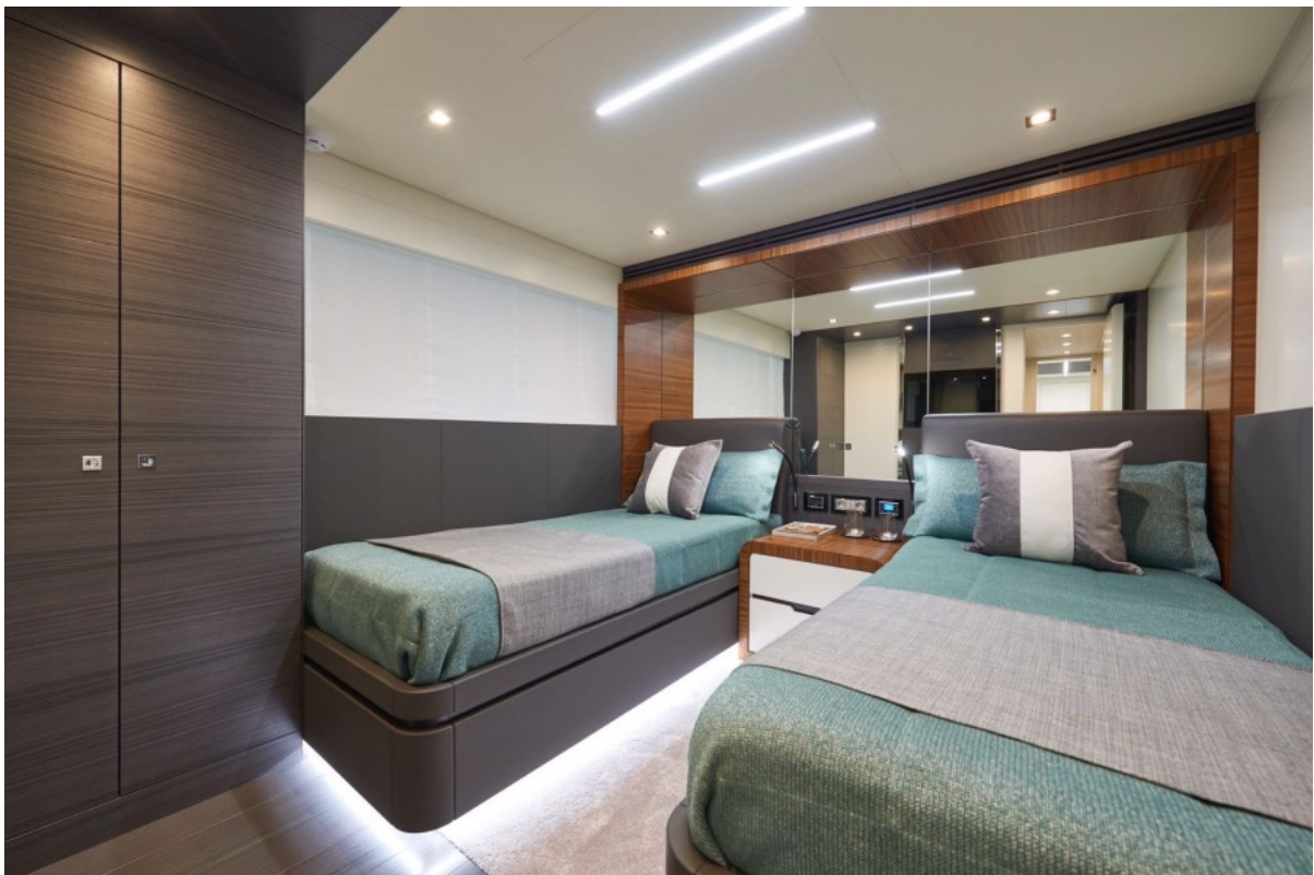
Astondoa 100 Century Twin cabins