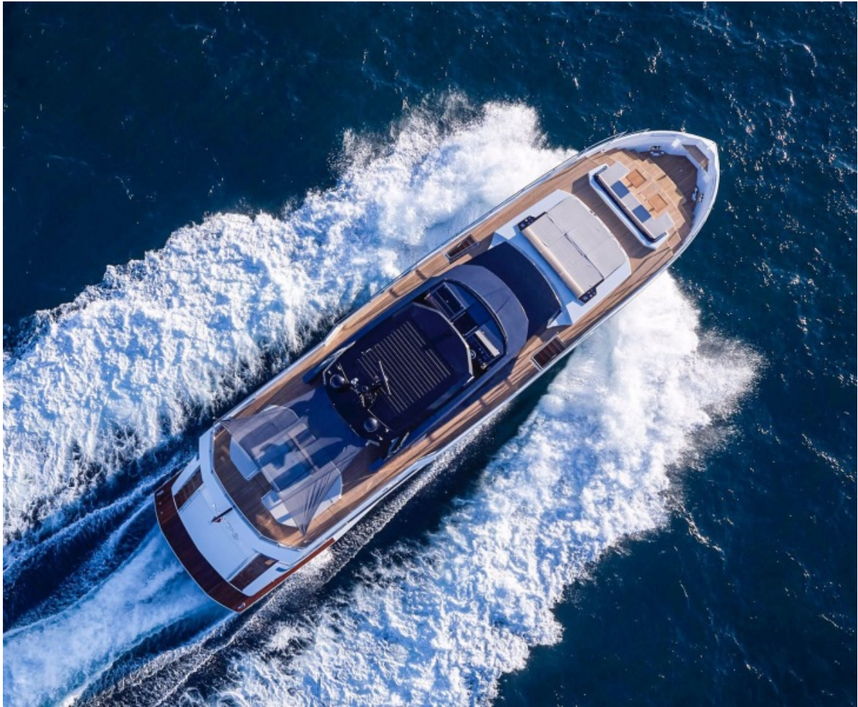
Astondoa 100 Century Aerial View