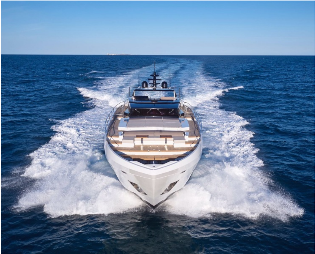
Astondoa 100 Century