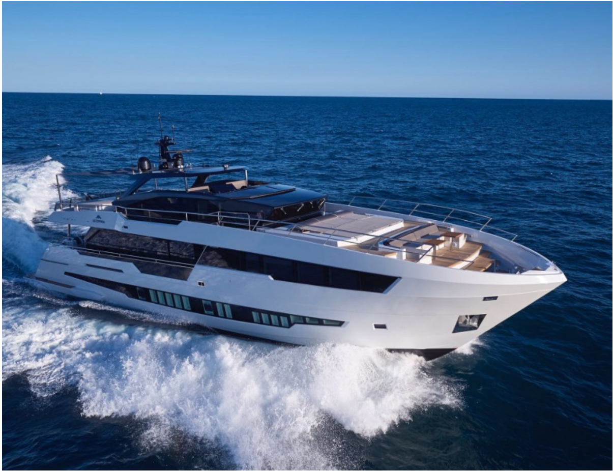
Astondoa 100 Century Running shot