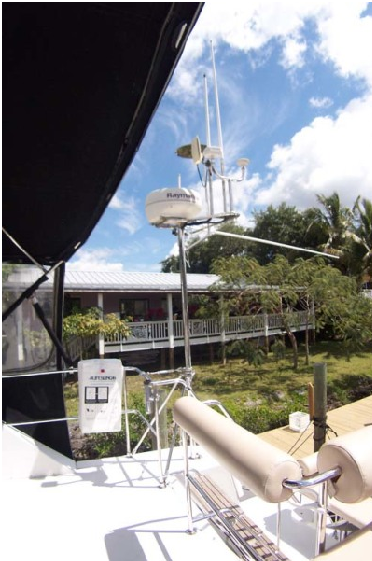
5a Sturdy Mast Lowers