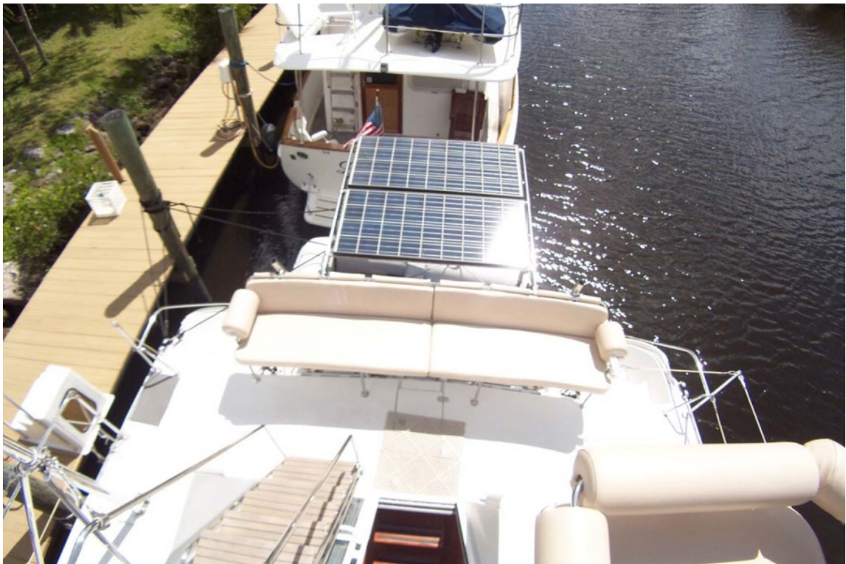
9 Solar Panels Aft Cockpit Seating