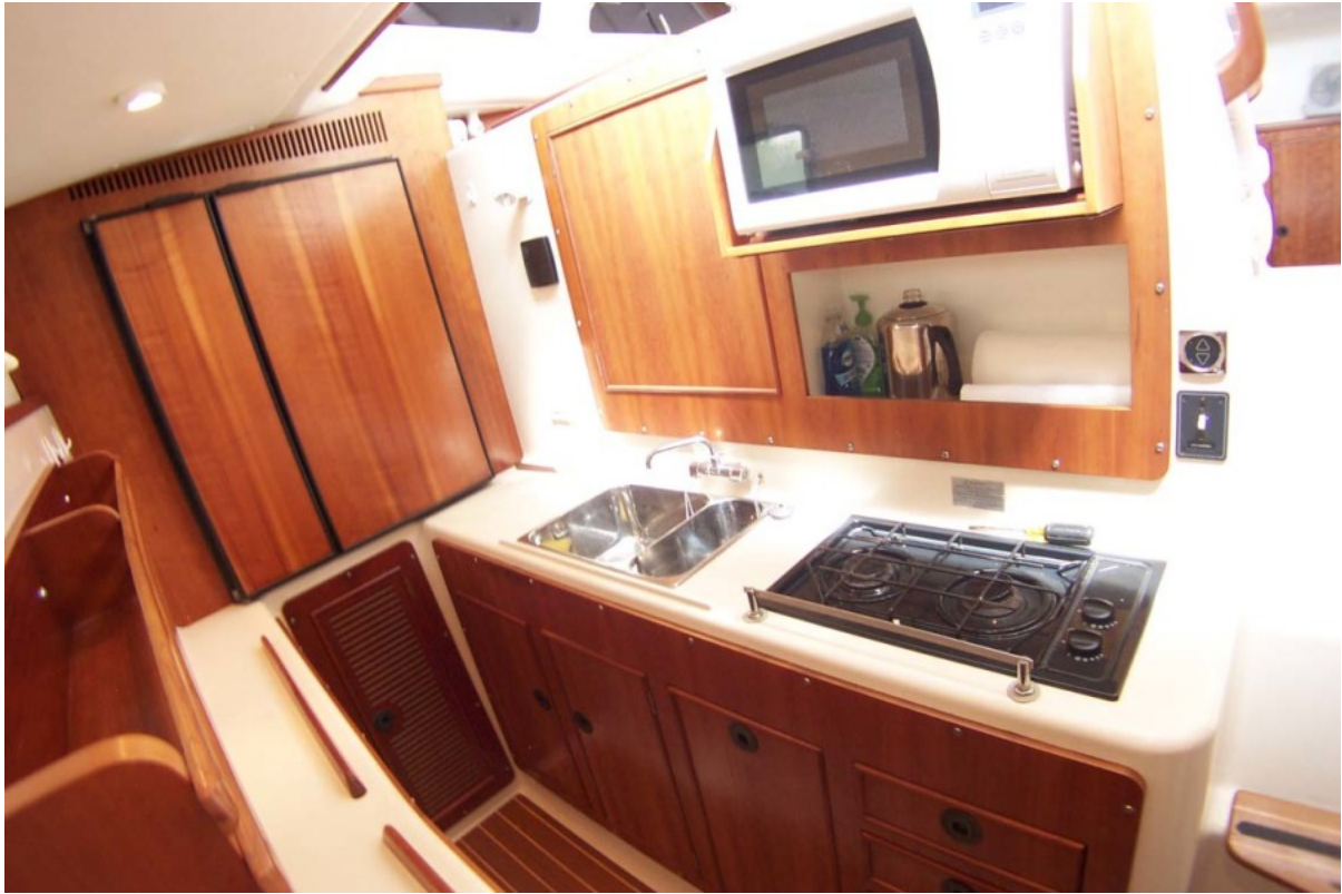
19 Galley In Port Hull