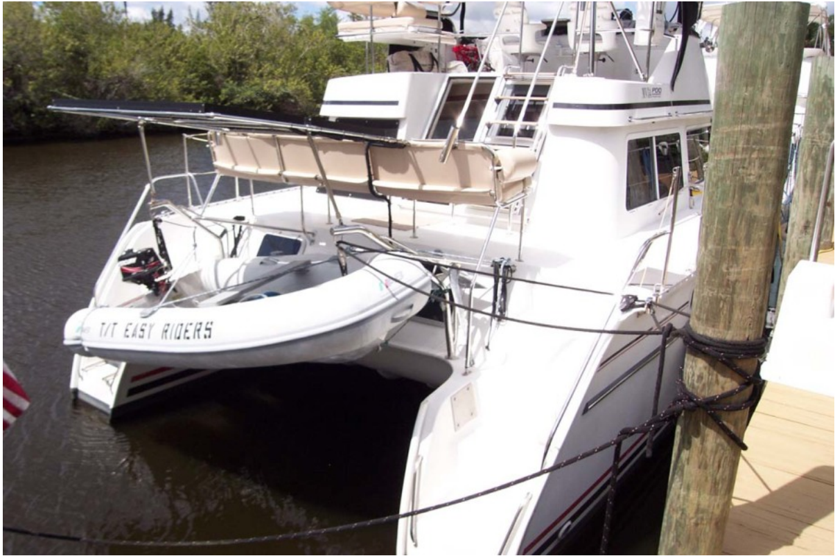
4a Stern Profile