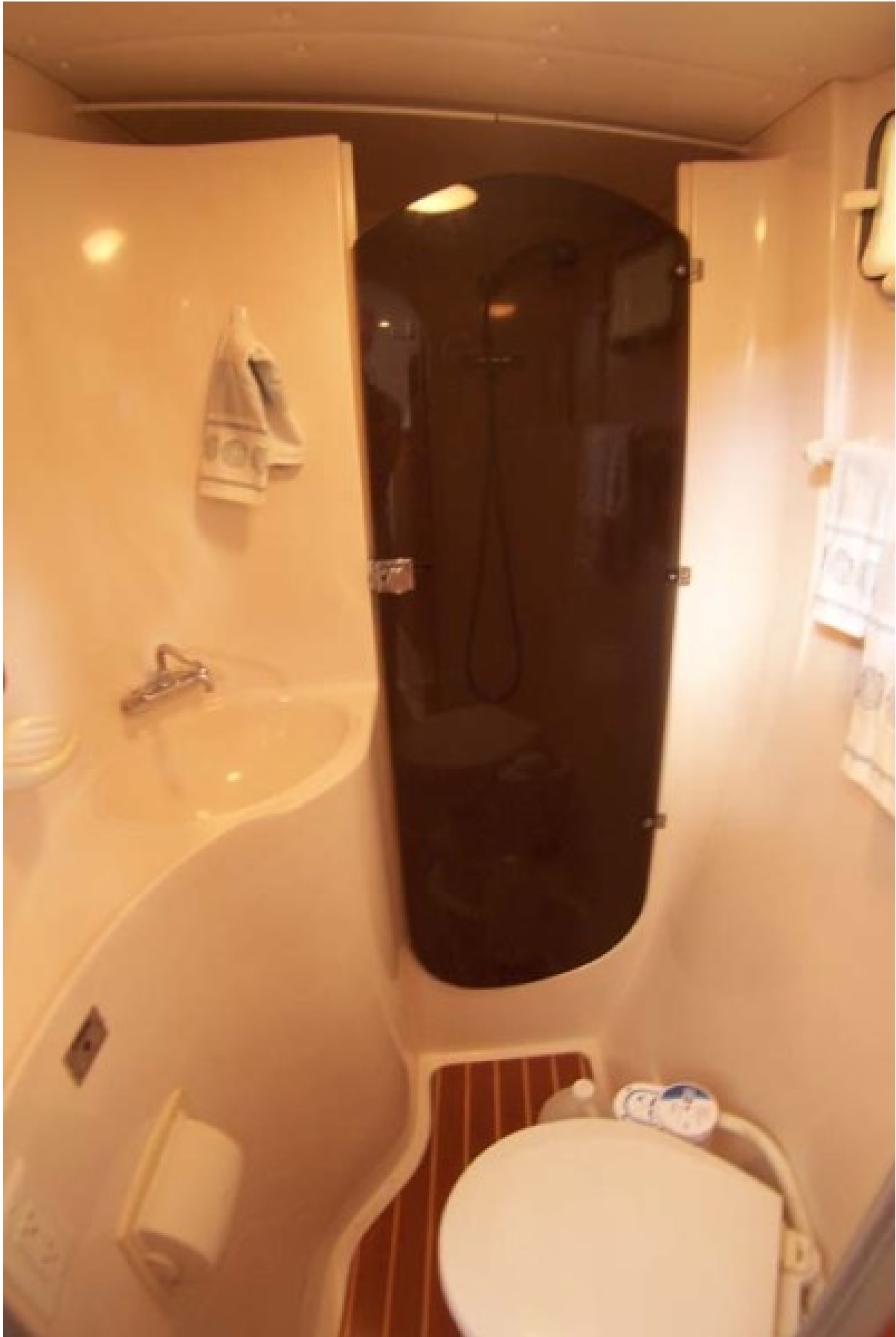
24 Head W Shower Door Closed