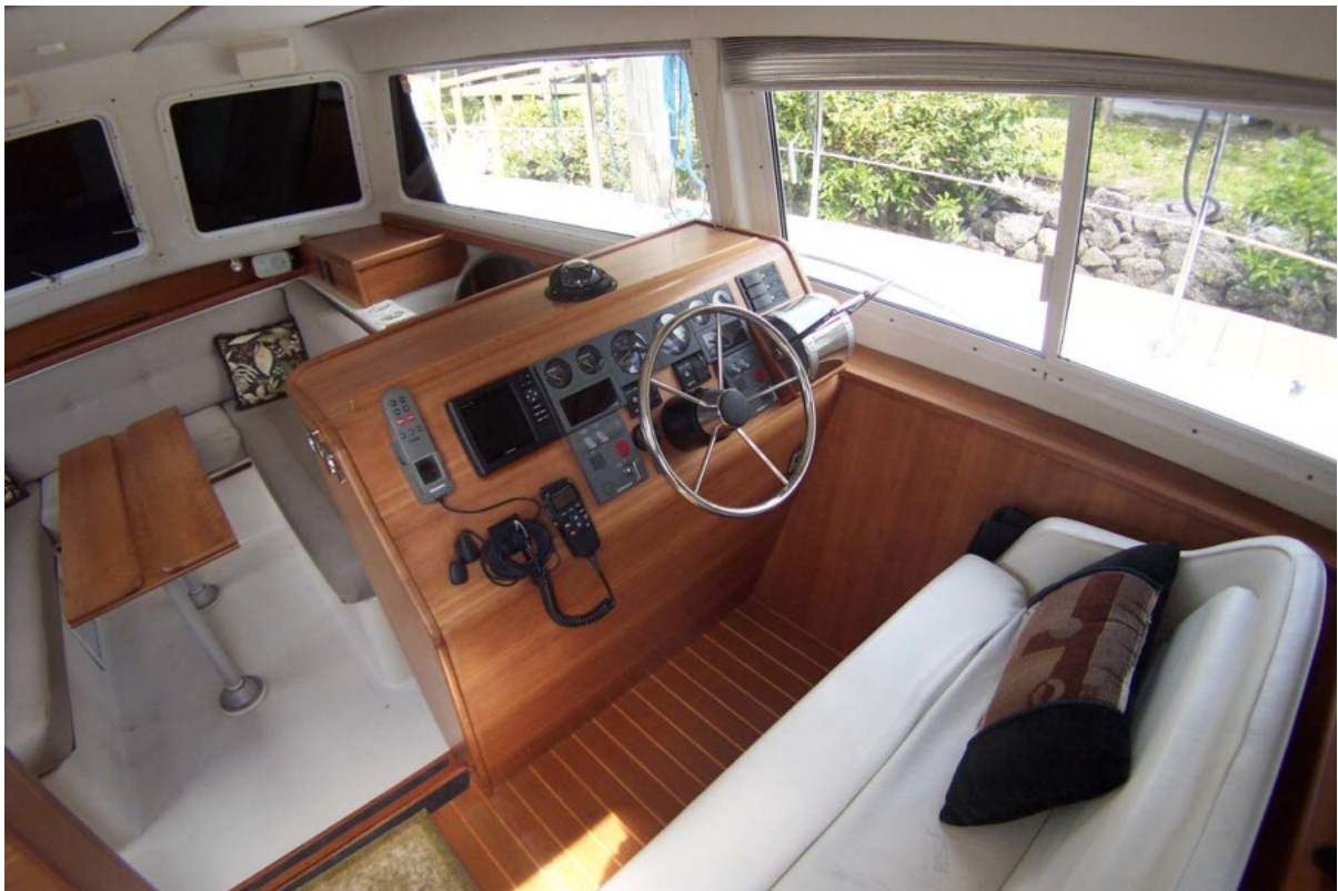
15 Lower Helm