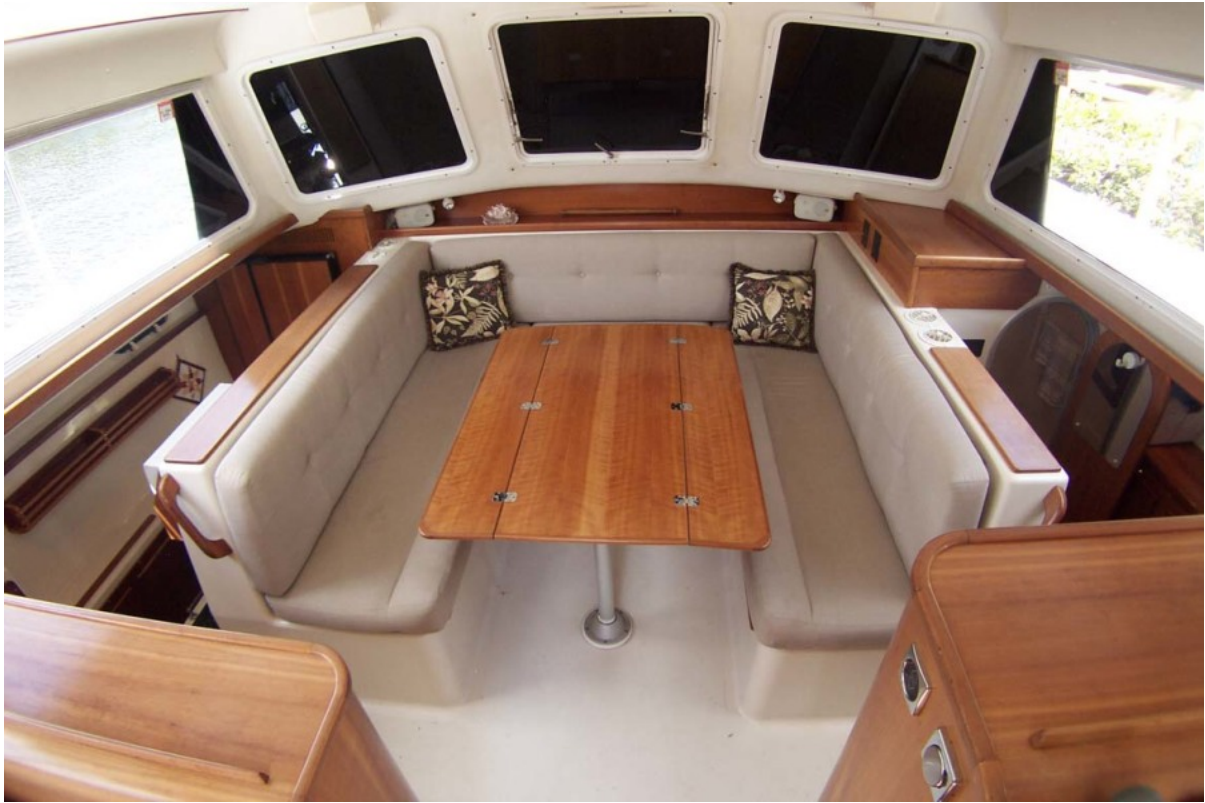
14 Table With Leaves Open