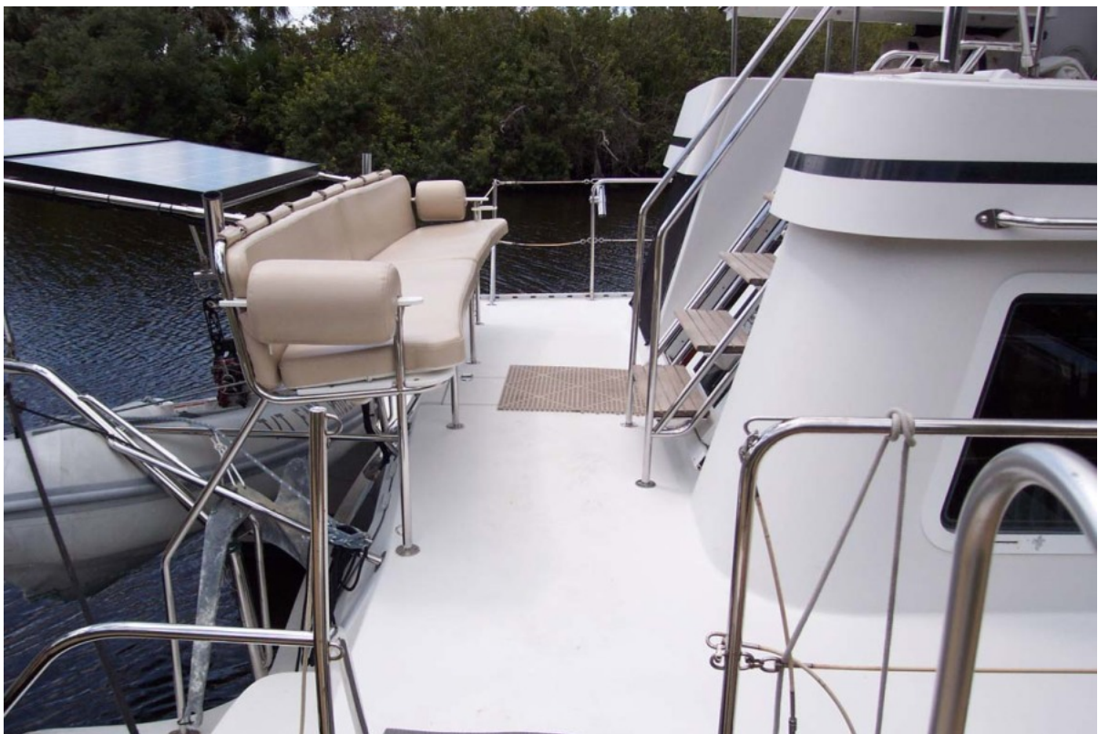
4 Aft Cockpit Area