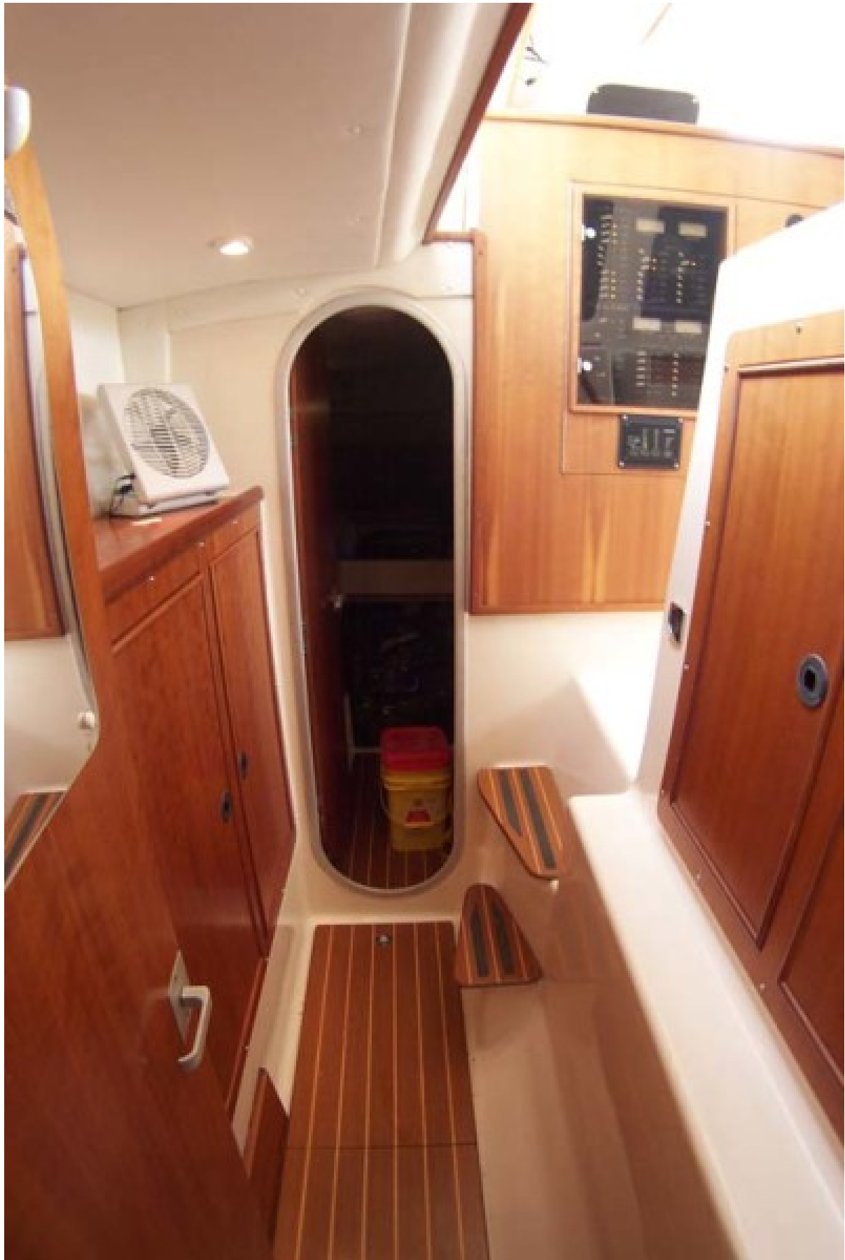
22 Starboard Hull Entrance To MSR