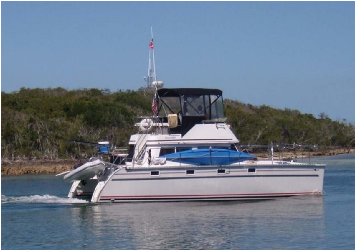
1 Main Photo