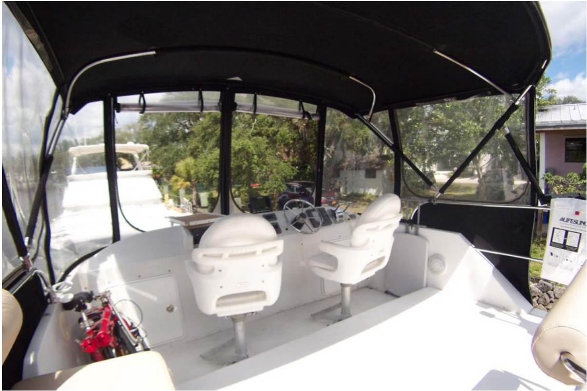
10 Flybridge Helm Seating