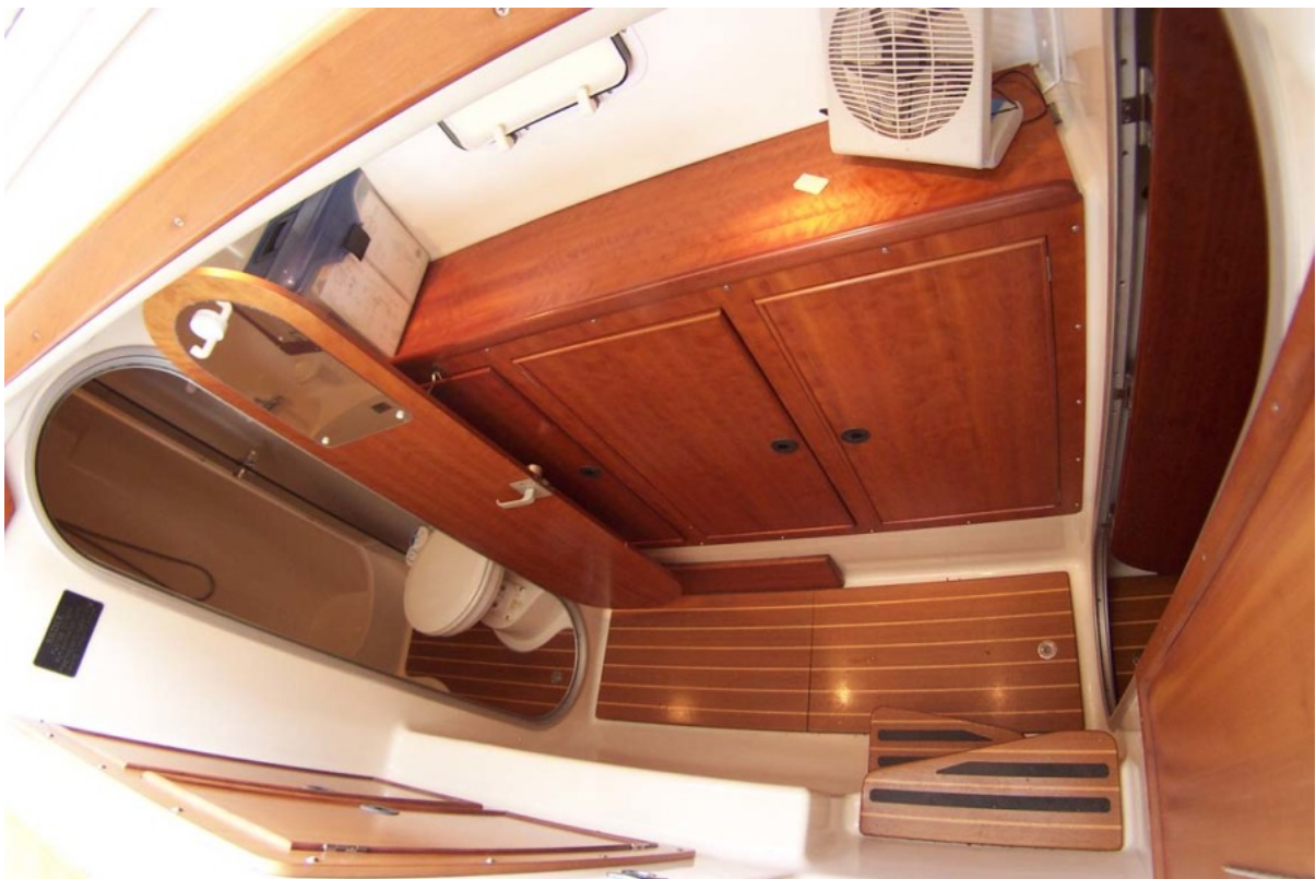
21a Stbd Hull From Overhead