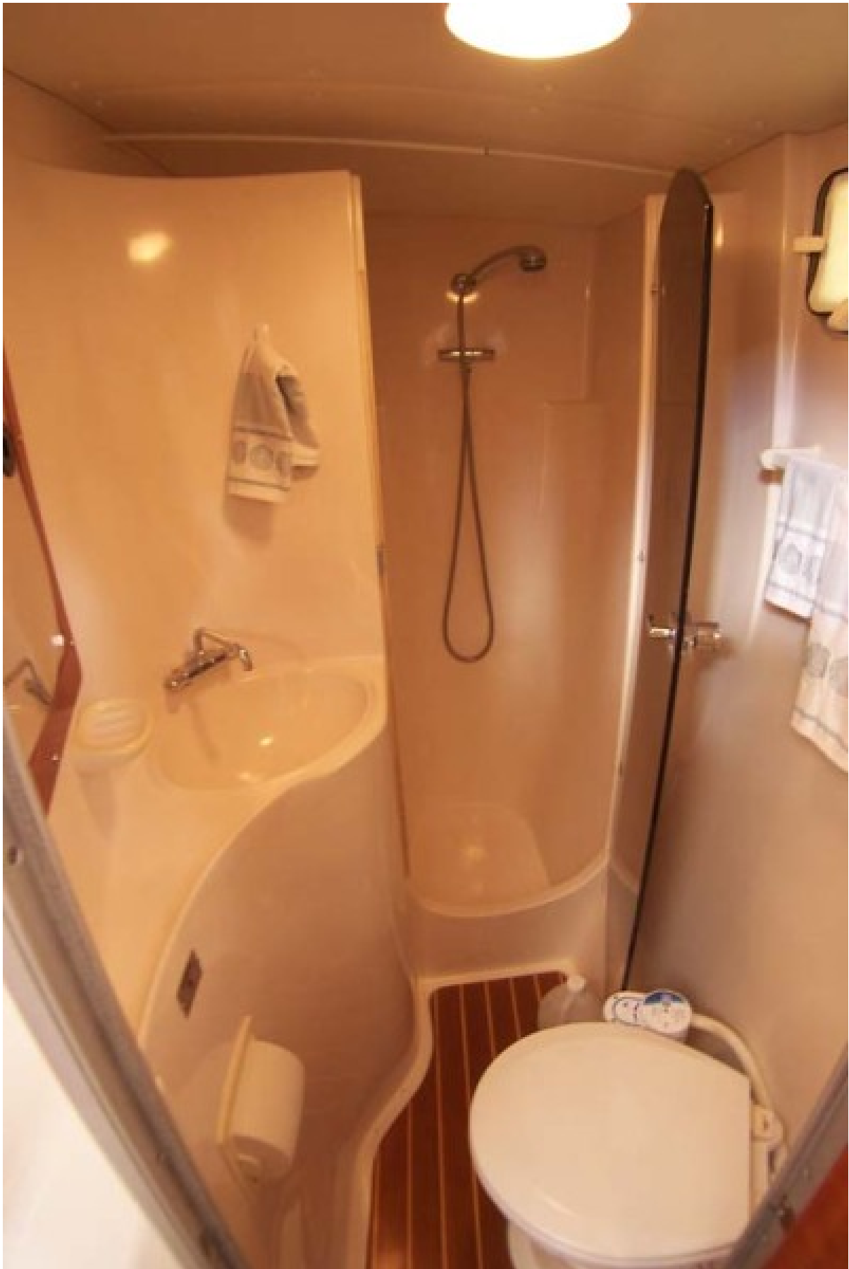
25 Head W Shower Door Open