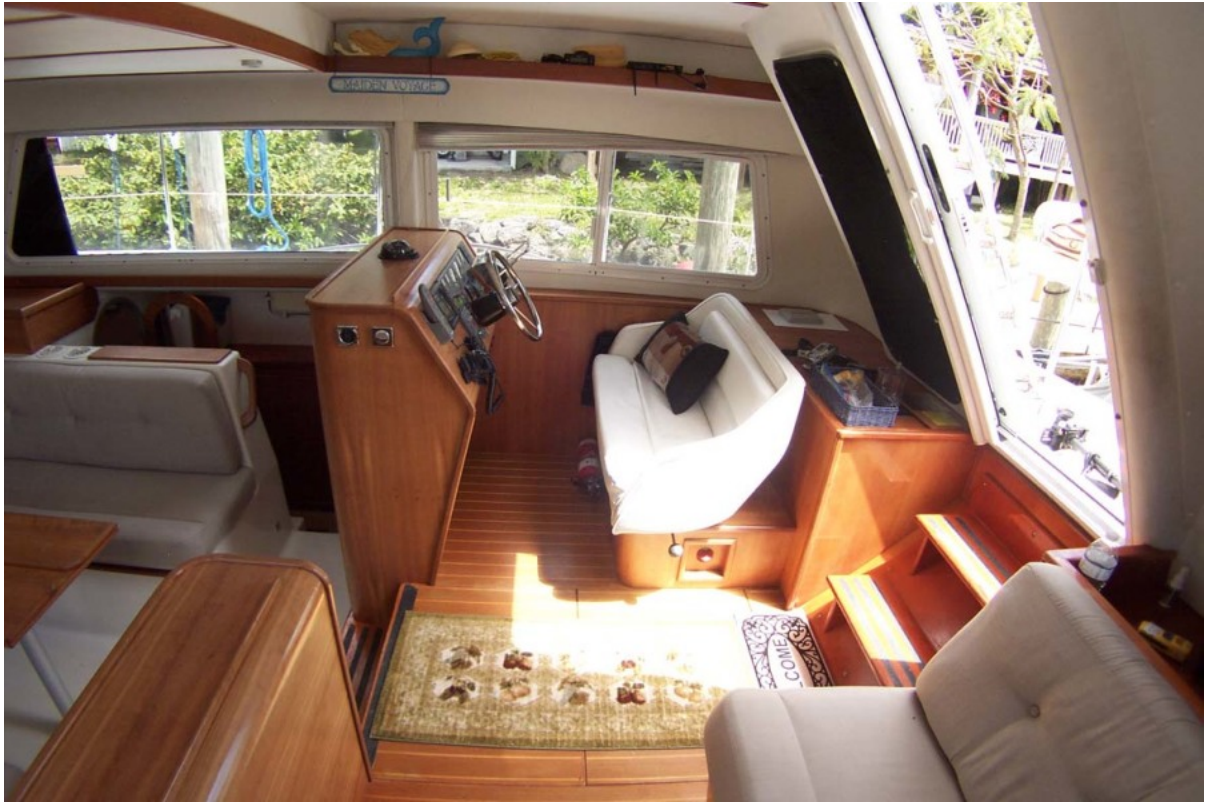
16 Lower Helm To Starboard