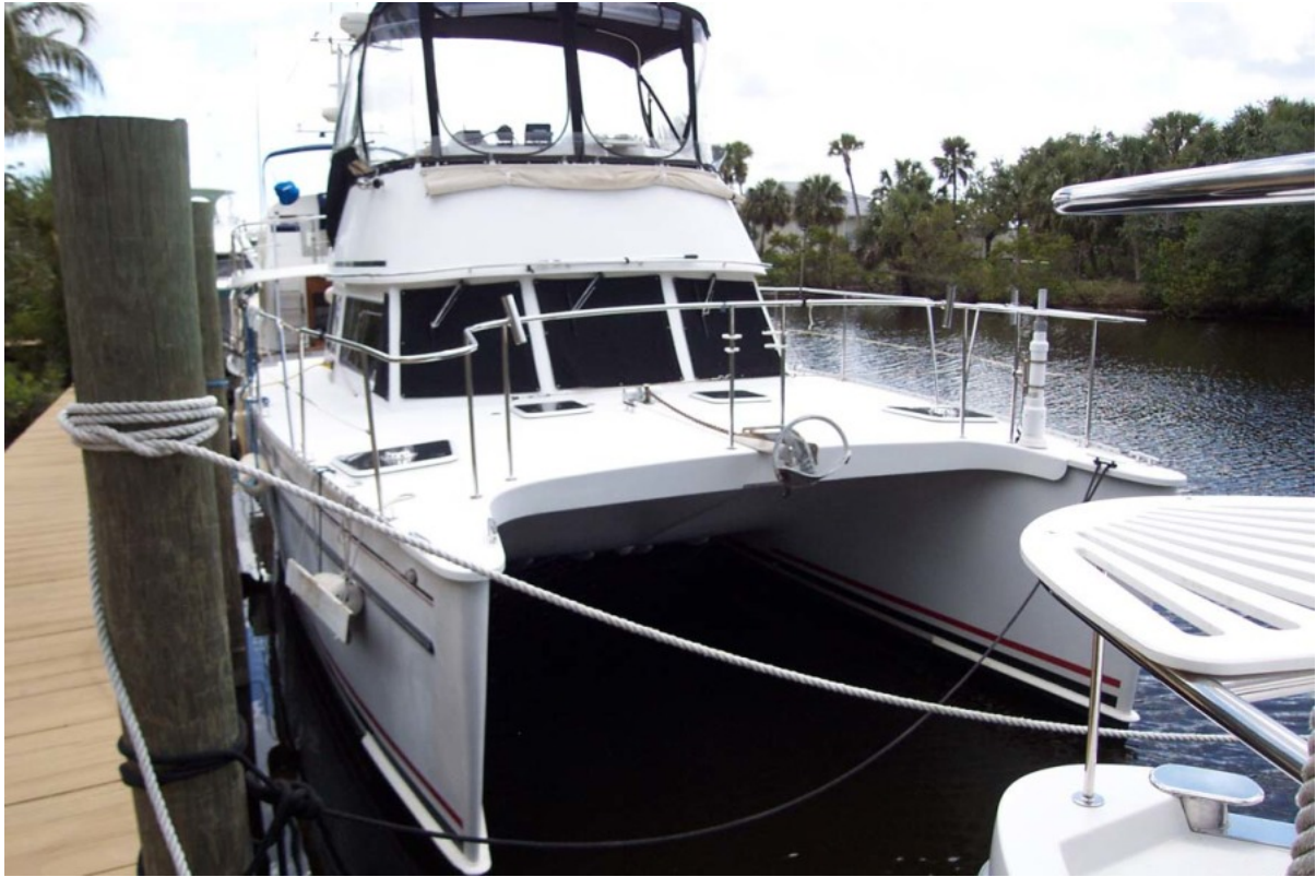
2 Bow Profile