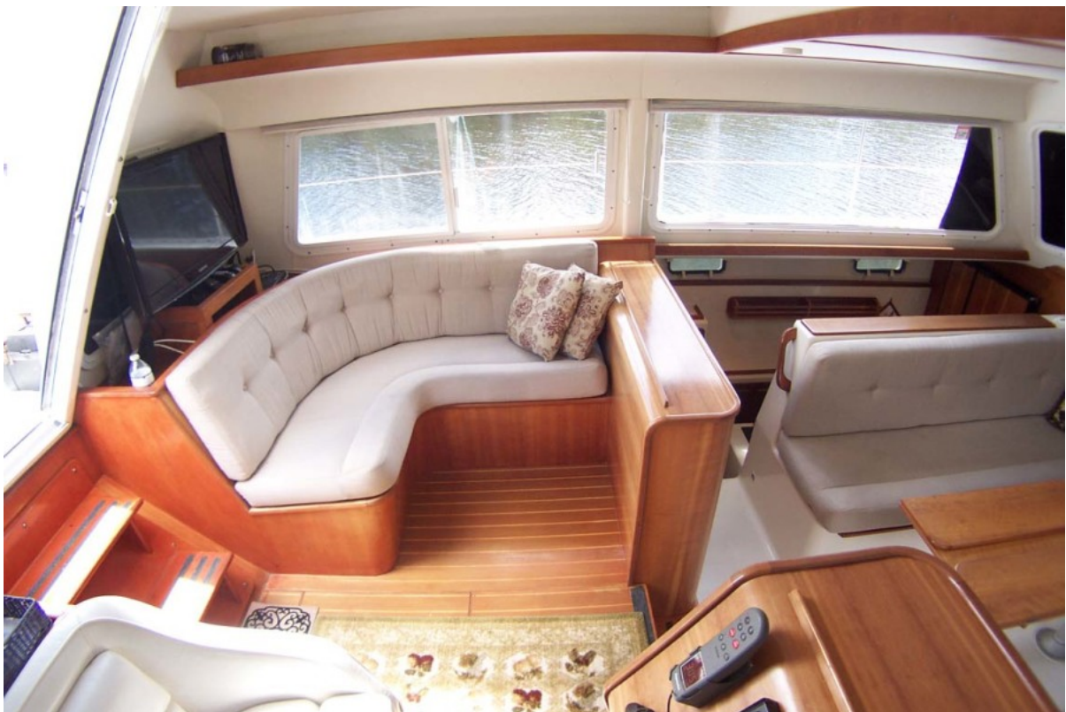
17 Crew Seating On Port Lower Helm