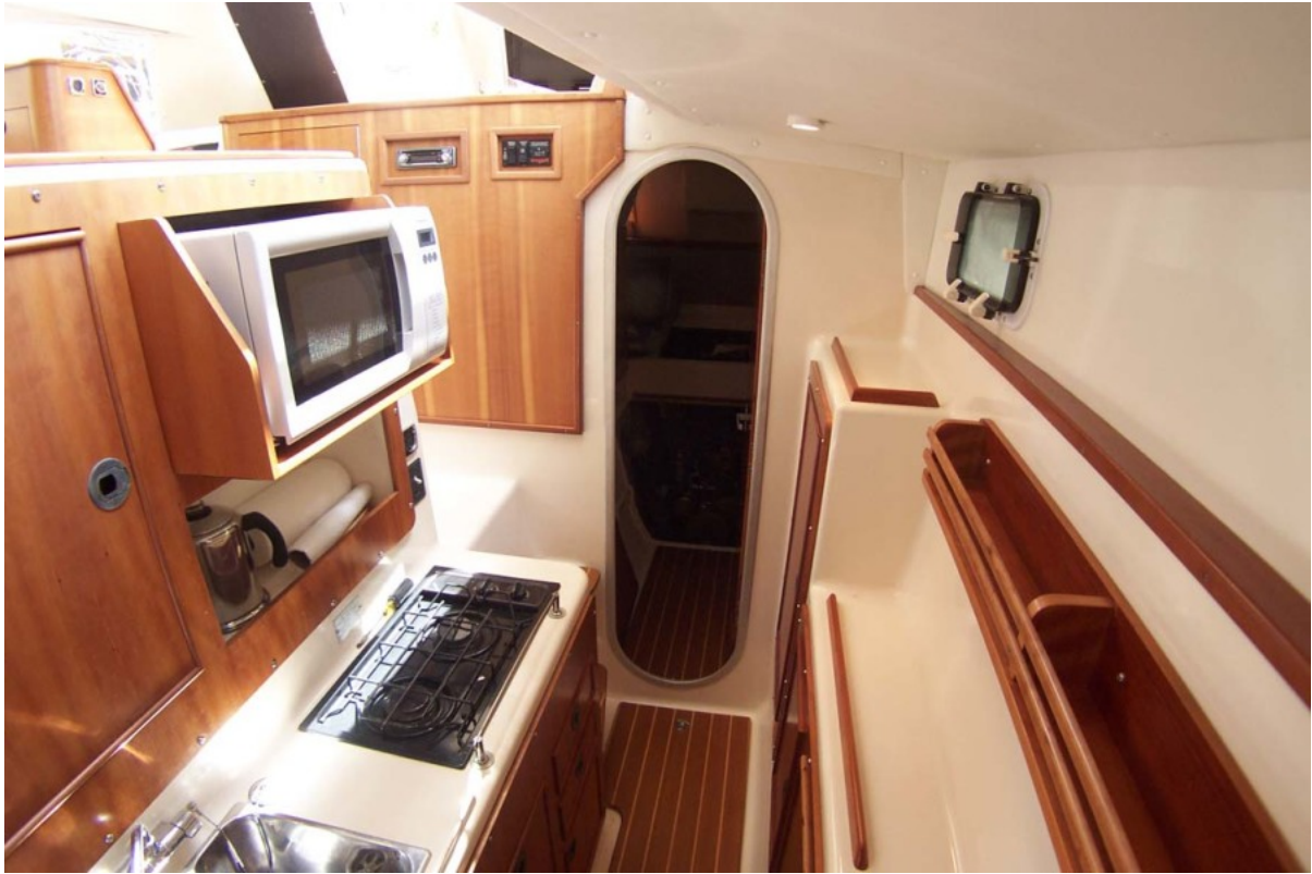
21 Port Passageway To Guest Stateroom