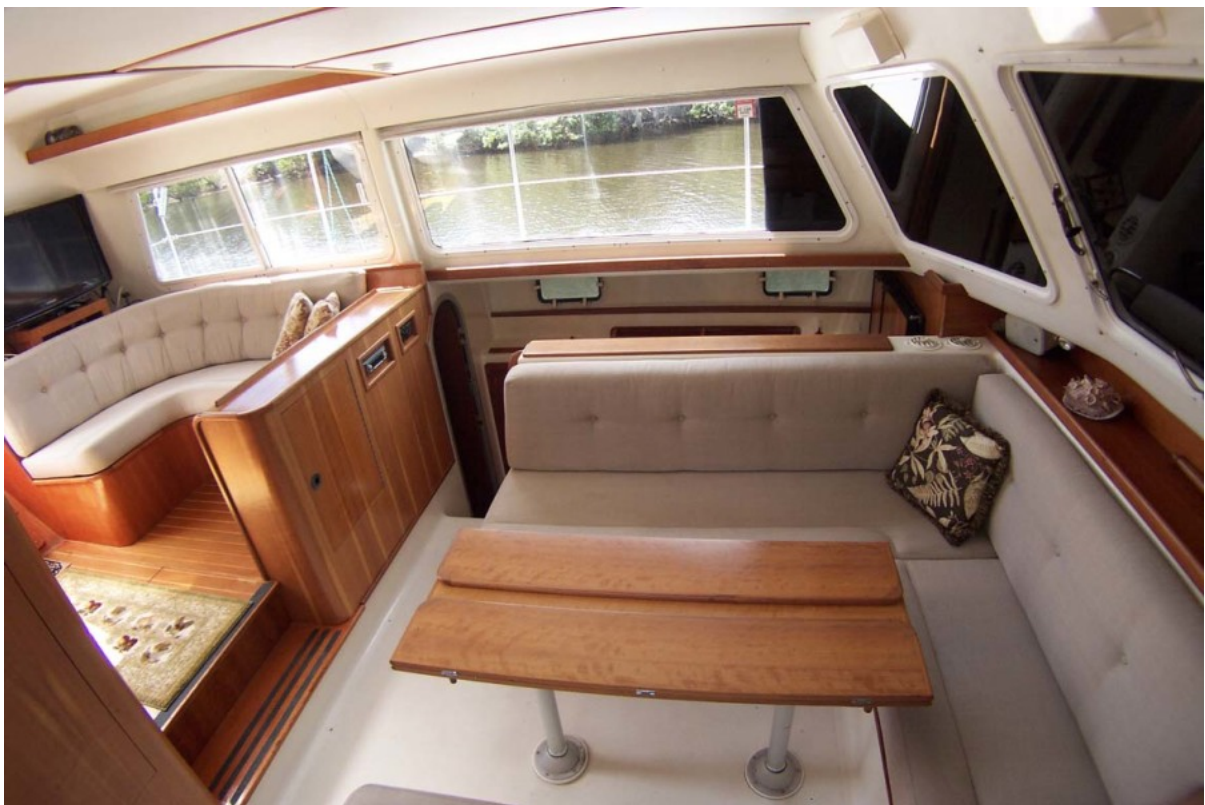
13 Salon To Port