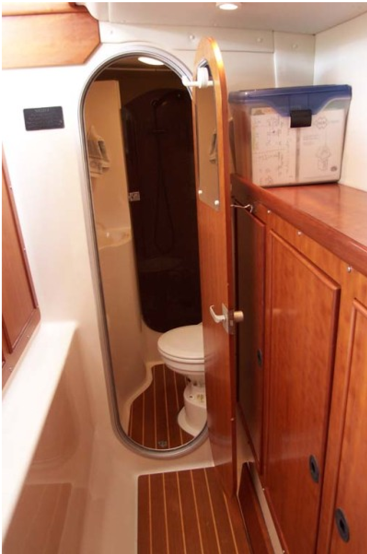
23 Starboard Hull To Head Shower