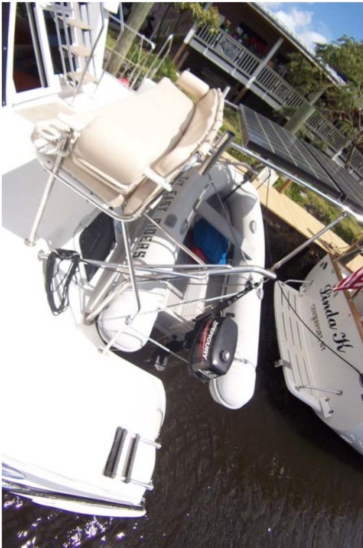
5 AB Tender & Davits