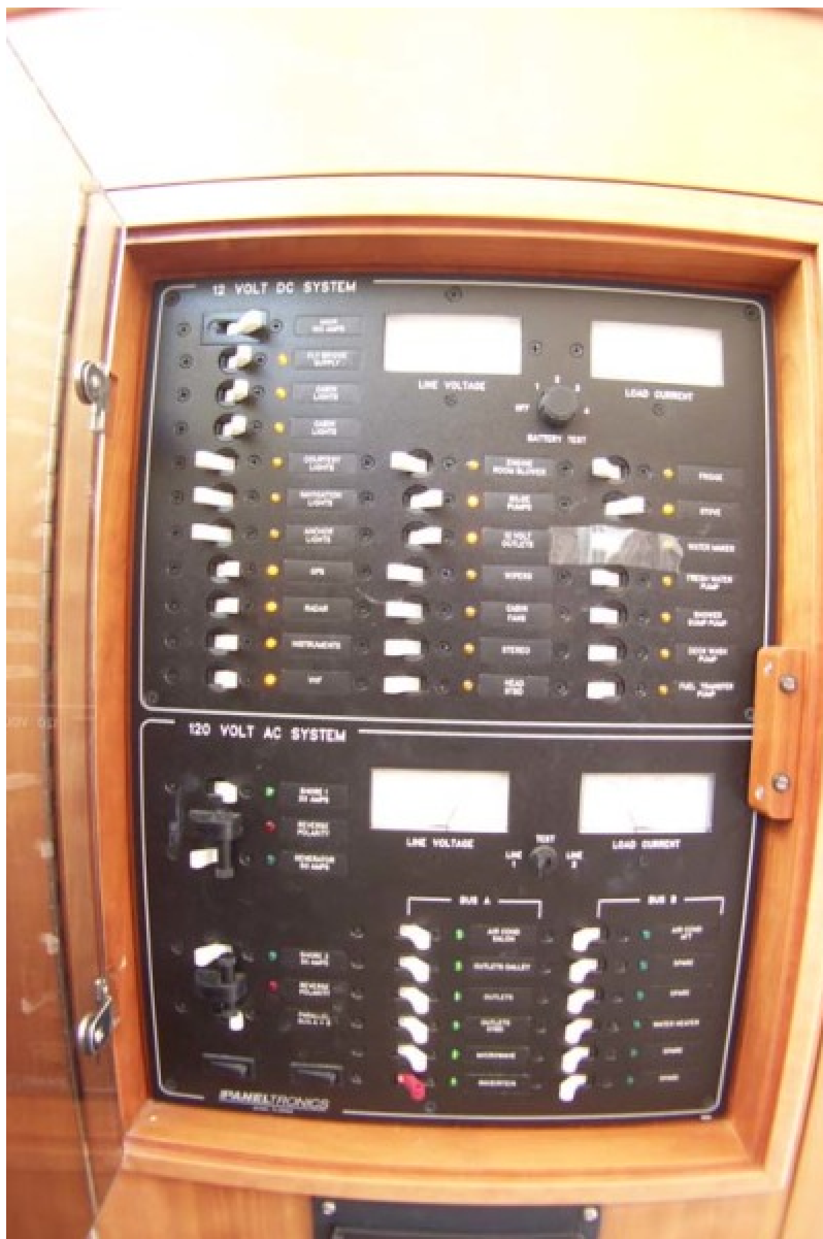
18 Electrical Panel