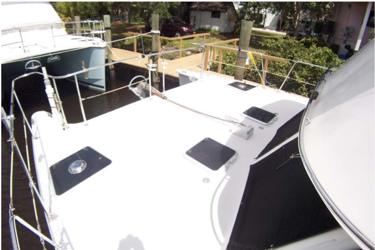
2a Large Foredeck