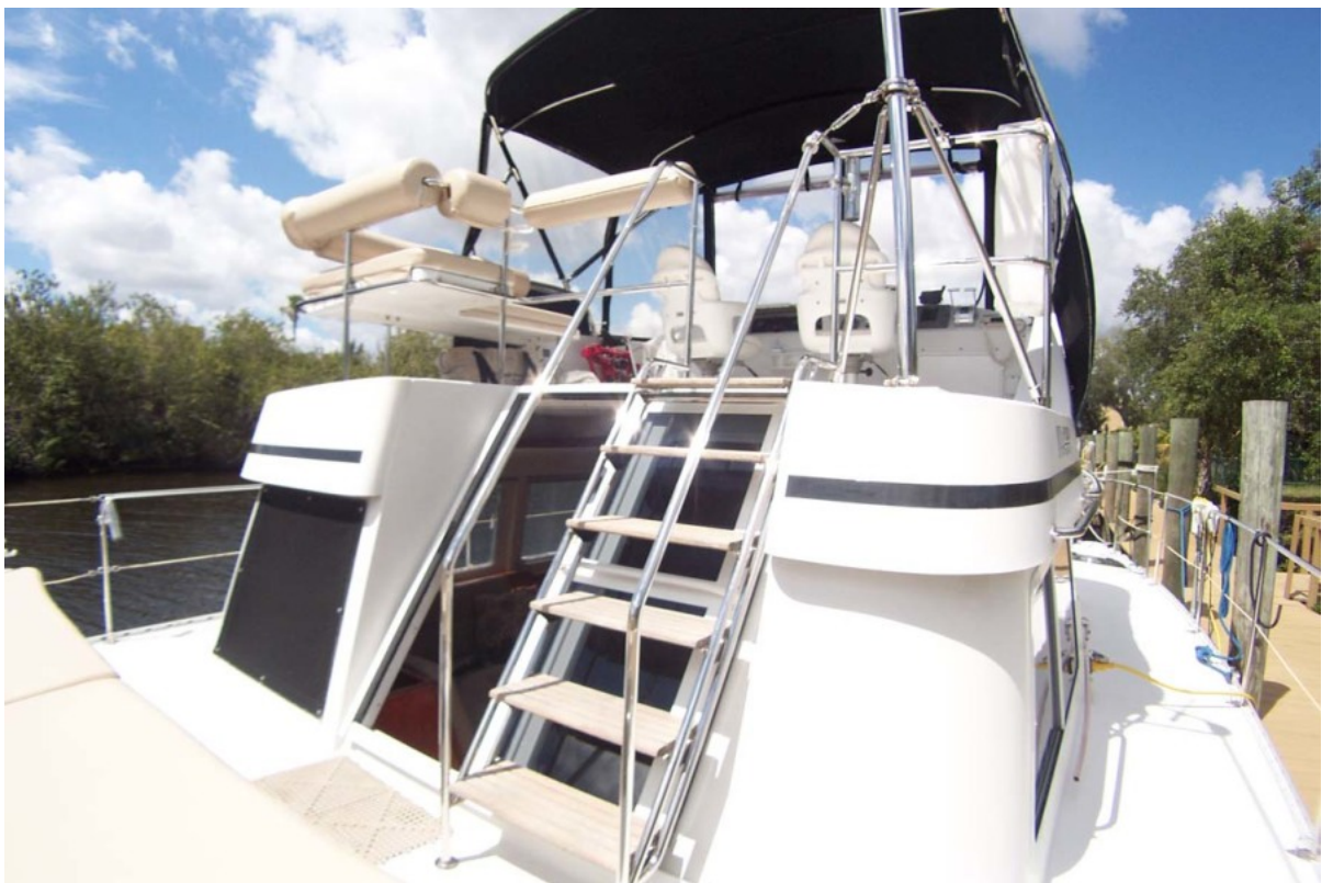
7 Stairway To Flybridge