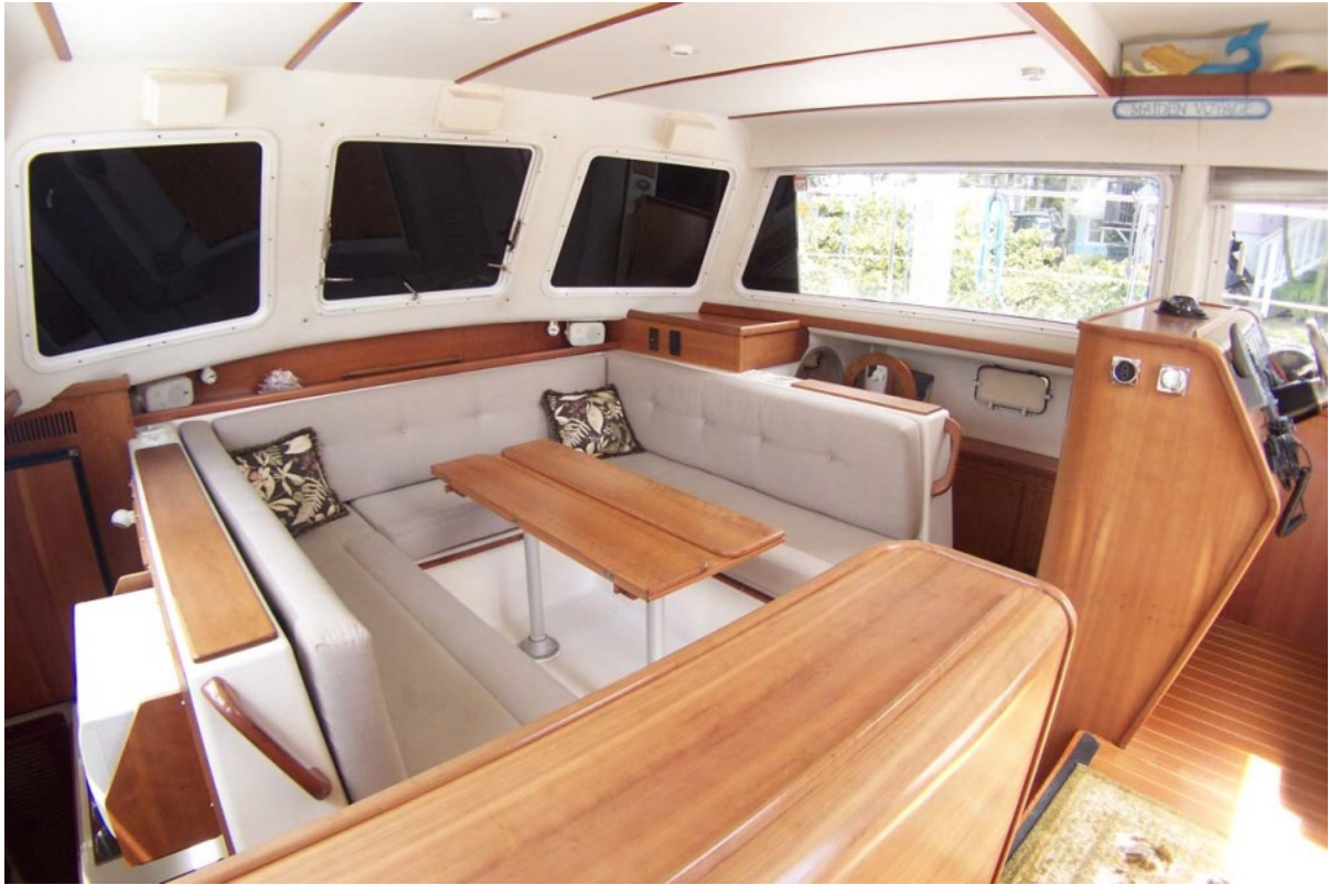
12 Salon Forward