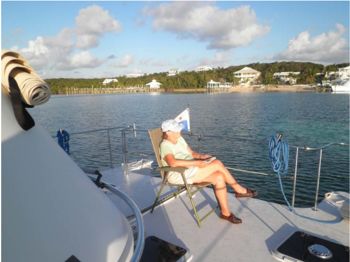
3 Expansive Foredeck Relaxation