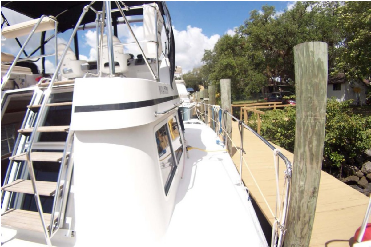
6 Wide Deck Passage