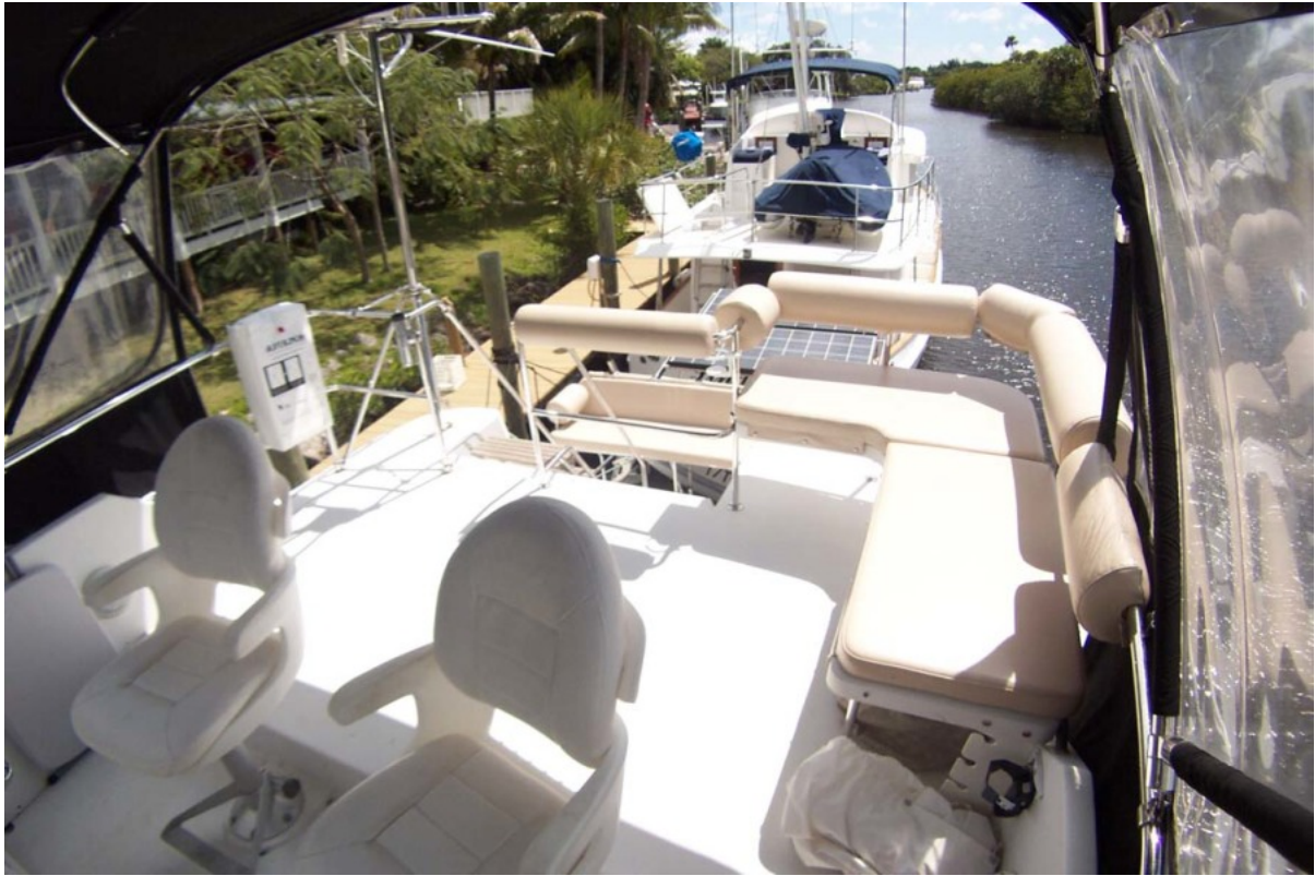
8 Comfortable L Shaped Settee In Flybridge