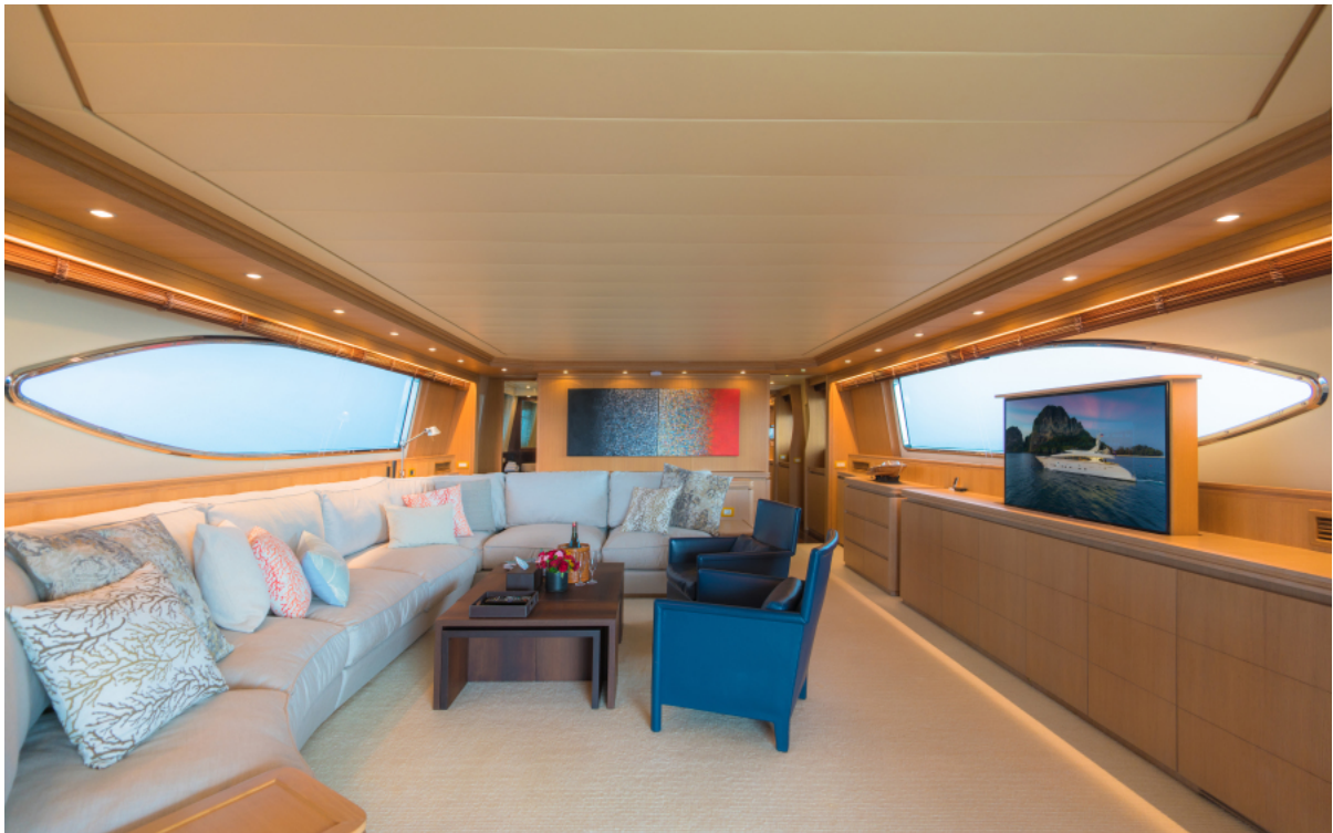
Aveline - Maiora 31 DP for sale Maiora 31 DP - salon