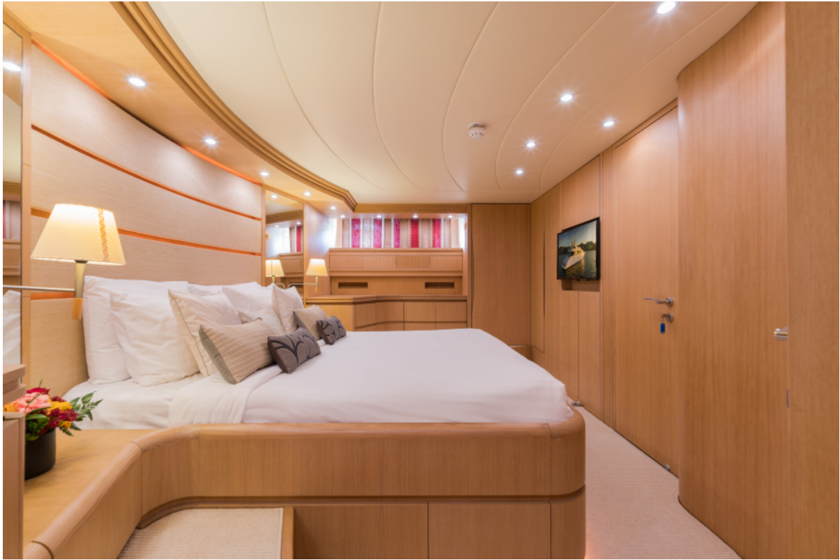
Aveline - Miora 31 DP for sale Maiora 31 DP - forward VIP