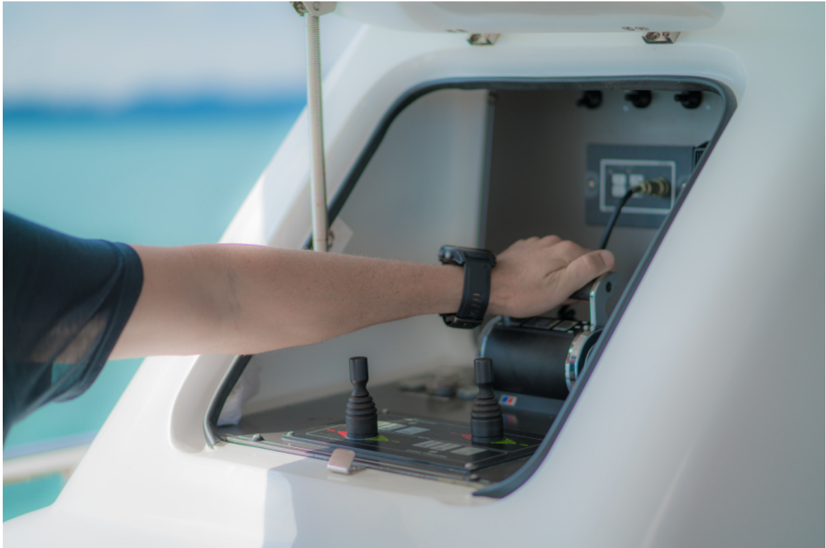
Aveline - Maiora 31 DP for sale Maiora 31 DP- aft docking station