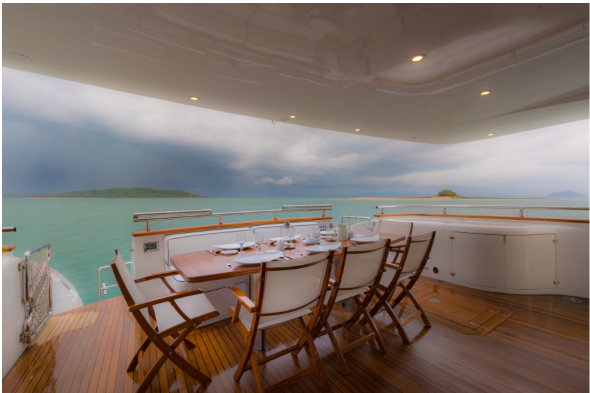
Aveline - Maiora 31 DP for sale Maiora 31 DP - aft cockpit