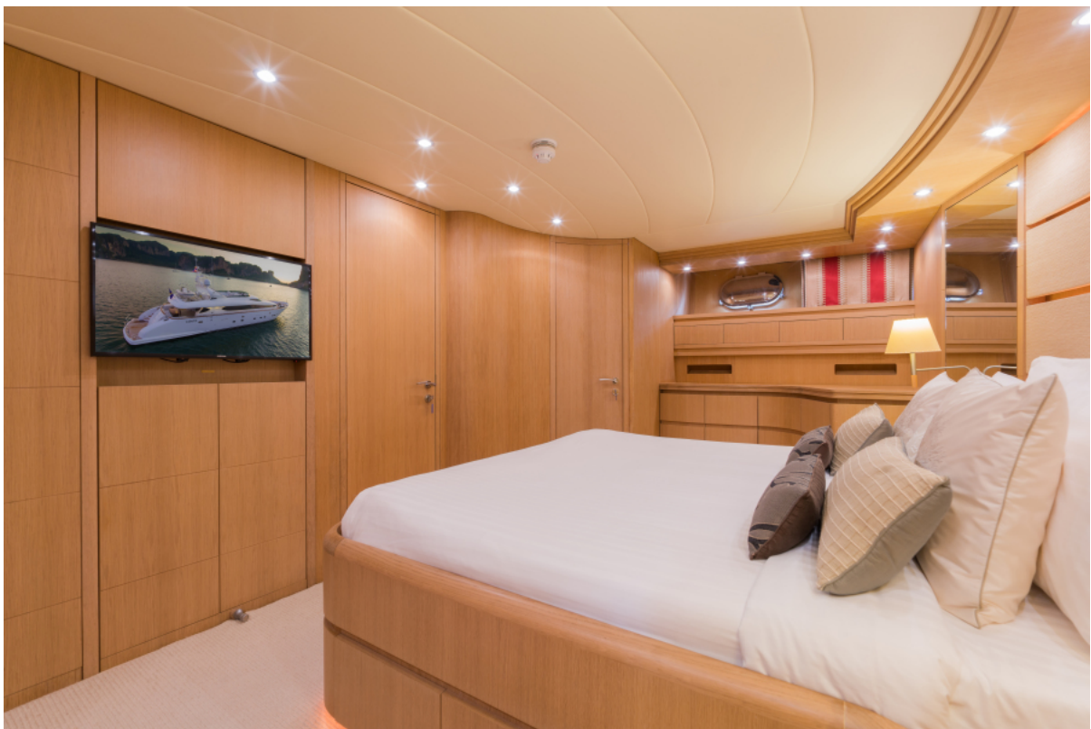
Aveline - Maiora 31 DP for sale Maiora 31 DP- forward VIP