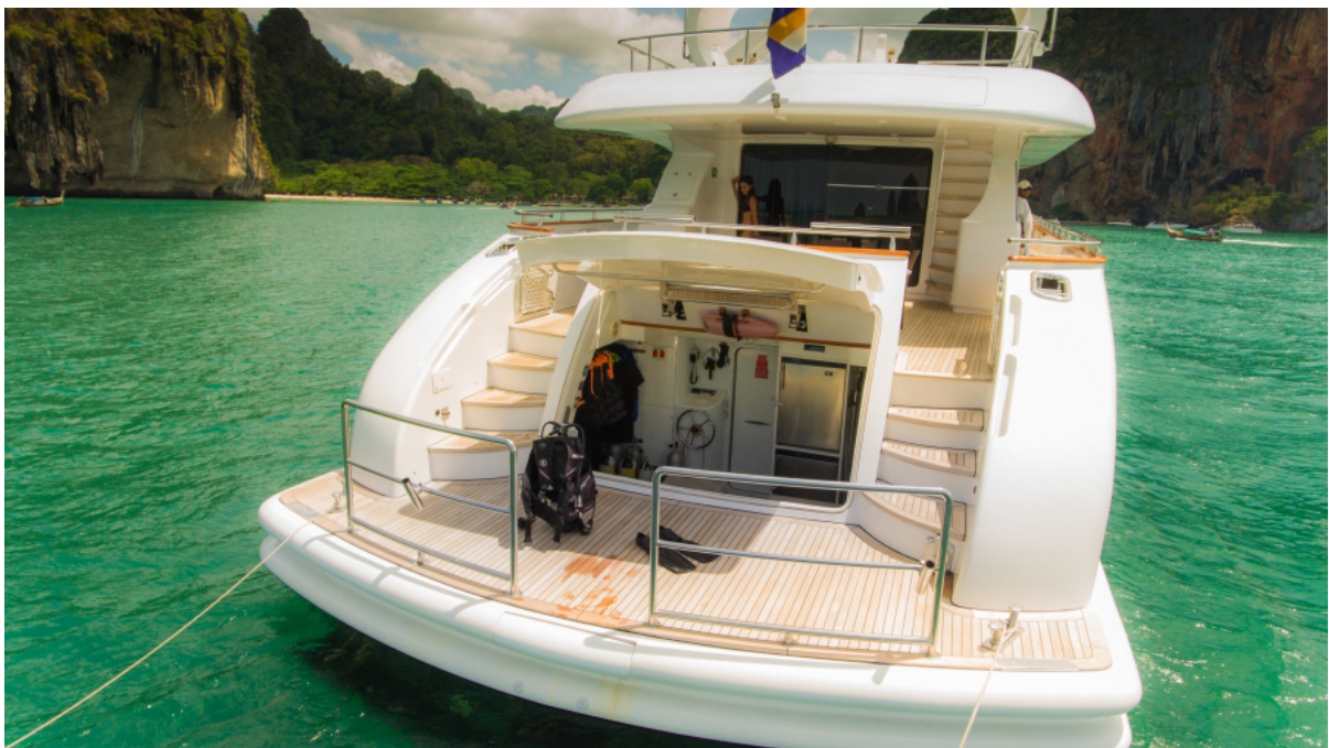
Aveline - Maiora 31 DP for sale Maiora 31 DP - transom and garage