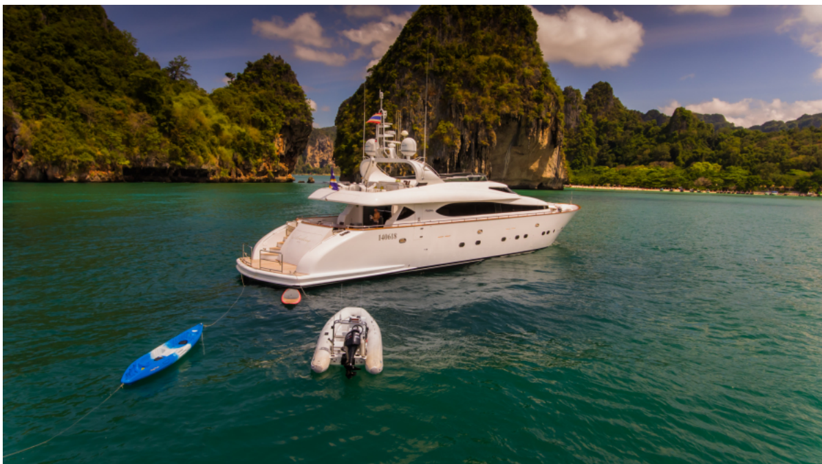
Aveline - Maiora 31 DP for sale Maiora 31 DP- at anchor