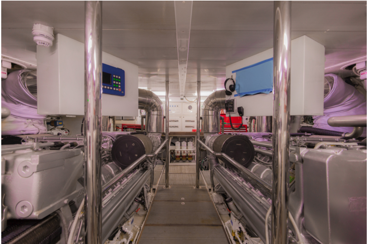
Aveline - Maiora 31 DP for sale Maiora 31 DP - engine room