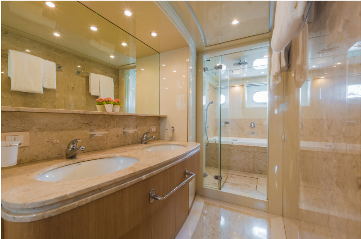
Aveline - Miora 31 DP for sale Maiora 31 DP - master ensuite with jacuzzi