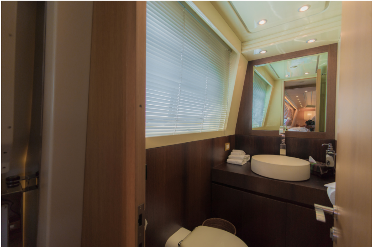
Aveline - Maiora 31 DP for sale Maiora 31 DP - day head on main deck