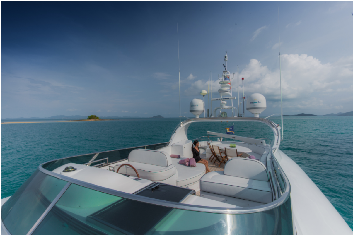
Aveline - Maiora 31 DP for sale Maiora 31 DP - flybridge