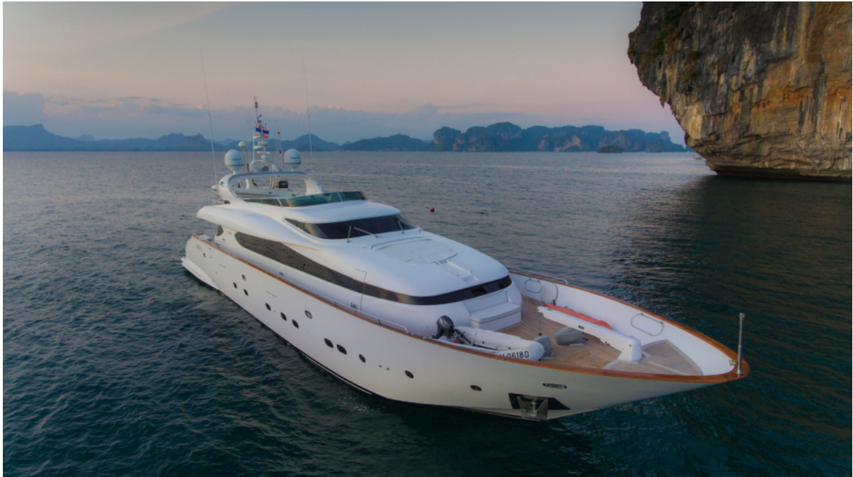
Aveline - Miora 31 DP for sale Maiora 31 DP