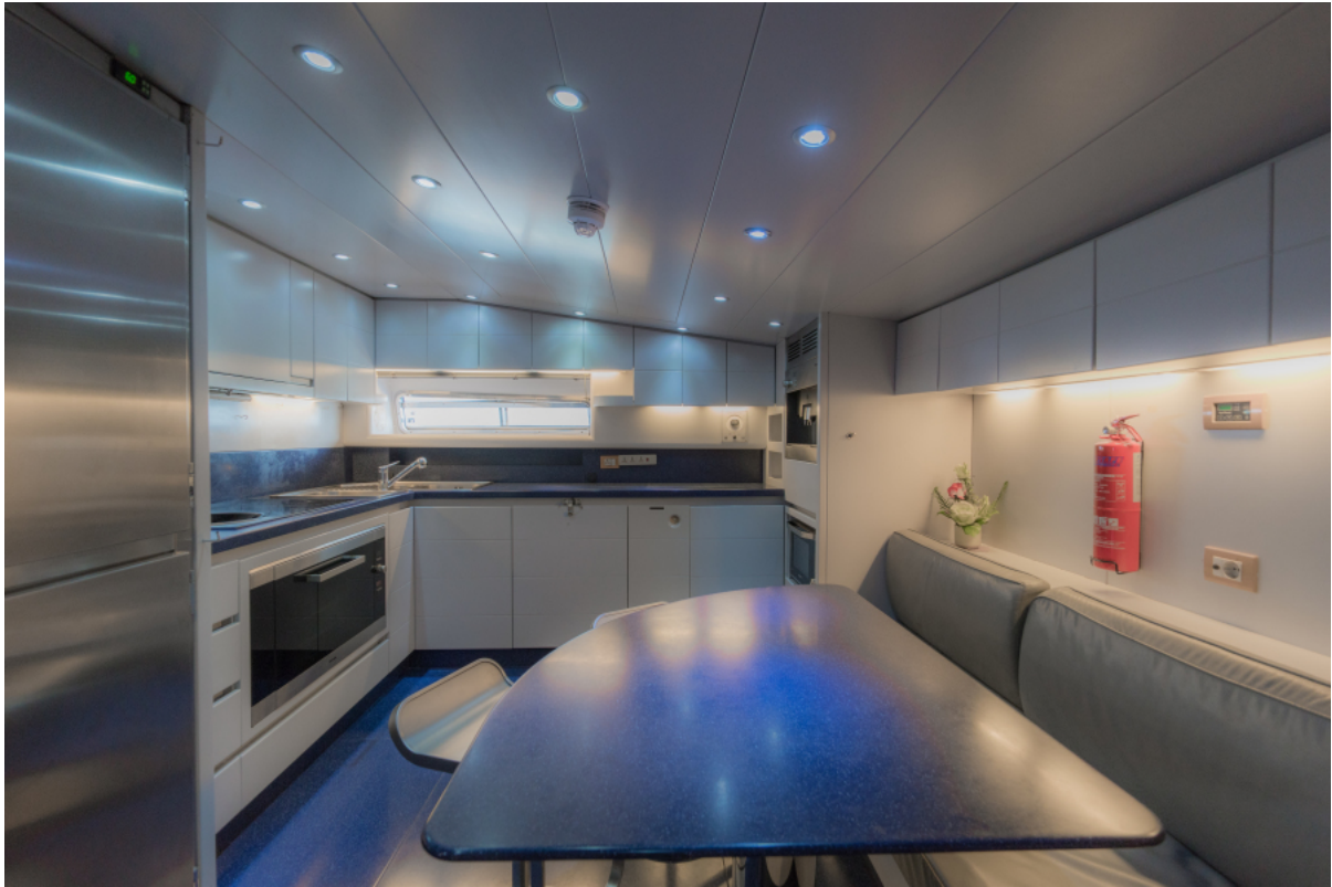
Aveline - Maiora 31 DP for sale Maiora 31 DP - galley