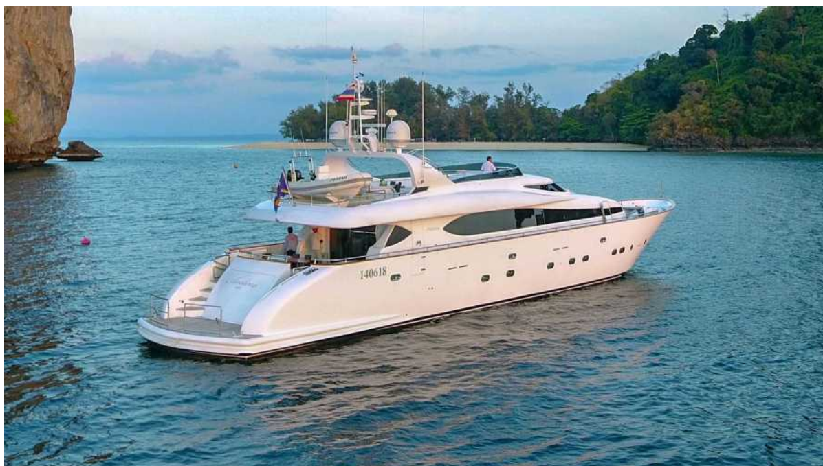
Aveline - Miora 31 DP for sale Maiora 31DP