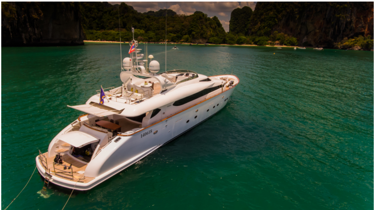
Aveline - Maiora 31 DP for sale Maiora 31 DP- ariel