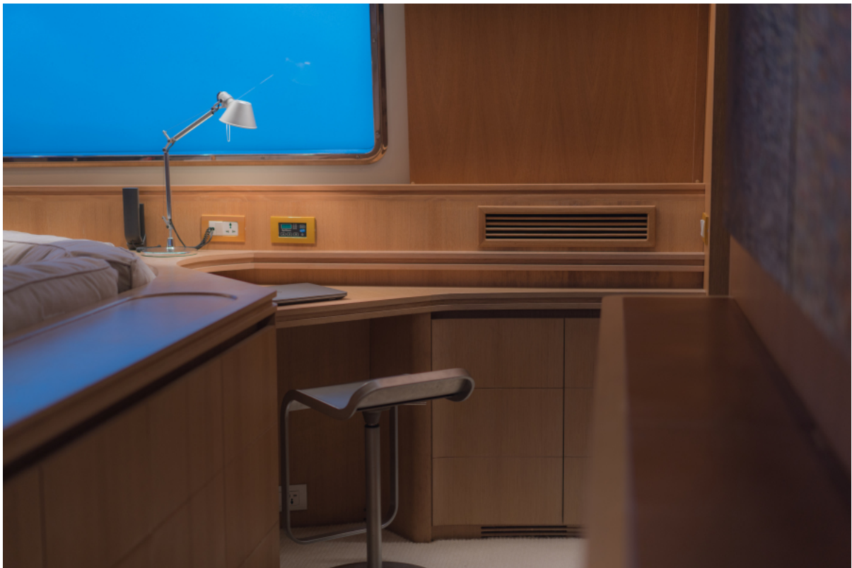
Aveline - Maiora 31 DP for sale Maiora 31 DP - salon writing desk