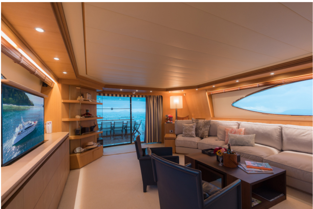
Aveline - Maiora 31 DP for sale Maiora 31 DP - interior