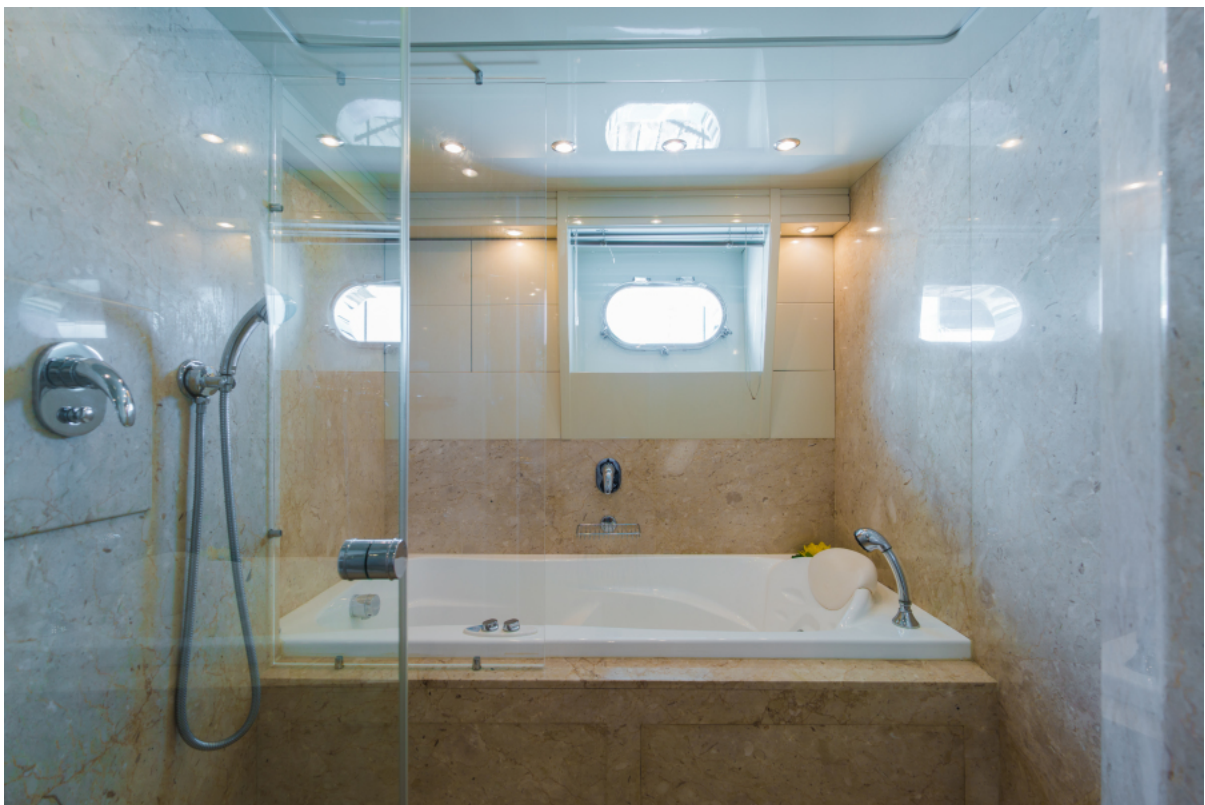
Aveline - Miora 31 DP for sale Maiora 31 DP - master ensuite