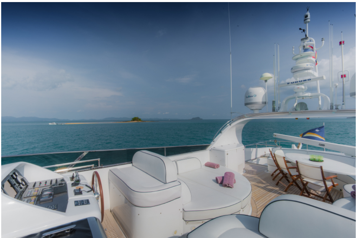
Aveline - Maiora 31 DP for sale Maiora 31 DP - flybridge