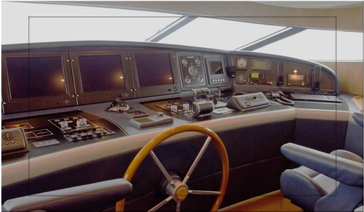
Aveline - Miora 31 DP for sale Maiora 31 DP - pilot house