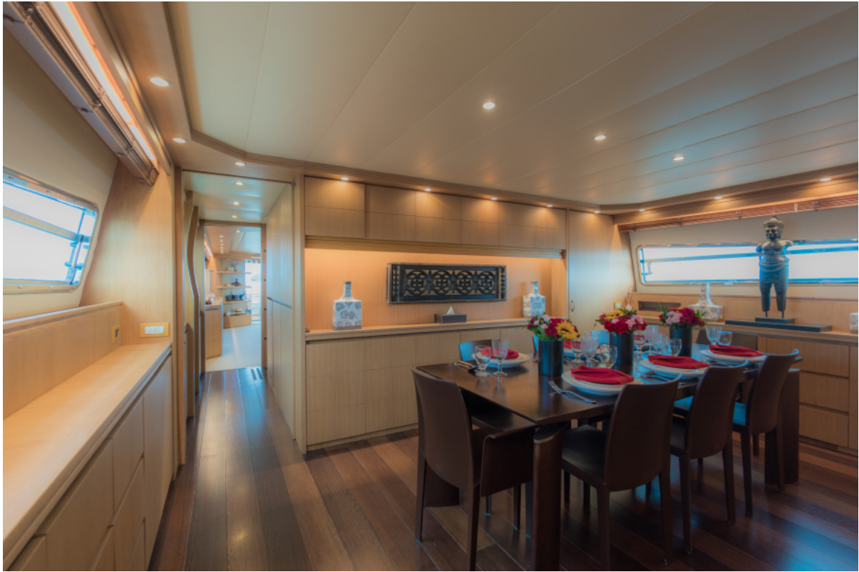
Aveline - Maiora 31 DP for sale Maiora 31 DP - dining table