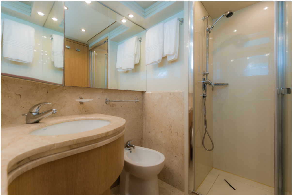
Aveline - Maiora 31 DP for sale Maiora 31 DP - guest ensuite