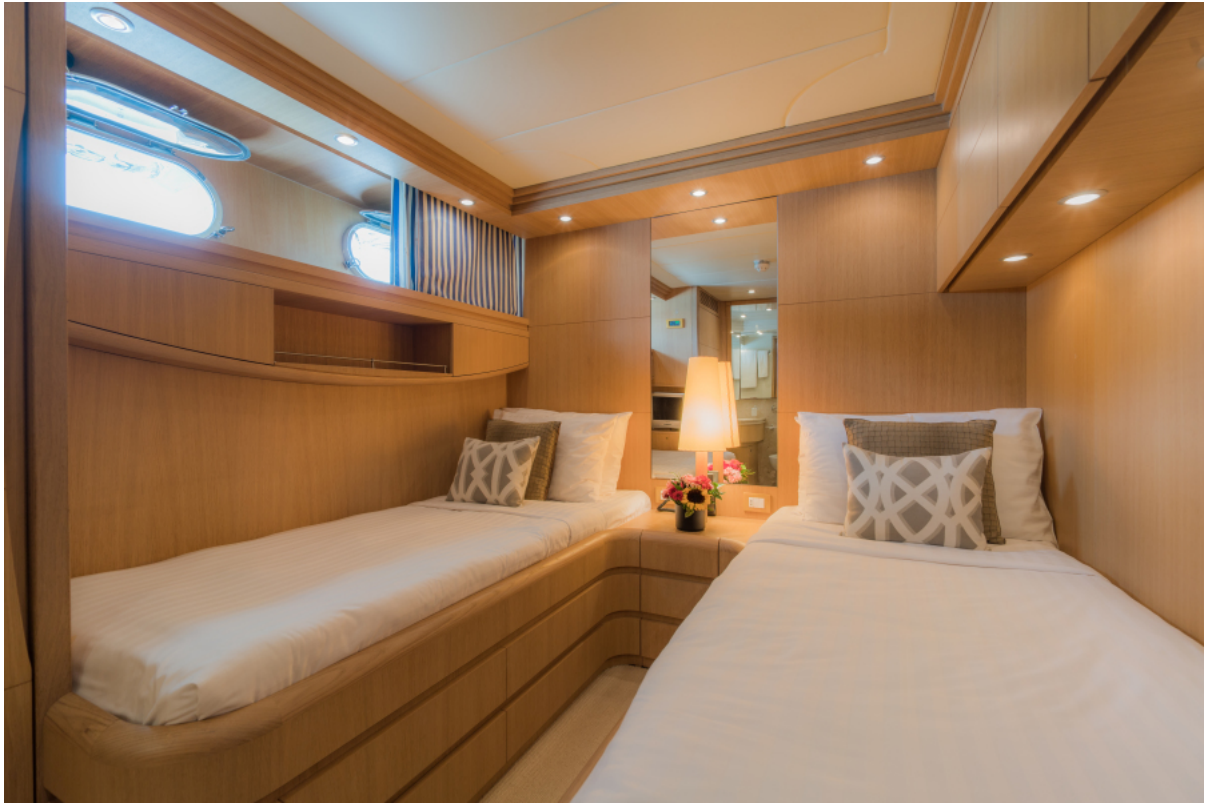
Aveline - Maiora 31 DP for sale Maiora 31 DP - twin guest cabin