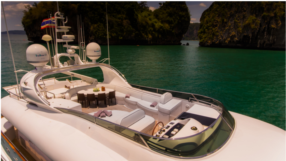
Aveline - Maiora 31 DP for sale Maiora 31 DP - flybridge