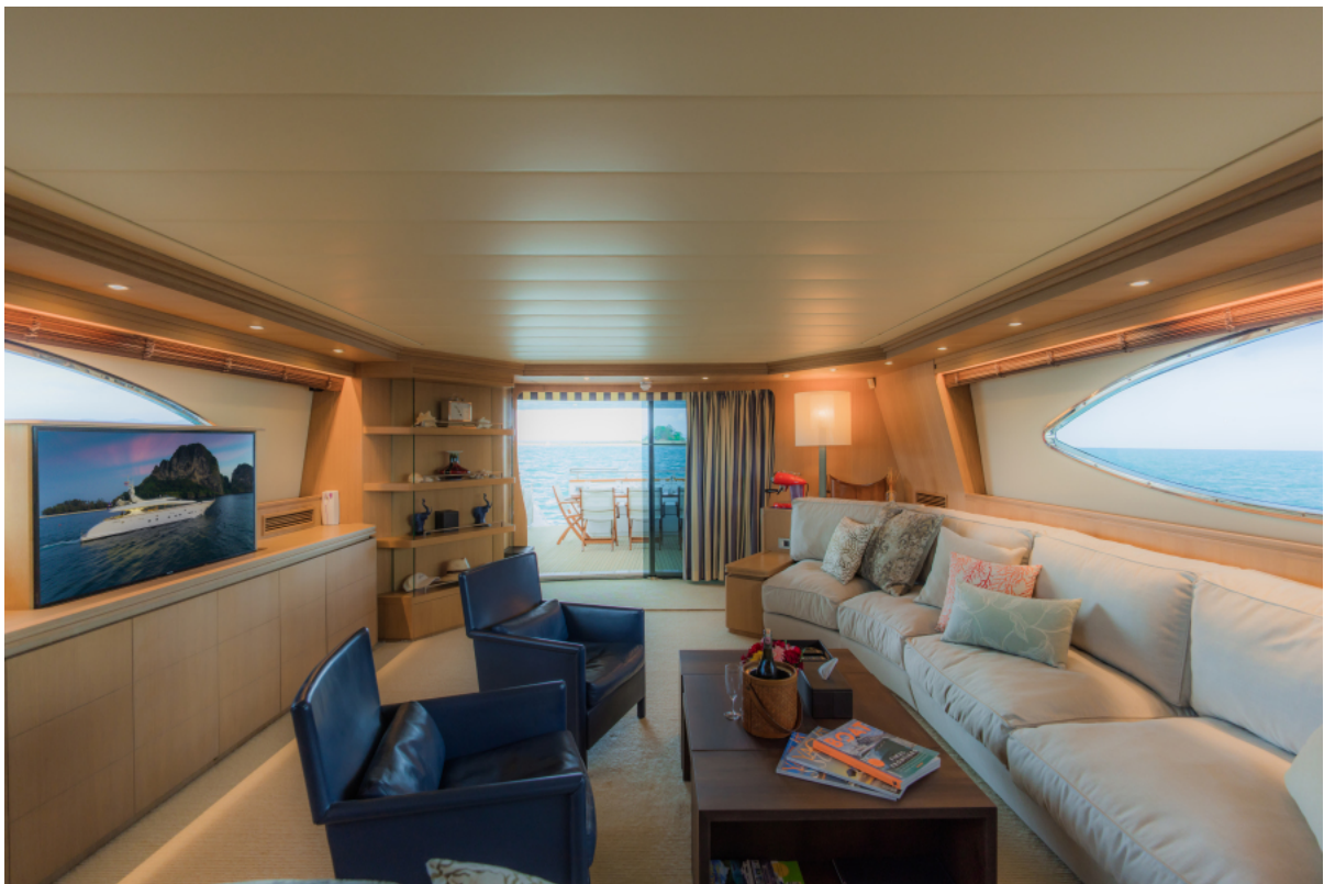
Aveline - Miora 31 DP for sale Maiora 31 DP - salon