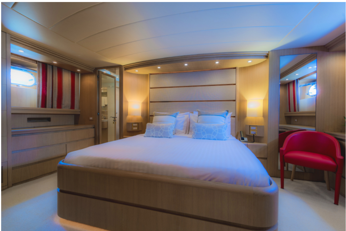
Aveline - Miora 31 DP for sale Maiora 31 DP - master cabin