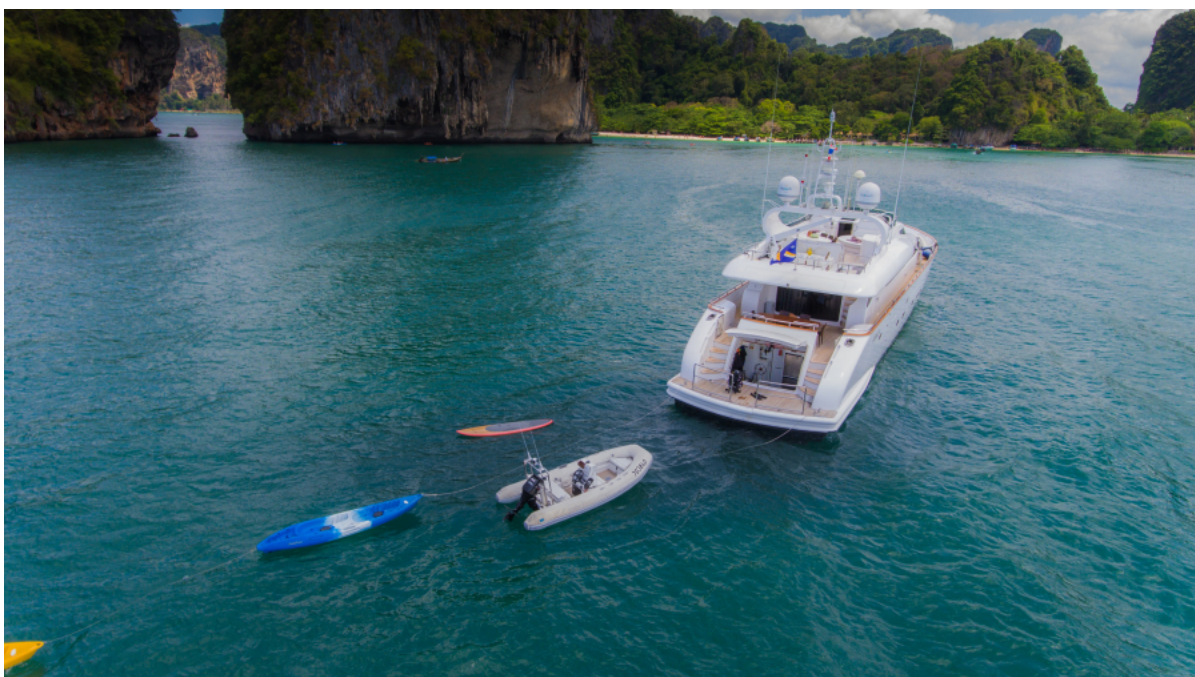
Aveline - Maiora 31 DP for sale Maiora 31 DP- at anchor