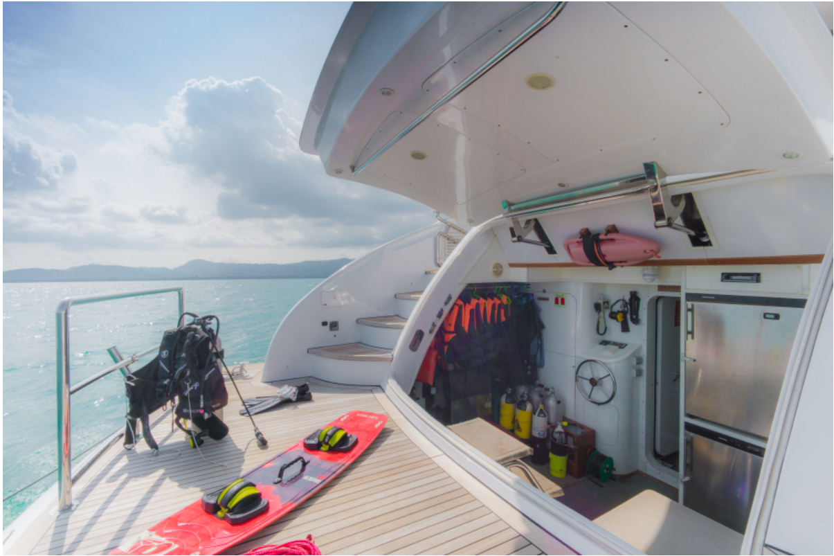
Aveline - Maiora 31 DP for sale Maiora 31 DP - garage