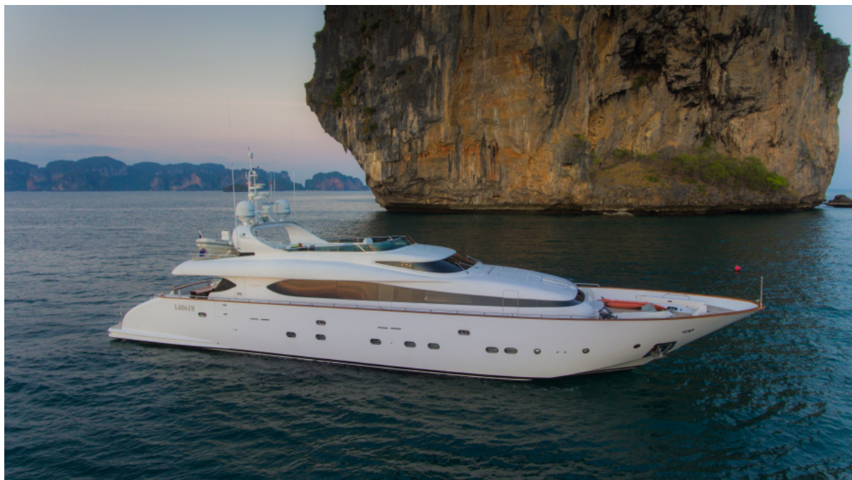
Aveline - Miora 31 DP for sale Maiora 31DP