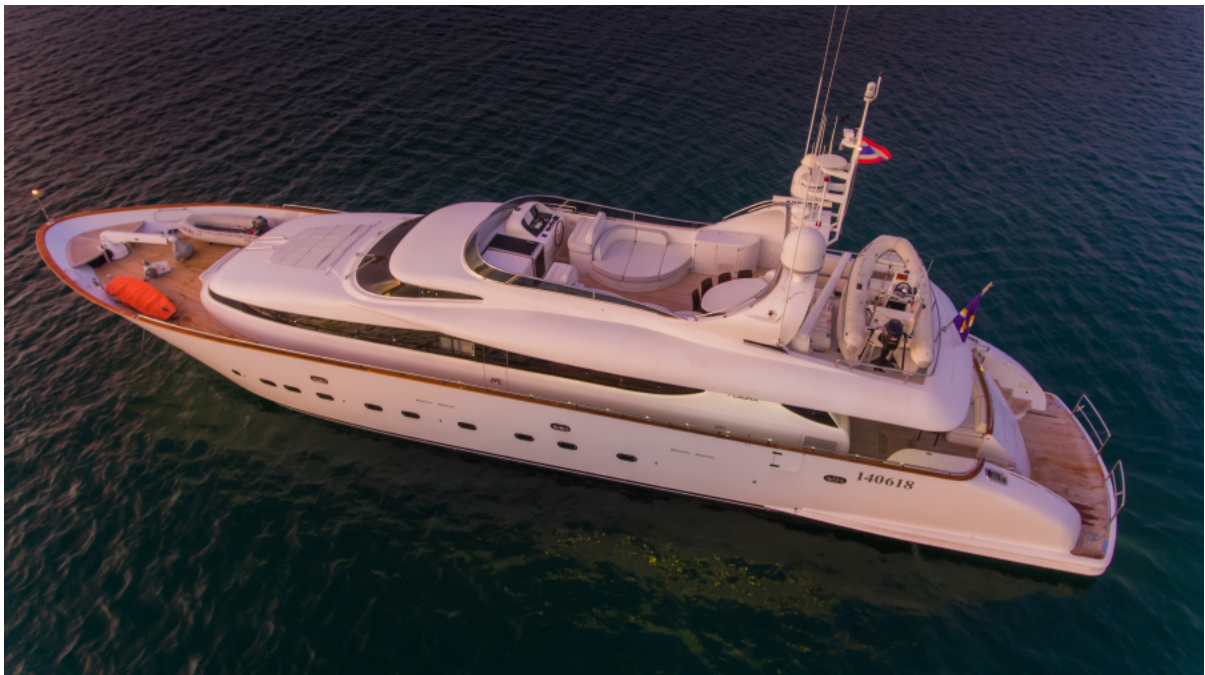
Aveline - Miora 31 DP for sale Maiora 31 DP