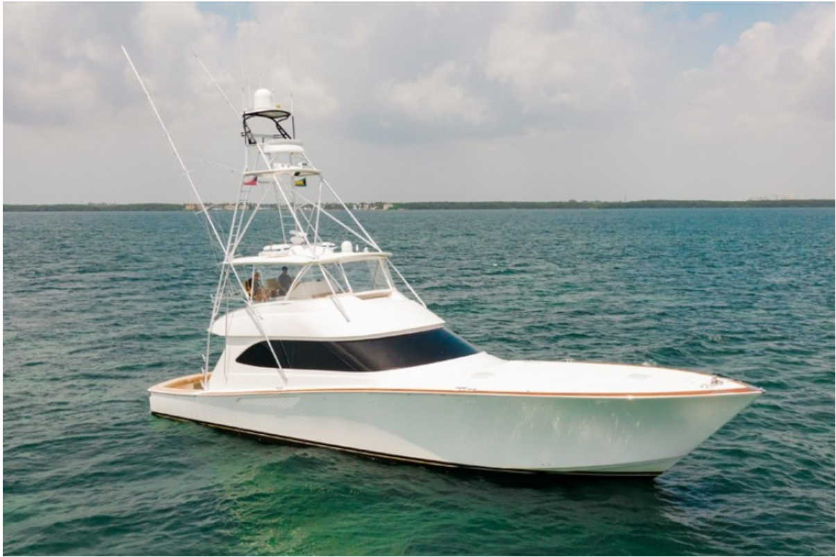
70 Viking Convertible - The Provider