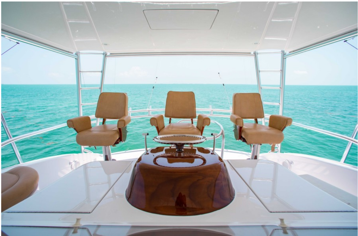
70 Viking Helm