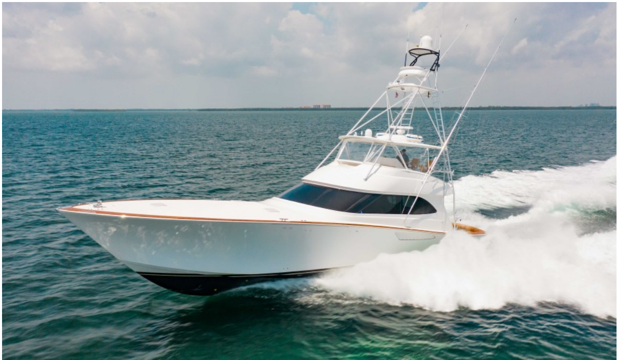
2011 Viking 70 Convertible - The Provider - Running Shot