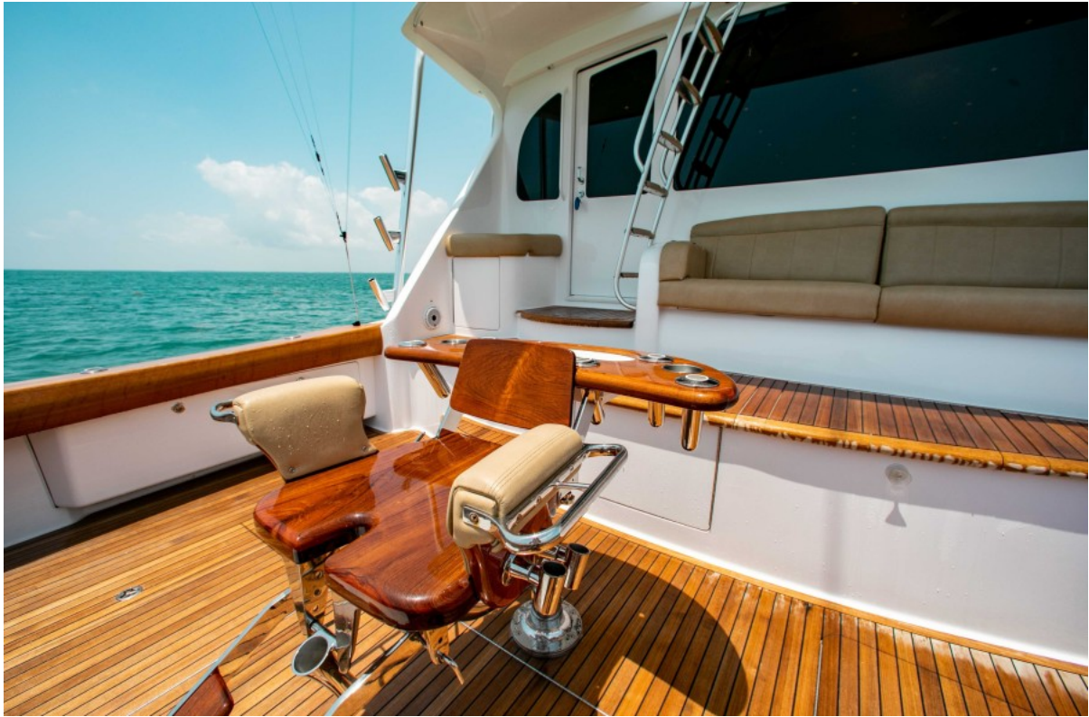
70 Viking Cockpit