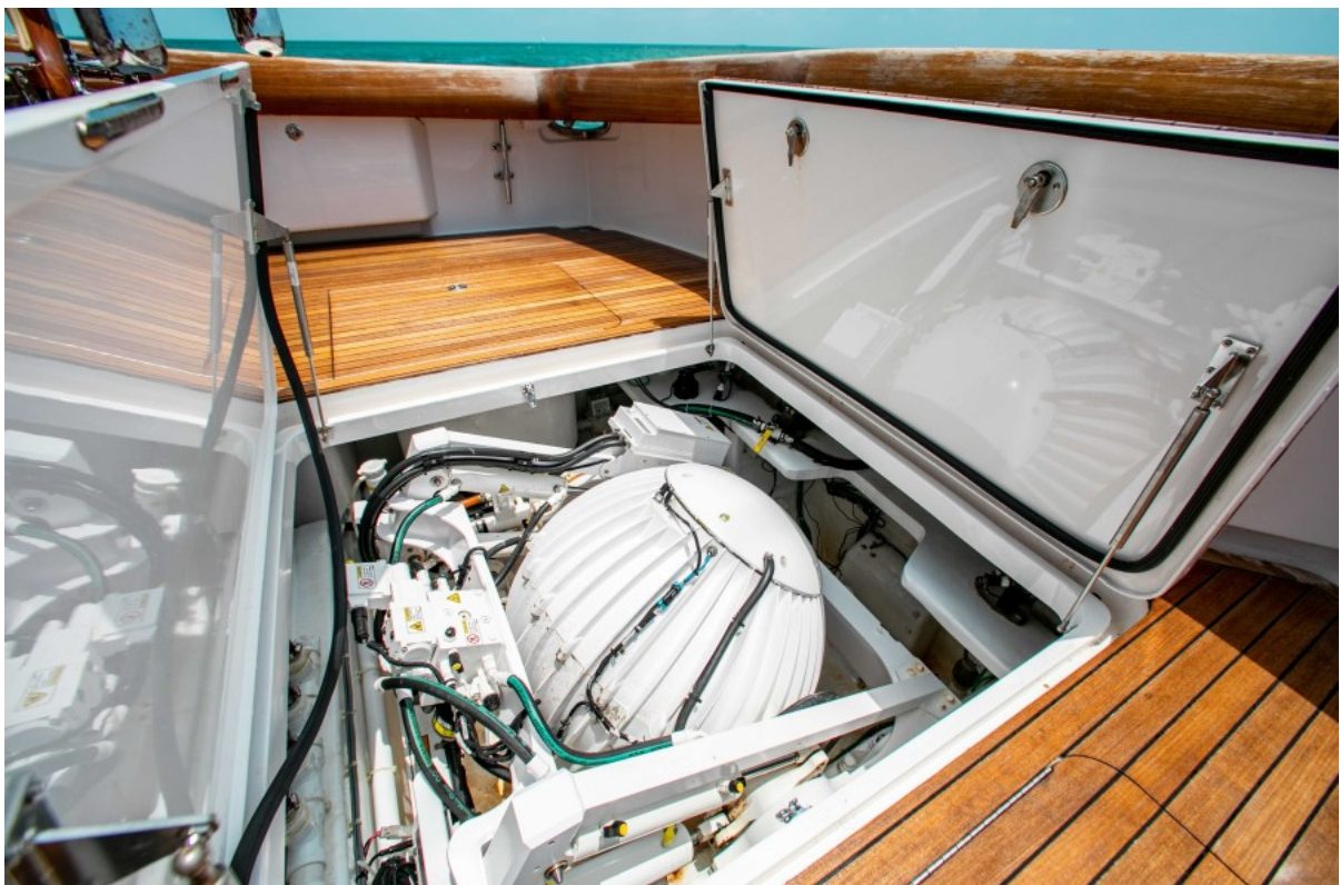
70 Viking CNV Seakeeper