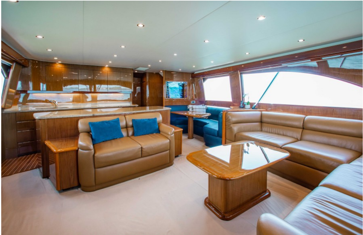
70 Viking Salon